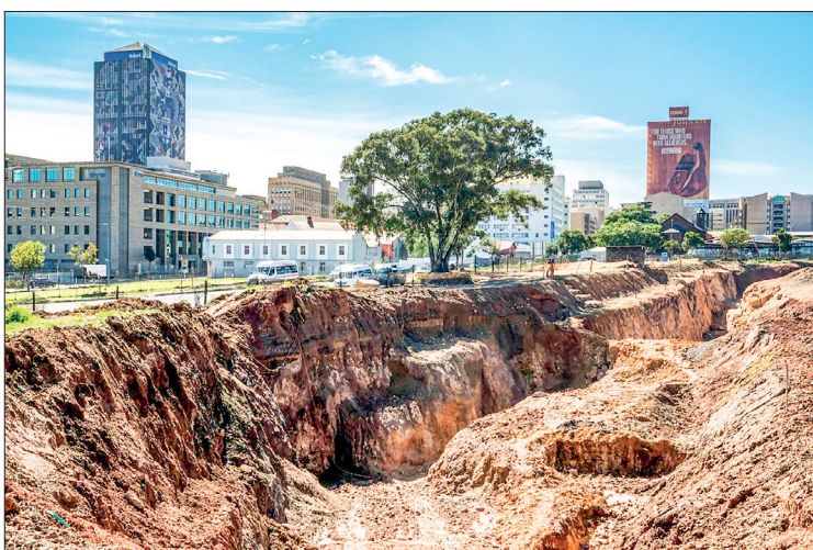
Dug out by hand and deepened with explosives, the gouge testifies to the gold rush that founded Johannesburg — and fuelled segregation and inequality.

OFF Johannesburg's main highway, surrounded by skyscrapers, heavy machinery has unearthed one of the city's original wounds — a deep gash left by the 1880s gold rush. The entire city centre is built over tunnels dug by gen-