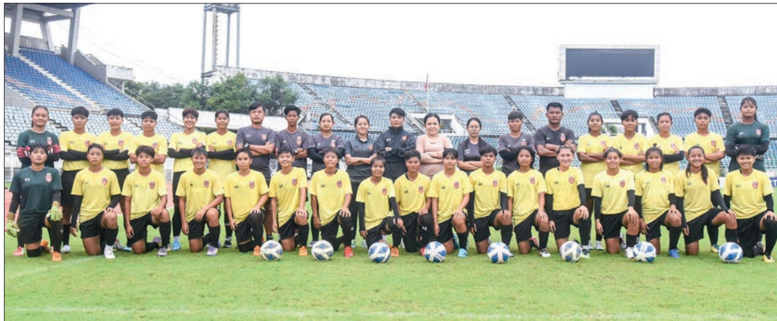
The Myanmar U-18 women's team pose for a group photo with the team's administrators and coaches.

THE Myanmar team has selected the final players to compete in the 2022 ASEAN U-18 Women's Championship to be held in Indonesia.