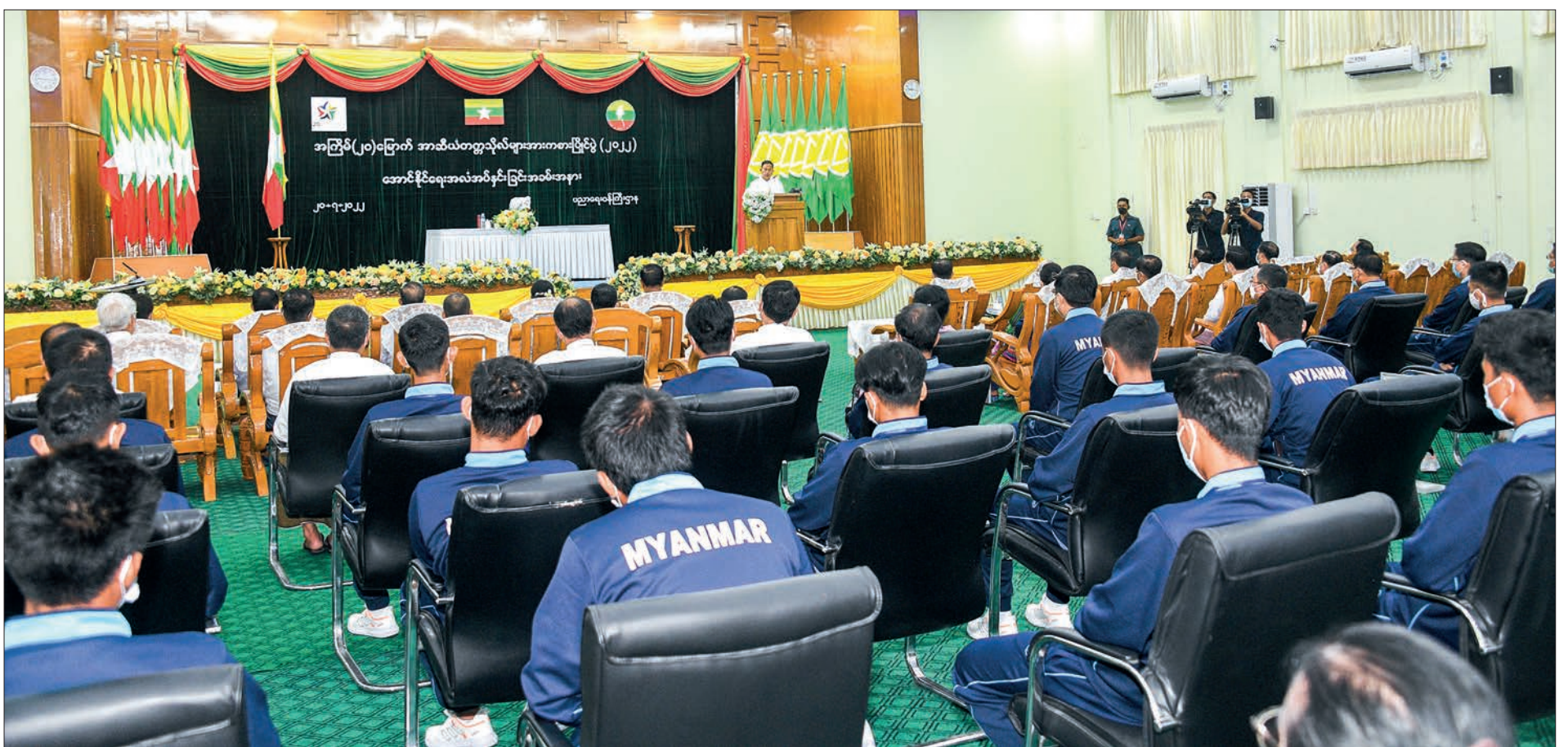
State Administration Council Vice-Chairman Deputy Prime Minister Vice-Senior General Soe Win addresses the ceremony to hand over the flag to the Myanmar universities sports team in Nay Pyi Taw on 20 July 2022.

V ICE-SENIOR General Soe Win, Chairman of the Education, Health and Human Resource Development Committee, Vice-Chairman of the State Administration Council Deputy Prime Minister, said