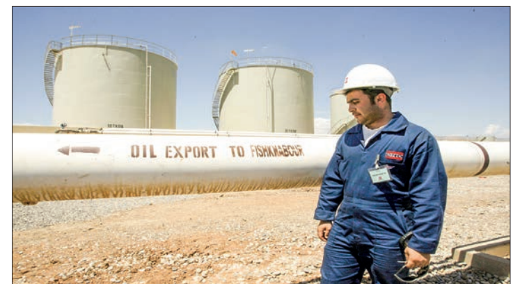
Baghdad has fought to regain control of output from lucrative oil fields in Kurdistan since the autonomous region began marketing oil independently more than a decade ago. PHOTO: AFP/FILE

The February ruling stated that a 2007 law adopted by Erbil to regulate oil and gas was unconstitutional.—AFP