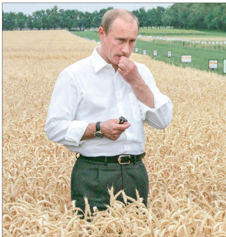
Russian President Vladimir Putin crosses a field during his visit to an agriculture exhibition in Rostov-on-Don, 30 June 2007.

RUSSIAN President Vladimir Putin on Tuesday said that the West must remove restrictions on exports of Russian grain.