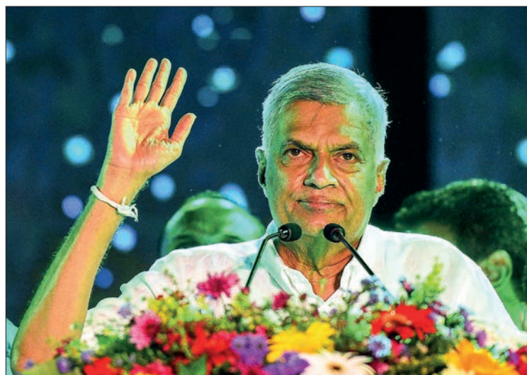
United National Party (UNP) party leader Ranil Wickremesinghe waves to supporters during the party's final campaign rally ahead of the upcoming parliamentary elections in Colombo on 2 August 2020.

This is for the first time in 44 years that Sri Lanka's Parliament will directly elect a president. Presidential elections in 1982, 1988, 1994, 1999, 2005, 2010, 2015 and 2019 had elected them by popular vote.—AFP