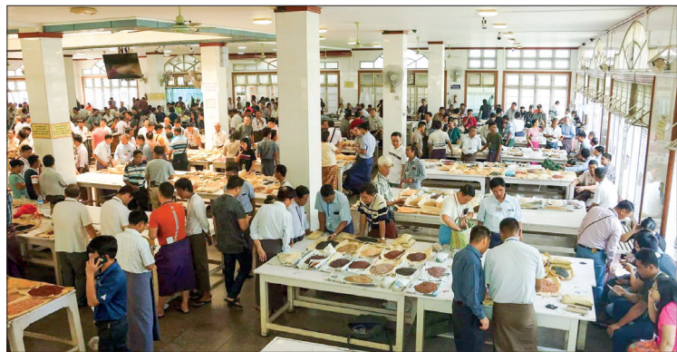
Myanmar conveyed US$830.625 million worth of over 1.09 million tonnes of various beans and pulses to foreign trade partners between 1 October 2021 and 31 March 2022 in the mini-budget period.

MYANMAR exported US$395.7 million worth of 522,332 metric tons of various pulses over the Q1 (1 April-8 July) in the current financial year 2022-2023, according to statistics released by the Ministry of Commerce.