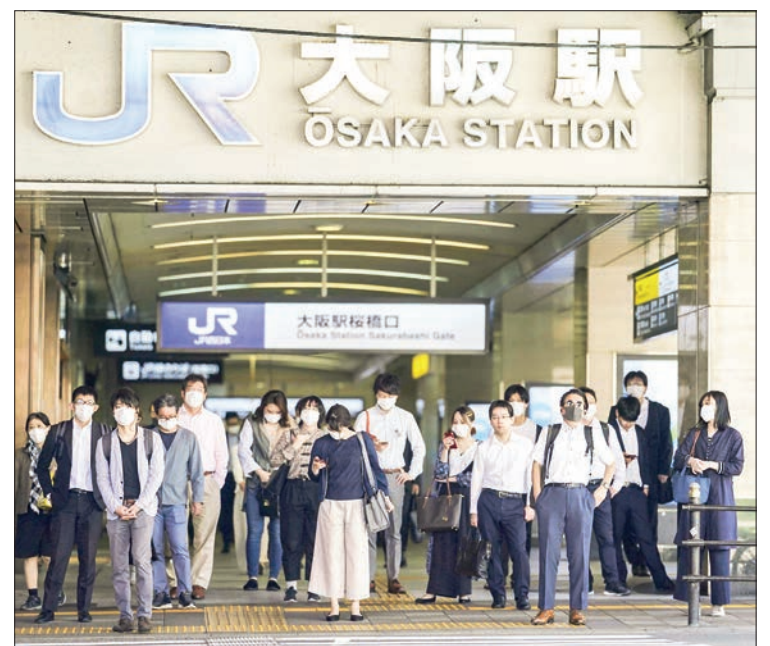
People wearing masks for protection against the coronavirus walk in Osaka on 17 July 2022.

Osaka Gov. Hirofumi Yoshimura said the number of new cases in the prefecture is expected to be about 22,000, a new high. Kanagawa Prefecture, near Tokyo, also said the daily tally is going to be a record at over 10,000.