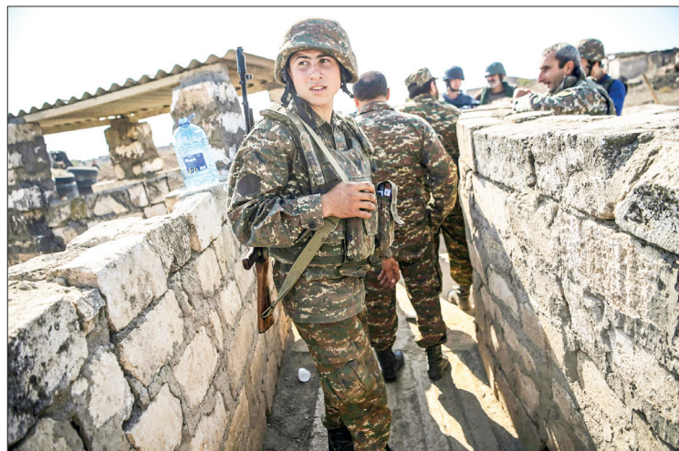
An Armenian soldier on the front line as troops fight to hold positions on 18 October 2020.