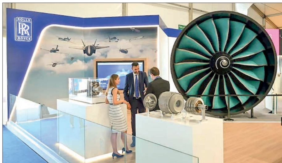
The manufacturer is looking towards developing more sustainable engine technology to help cut aviation emissions.

dered 100 medium-haul MAX jets with an option for 30 more, and swiftly afterwards Japan’s ANA agreed to buy 20 MAX 8 jets worth $2.4 billion. The MAX jet, which suffered two deadly crashes in 2018 and 2019, is experiencing a rush of interest at this year’s five-day Farnborough spectacle southwest of London.—AFP