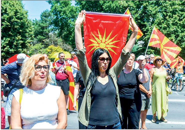
The opposition in North Macedonia has rallied thousands to fight back against any new compromises with Bulgaria and the EU.

AFTER years of setbacks, let-downs, and the change of its name, North Macedonia on Tuesday opened European Union membership talks even as unrest grows at home with a nationalist movement threatening to upend the process. Over the weekend, the country's government announced it had reached a compromise with Bulgaria in a long-running dispute that had served as an effective roadblock to the onset of talks for EU membership. On Tuesday, officials