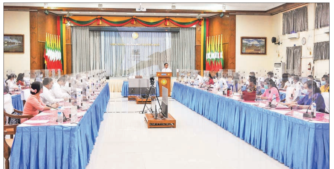
The annual review meeting for 2020-2021 of the vector-borne disease control branch is in progress.

The attendees discussed the advantages, weaknesses and difficulties in preventing diseases transmitted through mosquito bites such as malar-