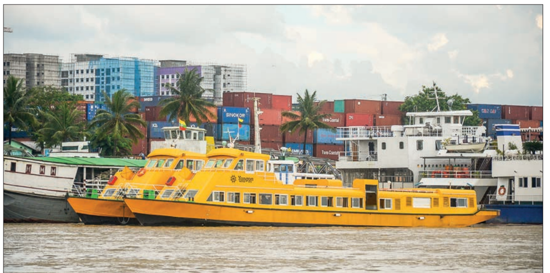
Vessels owned by Yangon Water Bus service are seen berthing at one Yangon port.

A total of 11 water buses carried about 100,000 passengers per month before the temporary suspension.