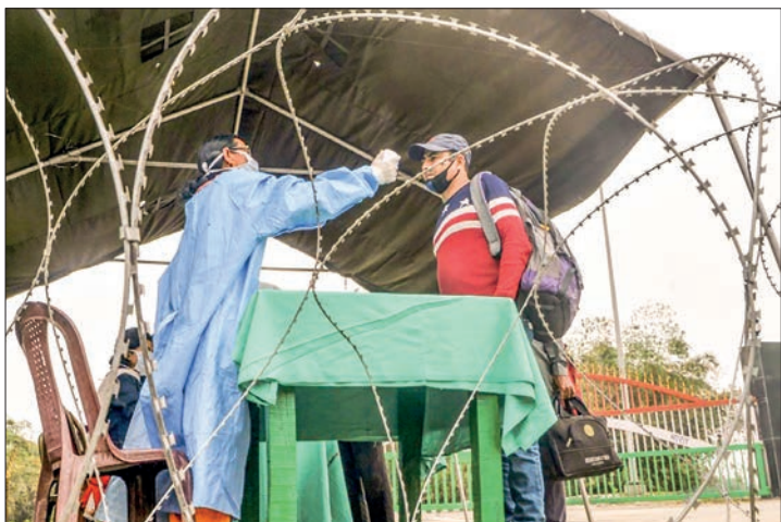
Health workers check the body temperature of an Indian national coming from Bangladesh, following an announcement about the closure of the India-Bangladesh border as a preventive measure against the spread of the COVID-19 coronavirus, at Fulbari Border checkpoint, some 16 kms from Siliguri on 13 March 2020.

Nearly two million people have tested positive for coronavirus in Bangladesh, where at least 29,241 have died since the virus was first detected in March 2020, according to government data. Health authorities contracted the firm to provide patients with free testing services, but allegations emerged that JKG was issuing false negative reports to patients in return for a fee.—AFP