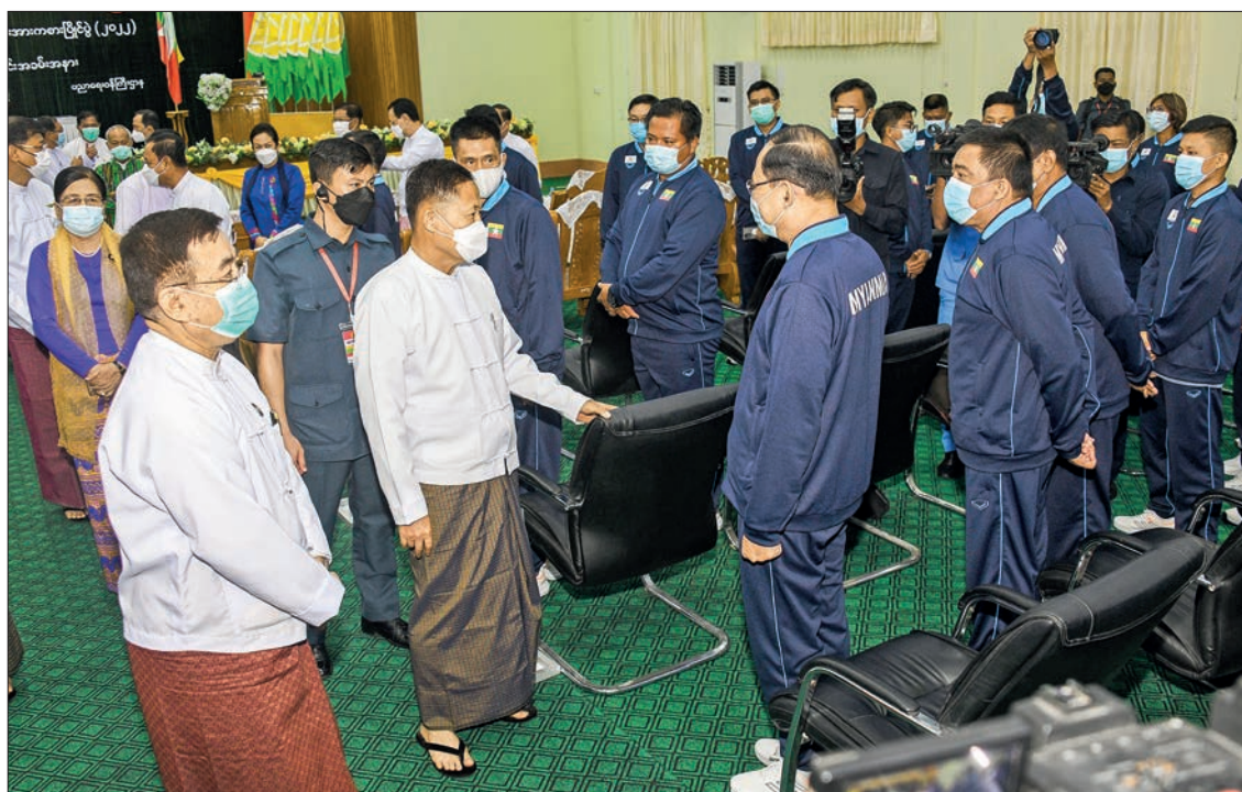
The Vice-Senior General cordially greets the Myanmar universities sports team.

The Vice-Senior General handed over the flag of the Republic of the Union of Myanmar