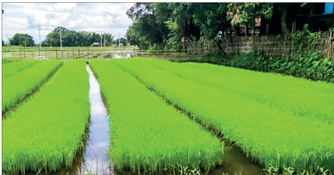
Only 1,154,509 acres were cultivated in the same period last year. Therefore, sowing acres increased this year. Farming types are seed broadcasting, transplanting and direct seeding.

year. Therefore, sown acreage has increased this year. Farming types are seed broadcasting, transplanting and direct seeding. The regional government is making a concerted effort to enhance the agriculture sector. They are focusing on soil testing, implementation of model farming acres, distributing pedigree and high-yielding seeds, establishing agricultural service centres to increase the interests of the farmers, shifting traditional farming methods to mechanized farming and raising awareness of growing methods among the farmers. — Maung Maung Myint (IPRD-Rtd)/GNLM