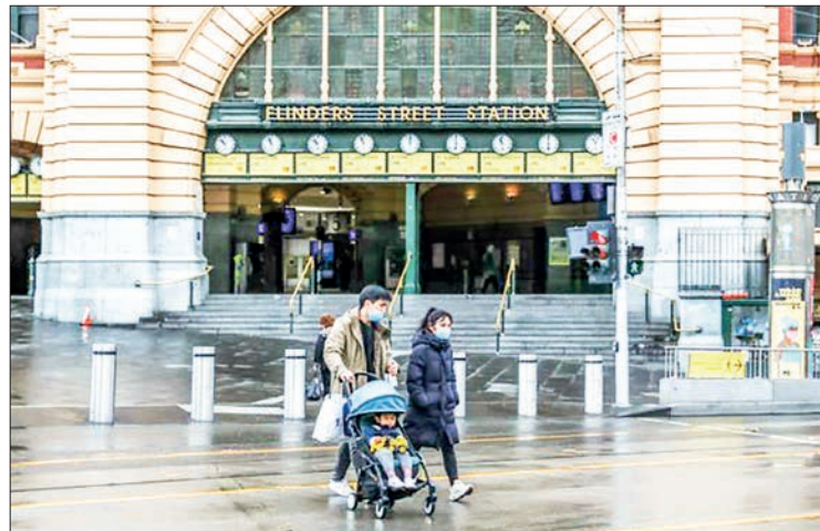
People wearing mask walk past the Flinders Street station in Melbourne on 16 July 2021, after Australia's second largest city entered a fresh lockdown amid a resurgence in coronavirus cases.

AUSTRALIAN Prime Minister Anthony Albanese asked people to wear masks when needed amid soaring coronavirus cases.