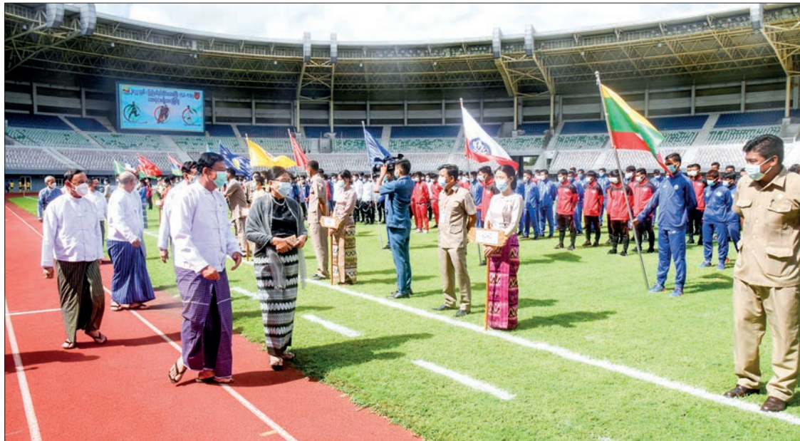
SAC members and dignitaries attend the opening event of the 2022 Inter-Region and State U-19 men's football tournament in Nay Pyi Taw yesterday.

First, Chairman of the Myanmar Olympic Committee Union Minister for Sports and Youth Affairs U Min Thein Zan said that the competition is held with the aim of improving the standard of football sport in