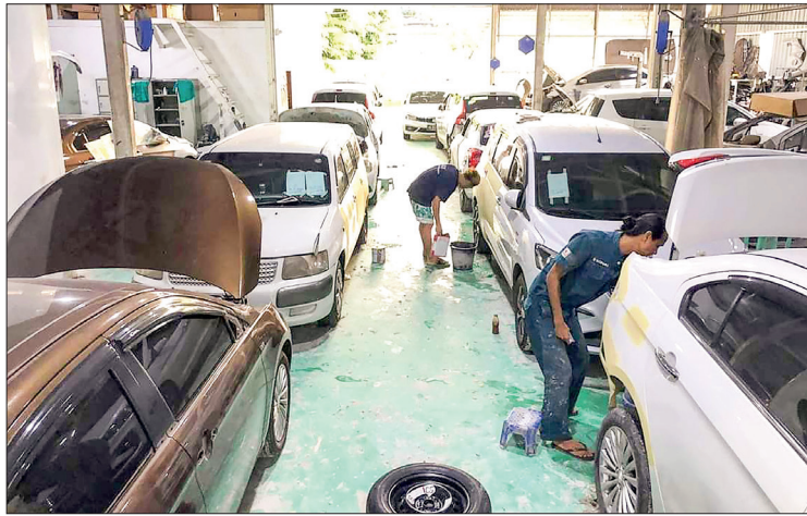
Services are given to Suzuki cars.

The statement also stated the profuse apologies for the delay to deliver the cars to the customers and for not being able to predict the exact time of the delivery. However, it stressed