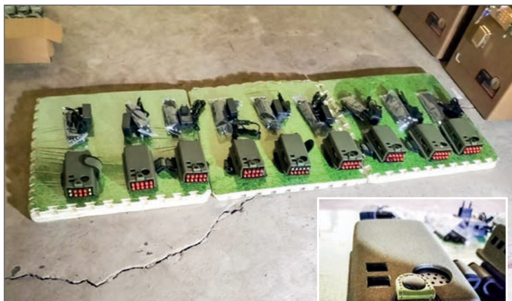
Seized electronics in Shan State.

SUPERVISED by the Anti-Illegal Trade Steering Committee, effective action is being taken to prevent illegal trade under the law.