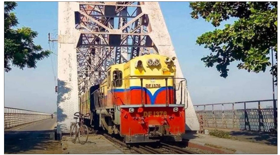
The Yangon-Mawlamyine-Yangon train.

THE Myanma Railways will start resuming the Yangon-Mawlamyine-Yangon daily route on 25 July.