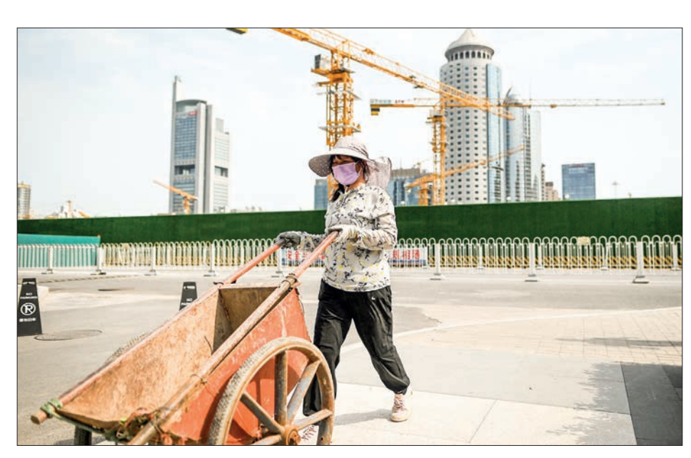
A worker pushes a trolley along a road outside a construction site in the central business district of Beijing on 8 July 2022.

China's Banking and Regulatory Insurance Commission urged banks to "effectively meet the reasonable financing needs of real estate companies, vigorously support rental housing construction" and support project mergers and acquisitions,