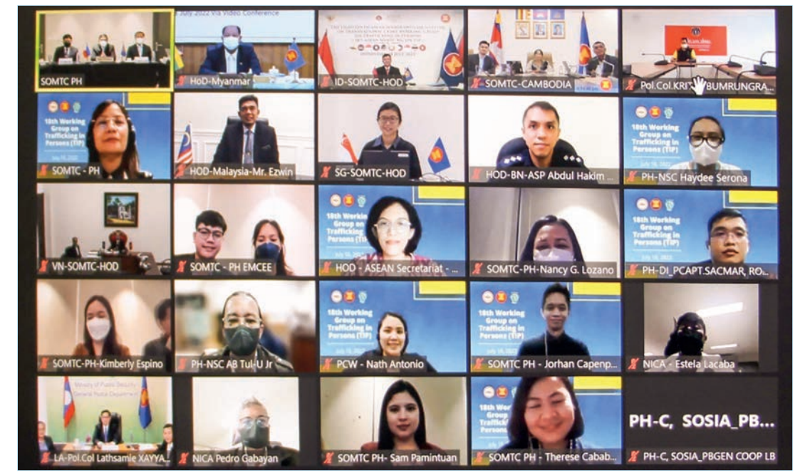
The 18th SOMTC Working Group on Trafficking in persons meeting is in progress online on 18 July.

After that, the ASEAN member countries discussed the country-wise anti-human trafficking efforts, the development of the Boho Human Trafficking Action Plan (2.0), duties and powers of national representatives for the implementation of the ASEAN Convention against Trafficking in Persons, particularly women and children, and issues related to let Indonesia as the host country.