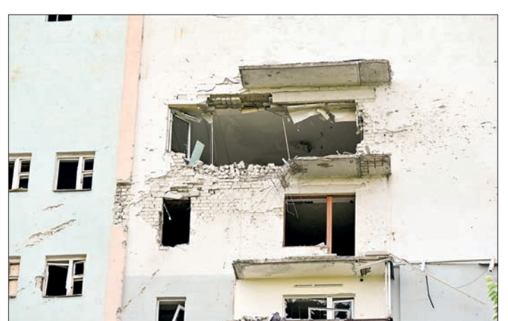
A photograph shows a building partialy destroyed after shelling in the outskirts of the second largest Ukrainian city of Kharkiv on 18 July 2022.

"Rescuers found and recovered the bodies of five dead people in total. Three people were rescued from the rubble and one of them died in hospital," the emergency services said, adding their rescue operations had concluded. —AFP