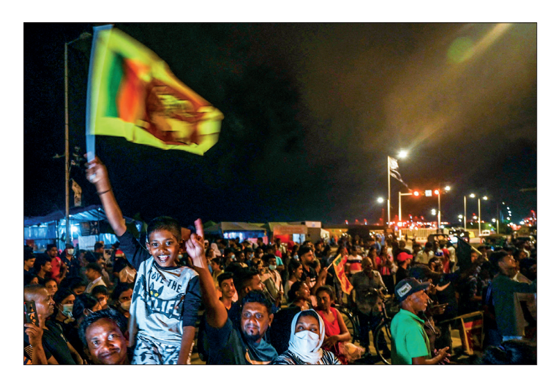
Demonstrators take part in a celebration as Sri Lanka's protest movement reached its 100<sup>th</sup> day at the Galle face protest area near Presidential secretariat in Colombo on 17 July 2022.

SRI Lanka's acting president renewed the country's state of emergency Monday ahead of a parliamentary vote to pick a new