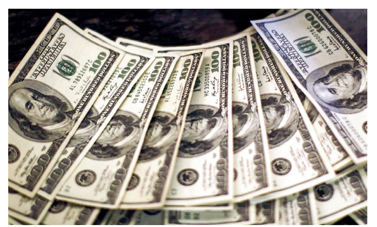
The unofficial exchange rate against the US dollar hit a high of K2,300 on the over-the-counter market although the Central Bank of Myanmar (CBM) set the reference exchange rate at K1,850, according to local forex traders.

Under the guidance of the Central Committee on Ensuring Smooth Flow of Trade and Goods,