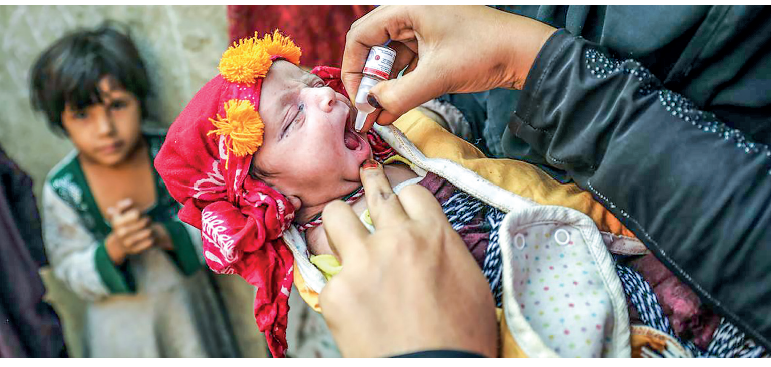
A 13-day-old baby receives the polio vaccine in Gadab town, Karachi Sindh Province, Pakistan.

New leaders of the State have been holding up the guidance of the national martyrs in successive eras in nation-building tasks since the time when the nation regained independence. Now is the best time for all national people to enjoy shared well-being and shared cause in working together. All the public desires must be implemented. If so, their endeavours will be the acts to pay back a debt of gratitude to the martyrs.