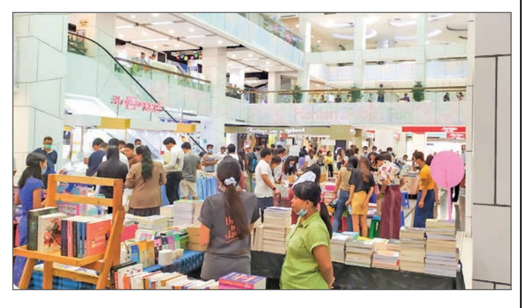
Thukhabon bookstore, Kaungsutha bookstore, Yetagon bookstore and Baby bookstore retail books at the fair, as well as the café shops are open in that area.