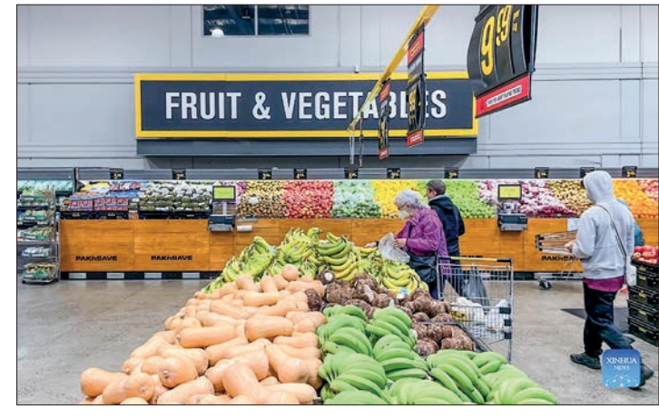
People shop at a supermarket in Wellington, New Zealand, 18 July 2022. New Zealand's consumers price index increased 7.3 per cent in the June 2022 quarter year-on-year, a 32-year high due to higher prices for construction and petrol, the country's statistics department Stats NZ said on Monday.

The 18-percent annual increase in the year to the June quarter follows an 18-percent jump in March and a 16-percent rise in December 2021, Attewell said. —Xinhua