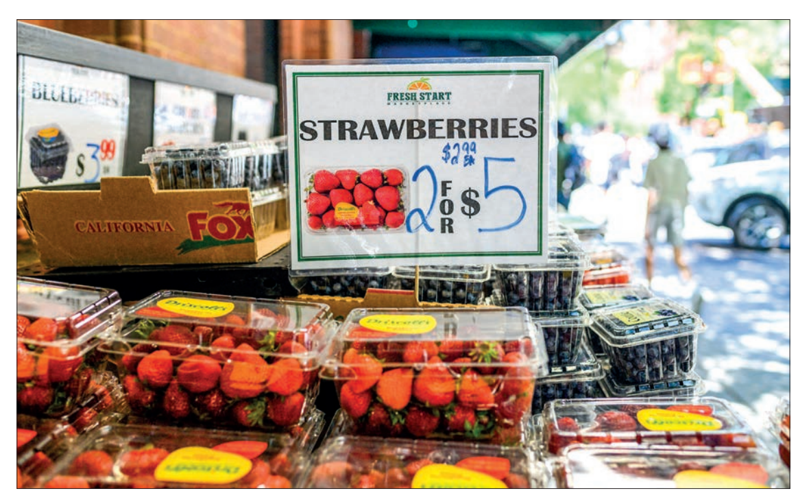
Fruit is sold at a supermarket on 13 July 2022, in New York City. US consumer price inflation surged 9.1 per cent over the past 12 months to June, the fastest increase since November 1981, according to government data released on 13 July. Driven by record-high gasoline prices, the consumer price index jumped 1.3 per cent in June, the Labour Department reported.