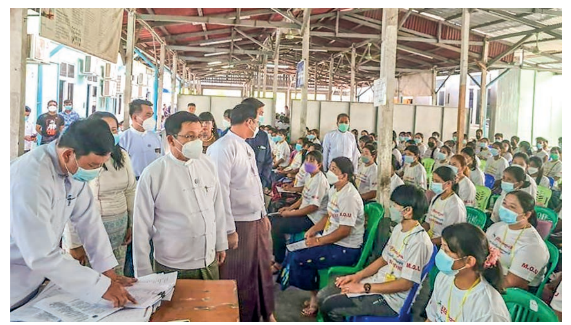
MoL Union Minister U Myint Kyaing inspects the signing of employment contracts.

THE application submission for the 2022 EPS-TOPIK exam will be accepted through the