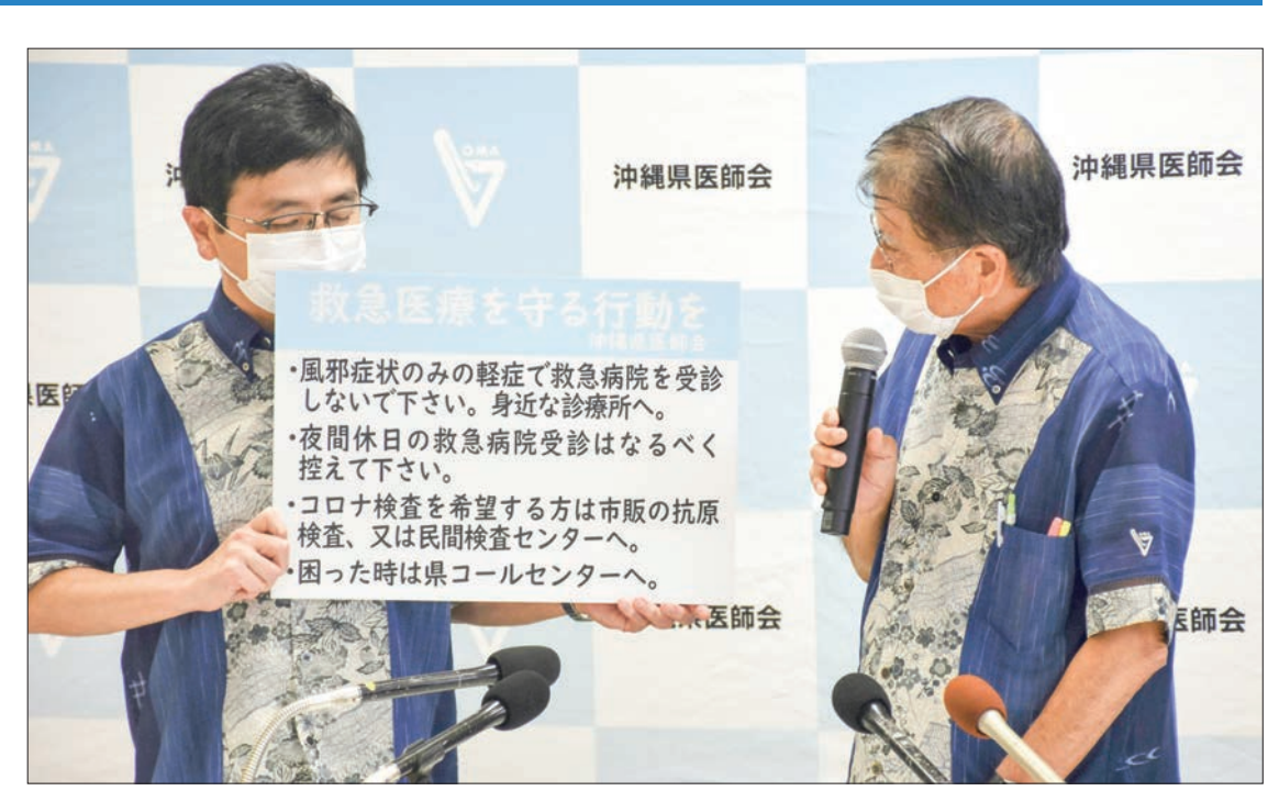
The Okinawa Medical Association holds an emergency press conference on 15 July 2022, in Haebaru, Okinawa Prefecture, to address the surge in COVID patients.

Hospital bed occupancy rates in Tokyo, which reported 17,790 new infections Sunday, have surpassed 30 per cent, with over 2,000 people hospitalized as of 12 July. Tokyo Gov. Yuriko Koike has ordered measures to reduce