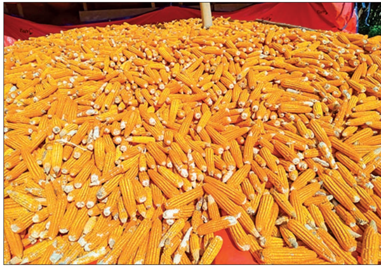
In early June, the corns were priced at K1,120 per viss depending on the quality. The current market price dipped to the lowest of K960 per viss.

Thailand gives green light to corn imports under zero tariff