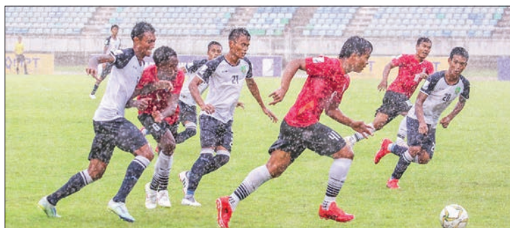
GFA FC players (red) vie for the ball against Myawady FC players (white) during their Myanmar National League Week-3 match at Thuwunna Stadium in Yangon on 13 July 2022.

MYAWADY FC made their straight wins after beating GFA FC 4-2 in their Week-3 match of the 2022 Myanmar National League at Thuwunna Stadium in Yangon on 13 July.