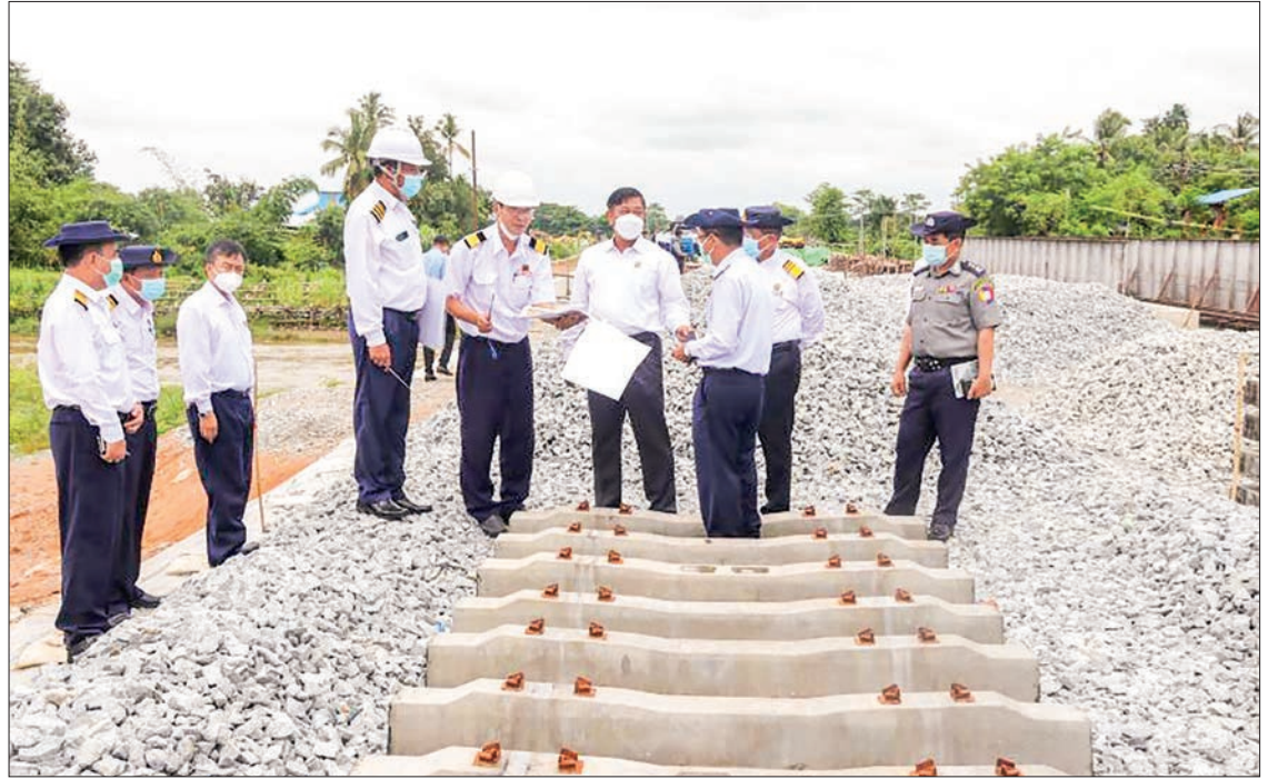
Union Transport & Communications Minister Admiral Tin Aung San looks into the progress of the Yangon-Toungoo rail section yesterday.

At the RBE factory, the Union minister highlighted the need to modify the train carriages to high quality and security and inspected the train carriage which was being renovated. He also presented crews with gifts during his inspection tour yesterday. — MNA