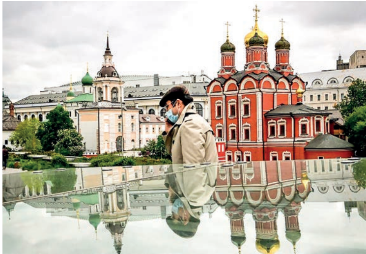
A man wearing a face mask walks past Russian Orthodox cathedrals at the Zaryadye park in Moscow on 24 May 2022.