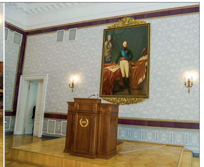
State Administration Council Chairman Prime Minister Senior General Min Aung Hlaing views the Kazan Federal University in the Republic of Tatarstan.