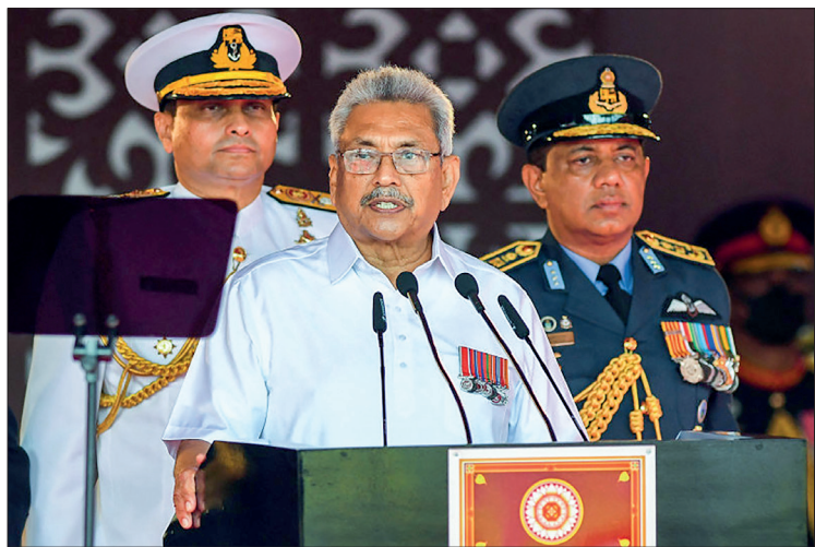
As president, Gotabaya Rajapaksa enjoys immunity from arrest, and he is believed to have wanted to go abroad before stepping down to avoid the possibility of being detained.

PRESIDENT Gotabaya Rajapaksa fled Sri Lanka on Wednesday, a government official said, just days after protesters stormed his official residence as the island nation grapples with its worst economic crisis since independence.