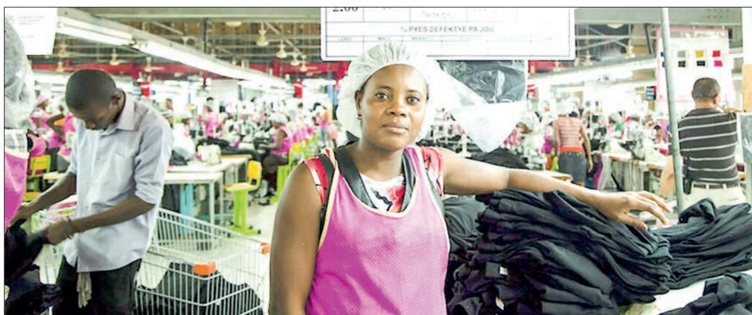
Haiti is a free market economy that enjoys low labour costs and tariff-free access to the US for apparel exports. BETTER WORK.ORG/AFP

In its warehouses, where scores of sewing machines are lined up, many members of the overwhelmingly female workforce found their first formal job in a country where nearly half of the population suffers from food insecurity.—AFP