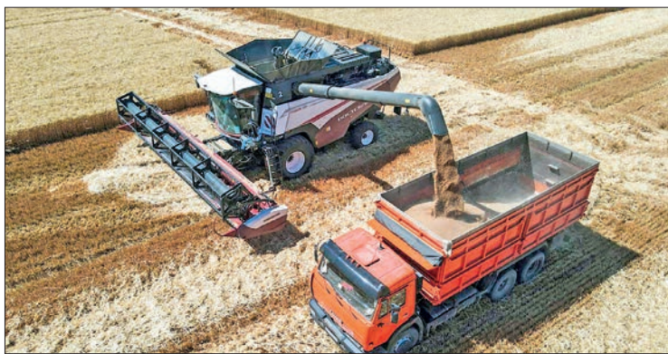
The four-way meeting in Istanbul comes with Russia's invasion of Ukraine showing no sign of abating and the threat of food shortages spreading across the poorest parts of the world.

suspicious that Russia is trying to export grain it has stolen from Ukrainian farmers in regions under its control.—AFP