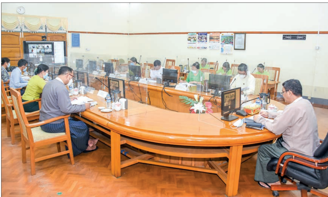
MoC holds the meeting for rice donation to Sri Lanka, yesterday.