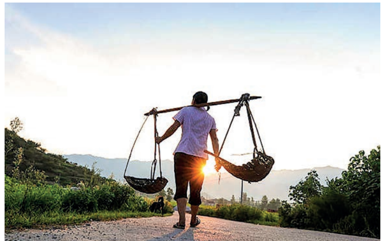
After reporting a new domestic infection, the steelmaking hub of Wugang in Henan province announced Monday that it would implement three days of "closed control" in response to "the needs of disease prevention". A farmer carries her baskets balanced on a bamboo pole as the sun sets over a village near the Wugang Manganese Smelting Plant in Hunan province in central China.

Residents are not allowed to use their cars without permission and must obtain official authorization to travel under "closed-loop" conditions in case of emergencies, the notice said.—AFP