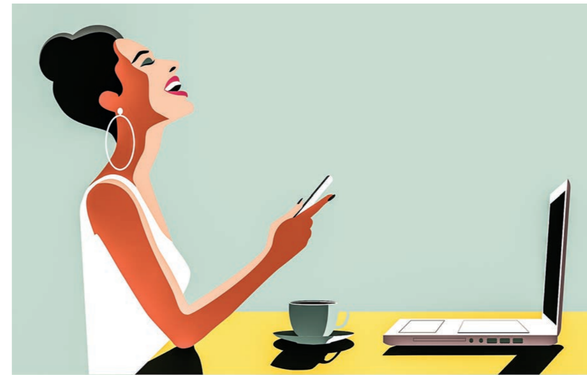
Laughing stimulates both sides of the brain.

Here, I would like to state Philosopher John Morreall's belief about laughter: It came about as a gesture of shared relief at the passing of danger. Many researchers believe that the purpose of laughter is related to human connections. Laughter happens when people feel comfortable with each other. With more laughter comes more bonding. Robert Provine, professor of psychology and