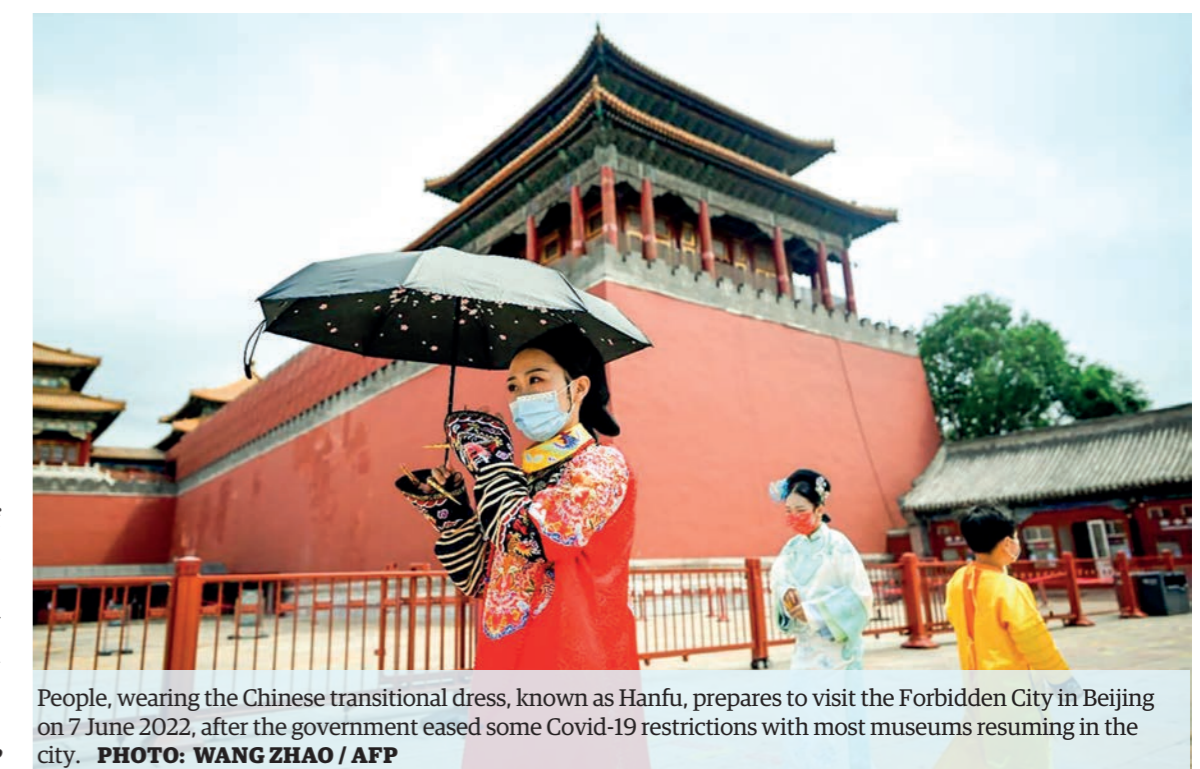
People, wearing the Chinese transitional dress, known as Hanfu, prepares to visit the Forbidden City in Beijing on 7 June 2022, after the government eased some Covid-19 restrictions with most museums resuming in the city.