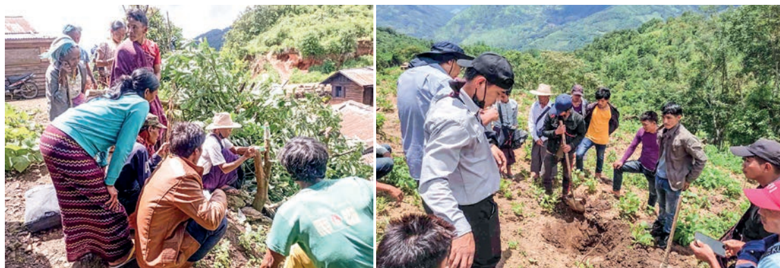
Awareness campaigns of the avocado growing methods were conducted in Leshi Township, in coordination with the Department of Rural Development.