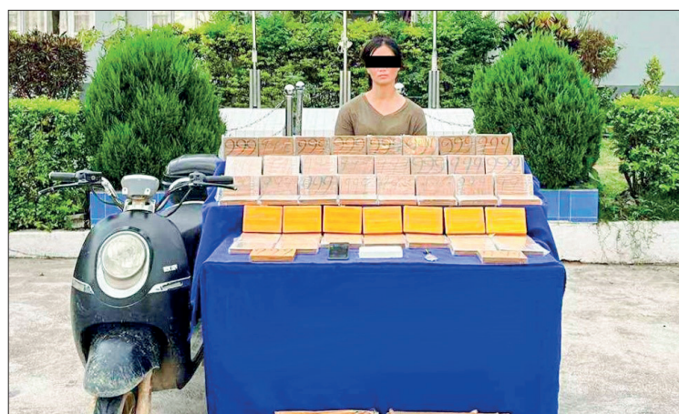
An arrestee is seen together with seized heroin blocks and a motorbike.

ACCORDING to the Myanmar Police Force, 21 kilogrammes of 60 heroin blocks (an estimated value of K210 million) were confiscated in Muse, Shan State (North).