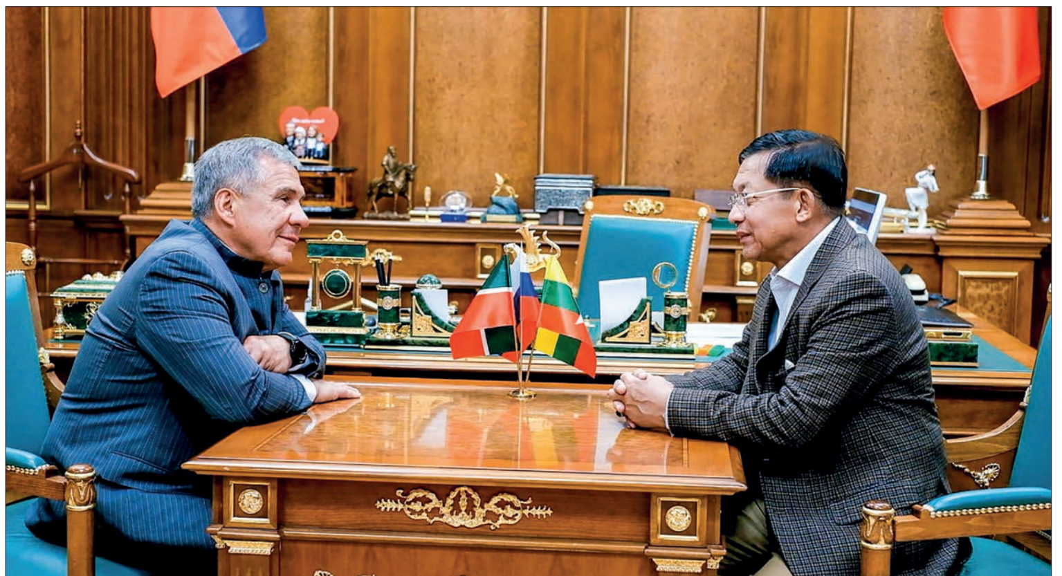
State Administration Council Chairman Prime Minister Senior General Min Aung Hlaing and President Mr Rustam Nurgaliyevich Minnikhanov of the Republic of Tatarstan hold the special meeting at the latter's office on 13 July 2022.

They frankly exchanged views on further promotion of Russian-Myanmar diplomatic relations and friendly relations, holding discussions on economic cooperation during the visit of the President of the Republic of Tatarstan to Myanmar this April, issues to enhance trade and investment for promotion of bilateral relations, cooperation in oil and natural gas production, construction of factories and maintenance of machinery, and cooperation in industrial de-