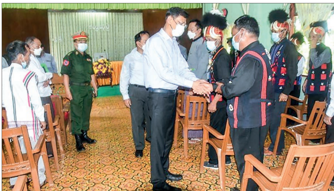
SAC member MoD Union Minister General Mya Tun Oo warmly greets the town elders in Khamti.

STATE Administration Council member Union Minister for Defence General Mya Tun Oo, accompanied by the Sagaing Region chief minister, the commander of the Sagaing Command and officials met officers, other ranks and their families of Khamti Station and provided foodstuffs and COVID-19 prevention gear yesterday.