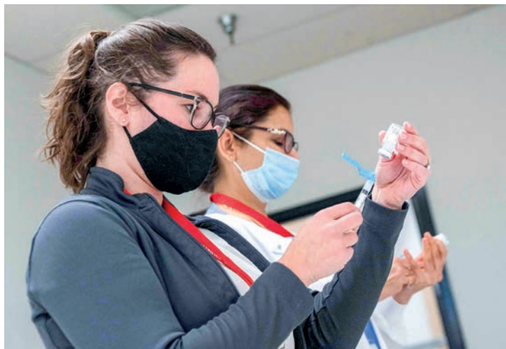
As of 22 June, around 78% of people in the US had received their first shot to guard against COVID-19 and 67% were considered fully vaccinated.

While daily tolls have reduced substantially since the crisis peaked more than a year ago, the United States is still recording 300 to 350 deaths per day, an "unacceptable" number, Fauci said.—AFP