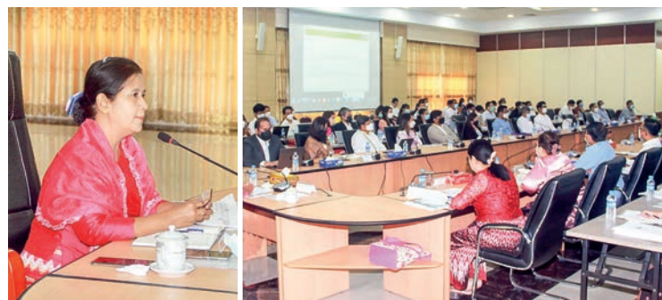
The CBM's coordination meeting on the digital payment switch system is in progress.

According to the CBM's National Payment System Strategy (2020-2025), a digital payment switch system that routes payment transactions between multiple acquirers and payment service providers is being implemented in line with the existing payment policies. CBM-NET system to handle large payrolls and utility bills was also carried out. Moreover, a digital payment switch system to facilitate the