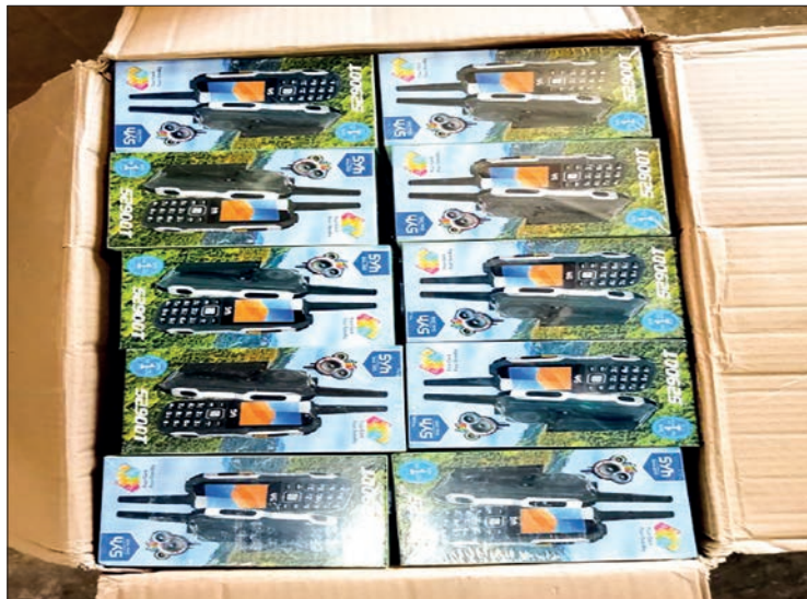
Seized items in Shan State.

In addition, a total of 1.6944 tonnes of illegal timbers worth K118,608 were captured in