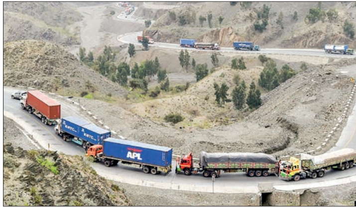
Pakistan and Uzbekistan have exchanged goods through war-torn Afghanistan.

It recognizes the importance of Afghanistan's poten-