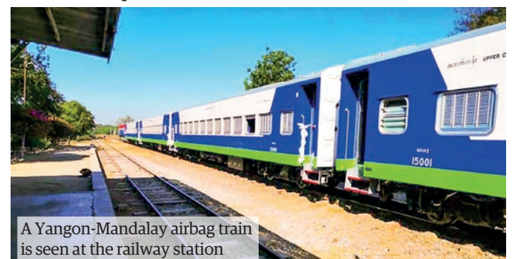
A Yangon-Mandalay airbag train is seen at the railway station

In the past, the Yangon-Mandalay express train ticket price was K13,000 for the sleeper, K9,300 for the upper class, K4,650 for the ordinary class and now it is K21,250 for upper class (sleeper), K15,450 for the upper class and K7,750 for ordinary class. —TWA/GNLM