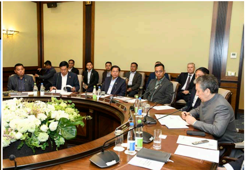
The CEO of the PJSC “Tatneft” company explains the brief history to the Senior General.

tions, the Chairman of the State Administration Council and party discussed matters relating to possible cooperation with the company and investments in petroleum and natural gas. After the meeting, the SAC Chairman