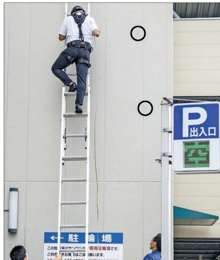
Circled are what appear to be bullet holes in the wall of a car parking facility near the scene of former Japanese Prime Minister Shinzo Abe's assassination in Nara on 13 July 2022. Abe was shot on 8 July during an election campaign speech.

Yamagami has told police the attack was not motivated by Abe's politics and he chose to make an attempt on the former prime minister's life after initially planning to target an executive of a religious group.—Kyodo