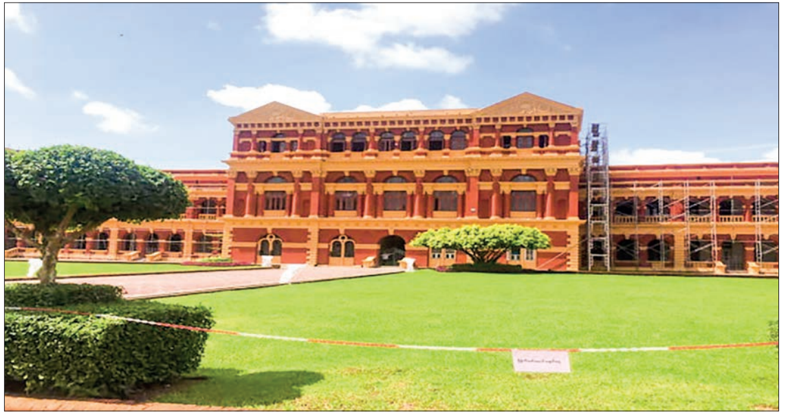
The photo shows today's Ministers' Office where the martyred leaders fell in Yangon.

During the flag-hoisting ceremony to be held at the Ministers' Office from 5 am to 6 pm, from 19-7-2022 to 21-