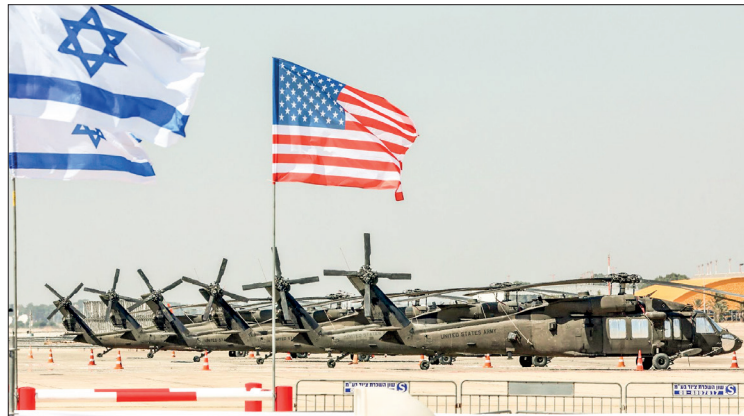
Military helicopters — and the Israeli and US flags — are pictured at Israel's Ben Gurion Airport ahead of US President Joe Biden's visit.

Moments after Biden touches down, Israel's military will show him its new Iron Beam system, an anti-drone laser it claims is crucial to countering Iran's UAV fleet. Israel insists it will do whatever is necessary to thwart Iran's nuclear ambitions, and is staunchly opposed to a restoration of the 2015 deal that gave Tehran sanctions relief.— AFP