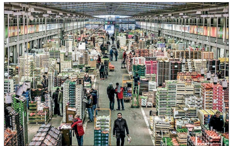
Rungis, located south of Paris, is the largest fresh produce market in the world, serving 18 million French consumers every day.

This was still far higher than the current forecast by the commission, which in May projected inflation in the eurozone at 6.1 per cent for 2022 and 2.7 per cent in 2023. —AFP