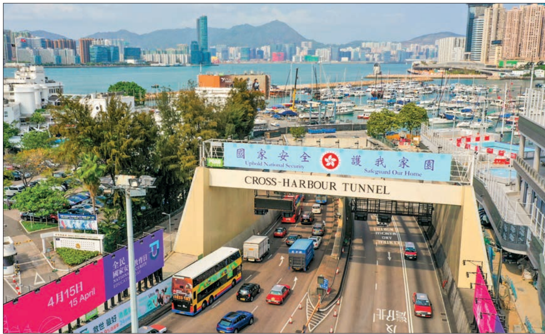
A government-sponsored advertisement promotes the national security law near an entrance to the Cross-Harbour Tunnel in Hong Kong, China, on Monday, 29 March 2021. China's National People's Congress is holding a standing committee meeting on 29 and 30 March to review draft revisions regarding the elections of Hong Kong Chief Executive and Legislative Council.