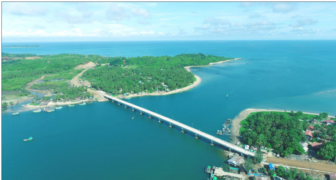
The photo shows an aerial view of the Gwachaung Bridge.

THE Gwachaung Bridge construction in Rakhine State has been completed and arrangements are being made to inaugurate the bridge, according to the Ministry of Construction.