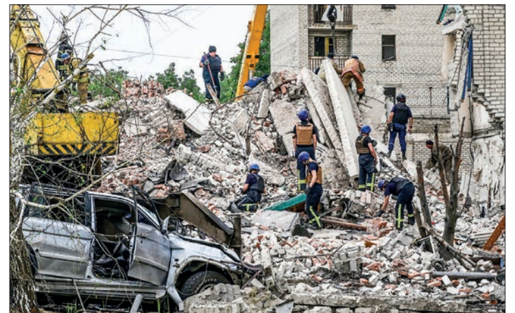
Rescuers clear the scene after a building was partially destroyed as a result of Russian missile hit on a four-storey residential building in Chasiv Yar, Bakhmut District, eastern Ukraine, on 10 July 2022.

“During the rescue operation, 15 bodies were found at the scene and five people were pulled out of the rubble” alive in the town of Chasiv Yar, the