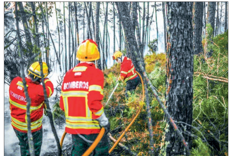
Firefighters work to extinguish a wildfire at Casais do Vento in Alvaizere on 10 July 2022.

June also saw Spain grapple with temperatures above 40C in swathes of the country.—AFP