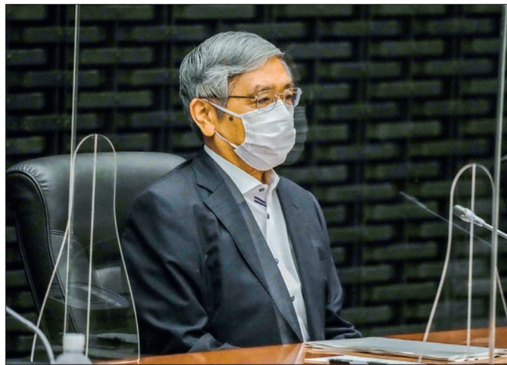
Bank of Japan Governor Haruhiko Kuroda attends a meeting with BOJ branch managers at the central bank's head office in Tokyo on 11 July 2022.

THE Bank of Japan on Monday upgraded its view on seven of the nine regional economies, reflecting the diminishing negative impact of COVID-19 on private