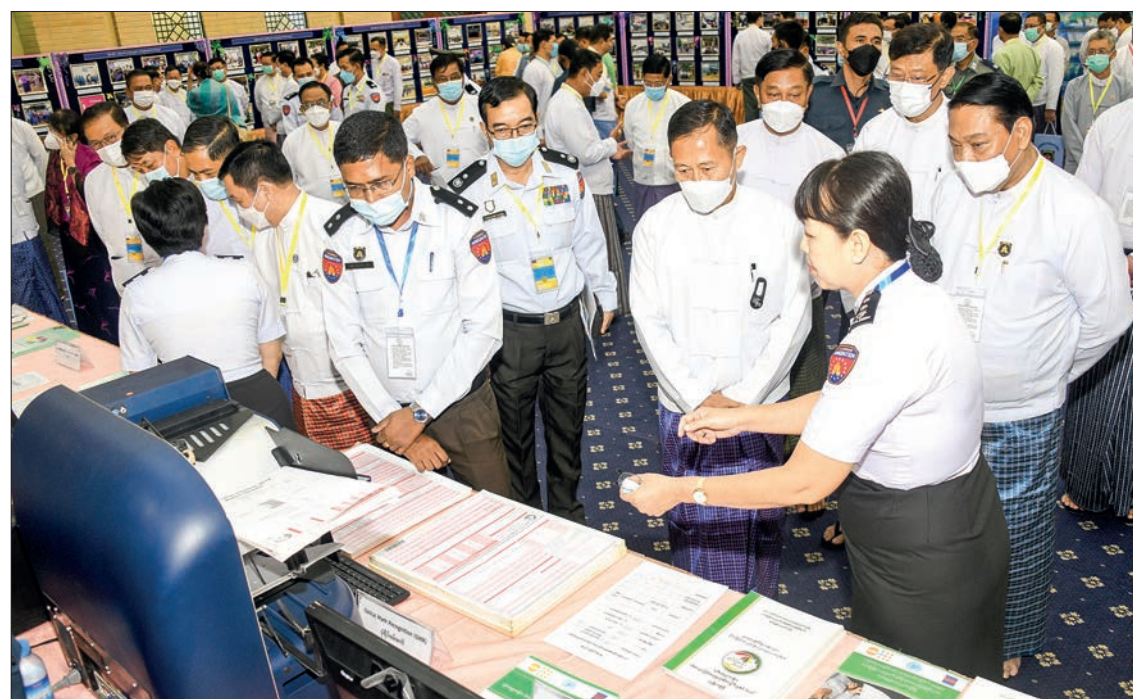
The Vice-Senior General pays observation tours at the exhibition.

The Vice-Senior General viewed round the booths at the exhibition to mark World Population Day 2022.