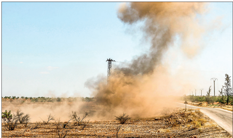
A landmine is remotely detonated in a field at a pistachio orchard in the village of Maan, north of Hama in west-central Syria on 24 June 2020.