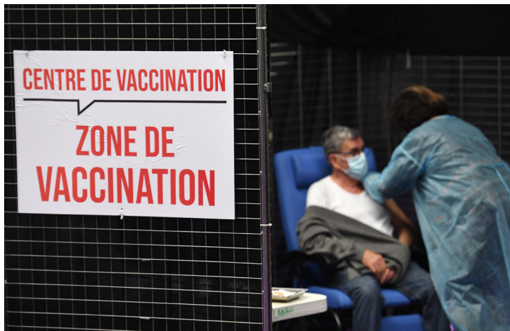
(FILES) In this file photo taken on 2 March 2021 an elderly man receives a dose of the Pfizer-BioNtech Covid-19 vaccine, at a vaccination centre in Garlan, western France.

recommended a second booster, or a fourth dose, for people over the age of 80, since April.