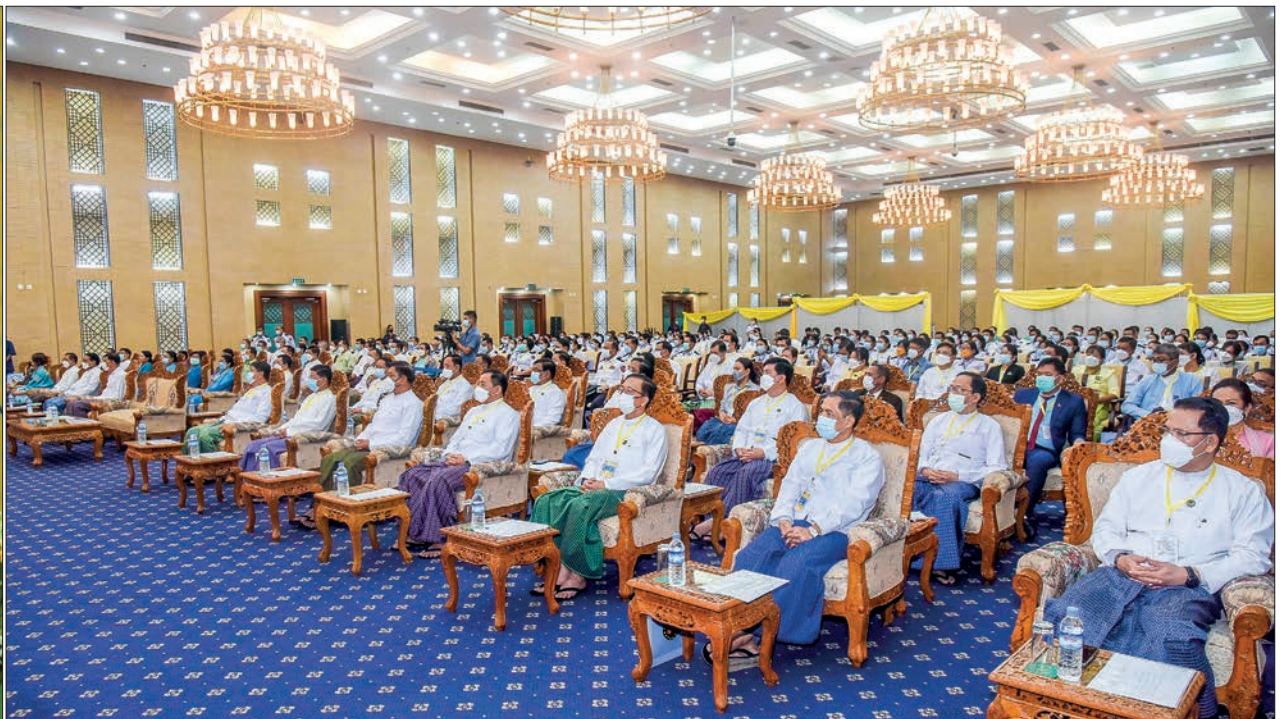
State Administration Council Vice-Chairman Deputy Prime Minister Vice-Senior General Soe Win speaks on the occasion of World Population Day 2022 in Nay Pyi Taw on 11 July 2022.

A S about 52 of 100 women are working in Myanmar, the workable power of women cannot be fully applied to economic development tasks of the nation yet, said Patron of the Central Census Commission Vice-Chairman of the State Administration Council Deputy Prime Minister Vice-Senior