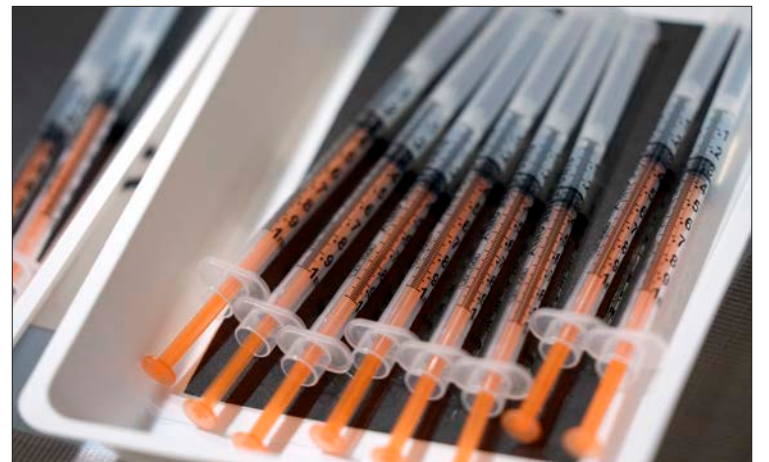
Vials of the Moderna COVID-19 vaccine against Covid-19, are being prepared for local residents in a tray at a mass vaccination centre operated by Japanese Self-Defence Force in Tokyo on 31 January 2022.

JAPAN "has no doubt entered" a seventh wave of coronavirus infections though there is currently no need for new movement restrictions, the head of a government COVID-19 experts panel told reporters on Monday.