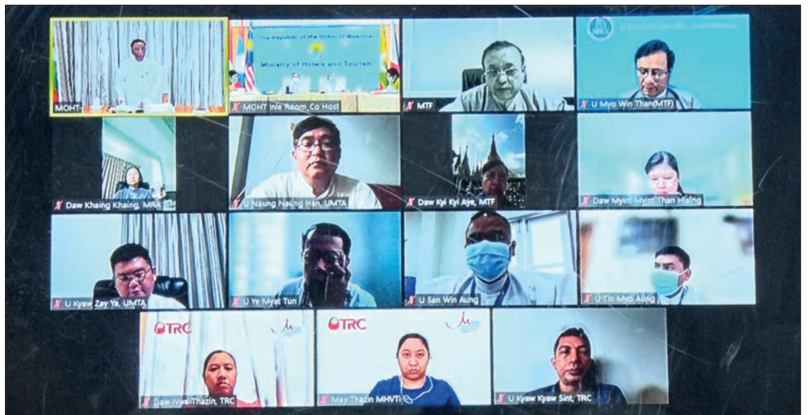
The virtual TPCB-NTPB coordination meeting 1/2022 is in progress yesterday.

It needs to be made widely known among young people and general public interested in tourism