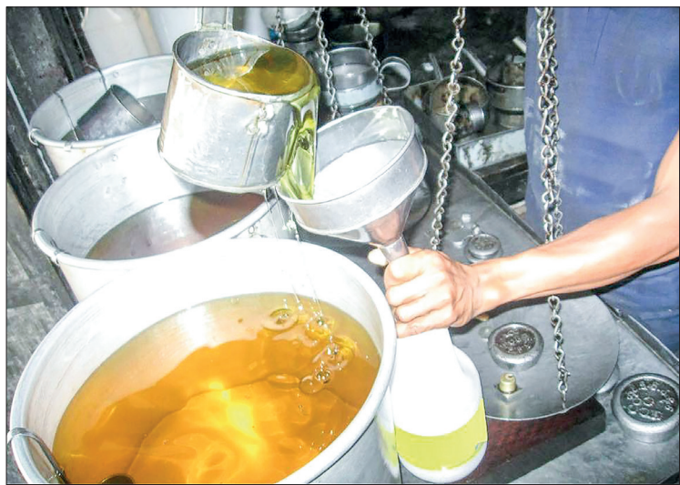
A vendor is pictured siphoning the palm oil into a plastic bottle.

THE Yangon’s palm oil reference price between 11 and 17 July was set at K4,650 per viss, according to the Committee for the Supervision of the Import and Distribution of Edible Oils.