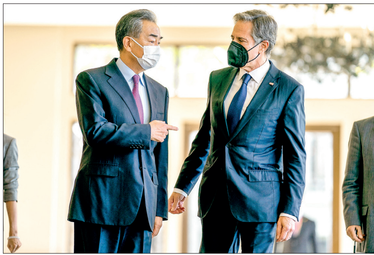
US Secretary of State Antony Blinken (R) and China's Foreign Minister Wang Yi talk before a meeting in Nusa Dua on the Indonesian resort island of Bali on 9 July 2022.

Years of rising tensions between the two has alarmed