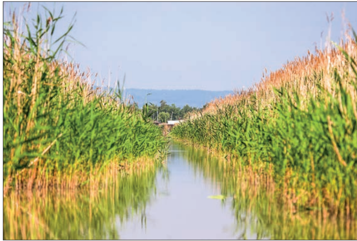
A driving channel pictured in the reed belt in Rust at Lake Neusiedl in the Bay of Rust, Burgenland on 5 June 2022. About 120 people took part in the first edition of the Lakemania/ SOS Neusiedler See meeting on Lake Neusiedl with boats, canoes and paddles to draw attention to the drying out of the lake.

Meszaros, who is close to Prime Minister Viktor Orban, is already in charge of a vast real estate project on the Hungarian side of the lake, including the