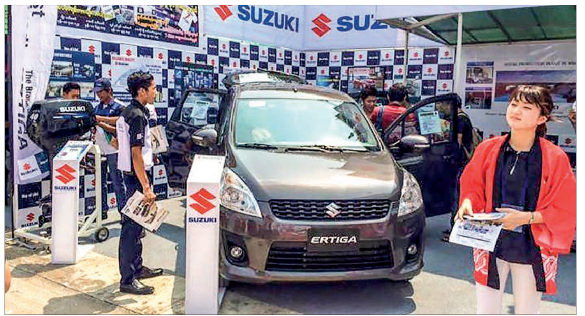
A Suzuki Ertiga was displayed at one car show in 2016.

vehicles from Japan, Korea and China occupy most of the market shares.