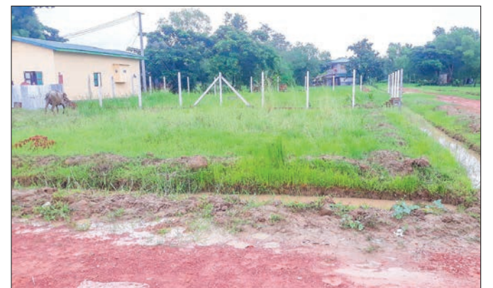
A plot for sale in Hmawby Township.

People are more interested in apartments in Yangon for rental and in lands for long-term investment. In satellite towns, the purchase of 20 feet x 60 feet government-grant lands worth between K50 million and K80 million is currently popular. Most buyers put their main focus on satellite towns, such as Shwepyitha, Dagon Myothit (East), Dagon Myothit (South), Dagon Myothit (North) and Thanlyin townships. It is learned that government-grant lands are more solid than “the plots to be granted permit” in terms of ownership.— TWA/GNLM