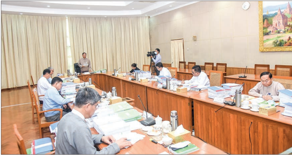
MIC Chair Lt-Gen Moe Myint Tun presides over the meeting 3/2022 in Nay Pyi Taw yesterday.

THE Myanmar Investment Commission-MIC held its meeting (3/2022) at No 18 Union Government Office yesterday morning in Nay Pyi Taw.