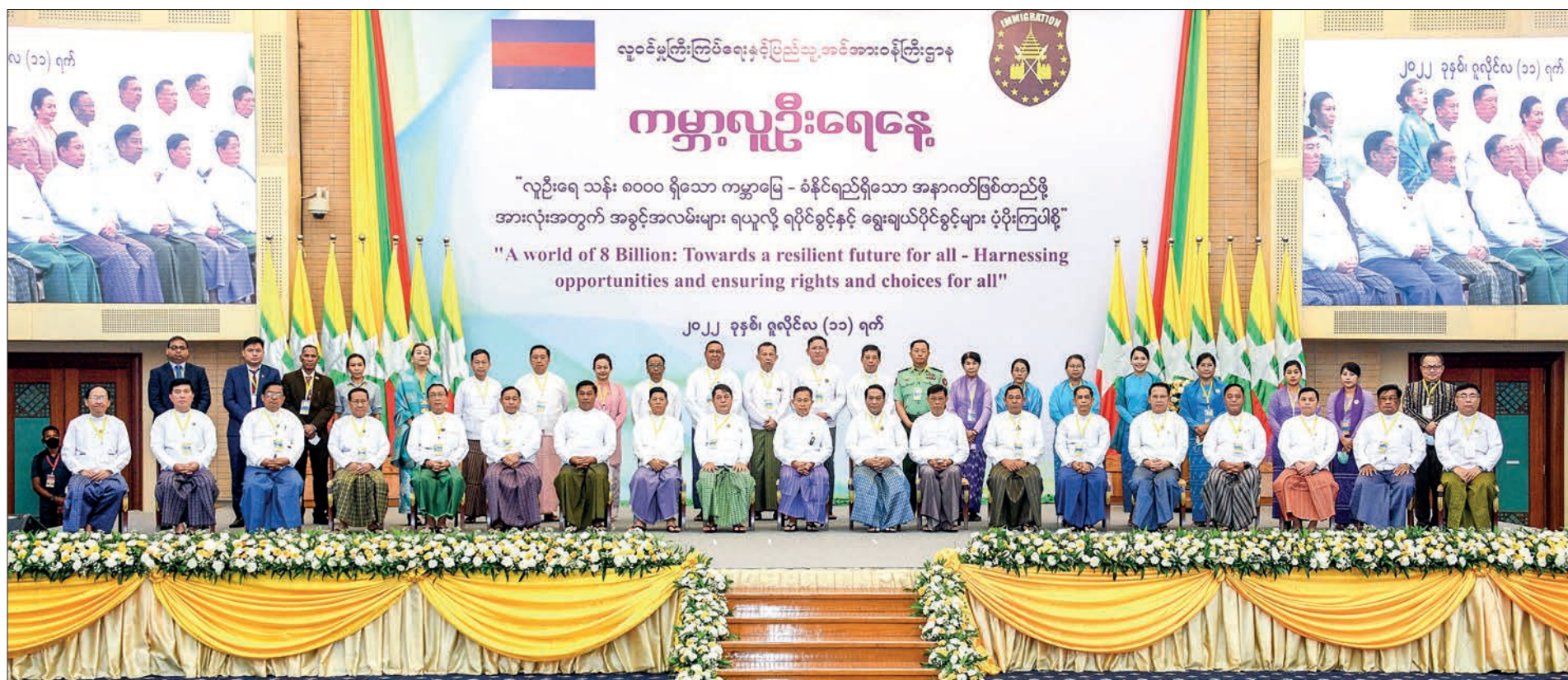
State Administration Council Vice-Chair Deputy Prime Minister Vice-Senior General Soe Win takes the documentary group photo with attendees at the event.