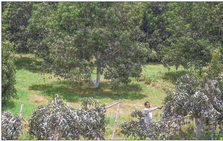
In this picture taken on 15 June 2022, Hari Mali, a farm worker plucks mangoes from a tree at a farm outside Mirpur Khas city in Pakistan's southern Sindh province.

MANGO farmers in Pakistan say production of the prized fruit has fallen by up to 40 per cent in some areas because of high temperatures and water shortages in a country identified as one of the most vulnerable to climate change.