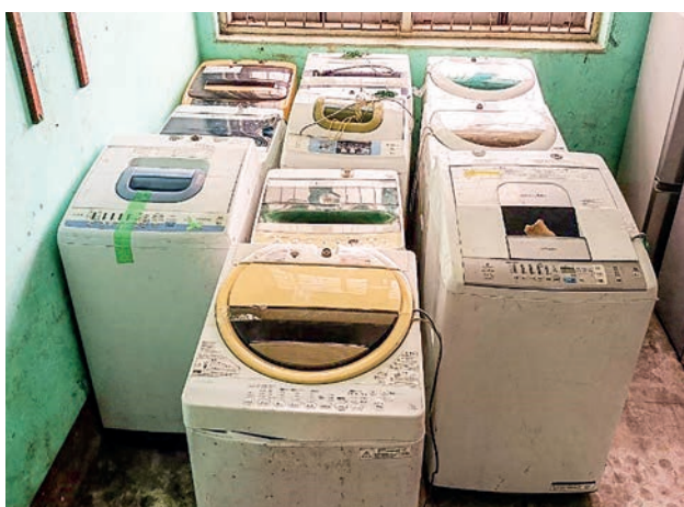
Seized washing machines in Mon State.

Therefore, seven arrests estimated at K36,079,016 were made on 9 and 11 July, according to the Anti-Illegal Trade Steering Committee. —MNA