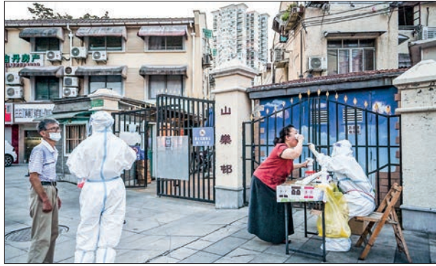
A health worker (R) takes a swab sample from a woman to test for the Covid-19 coronavirus on a street next to a residential area in the Jing'an district of Shanghai on 5 July 2022.

The prospect of another lockdown sparked a