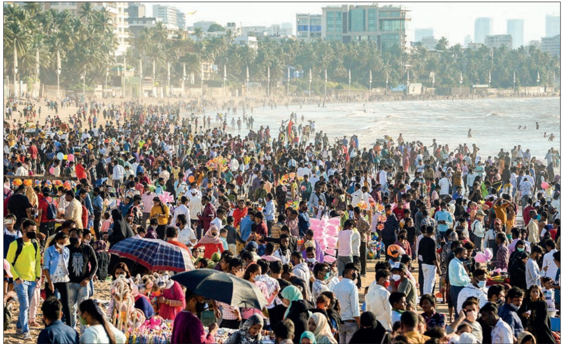
A general view shows beachgoers thronging Juhu beach in Mumbai on 9 January 2022.

While a net drop in birth rates is observed in several developing countries, more than half of the rise forecast in the world's population in the coming decades will be concentrated in eight countries, the report said. It said they are the Democratic Republic of Congo, Egypt, Ethiopia, India, Nigeria, Pakistan, the Philippines and Tanzania. — AFP