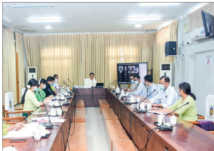
Myanmar-Russian trade meeting is in progress online.

The meeting was attended by officials from various departments via videoconferencing.