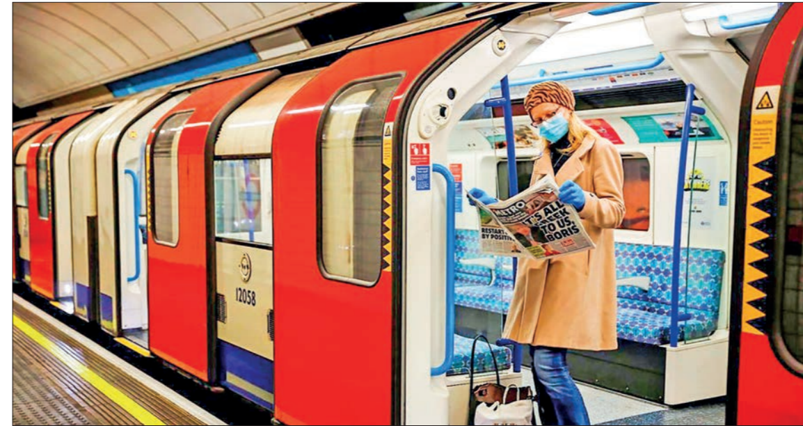
Most of UK's Monkeypox cases are in London. A woman reads a newspaper as she stands aboard a London Underground Tube train, in the morning rush hour on 11 May 2020, as life in Britain continues during the nationwide lockdown due to the novel coronavirus pandemic.

The 54 patients observed in this study represent 60 per cent of the cases reported in the UK