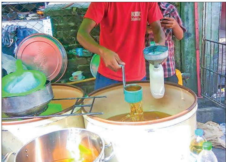
A vendor is seen selling the palm oil.

ALTHOUGH the wholesale reference rate of palm oil is set at K4,650 per viss (a viss equals 1.6 kilogrammes) in Yangon Region, the palm oil prices were valued at over K7,000 per viss in the domestic market.