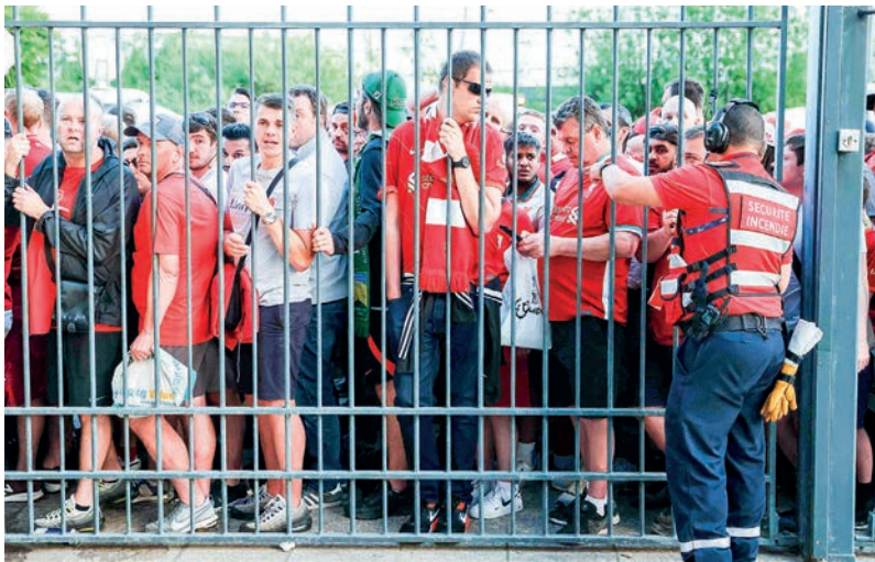
Liverpool fans stand outside the Stade de France before last month's Champions League final.

A senior UEFA representative said on Tuesday he did not believe French Interior Minister Gerald Darmanin's claims about the number of fake tickets in circulation during the chaotic scenes before last month's Champions League final between Liverpool and Real Madrid.