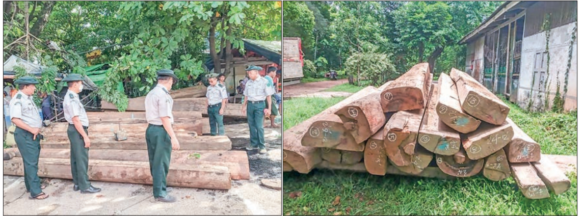
Officials confiscate timbers in Yangon Region.

They confiscated K2 million worth of a Toyota Mark II car and K2.5 million worth of a Toyota Alphard car in Yenangyoung