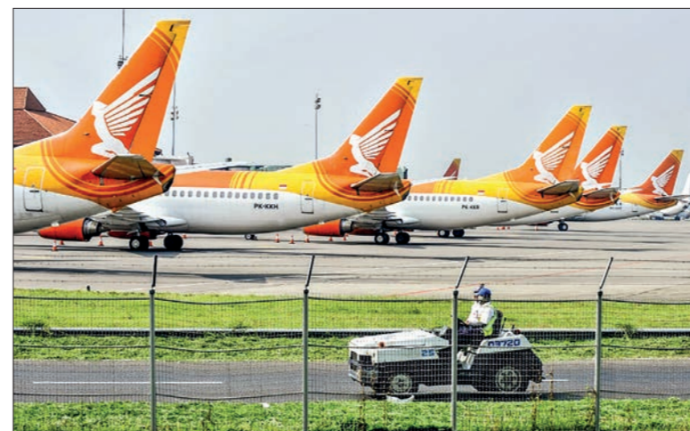
Indonesian budget airline Adam Air planes are parked at the Soekarno-Hatta airport in Jakarta.