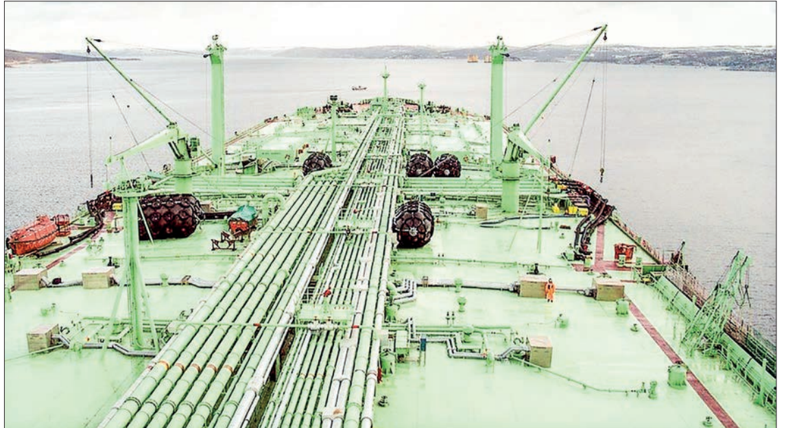
A picture shows the "Rosneft" oil tanker "Belokamenka" anchored in Kola bay, near the Russian northern seaport of Murmansk.

CHINA'S imports of oil from Russia rose 55 per cent in May, customs data showed on Monday, with the West sanctioning fuel imports from Moscow over its invasion of Ukraine.