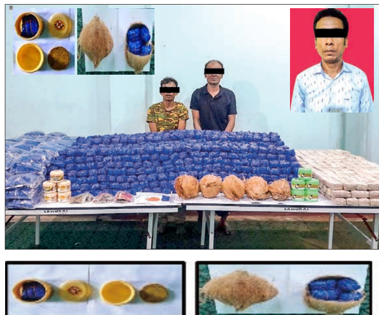
Arrestees are seen along with seized stimulant pills.

The suspects are prosecuted under the Narcotic Drugs and Psychotropic Substances Law and police are carrying out the investigation, the Myanmar Police Force stated. — MNA