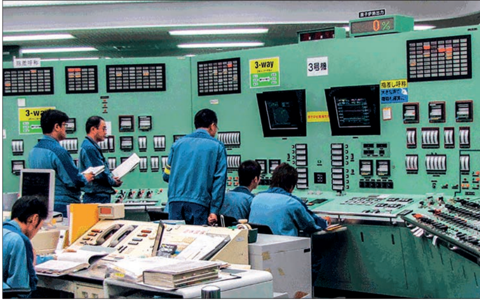
In this September 2010 photo, Tokyo Electric Power Co. workers are seen at work at the central control room of reactor Unit 3 of the Fukushima Dai-ichi nuclear complex at Okumamachi, northeastern Japan.

PRIME Minister Fumio Kishida said Tuesday the government plans to ease the impact of rising electricity prices on the public by awarding power-saving households points that can be used to help lower their utility bills.