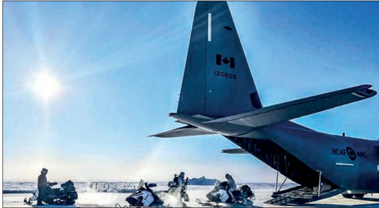
US Special Forces loading snowmobiles onto a Canadian aircraft during an exercise on 12 March.

CANADA'S defence minister announced upgrades to Arctic air and missile defences with the United States on Monday, citing growing threats from Russia and new technologies such as hypersonic missiles.