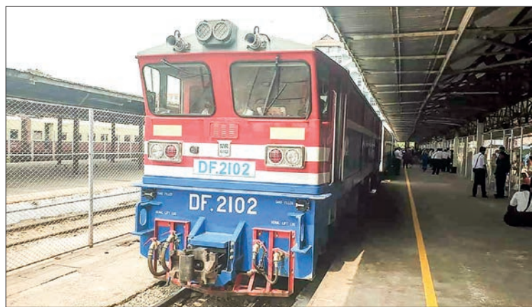
The Yangon-Mandalay Express Train at the Yangon Central Station.

MYANMA Railways is planning to resume express trains soon, which have been temporarily suspended, with a cheaper fare than long-distance express buses to make it easier for the public. This includes the No 5 Yangon-Mandalay up train and the No 6 down train, No 61 Yangon-Pyay up train and the No 62 down train.