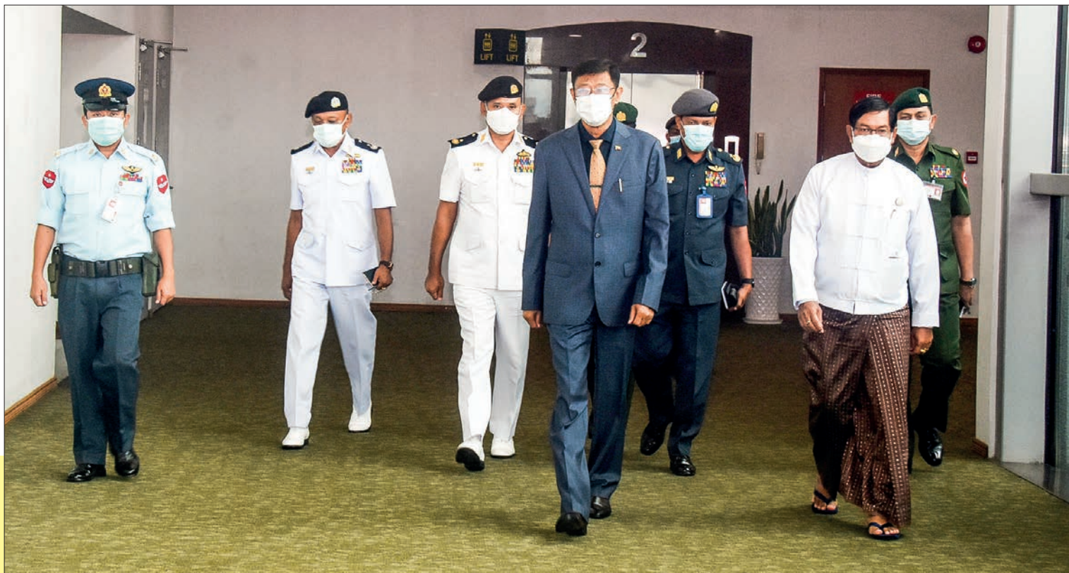
MoD Union Minister General Mya Tun Oo is seen off at Yangon International Airport before departing for Cambodia.

The Union minister was accompanied by Deputy Director-General of the Department of International Affairs U Zaw Zaw Soe and officials. Yangon Region Chief Minister U Soe Thein and senior military officers saw the delegation off at the Yangon International Airport. — MNA