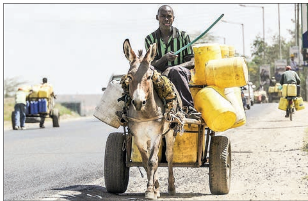
A Kenyan vendor relies on his donkey to transport water.

That is still a relative bargain in China where donkey hides that sold for $473 in 2018 now sell for $1,160. The ejiao produced from them can sell for up to $360 per kilogramme.— AFP