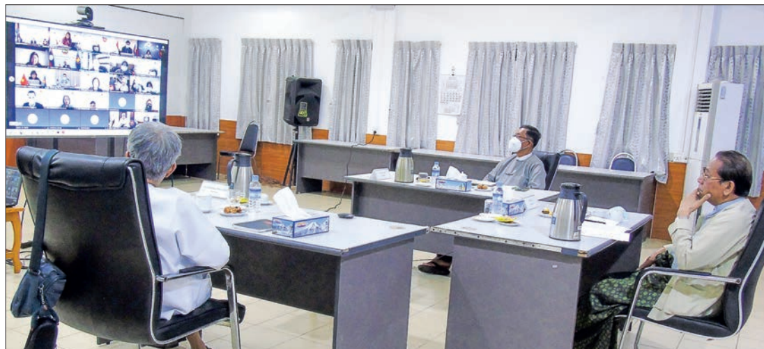
A virtual meeting of the AICHR and SEANF is in progress.

THE ASEAN Intergovernmental Commission on Human Rights (AICHR) and the Southeast Asia National Human Rights Forum (SEANF) held a virtual meeting today.