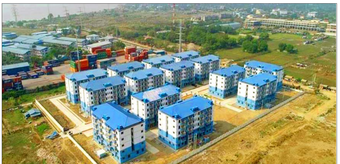
One of the Public Rental Housing projects in Yangon Region.

Inwa Housing Project is aimed at the middle-income and low-income people to occupy the property. It is developed on the roadside of Ayawun Road in Da-