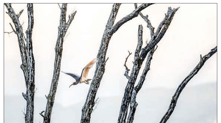
Wild tokis have been brought back from local extinction on Japan's Sado island.

where the bird's delicate pink plumage and distinctive curved beak now draw tourists. It's a rare conservation success story when one in eight bird species globally are threatened with extinction, and involved international diplomacy and an agricultural revolution on a small island off Japan's west coast.—AFP