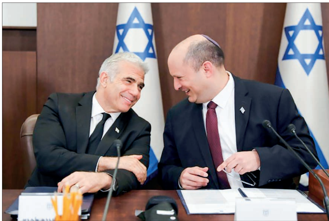
Israeli Prime Minister Naftali Bennett has said Foreign Minister Yair Lapid will take over as premier within days.

Bennett said that Lapid, a centrist, will take over as prime minister of the caretaker government in line with last year's power-sharing deal.—AFP