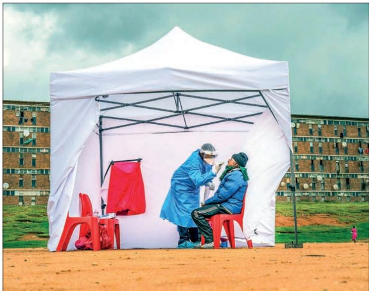
A resident from the Alexandra township gets tested for COVID-19 in Johannesburg, South Africa, Wednesday, 29 April 2020.