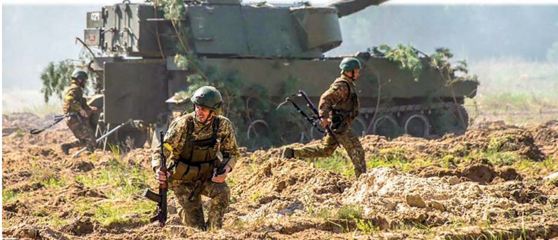
Self-propelled howitzers M109A3 shooting on the front line with Russian troops in an unknown place of Ukraine.