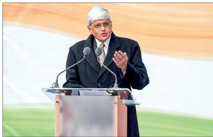
Gandhi was governor of West Bengal state between 2004 and 2009 after being appointed by the then-ruling Congress party.

The BJP is likely to announce its own candidate this week and may again put forward the incumbent, Ram Nath Kovind, a member of India's marginalised Dalit community, to serve another term.—AFP