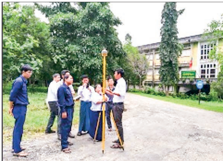
Yangon's first Informative Digital Map project is underway.

Urban planning staff and JICA Team staff were divided