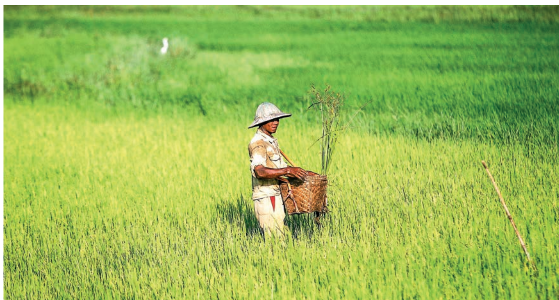
Urea fertilizer is imported from Indonesia and Iran and it is priced at K83,500 per bag.

Those interested can buy them through the contact num-