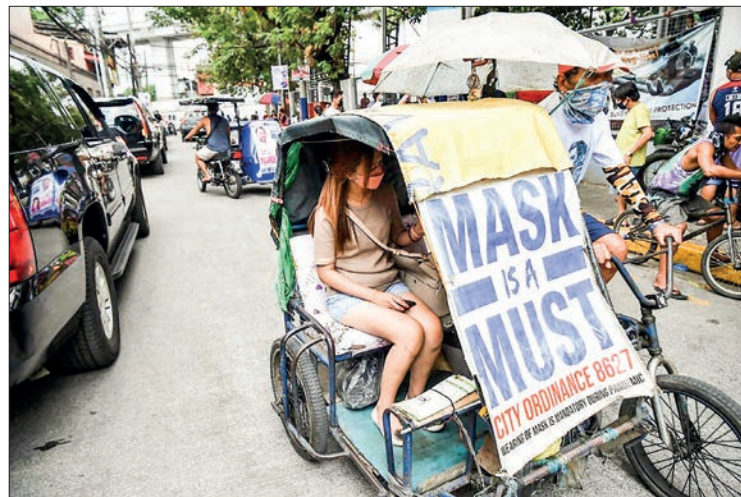
A passenger sits inside a tricycle covered with a reminder to wear a mask, part of the Covid-19 health protocols in Manila on 16 Febautry 2022.

Infectious diseases expert Edsel Maurice Salvana downplayed the spike in COVID-19 cases, saying the uptick in cases is expected due to the detection of the new, more transmissible coronavirus variants. Salvana said the country's COVID-19 cases "remains manageable at this time due to the low health-care utilization rate." The DOH blamed the slight increase of COVID-19 infections on the spread of the more transmissible variants, the increase in people's mobility, and the people's "waning immunity".—Xinhua