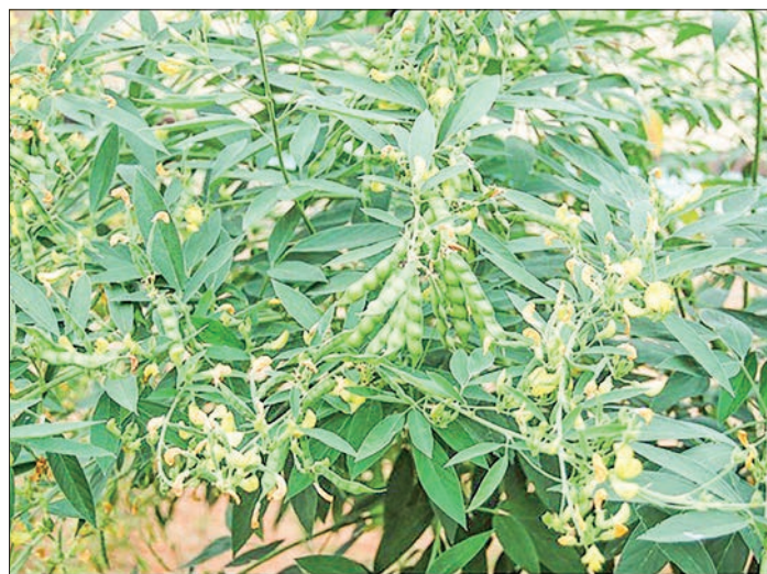
Pieces of pigeon peas (top right) and a plantation of pigeon peas (above).

there were no exports to India after August 2017, the prices of pigeon pea and black gram dropped, and the relevant authority set the price at K400,000 for a tonne of black gram and K500,000 for a tonne of pigeon pea.