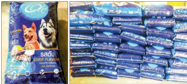
Seized illegal feedstuffs in Kayin State.

Therefore, 14 arrests (approximately K95,987,503) were made on 17, 18, 20 and 21 June, according to the Anti-Illegal Trade Steering Committee. —MNA