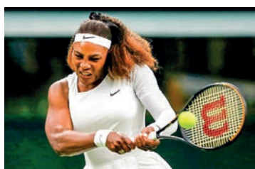
Serena Williams in action at Wimbledon in 2021.

ONS Jabeur said Monday she "cannot wait" to team up with Serena Williams as the American star prepares to return to tennis at the Eastbourne International after nearly a year away. Williams, a 23-year-time Grand Slam singles champion, was last week handed a singles wildcard entry to Wimbledon, which starts next Monday.