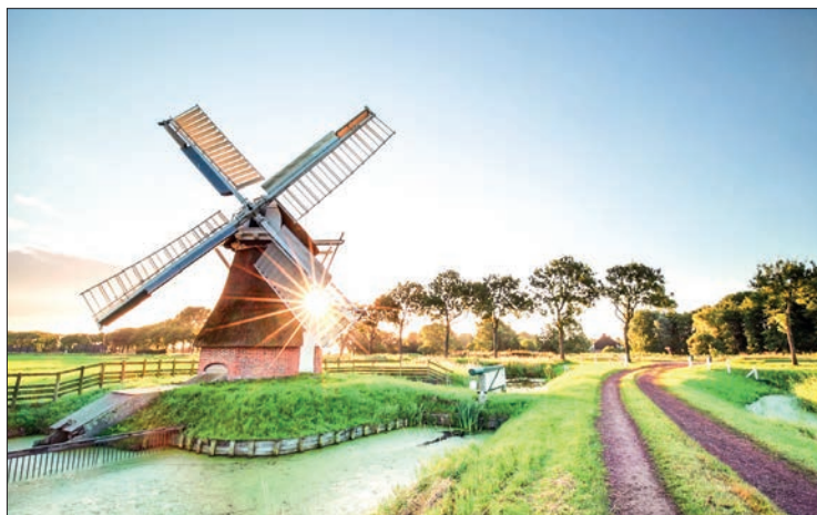
Several Dutch villages are known for their concentration of windmills, including Kinderdijk, Zaanse Schans, and Schiedam, home to the tallest windmill in the world.