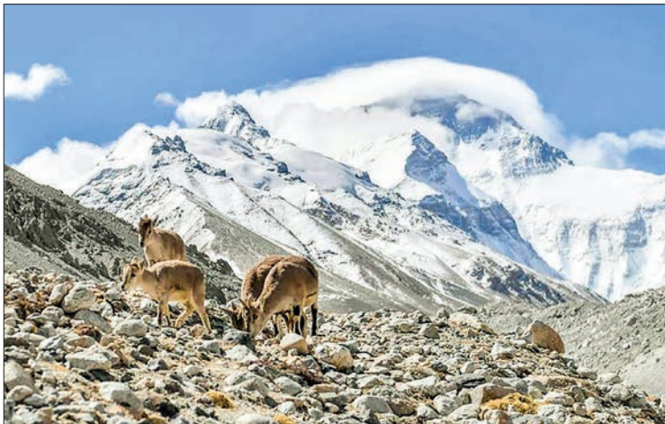
Animals live wild on the slopes of Qomolangma, the Tibetan name for Everest.

A repeatedly postponed UN summit tasked with protecting nature and halting accelerating