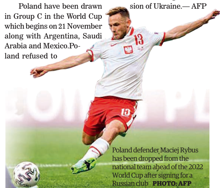
Poland defender Maciej Rybus has been dropped from the national team ahead of the 2022 World Cup after signing for a Russian club.

play Russia in their scheduled World Cup play-off semi-final in March following the invasion of Ukraine.— AFP