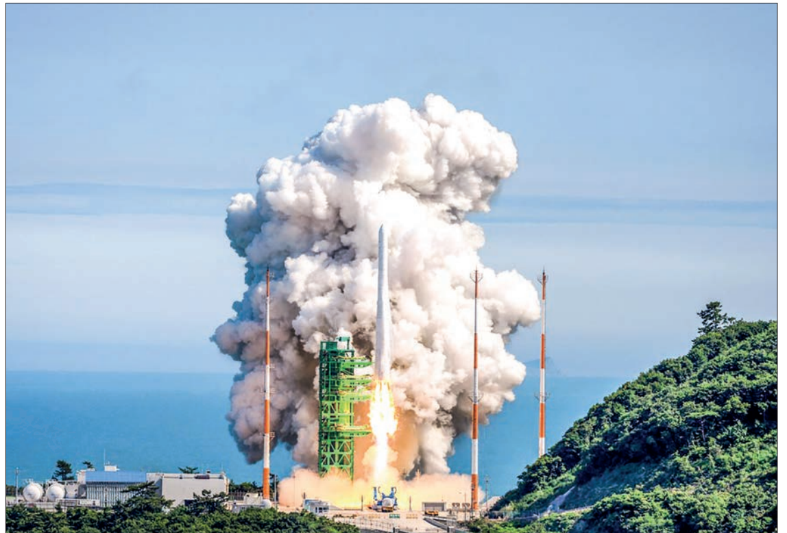
South Korea's 'Nuri' rocket successfully reached its target altitude of 700 km and put a satellite into orbit.

"Nuri separates dummy satellite," South Korea's YTN Television reported minutes after lift-off, adding shortly after that the launch "appears to be a success". In Tuesday's test, in addition to the dummy satellite, Nuri carried a rocket performance verification satellite and four cube satellites developed by four local universities for research purposes.—AFP