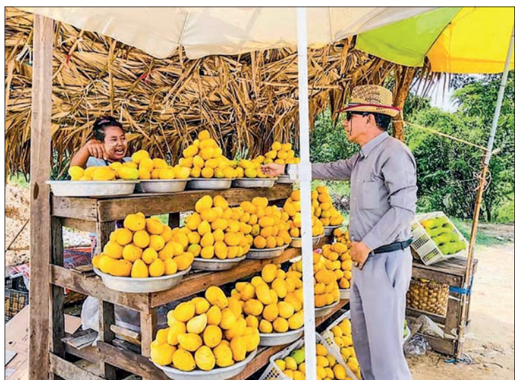
A consumer is seen buying mangoes from a street vendor.

"If mango meets quality criteria in Muse border, it is priced at K200 per piece. If they are ripe in Muse, it is worth only K80-100 per piece. If it takes five to six days to transport the mangoes to Muse, the over-ripe mangoes are discarded. Some growers make losses either. Yet, most of the farmers generate a certain profit," U Than Tun Oo stated.