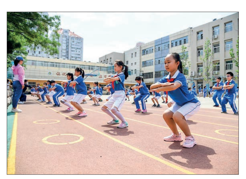
Fourth-graders attend a physical education class at Yangfangdian central primary school in Haidian District of Beijing, capital of China, 8 June 2020.

But hundreds of thousands still face restrictions after being designated close contacts of infected people.—AFP