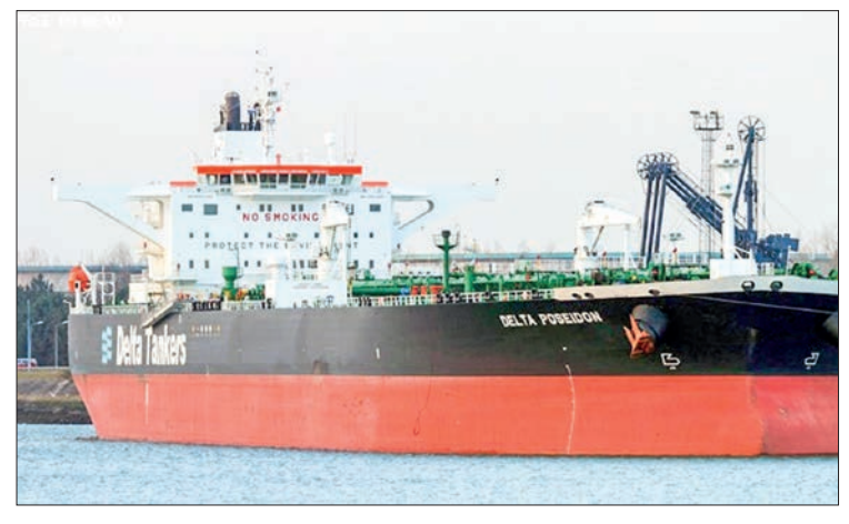
The Greek tanker Delta Poseidon.

IRAN was merely taking back "stolen property" by capturing two Greek tankers last week, the country's Supreme Leader Ali Khamenei said on Saturday,