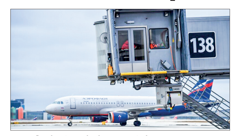
An Aeroflot plane is seen by the new terminal C at Moscow's Sheremetyevo airport on 17 January 2020.

SRI Lanka's main airport on Saturday denied the island nation's government was behind a decision to detain an Aeroflot aircraft, after Russia lodged a