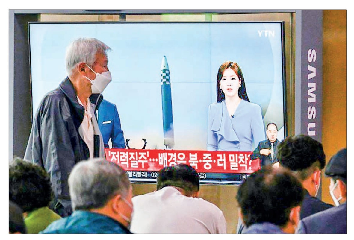
North Korea has launched a flurry of missiles in 2022.

According to local reports, two missiles were shot from