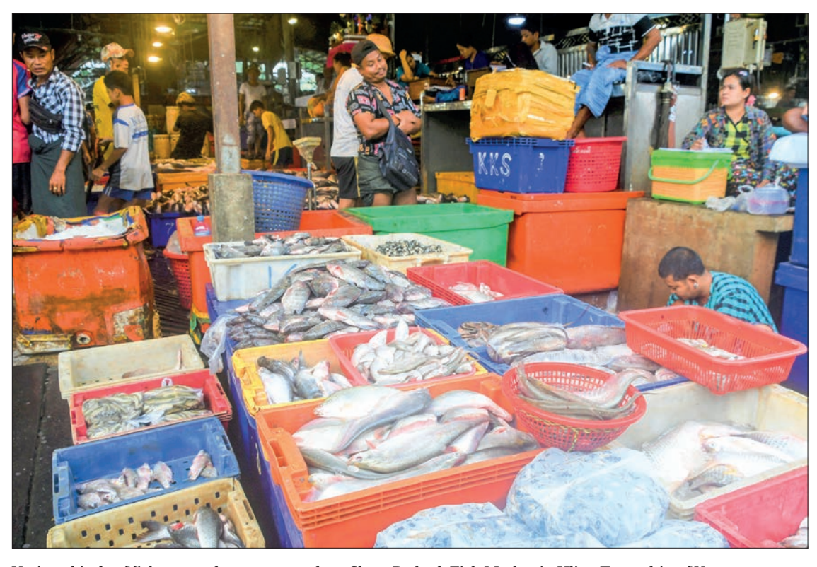
Various kinds of fishery products are on sale at Shwe Padauk Fish Market in Hline Township of Yangon Region.

"Especially during the rainy season, we are focusing on improving the flow of water in the market and market security; Since it is the big market for pub-