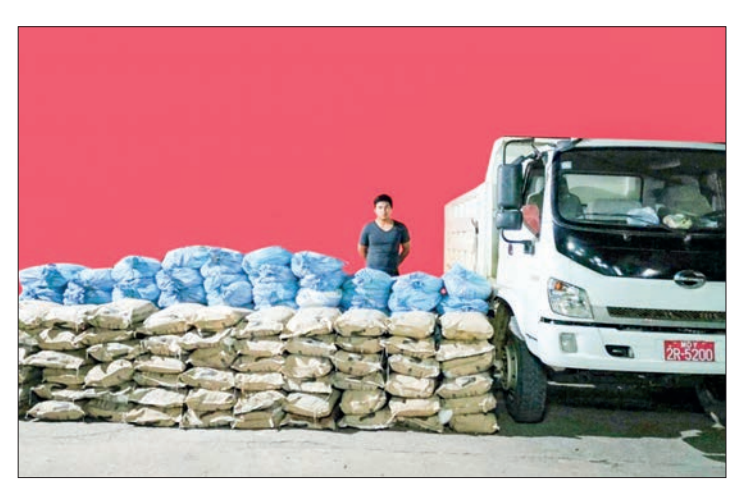
A drug trafficker is seen with seized 3,600 kg of Caffeine together with a truck in Tachilek township on 3 June.

A combined team consisting of members of the Anti-Drug Police Force seized 16,000 stimulant tablets from a motorbike on the afternoon of 4 June in Myeik Township, Taninthayi Region.