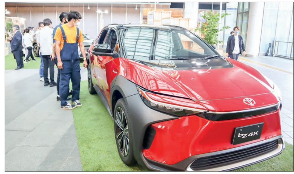
Photo taken 27 May 2022, in Nagoya, central Japan, shows Toyota Motor Corp.'s new electric model bZ4X, equipped with a lithium-ion battery.

According to Argus, the price of lithium, which is often traded in Chinese yuan as many battery-related industries are concentrated in China, has gone from about 89,000 yuan ($13,200) per ton in April last year to 486,000 yuan per ton. Prices of