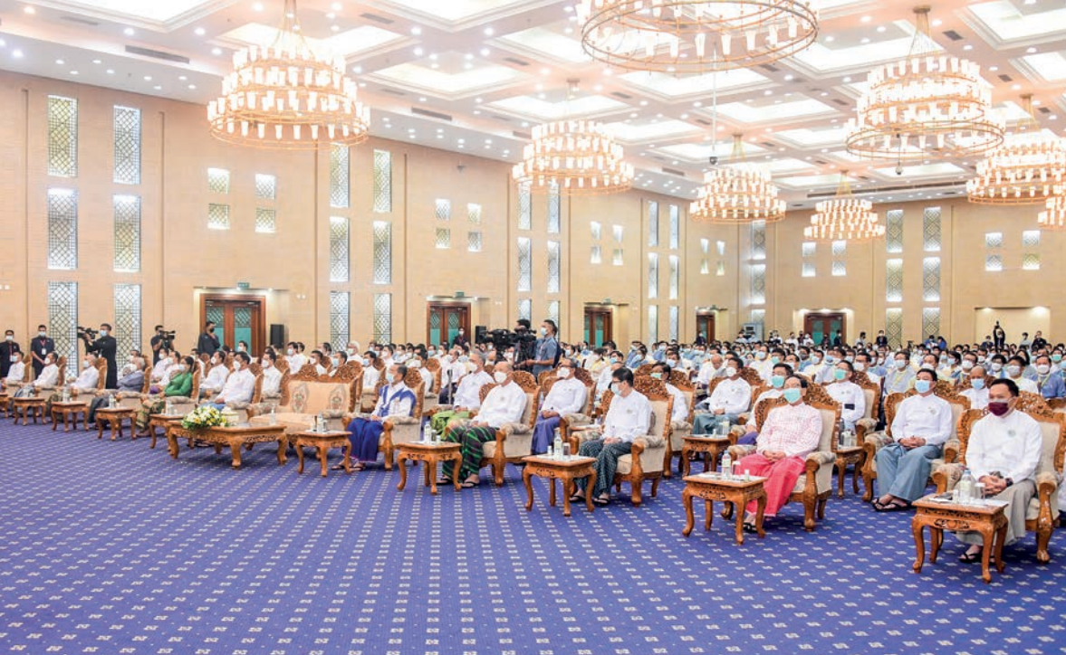
State Administration Council Chairman Prime Minister Senior General Min Aung Hlaing addresses the ceremony to mark World Environment Day 2022 at MICC-II in Nay Pyi Taw

YANMAR has formed 25.8 per cent of the forest reserves/protected forests to meet the 30 per cent of the national lands in 2030 for conservation of forest ecosystem and natural resources, said Chairman of the State Administration Council Prime Minister Senior General Min Aung Hlaing at the ceremony to mark the World Environment Day 2022 at the Myanmar International Convention Centre-II in Nay Pyi Taw yesterday morning.