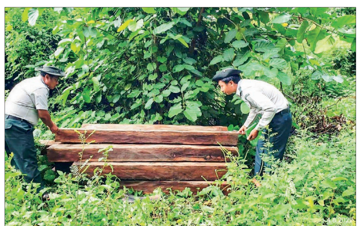
Officials inspect seized sawn timber in Pyu Township in Bago Region on 5 June.

Therefore, a total of three arrests (approximately K18,050,960) were made on 4 and 5 June, according to the Anti-Illegal Trade Steering Committee.—MNA