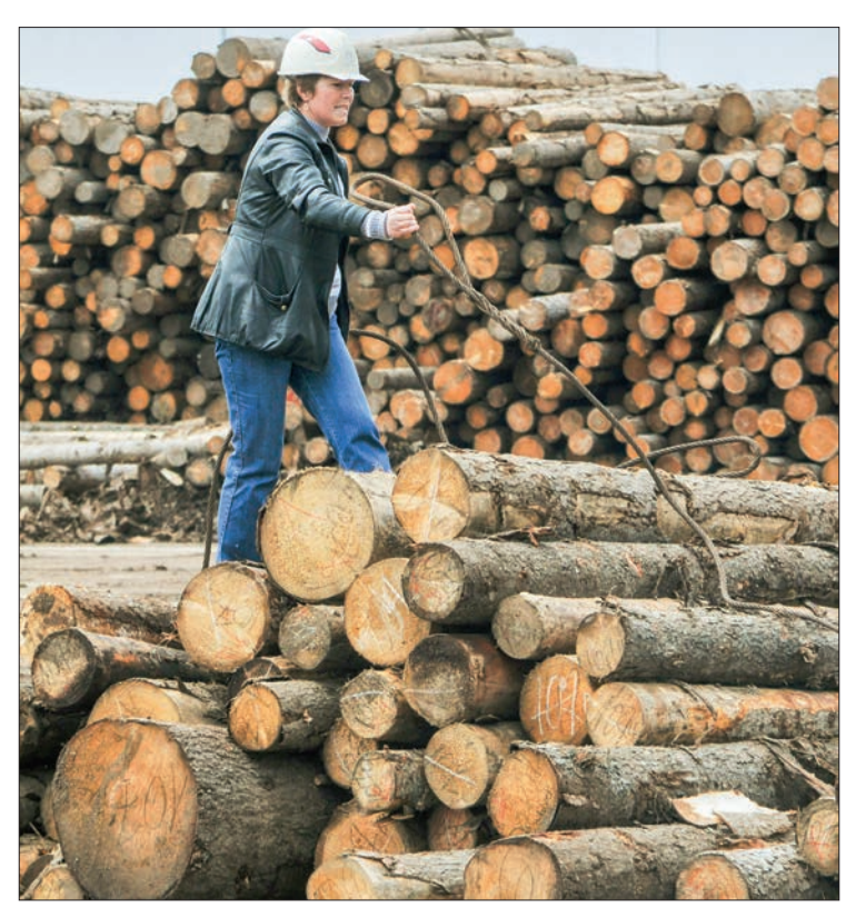
File photo shows logs piled up at a processing factory in a coastal region in the Russian Far East in 2009.