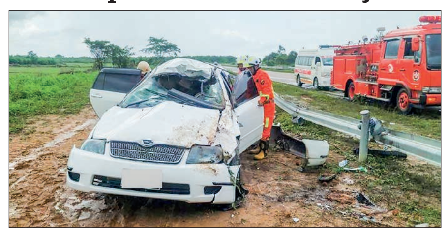
A Fielder car plunges into roadside after bumping guard rails between mile post 101/4 and 101/5 on Yangon-Mandalay expressway on 5 June.

MYANMAR'S traffic accidents in the past five months during the period of January-May 2022 left 30 dead and 110 injured in 72 cases, according the Road Transport Administration Department.