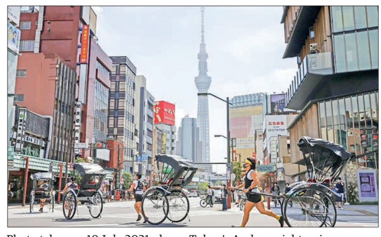
Photo taken on 10 July 2021, shows Tokyo's Asakusa sightseeing area and Tokyo Skytree (background) just days after the Japanese government decided to place the capital under a fresh COVID-19 state of emergency for the duration of the Olympics.

leased over the weekend, about 740,000 COVID-19 booster vaccine doses made by Moderna have been discarded or are expected to be discarded in 27 major cities in Japan due to expiration, as the country struggles to expand the number of people getting third