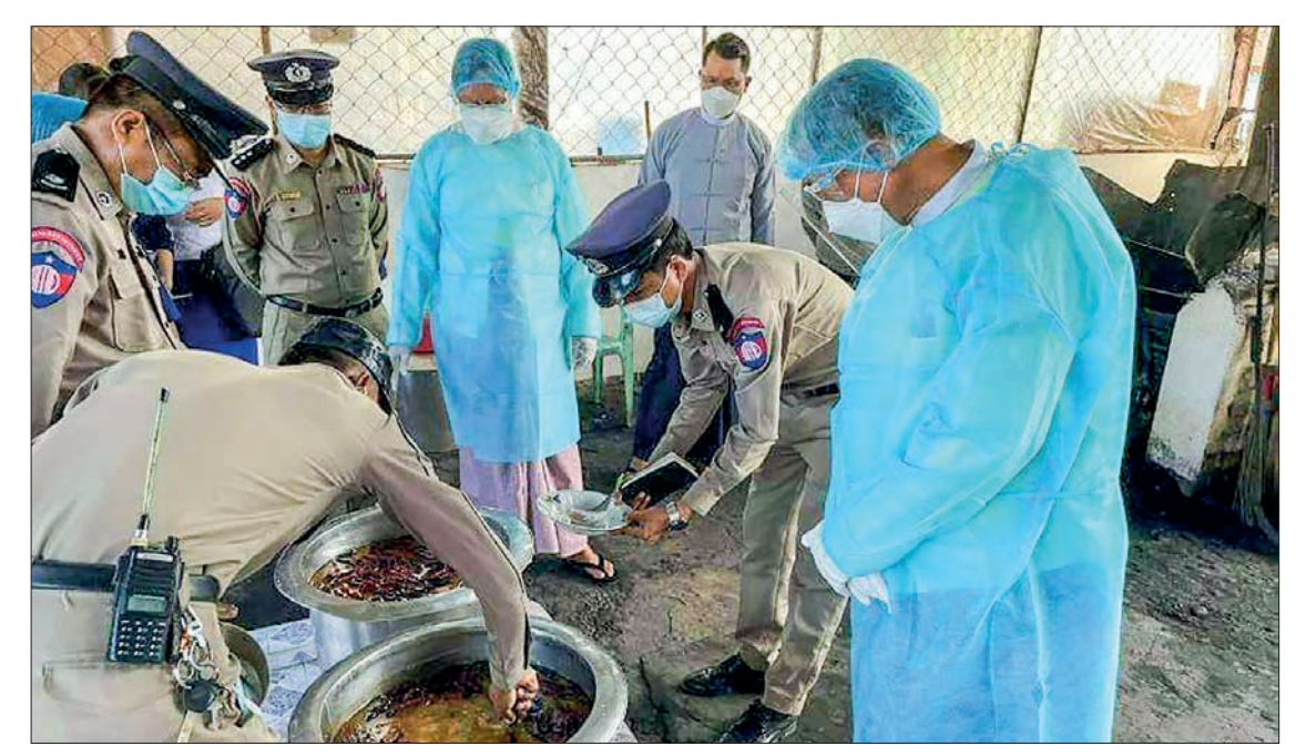
Officials of MNHRC inspect working process for food supplies at the jail.

The inspection was conducted by meeting with 9,297 prisoners from 27 prisons from January to May 2022. According to the findings of the inspection, one food issue, 43 administra-