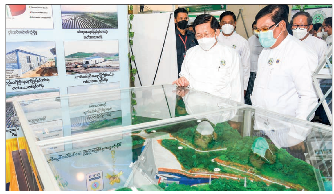
SAC Chairman Prime Minister Senior General Min Aung Hlaing views round booths to mark World Environment Day 2022.

So far, Myanmar has formed 25.8 per cent of the forest reserves/protected forests to meet the 30 per cent of the national lands in 2030 for conservation of