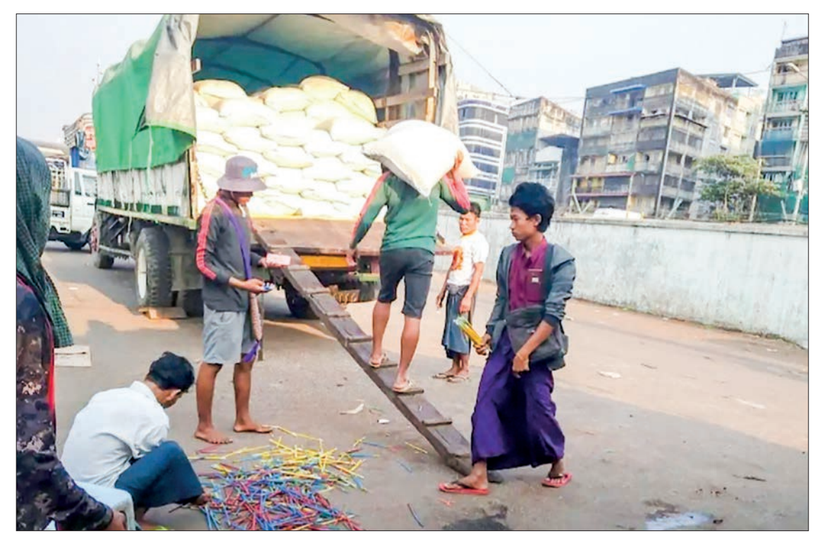
Freight workers loading bags of rice onto aboard the cargo truck for distribution to regions and states.

New monsoon paddy is expected to enter the market in 2022 November, and the arrivals of the new paddy face a discount of around K10,000 per bag each year compared to the old paddy on the market because consumers are mainly buying old rice.—TWA/GNLM