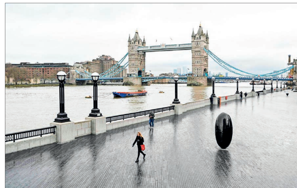
People walk along the bank of the River Thames with Tower Bridge in the background in London on 12 January 2021 as life continues in Britain's third lockdown due to the coronavirus pandemic.

The country of around 67 million people has recorded nearly 18.8 million cases, and almost