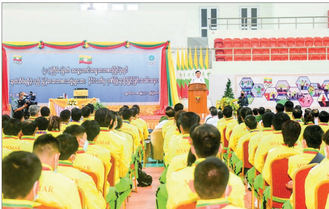
State Administration Council Chairman Prime Minister Senior General Min Aung Hlaing addresses the ceremony to honour victorious athletes for winning medals in the SEA Game 31, in Nay Pyi Taw on 3 June 2022.

The victorious athletes, coaches and administrative