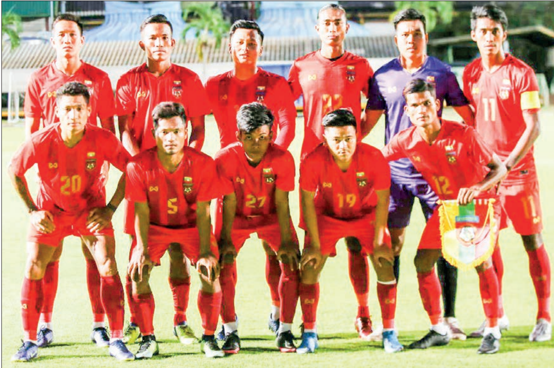
Myanmar National Football Team is seen before an international football match.