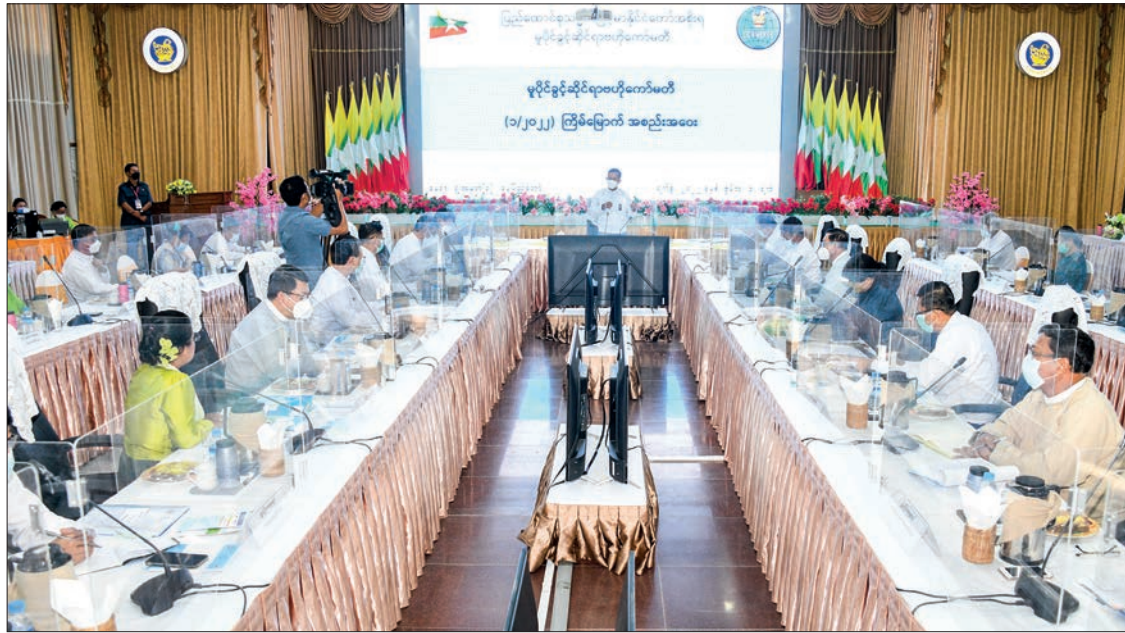
State Administration Council Vice-Chair Deputy Prime Minister Vice-Senior General Soe Win addresses the meeting 1/2022 of the Central Committee on Rights of Intellectual Property in Nay Pyi Taw yesterday.

economic policies, exercising the rights of intellectual property can contribute much to the development of businesses based on innovation and the emergence of the private sector capable of creation, innovation and competitiveness involved in the Myanmar sustainable development plan (2018-2030) while supporting the economic development of the State.