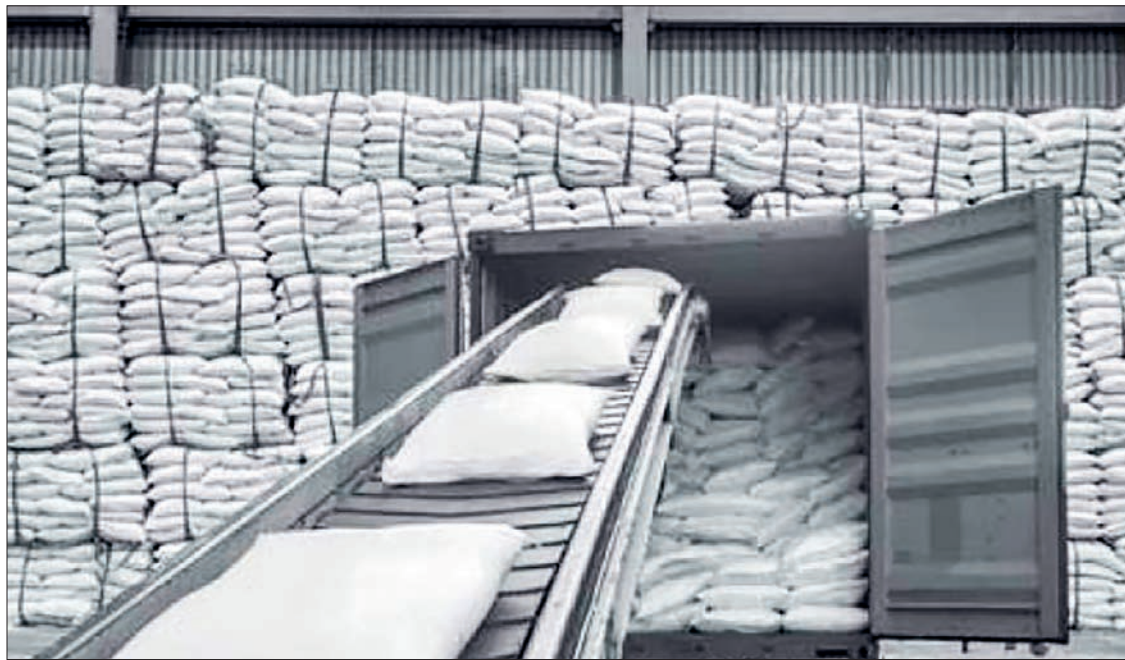
The wholesale price of sugar touched a high of K1,750 per viss in late 2010. On 31 May 2022, the price reached a fresh peak of K2,200.

The local sugar brands sell the sugar at the wholesale price of K2,140-2,200 per viss in Yangon. The sugar market collapsed in the past years owing to the COVID-19 impacts, resulting in a decrease in sugarcane sowing acres. This year, more sugarcane acres are added. The sugarcane processing started in mid-December and the season has not ended yet. Approximately 440,000 tonnes of sugar are expected to flow into the market, market