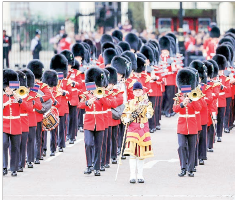
Huge crowds converged on central London in bright sunshine on Thursday for the start of four days of public events to mark Queen Elizabeth II's historic Platinum Jubilee, in what could be the last major public event of her long reign.

"We know it's a special occasion because it might be the last day we'll see Her Majesty in a public event," he told AFP.