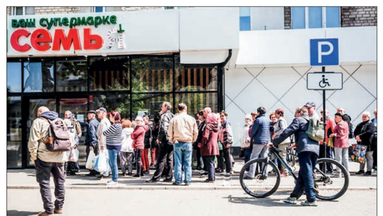
People queue in line outside a supermarket in Severodonetsk, eastern Ukraine, eastern Ukraine, on 3 May 2022, as fighting is raging across Ukraine's east.

"The most difficult situation is in the Lugansk region, where the enemy is trying to displace our units from their positions," said Valeriy Zaluzhnyi, the commander in chief of Ukraine's armed forces, according to a statement from the military.—AFP