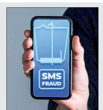
Police in 11 countries have taken down a mobile phone scam dubbed FluBot that spread around the world via fake text messages.

in the user's contact list, passing on the scam like a flu virus. "To date, we have disconnected ten thousand victims from the FluBot network and prevented over 6.5 million spam text messages," Dutch police said in a statement. The EU's police agency Europol said FluBot was among "the fastest-spreading mobile malware to date" and was "able to spread like wildfire due to its ability to access an infected smartphone's contacts."—AFP