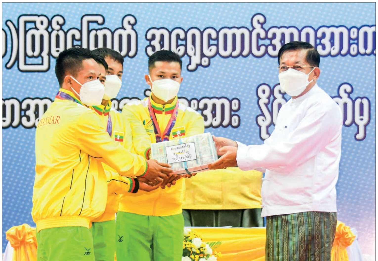
Chairman of the State Administration Council Prime Minister Senior General Min Aung Hlaing presents cash awards to gold medallists in the Vovinam sports.

pleased for victorious athletes in their competitions with honesty to securing the medals for the State by bringing honour to