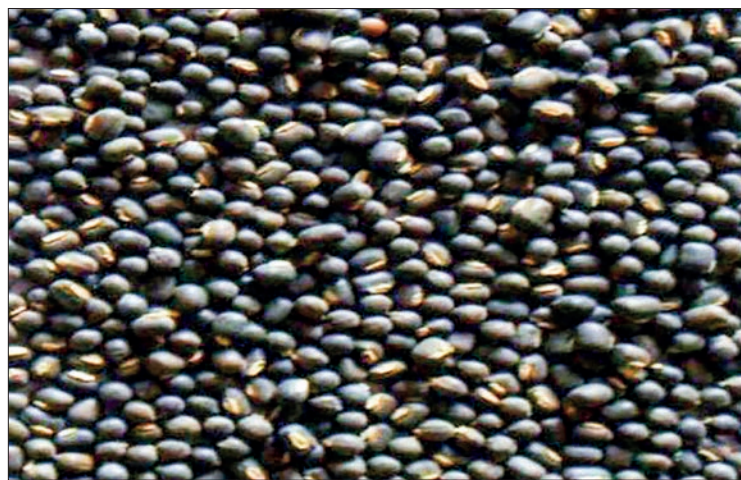
The bean cultivation rate was high in India and they temporarily suspended green gram and pigeon pea until March 2018.

The bean cultivation rate was high in India and they temporarily suspended green gram and pigeon pea until March 2018.