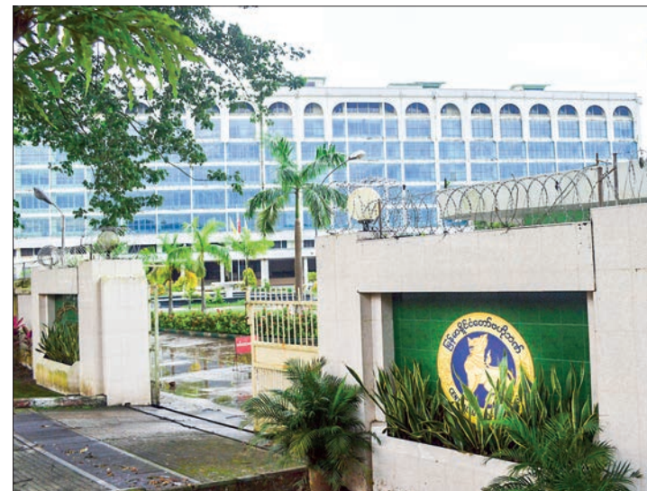
The Central Bank of Myanmar.

THE number of foreign exchange reserves was set for logistic services associations, according to the Foreign Exchange Supervision Committee's meeting (20/2022).