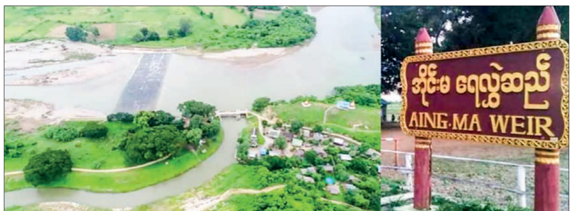
An aerial view of the Aing-Ma Weir.

in various stone inscriptions especially on the Pothugyi Thatta stone inscription in 606 ME, Khin Mami stone inscription curved on full moon of Taboung, 614 ME, another stone inscription donated by the stepmother of King Kyas-