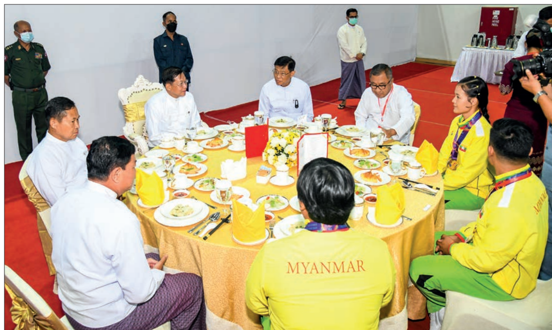
The Senior General and party give the tea party to triumphant athletes and coaches.

As part of encouraging the athletes, the government presented K200,000 and US$200 each to athletes, K100,000 and US$100 each to coaches at the handing over ceremony of the flag