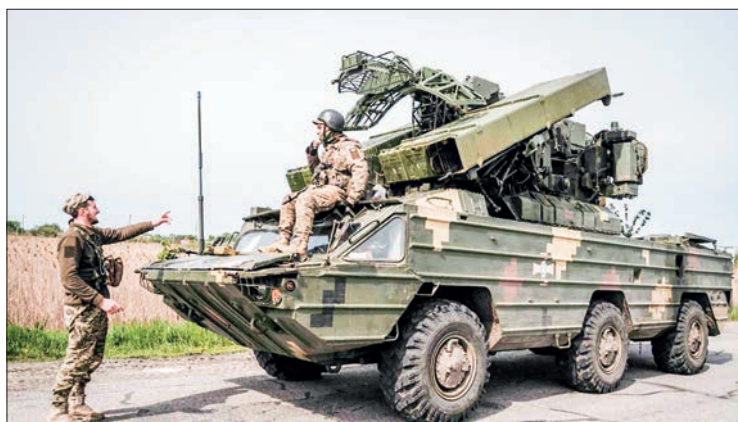
Ukrainian soldiers gesture around their anti aircraft missile system near Sloviansk, eastern Ukraine on 11 May 2022.

Following White House talks with US President Joe Biden, NATO chief Jens Stoltenberg warned Thursday that Ukraine's allies needed to brace for a gruelling "war of attrition".