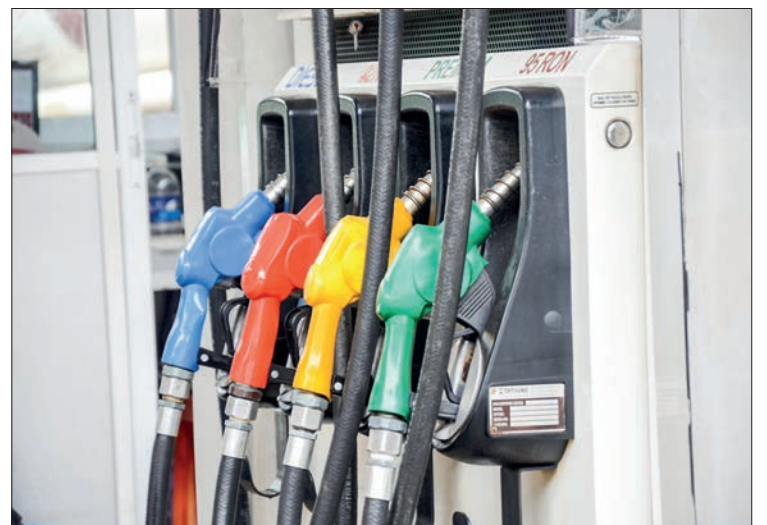
Myanmar is collecting fewer tax rate on the import of fuel and is setting policies to ensure that the people can purchase at a reasonable price.

In Myanmar, the Petroleum Import, Storage, and Distribution Oversight Committee were established on 21-4-2022 with 10 members, and the State Administration Council is also setting the exchange rate at K1,850 per US dollar. — TWA/GNLM