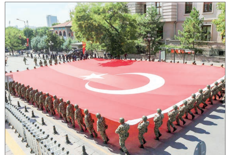
Turkish soldiers carry a giant Turkish flag during a ceremony to mark 94th anniversary of Turkey's Victory Day in Ankara on 30 August 2016.