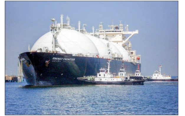
Australia is the world's largest LNG exporter at around 80 million tonnes in 2021.

term organic growth, add new reserves and resources cost-effectively, generate significant future returns for shareholders, and pursue further consolidation", they noted.—AFP