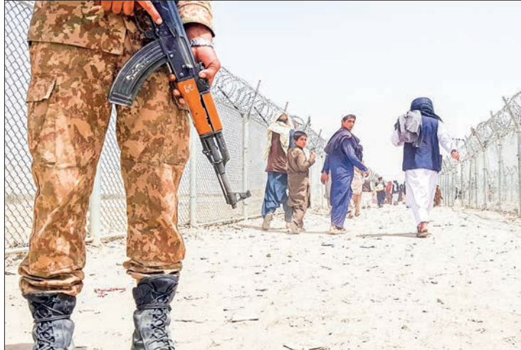
A Pakistani soldier stands guard as stranded Afghan nationals return to Afghanistan at the Pakistan-Afghanistan border crossing point in Chaman on 15 August 2021, after the Taliban took control of the Afghan border town in a rapid offensive across the country.

"In the two days of meeting substantial progress has been made and as a result of that the leadership of the TTP has extended the ceasefire until fur-