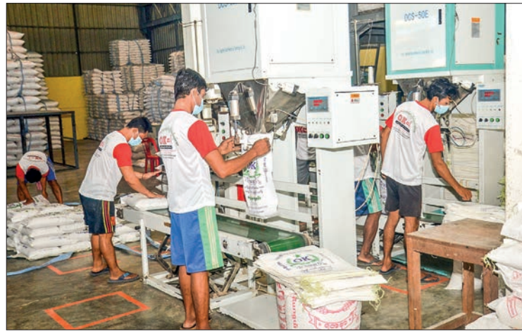
Workers are packing the export rice.

Myanmar conveyed about 18,200 tonnes of broken rice to