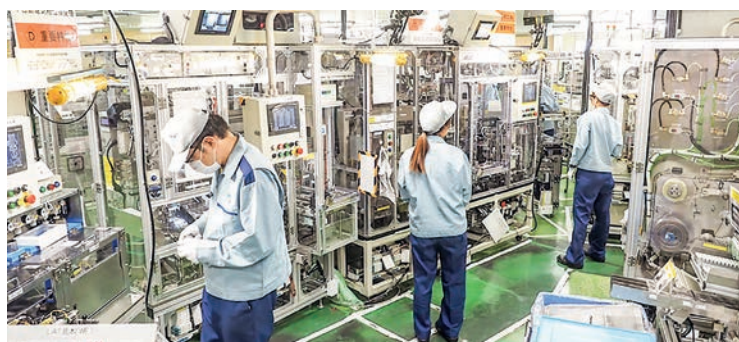
Hitachi Ltd. said Tuesday its employees can take their face masks off providing they are not conversing and social distancing is practiced at work, easing its mask guidelines in line with the view of the Japanese health ministry.

The Japanese government said recently that wearing masks outdoors is not necessary providing people maintain social distancing, with the approach of summer increasing the risk of heatstroke.—Kyodo