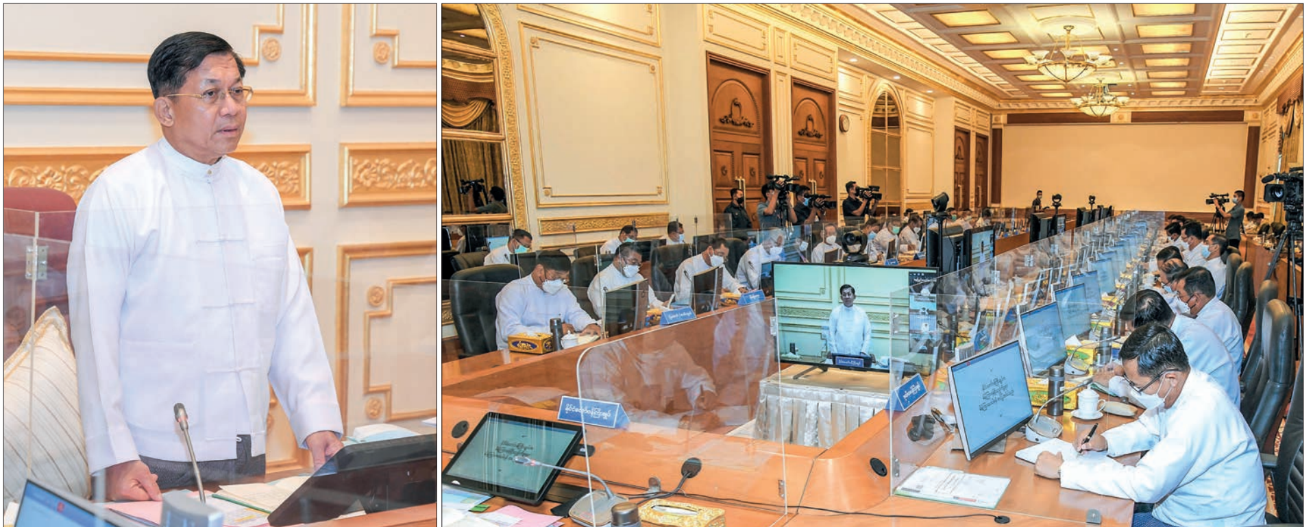
State Administration Council Chairman Prime Minister Senior General Min Aung Hlaing addresses the meeting 4/2022 of the Union government in Nay Pyi Taw on 31 May 2022.

A S the emphasis is being placed on the formation of the districts in the administrative machinery, important departments should open their offices in the newly-formed districts and self-administered division and zones, said Chairman of the State Administration Council Prime Minister Senior General Min Aung Hlaing at the meeting 4/2022 of the Union government at the SAC Chairman Office in Nay Pyi Taw yesterday. Efforts for ensuring peace and stability