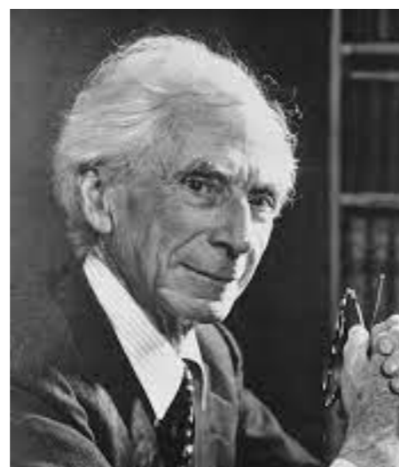
Bertrand Russell.

ONE hundred and fifty years ago on 18 May 1872, the philosopher Bertrand Russell (18 May 1872-2 February 1970) was born. During his long life, Bertrand Russell wrote many philosophical and related books, and treatises: their length might well exceed a million words. Books about him and his philosophy written before and after his death may also exceed a million words.