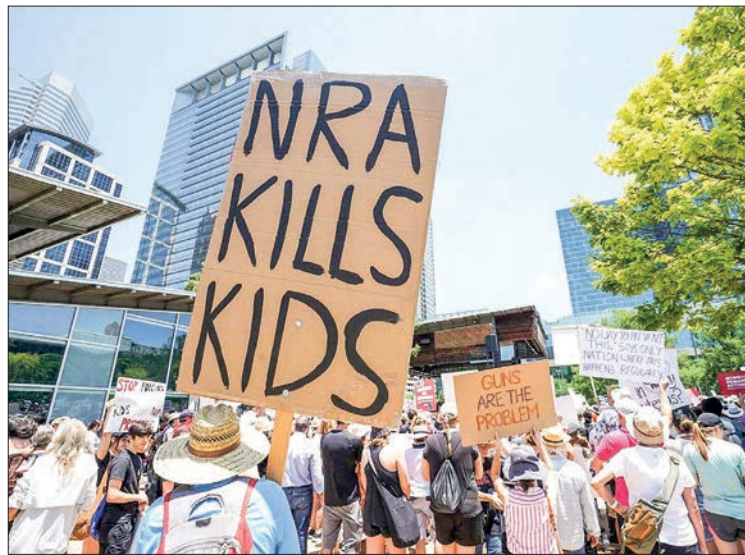
Anti-gun demonstrators protest outside the National Rifle Association Annual Meeting at the George R. Brown Convention Centre, on 27 May 2022, in Houston, Texas.