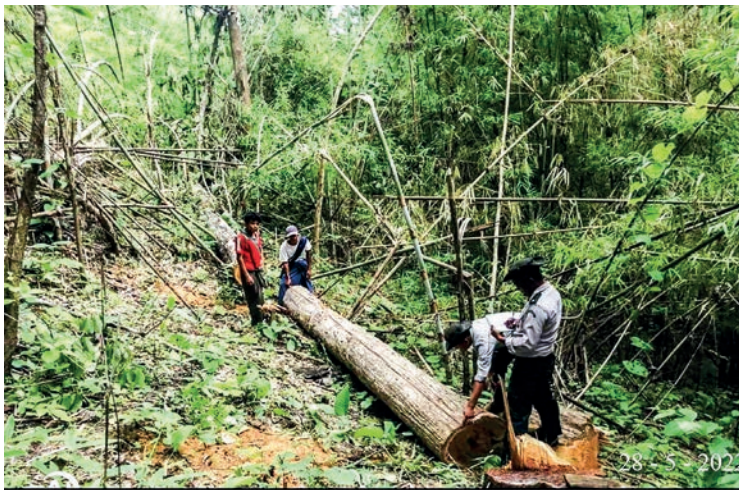
Officials seize teak logs.

SUPERVISED by the Anti-Illegal Trade Steering Committee, effective action is being taken to prevent illegal trade under the law.