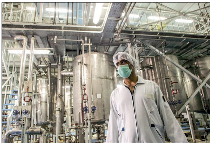
An Iranian technician works at the Isfahan Uranium Conversion Facilities (UCF), 420 kms south of Tehran. PHOTO: AFP/BEHROUZ MEHRI/FILE

amount of uranium enriched to 60 per cent now exceeded the IAEA's threshold of a "significant quantity", defined by the agency as an approximate amount above which "the possibility of manufacturing a nuclear explosive cannot be excluded".—AFP