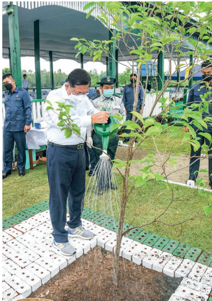
The Senior General is seen throwing water at the sapling.

According to a 2000 report issued by the UN Food and Agriculture Organization (FAO), 51.54 per cent of the country was covered in the forest while 46.96 per