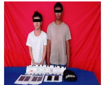
Two arrestees are seen along with seized drugs.

At 6:00 pm on the same day, police searched a house of Ma Yarsmain in Shwezar village of Maungtaung Town-