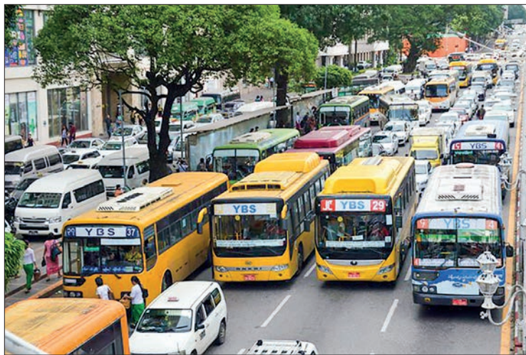
YBS buses are seen in downtown Yangon.

It is learned that the YBS bus lines operating in Yangon city are currently violating set rules and regulations, such as collecting more fares and giving