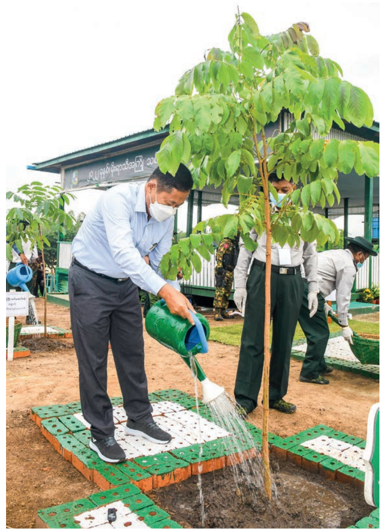
The Vice-Senior General is pictured pouring water on the sapling.

cent in 2010, 42.92 per cent in 2015 and 42.19 per cent in 2020. The figures showed declining forest coverage in the country.