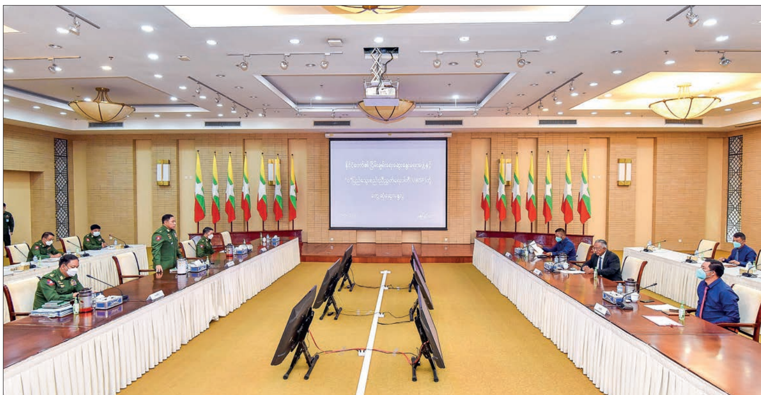
The meeting between the government Peace Talks Team and the delegation led by the UWSP vice-chair is in progress.

THE discussion between the government's Peace Talks Team and the delegation led by the vice-chairman of the United Wa State Party (UWSP) was organized in Nay Pyi Taw yesterday. The meeting was attended by State Administration Council