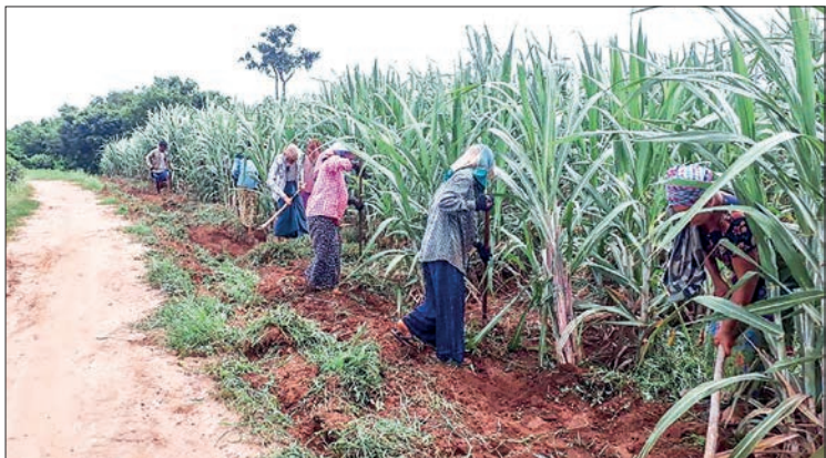
The projected acres are 606 in Madaya, 4,000 in Singu, 1,000 in Thabeikkyin and 2,000 in Tagaung, totalling 7,606 acres.

THE Mandalay Region Agriculture Department targets to cultivate 7,606 new acres of sugarcane in four townships of Mandalay Region in the 2022-2023 Financial Year.