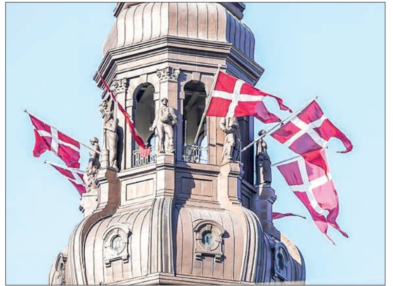
Eleven of Denmark's 14 parties have urged voters to say 'yes' to dropping the opt-out.

Since then, Denmark has remained outside the European single currency, the euro — which it rejected in a 2000 referendum — as well as the bloc's common policies on justice and home affairs, and defence.—AFP