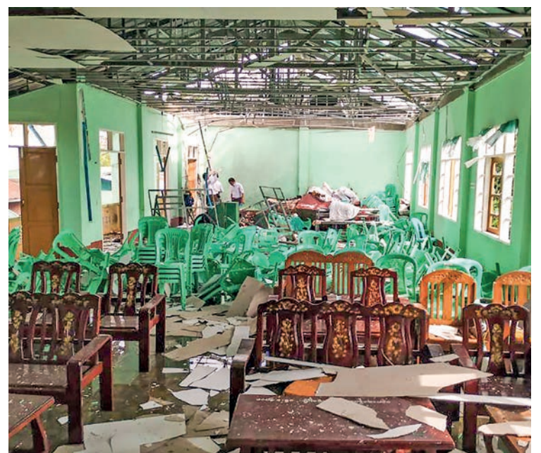
The ravages in the aftermath of the bomb blast at the Nawnghkio Township Education Office.