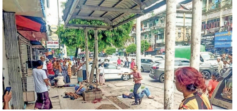
The aftermath scene of the blast.

The bomb blast occurred at the bus stop on 35 th street of the Anawrahta road in Kyauktada Township at 3:20 pm yesterday.