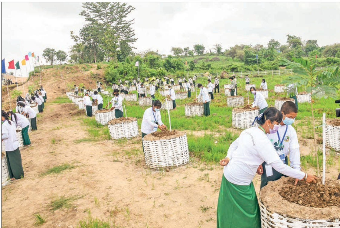
The pre-monsoon tree planting event in action.

According to the statement of FAO in 2020, only 49.19 per cent of the land area was covered by forest and so the government promoted the state-owned forest plantation area to ensure the forest coverage and meet the wood demands. The 10-year MRRP from the 2016-2017FY to the 2025-2026FY was also drafted. Based on the programme, the teak, ironwood, gun-kino, pine trees and more than 42,000 acres of watershed and mangrove plantations were established and there were 22,000 acres in the 2018-2019FY. If the commercial plantation is well conserved, it can produce wood for local demand without affecting natural forests. — MNA