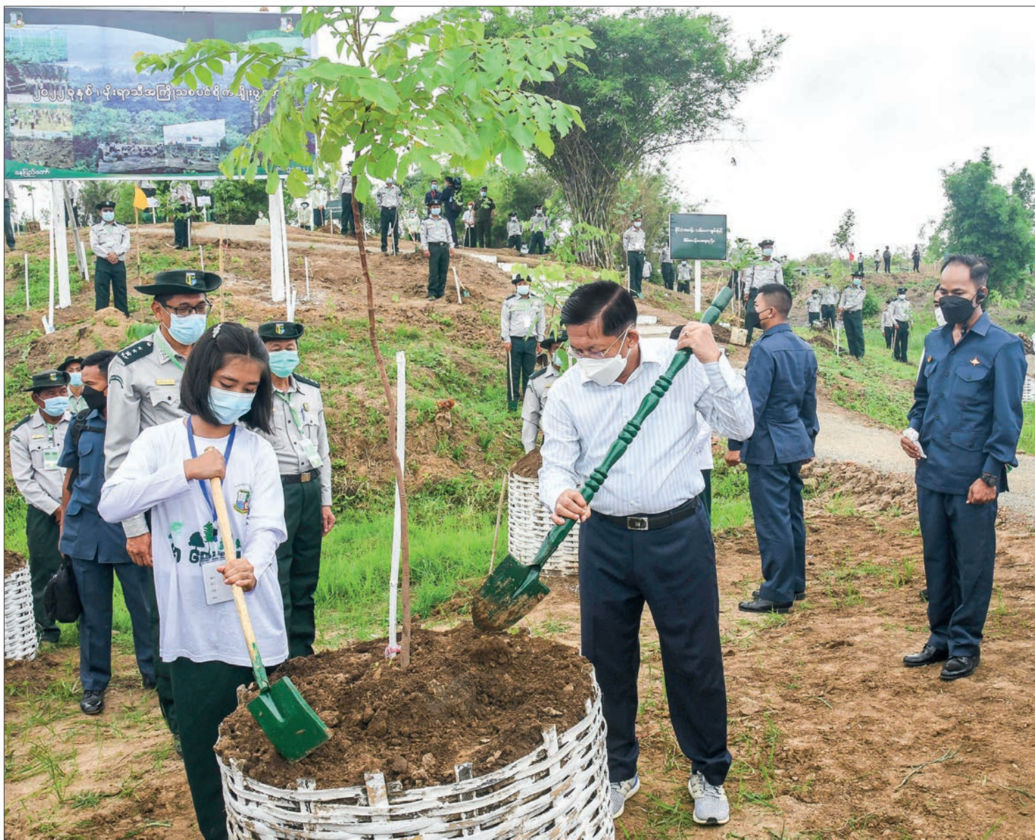
State Administration Council Chairman Prime Minister Senior General Min Aung Hlaing leads in the pre-monsoon tree planting ceremony along with a student at No 13 Yan Aung Myin forest reserve block in Lewe Township of Dekkhina District in Nay Pyi Taw on 31 May 2022.

Although the previous tree planting events were held only in June and July, they were conducted starting in May this year. The events should be held across the nation.