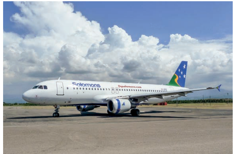
The Solomon Islands' national carrier, Solomon Airlines, has adjusted its domestic schedule to prepare for the future booking demand ahead of the full border reopening from 1 July.

"While the ongoing mandatory quarantine period for international arrivals remains a deterrent to inbound tourism, we understand that these restrictions will be progressively relaxed and believe we will still see enough early international travellers coming to Solomon Islands to sustain our twice-weekly Brisbane-Honiara services until all restrictions are removed in the next few months," he said.—Xinhua