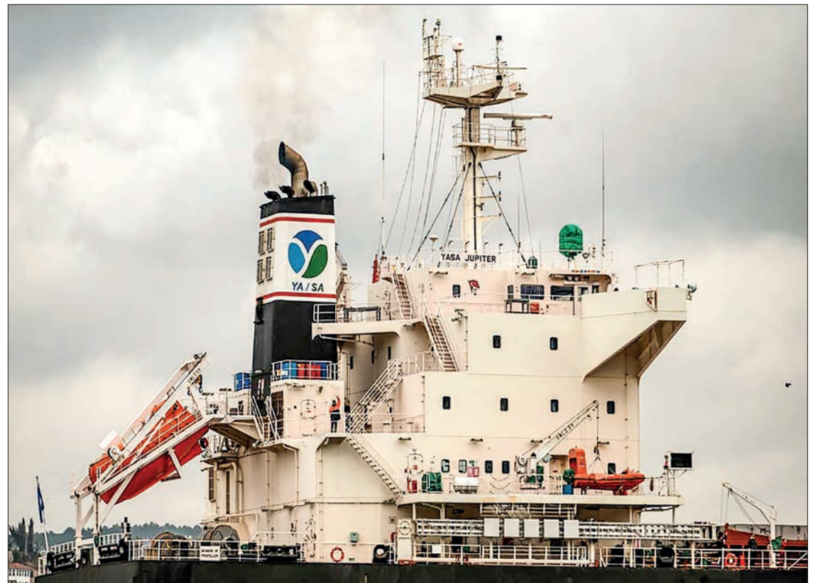
The Marshall Islands-flagged Turkish-owned Yasa Jupiter ship, which was hit by a missile off the coast of Ukraine’s port city Odessa, sails on the Bosphorus in Istanbul, Turkey, on 25 February 2022. The Yasa Jupiter is the first confirmed merchant ship casualty of war following Russia’s invasion of Ukraine, sustaining slight damages but no injury or human loss were reported.

RUSSIAN President Vladimir Putin told Turkish counterpart Recep Tayyip Erdogan on Monday that Moscow was ready to work with Ankara to free up maritime shipping blocked over the conflict in Ukraine.