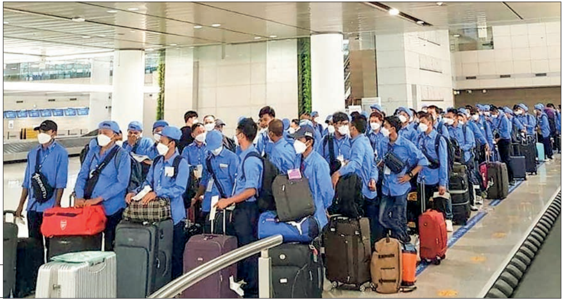
Myanmar workers are pictured leaving for S.Korea.

The minimum wage for South Korea in 2022 is set as 9,160 Won per hour, and the monthly wage is about two million Won, which is increasing the number of workers who want to go to work every year. More than 30,000 Myanmar workers are working in South Korea under the EPS system. — TWA/GNLM