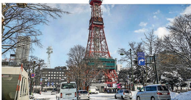
Sapporo was the first Asian city to host a Winter Olympics in 1972.

thon and race walk events at Tokyo's Summer Games last year so that athletes could compete in a cooler climate.