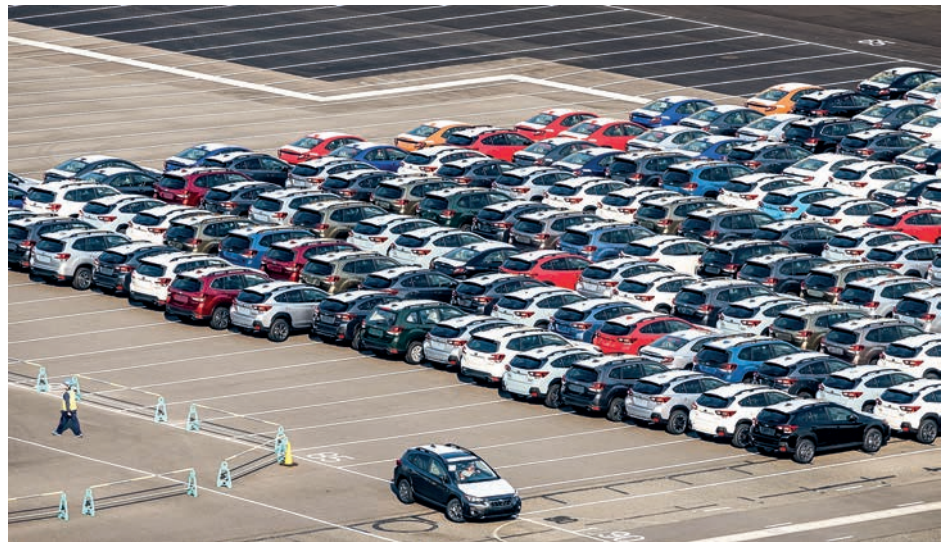
Cars bound for shipment are seen parked at Kawasaki Port, in Kawasaki on 18 May 2022.

That of Daihatsu Motor Co. accelerated 4.1 per