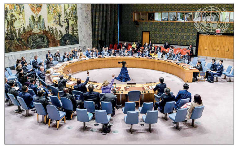
The UN Security Council votes on a resolution that sought to impose tougher sanctions on North Korea in New York on 26 May 2022. China and Russia vetoed the resolution.

FOREIGN ministers from the Group of Seven major developed nations said Monday they "deeply regret" failure by the