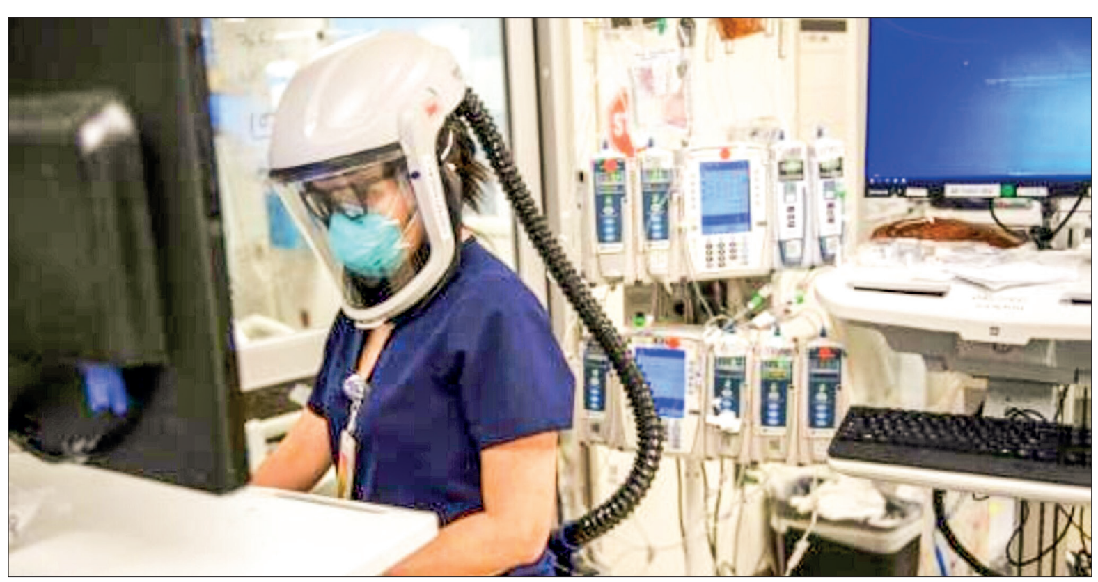
A nurse wearing personal protective equipment (PPE) including a personal air purifying respirator (PAPR) works in a Covid-19 intensive care unit (ICU) at Martin Luther King Jr. (MLK) Community Hospital on 6 January 2021 in the Willowbrook neighborhood of Los Angeles, California.

"Covid-19 severity and illness duration can affect pa-The study was based on tients' health care needs and