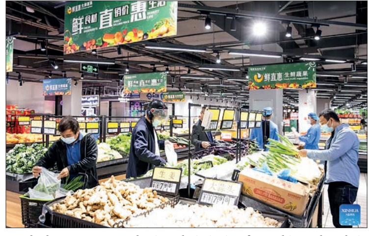
People shop at a supermarket in Xuhui District of east China's Shanghai, 16 May 2022. China's Shanghai has cut off the community transmission of COVID-19 in 15 out of its 16 districts, according to a press conference on epidemic prevention and control held Monday.

Shanghai will also essentially resume public transport services, including buses, rail transport and ferries, in the city, according