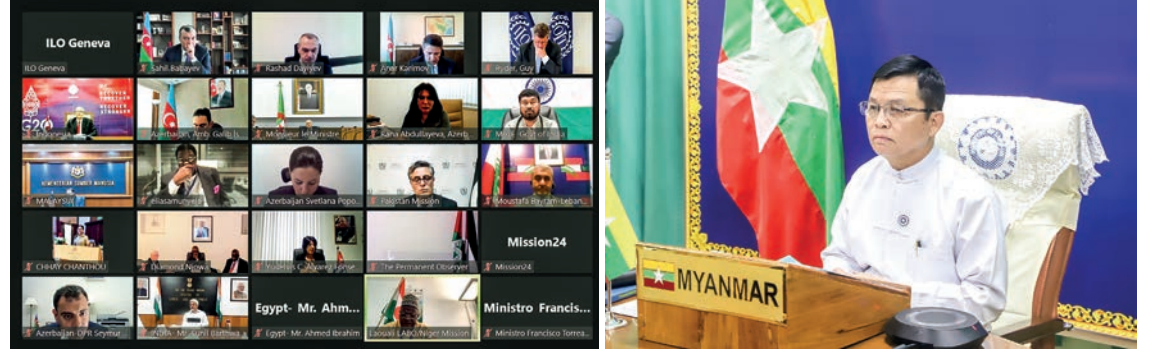
The online NAM's labour ministers' meeting in progress, attended by MoL Union Minister U Myint Kyaing.

While addressing the meeting, Union Minister U Myint Kyaing said the State Administration Council has set the five-point roadmap and nine objectives in building a genuine, disciplined, multiparty democratic system, focusing on the economic development of the country through the tripartite cooperation among the government, employers, and employees.