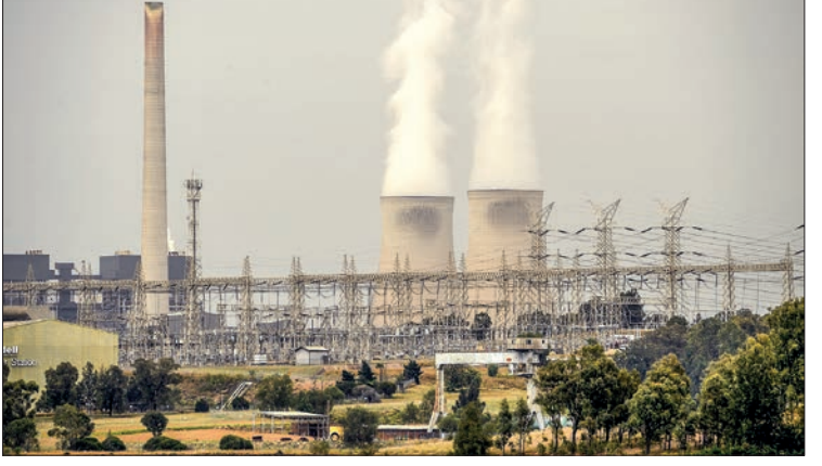
This picture taken on 4 November 2021 shows steam rising from cooling towers of the power generating plants in the town of Singleton, some 70km (43 miles) from Newcastle, the world's largest coal exporting port.

series of intense droughts, floods and bushfires — overwhelmingly support more action to tackle cli-