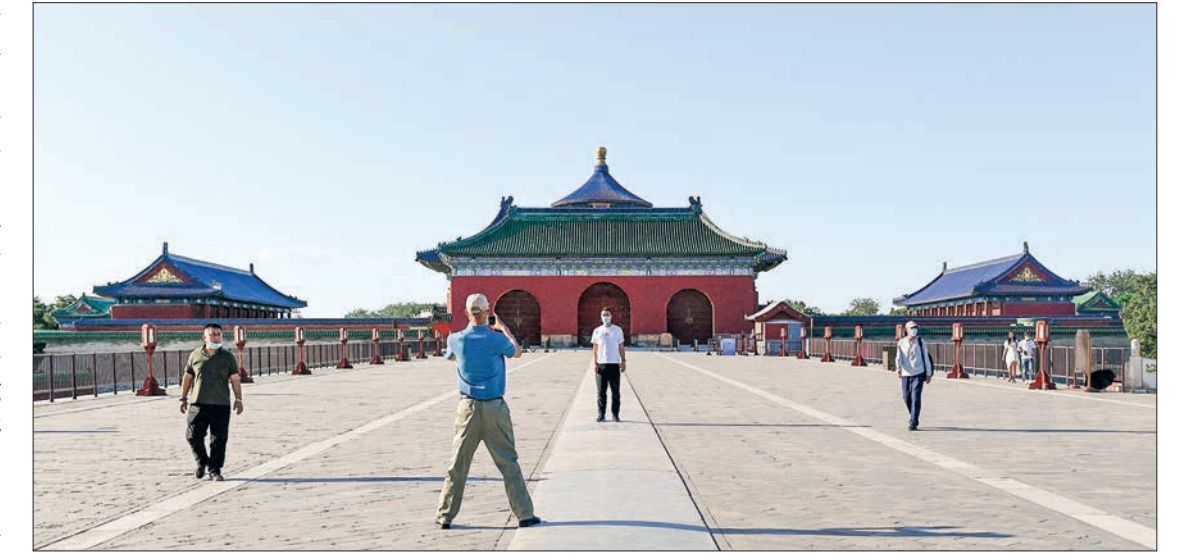
People visit the Temple of Heaven in Beijing on 30 May 2022.

Case numbers have dropped sharply in the past week.