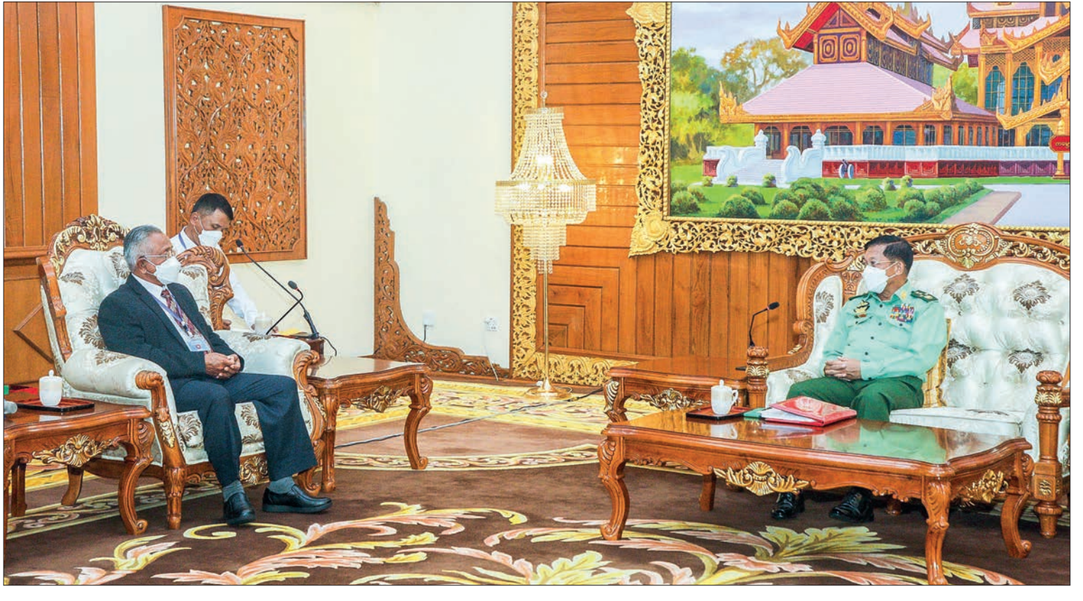
State Administration Council Chairman Commander-in-Chief of Defence Services Senior General Min Aung Hlaing receives U Lau Yaku, Vice-Chairman of the United Wa State Party (UWSP) in Nay Pyi Taw on 30 May 2022.

The Senior General explained that it is necessary to consider the requirements of the State, the needs of local ethnic nationals and the development of the region and the country as restoration of peace can reflect the smooth and swift region and nation-building tasks. Only when cooperation covers