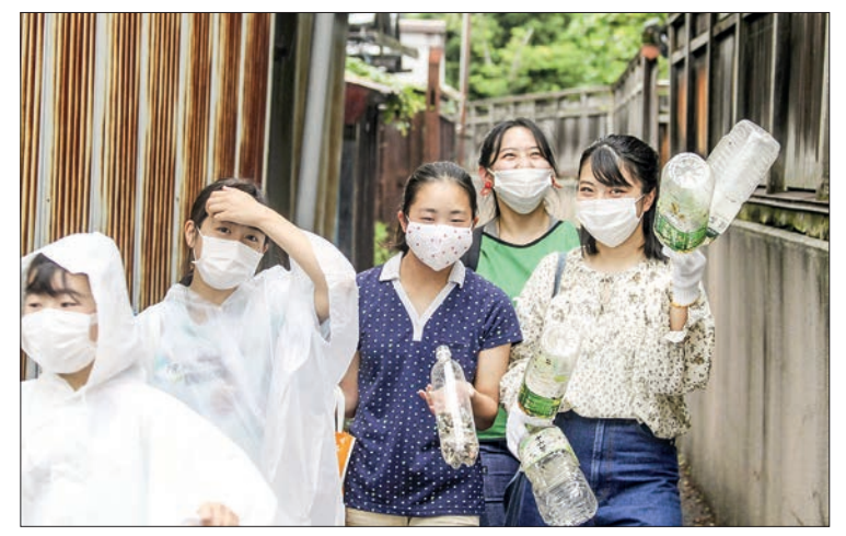
Supplied photo shows participants playing the trash picking game Seisochu in the city of Nagano in central Japan in July 2020.

Shocked by online images of beaches overflowing with garbage, Kitamura started to pick up trash on his own three years ago while a high school student and became excited when he found items from foreign countries washed up.