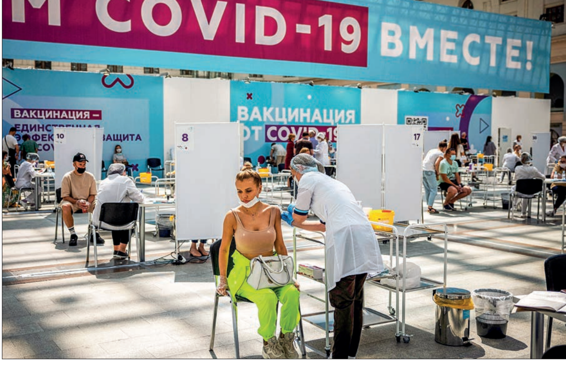
A woman receives a dose of Russia's Sputnik V Covid-19 vaccine at a vaccination centre at Gostiny Dvor in SOURCE: ANI Moscow, on 7 July 2021. PHOTO: DIMITAR DILKOFF / AFP

Light booster. Sputnik Light is a universal booster to other vaccines. Sputnik V has been authorized in 71 countries with a total population of over 4 billion people, and Sputnik Light in more than 30 countries.