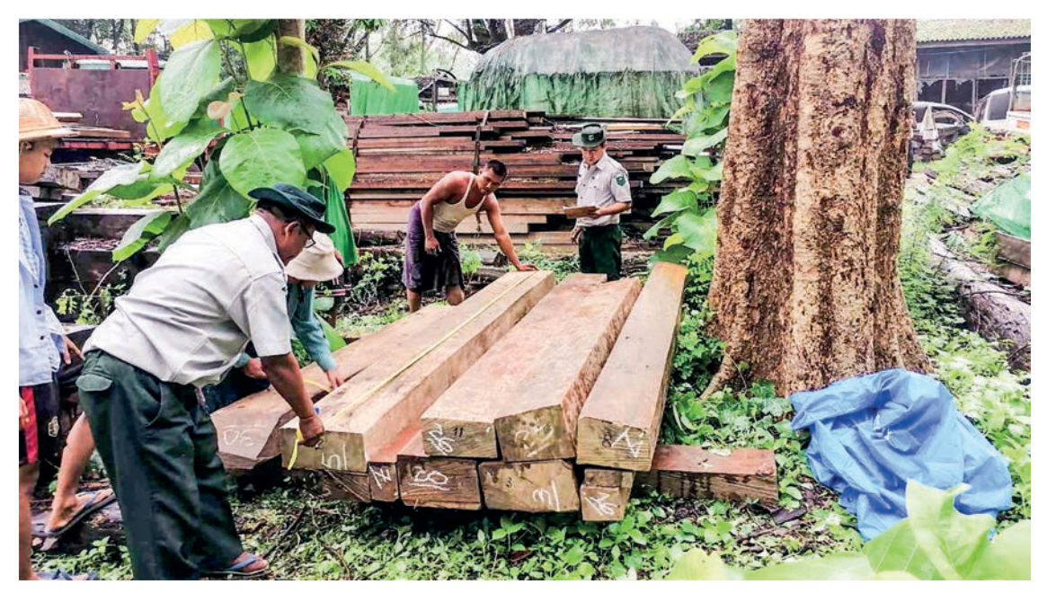
Officials confiscal illegal timbers.

SUPERVISED by the Anti-Illegal Trade Steering Committee,