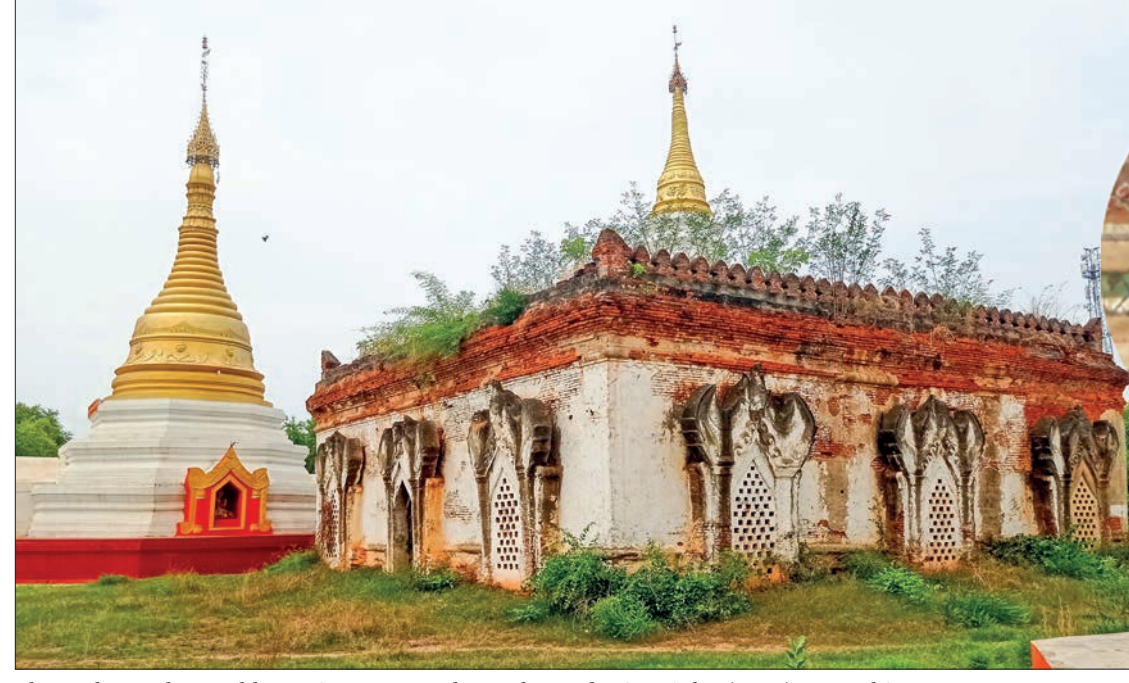
Photo shows the Koekhangyi Cave, pagodas and temples in Minbu (Sagu) Township.

KOEKHANGYI Cave (or) Watgyi Cave is located in the Hmankin Monastery in Minbu (Sagu) Township, Minbu District, Magway Region. The murals inside the cave, painted around 1,144 ME, are in ruins, historians say.