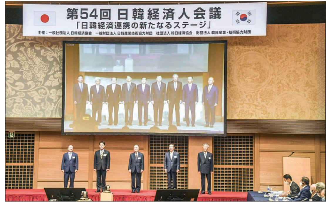
Photo taken 30 May 2022, in Tokyo shows Japanese business leaders and their South Korean counterparts

economy to stimulate the vitality of the industry.