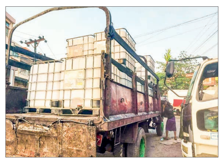
Palm oil in food grade tanks is loaded on the lorry.

Around 2000, the palm oil was directly imported using the iron barrel and with an In-Bulk system at the hull of edible oil vessels later and filled the oil tanks in Yangon. The current changes are made for the safety of consumers as the barrels of customers are not clean enough when they take out the oil from the oil tanks, the cooking oil merchants said.