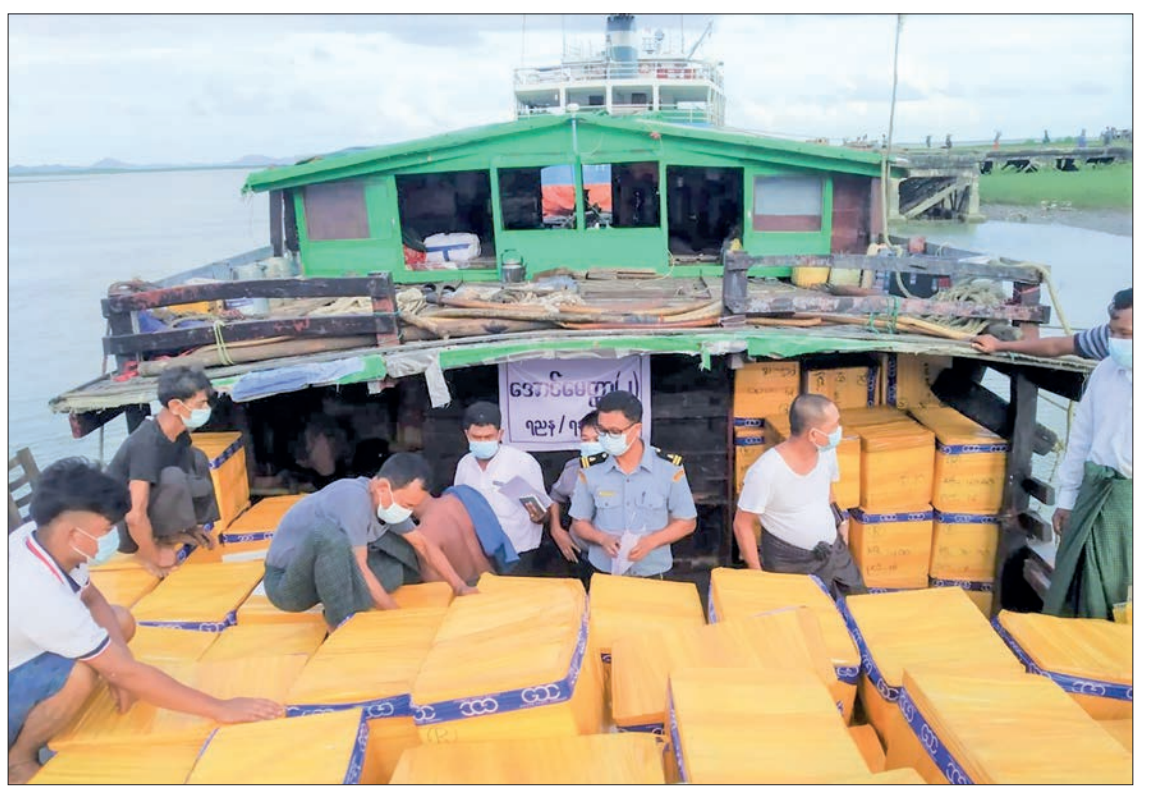
Fishery products are pictured prepared for exporting to Bangladesh via one border crossing.

"Those fish farmers working on a manageable scale convey the fish to Sittway and Maungtaw border areas by means of road