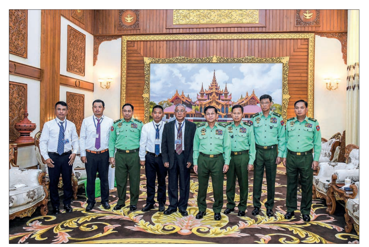
The Senior General and the UWSP delegation pose for the documentary photo yesterday.