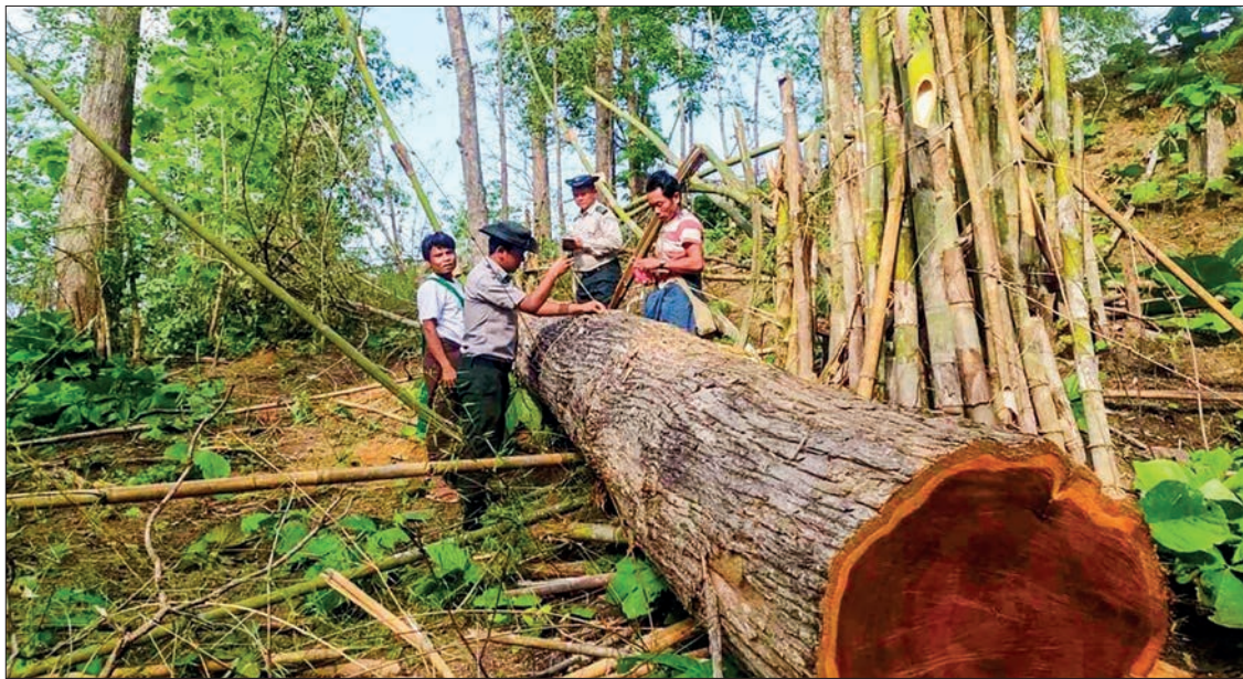
Officials confiscate illegal teak logs.