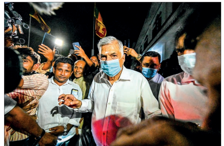
Sri Lanka's new prime minister Ranil Wickremesinghe (C) visits a Buddhist temple after his swearing in ceremony in Colombo on 12 May 2022.

the Sri Lanka Freedom Party (SLFP), said they will also offer conditional support to Wickremesinghe, overturning their earlier decision not to.