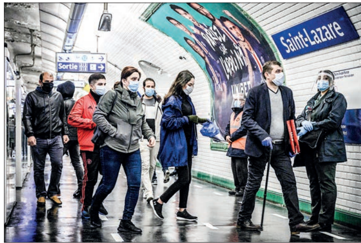
(FILES) In this file photo taken on 14 May 2020, commuters wearing facemasks walk at the Saint-Lazare platform of line 13 metro station in Paris during the ease of lockdown measures taken to curb the spread of the COVID-19.

FACE masks are no longer required in metros, trains and planes in France from Monday, as French authorities lifted one of the last remaining health measures imposed since the pandemic began in 2020.