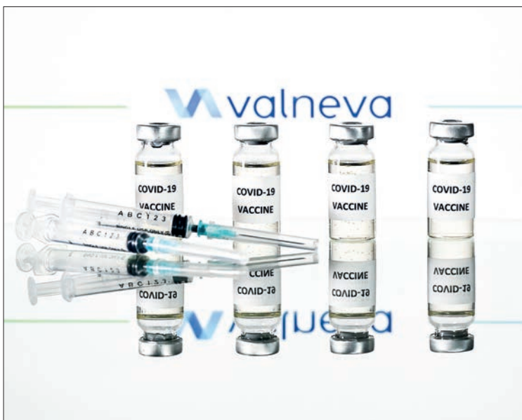
An illustration picture shows vials with Covid-19 Vaccine stickers attached and syringes with the logo of French-Austrian vaccine firm Valneva on 17 November 2020.

Valneva received further questions from the medicines agency last month and the company said it submitted responses on 2 May that "adequately" answers them.— AFP