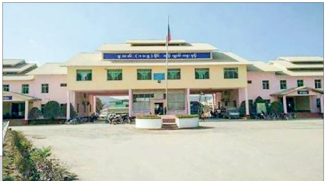
The Muse 105 th -Mile Trade Zone.

A total of 5,440 tonnes of sugarcane (2.448502 million yuan) has been exported within one month since the reopening of the Ruili- land border, a gateway to China. — TWA/GNLM