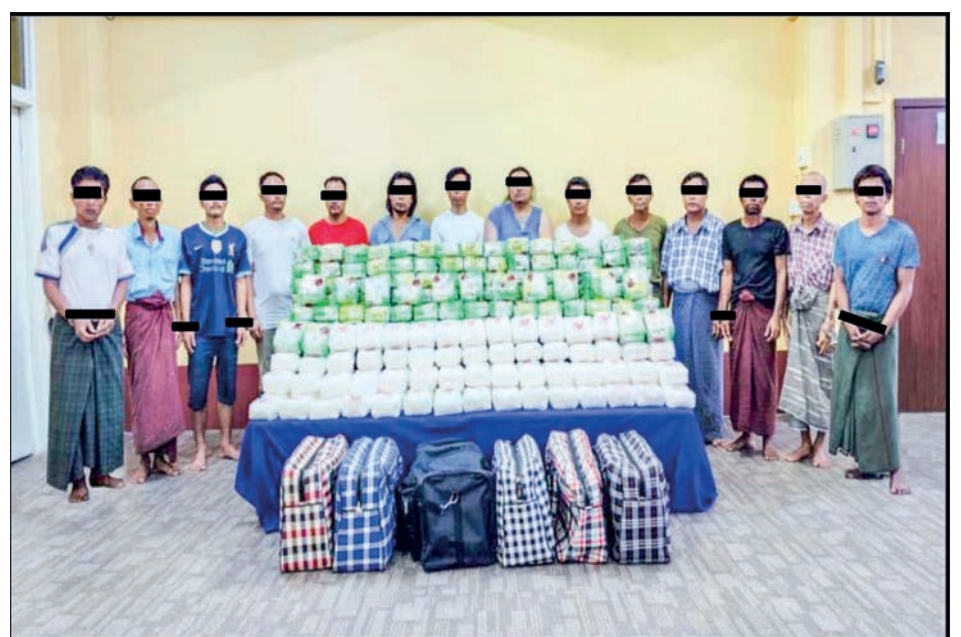
Fourteen arrestees are pictured along with seized packs of Ice methamphetamine that are to be transported to Malaysia.