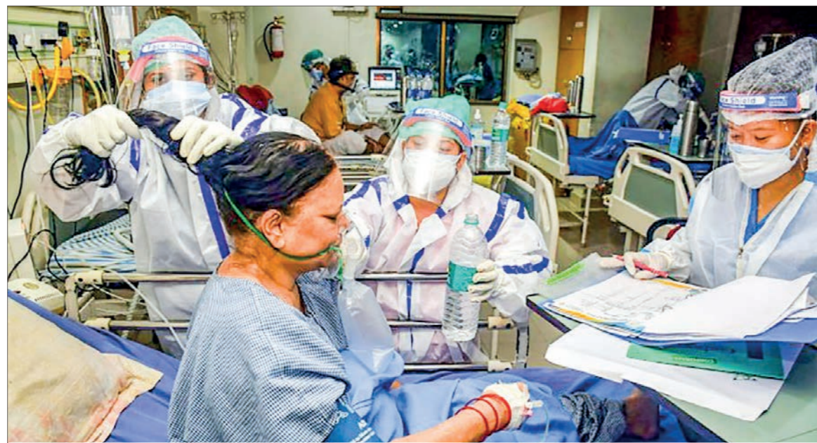
The study findings indicate that there is an urgent need to explore the pathogenesis of long COVID and develop effective interventions to reduce the risk of long COVID.

TWO years after getting infected with COVID-19, health outcomes of people who have suffered hospitalization, reported at least one symptom, said a follow-up study by The Lancet medical journal on Thursday. The Lancet Respiratory Medicine study said that evidence shows that a considerable proportion of people who have recovered from COVID-19 have long-term effects on multiple organs and systems. "Regardless of initial disease severity, COVID-19 survivors had longitudinal improvements in physical and mental health, with most returning to their original work within two years; however, the burden of symptomatic sequelae remained fairly high", stated The Lancet. It has also been found that COVID-19 survivors had a remarkably lower health status than the general population at two years. The study findings indicate that there is an urgent need to explore the pathogenesis of long COVID and develop effective interventions to reduce the risk of long COVID. "Future studies should further explore the pathogenesis of long COVID and develop effective intervention strategies to reduce the risk of long COVID," the Lancet said. According to a UK study published in The Lancet in April,