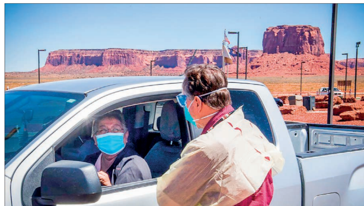
A doctor consults with a woman at a Covid-19 testing centre at the Navajo Nation town of Monument Valley in Arizona.

"COVID-19 remains a priority for the Navajo Nation as we