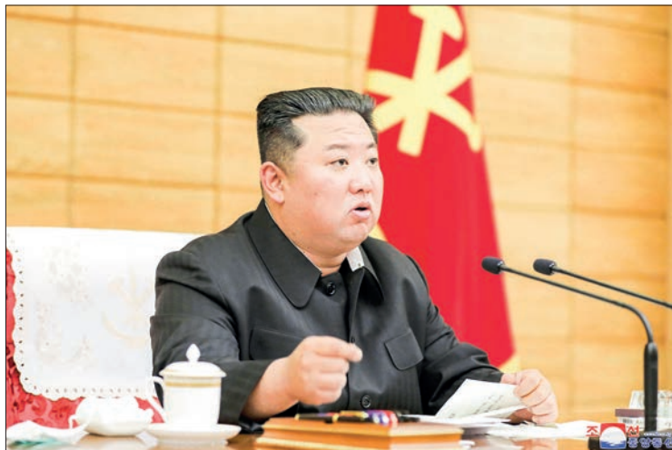
North Korean leader Kim Jong Un is pictured at an emergency meeting of the Politburo of the Central Committee of the Workers' Party of Korea on 15 May 2022.

To stabilize the supply of medicines in Pyongyang, Kim