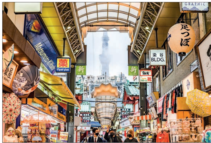
The Tokyo Skytree tower is seen as people walk along a shopping street near Sensoji Temple in Tokyo on 15 April 2022.

Surging energy and raw-material costs are threat-