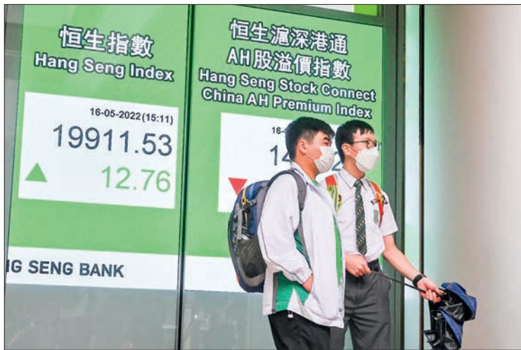
Students stand next to a sign showing the numbers for the Hang Seng Index before the close in Hong Kong on 16 May 2022.

ASIAN equities retreated Monday following last week's temporary rally on Wall Street due to fears of surging inflation and