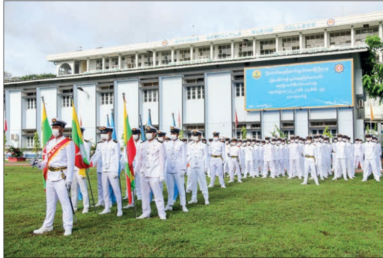
MoTC Union Minister Admiral Tin Aung San addresses the 13 th graduation event of Myanmar Mercantile Marine College in Yangon yesterday.

THE Myanmar Mercantile Marine (MMM) College held its 13 th graduation ceremony at the college parade ground in Yangon yesterday.