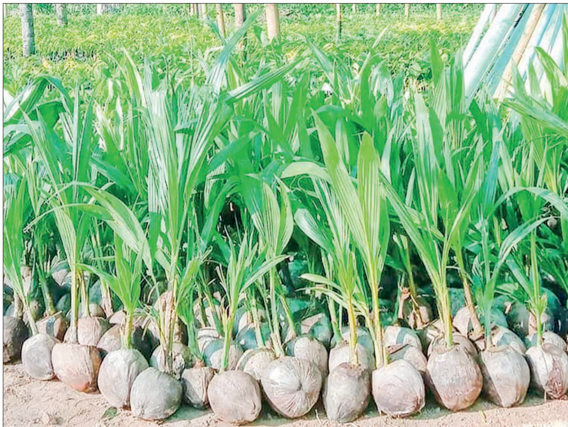
Five kinds of plants including dwarf coconut, pomelo, rambutan, areca palm and Shwehlanbo chilli pepper variety are cultivated with the use of the K10 million from the Naga Self-Administered Zone and border area development fund, aiming at exports to India.

“K10 million was allocated for the Naga SAZ and border area development last year. Dwarf coconut, pomelo and ram-