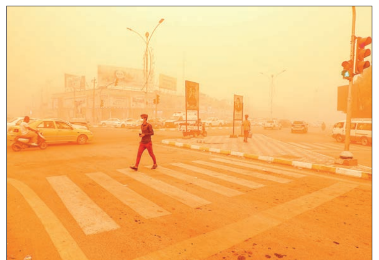
A pedestrian crosses a road in the city of Nasiriyah in Iraq's southern Dhi Qar province on 16 May 2022 amidst a heavy dust storm.

Authorities in seven of Iraq's 18 provinces, including Baghdad, ordered government offices to shut. Health units across the country remained open, however, as authorities warned that the most at risk were the elderly and people suffering from chronic respiratory diseases and heart ailments.— AFP