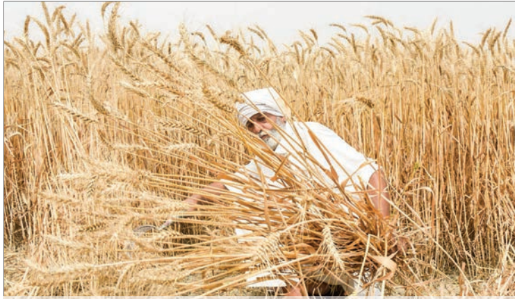
(FILES) In this file photograph taken on 12 April 2022, an Indian farmer poses as he harvests wheat crop in a field on the outskirts of Amritsar, in the northern Indian state of Punjab. Wheat prices surged to a record high on 16 May 2022, after India decided to ban exports of the commodity as a heatwave hit production.

WHEAT prices surged to a new record high on Monday after India decided to ban exports of the commodity as a heatwave hit production.