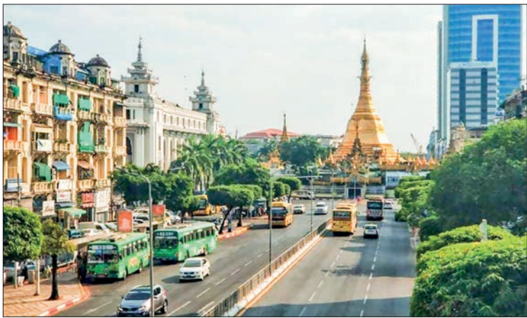
Yangon city centre.

ACTION is being taken against 60 undisciplined taxis and cars parked at bus stops in Yangon, according to the Yangon Region Transport Committee (YRTC).