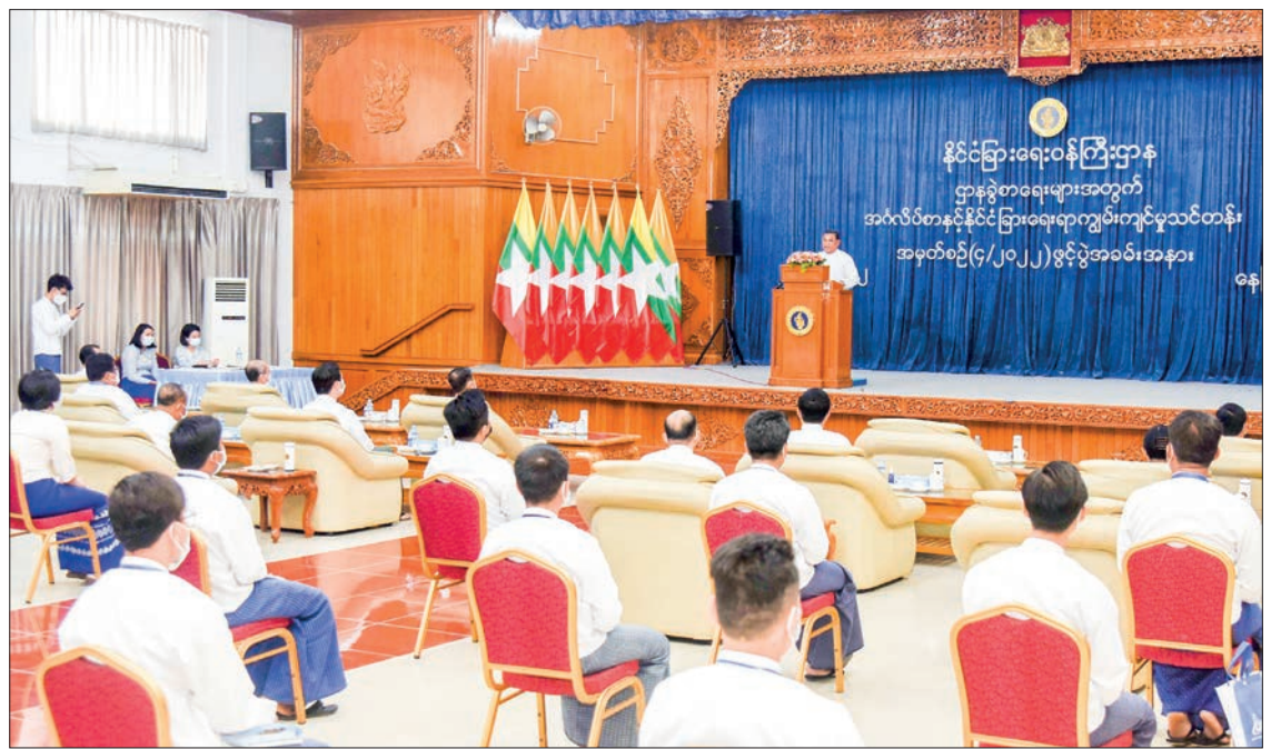
The Training Course for Attaché on English Proficiency and Foreign Service Skills 4/2022 in progress.

During the training course, it will be lectured by the Senior Diplomats, the Senior Officials from the respective departments of the Ministry of Foreign Affairs, the officials from the Ministry of Home Affairs, Ministry of Planning and Finance, Ministry of Information, Ministry of Culture and Religious Affairs, Ministry of Immigration and Population, Ministry of Commerce, Ministry of Information, Ministry of Hotels and Tourism, Office of Union Auditor-General, Union Civil Service