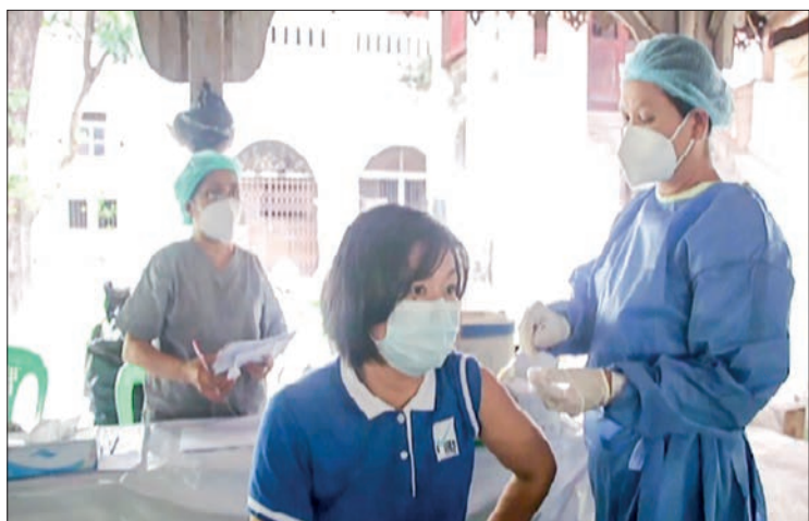
A local in Mon State gets COVID-19 vaccine shot.

DOCTORS and nurses from public hospitals, Tatmadaw medical teams, healthcare workers and volunteers are working hard to give COVID-19 vaccines in different states and regions as the vaccination programme is one of the most important activities in the prevention, control and treatment of COVID-19 disease.