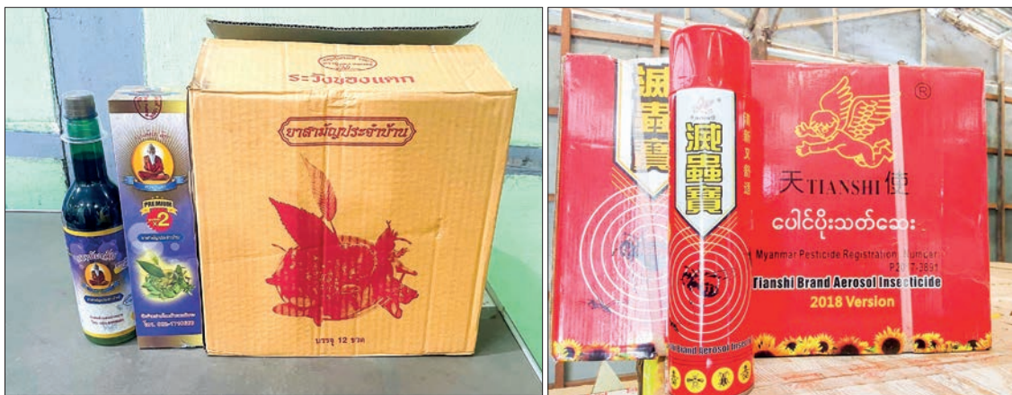
Seized illegal commodities.

Afterwards, on the same day, the Forest Department inspection team captured K262,800 worth of 1.7520 tonnes of illegal teak in Khaboung forest reserve in Ottwin Township, and the action was taken under the Forest Law.