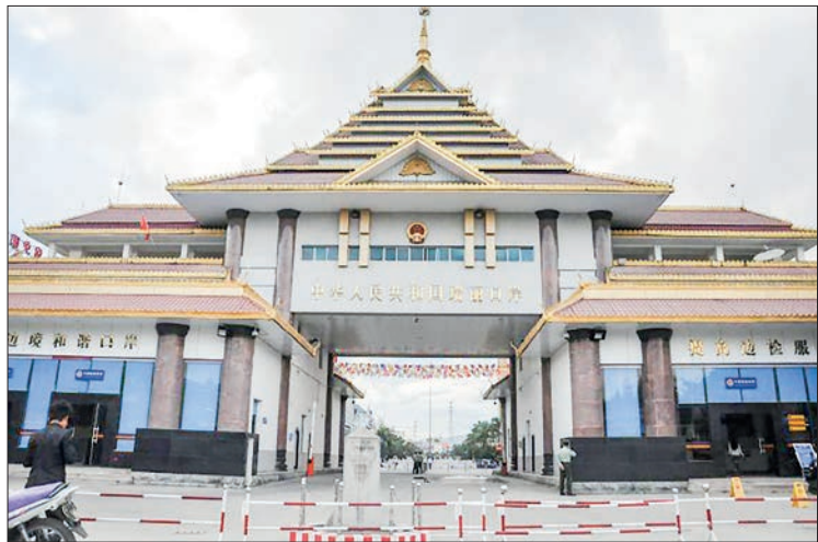
The Kyinsankyawt-Wang Ding border post.