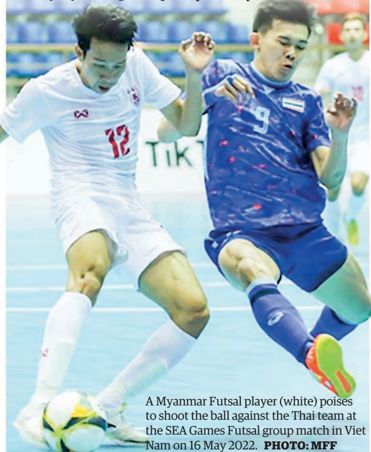
A Myanmar Futsal player (white) poised to shoot the ball against the Thai team at the SEA Games Futsal group match in Viet Nam on 16 May 2022.

Indonesia beat Malaysia 3-0 in an earlier group match yesterday. — GNLM