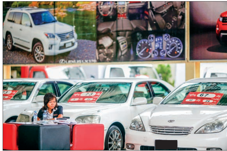
Myanmar imported capital goods such as auto parts, vehicles, machines and steel, with an estimated import value of $345.66 million between 1 April and 6 May 2022, which slightly declined from $399.9 million.

port groups saw an increase. Myanmar imported consumer products worth over $307.765 million, including pharmaceuticals, cosmetics, and palm oil.