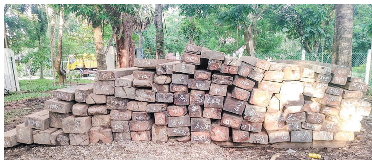
Seized illegal timbers in Mon State.

Therefore, from 10 to 12 May, seven arrests were made (an estimated value of K14,500,900), according to the Anti-Illegal Trade Steering Committee. — MNA