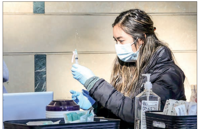
A healthcare worker wearing face mask prepares a dose of vaccine at a pop-up vaccination site in Los Angeles, California, the United States, 15 December 2021.

Pfizer and Moderna are developing redesigned vaccines that target the Omicron variant's mutations to boost protection against infection. As the virus has evolved over the past two years, the current shots have become less effective at preventing mild illness, though they generally still protect against severe disease.