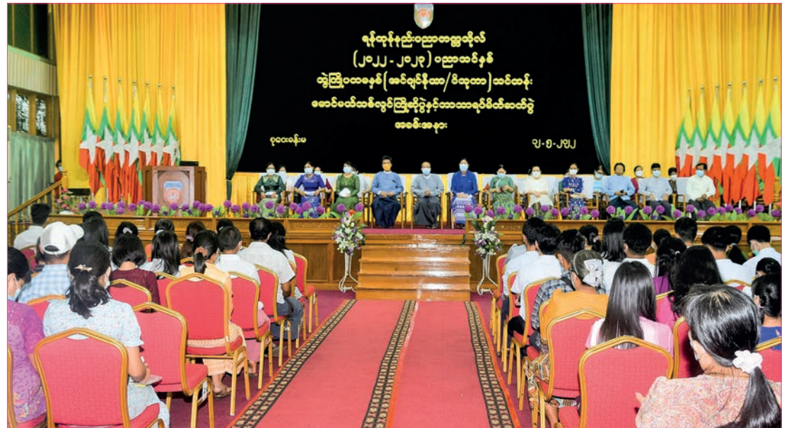
Fresher welcome and orientation ceremony are underway at the Yangon Technological University.

FRESHER welcome and subject orientation ceremonies were held respectively yesterday at 60 technological and computer universities under the Department of Advanced Science and Technology (DAST) of the Ministry of Science and Technology.