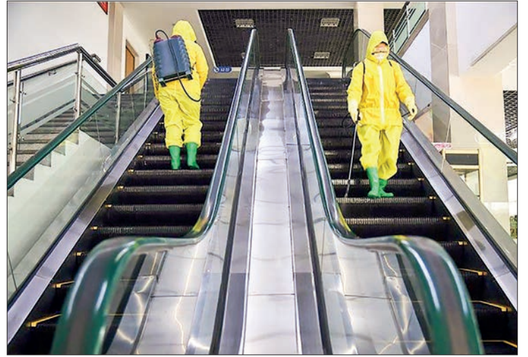
Employees spray disinfectant as part of preventative measures against the Covid-19 coronavirus at the Pyongyang Children's Department Store in Pyongyang on 18 March 2022.

North Korea had not confirmed a single case of coronavirus until Thursday.—AFP