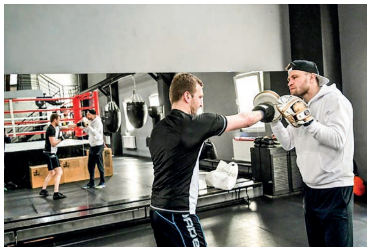
An amateur boxer trains at the All Stars Boxing Club in the Ukrainian capital of Kyiv on Tuesday. PHOTO: AFP

For the past two decades, Ukraine has maintained a dominant presence in the boxing world, with their fighters gaining a reputation for speed, movement, and fighting IQ -- skills that also appear to have been adopted on the battlefield.—AFP