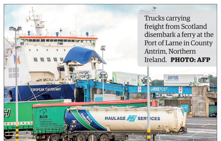
Trucks carrying freight from Scotland disembark a ferry at the Port of Larne in County Antrim, Northern Ireland. PHOTO: AFP

In the latest threat to take unilateral steps to address the “very serious” situation, he added his government “would take action to protect peace and political stability in Northern Ireland if solutions could not be found”.—AFP