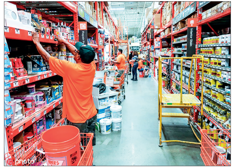
Workers stock the shelves at a Home Depot store in Passaic, New Jersey, the United States, 14 August 2018.

statements by Deputy National Security Adviser Daleep Singh and Treasury Secretary Janet Yellen, who spoke about potential easing of tariffs on Chinese goods in late April. Such voices came as the United States is experiencing the highest inflation in four decades. The March consumer price index (CPI) surged 8.5 per cent from a year earlier, the largest 12-month increase since the period ending December 1981, according to data from the US Labour Department. The April CPI, set to be released on Wednesday, is expected to remain elevated.—AFP