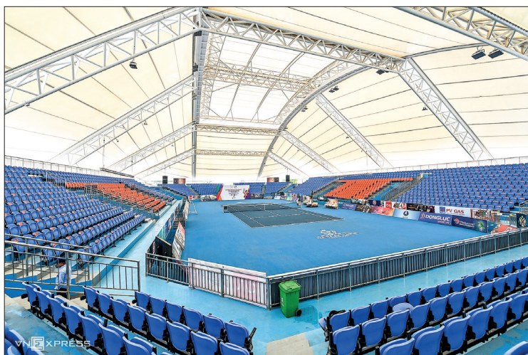
The main court has a capacity of 3,000, a floor area of 4,348 square meters and a height of 22.34 meters.

The 3,000-seat main tennis court covers a floor area of 4,348 sq.m and has a height of