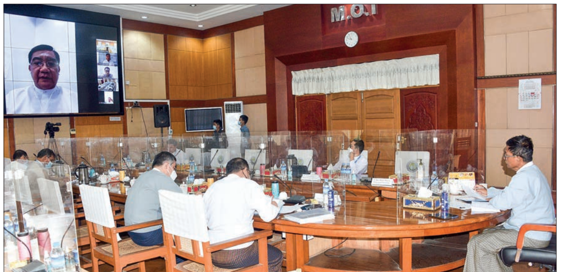
The Broadcasting Governing Body-BGB meeting 3/2022 underway online.

to be careful of broadcasting companies that are working together with the MRTV not to broadcast in a way that could endanger the stability and security of the country, to abide by the existing laws, terms of the partnership agreement with the department, and with media ethics, to include the dissemination of information and programmes that will benefit the country and the people, including the peace process being carried out by the State, to broadcast real news in time and to eliminate