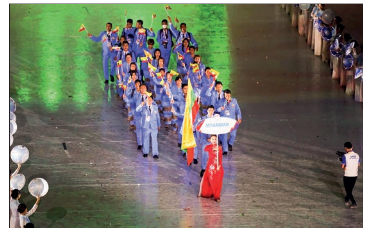
Myanmar sport team enters the SEA Games Opening Ceremony at the My Dinh Stadium in Hanoi, Viet Nam on 12 May 2022.

The competition includes 40 sports and a total of 526 gold medals will be awarded. The Myanmar sports team have win one gold, one silver and one bronze medal at the tourney.