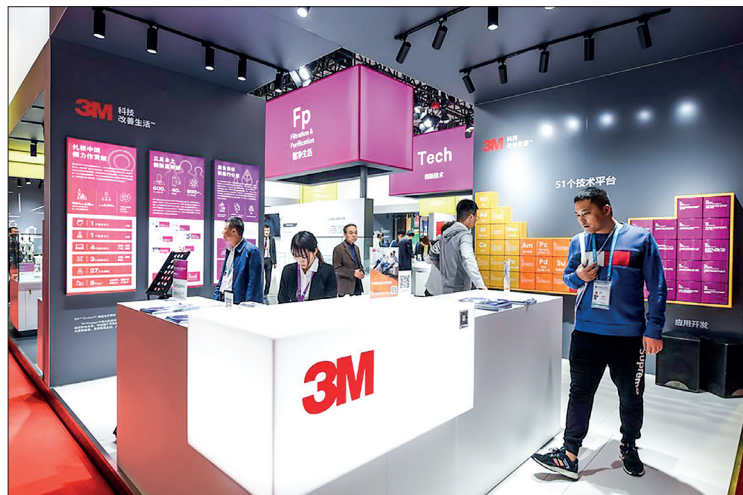
People visit the 3M booth during the second China International Import Expo (CIIE) in Shanghai, east China, on 7 Nov 2019.

ference held on 5 May, over 70 per cent of Shanghai's 1,800-plus major enterprises had resumed work and production as the city's epidemic situation eased.