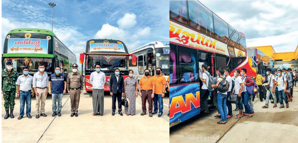
Myanmar migrant workers are seen systematically migrating to work in Thailand.

Myanmar workers working in Thailand through illegal brokers, but not through legal foreign