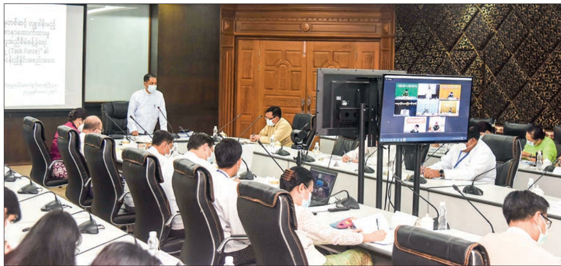
THE 8 th Coordination Meeting of the Task Force to facilitate the provision of Humanitarian Assistance to Myanmar through the AHA Centre was held at 10:00 am on 12 May 2022