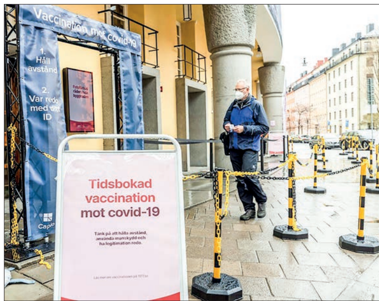
A man walks into a COVID-19 vaccination centre in Stockholm, capital of Sweden, on 6 May 2021.

million US dollars) for the period November 2021-January 2022. Compared with the same period in 2019 — before the pandemic struck — total revenues were down 42 per cent. SAS, therefore, announced it would "aggressively pursue reducing costs" by 7.5 billion Swedish crowns annually, by adjusting its fleet and product offerings, among other things. (1 US dollar = 10.06 Swedish crowns)—Xinhua