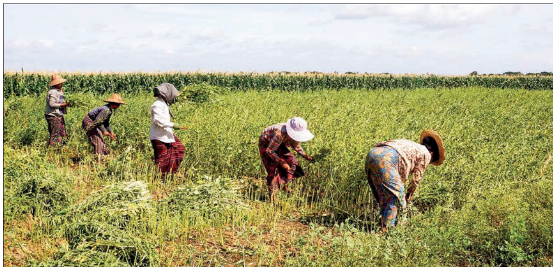
Farm workers seen picking up the sesame.

THE market of black sesame seeds is seemingly inactive as the prevailing market price is not profitable for the traders, said traders from Mandalay.