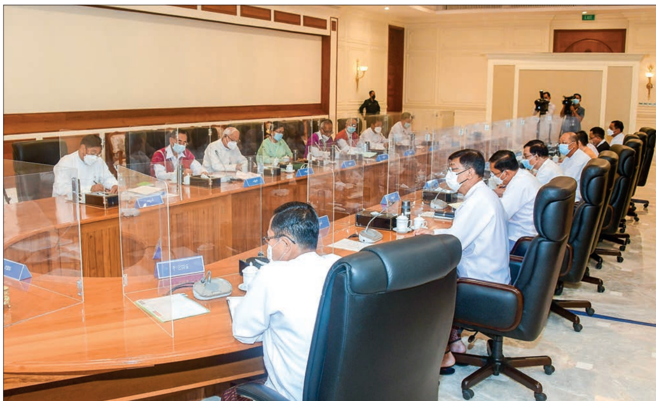
State Administration Council Chairman Prime Minister Senior General Min Aung Hlaing addresses the State Administration Council meeting 4/2022 in Nay Pyi Taw on 12 May 2022.

B OTH sides' coordination should not disorder the essence of democracy and should emphasize the creation of chances for them, said Chairman of the State Administration Council Prime Minister Senior General Min Aung Hlaing at the SAC meeting 4/2022 at the SAC Chairman Office in Nay Pyi Taw yesterday afternoon.