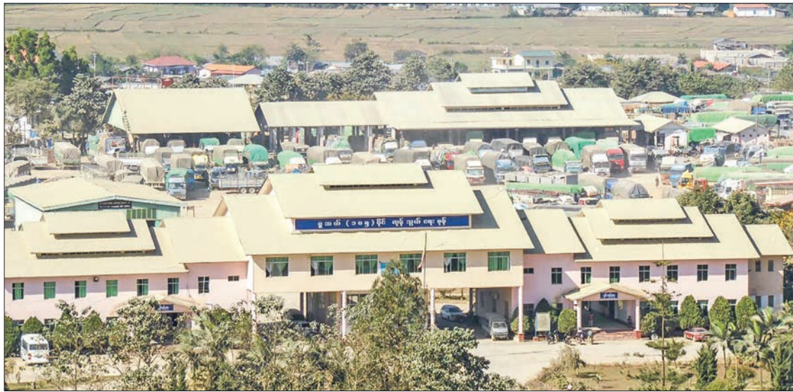
China shut down all the checkpoints linking to a major border post Muse amidst the COVID-19 pandemic. Of the checkpoints, Kyinsankyawt has resumed trading activity from 26 November on a trial run.

Last month, border trade values amounted to $100.9 million through Muse border, $17.424 million via Lweje, $5.3 million via Chinshwehaw, $16.259 million via Kampai-