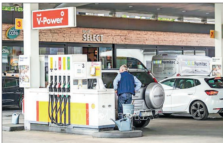
A man fuels a vehicle at a gas station in Berlin, capital of Germany, on 11 May 2022. Germany’s inflation rate in April rose to 7.4 per cent amid soaring energy prices, according to confirmed figures published by the Federal Statistical Office (Destatis) on Wednesday.

GERMANY’S inflation rate in April rose to 7.4 per cent amid soaring energy prices, according to confirmed figures published by the Federal Statistical Office