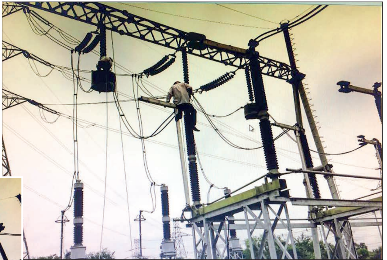
Repair work underway at the substation in Hlinethaya.

In addition, the Yangon City Development Committee performed the cutting and clearing of branches adjacent to the 33kV power line provided by the Department of Engineering (Water and Sanitation) to the Lagunbyin