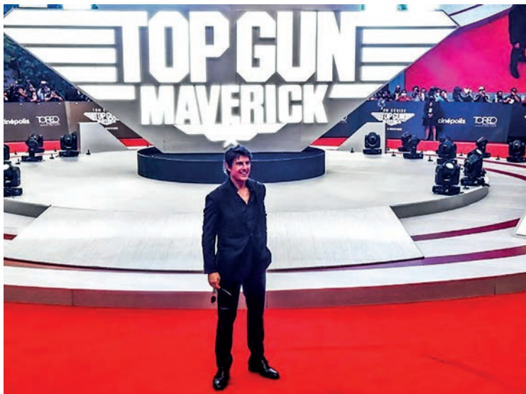
Tom Cruise will appear at Cannes for the first time in 30 years.