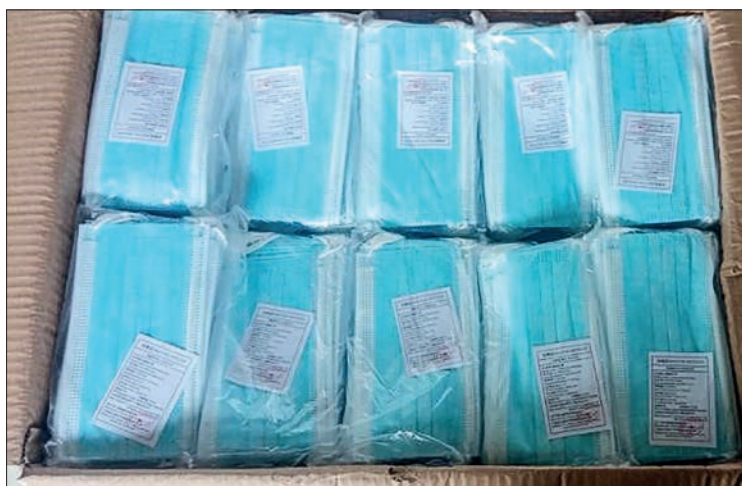
Imported anti-Covid items.

THE Ministry of Commerce oversees the importation of necessary medical supplies and anti-COVID-19 devices critical