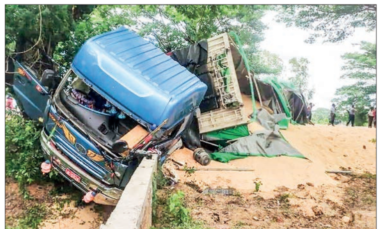
against the driver under Articles 338/337 of the Penal Code, it is reported. — TWA/GNLM