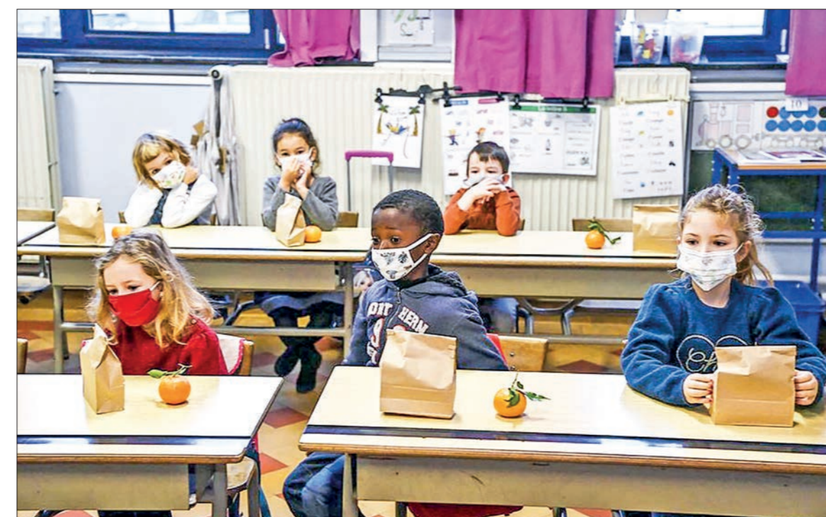
The WHO was first informed on 5 April of 10 unexplained hepatitis cases in Scotland, detected in children under the age of 10.

Further testing in the past week confirmed that around 70 per cent of the cases tested posi-