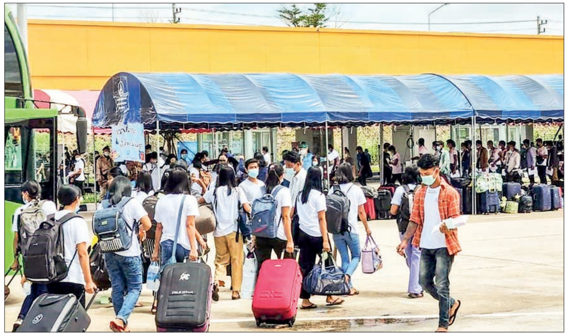
The second batch of Myanmar migrant workers arrives in Thailand.