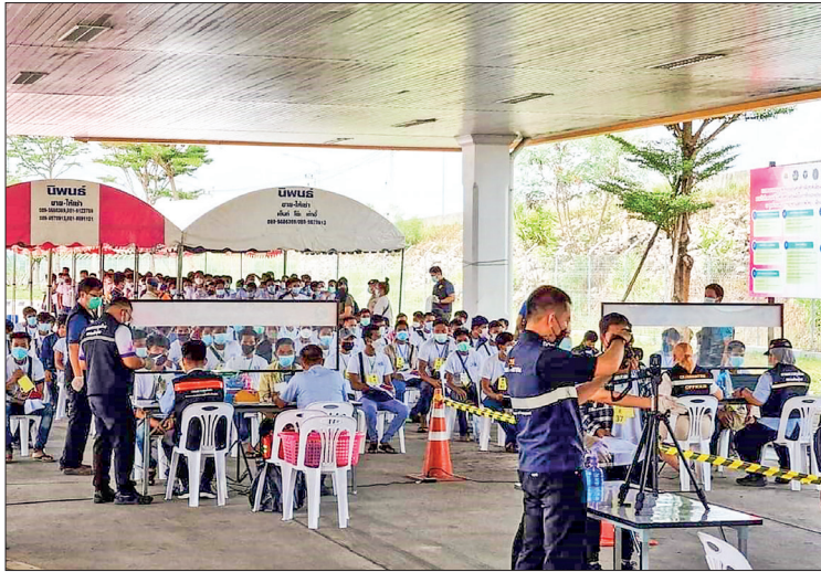
Myanmar migrant workers seen undergoing medical checks in Thailand.

If the workers are tested positive for COVID-19, the officials put them under quarantine, grant a Work Permit (Border 40), a two-year stay visa and arrange to send them