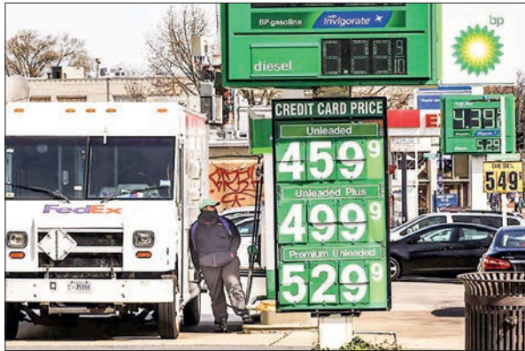
Surging petrol prices made up half of the March increase in US consumer inflation.

US gas prices reached a record high Tuesday, as President Joe Biden said fighting inflation is his top domestic priority.