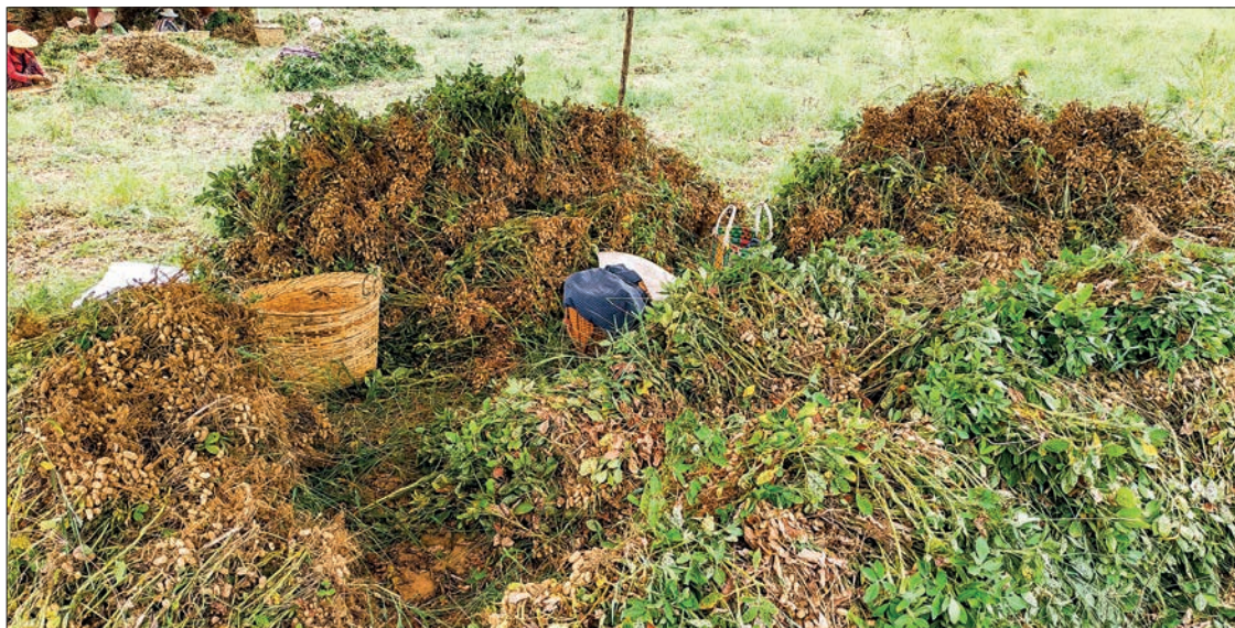
The export ban over peanut and sesame except black sesame was effective starting from 9 May 2022.

The slowdown of businesses from the consequences of the COVID-19, palm oil export ban by the leading exporting country Indonesia, a drop in the sunflower oil export because of the escalating Russia-Ukraine crisis and international edible oil market conditions negatively affected the edible oil market. As a result