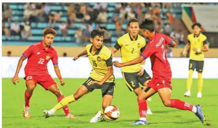
Malaysia team (yellow) vie for the ball against the Laos team players during their SEA Games men's football group match held in Viet Nam on 11 May 2022.

THE 31 st SEA Games men's and women's group matches continued on 11 May with Singapore and Malaysia team's victories.