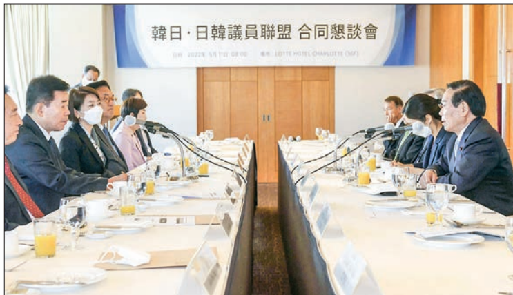
Members of a cross-party group of Japanese lawmakers (R) and their South Korean counterparts meet in Seoul on 11 May 2022.

LAWMAKERS from Japan and South Korea pledged Wednesday to turn the two nation's frayed ties positive, after South Korean President Yoon Suk Yeol took office.