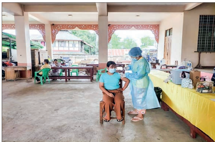
A local in Shan State (North) gets COVID-19 vaccine shot.

DOCTORS and nurses from public hospitals, Tatmadaw medical teams, healthcare workers and volunteers are working hard to give COVID-19 vaccines in different states and regions as the vaccination programme is one of the most important activities in the prevention, control and treatment of COVID-19 disease.