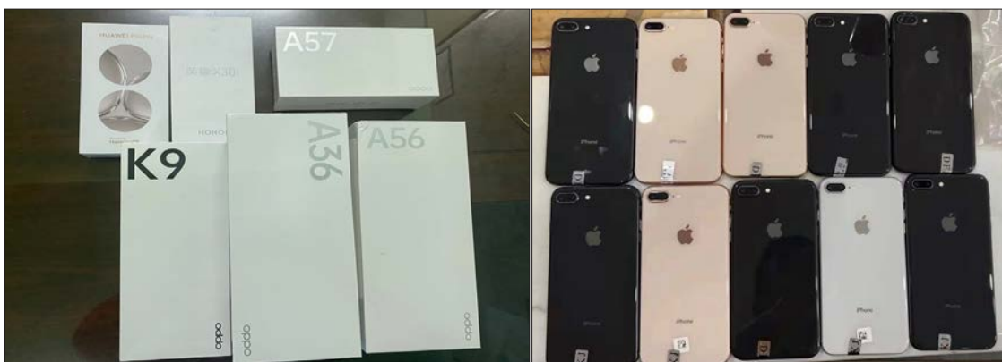
Seized illegal cell phones in Shan State.

SUPERVISED by the Anti-Illegal Trade Steering Committee, effective action is being taken to prevent illegal trade under the law.