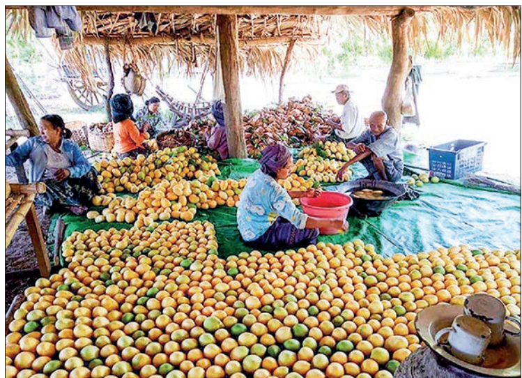
Farm workers are pictured sorting out the mangoes.

MYANMAR'S mango growers had better focus on quality control in order to maintain market share, in China said U Kyaw Soe Naing, general secretary of the