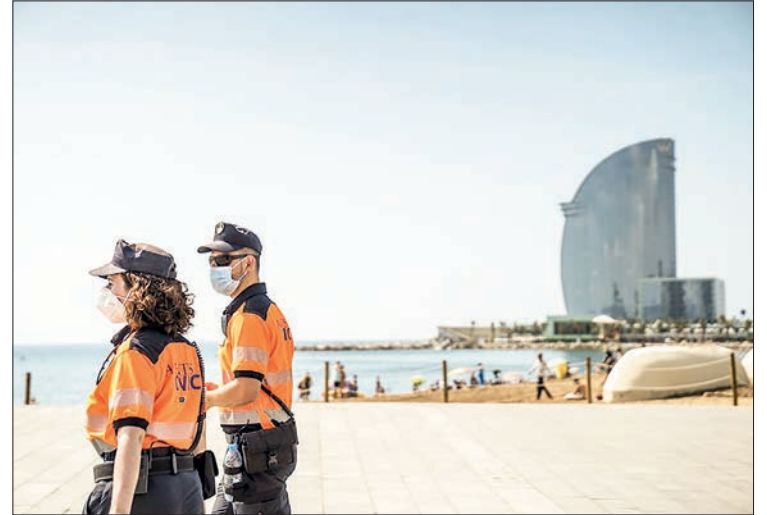
Community workers patrol near a beach in Barcelona, Spain, 27 July 2020.

financial system that improves access for developing countries so they can invest in their people, rather than servicing their debt; through climate commitments that match the scale of the crisis and bold support for developing countries to leave fossil fuels behind and develop truly green and resilient economies; through supporting peace, advancing human rights and working for an end to all wars that scar our world and block progress for all; and through a renewed commitment to multilateralism, and gathering in solidarity around shared solutions.”—Xinhua