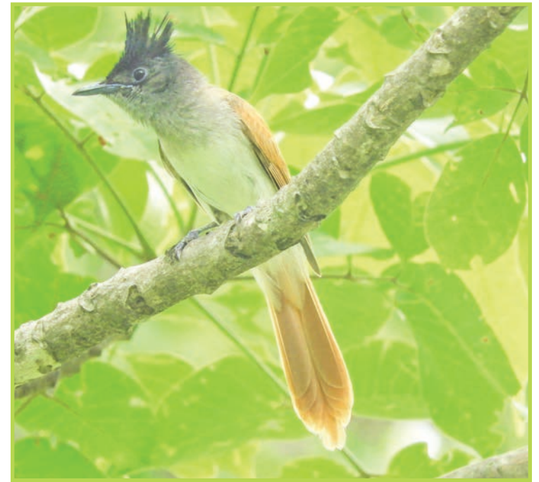
Asian Paradise Flycatcher

As the bird species are warm-blooded animals, the incubation period is June to August. Some birds undergo colour changes in the breeding season. Bird species play a pivotal role in the valuable ecosystem and they defend