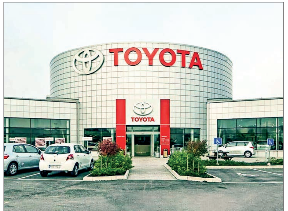
The Japanese auto giant, which kept its crown as the world’s top-selling carmaker in 2021, reported a net profit of 2.85 trillion yen ($22 billion), up 26.9 per cent from the previous year.

was suspending production at its eight domestic plants for six days due to impact from China’s tough Covid measures — particularly in economic engine Shanghai which has been under lockdown since April.—AFP