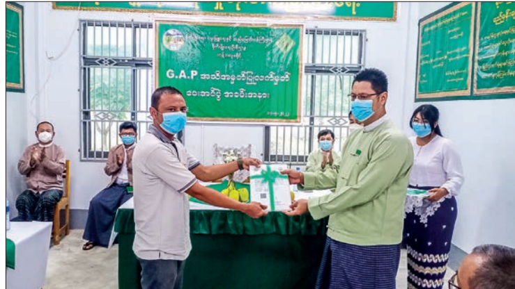
The GAP certificates handover event is underway.

KANBALU District Agriculture Department held a handover ceremony of the Good Agricultural Practices certificate for mango and dragon fruit on 11 May 2022.