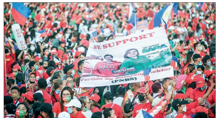
Outgoing Philippine President Rodrigo Duterte could face international charges over his deadly drug war, but his daughter's thumping victory in the vice-presidential race shows his popularity remains sky-high.

That popularity has rubbed off on his daughter, who supporters see as a safe pair of hands to continue his legacy—and protect him from potential criminal charges in the Philippines or abroad when he leaves office.—AFP