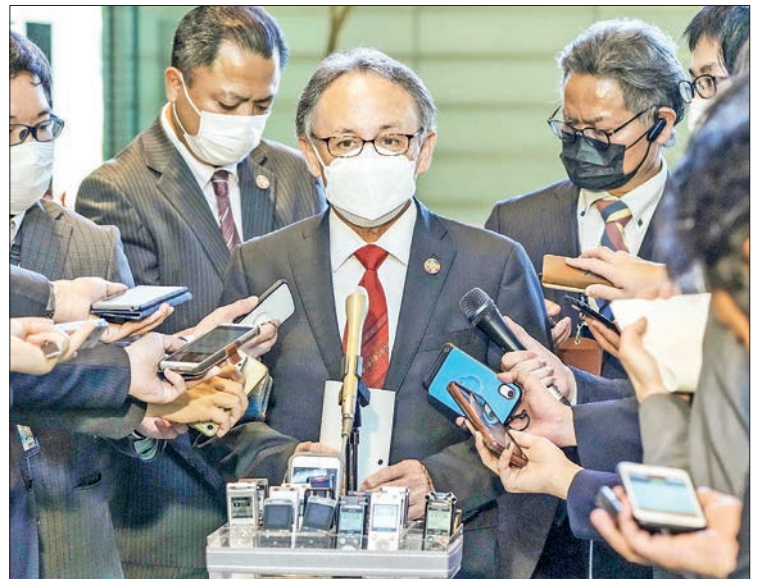
Okinawa Gov. Denny Tamaki speaks to reporters in Tokyo on 10 May 2022.

But their meeting only lasted about 15 minutes, signalling the central government's unenthusiastic response to Tamaki, known as a staunch opponent of the relocation plan.— Kyodo