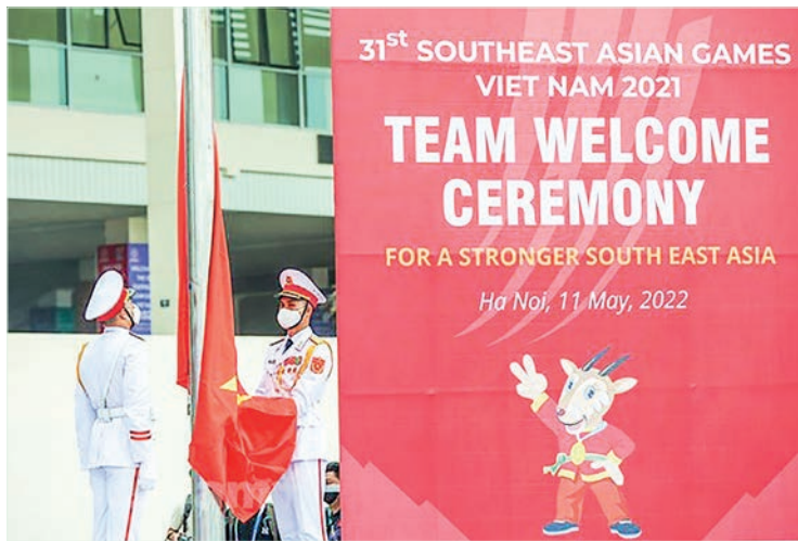
The team welcome ceremony is held on 11 May.

According to the organizers, SEA Games 31 is a bridge of friendship that fosters unity among regional countries against the backdrop of COVID-19 global crisis. It provides a chance for the countries to share, motivate each other and together surmount challenges in multiple areas.