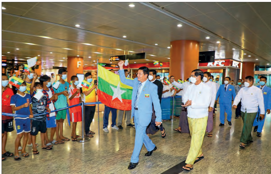
Myanmar national sports team led by MoSYA Union Minister U Min Thein Zan leave for Viet Nam yesterday.

UNION Minister for Sports and Youth Affairs and Chairperson of the Myanmar Olympic Committee U Min Thein Zan accompanied by the Myanmar Sports contingent led by Director-General of the Sports and Physical Education Department U Tun Myint left for Hanoi, Viet Nam from Yangon International Airport yesterday to attend the 31 st South East Asian (SEA Games).