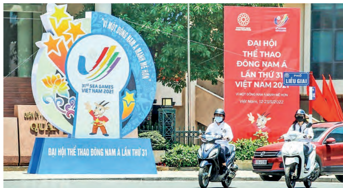
SEA Games 31 offers chance to promote Vietnam's image to regional sport fans. Signboards welcome SEA Games 31 in Hanoi.