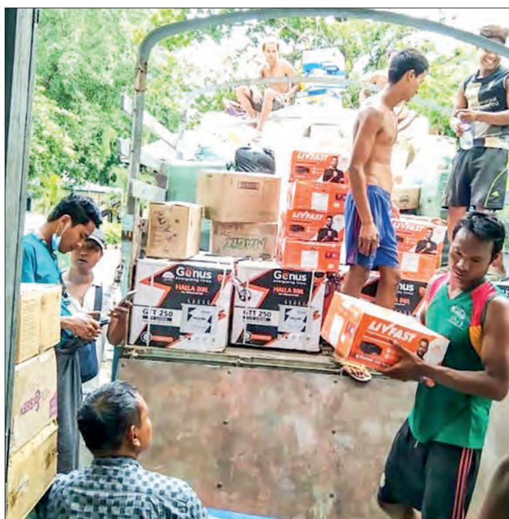
Seized commodities in Sagaing Region.

On 7 May, an inspection team led by the Department of Forest seized 1.5716 tonnes of illegal timbers in Hlegu Township. An Isuzu vehicle carrying these timbers (estimated at K25,000,000) and a total value of K40,888,000 were seized. The action was taken under the Forest Law.