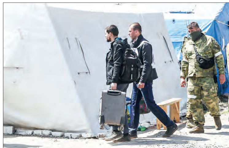
People evacuated from the Azovstal plant and adjacent houses in Mariupol arrive at a temporary accommodation center in the village of Bezimenne in Donetsk, 1 May 2022.

For her part, Andersson tweeted that she expressed steadfast support for Ukraine during the phone call with Zelensky. — Xinhua