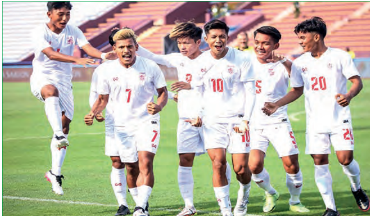
Myanmar players celebrate the victory after beating the Philippines 3-2 in the second Group A match played at the Viet Tri Stadium in Hanoi, Viet Nam on 10 May 2022.

Next the Philippines won 2-1 after a penalty kick was awarded