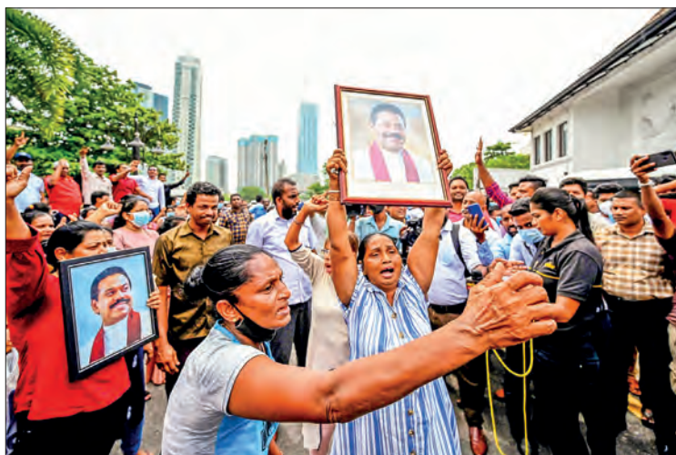
Pro-government supporters hold the portrait of outgoing Prime Minister Mahinda Rajapaksa during a protest outside his residence in Colombo. PHOTO: ISHARA S KODIKARA/AFP

The emergency order from President Gotabaya Rajapaksa, the outgoing premier's younger brother, gave sweeping powers to the military as protests demanding the duo's resignation escalated over the country's worst-ever economic crisis.—AFP