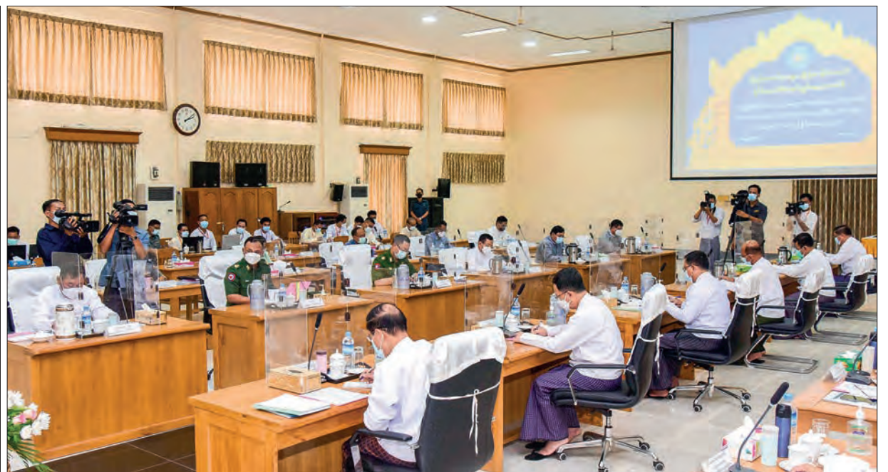
State Administration Council Vice-Chair Deputy Prime Minister Vice-Senior General Soe Win presides over the coordination meeting to organize water-pouring ceremony at banyan trees.

THE United Nations General Assembly decided its resolution 54/115 to designate the full moon day as the International Vesak day or Visākha day, said the Chairman of the Leading Committee for organizing the 14 th ceremony of pouring water at banyan trees on the full moon day of Kason Vice-Chairman of the State Administration Council Deputy Prime Minister Vice-Senior General Soe Win at the coordination meeting between the leading committee and the working committee yesterday afternoon.