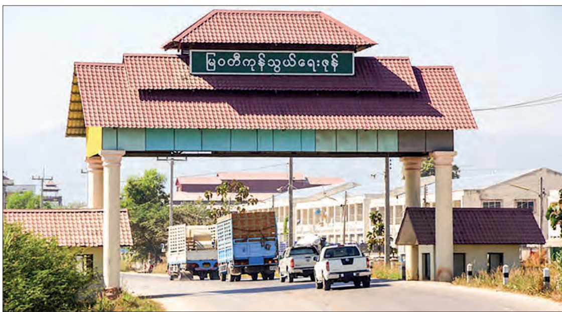
The Myawady Trade Zone.

There are seven border posts between Myanmar and Thailand through Tachilek,