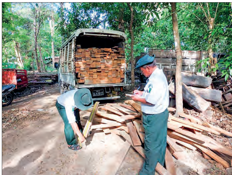
Confiscated timbers in Yangon Region.

A combined team led by the Criminal Investigation Department No. 6 and the Department of Forest seized 1.3884 tonnes of illegal teak (estimated at K416,520) and a Toyota Wish car an estimated value of K15,000,000 in total were seized in Mingaladon Township, Yangon North District on 6 May.