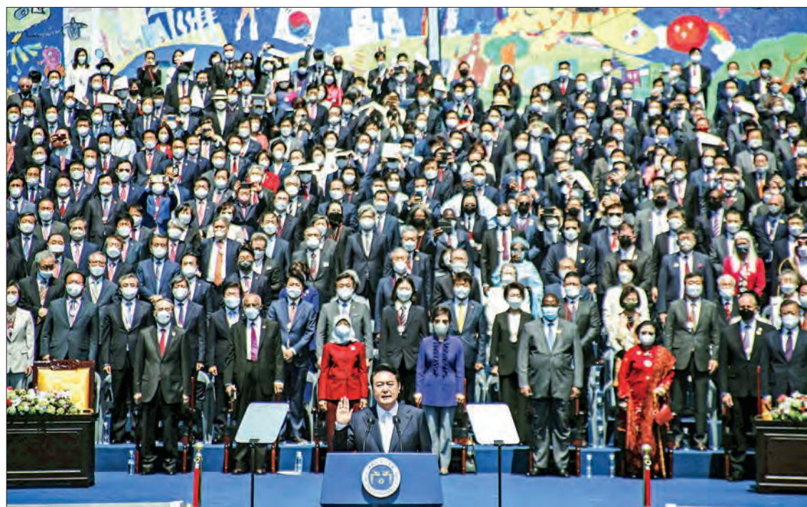
South Korean President Yoon Suk Yeol takes an oath during his inauguration ceremony in Seoul on 10 May 2022.

Among the foreign guests attending the ceremony were US second gentleman Douglas