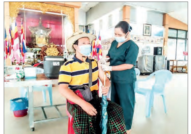
A local in Yankin Township, Yangon gets COVID-19 vaccine shot.

It is reported that officials from the respective Military Commands visited the site and coordinated the necessary work. — MNA