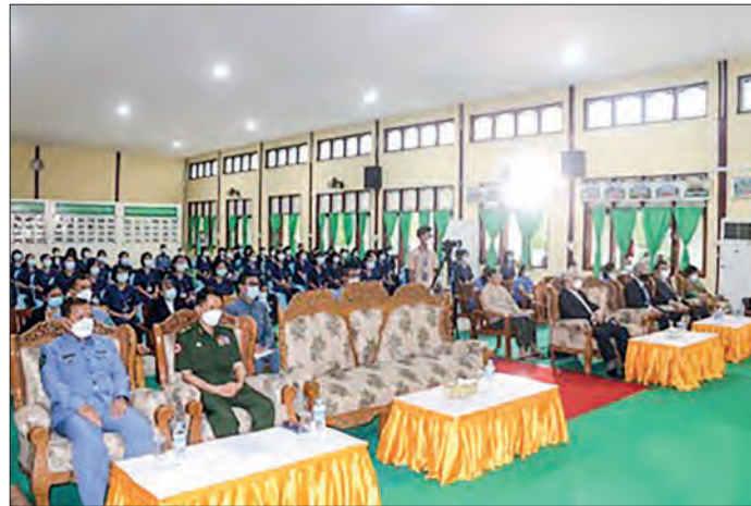
MoBA Union Minister Lt-Gen Tun Tun Naung attends the Elderly Care (Nursing Internship) Training I in Yangon yesterday.