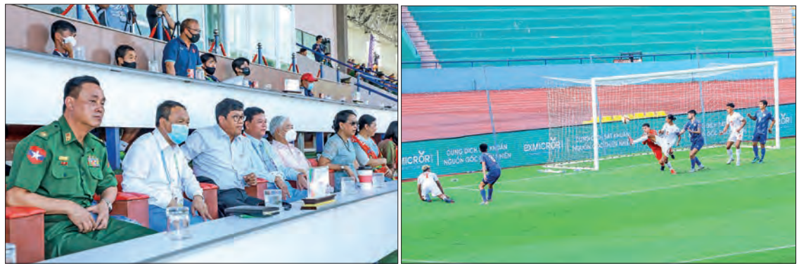
The MoSYA Union Minister and party are pictured watching Myanmar versus the Philippines match.