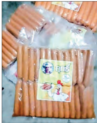
The FDA-banned foodstuffs.