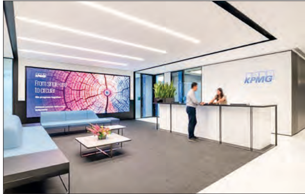
The "Big Four" accountancy firms — KPMG, Deloitte, EY and PwC — were among western multinationals placing adverts.

Lee, 64, a former security chief who oversaw the crackdown on Hong Kong's democracy movement, was anointed the business hub's new leader on Sunday in a near-unanimous vote by a small committee of Beijing