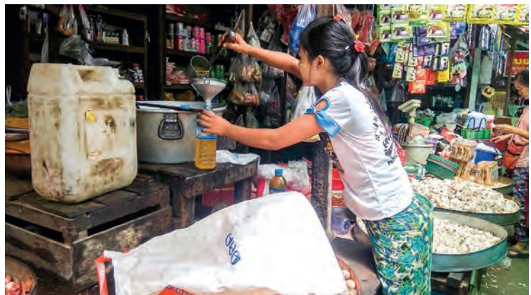
The reference rate in the Yangon market for a week from 2 to 8 May was set at K6,025 per viss.

THE Supervisory Committee on edible oil import and distribution under the Ministry of Commerce set a weekly reference rate at K6,025 per viss (a viss equals 1.6 kilogrammes) following the price stabilities in the world's palm oil-producing countries, according to the committee.