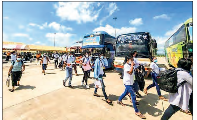
Myanmar migrant workers under the MoU system arrive in Thailand.

Those 287 MoU workers who will work at the Panus Poultry Group Co. Ltd. have signed the employment contract in March. Others who have signed contracts will also be sent separately in batches.