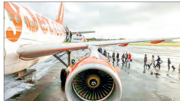
EasyJet plans to remove seats from Airbus aircraft this summer, allowing the British airline to fly with fewer cabin crew as it struggles with Covid absences and staff recruitment.

stead of four, under regulations imposed by the Civil Aviation Authority watch-