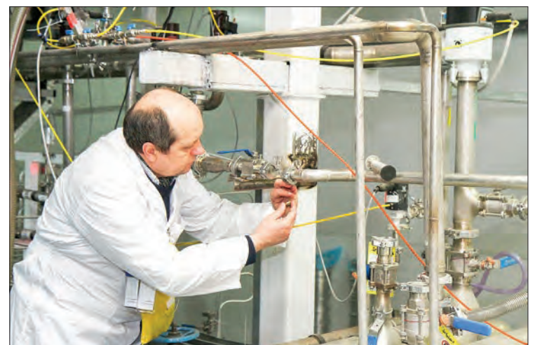
An unidentified International Atomic Energy Agency (IAEA) inspector disconnects the connections between the twin cascades for 20 per cent uranium production at nuclear research centre of Natanz, some 300 kilometres south of Tehran on 20 January 2014 as Iran halted production of 20 per cent enriched uranium, marking the coming into force of an interim deal with world powers on its disputed nuclear programme.

Adversaries for decades, Iran and the US have been engaged in negotiations only indirectly, even while Tehran has negotiated directly with the remaining parties to the