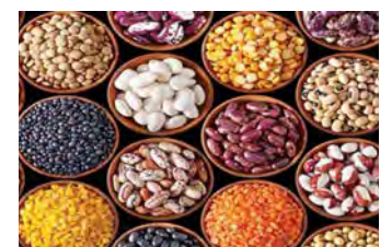
Multiple beans and pulses in the market.

The beans are mostly grown in Ayeyawady, Bago, Magway and Mandalay regions. More than 142,000 tonnes of pulses were exported in April amounting to $830.625 million from 1 October 2021 to 31 March 2022, according to the ministry. — TWA/GNLM