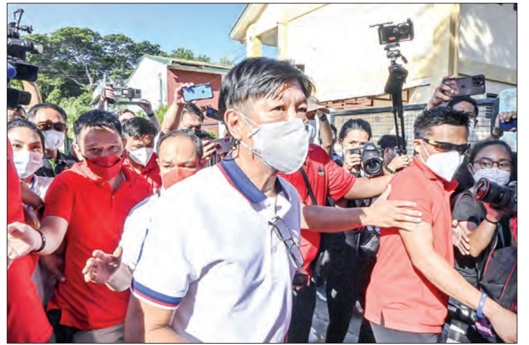
Former senator Ferdinand Marcos Jr exits a polling station in Batac in the Philippines on 9 May 2022.

some victims of the atrocities committed while Marcos senior was in power have expressed concerns. The dictator's 21-year-long administration was marked by rampant human rights abuses, torture, killings and embezzlement until he was overthrown by the 1986 pro-democracy "people power" revolution. During the election campaign, Marcos Jr said he will focus on promoting small and medium-sized businesses and agriculture as well as accelerating industrialization, as his father's government had worked on the areas in the 1970s. Although the Philippines faces its deepest economic downturn since the 1980s and a record high debt of 12.68 trillion pesos ($242