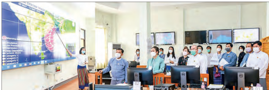
The MoSWRR Union Minister inspects the work procedures at the Emergency Operation Centre.

UNION Minister for Social Welfare, Relief and Resettlement Dr Thet Thet Khine inspected the work procedures of the