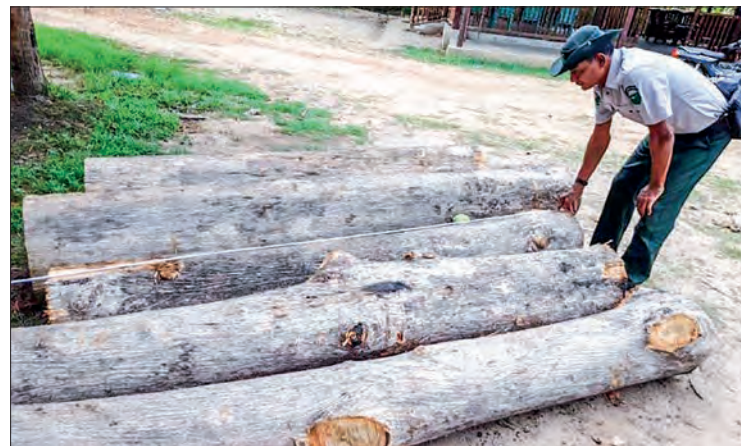
Confiscated teak logs in Bago Region.

Therefore, on 6 and 9 May, six arrests were made (an estimated value of K21,464,150), according to the Anti-Illegal Trade Steering Committee. — MNA