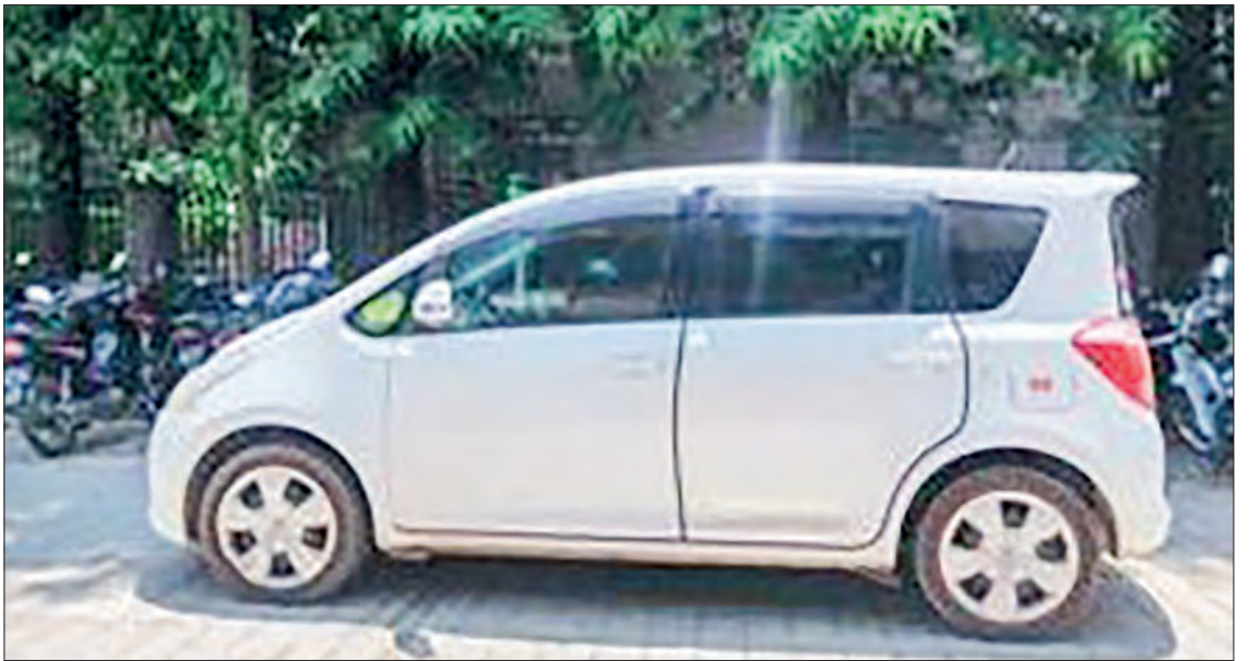
Seized car in Ayeyawady Region.