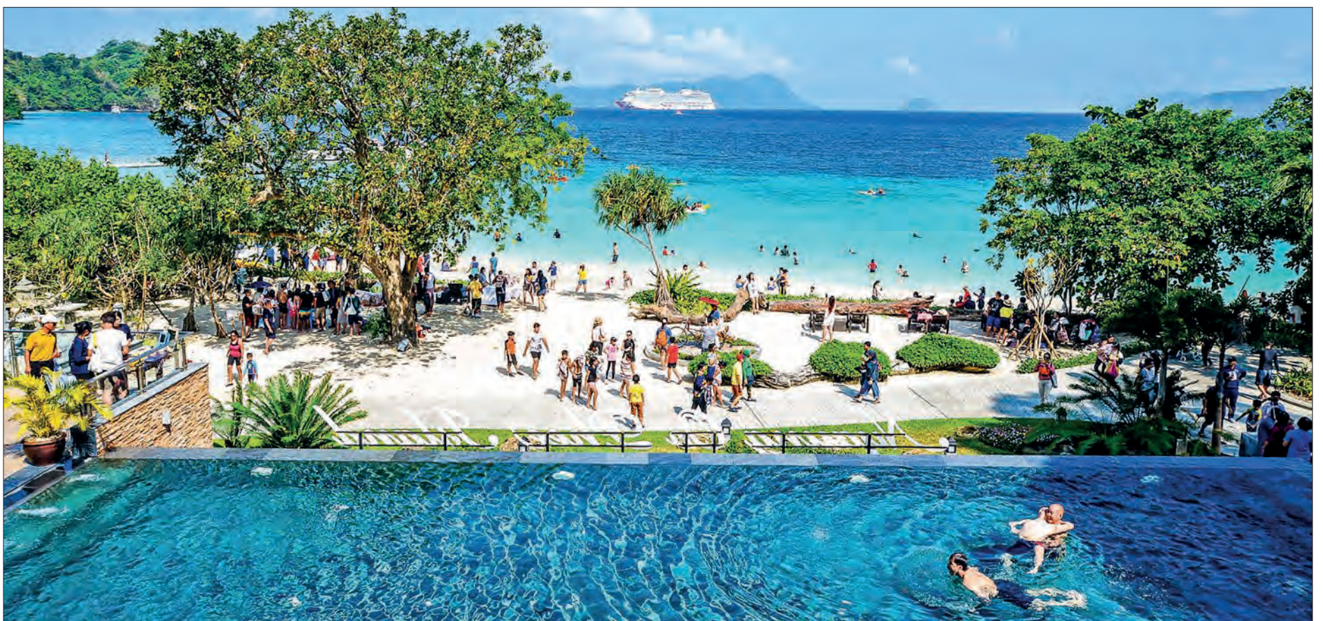
A total of 135 islands along the coast of Kawthoung District are abundant with natural beauties, live bio-diversities and coral reefs. Some islands are attractive to travellers for taking relaxation.

K AWTHOUNG area in Taninthayi Region is naturally endowed with long coasts, various sizes of islands formed with soft and white sand beaches, varieties of plants, mangrove forests, amphibious animals, birds and coral reefs.