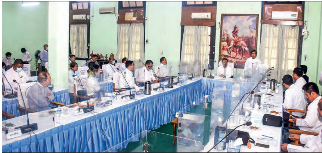
The meeting between the MoI Union Minister and the Myanmar Press Council, National Literary Award and Sarpay Beikman Manuscript Award Selection Committees' members in progress.

The ministry also adopts proper media related measures to ensure the knowledge and thoughts of the people in their daily life. But unscrupulous persons are obstructing