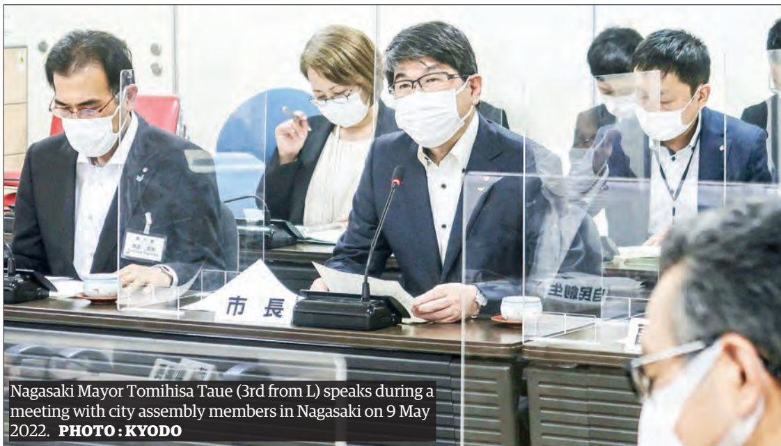
Nagasaki Mayor Tomihisa Taue (3rd from L) speaks during a meeting with city assembly members in Nagasaki on 9 May 2022.