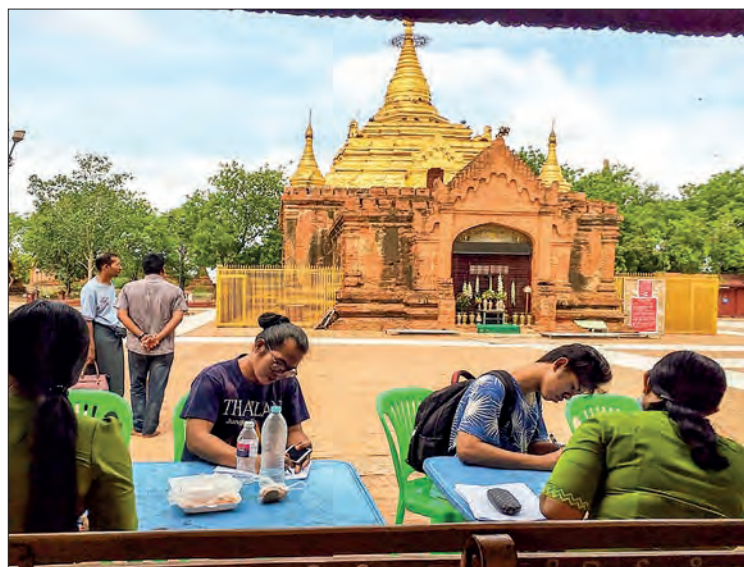
The Directorate of Hotels and Tourism carries out the survey on Bagan travellers.

vehicle. Due to fewer travellers before the Thingyan period, passenger buses had to rely on goods every day.