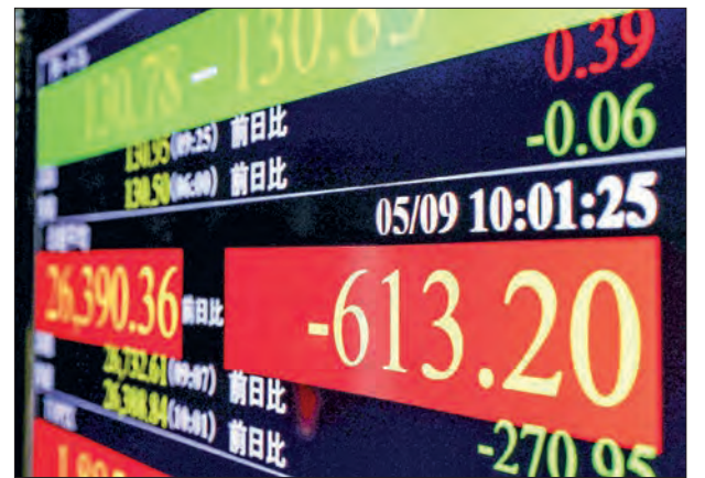
A financial data screen in Tokyo shows the Nikkei Stock Average falling over 600 points at one point on 9 May 2022.

Lockdowns across dozens of Chinese cities—from the manufacturing hubs of Shenzhen and