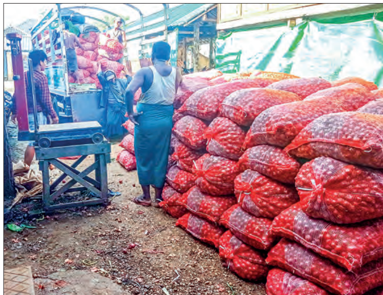
The retail prices stand at K700-800 per viss at present and the wholesale price is at K500-600 per viss.

THE prices of onions are slightly rising and the Minbu market sees brisk sales, onion brokers said.