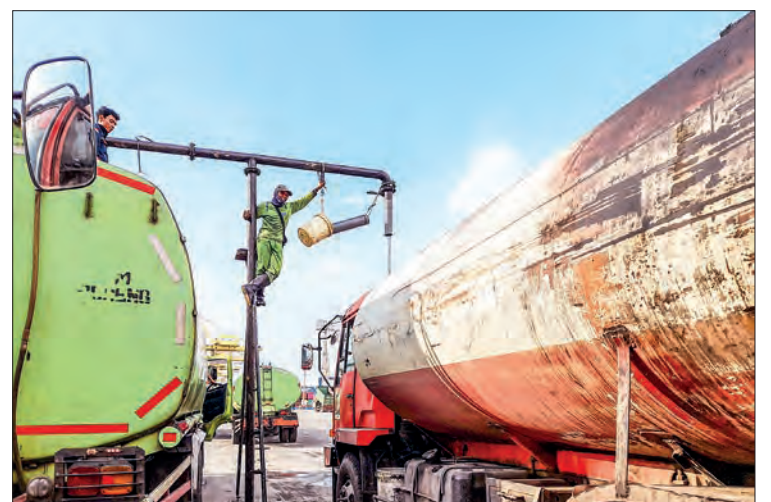
This photo taken on 7 April 2022 shows workers transferring crude palm oil to tanker trucks at the Tanjung Emas seaport in Semarang, before being distributed to cooking oil packaging factories.

ly impressive growth of 16.22 per cent in the first quarter of 2022 as prices for Indonesia's palm oil, nickel and tin soared on the global market.