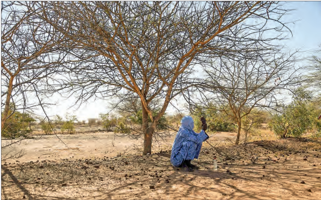
A Nigerien farmer sits in the shade of a tree in the Great Green Wall site in Simiri, about 100km north of Niamey, on 13 November 2021.

NINE African heads of states attended Monday's opening session of the UN's COP15 talks to fight desertification and land degradation that have devastated large