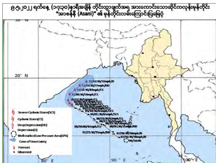
Direction diagram of the severe cyclonic storm "Asani".

Due to the Severe Cyclonic Storm "Asani", people should be aware rain or thundershowers with strong wind and domestic flight, trawlers, vessels and ships in off and along Myanmar Coasts. — Department of Meteorology and Hydrology