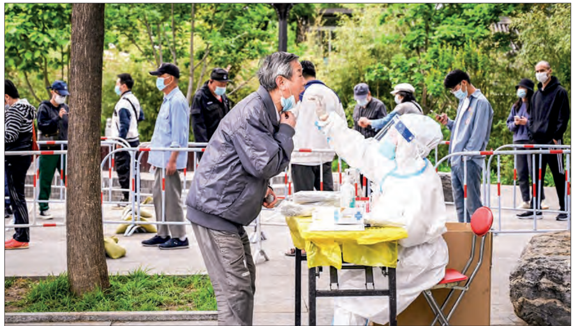
A health worker takes a swab sample from a man to be tested for Covid-19 coronavirus at a makeshift testing site along a street in Beijing on 7 May 2022.

Non-essential businesses in the district, home to 3.5 million people, were shuttered, with even the Apple store in the popular Sanlitun shopping area ordered to close after opening briefly in the morning. "I feel very uncomfortable seeing so few people around," Wang, a middle-aged cleaner waiting outside a restaur-