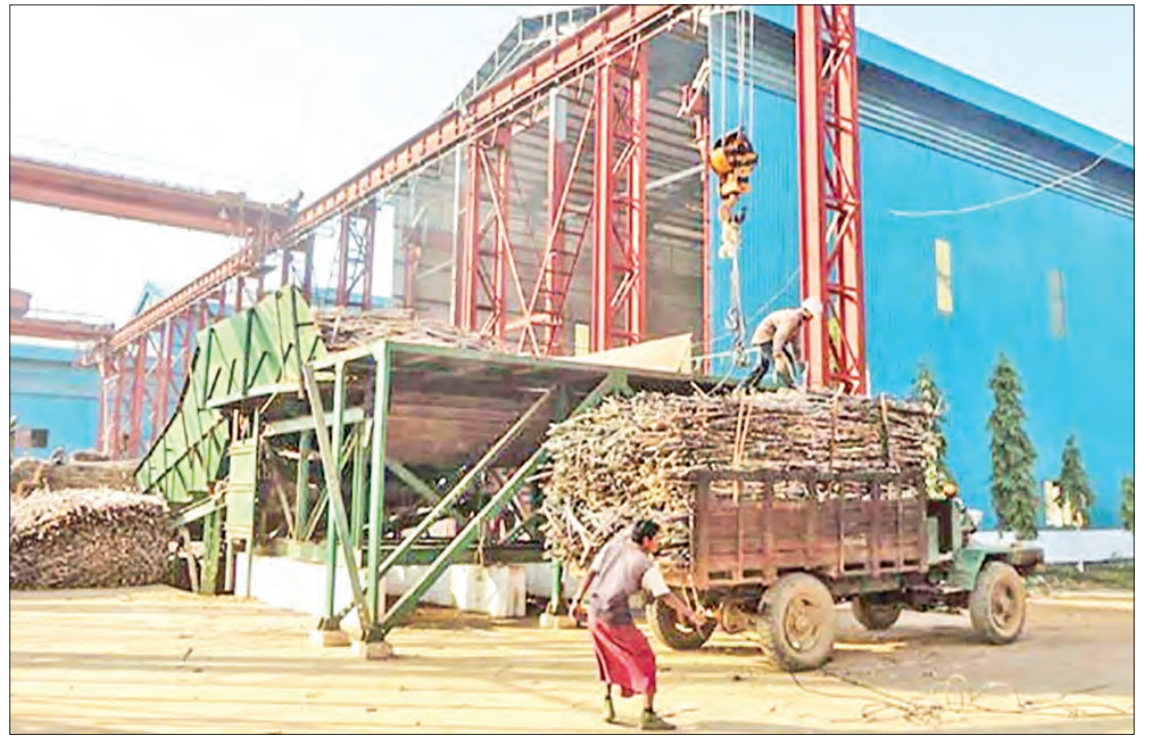
Three mills in Katha and Htigyaing townships crushed over 600,000 tonnes of sugarcane. The remaining was delivered to the mills in Mandalay Region and the syrup manufacturing plants.

The millers faced banking restrictions to pay the growers. Nevertheless, they reached an agreement with the growers to practice a barter trade system. The refined sugar is given in return for sugarcane price and worker wages. The sugar is conveyed to the Mandalay depot. The sugar fetches K1,950 per viss (a viss equals 1.6 kilogrammes).