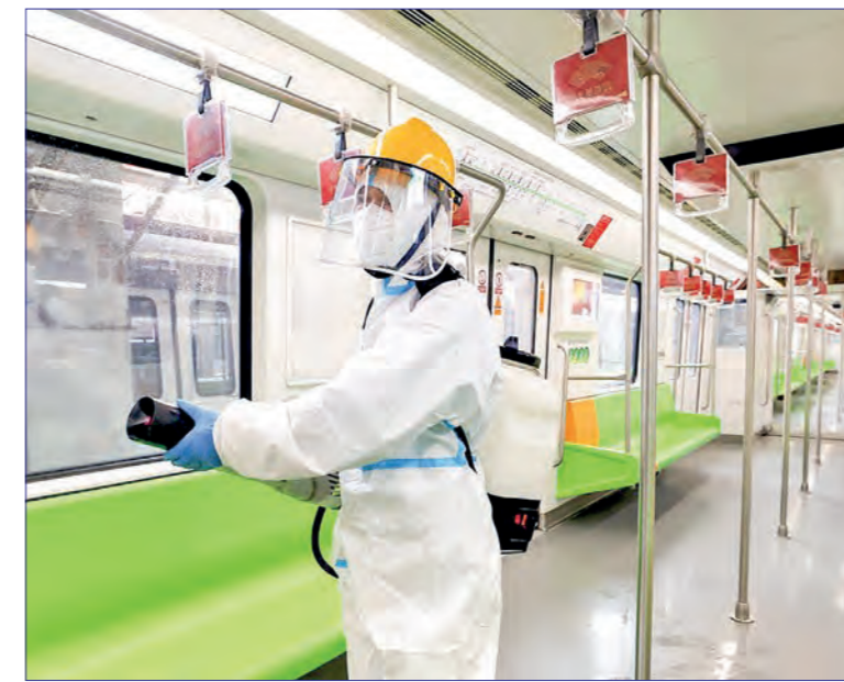
A sanitation worker disinfects subway carriages in east China's Shanghai, 5 May 2022.

According to preliminary statistics in late April, more than 720,000 Party members volunteered to report for duty during