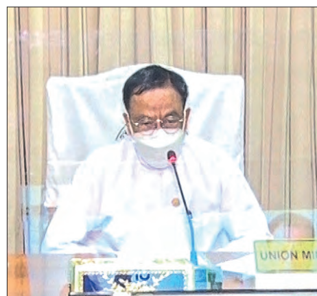
The MoHT Union Minister joins the UNWTO Online Meeting yesterday.

Head of Tourism Market Intelligence and Capacity