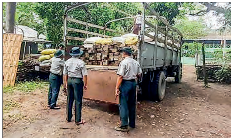
Seized timbers in Sagaing Region.

spection team led by the Region Forest Department under the supervision of the Bago Region Anti-Illegal Trade Task Force