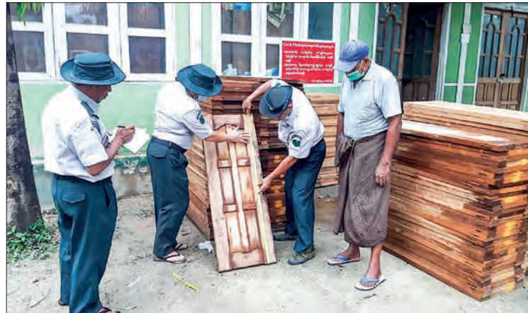
Confiscated items in Sagaing Region.