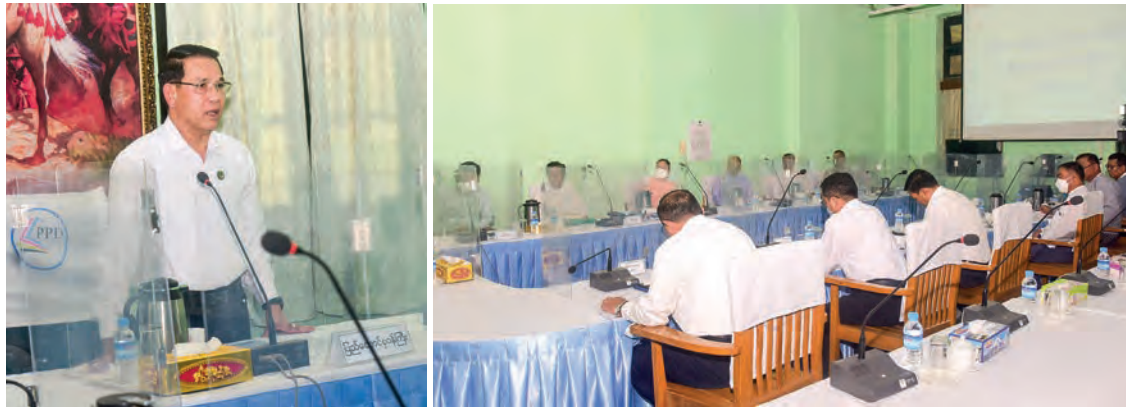
The MoI Union Minister meets publishers at the Department of Printing and Publishing in Yangon on 8 May.

UNION Minister for Information Maung Maung Ohn said it was very upset to see the hate speech and writings that provoke