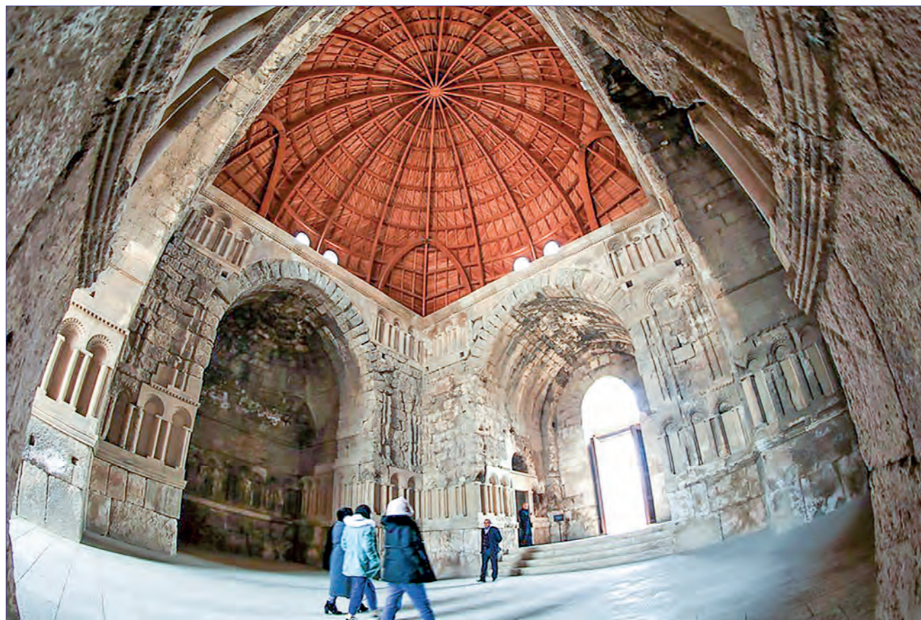
People visit the Citadel archaeological site in Amman, Jordan, on 28 December 2021.

J ORDAN'S pandemic-hit tourism industry has shown signs of recovery for the first quarter of 2022 and the Eid al-Fitr holiday, following massive campaigns to promote the kingdom's tourism profile and the eased COVID-19 restrictions.