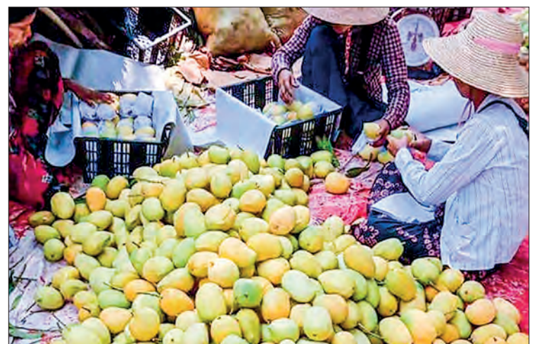
Workers are sorting quality mangoes to be packaged into the market.

Of about 200 mango varieties originated in Myanmar, Seintalone, Shwehintha, Padamyar Ngamauk, Yinkwe, Machitsu varieties are primarily grown. Foreign market prefers Seintalone varieties. Ayeyawady Region possesses the largest mango plantation acres, having about 46,000 acres. Bago Region is the second largest producer with 43,000 acres and Mandalay Region has 29,000 acres of mango. There are over 24,000 acres in Kayin State, over 20,400 acres in Shan State and over 20,000 acres in Sagaing Region, according to the association.—NN/GNLM