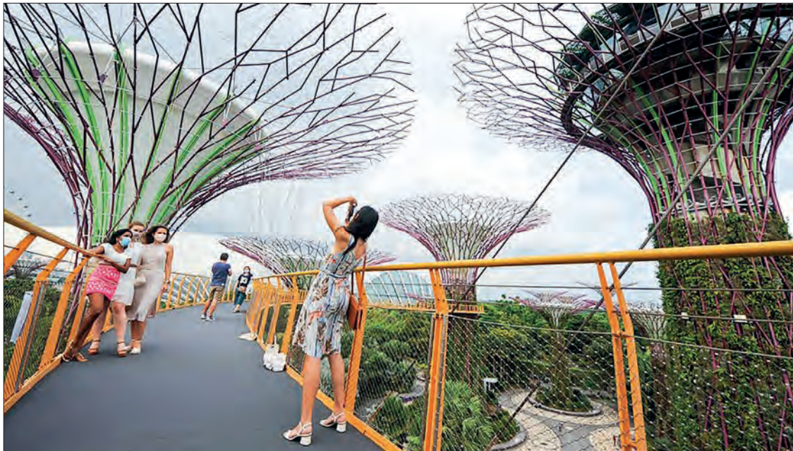
Singapore rolled out last year the Singapore Green Plan 2030 which aims to advance the national agenda on sustainable development. People visit the Supertree grove OCBC Skywalk on the first day of reopening at Singapore's Gardens by the Bay on 7 September 2020.

A senior Singaporean official has warned that an attitude of complacency and lack of responsibility