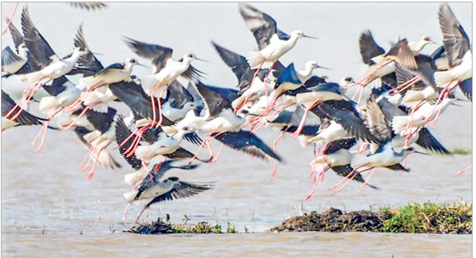
Migratory birds, a flock of black winged stilt, are flying over Moeyungyi Wildlife Sanctuary in illustrating image of sanctuary nature in Bago Region.