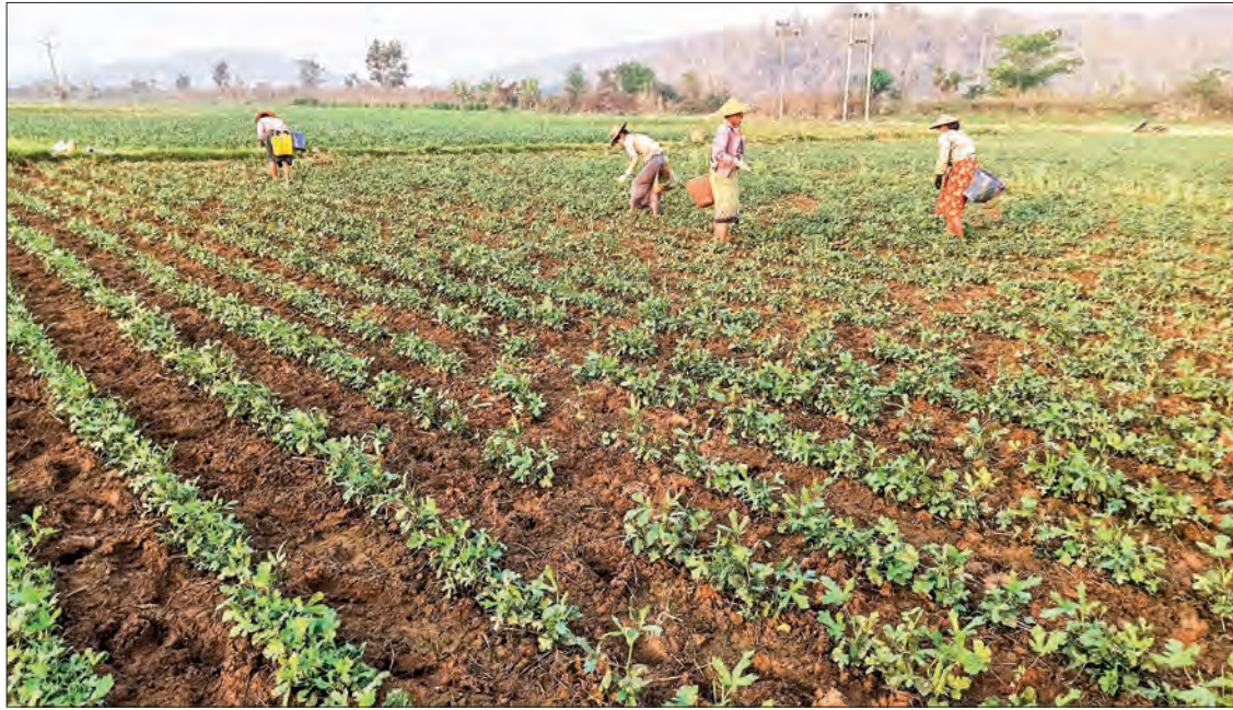
Farming workers are working in the crops farm.

Following the closure of Sino-Myanmar border posts triggered by COVID-19 impacts and changes in China's Customs regulations, the export saw a drastic drop in agriculture.