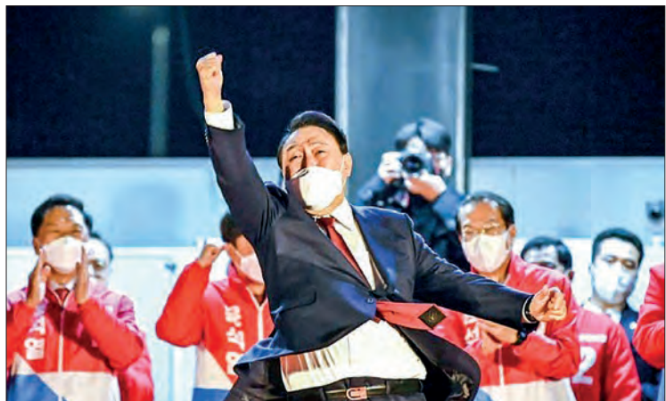
Incoming South Korean President Yoon Suk-yeol has not ruled out pre-emptive strikes on the North.

SOUTH Korea's hawkish new president will be sworn in Tuesday, and he looks set to get tough with Pyongyang, departing from what he has called the "subservient" approach of his predecessor.