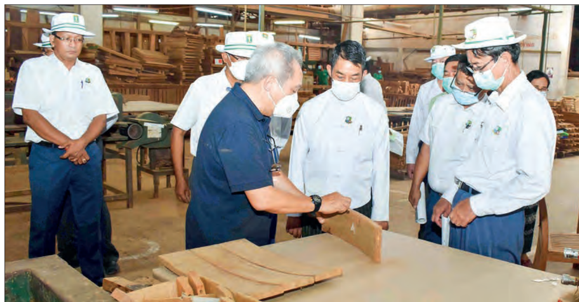
Deputy Minister U Tun Ohn views furniture products at the No 10 Furniture Factory under Myanmar Timber Enterprise in Yangon on 7 May.

The Deputy Minister also visited the No 10 Furniture Factory of the Wood-Based Industry Branch of MTE in Dagon Myothit (South) Township and No 4 Furniture Factory in Thingangyun Township, inspecting the production processes of the factories and coordinating the necessary measures.—MNA