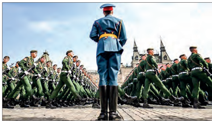
Russian forces marching through Red Square for the rehearsal of the Victory Day parade in Moscow.