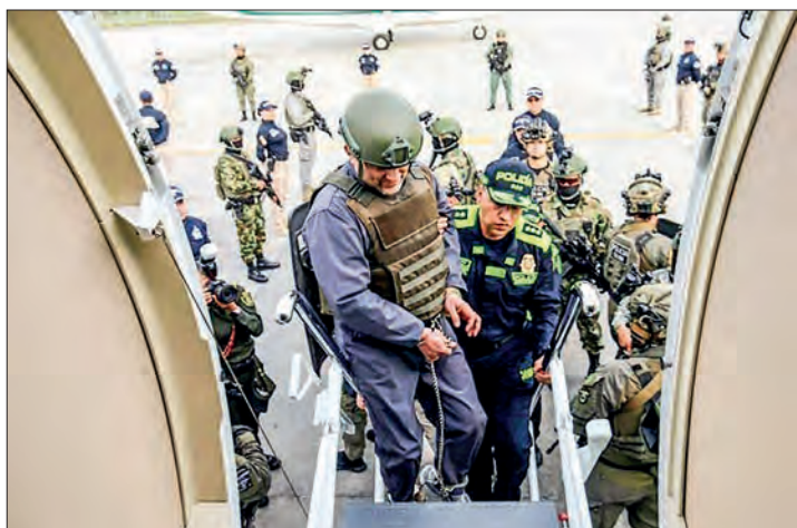
Usuga has pled not guilty to charges of criminal enterprise and international cocaine manufacturing and distribution.