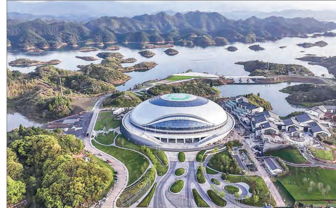
A view of Chun'an Jieshou Sports Centre Velodrome, a venue of the 19th Asian Games in Hangzhou, eastern China's Zhejiang Province.

China's costly and labour-intensive Winter Olympics bubble — when participants took daily Covid tests and were not allowed to mix with the public — now appears to have been