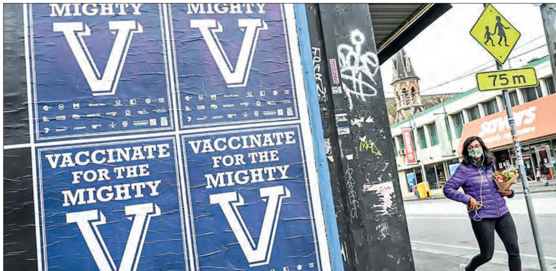
A person walks past posters encouraging people to get vaccinated in Melbourne on 31 August 2021.

A new global trial of COVID-19 vaccines is set to begin in the Australian state of Victoria, which will administer lower dose booster vaccines in an effort to top up immunity, lessen side ef-