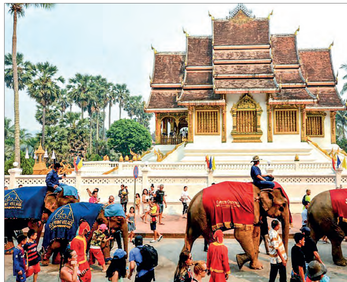
This photo taken on 13 April 2018 shows elephant parading in Luang Prabang, Laos.

Laos will drop Covid-19 entry restrictions for fully vaccinated tourists from Monday after the country reported falling coronavirus cases and deaths, senior officials said.