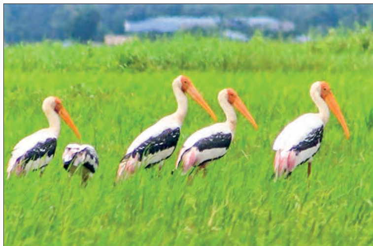
A flock of painted storks are seen in wetland.

Wetland ecosystem helps the local residents earn for living. The department is making effort to keep balance and synergy between the tourism sustainable development and preserving landscape.