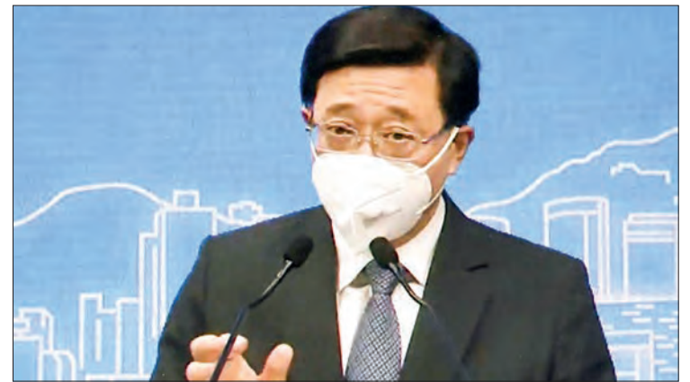
John Lee, the Hong Kong government's former No. 2, was selected as the city's next chief executive in an uncontested election on Sunday.

considered a sure thing since the security hard-liner and only candidate favored by Beijing was