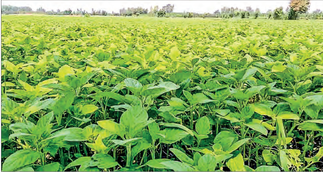
Summer sesame plants are thriving in the farm in Pwinbyu Township of Magway Region.

MORE than 50,000 acres of summer sesame have been planted this summer to ensure local edible oil security, according to the Pwinbyu Township Department of Agriculture in Magway Region.