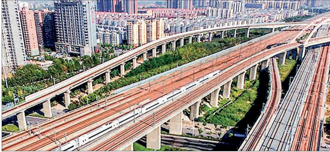
President Xi Jinping has offered state backing for tech, infrastructure and jobs to revive China's economy. A bullet train runs in Zhengzhou, capital of Central China's Henan Province, 1 September 2016.

PRESIDENT Xi Jinping has offered state backing for tech, infrastructure and jobs to revive China's economy, but analysts warn growth will continue to wilt