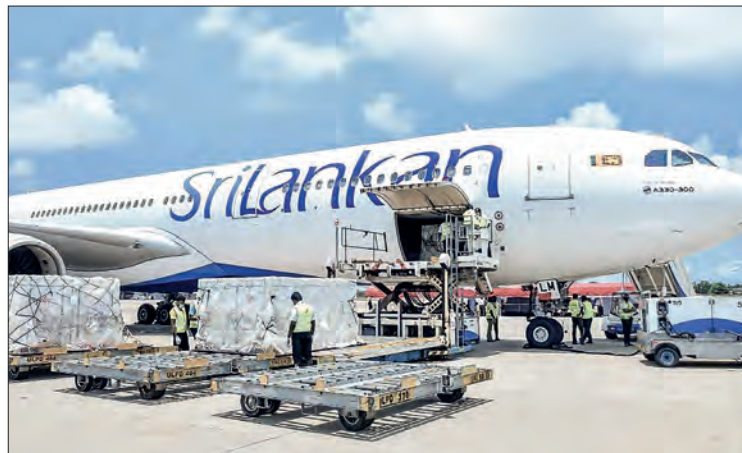
Workers transport Sinopharm COVID-19 vaccines at the Bandaranaike International Airport in Colombo, Sri Lanka, 31 March 2021.

Sri Lanka began administering the COVID-19 vaccines early last year and has to date vaccinated over 80 per cent of those above the age of 12, ac-