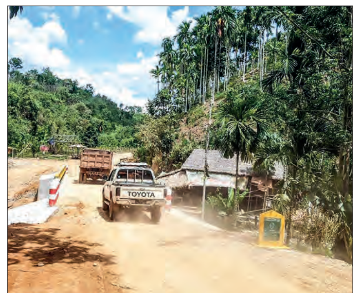
Completion of 30-foot concrete bridge is seen on Phalan Chaungwa-Nyisar road in Ye Township.

THE Ministry of Border Affairs has been working to improve road communication and socio-economic development of fur-flung villages in Ye Township, Mon State.