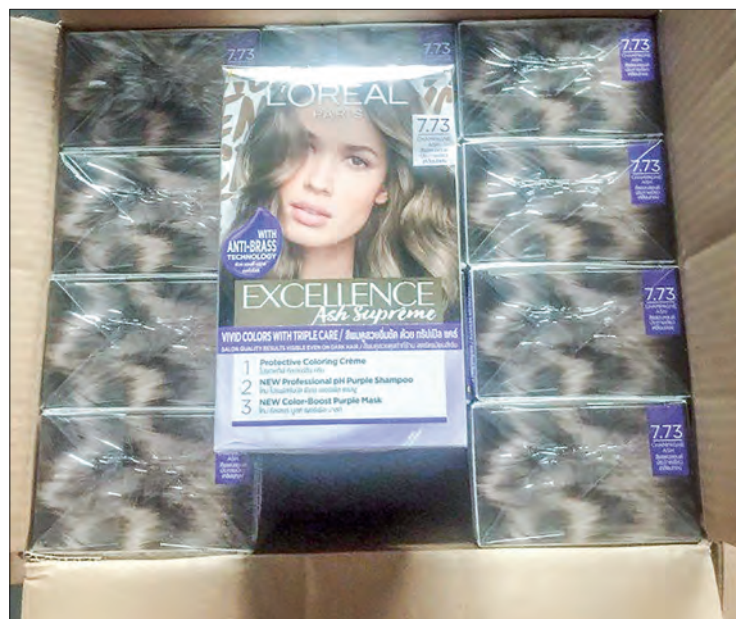
Photo shows packages of seized cosmetics on 7 May.

Therefore, four arrests approximately valued at K37,413,880 were carried out on 7 and 8 May, according to the Steering Committee for Combating Illegal Trade. — MNA