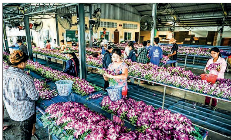
Thailand is the world's biggest producer and exporter of cut orchids.

THAILAND'S orchid growers, already weary after two years of being battered by the pandemic, are bracing for fresh blows to their livelihood as the war in Ukraine and changing weather patterns further cloud their futures.