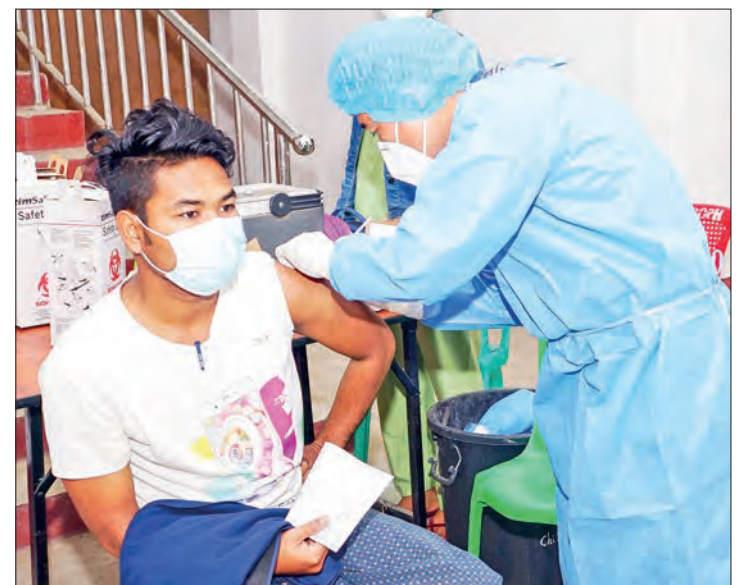
A local is receiving anti-COVID-19 vaccine as booster dose in Maungtaw Township on 7 May.

As of 7 May, 6,394 people had been vaccinated in accordance with the guidelines of the Ministry of Health.