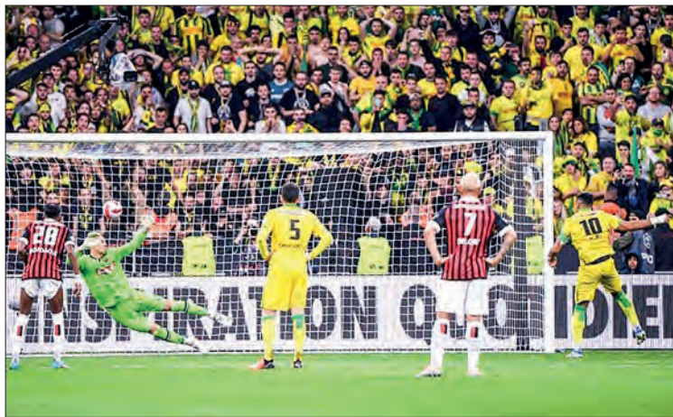
Ludovic Blas scored the only goal in the French Cup final as Nantes beat Nice.

NANTES won the French Cup for the first time in 22 years on Saturday, beating Nice 1-0 in the final at the Stade de France.