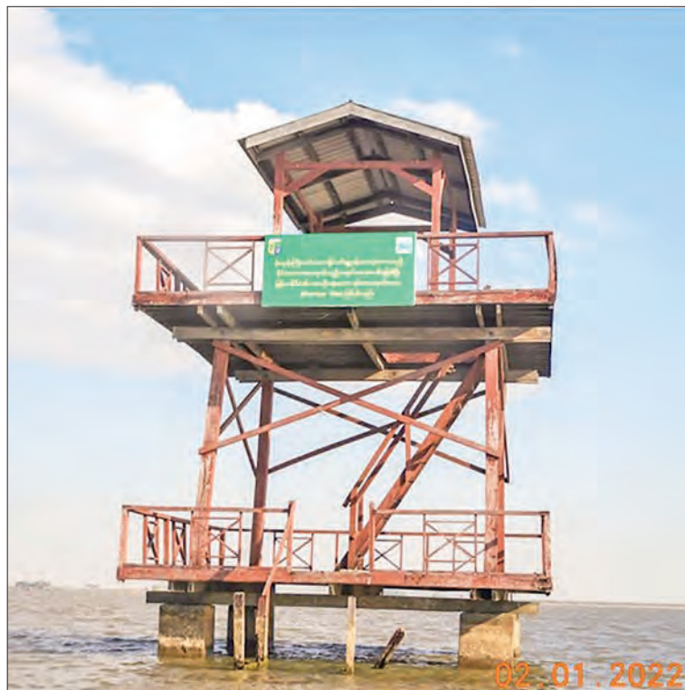
A tower for bird watchers.