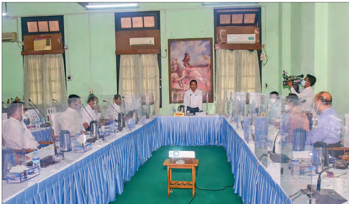
Union Minister for Information U Maung Maung Ohn is speaking at the meeting with publishers and printers in Yangon on 8 May 2022.

Such a lawsuit is not a restriction on the right to freedom of expression, but due to the violation of the provisions