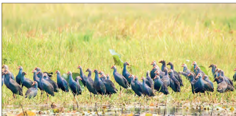
A flock of Purple Swamphens are seen in Moeyungyi Lake.