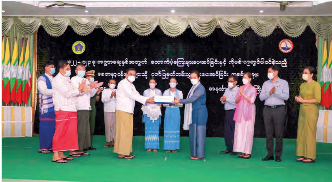
SWRR Union Minister Dr Thet Thet Khine presents cash assistance to Taninthayi Region Chief Minister U Myat Ko on 7 May.

At the ceremony, the Union Minister briefed them on the implementation of Quick Win Projects on social protection, and disaster management and rehabilitation. Taninthayi