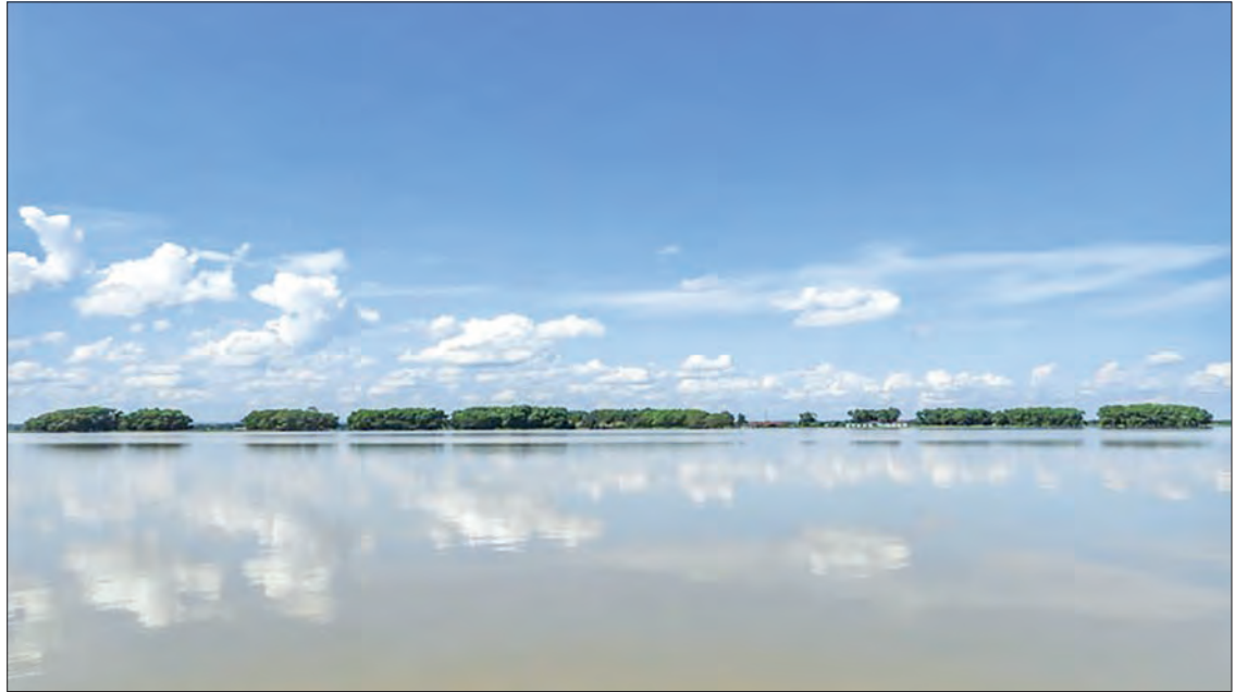
A scenic view of Moeyungyi Lake.

Migratory Birds enter Myanmar through two flyways: Central Asian Flyway and East