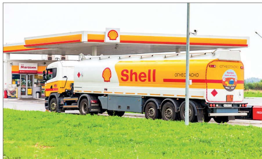
Shell added Thursday that revenues rallied 51 per cent to $84.2 billion in the first three months of the year.

Shell added Thursday that revenues rallied 51 per cent to $84.2 billion in the first three months of the year.—AFP