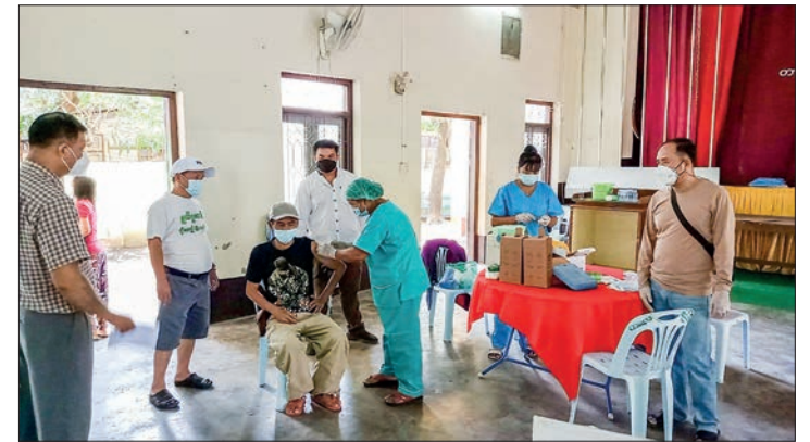
A local in Tachilek Township, Shan State gets COVID-19 vaccine shot.

It is reported that the Ministry of Commerce is coordinating with relevant departments to prevent COVID-19, and contact persons for enquiries can be reached through the Ministry's Website – www.commerce.gov.mm.