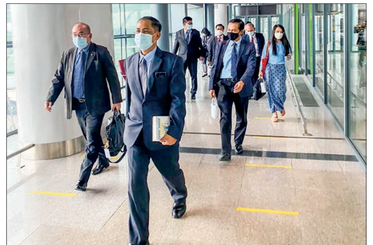
The MoIC Union Minister leaves for Phnom Penh on 5 May 2022.

At OCHA's request, Union Minister U Ko Ko Hlaing received a courtesy call by the delegation led by Ms Joyce Msuya, OCHA's Assistant Secretary-General for Humanitarian Affairs and Deputy Emergency Relief Coordinator at the Sokha Hotel, Phnom Penh. The Meeting was also attended by Deputy Ministers and the relevant officials for the provision of humanitarian assistance to Myanmar.—MNA