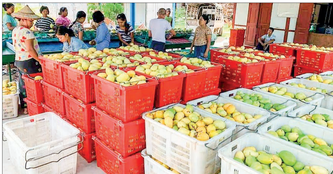
At present, export to China is on a trial run. After the goods pass COVID tests at the Muse 105th-Mile Post, mangoes are delivered to China.

The weather condition wreaked havoc on the yield this year, yet the price is pretty good.