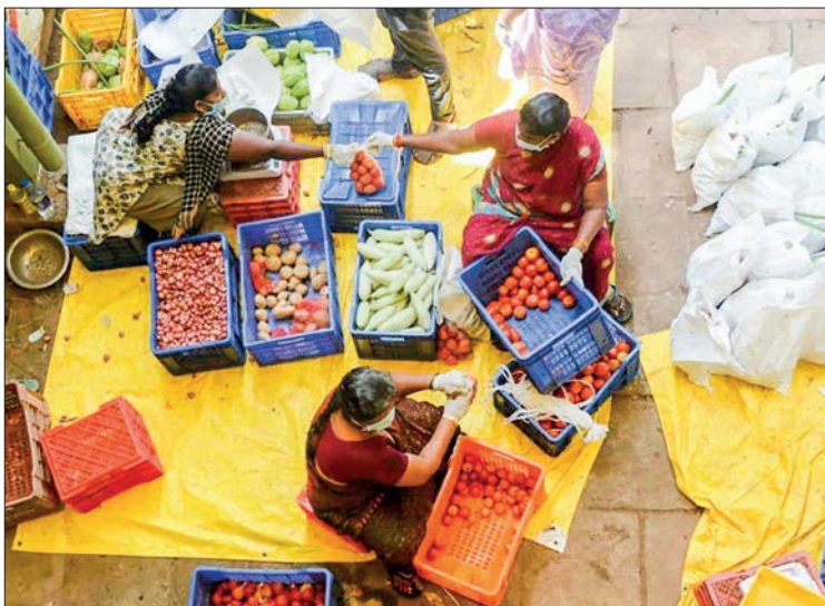
The Indian economy bounced back strongly from the coronavirus pandemic with one of the world's fastest growth rates, but is now grappling with rising costs as global commodity prices skyrocket. Workers wearing facemasks pack pre-ordered vegetables for distribution at the Tamilnadu horticulture centre in Chennai.

Consumer inflation has consistently overshoot the RBI's two-to-six per cent target in the first three months of the year, hitting a 17-month high of 6.95 per cent in March. Economists expect inflation in April to have crossed seven per cent.—AFP