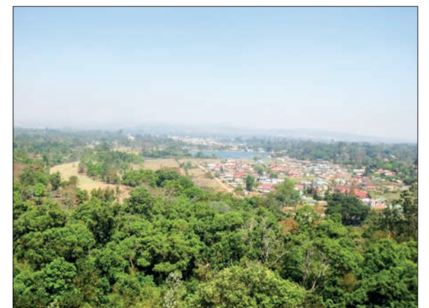
An aerial view of PyinOoLwin.

THE PyinOoLwin District Administration Body made an announcement on 4 May regarding the sales of plots of divided land at low prices in PyinOoLwin, saying that there may be losses for the buyers in the future.