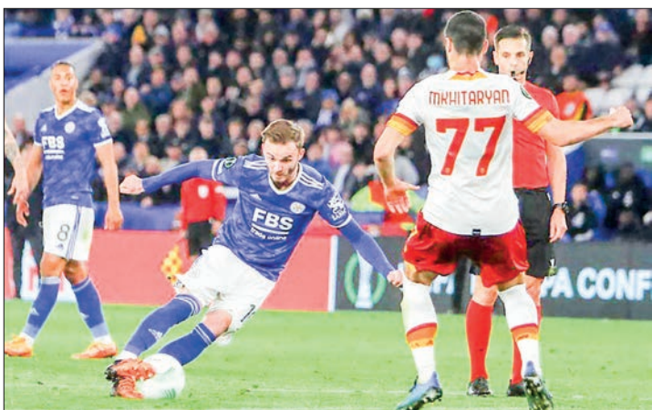
Leicester boss Brendan Rodgers says the club are attempting to write "another chapter" in their story as they prepare to face Roma with a place in the Europa Conference League final at stake.

Rodgers, whose team dropped into the Conference League after failing to progress from the Europa League group stage, said Wednesday he had been trying to create a "winning mentality" at the club, who have struggled in the Premier League this season.