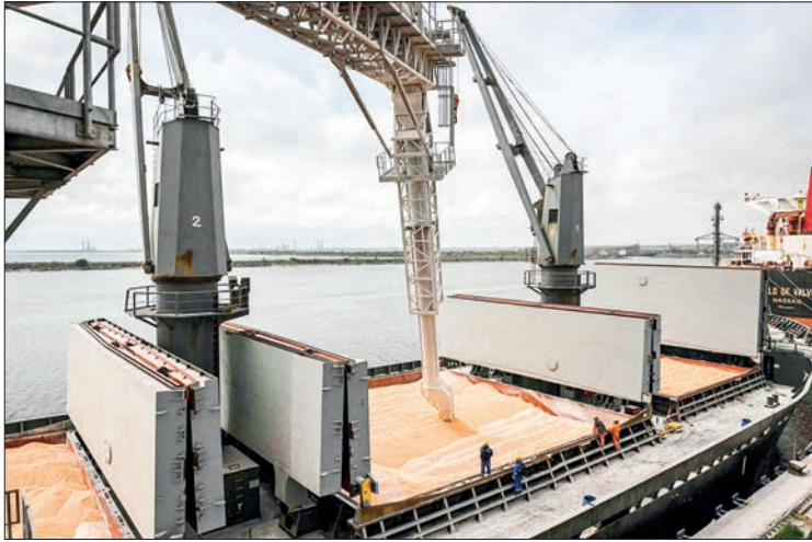
Workers assist the loading of corn on to a ship at Pier 80 in the Black Sea port of Constanta, Romania, 3 May 2022.

LIKE a giant elephant trunk, a huge hose sweeps above the hold of a ship in Romania's Black Sea port of Constanta, spilling tonnes of corn into the vessel before it sets sail.