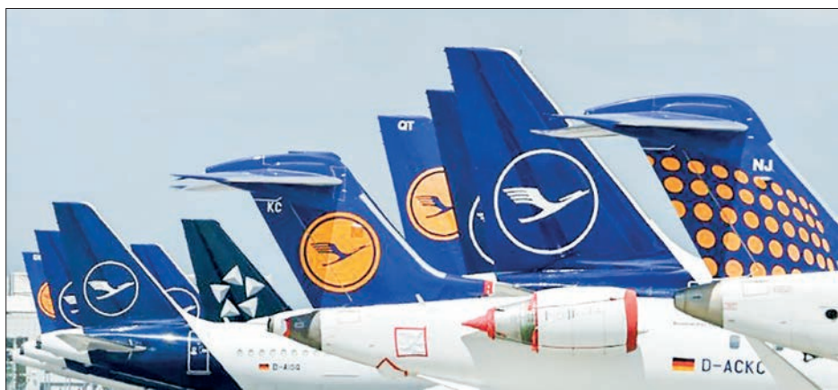
Lufthansa warns that 'ticket prices will have to rise' due to the surge in fuel costs.

The improved result was due in part to the rise in air traffic as coronavirus-related restrictions were rolled back in