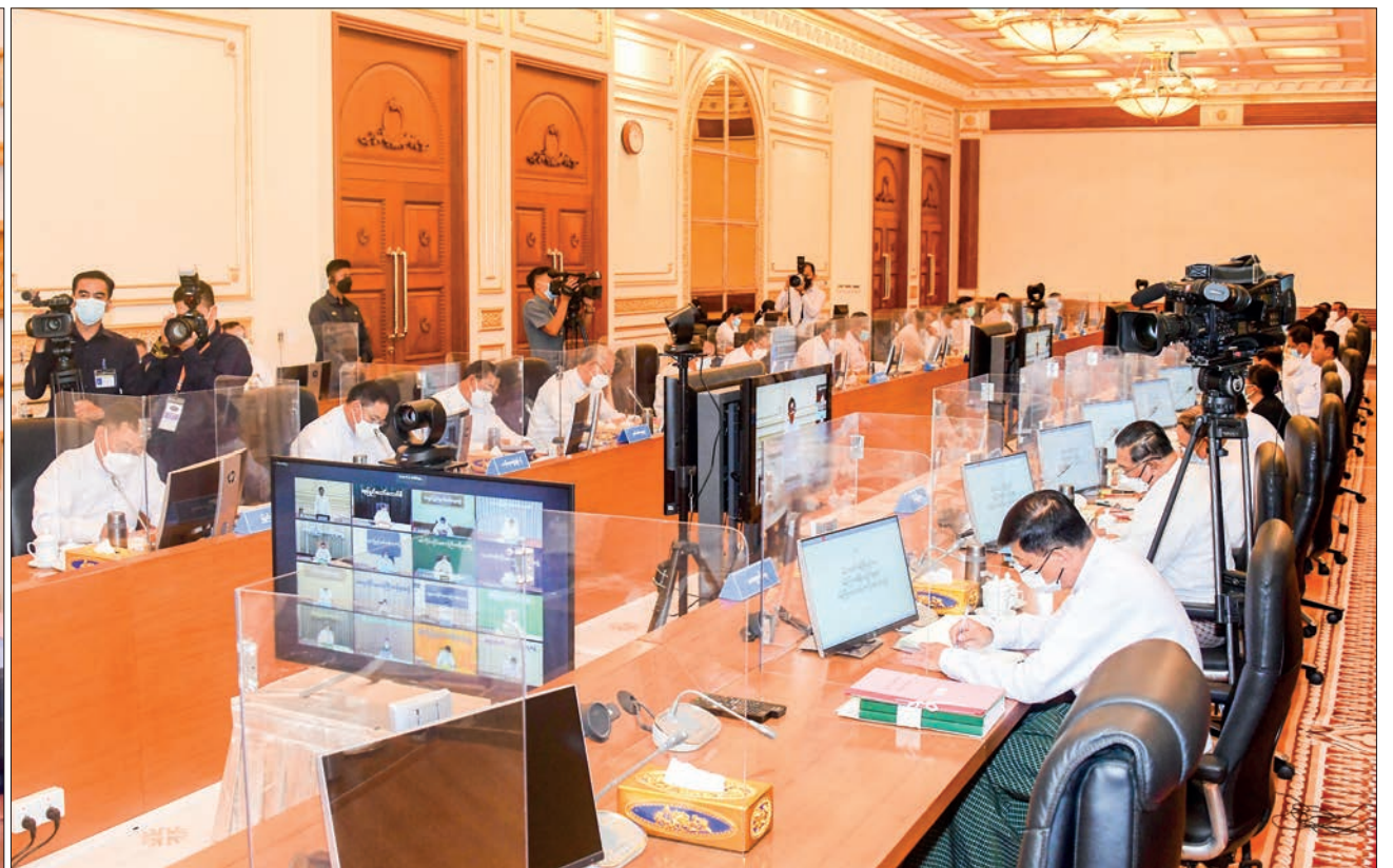
State Administration Council Chairman Prime Minister Senior General Min Aung Hlaing addresses the meeting 3/2022 of the Union government in Nay Pyi Taw on 5 May 2022.

A government responsible for the nation's economic development needs to take this into consideration, said Chairman of the State Administration Council Prime Minister Senior General Min Aung Hlaing at the meeting 3/2022 of the Union government yesterday.