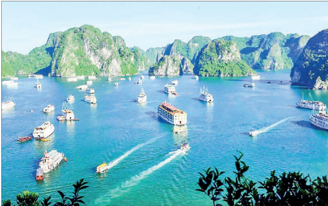
Photo taken on 16 March 2022 shows Ha Long Bay, Vietnam's northern Quang Ninh province.

The country targeted serving over 5 million overseas tourists in 2022, according to the Vietnam National Administration of Tourism.—Xinhua