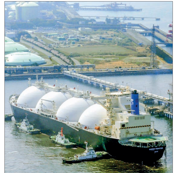
File photo shows a liquefied natural gas tanker in waters off Sodegaura, Chiba Prefecture, in April 2009, which arrived from Sakhalin island under the Sakhalin 2 project.

"It is necessary for countries to do what they can do to keep pace," Hagiuda said, while adding his government wants to "share the same direction" after U.S. President Joe Biden expressed his intention to hold talks among the Group of Seven nations by the end of this week on imposing more sanctions against Russia.—Kyodo