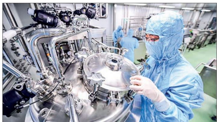
An employee works at a facility producing a Covid-19 coronavirus vaccine.

"People are tired of the repeated booster, so it is extremely important to come to a vaccine that could be a yearly vaccine," Bourla told analysts on a conference call, adding that while the company has made progress on this front, "it's not technically easy to achieve."—AFP