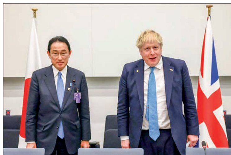
UK and Japan leaders Boris Johnson and Fumio Kishida were on Thursday to hold talks in London, where they were set to agree a new defence agreement and measures to reduce dependency on Russian energy supplies.

London has been strengthening its commitment to the Indo-Pacific region in view of its economic and geopolitical importance. If a reciprocal access agreement, as the defence cooperation pact is known, is reached, Britain would be the third country to have such an accord with Japan after Tokyo's longtime ally the United States and Australia. —Kyodo