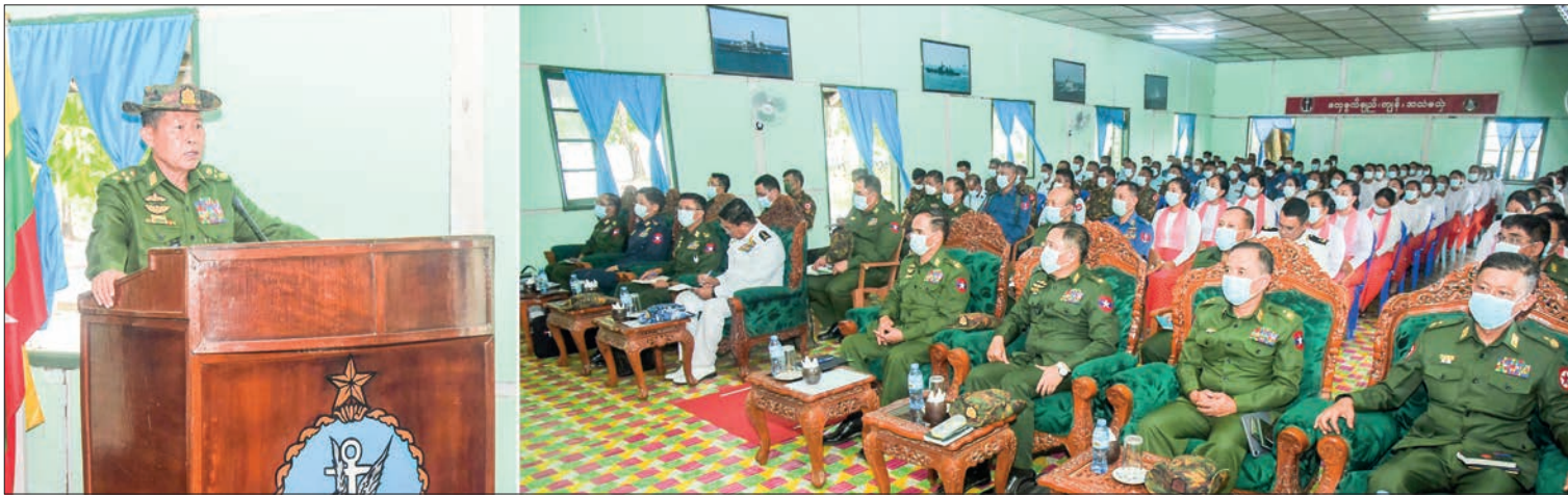
State Administration Council Vice-Chair Deputy Commander-in-Chief of Defence Services Vice-Senior General Soe Win meets officers, other ranks and families in Cocokyun on 5 May 2022.

TATMADAW members in far-flung areas have to live in unison inside and outside the military units to prevent terror dangers, said State Administration Council Vice-Chair Deputy Commander-in-Chief of Defence Services Commander-in-Chief (Army) Vice-Senior General Soe Win while meeting officers, other ranks and families in Cocokyun yesterday afternoon.