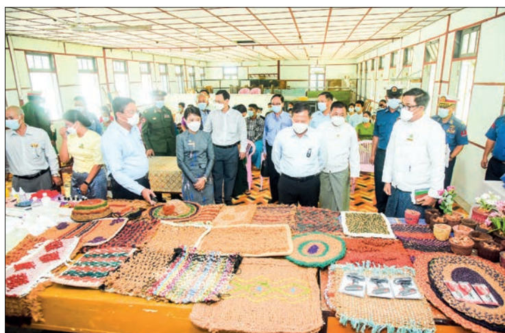
At the training course.

Learning opportunities in rural and cities are not that differ-