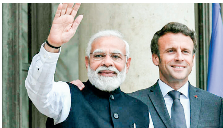
France's President Emmanuel Macron (R) welcomes India's Prime Minister Narendra Modi (L) before their meeting at the Elysee Palace in Paris, on 4 May 2022.

INDIA and France on Wednesday called for "an immediate cessation of hostilities" in Ukraine, with Prime Minister Narendra Modi again stopping short of condemning Russia's invasion of its neighbour.