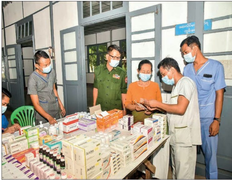
THE Tatmadaw sea-going hospital ship (Thanlwin) which plans to provide medical services to the residents of Cocokyun Township, Yangon Region and the coastal region of the Tanin-

thayi Region offered healthcare services to 285 patients at Cocokyun People's Hospital yesterday.