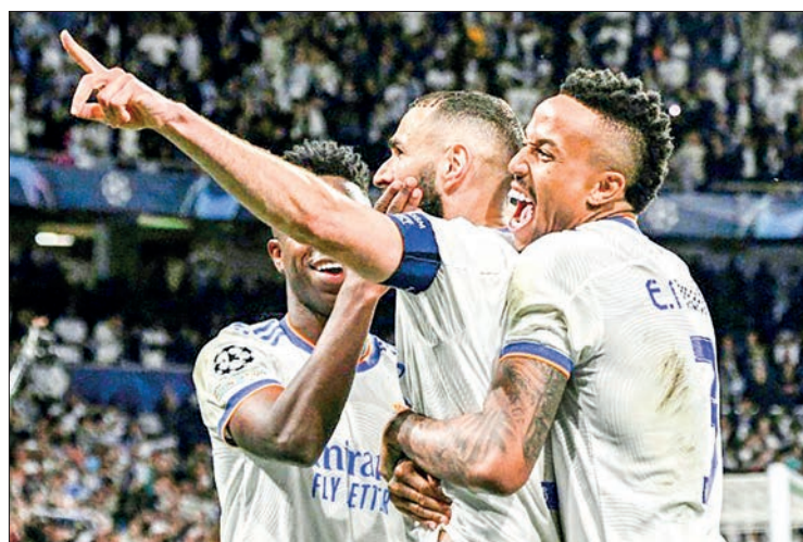
Real Madrid forward Karim Benzema (centre) celebrates scoring a penalty against Manchester City.

MANCHESTER City have become accustomed to Champions League heartache, but the manner of their latest collapse against Real Madrid might be the most painful defeat of all.