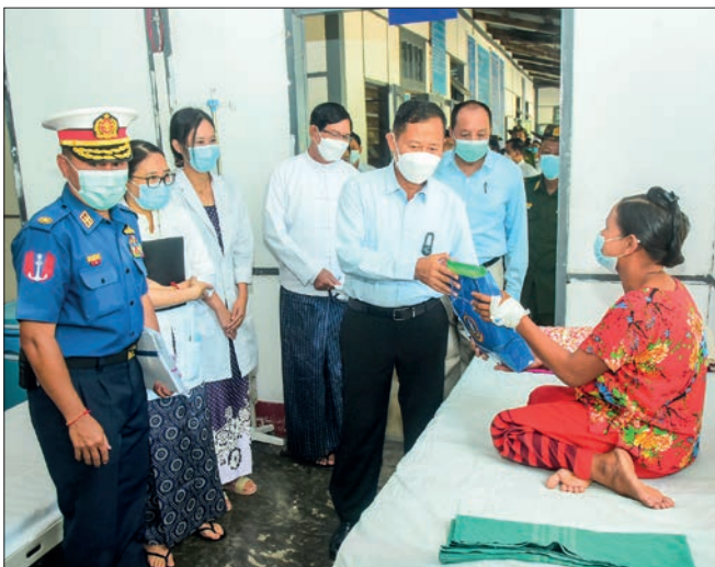
At the township hospital.