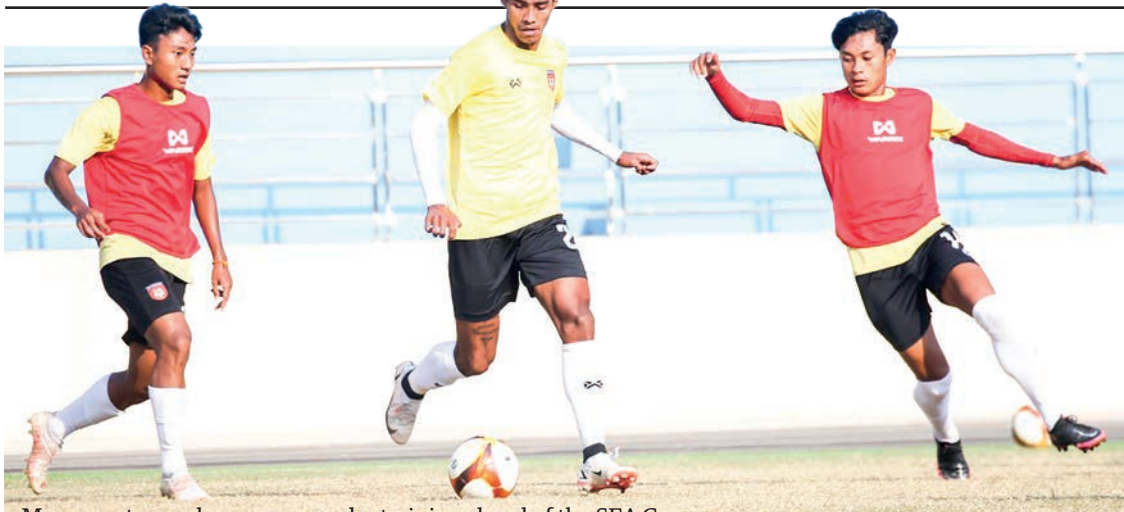
Myanmar team players seen under training ahead of the SEA Games men's football competition.