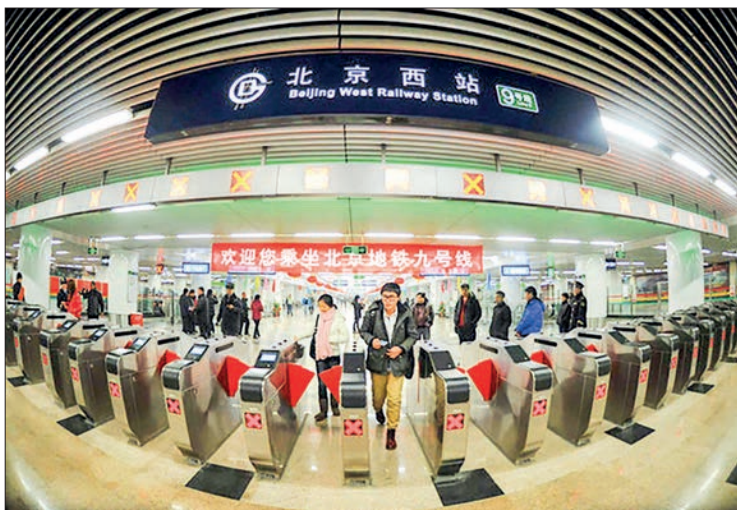
Passengers exit from the Beijing West Railway Station of No 9 subway line in Beijing, capital of China, 31 Dec 2011.

BEIJING closed dozens of subway stations on Wednesday, as Covid restrictions slowly constrict movement across