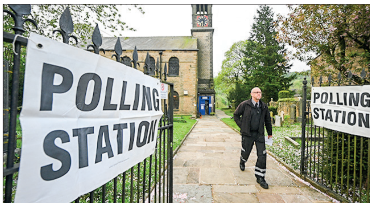
A voter walks out of Holy Trinity Church being used as a polling station in Dobcross near Manchester during local elections on 5 May 2022.

simmering discontent within his ruling Conservatives about his leadership, after a string of recent scandals.