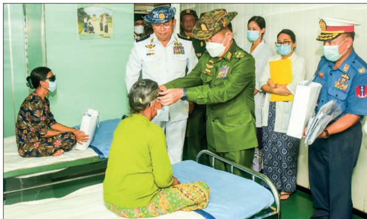
The Vice-Senior General comforts the patients on board the hospital ship.

gers. Sports contribute to unity. As the government allotted the budget for the infrastructures for Tatmadaw members and families, it is necessary to maintain the structures for long-term existence systematically. The Tatmadaw members must always take training for discharging the State defence duty at full capacity. Tatmadaw members should not commit carelessness for their duties as they are assigned round the clock. Officials need to manage duties and functions for the Tatmadaw members as they take out their tasks in positions