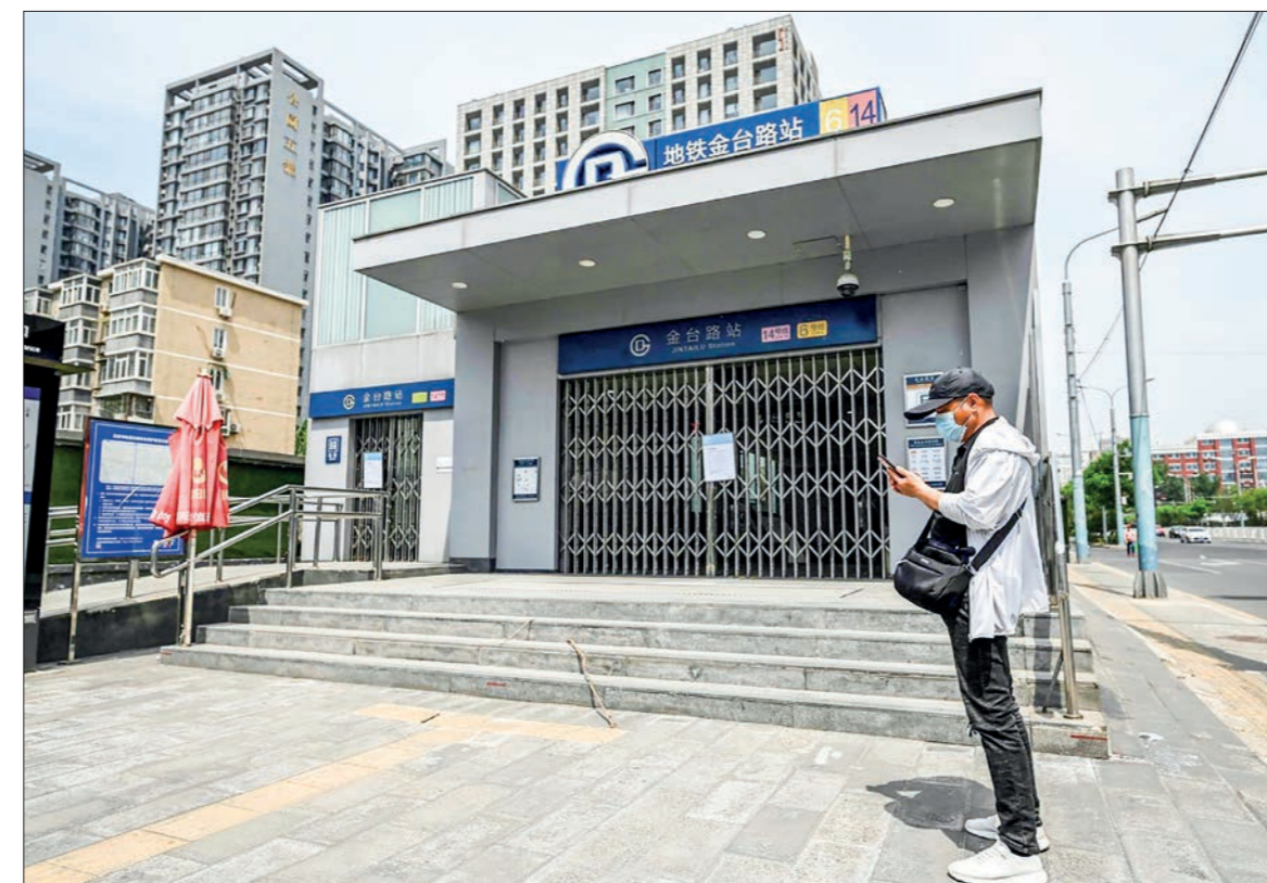
Many subways and restaurants are closed in Beijing to stamp out Covid cases.

At least one other Beijing district has also encouraged residents to work from home, while dozens of subway stations across the capital remained closed. Open restaurants offer only takeaway.