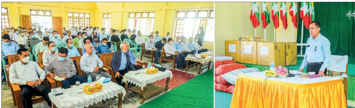
State Administration Council Vice-Chair Deputy Commander-in-Chief of Defence Services Vice-Senior General meets departmental personnel and residents in Cocokyun Township yesterday.