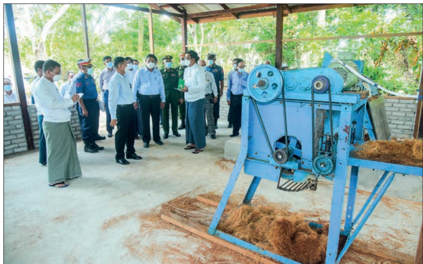
At the Aung Naing Thu coir rope factory.