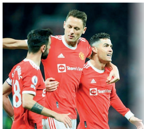
Manchester United eased to victory against Brentford.

MANCHESTER United took the sting out of their fans' latest protest against the Glazer family as they eased to a 3-0 win against Brentford on Monday.