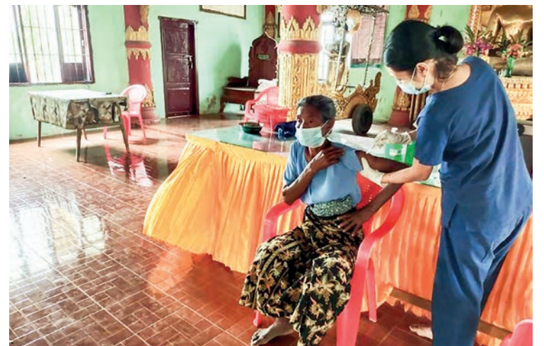
A local in Yathedaung Township, Rakhine State receiving a Covid vaccine.

It is reported that officials from the respective military commands visited the site and coordinated the necessary work.