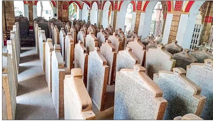
Renovation work at the Ledi Stone Inscription Museum.

“The board of trustees discussed the launch of the renovation. The renovation has started with the desire to keep it tidy. It is necessary to hand it over to the next generation. We want to be appreciated for our efforts. We want the next generation to do as