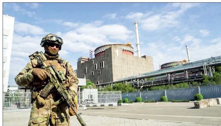
An administrative building is charred, but those of the reactors seem intact: AFP was able to visit the Zaporizhzhia nuclear power plant on Sunday, the largest in Ukraine and Europe, whose capture by the Russian army has aroused concern of the international community.

NEARLY two months after it was seized by Russian forces, there are few signs of the fighting for the Zaporizhzhia nuclear power plant in Ukraine that sparked global fears of a potential atomic disaster.