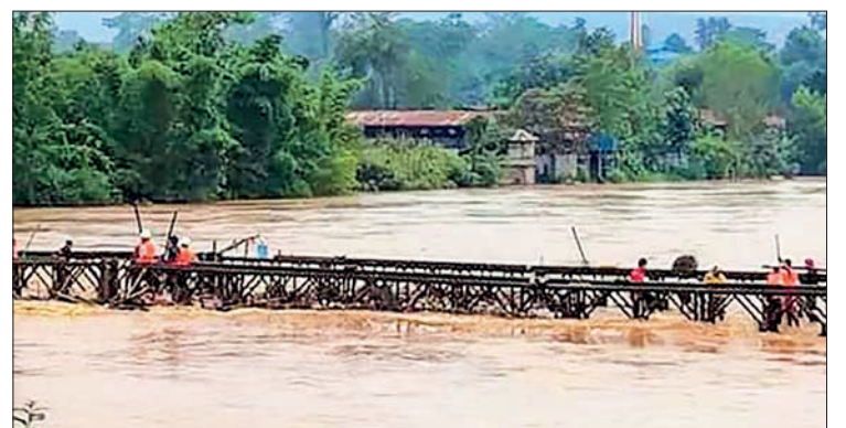
Myanmar Fire Brigade members are pictured carrying out rescue measures against the flood.