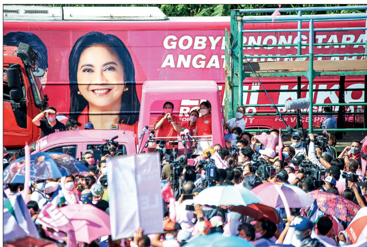
Philippine Vice-President and opposition presidential candidate Leni Robredo (C-with microphone) speaks from a truck during a campaign rally in the town of Libamanan, Camarines Sur province, south of Manila on 8 February 2022, as candidates hit the road for the start of the three-month long campaign season.

LENI Robredo was a neophyte congresswoman in 2016 when she came from behind to narrowly beat Ferdinand Marcos Junior for Philippines vice-pres-