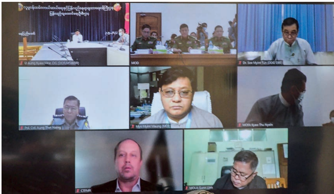
The videoconferencing meeting between CPRCS and CTFMR in progress.

A virtual coordination meeting between the Committee on Prevention of Recruitment of Child Soldiers (CPRCS) and the Country Task Force on Monitoring and Reporting (CTFMR) was held yesterday morning at the Ministry