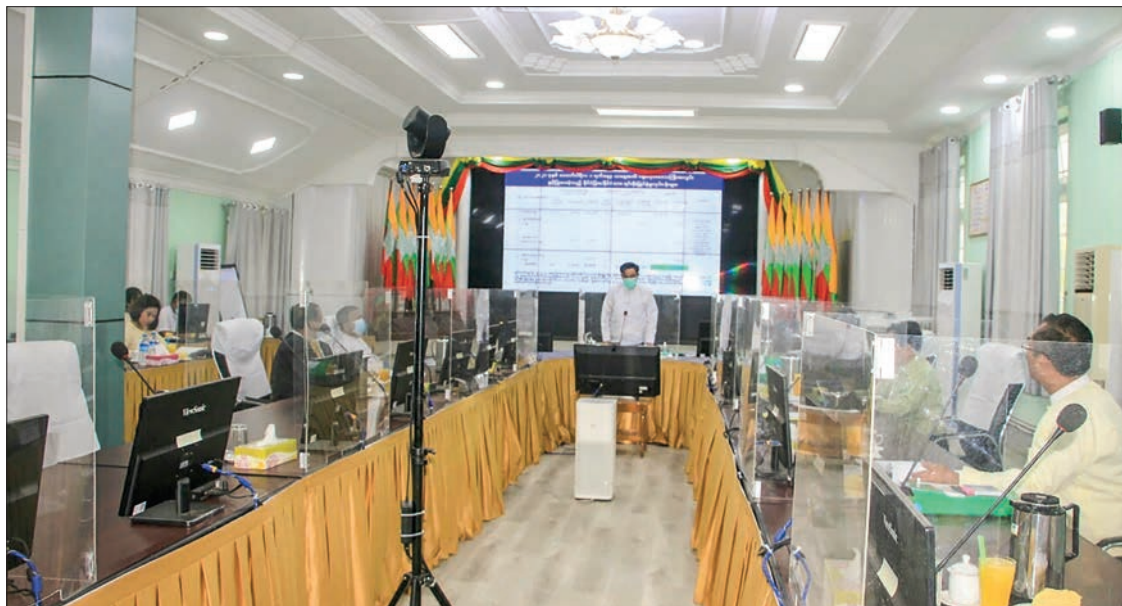
The meeting of the Bago Region Investment Committee in progress on 2 May 2022.

At the BRIC's meeting held on 2 May, Bago Region Chief Minister U Myo Swe Win said that Bago Region mainly depends on agriculture and livestock. As the region has abundant raw materials to produce natural fertilizer, the chief minister urged BRIC to invite investment in fertilizer plants. Next, energy infrastructure is essential in manufacturing industries