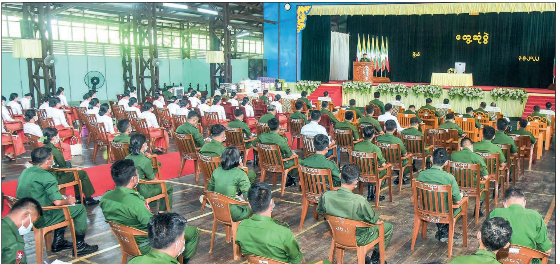
State Administration Council Vice-Chairman Deputy Commander-in-Chief of Defence Services Commander-in-Chief (Army) Vice-Senior General Soe Win meets service members, families and trainees in Myeik Station on 3 May 2022.

THE correct administration system will affect welfare and then gain good morality, which is important for success, said Vice-Chairman of the State Administration Council Deputy Commander-in-Chief of Defence Services Commander-in-Chief