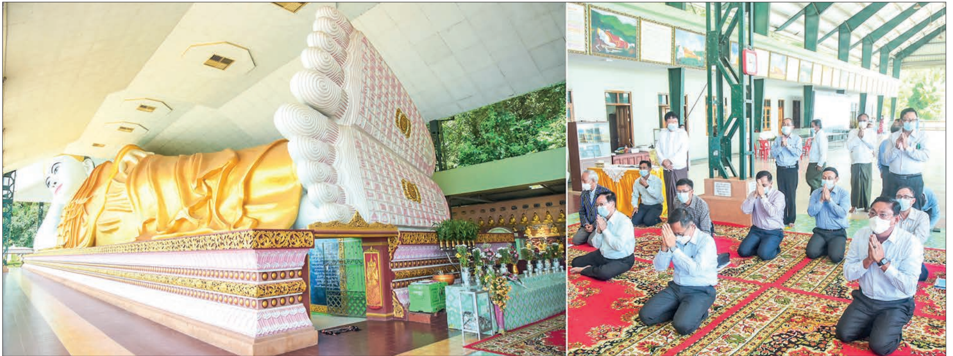
The Vice-Senior General and party kowtow the Atularanthi Shwethalyaung reclining Buddha image on Pahtet Hill yesterday.