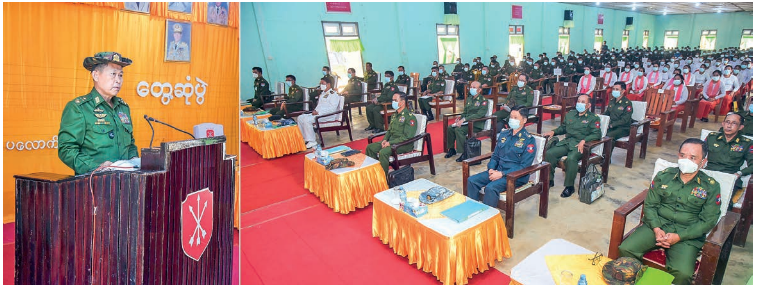
The Vice-Senior General meets service members, families and trainees in Palauk Station in Taninthayi Region yesterday.