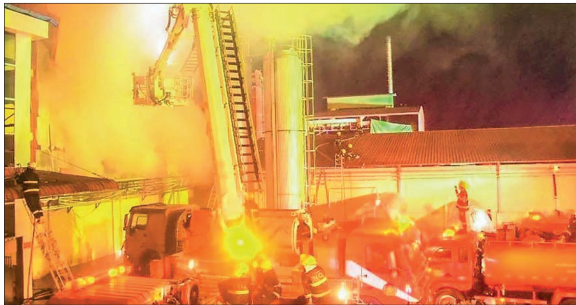
Myanmar Fire Brigade members are seen fighting to put out the fire.

was designated on 5 May 1946 to commemorate the establishment date of the Myanmar Fire Brigade. Myanmar marks Fire Service Day every year.