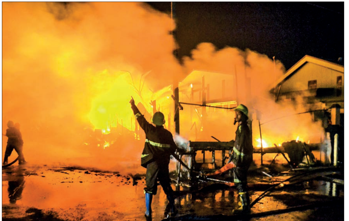
Firefighters are pictured extinguishing the fire in the Hlinethaya Industrial Zone.

There has been evidence of Myanmar's fire preventive activities since the Bagan Dynasty in 1044 AD. King Anawrahta (reigned 1044-1077 AD) was a noble King acquiring martial arts skills and a heart of gold. He was sagacious enough to take preventive measures against fire hazards. The history of Myanmar's fire service began in the King Anawrahta era. About 663 fire service crews were appointed to take fire safety measures in the palace. They gave a warning to the people by hitting a gong for the time limit of fire in use. Onomatopoeic words for the resonant and echoing sound of the gong (Thaw Thaw Nyan Bagan Mee Saw Maung) were noted from the duties of the fire service crew in the palace.