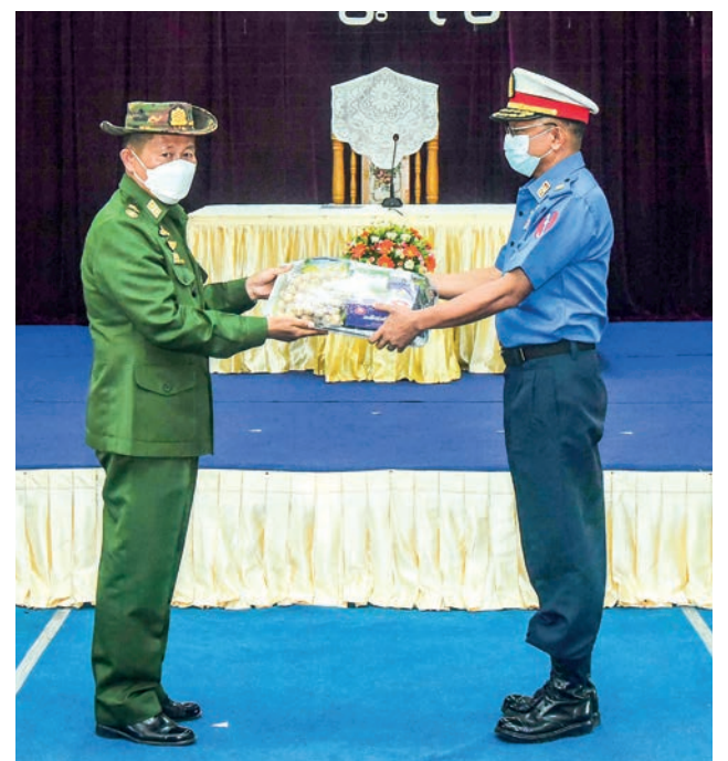
The Vice-Senior General presents foodstuffs to service members and families in Myeik, Palauk and Heinze stations (from left to right), respectively.