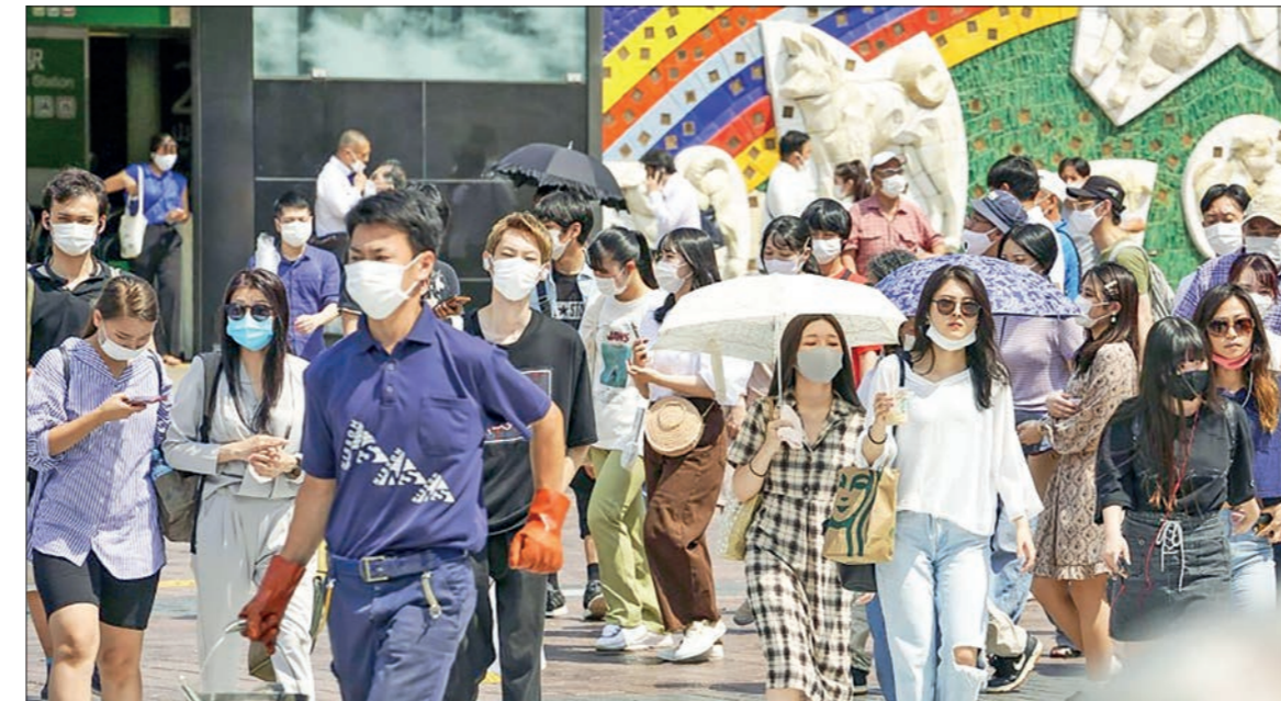
People wearing face masks due to the coronavirus pandemic walk in the summer heat in Tokyo's Shibuya area on 12 August 2020.

Gov. Shinji Hirai called for reviewing measures taken so far to prevent COVID-19, revealing that he has been publicly stressing that masks are unnecessary as long as enough distance is maintained