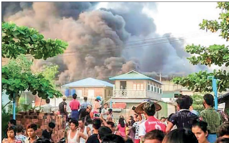
File photo shows the fire on the garment factory in the Shwelinpan Industrial Zone.

It is noted that the history of firefighters began in ancient Rome under the rule of Augustus in the 3 rd Century. It was said