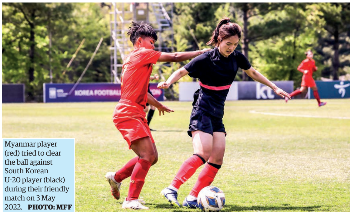
Myanmar player (red) tried to clear the ball against South Korean U-20 player (black) during their friendly match on 3 May 2022.

THE Myanmar women's team, taking training in South Korea in preparation for the 31st SEA Games, played their third friendly match in South Korea against the South Korean U-20 women's team on 3 May.