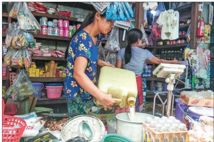
The domestic consumption of edible oil is estimated at one million tonnes per year. The local cooking oil production is just about 400,000 tonnes.

ACCORDING to the Supervisory Committee on edible oil import and distribution under the Ministry of Commerce, the price of palm oil spiked following the prices in the world's palm oil-producing countries.