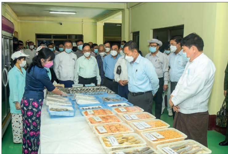
The Vice-Senior General looks into the marine products.

They also viewed around the self-reliant dockyard and fish and shrimp lakes of the company.