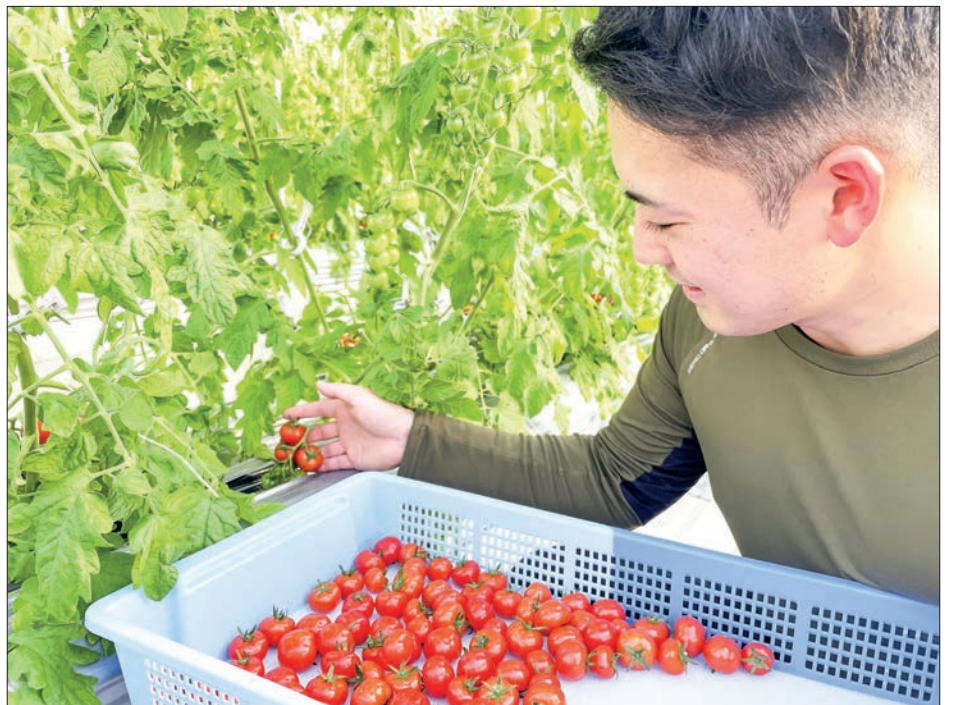
Undated supplied photo shows H.I.S. tomatoes being picked at a farm in Saitama Prefecture. PHOTO: KYODO

At each location, the H.I.S. unit will introduce farming experience tours to provide an in-person experience of cultivation and harvesting. It is considering offering its fresh produce at theme park Huis Ten Bosch, operated by the parent firm in Nagasaki Prefecture in southwestern Japan.—Kyodo