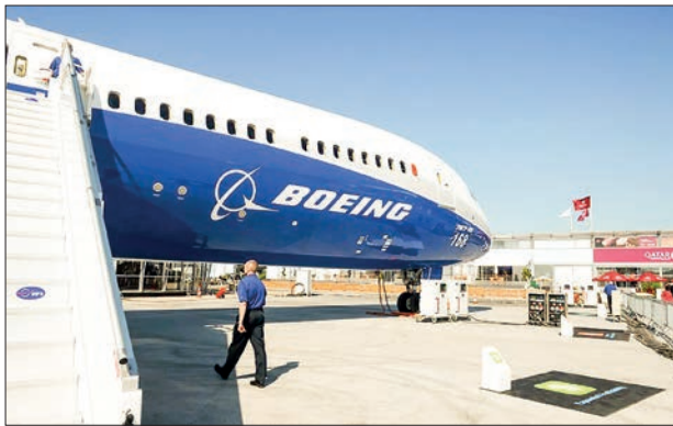
The Boeing 2021 Commercial Market Outlook projects that through 2040 there will be demand of more than 43,500 new airplanes valued at 7.2 trillion dollars.

BOEING Capital Corporation, a wholly-owned subsidiary of the Boeing Company, on Monday re-