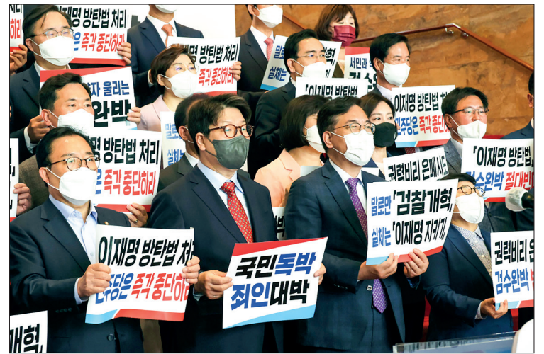
Lawmakers of the main opposition People Power Party chant during a sit-in protest held Wednesday in the National Assembly in Seoul on 27 April. The party is hoping to block a bill pushed by the Democratic Party of Korea that would strip the prosecution of its investigative power.

The outgoing president will be holding his final Cabinet meeting later in the day, at which he is expected to announce the bill's passing. Once he does this, the bill will take effect in four months. — Kyodo