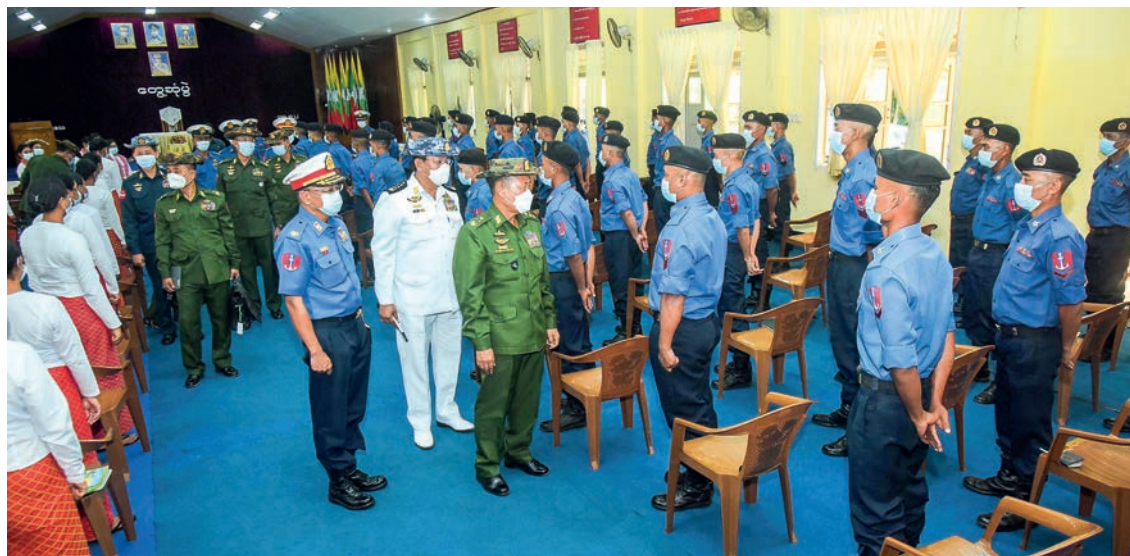
The Vice-Senior General is pictured cordially greeting service members, families and trainees.

stressed that the Prime Minister set 2022 as the Year of Peace with an invitation to hold the peace talks. As peace is essential for holding a free and fair election, the Head of State invited all to convene the peace talks.