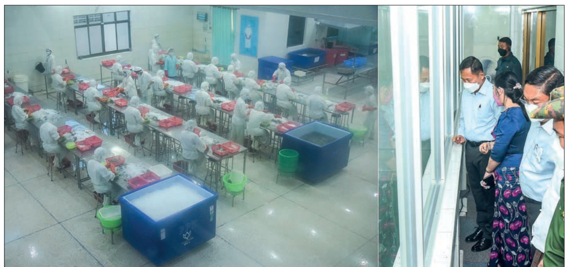
The Vice-Senior General views the packing process of fish and shrimp at the cold storage.