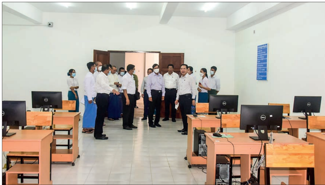
The donated computers are seen at the Community Centre in Bahan Township.

THE donation ceremony of computers and printers to the public libraries by the Myanmar Chinese Cooperation and Communication Centre and China