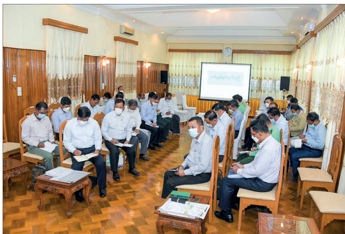
State Administration Council Chairman Prime Minister Senior General Min Aung Hlaing meets departmental personnel of PyinOoLwin district and township in Mandalay Region on 18 April 2022.

S TATE Administration Council Chairman Prime Minister Senior General Min Aung Hlaing met departmental officials of PyinOoLwin district and township of Mandalay Region to discuss development programmes at the government's guesthouse in PyinOoLwin Township yesterday.