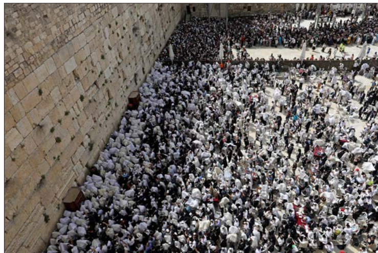
Jewish worshippers take part in the Cohanim prayer (priest's blessing) during the Passover holiday at the Western Wall in Jerusalem's Old City on 18 April 2022.

ISRAELI Prime Minister Naftali Bennett is working to hold his fractious coalition together after a split on the right and an Arab-Israeli party's threat to quit over violence in Jerusalem.