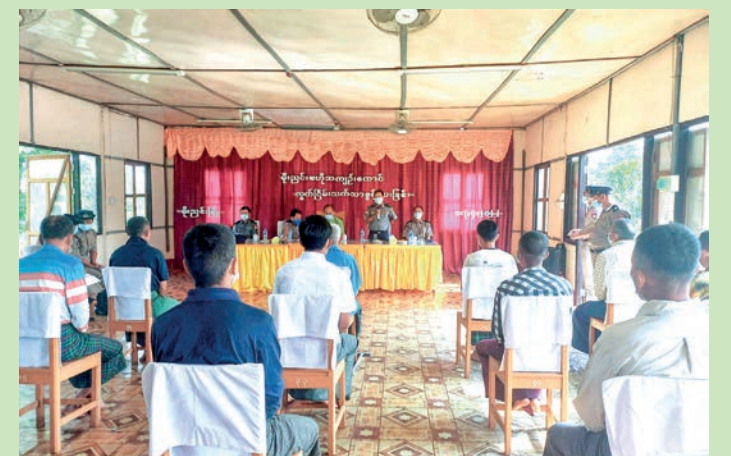
Mohnyin Central Prison officials give talks before releasing 20 prisoners.

The Mohnyin Central Prison provided them with food and travel expenses.