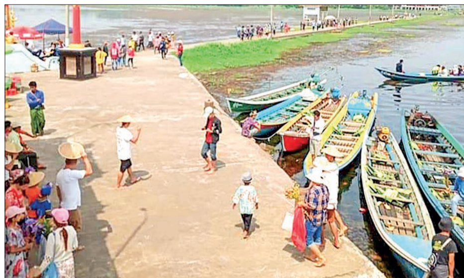
OVER 5,000 people visited Shwemyintzu Indawgyi Pagoda located in the Indaw-