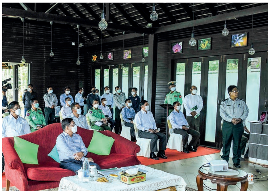
The Senior General hears the report on the data of the garden made by the director-general of the Forest Department.

Then, the Senior General and party visited the Governor House. He viewed around the Governor House compound and instructed the necessary things to ensure a picturesque place. — MNA