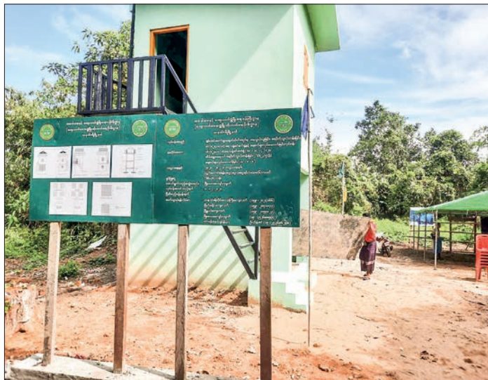
One of the rural roads and bridges in Myeik District.

THE Department of Rural Development in Myeik District, Taninthayi Region, is implementing rural development projects in 126 villages in the 2022-2023 Financial Year.