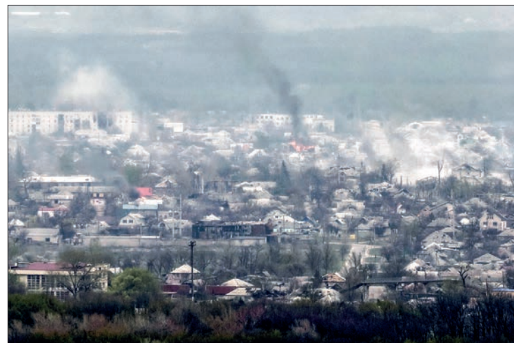
A photograph taken from Novodruzhesk village, shows smoke rising in Rubizhne city, on 18 April 2022, on the 54 th day of the Russian invasion of Ukraine. A series of “powerful” Russian strikes on military infrastructure in Lviv on 18 April 2022, left several dead and ignited blazes in the west Ukraine city that has been spared fierce fighting.

RUSSIAN troops on Monday captured the east Ukraine town of Kreminna, local authorities said, as Kyiv's armed forces launched salvos on Russian forces in the nearby settlement of Rubizhne.