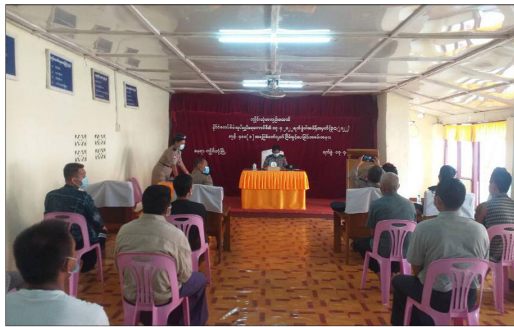
The Kengtung Prison releases 12 prisoners.

UNDER the pardon order granted by the Chairman of the State Administration Council, 12 prisoners from the Kengtung Prison were systematically released on 17 April. Of them, one prisoner was a foreigner.