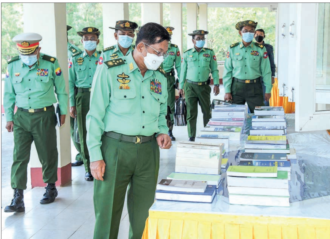
The Senior General views the teaching materials and legal books.

The Senior General and party also inspected teaching materials, legal books, and libraries. — MNA