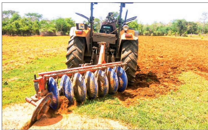
The department targets to grow 20,274 acres of sesame in summer.

ACCORDING to the Department of Agriculture, a total of 20,274 acres of summer sesame crops is projected in Minbu (Sagu) Township, Magway Region, to have the edible oil self-sufficiency.