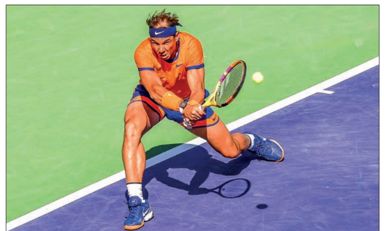
(FILES) In this file photo taken on 20 March 2022 Rafael Nadal of Spain hits a backhand return to Taylor Fritz of the US in their ATP Men's Final at the Indian Wells tennis tournament in Indian Wells, California.

The 35-year-old missed last week's Monte Carlo Masters and the Barcelona Open, cur-