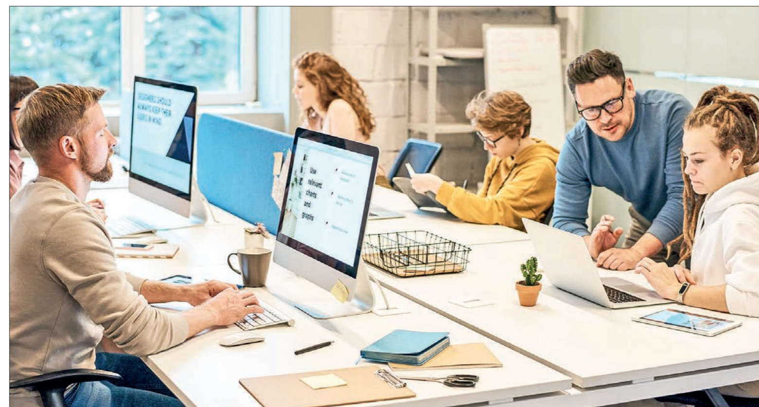
The study sought to shed further light on the phenomenon of 'presenteeism' — defined by the researchers as continuing to work when experiencing ill-health.