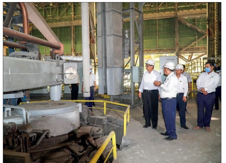
The MoI Union Minister views around the No 1 Steel Mill (Myingyan).

Then, Union Minister Dr Charlie Than discussed the detailed process of business plan and project management drawing, made a tour to Melt Shop 1 of steel smelting work, and encouraged staff. — MNA