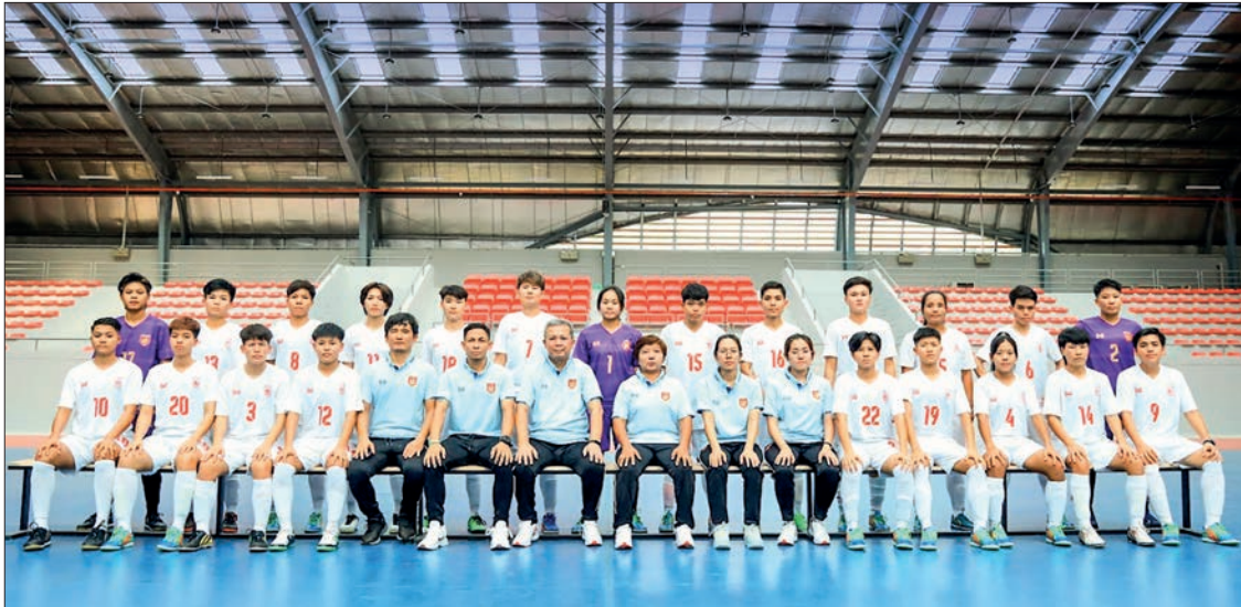
Myanmar Women's Futsal Team pose for a group photo with the Team administrators.