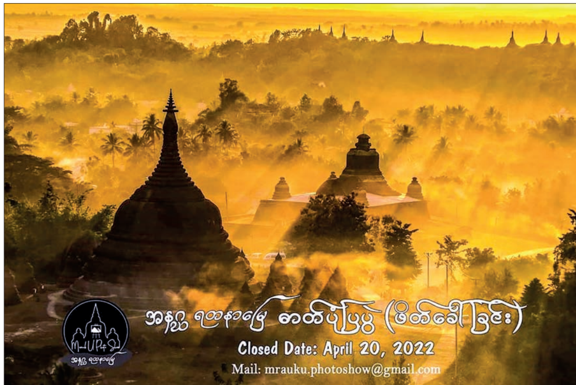
Photo exhibition on MraukU ancient city to be held for World Heritage status

Sd/Min Aung Hlaing Senior General Chairman State Administration Council