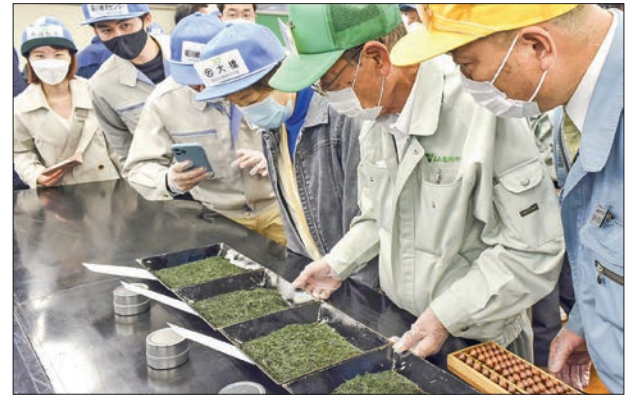
The season's first auction for the first harvest of Japanese green tea is held on 18 April 2022, at a market in Shizuoka Prefecture, a major green tea production area in Japan.

The Shizuoka Japanese Tea Market reported that as of 8:10 am, the trading volume of Shizuoka-grown green tea was 1,732 kilogrammes, with an average per-kilogramme price of 5,027 yen.—Kyodo