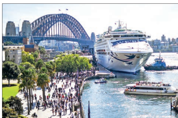
The Pacific Explorer makes its way to dock at the overseas passenger terminal on Sydney Harbour on 18 April 2022, as Australian authorities lifted a ban on cruise ships after relaxation in Covid 19 restrictions.

Crowds gathered at the base of the Sydney Harbour Bridge to watch the arrival of the ship, which began its 18,000-kilometre (11,000-mile) journey back to Aus-