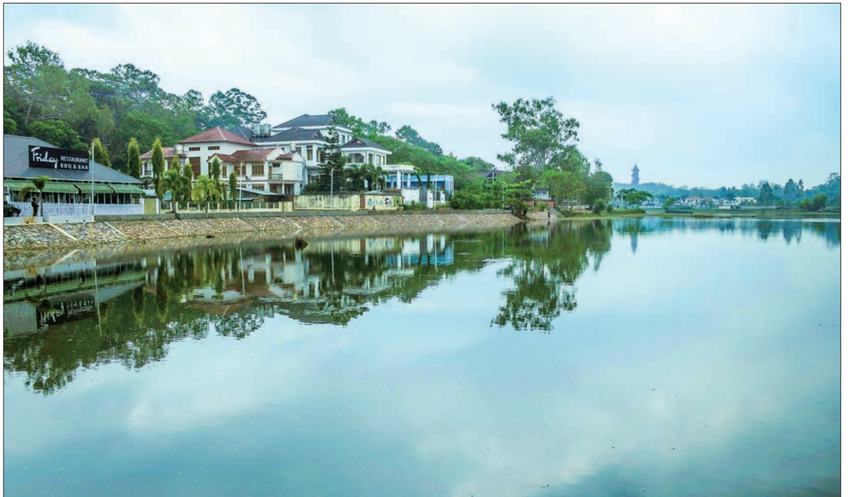
State Administration Council Chairman Prime Minister Senior General Min Aung Hlaing looks around the National Kandawgyi Garden in PyinOoLwin on 18 April 2022.

S TATE Administration Council Chairman Prime Minister Senior General Min Aung Hlaing, accompanied by SAC members, Union Ministers, Mandalay Region Chief Minister, senior military officers of Commander-in-Chief Office, Commander of Central Command and officials inspected the National Kandawgyi Garden and Governor House in PyinOoLwin Township yesterday.