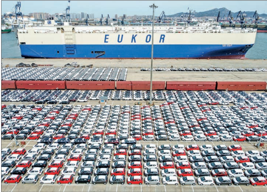
This aerial photo taken on 13 April 2022 shows cars that will be exported at Yantai port, in China's eastern Shandong province.

ASIAN stocks closed lower on Monday in cautious trade, as figures showed China's economic growth accelerated in the first quarter of the year, but the government warned of "significant challenges" ahead.