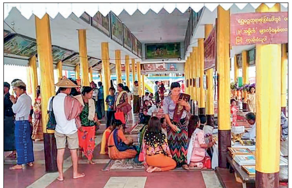
Pilgrims and visitors are seen at the Shwemyintzu Indawgyi Pagoda.