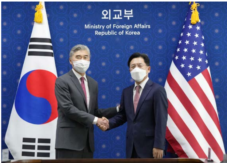
Sung Kim (L), US special representative for North Korean affairs, and his South Korean counterpart Noh Kyu Duk hold talks in Seoul on 18 April 2022.

THE United States and South Korea will respond strongly if North Korea conducts another nuclear test, their special envoys warned Monday, as the two countries began joint military exercises despite protests from the North that they should be canceled.