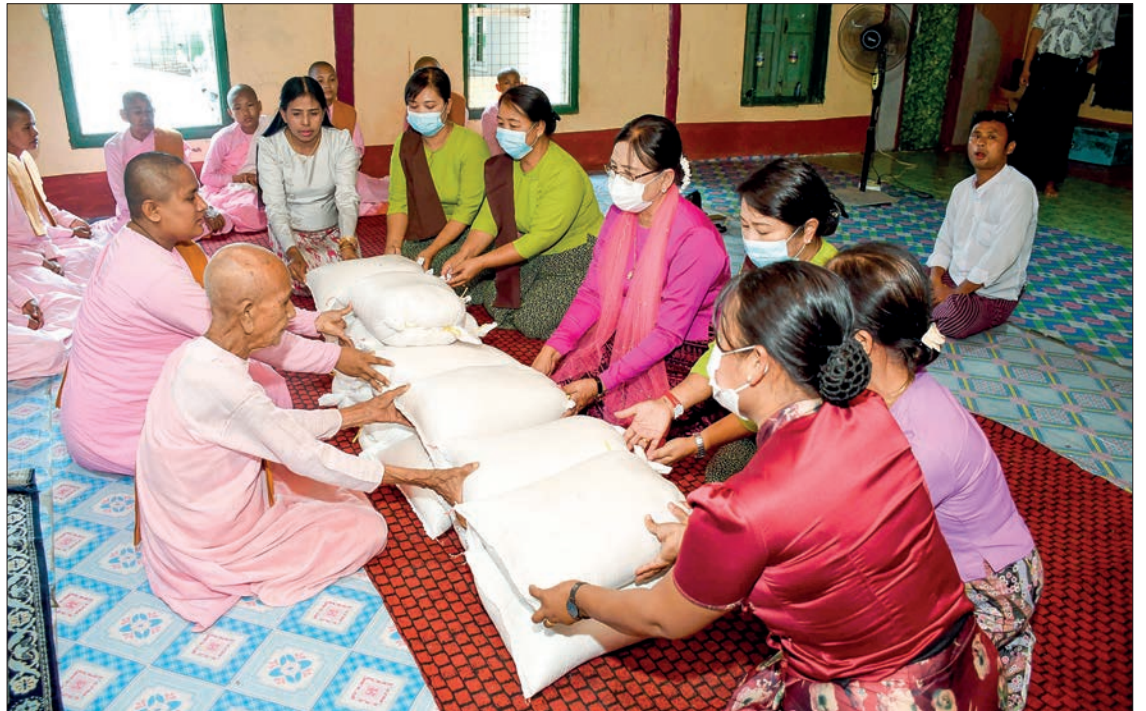
Rice bags are donated to the nuns in Sittway, Rakhine State.

The SAC member and party also paid homage to the Presiding Sayadaw of the Ashin Nyana Sakka Seikta Thukha Kamahtan Monastery and donated offerings.