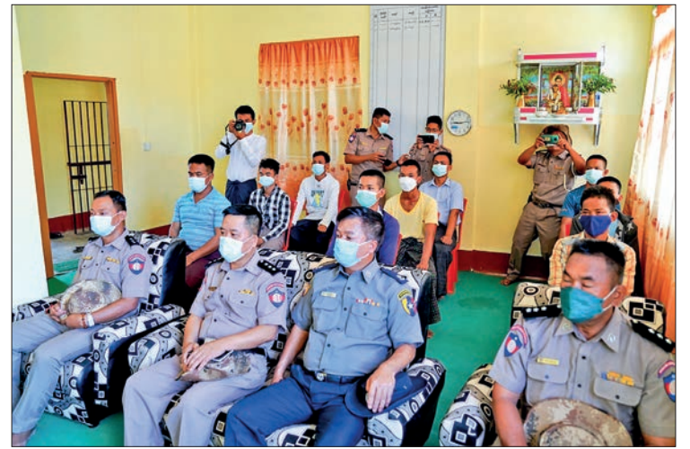
The Magway Central Prison frees nine prisoners.

travel expenses, amnesty certificate, labour benefits. In Magway Region, nine prisoners from the Magway Central Prison, one from the Thayat Prison, four from the Pakokku Prison and two from the Koepin Agriculture and Vocational Training camp. Sixteen prisoners were released under the pardon order. — Maung Nyinya/GNLM