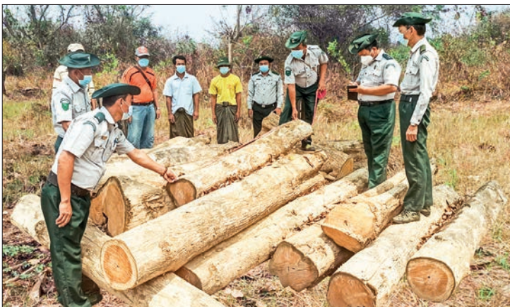
Officials confiscate illegal teak logs.

UNDER the supervision of the Anti-illegal Trade Steering Committee, action is being taken against illegal trades under the law. On 11 April, 40,924 kilograms of raw jade (estimated value of K240,514,480) from three vehicles parked near the