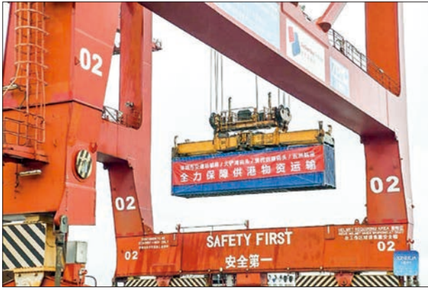
A container carrying supplies for Hong Kong is loaded onto a ship at Dachanwan wharf of Shenzhen port, south China’s Guangdong Province, 21 Feb 2022.

“Shocks emanating from the war in Ukraine and the sanctions on Russia are disrupting the supply of commodities, increasing financial stress, and dampening global growth,” said the World Bank’s newly released East Asia and Pacific Economic Update. “Just as the economies of East Asia and the Pacific were recovering from the pandemic-induced shock, the war in Ukraine is weighing on growth momentum,”