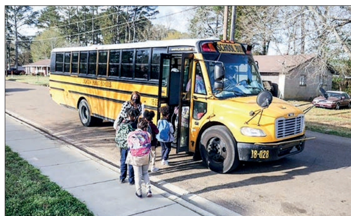
Children leave Wilkins Elementary school in Jackson, Mississippi, to use the bathroom at a neighbouring school because their school lacks the water pressure needed to flush the toilets.

"The distribution lines are aging, and a master plan for pipe replacement... is not being implemented," the US Environmental Protection Agency (EPA) wrote in a 2020 report.—AFP ■