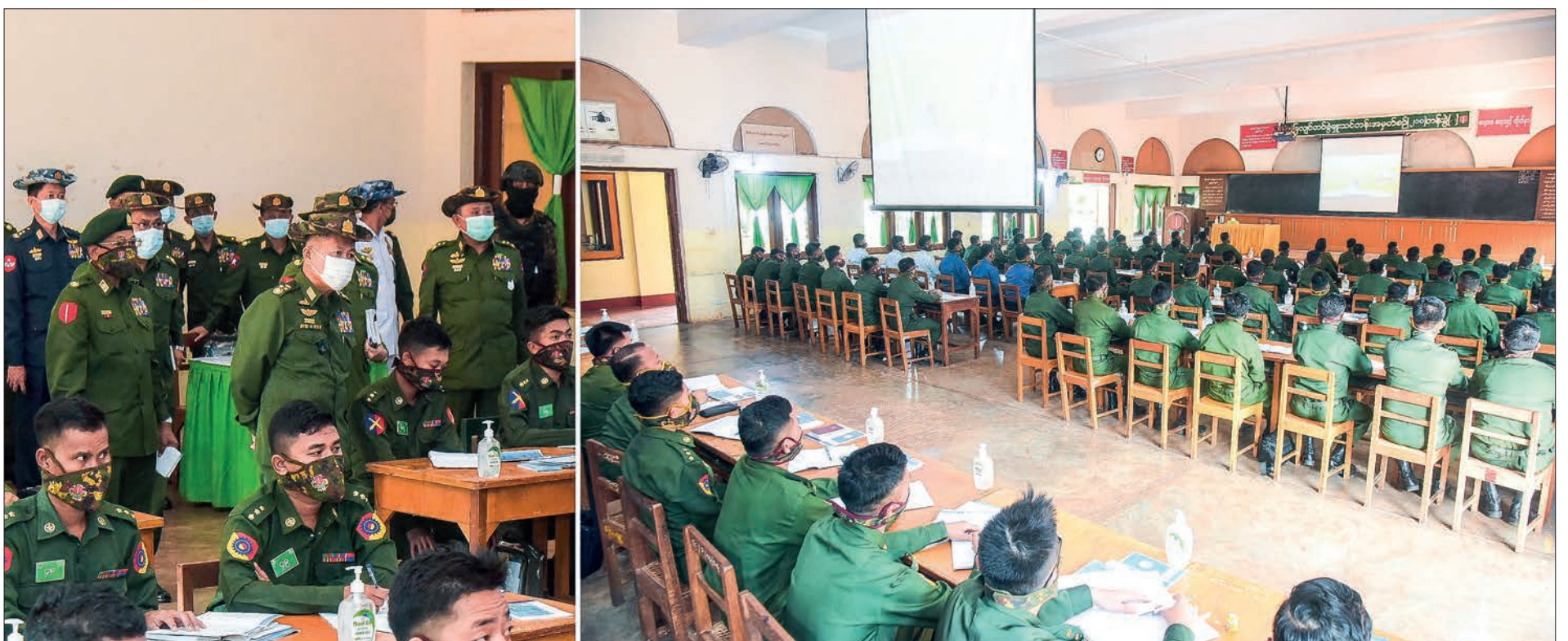
State Administration Council Vice-Chairman Deputy Commander-in-Chief of Defence Services Commander-in-Chief (Army) Vice-Senior General Soe Win inspects the Defence Services (Army) Combat Forces School in Bahtoo on 5 April 2022.

VICE-CHAIRMAN of the State Administration Council Deputy Commander-in-Chief of Defence Services Commander-in-Chief (Army) Vice-Senior General Soe Win inspected the Defence Services (Army) Combat Forces School (Bahtoo) yesterday morning.