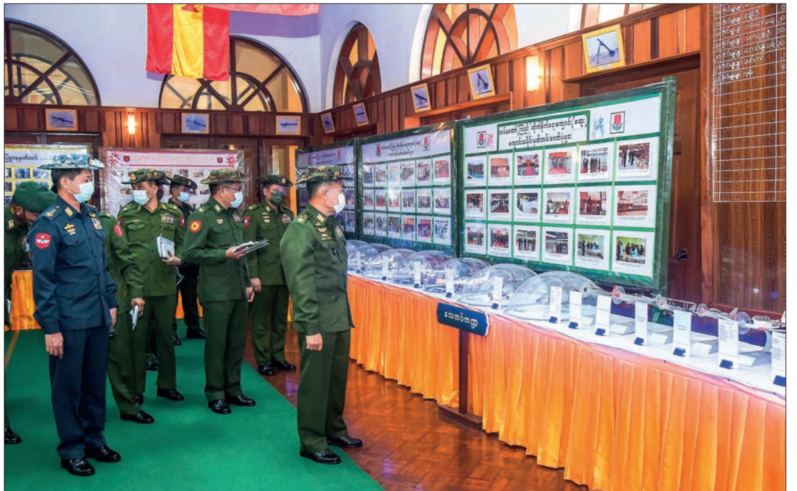
The Vice-Senior General look into the historical record photos of the Combat Forces School.

ordinates and families to serve the assigned duties conveniently. They all have to build mutual trust and understanding to supervise associates with goodwill.