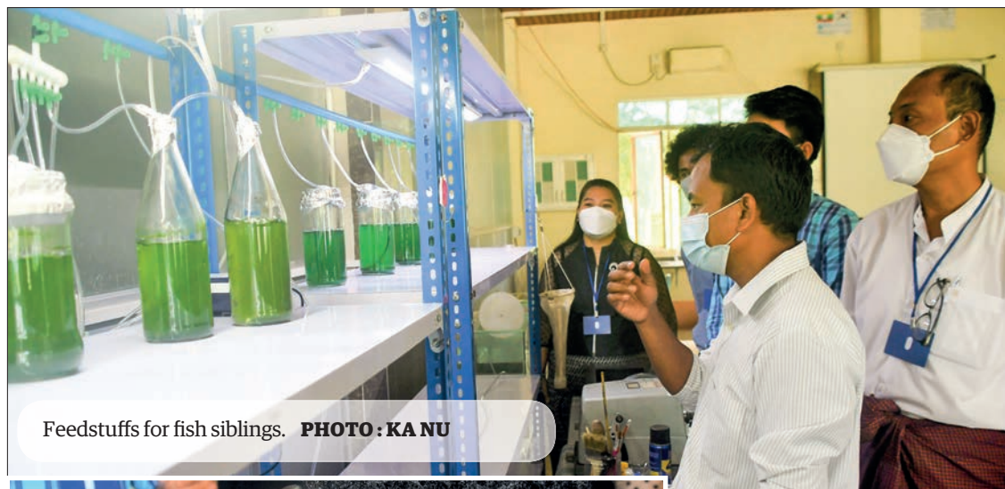
Feedstuffs for fish siblings.