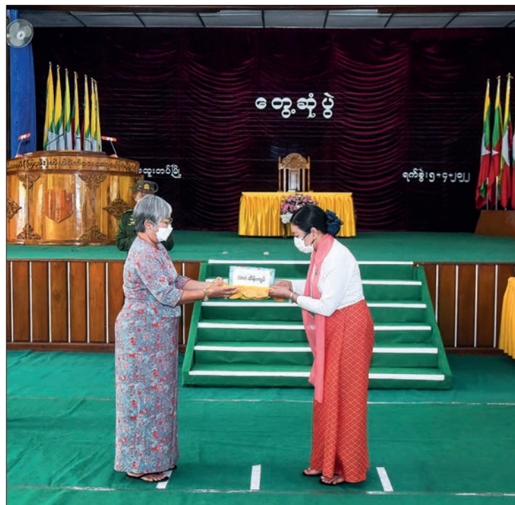
The wife of the Vice-Senior General gives cash assistance.