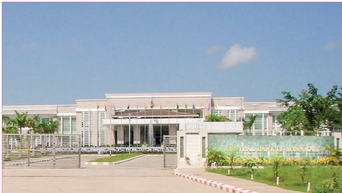
Central Bank of Myanmar (CBM).

According to the provisions stipulated in Sections 11, 12 and 13 of the Foreign Exchange Management Law, all the foreign currency earned by locals have to be exchanged for local currency at the CBM's reference rate of K1,850 by opening the accounts at the authorized dealers in the country within one working day, according to the notification released on 3 April.