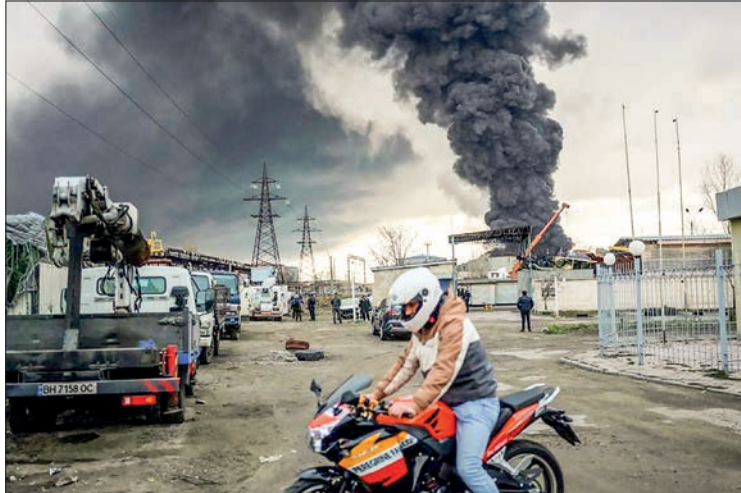
Smoke rises after an attack in Odessa.

The exceptional move by Japan of using a government plane to airlift foreign evacuees comes as people fleeing Ukraine face skyrocketing airfares since Russia's invasion of their homeland