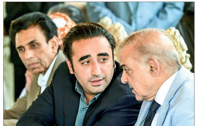
Bilawal Bhutto Zardari (left) chats to fellow opposition leader Shehbaz Sharif in Islamabad.

The move allowed Khan to get the presidency — a largely ceremonial role taken by a loyalist — to dissolve parliament and order an election, which must be held within 90 days. Had the vote taken place, Khan was certain to have been booted from office.