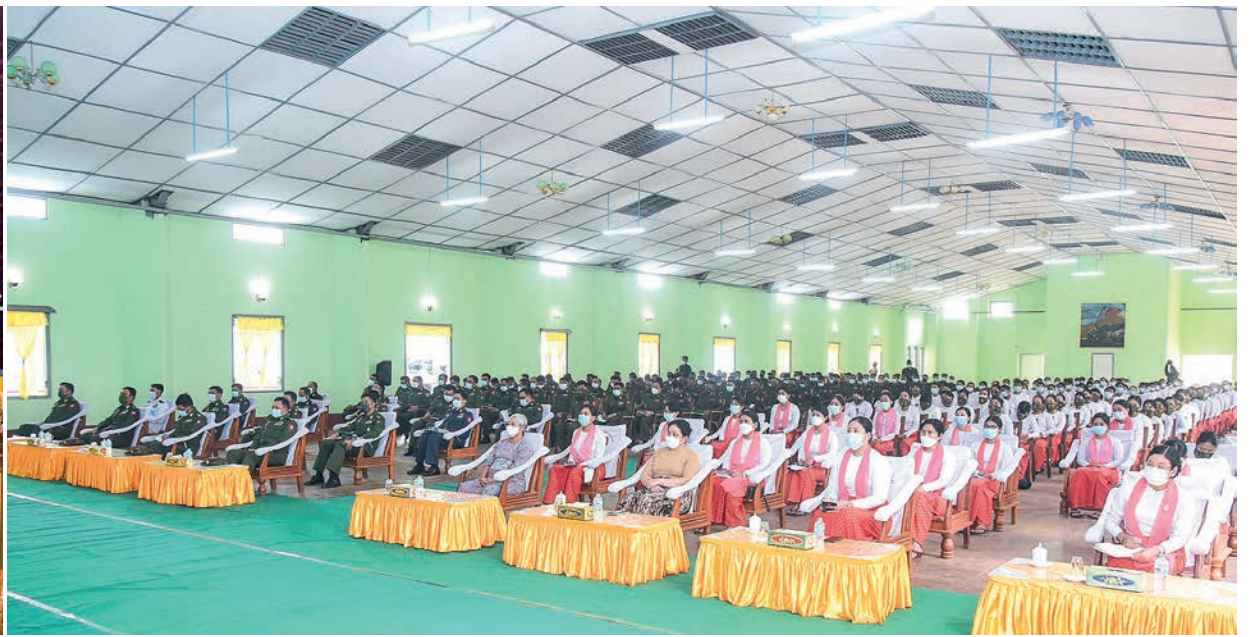
State Administration Council Vice-Chairman Deputy Commander-in-Chief of Defence Services Commander-in-Chief (Army) Vice-Senior General Soe Win meets the training instructors, officers, other ranks and family members at the Bahtoo Station yesterday.

THE defence strategy of the State is the people's militia strategy with all-inclusive of the entire people centring the Tatmadaw, so they all need to live in the harmonization of the people, said Vice-Chairman of the State Administration Council Deputy Commander-in-Chief of Defence Services Commander-in-Chief (Army) Vice-Senior General Soe Win in meeting with training instructors, officers, other ranks