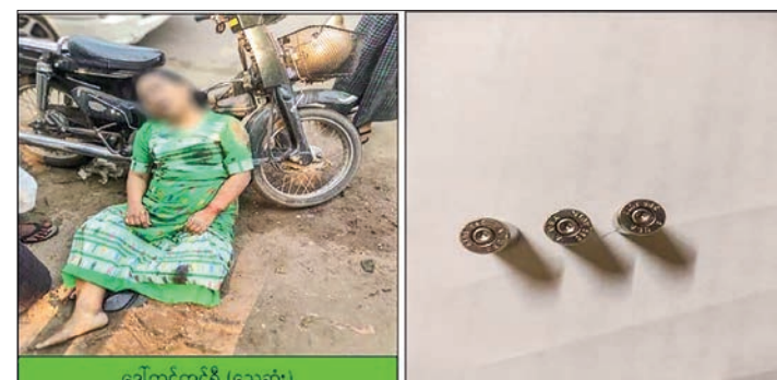
Deceased education officer.

The dead body was sent to the Pakokku District People's Hospital, and members of the security forces are conducting necessary investigations to take action against the perpetrators, according to the Myanmar Police Force. — MNA