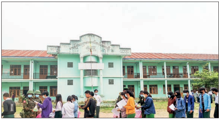
Katha Township, Sagaing Region