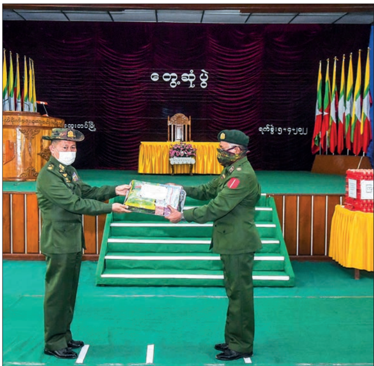
The Vice-Senior General presents foodstuffs.