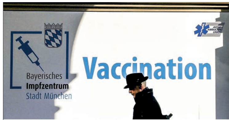
A man walks in front of a vaccination center in the city of Munich, southern Germany.

As a proposal to introduce mandatory jabs for over-18s was unlikely to win a majority in parliament, the government committee working on the plan has scaled down its ambitions to look at compulsory vaccinations for over-50s.—AFP ■