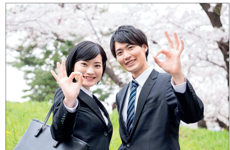
Image of new employees who joined companies on 1 April