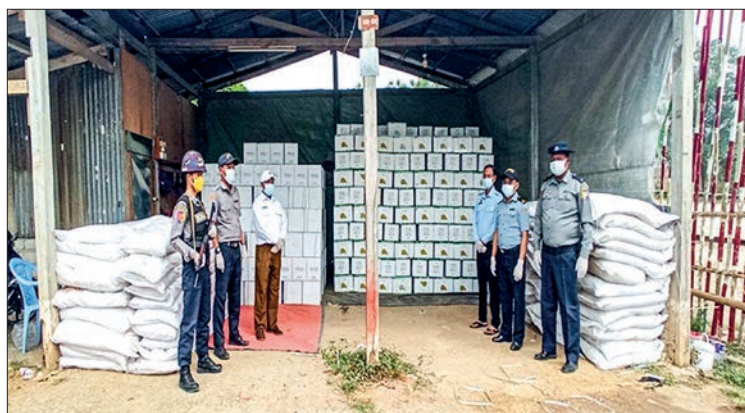
Officials confiscate illegal commodities.

MANAGED by the Anti-Illegal Trade Steering Committee, action is being taken against illegal trades under the law.