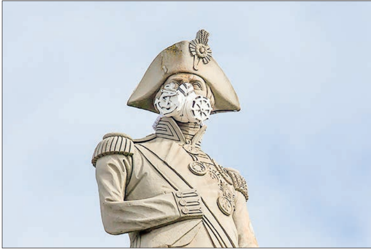
A nautical-themed breathing mask is fixed to Lord Nelson's statue at the top of Nelson's Column in Trafalgar Square, central London on 18 April 2016. The stunt was part of a series that were carried out across the capital by Environmental protest group Greenpeace by adding masks to famous statues, to highlight air pollution in the capital.

A full 99 per cent of people on Earth breathe air containing too many pollutants, the World Health Organization said Monday, blaming poor air quality for millions of deaths each year.