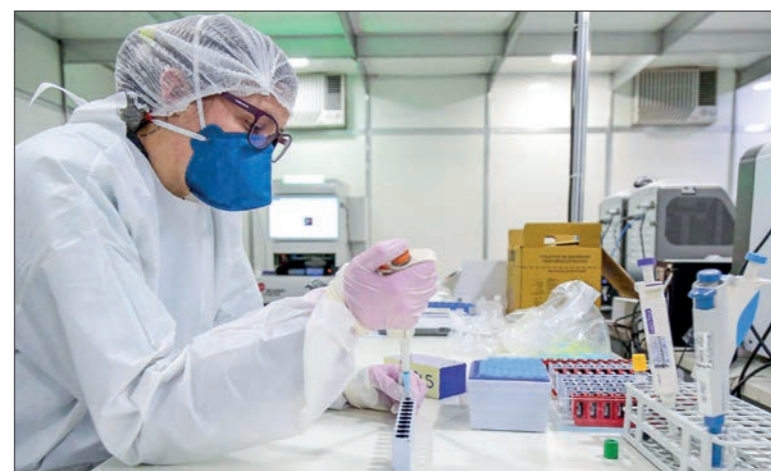
A health worker works with blood samples of COVID-19-infected patients in Sao Paulo on 1 July 2021.

RESEARCHERS have found that subjects infected with the SARS-CoV-2 virus displayed signs of severe brain inflammation and injury consistent with a reduction in blood or oxygen flow into the brain, neuron damage and small areas of bleeding.