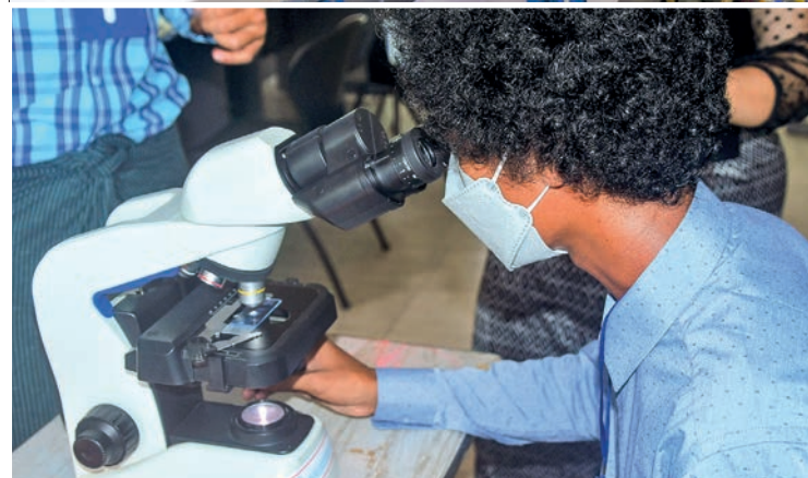
Microscopic check on the disease of fish/ shrimps.

THE Myanmar Fisheries Federation, the Aqua Myanmar and Fish/Shrimp Diagnostic Laboratory have taught the farmers the basics of fish/shrimp disease diagnosis and treatment for four days at the Myanmar Fisheries Federation in Yangon. The certificates of achievements were awarded yesterday evening.