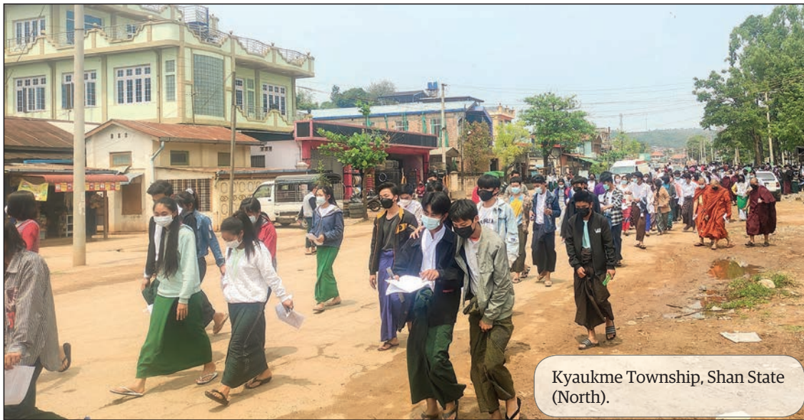
Kyaukme Township, Shan State (North).