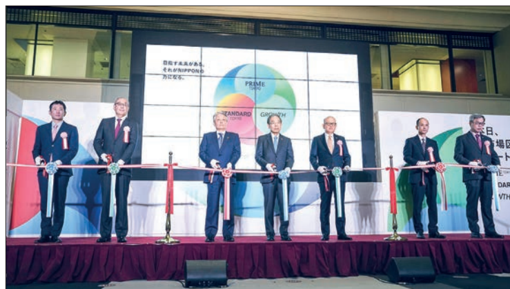
A ceremony is held at the Tokyo Stock Exchange to mark the reorganization of the market into three trading segments on 4 April 2022, a major reform aimed at imposing stricter listing standards and attracting more foreign investment.

THE Tokyo stock market was reorganized Monday into three trading segments in a major reform aimed at imposing stricter listing standards and attracting more foreign investment.