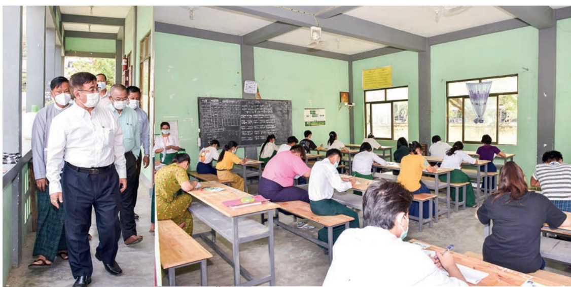
The MoE Union Minister and party views around one of the Mandalay exam centres.