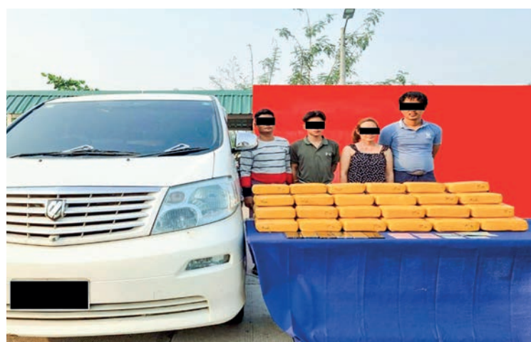
Four arrestees are seen along with seized drugs and a car.

They are prosecuted, and perpetrators are being investigated. — MNA