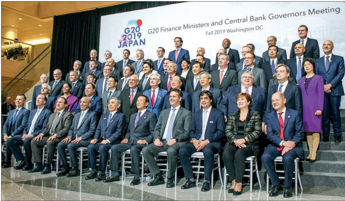
File photo shows finance chiefs and central bank governors from the Group of 20 posing for a photo in Washington in October 2019.

FINANCE chiefs from the Group of 20 economies have decided not to issue a joint statement after their 20 April meeting amid conflicts over Russia's participation