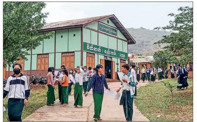
Pindaya Township, Shan State (South).