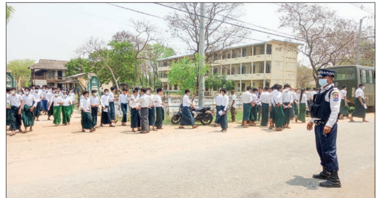
Taungdwingyi Township, Magway Region.