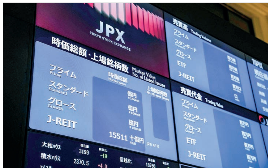
Trading begins under the new three-section format at the Tokyo Stock Exchange on 4 April 2022, a major reform aimed at imposing stricter listing standards and attracting more foreign investment.

However, expectations that rates will continue to go up have seen Treasury yields surge, with commentators saying there were warning signs that growth will slow as the year progresses. "It would not be surprising to see yields rise further from here and it is very hard to know where they will land," An-