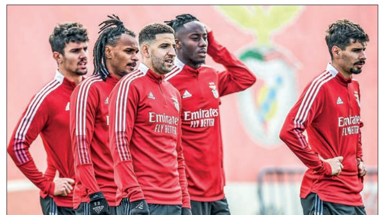
Benfica's players attend a training session at Benfica Campus training ground in Seixal near Lisbon on 4 April 2022, on the eve of their UEFA Champions League quarter final first leg football match against Liverpool.

belied a tumultuous season domestically for the club, who parted ways with Jorge Jesus as coach in December following a 3-0 defeat by Porto and just seven wins out from their first 15 matches. —AFP ■