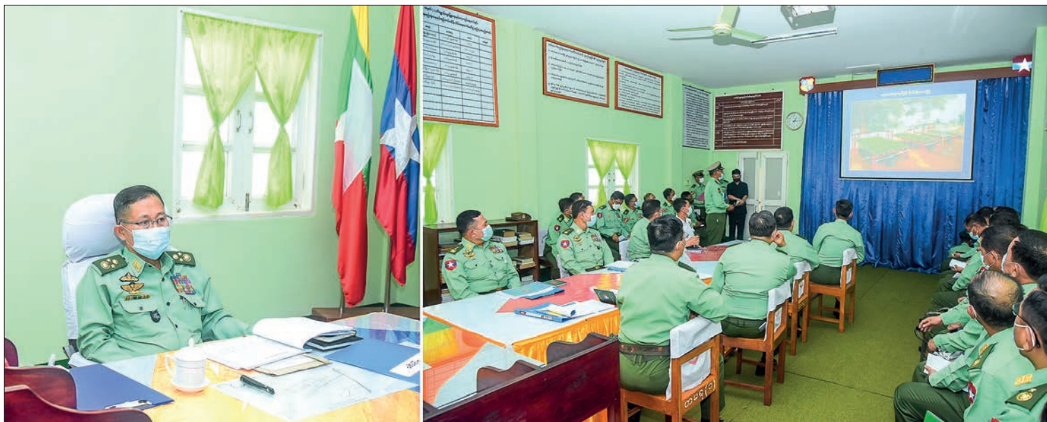
Vice-Chairman of the State Administration Council Deputy Commander-in-Chief of Defence Services Commander-in-Chief (Army) Vice-Senior General Soe Win hears the reports on implementing the assigned duties and operation of the model agriculture and livestock zone yesterday.

The Vice-Senior General viewed a round the establishment of 55-acre model agriculture and livestock zone of the battalion, cultivation of seasonal crops, thriving crops in the greenhouse, growing of Kyaukse-in tissue banana, breeding of DYL pedigree piglets, raising of layers in the air-conditioned