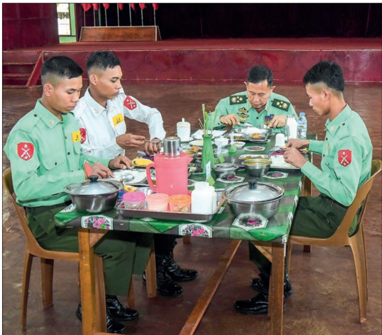
The Vice-Senior General is pictured in having lunch together with trainees.

to be loyal to the State in serving their duties to respond to some big countries and terrorist organizations that attempt to