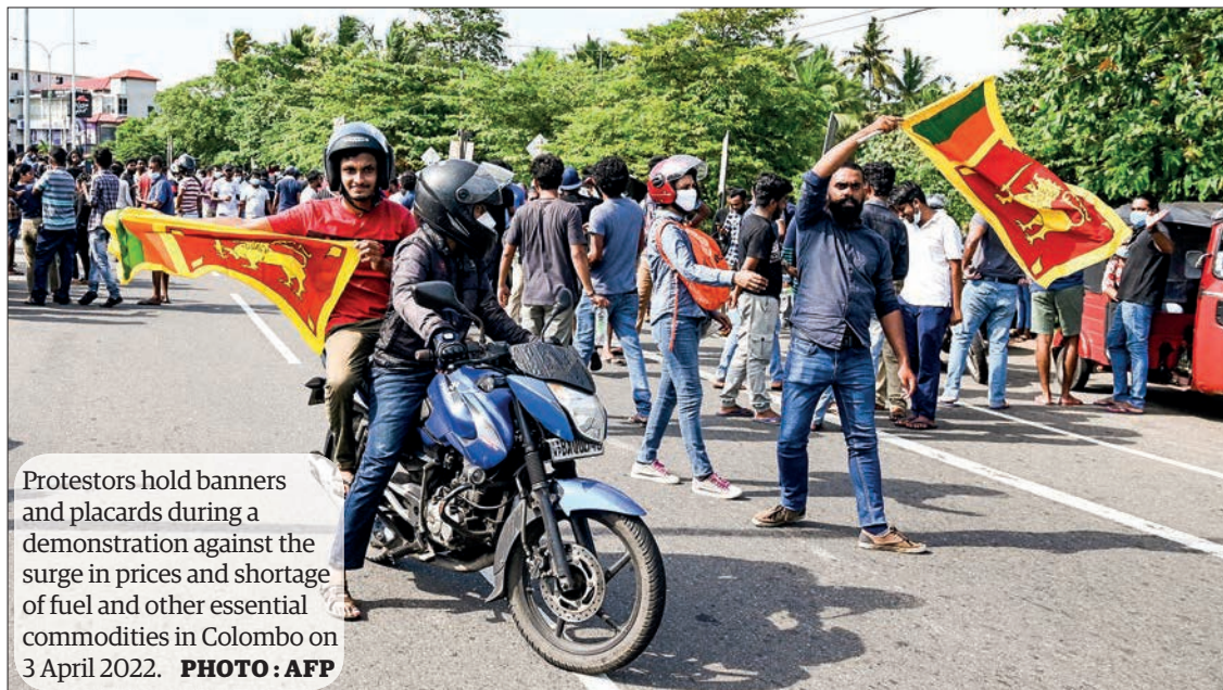
Protesters hold banners and placards during a demonstration against the surge in prices and shortage of fuel and other essential commodities in Colombo on 3 April 2022.

SRI Lanka’s embattled president offered to share power with the opposition on Monday as protests demanding his resignation grew over the worsening shortages of food, fuel and medicines.