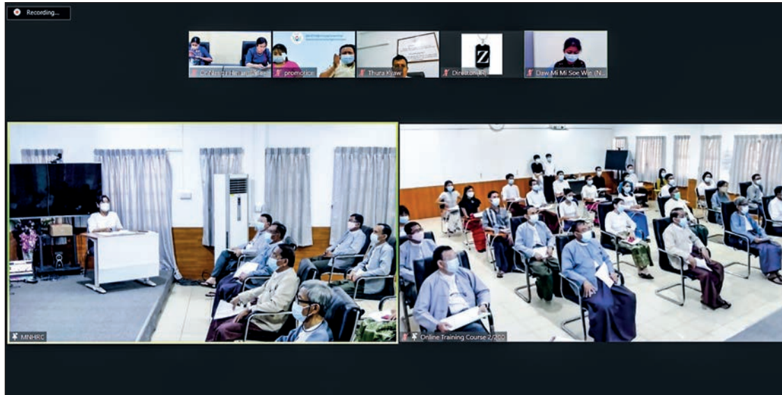
The MNHRC Inter-departmental Human Rights Awareness Training 2/2022 in progress.

of the commission office staff, the training aims to be professional staff who can support