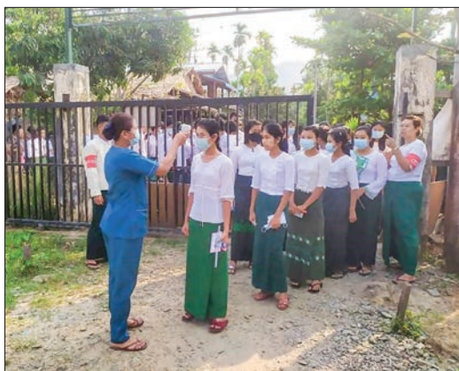
Thandwe Township, Rakhine State.