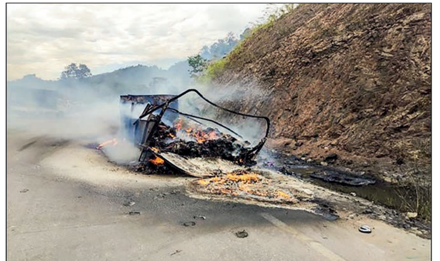
Ravages are seen in the aftermath of setting the car ablaze.

It is reported that officials from the respective regions and states visited the site and coordinated the necessary work. — MNA