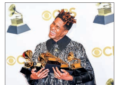
US singer Jon Batiste poses in the press room with his Grammys during the 64th Annual Grammy Awards at the MGM Grand Garden Arena in Las Vegas on 3 April 2022.

“I just put my head down and work on the craft every