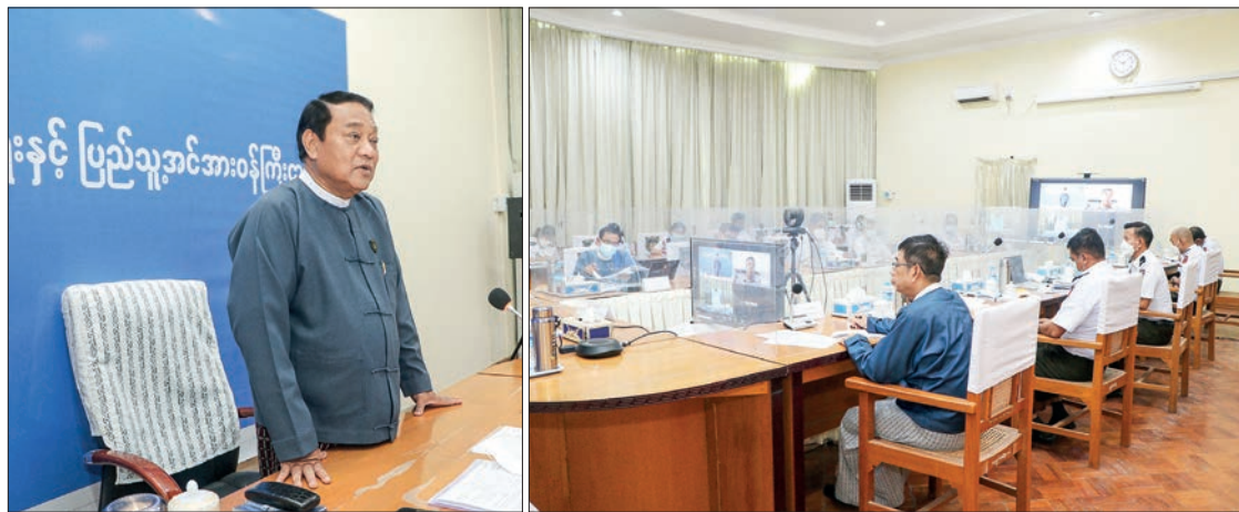
The MoIP Union Minister makes the speech at the meeting on the resumption of online e-Visa service.

First and foremost, Union Minister U Khin Yi of the Ministry of Immigration and Population stated that Myanmar is granting ordinary passport holders from 100 countries and China (Taipei) e-Visas for tourist purposes, and from 54 countries and China (Taipei) e-Visas for business. The COVID-19 outbreak stopped the service on 20 March 2020. As the COVID-19 situation is under control and the detection of the cases is dropping, international passenger flights are reportedly allowed to en-