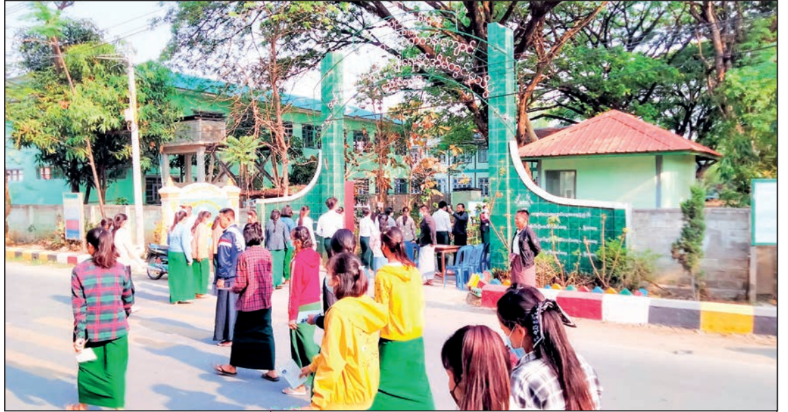
Nyaungshwe Township, Shan State (South).

On the fourth day of the exam, 227,746 students took the chemistry exam, accounting for 90.22 per cent, according to the Ministry of Education. —MNA