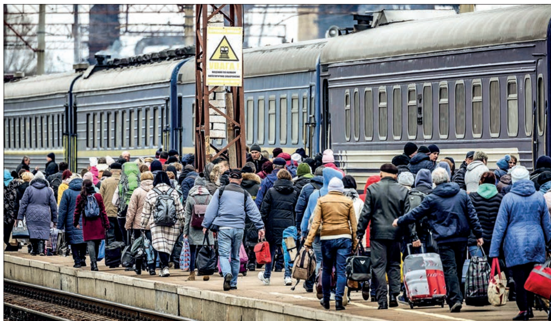
Families walk on a platform to board a train at Kramatorsk central station as they flee the eastern city of Kramatorsk, in the Donbas region on 4 April 2022, amid Russian invasion of Ukraine.

HUNDREDS wait for a train to take them west out of the path of the Russian advance at the station in Kramatorsk, the de facto capital of Ukrainian-controlled territory in Donbas.