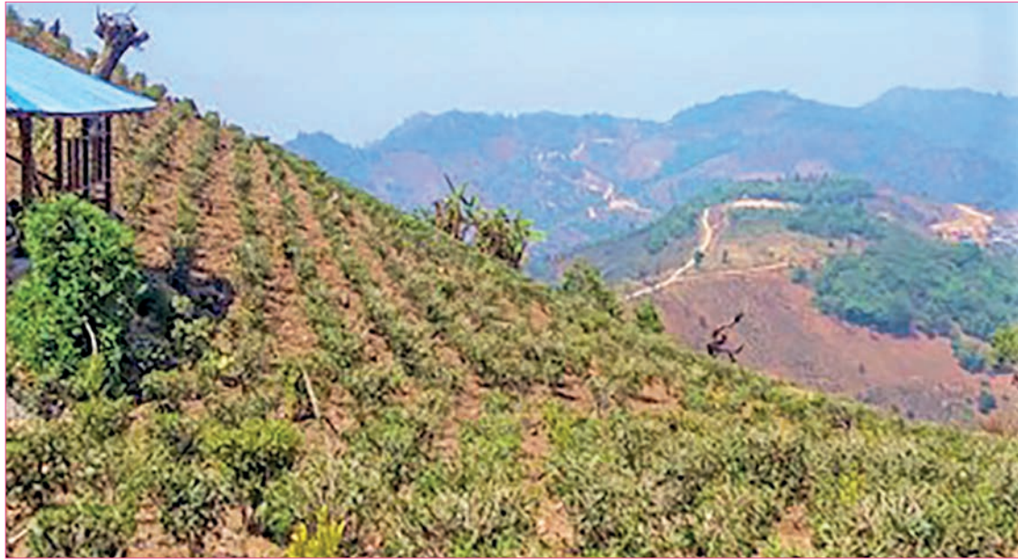
Northern Shan State produces fresh and dried tea leaf, while the southern state primarily focuses on dried tea leaf production. The perennial tea plants from the eastern and northern Shan State have earned a reputation for dried tea leaf quality.

Northern Shan State produces fresh and dried tea leaf, while the southern state primarily focuses on dried tea leaf production. The perennial tea plants from the eastern and northern Shan State have earned a reputation for dried tea leaf quality. The dried tea leaf from east Shan