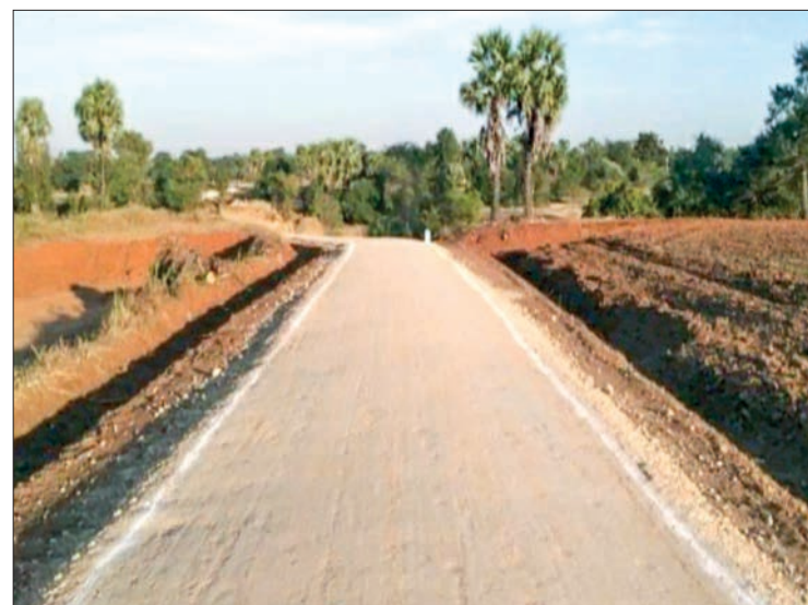
One of the rural road development projects in Mandalay Region.

The project will cover Patheingyi, Kyaukse, Myittha, TadaU, Ngazun, Taungtha, Mahlaing, Meiktila, Wundwin, Pyawbwe, Yamethin, and Kyaukpadaung townships in the 2022-2023 Financial Year.