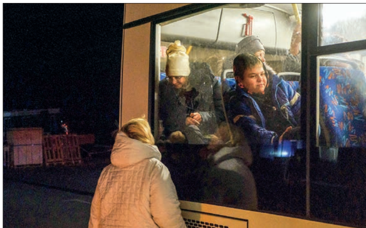
Children are seen through a bus window as a convoy of 30 buses carrying evacuees from Mariupol and Melitopol arrive at the registration centre in Zaporizhzhia, on 1 April 2022.

Russia and Ukraine have blamed each other for the difficulties encountered by recent evacuation attempts. — AFP ■