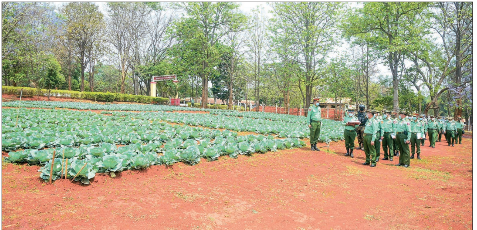
Vice-Senior General Soe Win views around the farm in the training school.

based on changes in time. The country has overcome the various challenges within one year through the cooperation of loyal personnel, security personnel and people. Although some big countries accuse the Tatmadaw of genocides by putting pressure, threat, interference and disturbance, the Tatmadaw will successfully overcome all challenges with united strength. Unity is a basic need for enabling an independent and sovereign country to stand tall. All Tatmadaw members must be healthy and fit to be able to face all difficulties. They have to follow the 60-military code of conduct for the proper lifestyle of disciplined living. Tatmadaw members are