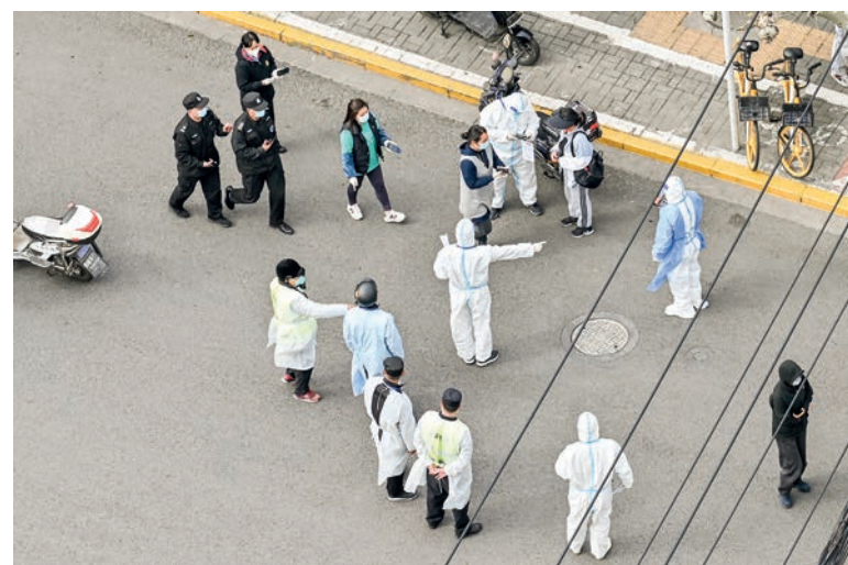
A health worker (C) wearing personal protective gear gestures to residents on a street during the second stage of a Covid-19 lockdown in Jing'an district in Shanghai on 1 April, 2022.

NEARLY all of Shanghai's 25 million residents were under stay-at-home orders on Saturday, as