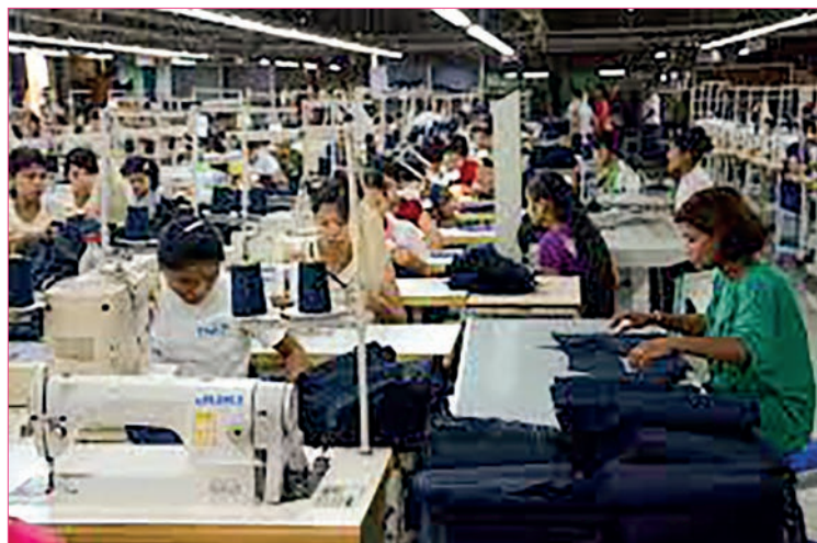
Female workers are seen at one of the CMP workplaces.

THE value of Myanmar’s imports between 1 October and 25 March of the past mini-budget period 2021-2022 (Oct-Mar) slightly narrowed to US$7.6 billion, which reflects a drop of $24 million compared to the year-ago period, the Ministry of Commerce’s data indicated.