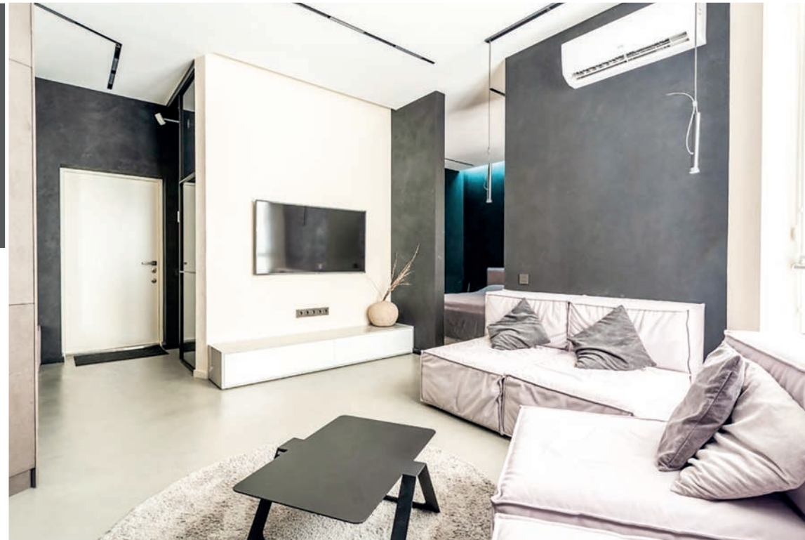
Far-UVC, which can efficiently inactivate pathogens, such as coronaviruses and influenza, in air.

In the past decade, many studies around the world have shown that far-UVC is both efficient at destroying airborne bacteria and viruses and safe for use around people. But until