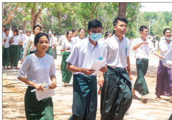
Htantabin Township, Yangon Region.