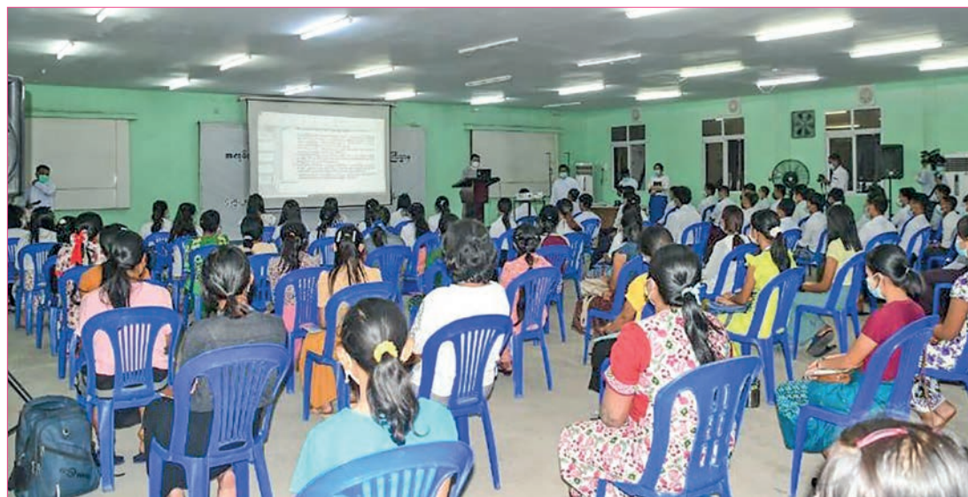
The MoL Union Minister and party inspect the training course for migrant workers who will work in foreign countries.

THE opening ceremony of the on-the-job refresher course to build the capacity of district/township officials of the Ministry of Labour was held yesterday morning in Yangon. The ceremony was attended by Union Minister for Labour U Myint Kyaing, Ethnic Affairs Minister of the Yangon Region Government U Saw Jacob Htoo, directors-general, trainers and trainees.