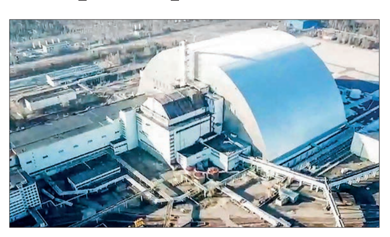
The defunct nuclear power plant still uses electricity to keep spent fuel at manageable, safe temperatures.

The IAEA said on Thursday the agency had been informed