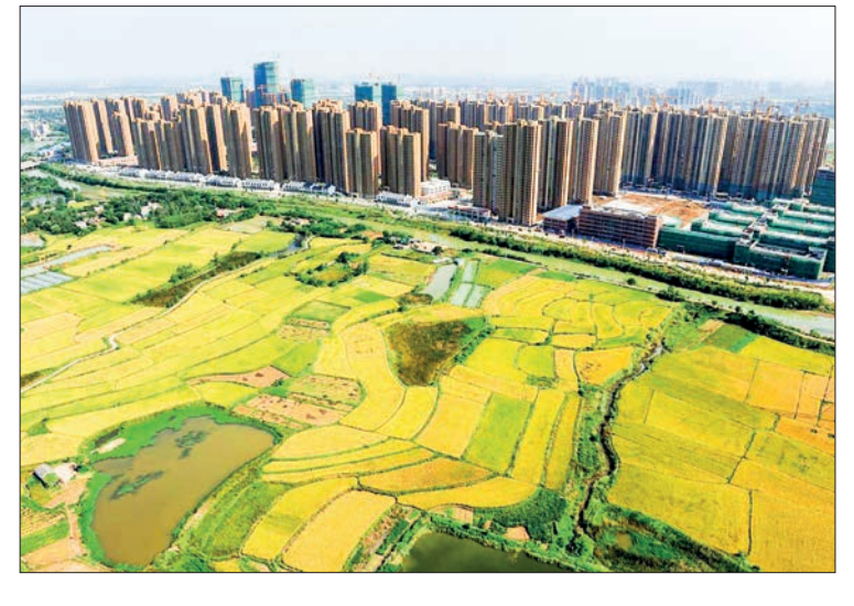
The world is developing at an unprecedented scale. Over the next 20 years, urban population in developing countries will double to four billion.

According to UN-Habitat, the award, initiated by UN-Habitat, China's Ministry of Housing and Urban-Rural Development and the Shanghai Municipal Government and led by UN-Habitat, will be selected once a year, with a comprehensive award to reward cities with outstanding overall performance in urban sustainable development and several theme awards to reward cities that have made outstanding progress in a certain aspect of urban sustainable development.—Xinhua ■