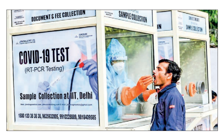
A health worker collects a swab from a man during a COVID-19 test in New Delhi, India, on 6 November 2020.

"I admire the progress that India is making under the visionary leadership of PM Modi. We've seen India's effective manage-