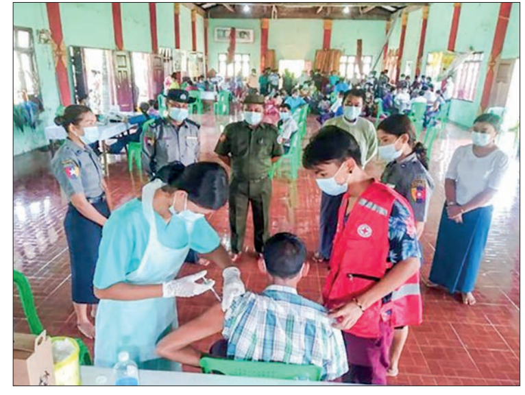
A local in Pauktaw Township, Rakhine State gets COVID-19 vaccine shot.

It is reported that officials from the respective Regional Military Headquarters visited the site and coordinated the necessary work. - MNA