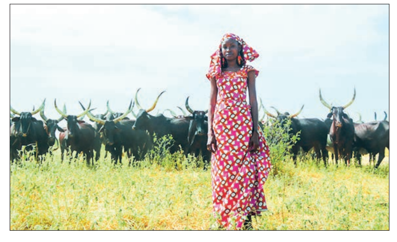
By fighting for their lands, Indigenous peoples are fighting to save the planet.

BRAZIL, Colombia, Mexico and Peru will not be able to meet their 2030 climate goals if they do not protect indigenous communities' lands, according to a report released Thursday.