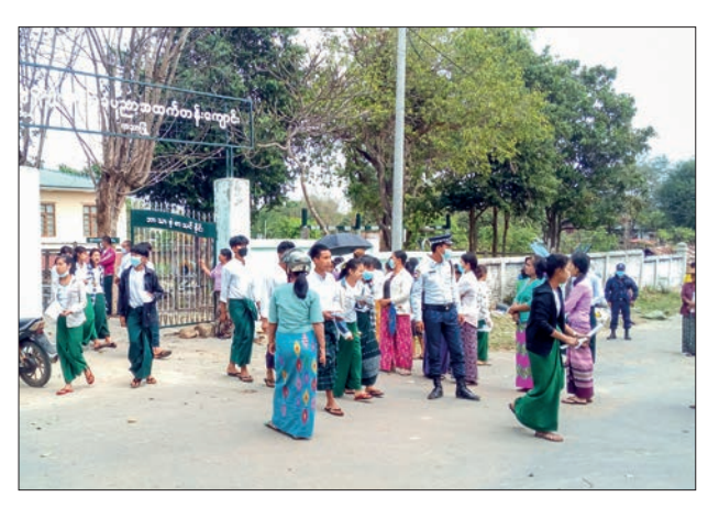
Katha Township.