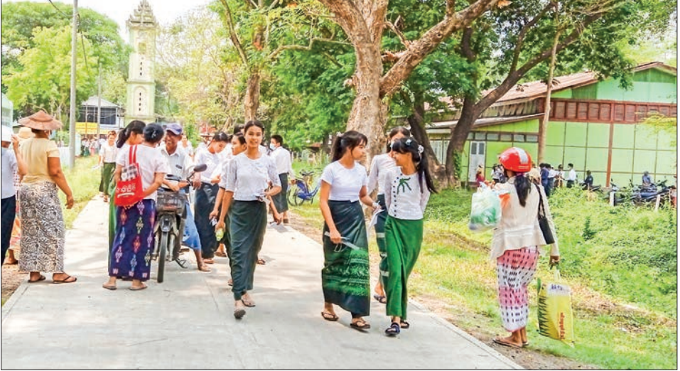
Ingapu Township.