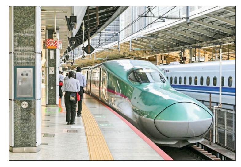
Photo taken 2 April 2022, shows a Tohoku Shinkansen bullet train arriving at Tokyo Station having departed from Fukushima.

The 16 of the train's 17 cars derailed in the incident, injuring four people, with one car moving about one metre off the side of the tracks.—Kyodo ■