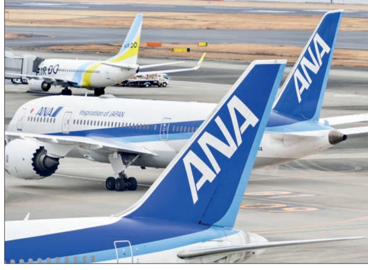
Japan on Friday eased its travel warning for 106 nations including the United States and India over the coronavirus pandemic, no longer recommending Japanese nationals against travelling to the areas.

"Although the situations are different among nations and areas, the number of new COVID-19 infections and deaths has been on a decreasing trend globally, and risks of dying and developing serious symptoms have been reduced on the back of progress in vaccinations," Foreign Min-