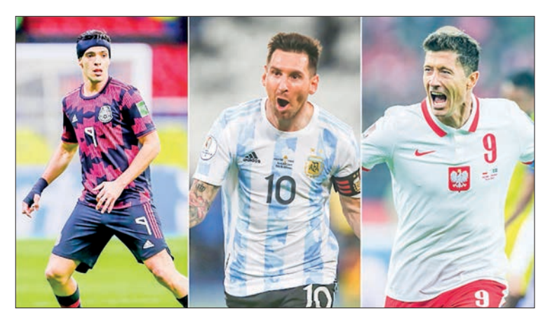
Saudi Arabia were drawn on Friday with Argentina, Mexico and Poland in their group for the football World Cup finals in Qatar in November.

SAUDI Arabia were drawn on Friday with Argentina, Mexico and Poland in their group for the football World Cup finals in Qatar in November.