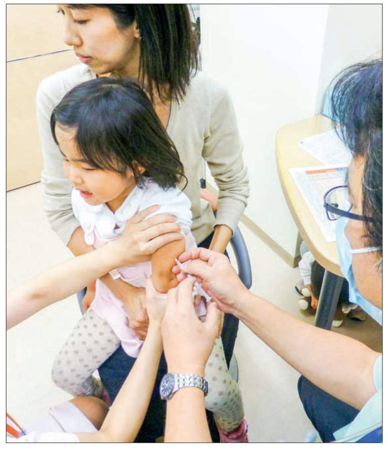
The vaccine was safe and immunogenic but antibody response in HIV-infected children was not as high as in uninfected children.

JEV is a potentially deadly virus transmitted by mosquitos that causes high levels of human disease in many countries including India, the Philippines, and Viet Nam.—Xinhua ■