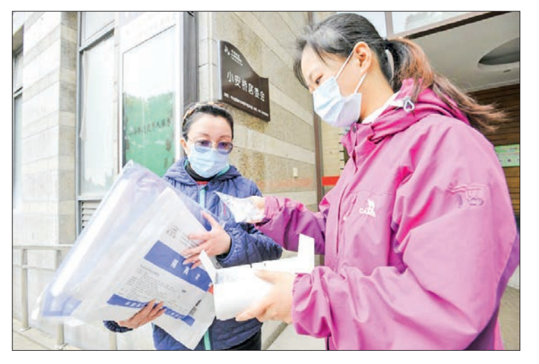
allowed to leave their homes in Community workers prepare to distribute rapid antigen test kits in east China's Shanghai, 26 March 2022.

The Communist-led government has pledged to continue its radical "zero COVID" policy, including imposing lockdowns on cities when outbreaks occur and quarantining travellers from abroad, even after the end of the Beijing Winter Olympics and Paralympics. Until next Tuesday, citizens in districts to the west of the Huangpu River, which passes through Shanghai, will not be principle.—Kyodo ■