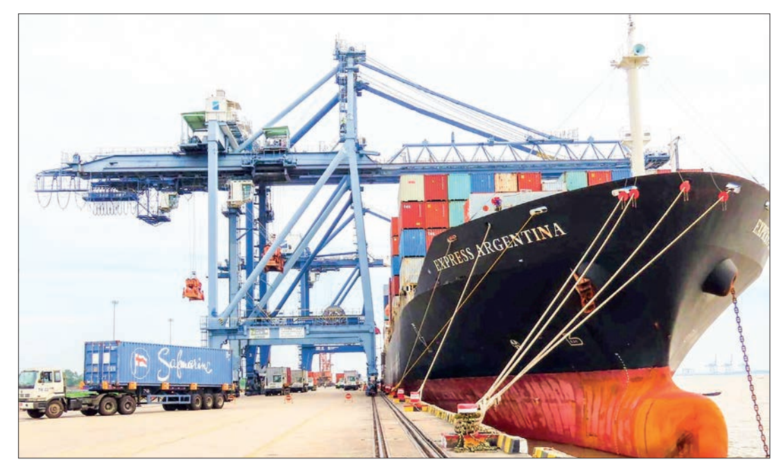
One of the container ships is seen berthing at Yangon Port.

SIXTEEN container vessels will arrive from 9 to 17 April, the April Thingyan holidays, when the Myanma Port Authority and ports are providing services to expedite the import of containers by sea as soon as possible.