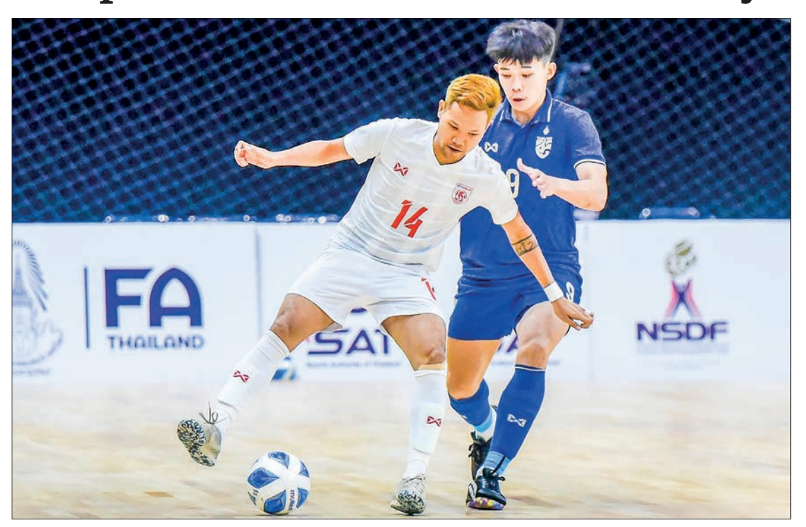
In March, Myanmar and Thai teams compete in the Thai Invitational Futsal Championship.

ACCORDING to the SEA Games organising committee, six men's teams and five women's teams will compete in the 31^{\rm st}\ SEA Games futsal tournament in May 2022.