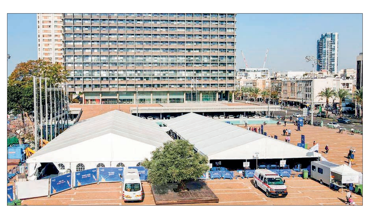
Israel has set up large COVID-19 vaccination centres such as this one in Tel Aviv.

"This is our third strategic plan for COVID-19, and it could and should be our last", he said, laying out three possible scenarios for how the pandemic could evolve this year.