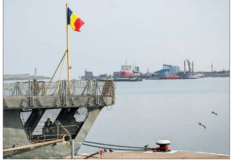
Constanta is the largest port on the Black Sea, handling more than 67 million tonnes of exports in 2021.

FACED with a Russian blockade of its own ports, Ukraine is seeking to export the farm goods