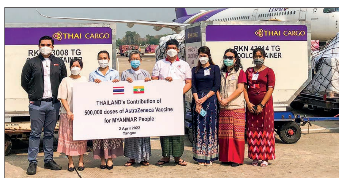
Officials receive the second batch of 500,000 AstraZeneca COVID-19 vaccines donated by Thailand.

Therefore, the public is urged to actively participate in completing the entire course of the COVID-19 vaccine. — MNA