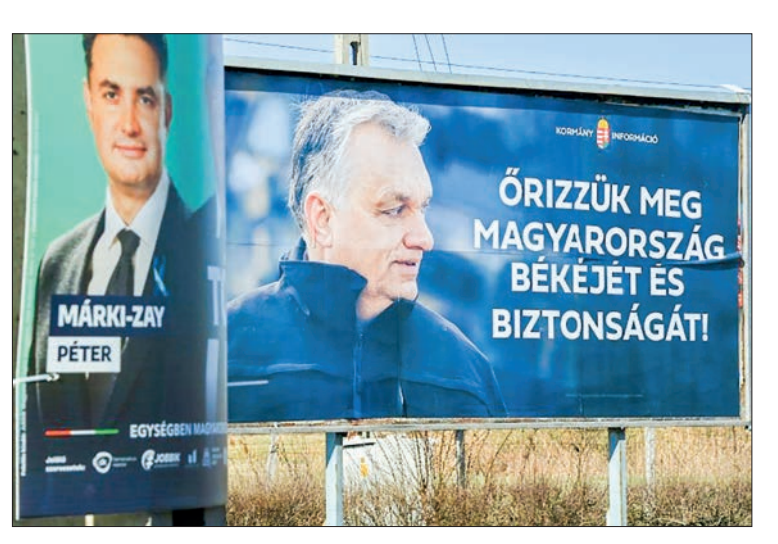
For the first time in its 12 years in office, Orban's Fidesz party is facing a united opposition coalition at the ballot box.

AFTER a tense campaign dominated by Russia's invasion of neighbouring Ukraine, Hungarians will vote in a general election on Sunday with polls giving the edge to incumbent nationalist Prime Minister Viktor Orban.