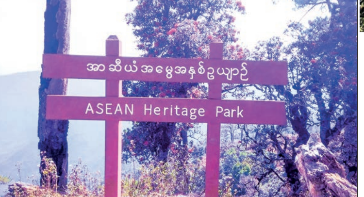
Natmataung National Park was listed as ASEAN Heritage Park and is located in the Kanpetlet city of Chin State.

a picturesque view of floral biodiversity.