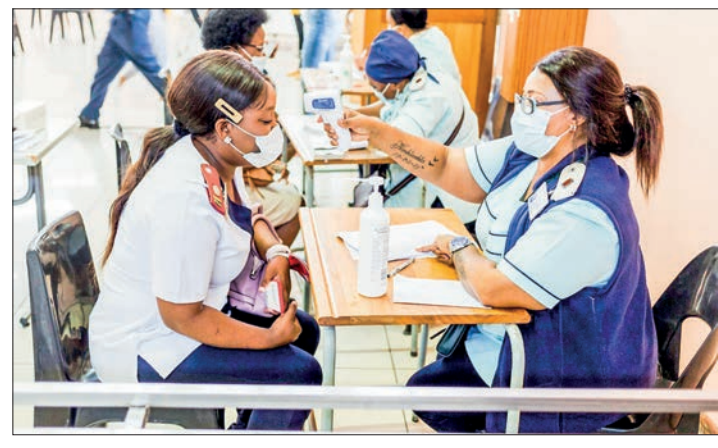
South Africa is the continent's hardest hit country, counting more than 3.7 million coronavirus cases or more than 30 per cent of Africa's over 11.3 million cases.

"Although more data are needed on the underlying causes of (natural) death, (the) observation is strongly supportive that a significant proportion of the current excess mortality being observed in South Africa is likely to be attributable to Covid-19," it said in a report on its website.—AFP ■