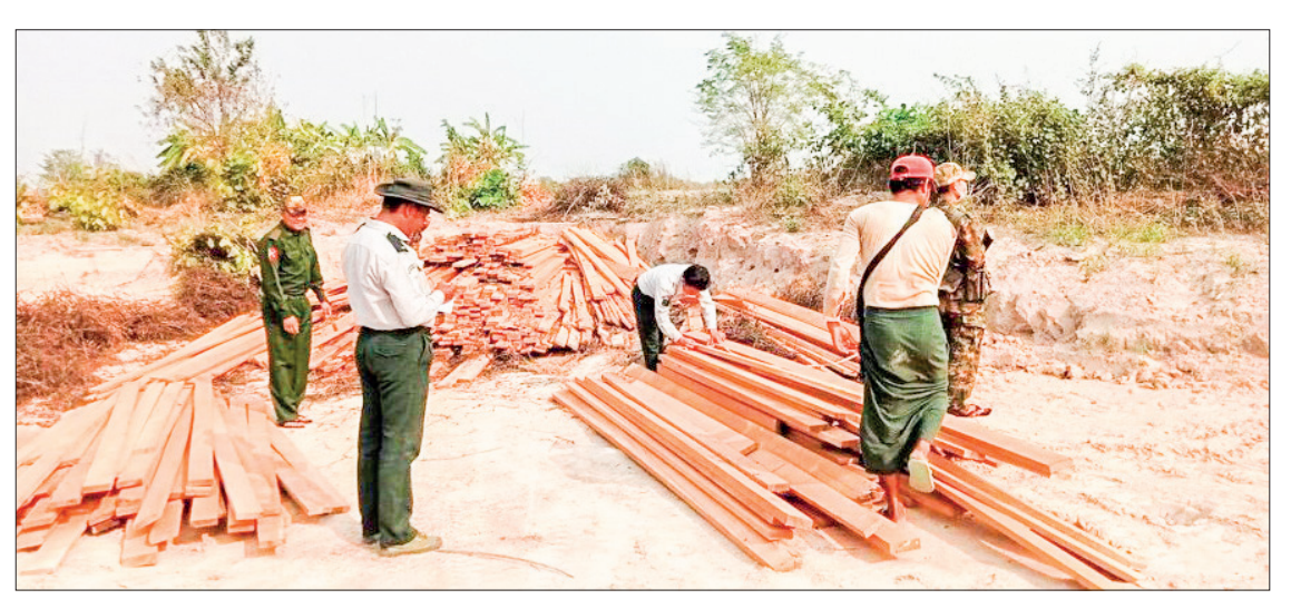
Officials confiscate illegal timbers.

Therefore, five arrests (estimated value of K118,922,364) were made on 31 March and 1 April, according to the Anti-Illegal Trade Steering Committee. — MNA