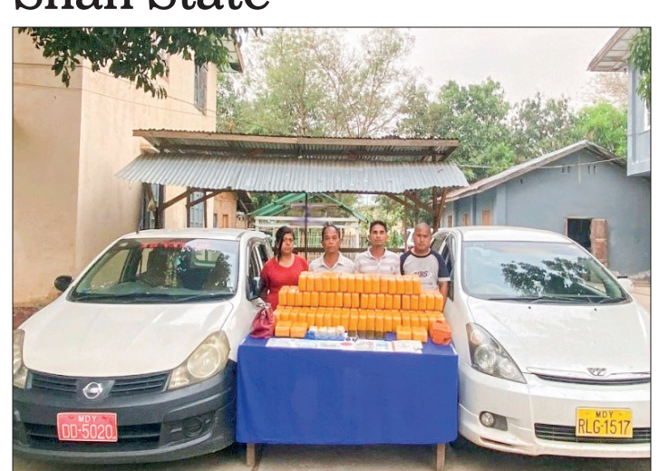
Four arrestees are seen along with seized stimulant pills and vehicles.

THE police seized K400 million worth of stimulant tablets in Hsipaw Township of Shan State.