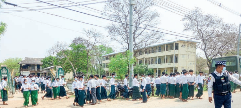
Taungdwingyi, Magway Region.