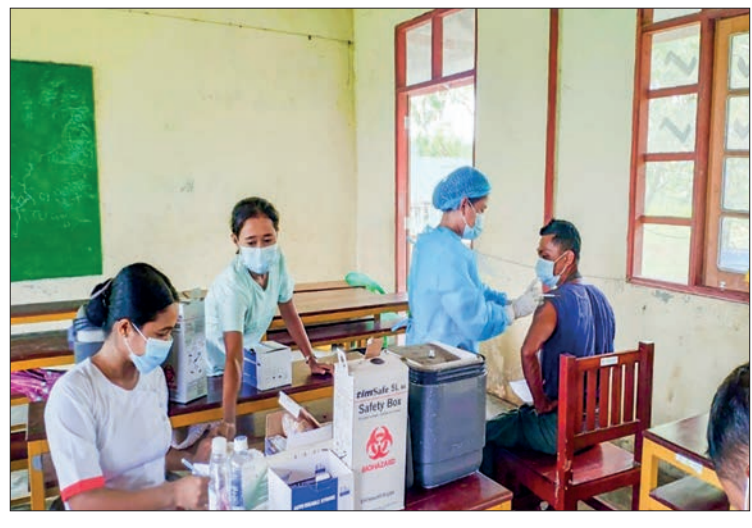
A local in Ponnagyun Township, Rakhine State gets COVID-19 vaccine shot

DOCTORS and nurses from public hospitals, Tatmadaw medical teams, healthcare workers and volunteers are working hard to give COVID-19 vaccines in different states and regions as the vaccination programme is one of the most important activities in the prevention, control and treatment of COVID-19 disease.