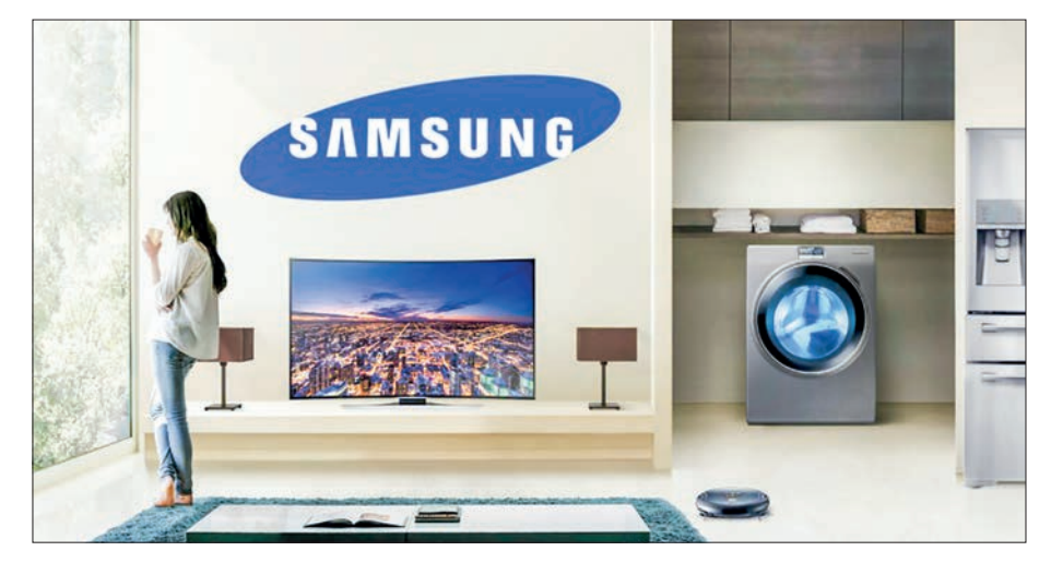
The country is home to major technology firms including Samsung Electronics, the world's leading smartphone maker, whose chips are used in a wide range of devices.

South Korea's outbound shipments stood at US$63.48 billion for March 2022, up from $53.69 billion a year earlier. The figures are "the highest tally since 1956, when trade statistics started to be collected",