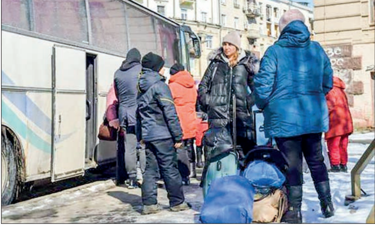
Residents prepare to evacuate Ukraine.

"We are sending 45 buses to the Mariupol corridor". Seventeen buses had already left for Mariupol from Zaporizhzhia,