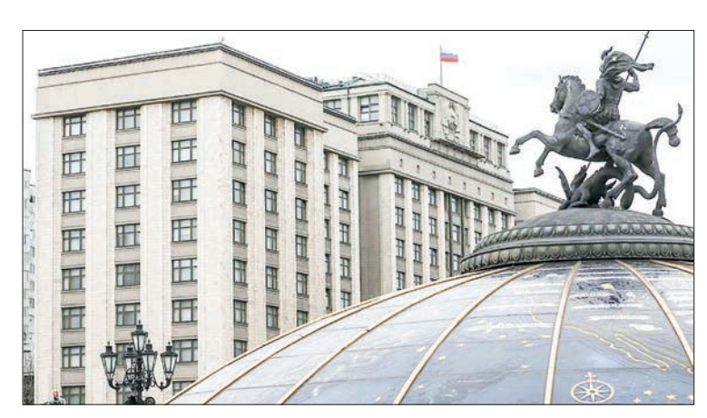
The building of Russia's State Duma is seen in this picture.

A Russian parliamentary commission held its first meeting on Thursday, announcing the establishment of four working groups to investigate US-controlled biological laboratories in Ukraine.