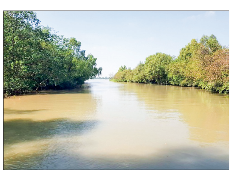
Monrec designates 9,274.38 acres in Kungyangon Township as "Green Wall Mangrove Protected Forest Reserve" effective 1 April 2022.

EXERCISING powers conferred under Sub-section (e) of Section (6) of the Forest Law promulgated in September 2018, the Ministry of Natural Resources and Environmental Conservation of the Government of the Republic of the Union of Myanmar has designated the area of 9,274.38 acres in Kungyangon Township in Yangon South District as "Green Wall Mangrove