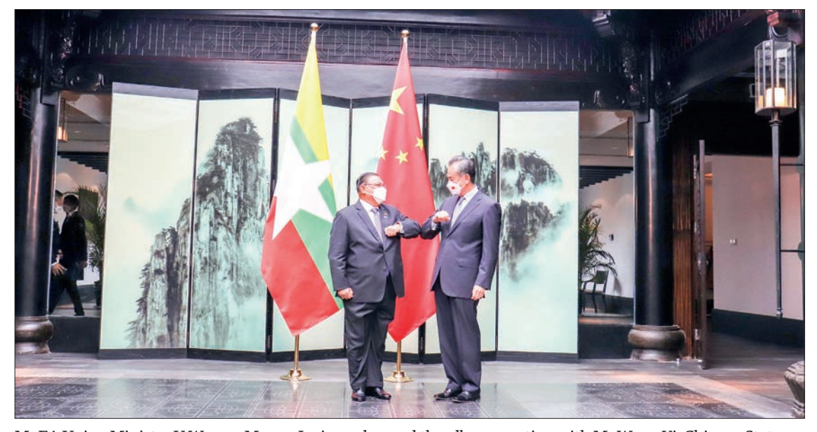
MoFA Union Minister U Wunna Maung Lwin exchanged the elbow greeting with Mr Wang Yi, Chinese State Councilor and Foreign Minister.

While in Huangshan, at 5:00 pm on 1 April 2022, Union Minister for Foreign Affairs U Wunna Maung Lwin had a separate meeting with State Councilor and Minister of Foreign Affairs of China Mr Wang Yi, followed by a bilateral meeting between the two Foreign Ministers. At the meeting, they cordially exchanged views on matters pertaining to the further consolidation of the existing Pauk Phaw relations, accelerating the implementation of Myanmar-China bilateral projects on the basis of mutual benefit, strengthening cooperation in the fights against the Covid-19 pandemic, opening the Myanmar Consulate-General in Chongqing Municipality, the maintenance of peace and stability along the border between Myanmar and China, closer coordination for the