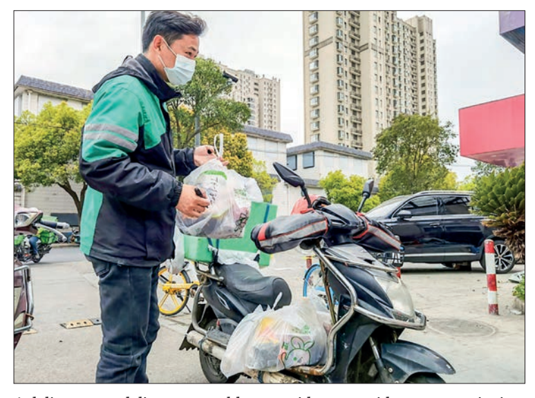
A deliveryman delivers vegetables to residents outside a community in Shanghai's Pudong New Area on 28 March 2022.

SHANGHAI will launch a nucleic acid testing campaign in areas west of the Huangpu River starting Friday amid the second