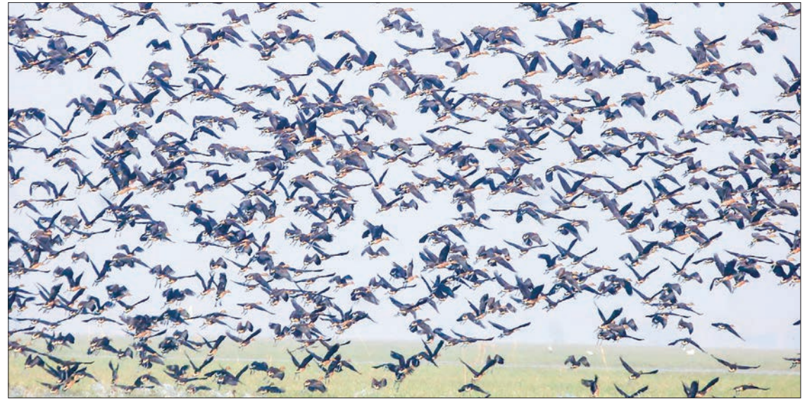
The ecosystem of Moeyungyi Sanctuary in the Bago Region is currently conserved with the residential bird inhabitants and migratory birds when the water level becomes lower starting the end of March. PHOTO:

decreases, and the Storks that eat snails and clams living in