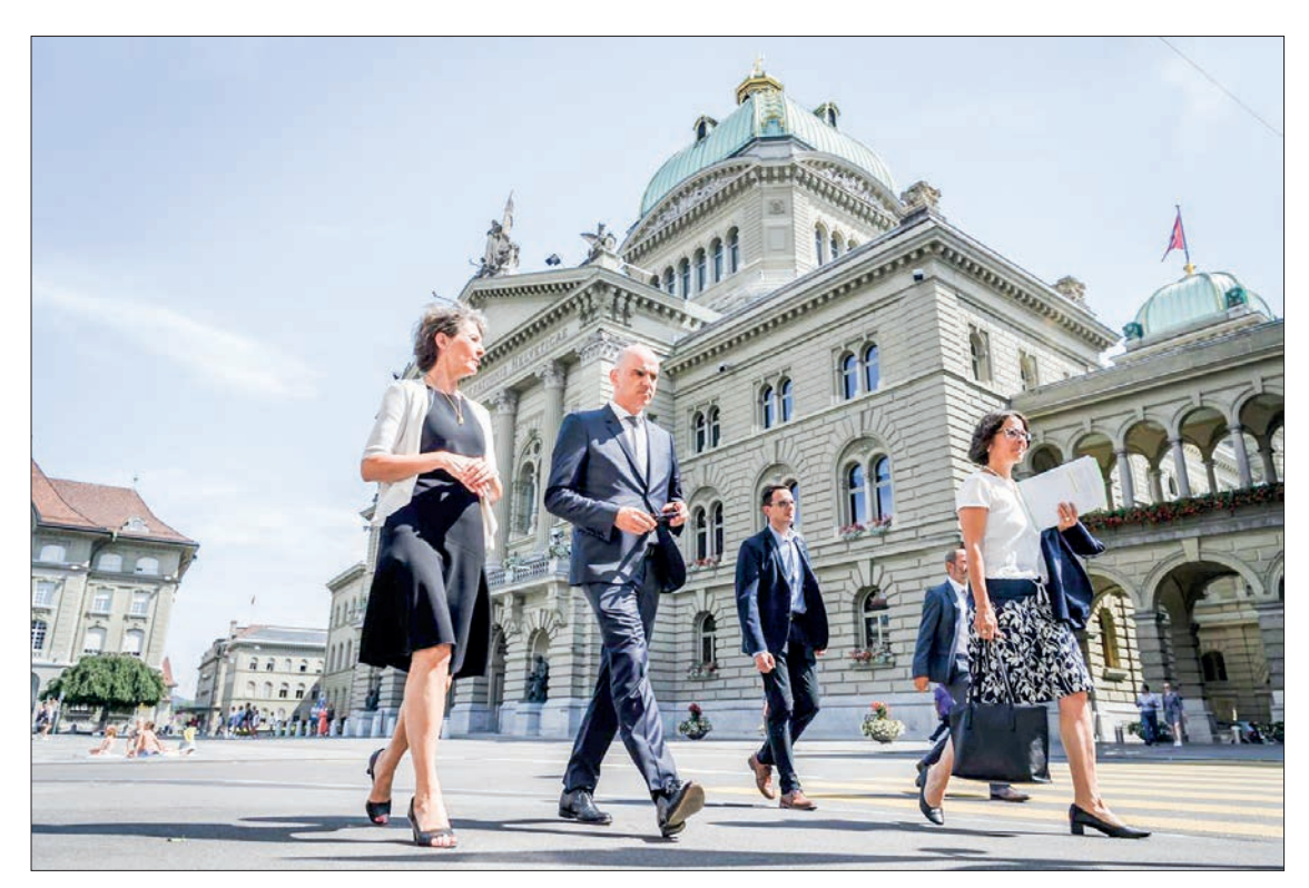
Swiss President Simonetta Sommaruga (L) and Swiss Health Minister Alain Berset walk in front of the Swiss House of Parliament on 27 August 2020.

THE Swiss government on Wednesday said that it has decided to lift all COVID-19 restrictions in the country on 1 April.