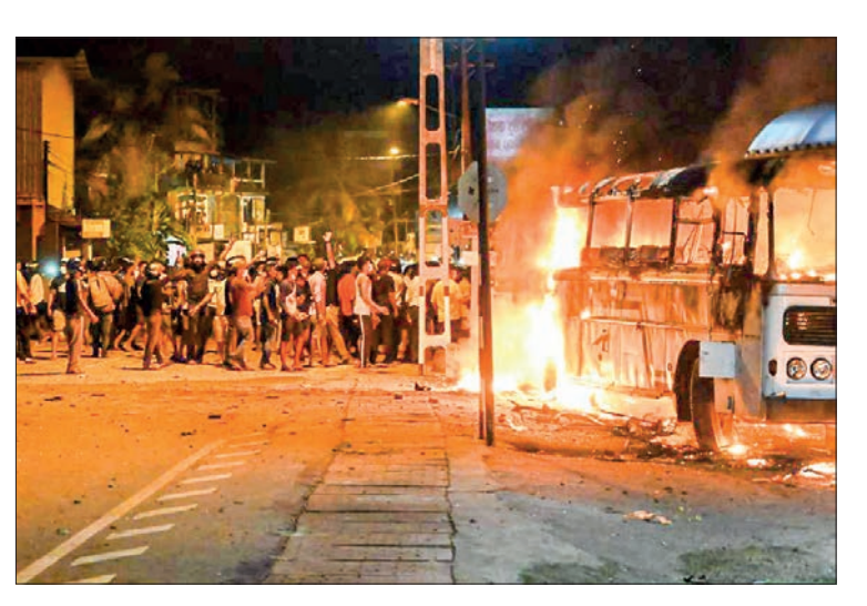
Protesters shout slogans after setting a bus on fire during a demonstration outside the Sri Lankan president's home to call for his resignation in Colombo.

SECURITY forces were deployed across the Sri Lankan capital on Friday after protesters tried to storm the president's home in anger at the nation's worst economic crisis since independence.