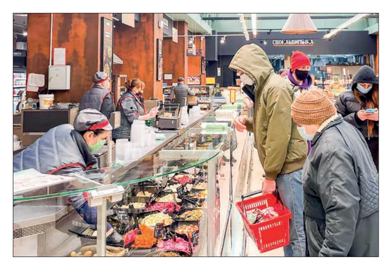
People go shopping at a supermarket in Lviv, Ukraine, 28 February 2022.

"Disruptions to Ukrainian and Russian grain and oilseed production and exports and restrictions on Russia's exports can have significant impacts on global food security," noted Ben-Belhassen.—Xinhua ■