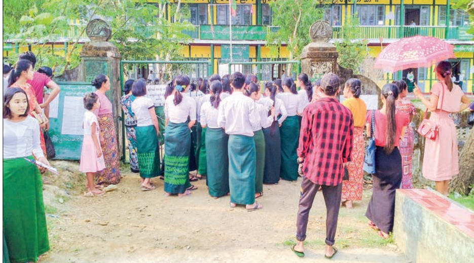
Minbya, Rakhine State.