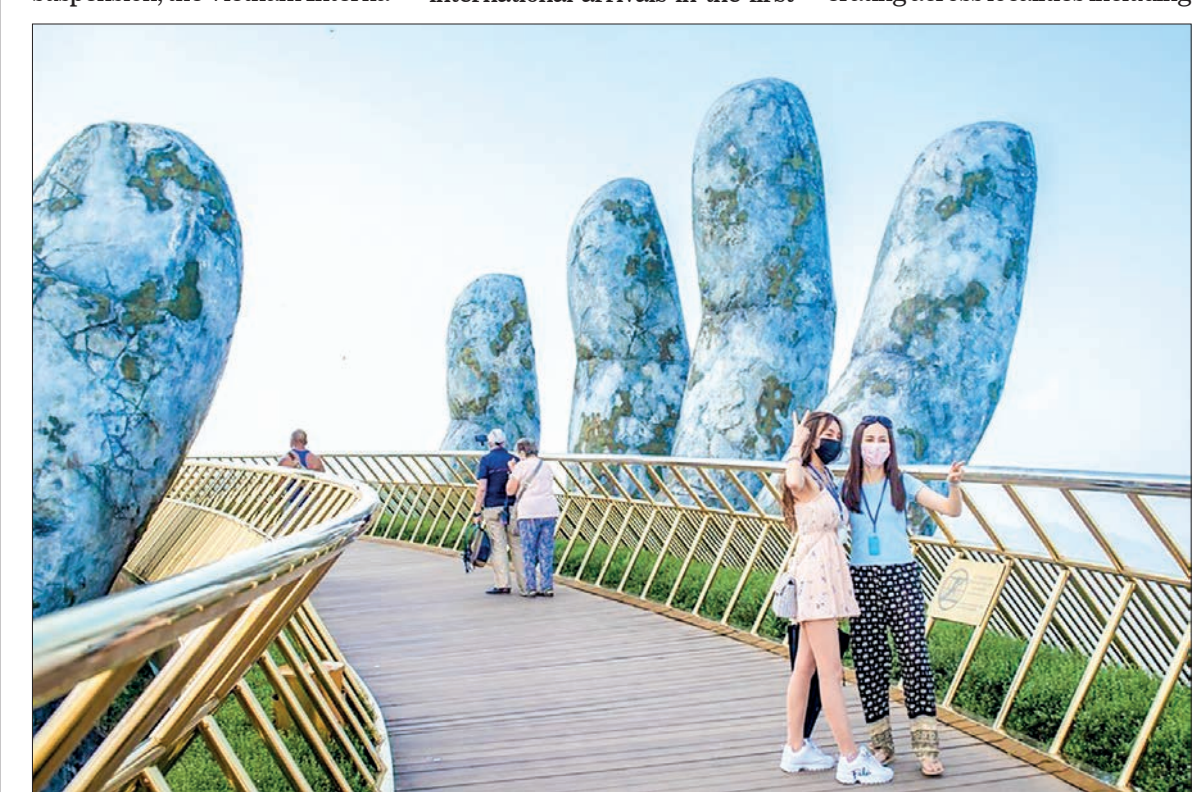
Tourists pose for photos on the Golden Bridge on Ba Na Hills, Da Nang city, Vietnam.