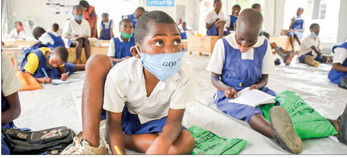
Pupils attend class at a pirmary school in Kasese District, Uganda

And between March 2020 and July 2021, the number of children out of school in South Africa, tripled from 250,000 to 750,000. Around one in 10 Ugandan students did not re-