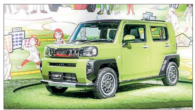
Daihatsu Motor Co., Toyota's minicar subsidiary, sold 506,436 cars, down 7.8 percent.

Nissan Motor Co. marked declines of 3.4 per cent and 1.1 per cent, respectively. Mazda Motor Corp. reported a 15.4 per cent fall, with Subaru Corp. losing 14.2 per cent.