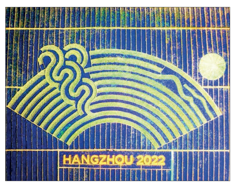
This aerial photo taken in March 2019 shows different coloured flowers used to create the logo of the 19th Asian Games in Hangzhou.

"Functional checks for the events have been finished," the statement said, adding sever-