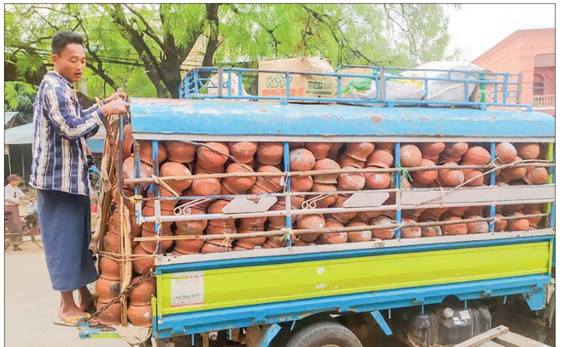
Clay pots used in collecting toddy sap are transported by car to the domestic market.

The prices of earthen pots vary depending on design, size and quality.—Ko Htein (KPD)/GNLM