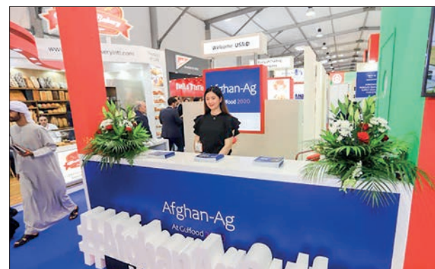
Afghan agricultural exporters are gearing up to display their products for overseas buyers once again. A total of 29 Afghan exporters showcased their products at Gulfood Trade Show 2021 in Dubai, UAE.

This is the country's 26th agricultural products exhibition and also the first version held under new administration since Taliban's takeover of power last year in Afghanistan. Baradar also said that the