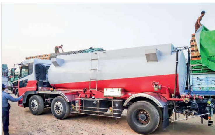
An oil bowser was seized at Kawkareik (Tadakyo) Combined Checkpoint on 26 March.

Checkpoint in Kawthoung, Taninthayi Region. During the inspection, undocumented motorcycle spare parts (estimated value K 1,402,200) were seized under the Customs Law.