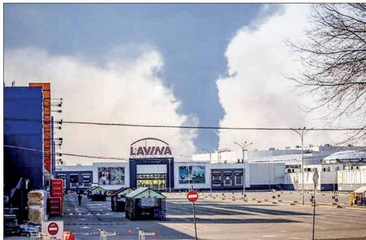
A photo shows a deserted area while smoke rises in the suburbs of Kyiv, on 25 March 2022.

BULGARIAN President Rumen Radev said here on Saturday that he would not allow his country to be involved in the conflict in Ukraine, according to a press release by his press office.