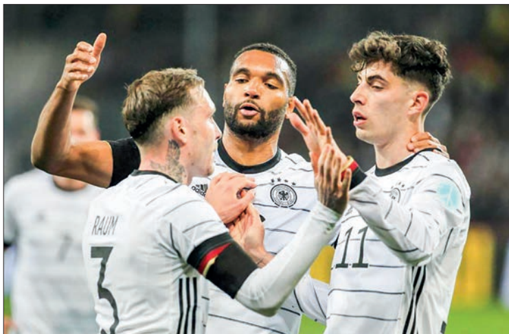
Chelsea pair Kai Havertz and Timo Werner both hit the net Saturday as Germany eased past Israel with a 2-0 friendly win in Sinsheim.

CHELSEA pair Kai Havertz and Timo Werner both hit the net Saturday as Germany eased past Israel with a 2-0 friendly win in Sinsheim.