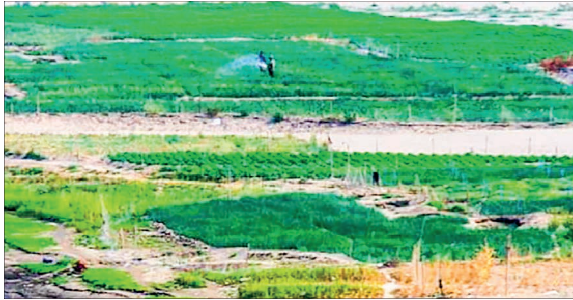
Various kinds of crops are thriving in the crop lands.

Following the closure of Sino-Myanmar border posts triggered by COVID-19 impacts and changes in China's Customs regulations, the export sees a