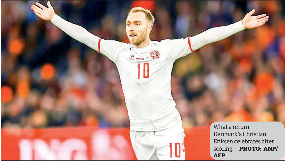
What a return: Denmark's Christian Eriksen celebrates after scoring.

DENMARK'S Christian Eriksen made an emotional goal-scoring return to international football on Saturday as England, Germany and Spain carved out friendly victories.