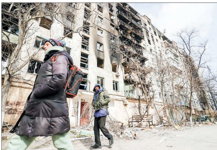
Residents walk past a damaged building in Mariupol, 25 March 2022.

disregard of Russia's legitimate concerns, drove five waves of NATO expansion eastward all the way to Russia's doorstep, incessantly squeezed Russia's security space and challenged the country's strategic bottom line until a military conflict broke out between Russia and Ukraine.