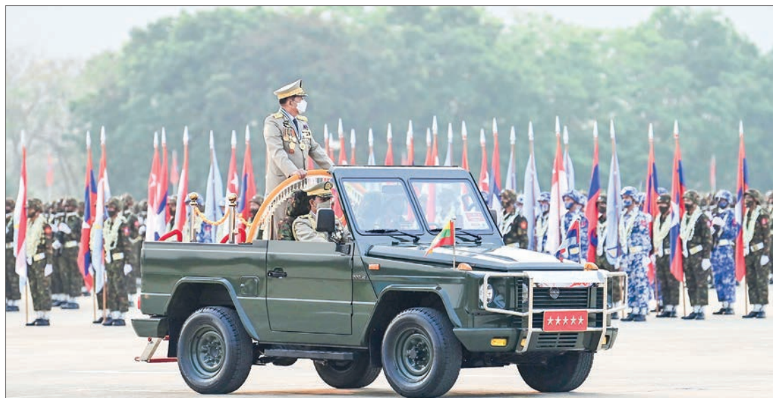
Chairman of State Administration Council Commander-in-Chief of Defence Services Senior General Maha Thray Sithu Min Aung Hlaing inspects parade columns.

The ceremony was also attended by State dignitaries, departmental heads, officials from