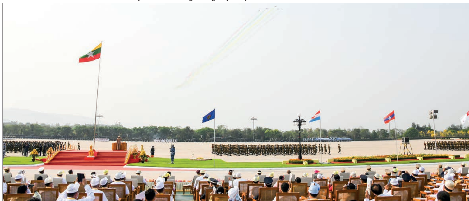
The 77 th Anniversary Armed Forces Day Parade in progress.

The bronze statues of three kings who established the first, second and third Myanmar empires posted in the Nay Pyi Taw Parade Ground and the flaming torch and the emblem to mark the 77 th Anniversary Armed Forces Day could be seen in the parade ground on a grand scale in addition to hoisting colourful flags representing the Burma Independence Army, the Burma Defence Army, directorates of the Office of the Commander-in-Chief (Army), military commands and military divisions as well as regiments and units.—MNA