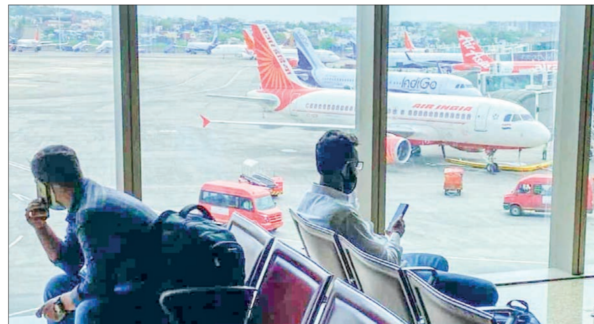
The Ministry of Health and Family Welfare (MoHFW) is also learnt to have received representations for allowing administration of precaution dose for those seeking to travel for employment opportunities, educational purpose or for attending official/business commitments, etc.

Currently, the precaution doses of COVID-19 vaccines are being administered to healthcare and frontline workers and those aged 60 and above with comorbidities in the country.