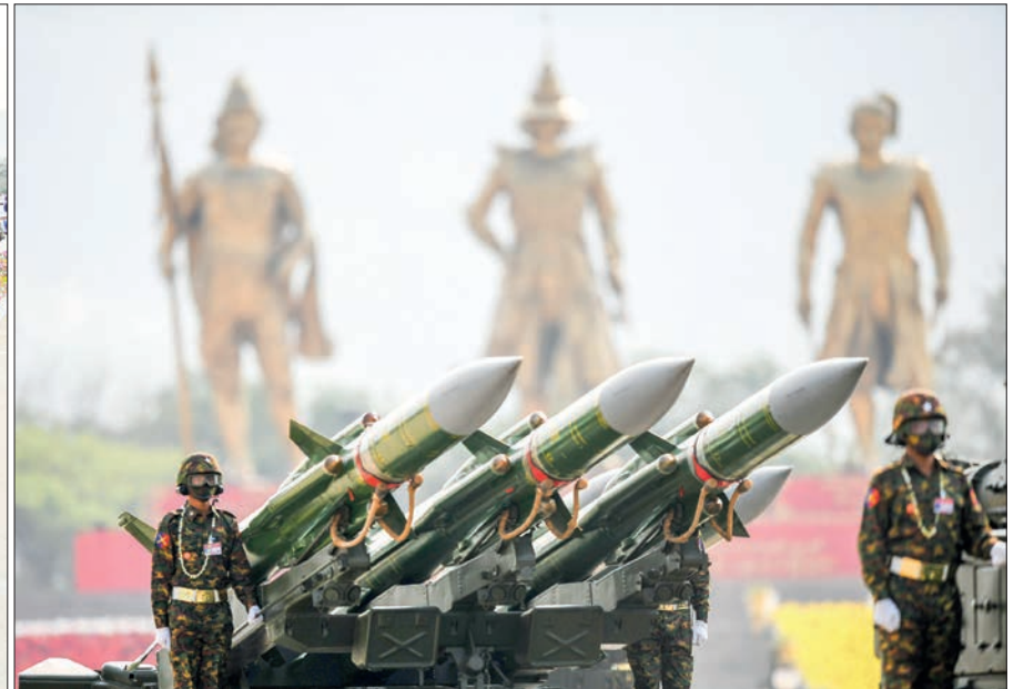
Photo depicts part of military columns at the 77 th Anniversary Armed Forces Day Parade.