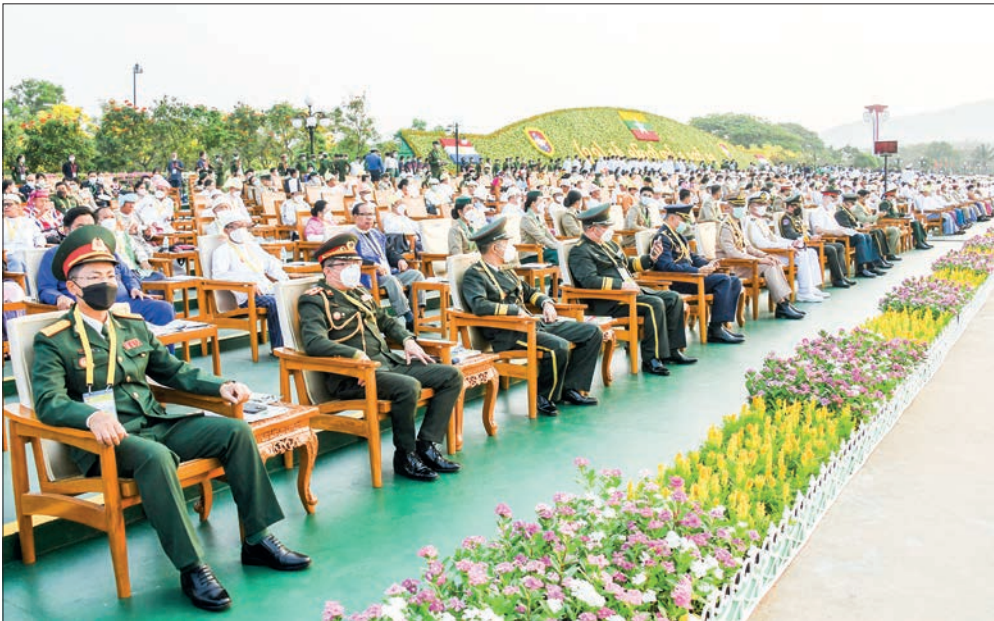
Military attachés and those in various strata attend the 77 th Anniversary Armed Forces Day Parade on 27 March.