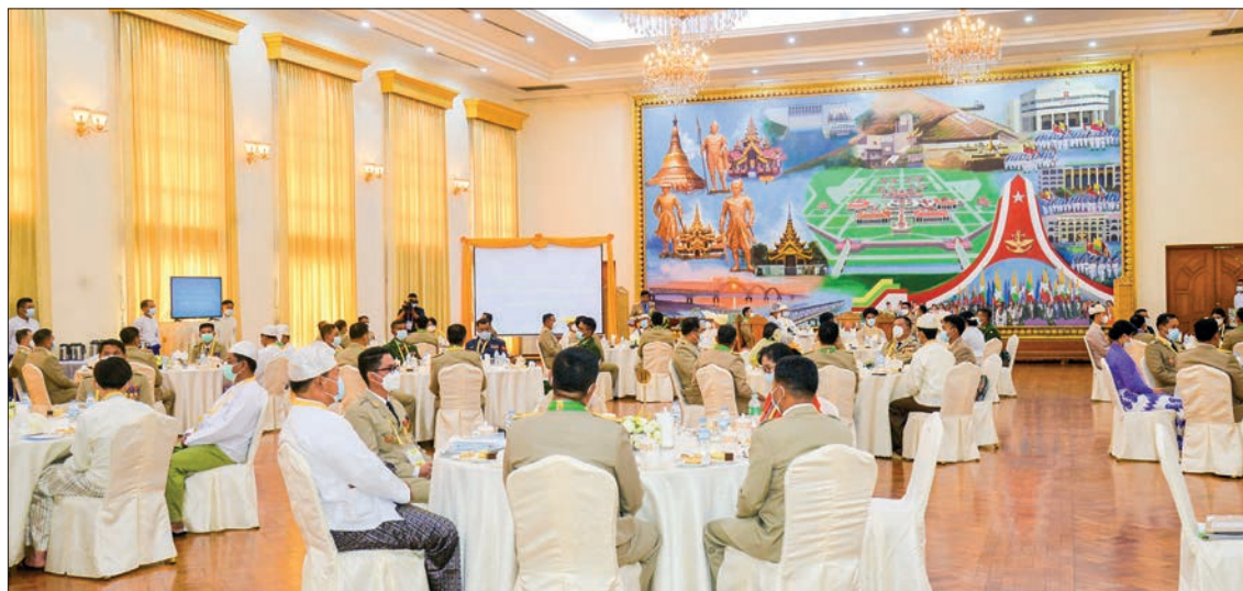
The ceremony to honour artistes and winners in drama and contests to mark 77 th Anniversary Armed Forces Day in progress in Nay Pyi Taw.

ARTISTES who performed in the 77 th Anniversary Armed Forces Day commemorative