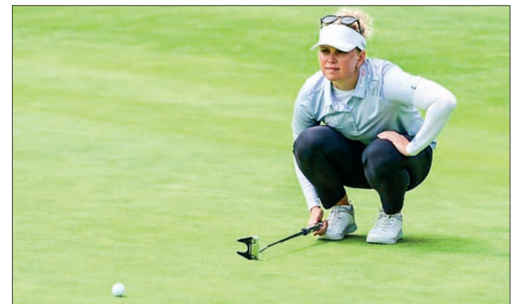
Denmark's Nanna Koerstz Madsen fired a three-under par 69 on Saturday to seize a three-stroke lead at the LPGA JTBC Classic.

DENMARK'S Nanna Koerstz Madsen seized a three-stroke lead after Saturday's third round of the LPGA JTBC Classic after South Korea's An Na-rin closed with a triple bogey disaster.