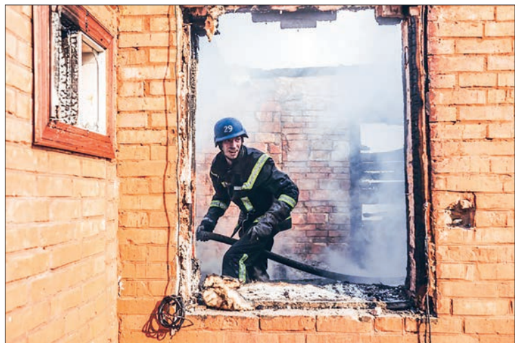
A firefighter works inside a damaged building in Kiev, Ukraine, 23 March 2022.

CANADA and the European Commission on Saturday announced plans to launch a joint fund-raising effort to help Ukrainian refugees, with the