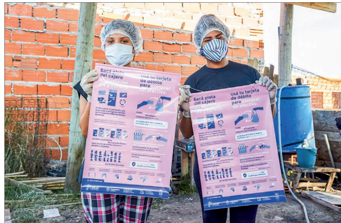
The research found that approximately 1.4% of the reviewed online content in the region could be classified as information pollution. This corresponds to half a million pieces over four months, which has an outsized impact on vulnerable audiences.

This report offers relevant insights based on new methods of research and analysis and provides actionable recommen-