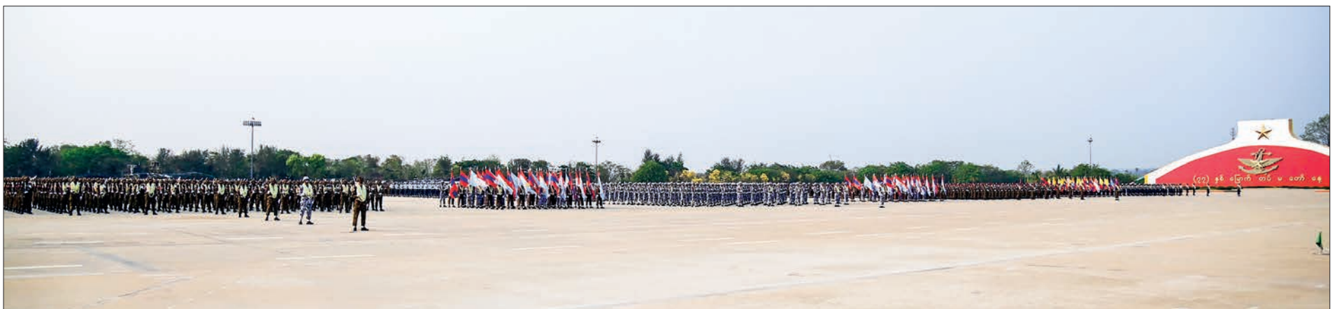
Chairman of State Administration Council Commander-in-Chief of Defence Services Senior General Maha Thray Sithu Min Aung Hlaing delivers speech at 77 th Anniversary Armed Forces Day Parade.