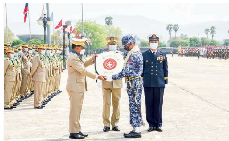
Chief of the General Staff (Army, Navy and Air) General Maung Maung Aye presents trophy to an outstanding parade company through an official.

Later, the General spoke words of honour and the ceremony came to an end.—MNA