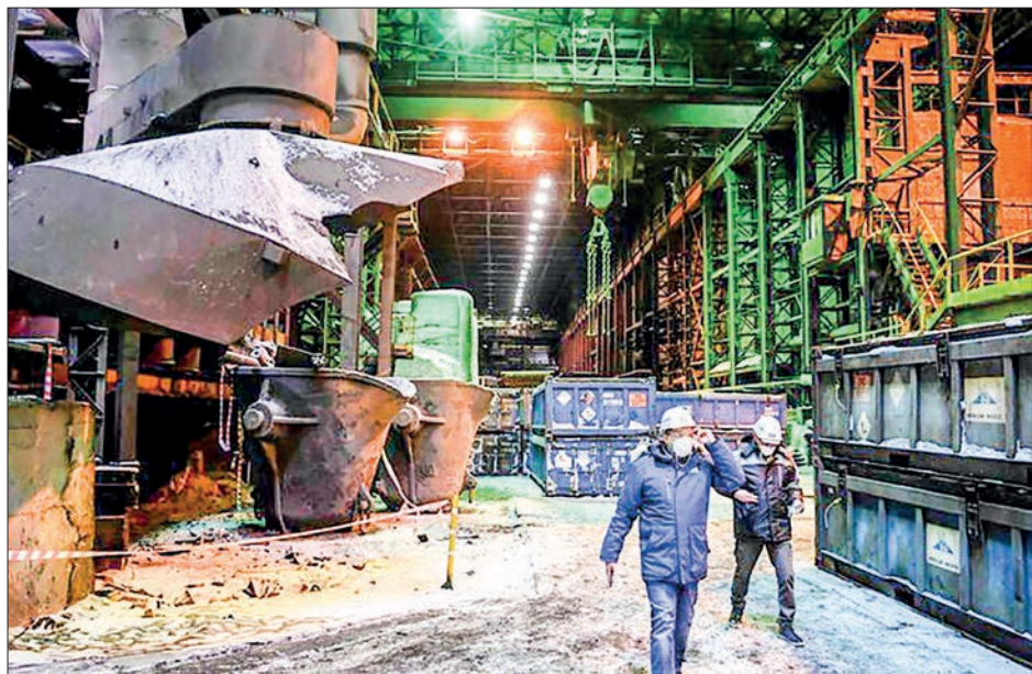
A view of a nickel smelter, owned by the Russian mining giant Norilsk Nickel, also known as Normickel, in the Murmansk region on 26 February 2021.

THE play by Xiang Guanda, China's "Nickel King", was to use his influential market position to short the metal, wait for the price to drop, then soak up the rewards when the value bounced back.