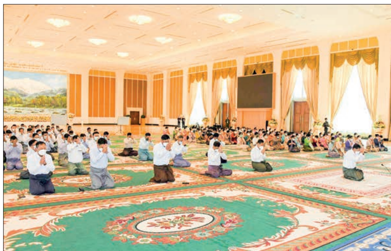
Chairman of State Administration Council Commander-in-Chief of Defence Services Senior General Min Aung Hlaing and wife Daw Kyu Kyu Hla and party pay respect to retired Senior military officers.

On the occasion, the Senior General delivered a speech for paying respects, expressing his delightedness of paying respects to the retired senior military officers at the 77 th Anniversary