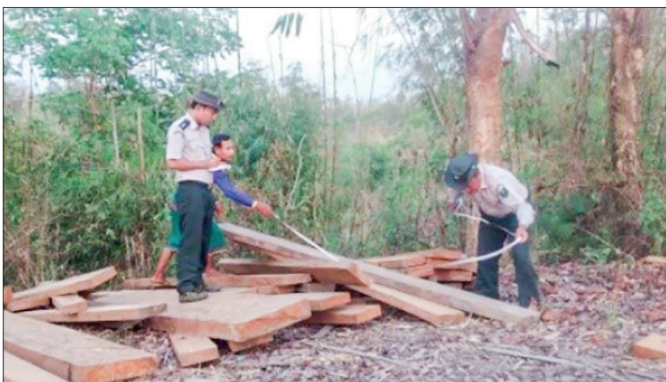
Officials measure illegal sawn teak timber seized in Bago Region on 26 March.

UNDER the supervision of the Anti-illegal Trade Steering Committee, efforts are being made to take effective action under the law.