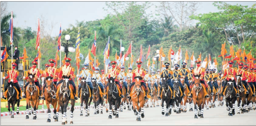
Troops of cavalry are marching in the 77 th Anniversary Armed Forces Day Parade.