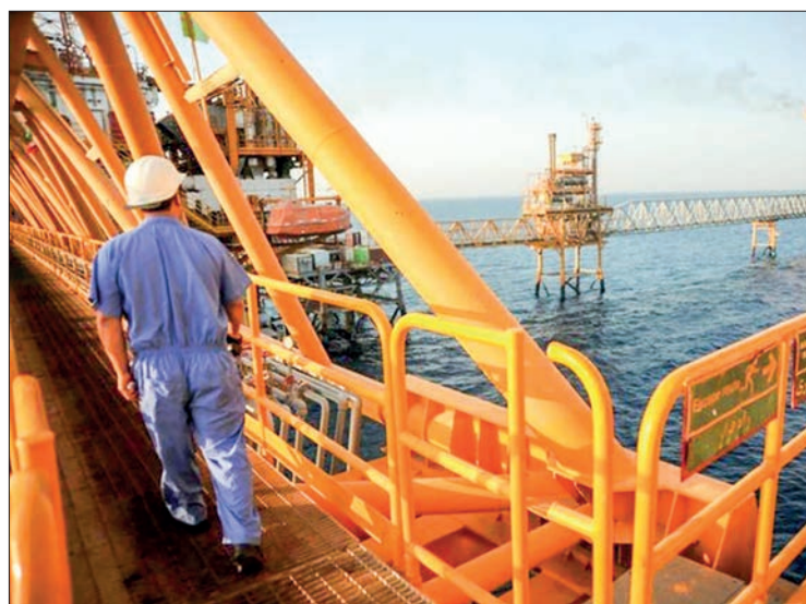
The Arash gas field or Durra gas field is a natural gas field located on the maritime border Iran, Kuwait, and Saudi Arabia. It was discovered in 1967.

IRAN said on Saturday that a recent agreement signed between Saudi Arabia and Kuwait to develop the Arash/Al-Durra gas field is "illegal," as Iran has a stake in the field and the Saudi-Kuwait agreement has run