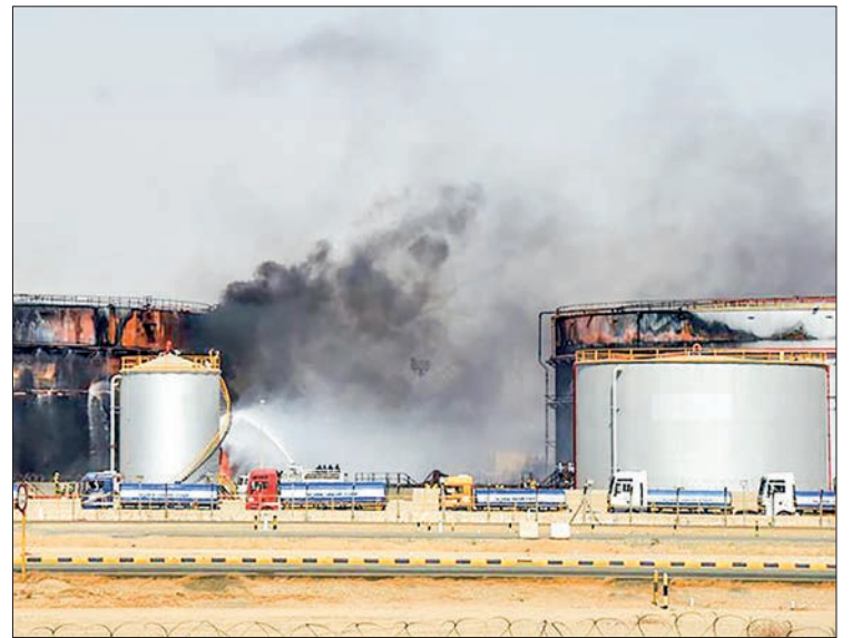
Fire fighters extinguish the last hearths of fire at a Saudi Aramco oil facility in Saudi Arabia's Red Sea coastal city of Jeddah, on 26 March 2022, a day after a Yemeni rebels attack.

"This attack is further proof that Iran's regional aggression knows no bounds," Prime Minister Naftali Bennett wrote on Twitter in a rare public message to the kingdom. French President Emmanuel Macron also condemned the rebel attack and expressed "solidarity" with Saudi Arabia. — AFP ■