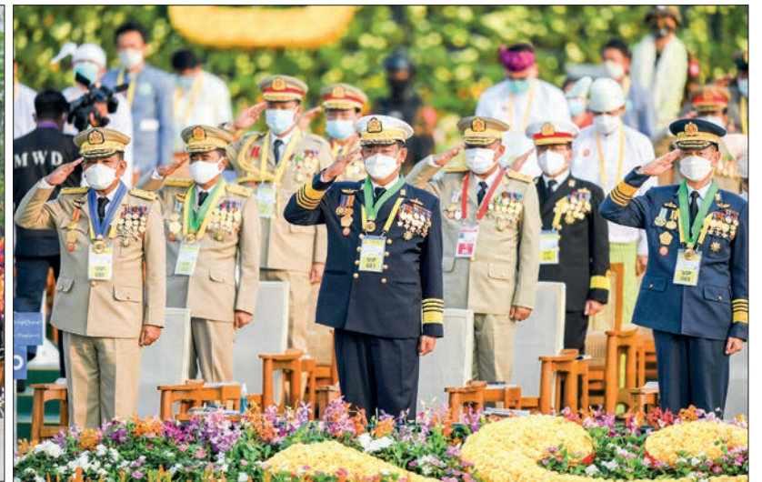
Senior military officers are saluting at the 77 th Anniversary Armed Forces Day Parade.