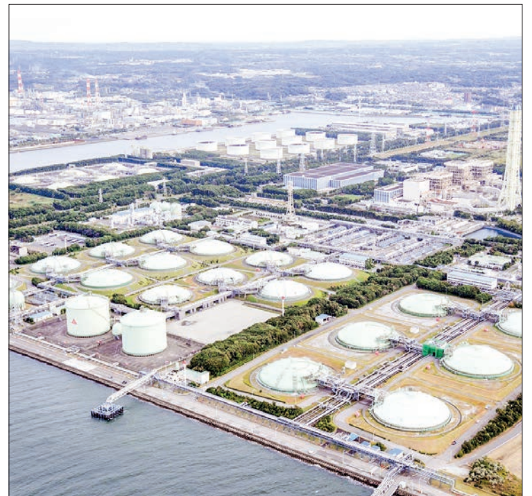
File photo taken from a Kyodo News helicopter on 12 November 2021, shows liquefied natural gas tanks of Tokyo Gas Co in Sodegaura in Chiba Prefecture, eastern Japan.