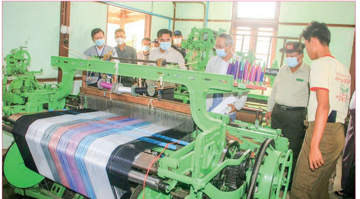
Bago Region Chief Minister U Myo Swe Win observes the training activities at the weaving and vocational school under the SME Development Department in Shwedaung Township on 26 March.

Finally, he arrived at the weaving and vocational school under the SME Development Department in Shwedaung Township and observed the training activities. He instructed the trainers to offer both the intensive and extensive courses to enhance the livelihoods of the local people. He also provided some contributions to the trainers.—MNA