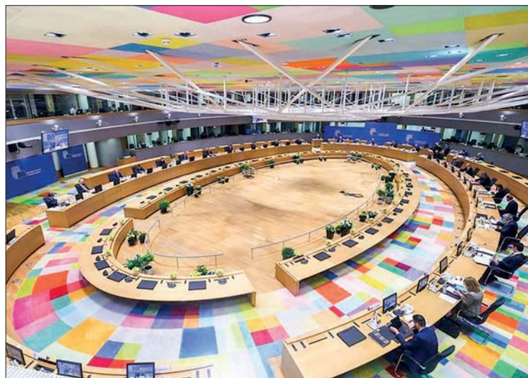
Leaders attend the European Council meeting in Brussels, Belgium, 24 March 2022.

mit on Thursday failed to agree on additional sanctions against Russia, despite Biden's presence — a reflection of different positions among members of the European Union (EU) as they become increasingly wary of consequences of such actions given existing challenges they face due to the