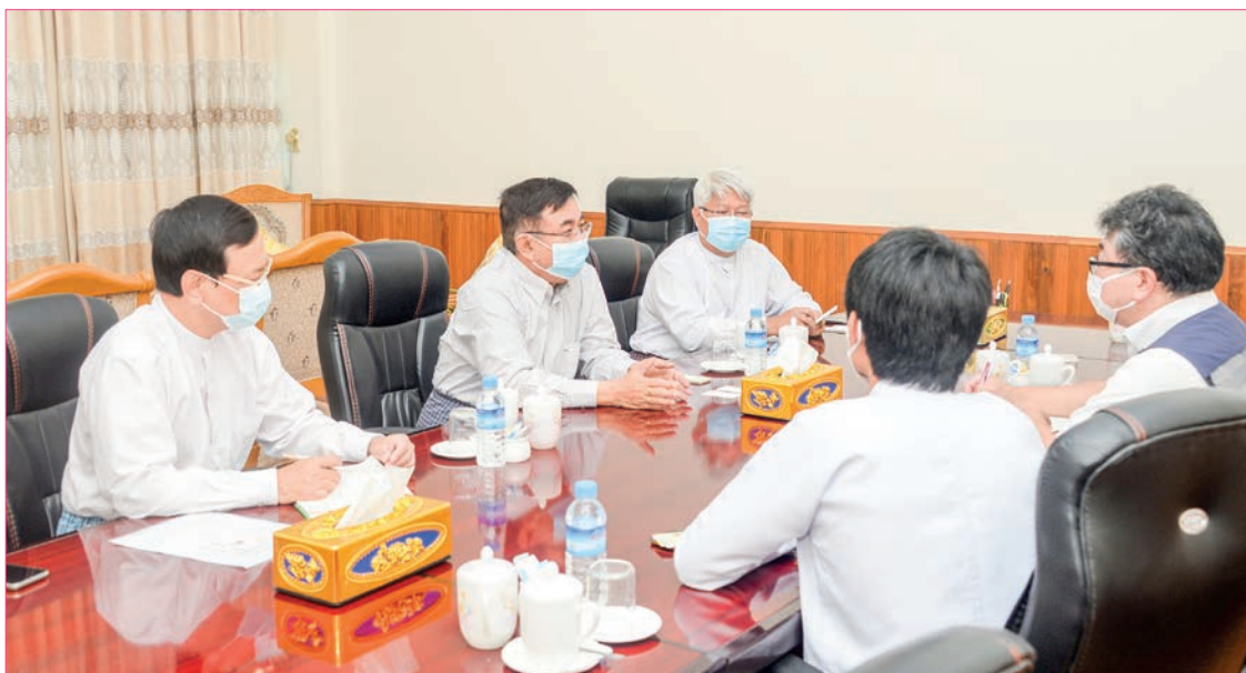
The MoE Union Minister receives the Asia Bureau Head of the Asahi Shimbun Newspaper in Nay Pyi Taw yesterday.

UNION Minister for Education Dr Nyunt Pe met Head of Asia Bureau of Asahi Shimbun Newspaper, Japan, Mr Onaga Tadao at the lobby of the Ministry of Education Office in Nay Pyi Taw at 10:30 am yesterday.