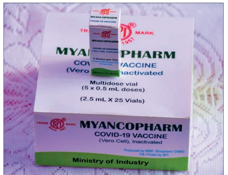
Myancopharm Covid vaccine—the first-ever product of Myanmar.

We measure the temperature of vaccine three times