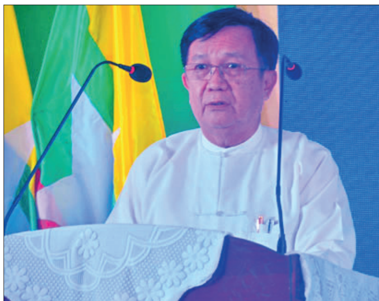
An opening speech by SAC Secretary Lt-Gen Aung Lin Dwe.

the Media Fill completed after three March and we conducted the necessary operations and so we could produce the vaccines in March. Our department buys the Ready to Fill Bulk to produce the vaccines.