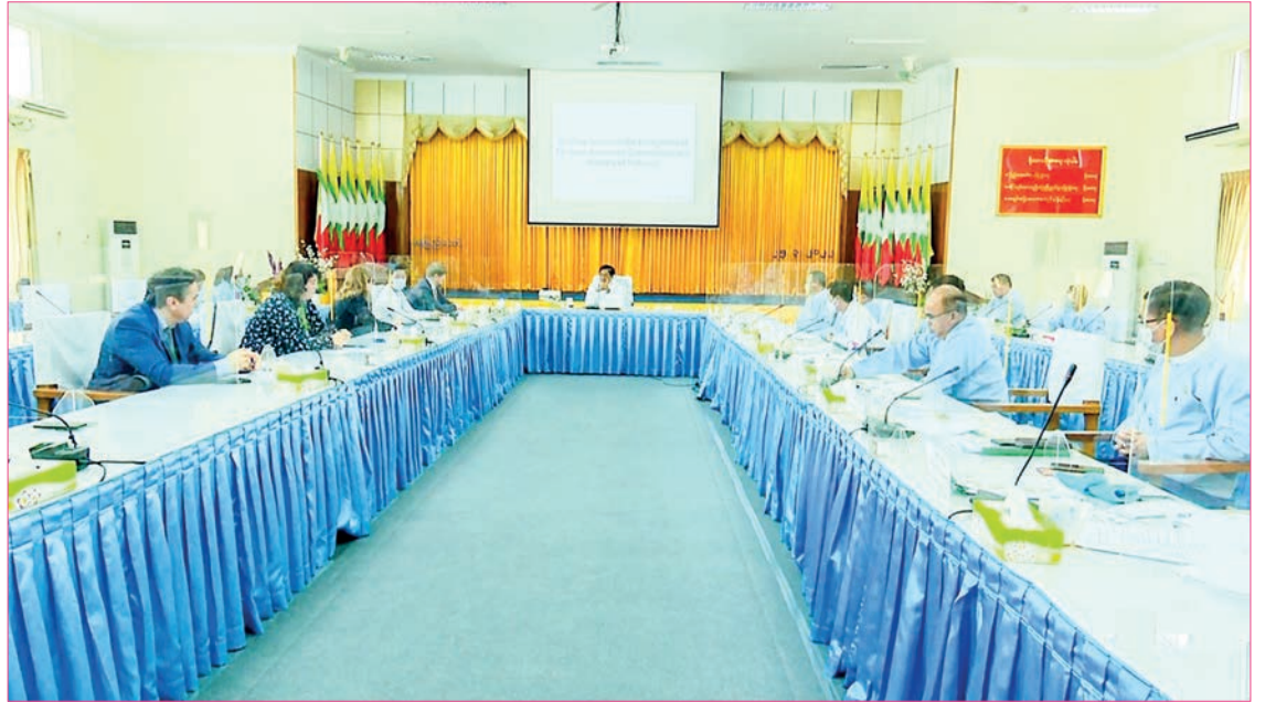
The MoI Union Minister holds talks with the Eurasian Economic Commission delegation in Nay Pyi Taw on 25 March.

The deputy ministers from the Ministry of Industry, the directors-general, managing directors and officials also attended the meeting.—MNA