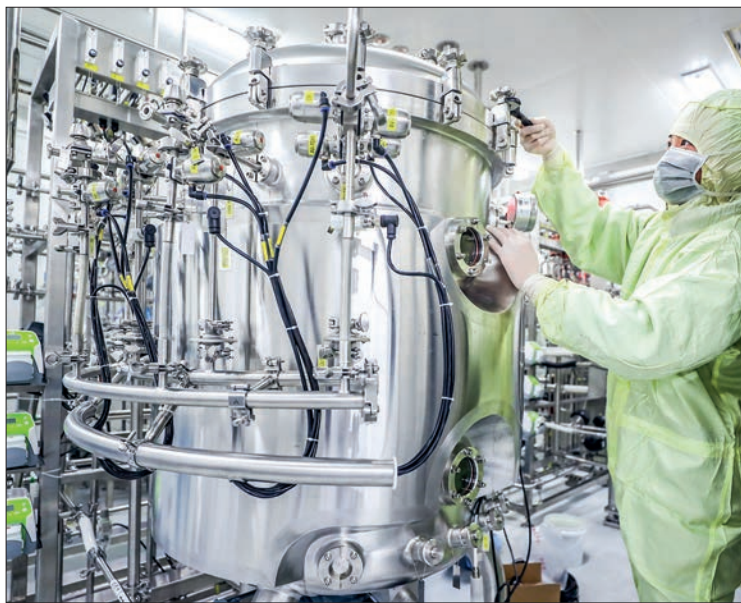
A staff member adjusts equipments at a vaccine production plant of China National Pharmaceutical Group (Sinopharm) in Beijing, capital of China, 10 April 2020.