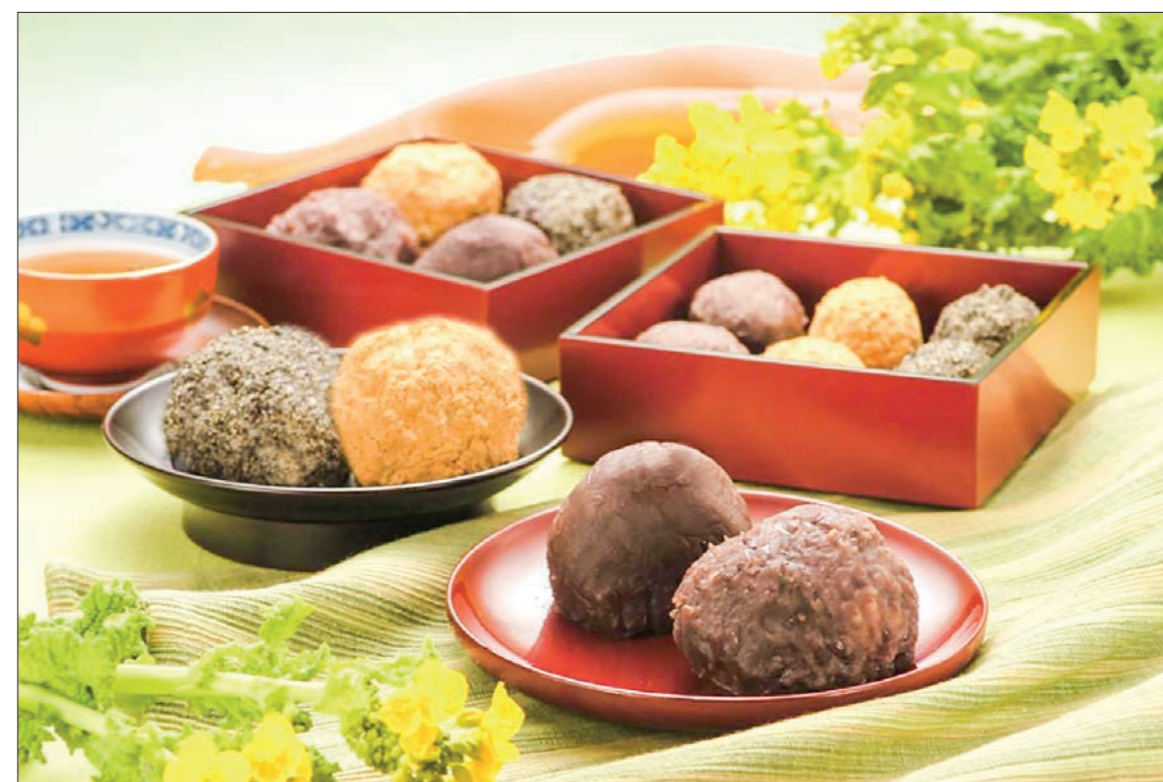
Ohagi (rice cake with sweet beans paste)