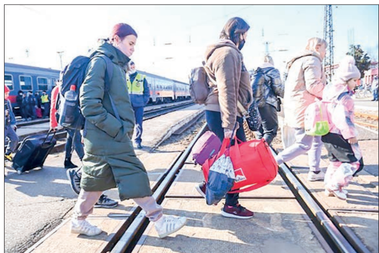
A human tide flows out of Ukraine in search of shelter and security.

INTERPOL said Friday it sent a team to Moldova to help the impoverished non-EU country deal with a surge in refugees fleeing war-torn Ukraine. Nearly 380,000