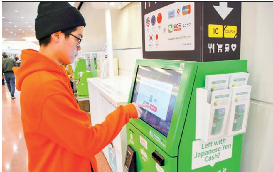
A visitor uses a currency converter at Haneda airport in Tokyo on 19 January 2021.

JAPAN'S three major banks will halt dollar transactions and money transfers with Russia's largest financial institution Sberbank following the United States' sanction against it in response