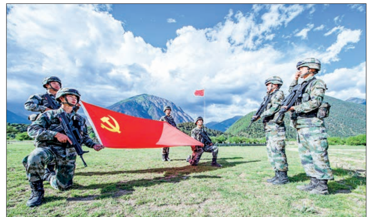
Two soldiers from a special combat brigade under the Tibet Military Command of the Chinese People's Liberation Army take an oath during a Party admission ceremony on a plateau near the China-India border.

The two sides should step up communication, coordination and mutual support to send more positive signals for upholding