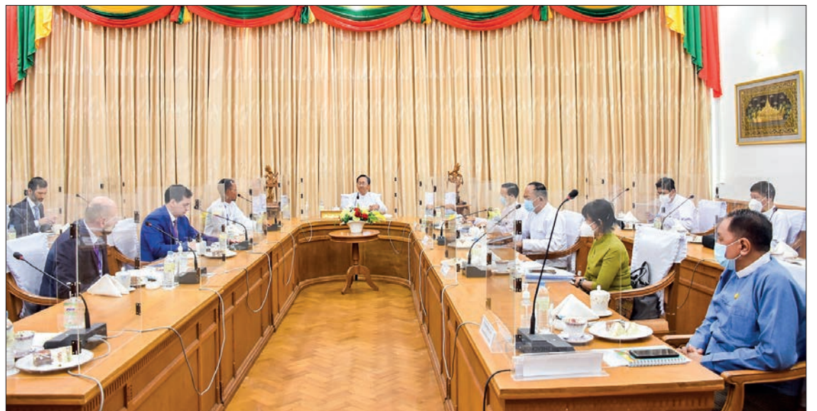
Union Minister for Health Dr Thet Khaing Win meets the delegation of the Eurasian Economic Commission (EEC) led by Project Manager Mr Iliia Nesterov of the Russian-Myanmar Friendship Association on 25 March.

international standard COVID-19 vaccine production sector of Russia, vaccine registration processes in Myanmar, medical research, manufacturing of medicines, hospital materials and diagnosis machines, medicinal technology and training, cooperation in the field of radiation therapy in cancer treatment, proper communication between the universities of medicine and universities of medical technology and the use of the solar system in hospitals and health department in remote areas. The event was attended by the deputy minister of the Health Ministry, the directors-general and representatives of the EEC. —MNA