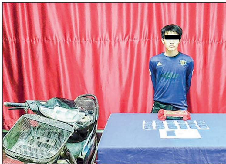
An arrestee is seen together with seized drugs and a motorbike.