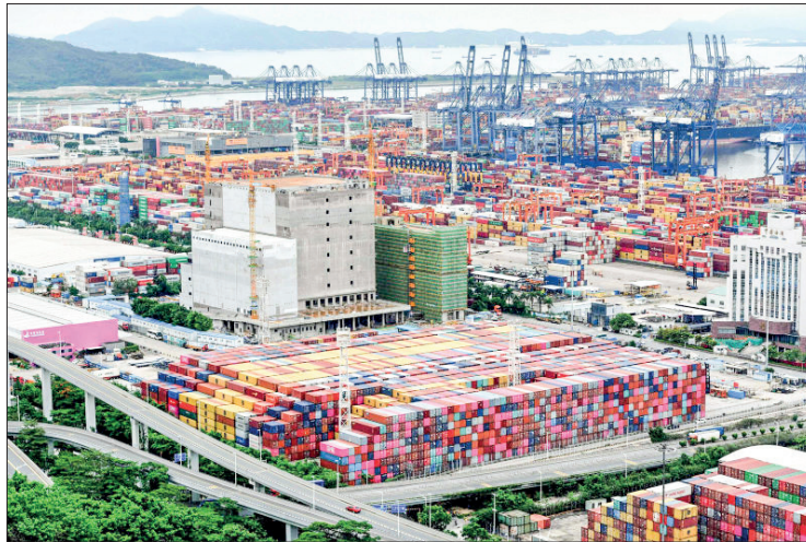
Last year, bilateral trade reached a new high, and China's investment in Britain more than tripled.

The trade volume between the two countries has increased from 300 million US dollars to 100 billion dollars, and the two-way investment stock has risen from almost zero to 50 billion dollars, Xi said.