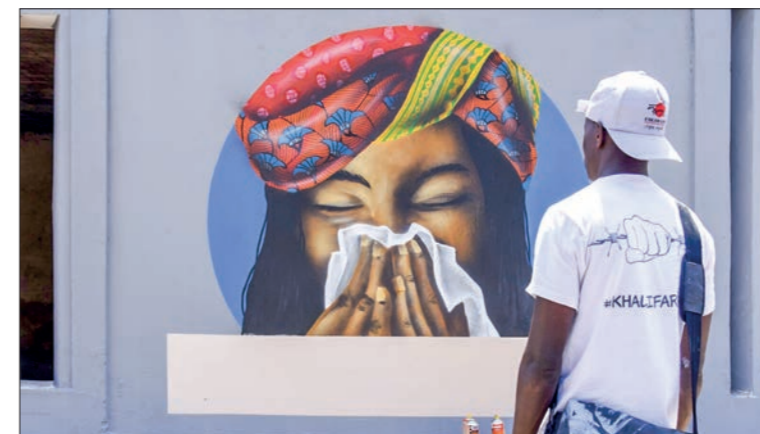
An image of a woman sneezing in a tissue serves as a reminder of preventive measure against COVID-19 at Cheikh Anta Diop University in Dakar on 21 March 2020.