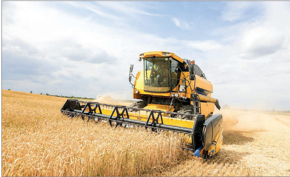
The EU harvested 119.1 million tonnes of common wheat and spelt in 2020, the equivalent of 41.6% of all cereal grains harvested.

“The EU is an agricultural superpower and we will ensure that our farmers have the Com-