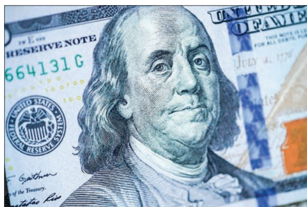
Photo taken on 23 March 2020 shows a US dollar banknote in Washington D.C., the United States.

THE US dollar inched lower in late trading on Friday as market participants digested newly-released economic data.