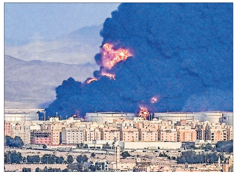
Smoke billows from an oil storage facility in Saudi Arabia's Red Sea coastal city of Jeddah on 25 March 2022.

The news added fuel to the already volatile oil market shadowed by supply risks related to the Russia-Ukraine conflict.—Xinhua ■