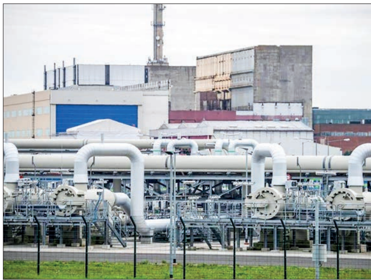
The Gascade Gas Receiving station adjoining the Nord Stream 2 Pipeline Inspection Gauge (PIG) receiving station in Lubmin, northeastern Germany.

THE US and EU announced a task force Friday aimed at reducing Europe's reliance on Russian