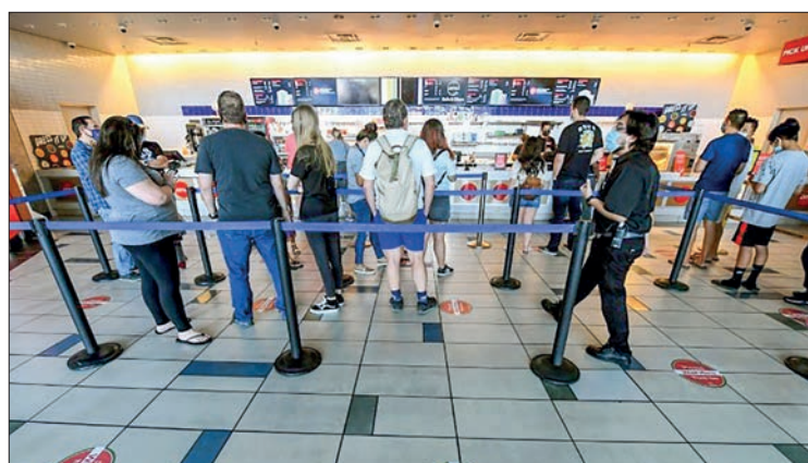
People line up at a concession stand at a movie theatre in Las Vegas, Nevada in August 2020.

Earlier, Chinese President Xi Jinping said that Beijing will stick to its "zero Covid-19" policy, days after National Health Commission (NHC) released new guidelines easing its control measures.— ANI ■