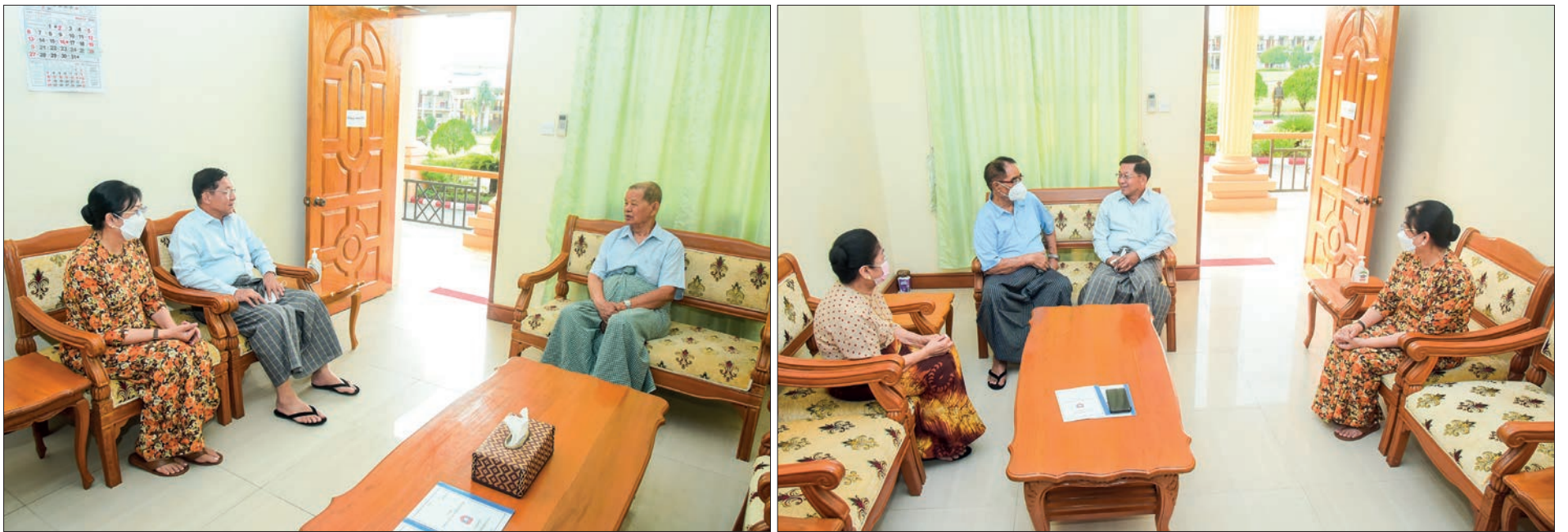
State Administration Council Chairman Commander-in-Chief of Defence Services Senior General Min Aung Hlaing and wife Daw Kyu Kyu Hla talk with the retired military personnel and their wives in Nay Pyi Taw yesterday.

THE retired military personnel and wives arrived at the Bayintnaung Guesthouse in Nay Pyi Taw to attend the military parade of the 77 th Anniversary Armed Forces Day.