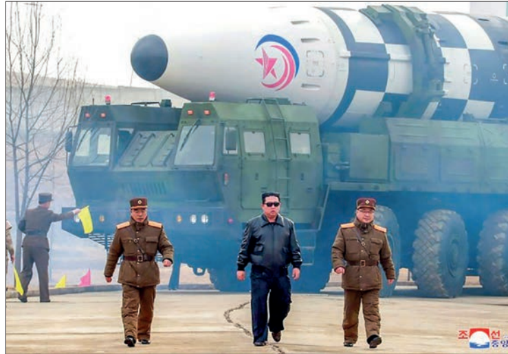
North Korean leader Kim Jong Un (C) walks near what state media said was a new inter-continental ballistic missile.

CHINA on Friday called for restraint on the Korean Peninsula nuclear issue after the test launch of an intercontinental ballistic missile was conducted