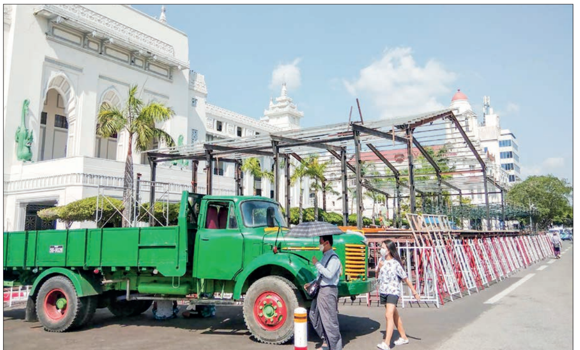
The construction of the Yangon Maha Thingyan Water Festival main pandal is underway.

Thingyan (water festival) is the biggest and most popular festival in Myanmar and this is very attractive to tourists. It is not only known as the Thingyan