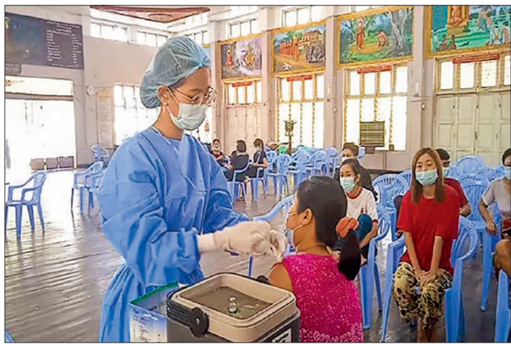
Locals get jabbed against COVID-19 in Mon State.

DOCTORS and nurses from public hospitals, Tatmadaw medical teams, healthcare workers and volunteers are working hard to administer COVID-19 vaccines in different states and regions as the vaccination programme is one of the most important activities in the prevention, control and treatment of COVID-19