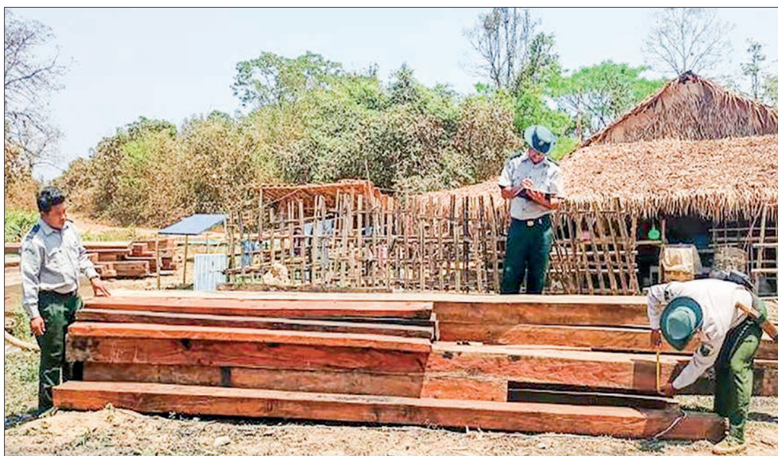
Officials seize illegal timbers.

On 26 March, an inspection team led by Police under the management of the Anti-Illegal Trade Task Force in Homalin Township carried out inspections and seized an unregistered motorcycle (estimated at K180,000) and is prosecuted under the Import and Export Law.