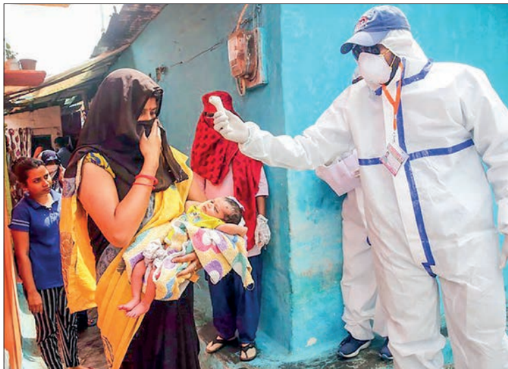
Slum dwellers being checked by medics amid nationwide lockdown to curb the spread of coronavirus at Vallabh Nagar locality, in Bhopal, in Madhya Pradesh on 20 April 2020.

India's active caseload currently stands at 21,530. It accounts for 0.05 per cent of the total positive cases. The active cases dipped by 897 since yesterday.