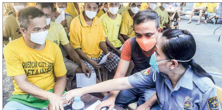
This file photo shows inmates from the Quezon City jail being processed during a mass screening for tuberculosis (TB) in suburban Manila.

"TB remains one of the world's deadliest infectious killers. Each day, over 4,100 people lose their lives to TB and close to 30,000 people fall ill with this preventable and curable disease," the WHO said. The coronavirus pandemic disrupted access to TB services, the WHO said, as it called for countries to restore pre-pandemic services, especially for children and adolescents.— AFP ■