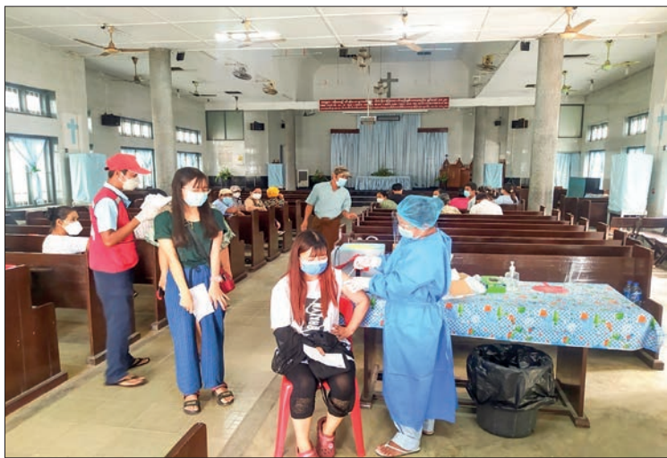
Inoculation continues in states/regions.

DOCTORS and nurses from public hospitals, Tatmadaw medical teams, healthcare workers and volunteers are working hard to give COVID-19 vaccines in different states and regions as the vaccination programme is one of the most important activities in the prevention, control and treatment of COVID-19 disease.