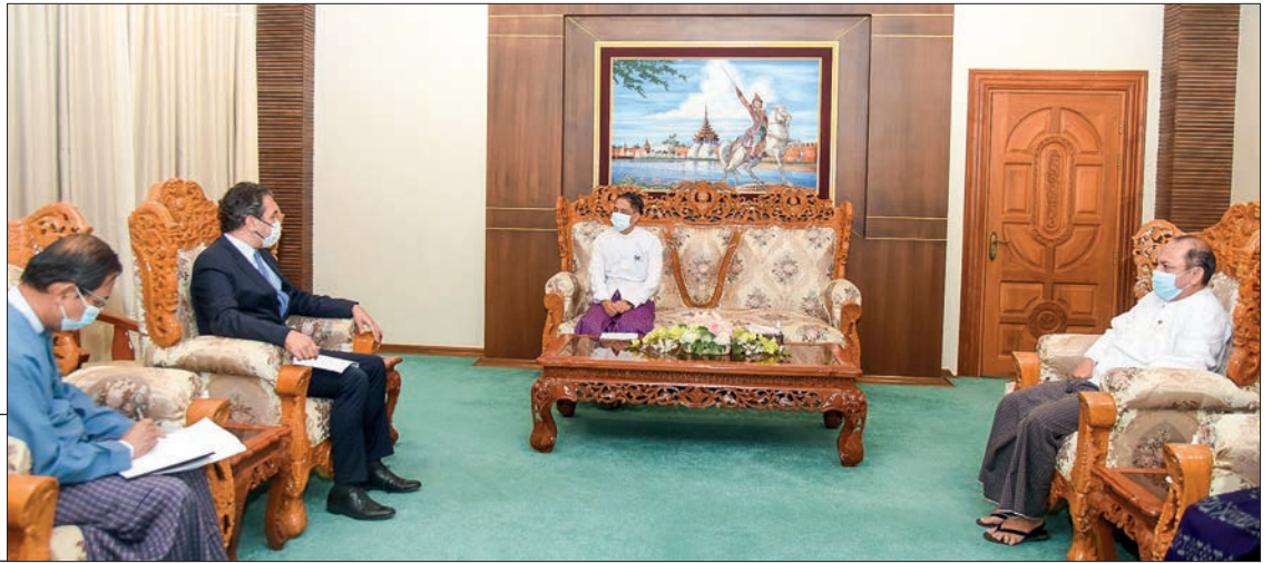
The MoIC Union Minister receives the ICRC Resident Representative in Myanmar yesterday.

At the meeting, they exchanged views on the progress of ongoing humanitarian assistance provided by the ICRC and potential areas of further cooperation between Myanmar and the ICRC.—MNA