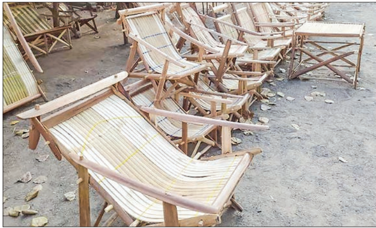
The toddy-palm chairs from Intawkyel village are displayed beside the road. The chairs are bought by the domestic travellers visiting the Bagan-NyaungU archaeological site, stopping their car.

THE people from Intawkyel village, Kyaukpadaung Township of Mandalay Region are manufacturing a lot of toddy-palm chairs and selling them in bulk, it is learnt.