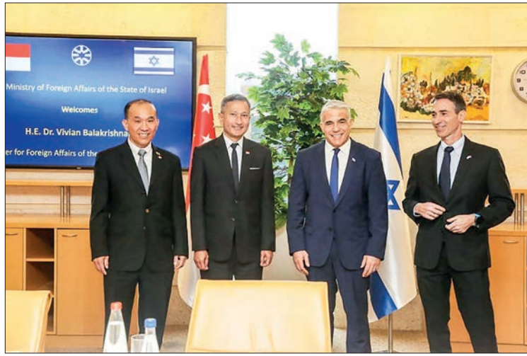
Israel's Foreign Minister Yair Lapid, who met Balakrishnan on Monday, said Singapore's decision to open an embassy highlighted "the good and special relations between our two countries", which were established in 1965.