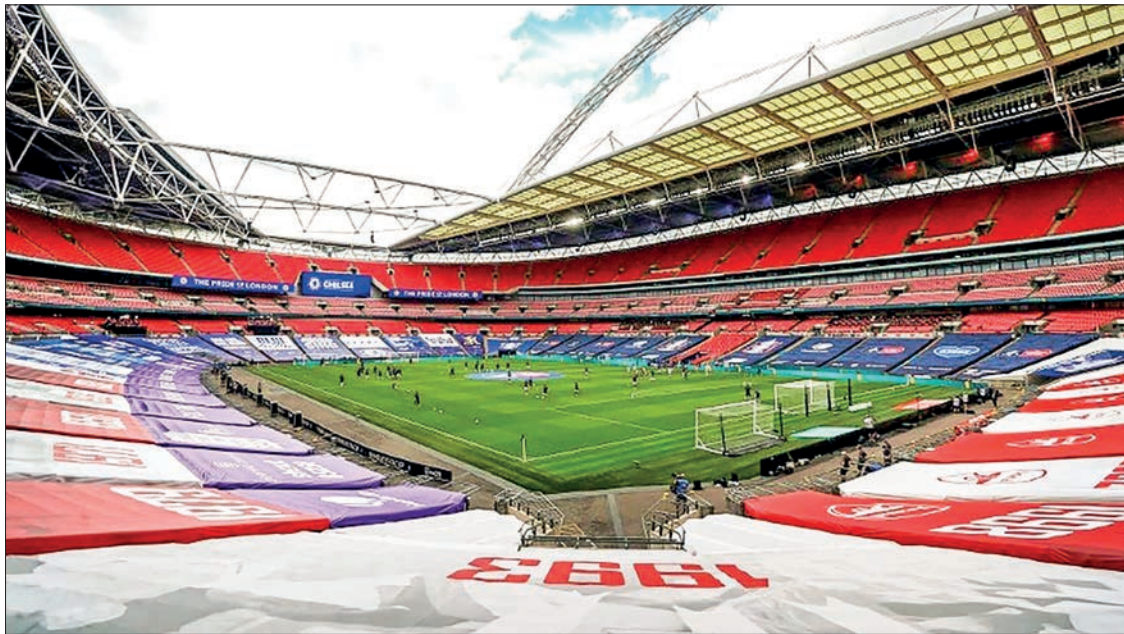
Wembley hosted the Euro 2020 final between England and Italy.

THE UK and Ireland look set to be named as joint hosts of the European Championship in 2028 with no rival bids looking likely before this week's deadline, the Times reported on Monday.