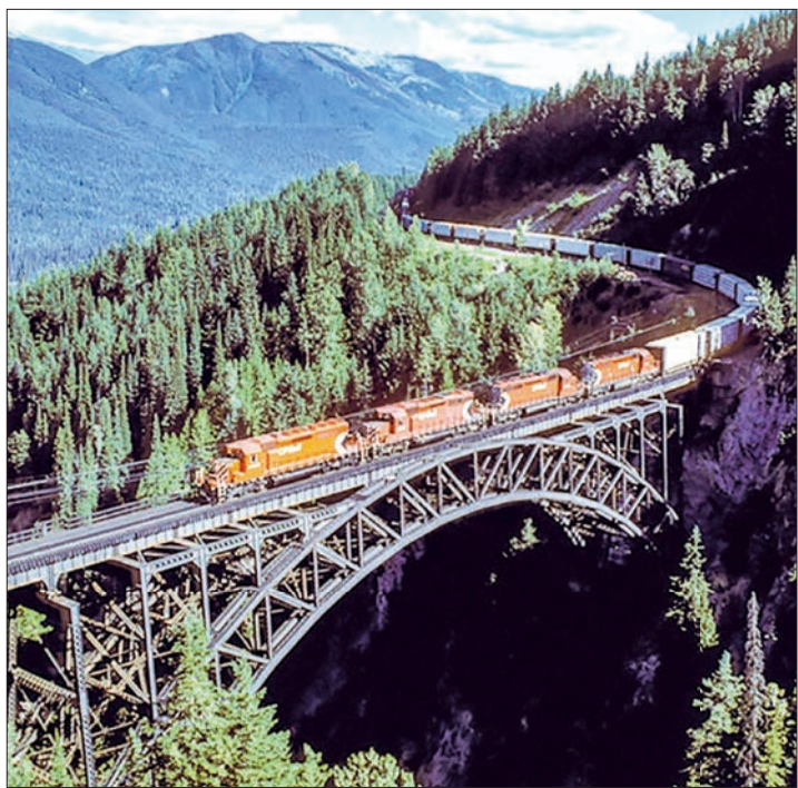
Railway giant Canadian Pacific's network crosses much of southern Canada and extends as far as Kansas City, Missouri, in the central United States. An eastbound CP freight train at Stoney Creek Bridge descending from Rogers Pass.

The pound was floated at the time as part of a package of reforms in exchange for a $12-billion bailout from the International Monetary Fund.—AFP ■