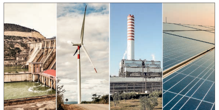
Italy's new energy tax will help finance a 4.4 billion euro package of measures designed to alleviate soaring energy prices for households and businesses.

The Spanish government attempted to tax profits of major energy companies in September, before it backtracked months later in the face of opposition by the sector, which warned the measure would jeopardize future investment.—AFP ■