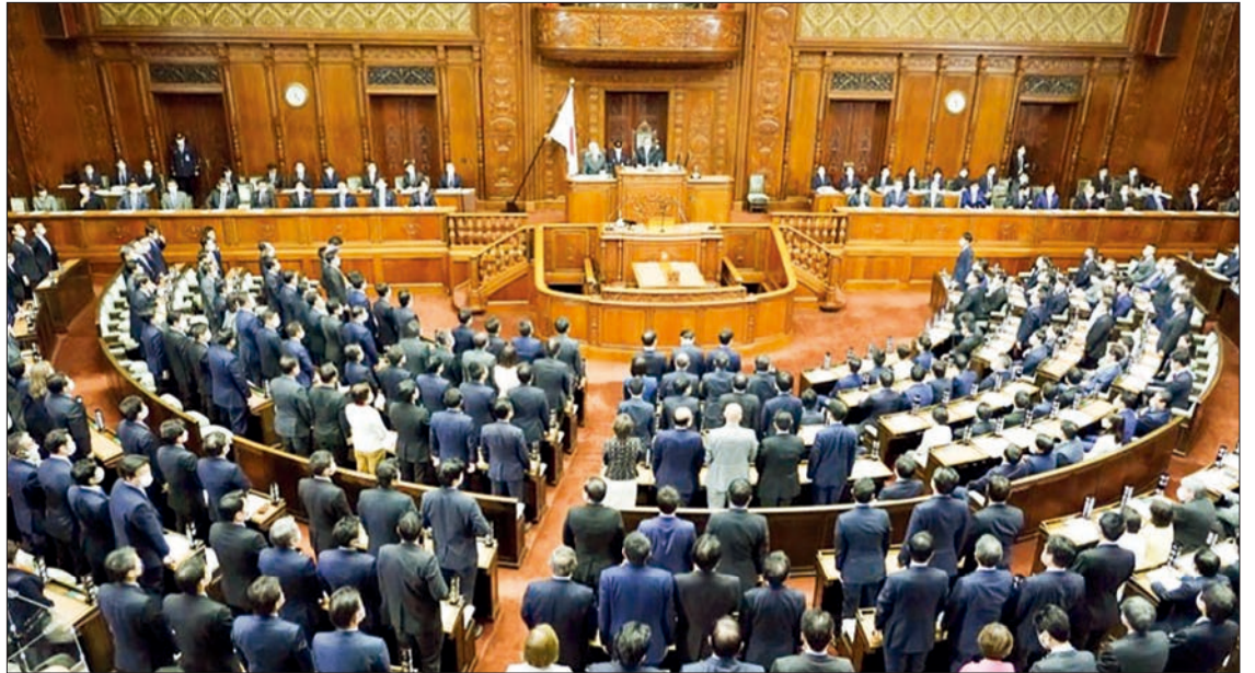
Japan's Diet enacted Tuesday a record 107.60 trillion yen ($900 billion) budget for fiscal 2022 to finance measures against the coronavirus as well as rising social security and national defense costs.

JAPAN'S Diet enacted Tuesday a record 107.60 trillion yen ($900 billion) budget for fiscal 2022 to finance measures against the coronavirus as well as rising social security and national defence costs.