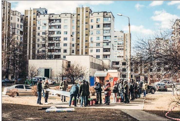
People line up to get plastic covers to mend broken windows on 17 March, 2022 in Kyiv, Ukraine.

Ukrainian President Volodymyr Zelensky renewed an offer of direct peace talks with his Russian counterpart Vladimir Putin late Monday, declaring the status of disputed territories could be up for debate and a possible referendum. Zelensky told local media that he was ready to meet Putin "in any format" to discuss ending the almost one-month-old