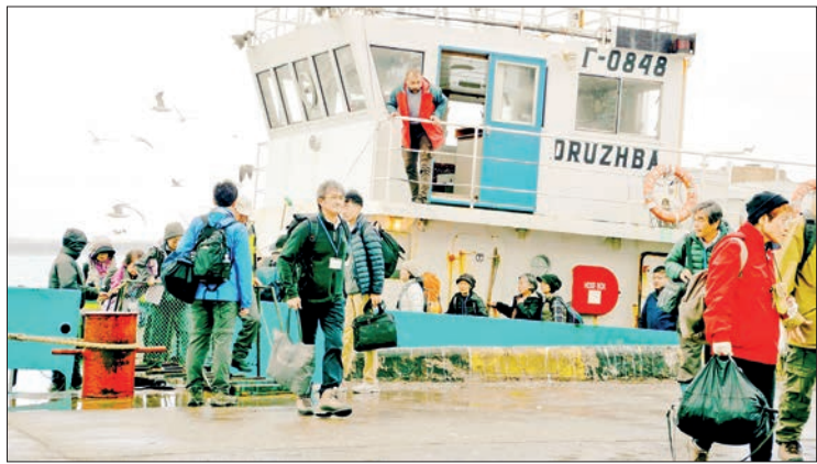
Moscow will also cancel visa-free travel for Japanese citizens to the four disputed Pacific islands, which are known as the Southern Kurils in Russia and the Northern Territories in Japan. Visitors from Japan arrive at Russian-held Kunashiri Island on 30 Oct 2019 : it was the first ever by Japanese tourists to the disputed islands.

THE Russian Foreign Ministry said Monday that it will no longer continue peace treaty negotia-