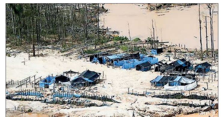
Illegal miners in Peru left a huge desert of sand in the middle of the lush jungle due to mercury contamination produced by their activities.

The Minamata treaty, which takes its name from the southwestern Japanese city of Minamata where industrial emissions of mercury caused a poisoning disease affecting thousands of people, has not regulated mercury's illegal trade. According to a 2020 report from the UN Environment Programme, the illegal trade of mercury has increased as a result of countries' attempts to restrict the metal's supply and use, with the value of the trade reaching up to $215 million annually.—Kyodo ■