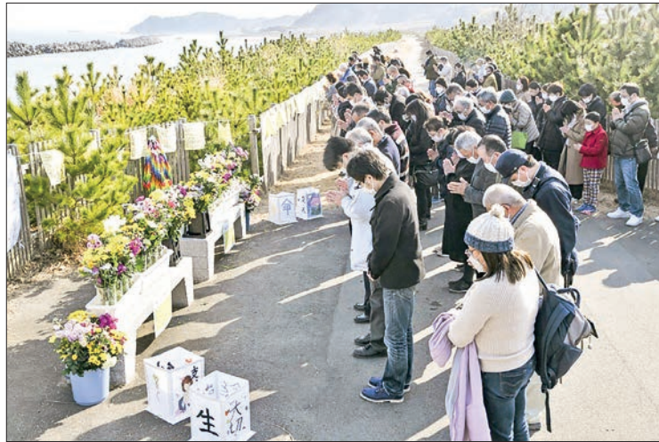
People pray in Iwaki, Fukushima Prefecture, at 2:46 pm on 11 March 2022, exactly 11 years after a massive earthquake struck northeastern Japan, triggering a killer tsunami.

The task force also called for measures to address issues