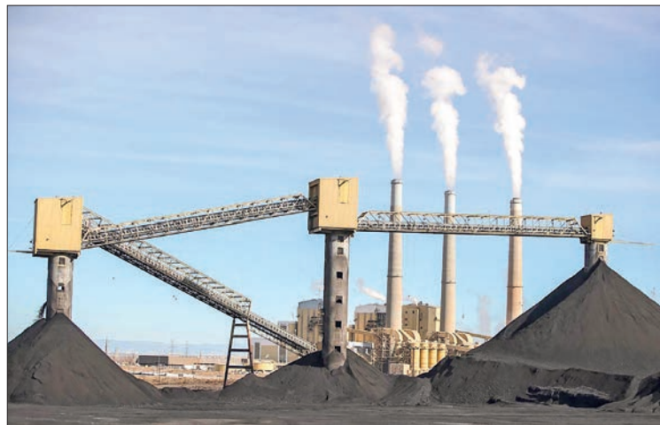
Coal piles outside of PacifiCorp's Hunter power plant in Castle Dale, Utah.

PUBLICLY-TRADED US companies would be required to disclose their greenhouse gas emissions and their approach to managing climate change risks under a proposed rule approved by