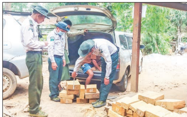
Officials seize illegal timbers.

In addition, consumer goods that were not declared in the import declaration (ID) (estimated value of K30,585,000) were seized at the Myanmar Industrial Port Container Checkpoint in Yangon, and action is tak-