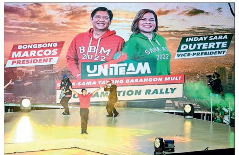
Philippine President Rodrigo Duterte's party on Tuesday threw its support behind presidential election favourite Ferdinand Marcos Junior, as his main rival appears to gain momentum in the race for the top job.