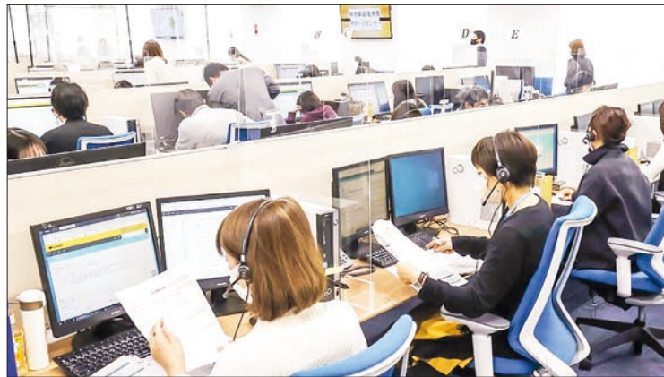
Photo shows a support centre set up by the Tokyo metropolitan government for coronavirus patients recovering at home.

On Thursday, the government decided to officially lift the