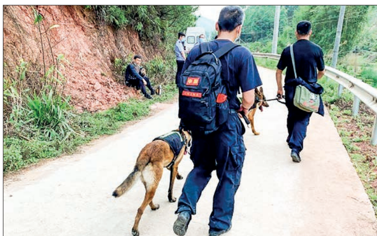
Recovery teams clambered over a scene of upturned earth, blasted trees and scattered debris, including a section of plane bearing the carrier's blue and red livery.

CHINESE recovery teams on Tuesday picked through the debris of a crashed China Eastern jet after it inexplicably plummeted from the sky into a mountainside with 132 people on board.