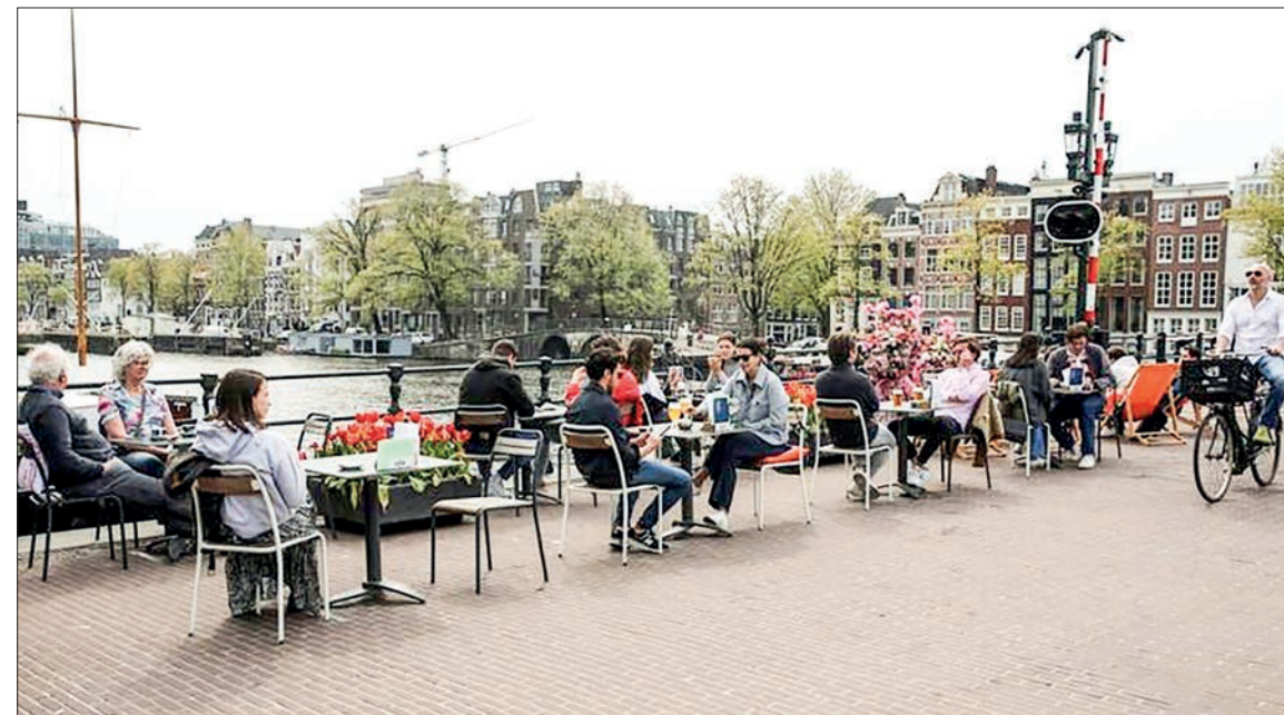
Customers sit on a terrace alongside a canal in Amsterdam, on 28 April 2021, as the Dutch government eased the restrictions put in place to curb the spread of COVID-19.

"The BA.2 version of Omicron seems to be behind this uptick in infections, which again shows how quickly the situation can change as the virus evolves into new forms," he told the Science Media Centre.