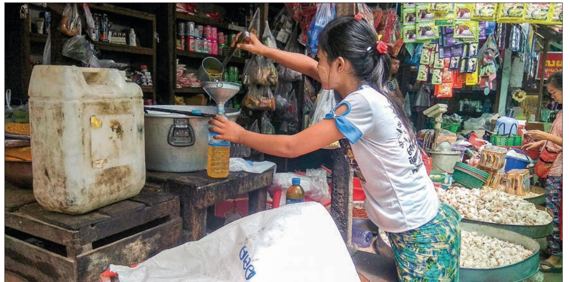
Cooking oil is measured at one of the local outlets.

The domestic consumption of edible oil is estimated at 1 million tonnes per year. The