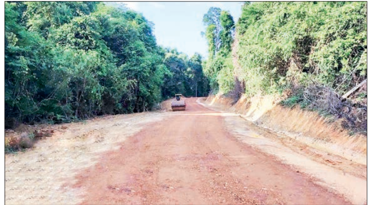
Upgrading of the Zadetgyi Island coastal road is underway.

The process of paving work is conducted by the Progress of Border Areas and National Races Department of the Ministry of Border Affairs with K285.841 million of the Union fund during the six-month mini-budget period (October 2021-March 2022) for the development of border areas, according to the Taninthayi Region De-