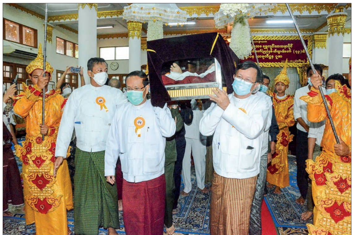
The final rites of late State Ovadacariya Chairman of Shwegyin Nikaya Dhipati Presiding Sayadaw in progress.