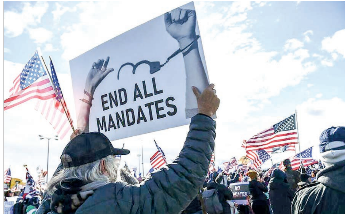
A demonstrator holds a sign reading during a rally with truckers at the start of 'The Peoples Convoy' protest against COVID-19 vaccine and mask mandates in Adelanto, California, on 23 February.

Experts warned that the United States may see another rise in COVID-19 cases in the next few weeks as the new Omicron subvariant continues to spread across the country.