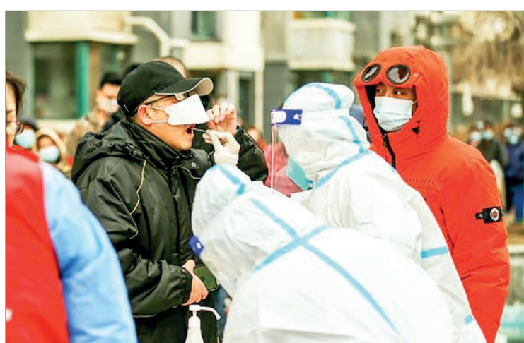
The city of Shenyang in northeastern Liaoning province was ordered to lock down late Monday.

Authorities have warned of the risk posed to growth by per-