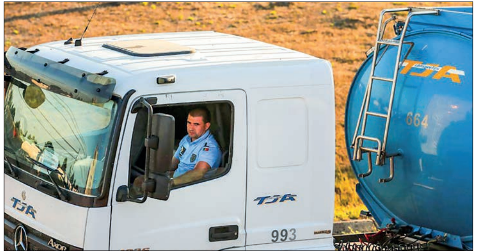
The measure aims to reinforce support for companies affected by fuel price inflation, which has risen by an average of 10 per cent in the last two weeks.

Portuguese Prime Minister Antonio Costa had already announced a package benefiting individual consumers in general, the main measure being the return of amounts charged as Tax on Petroleum Products. (1 euro = 1.11 US dollars)—Xinhua ■