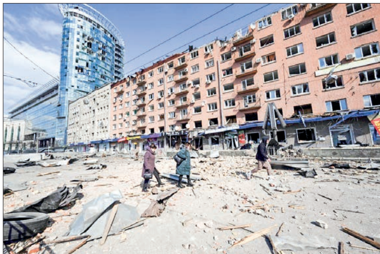
People walk by a building damaged by shelling amid Russian invasion of Ukraine in Kyiv on 17 March 2022, as Russian troops try to encircle the Ukrainian capital as part of their slow-moving offensive.