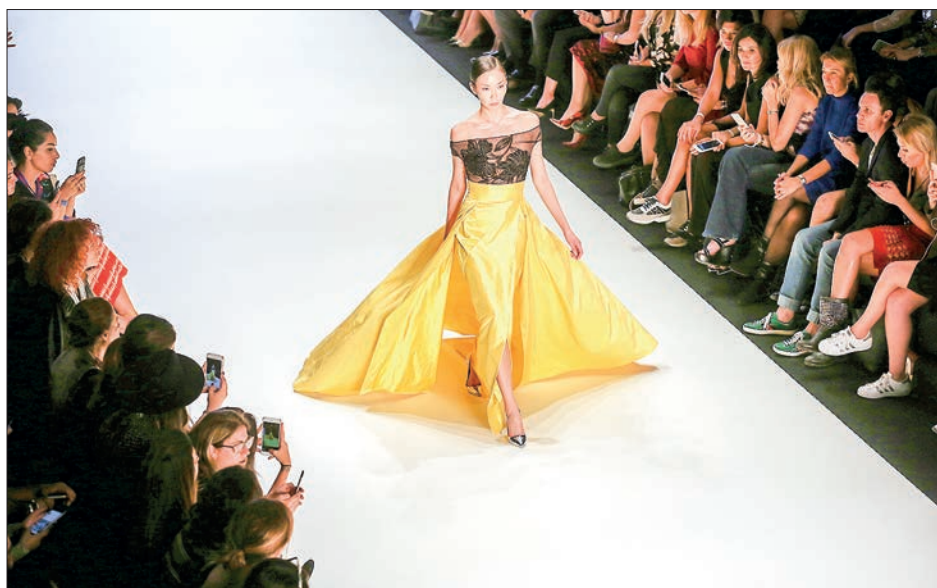
Mercedes-Benz Fashion Week Istanbul.

RUNWAY fashion shows have made a major comeback in Istanbul, Turkey's cultural and financial hub, after a two-year hiatus due to the COVID-19 pandemic. More than two dozen Turkish designers