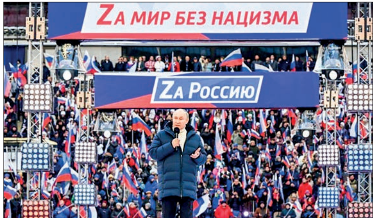
President Vladimir Putin addressed tens of thousands of supporters at a Moscow rally marking the eighth anniversary of Russia’s annexation of Crimea

RUSSIAN President Vladimir Putin on Friday termed the war waded on Ukraine as a “heroic” mission by his country’s army during a patriotic rally at a Moscow stadium. Putin made the remarks at a rally held at Luzhniki Stadium here to celebrate the