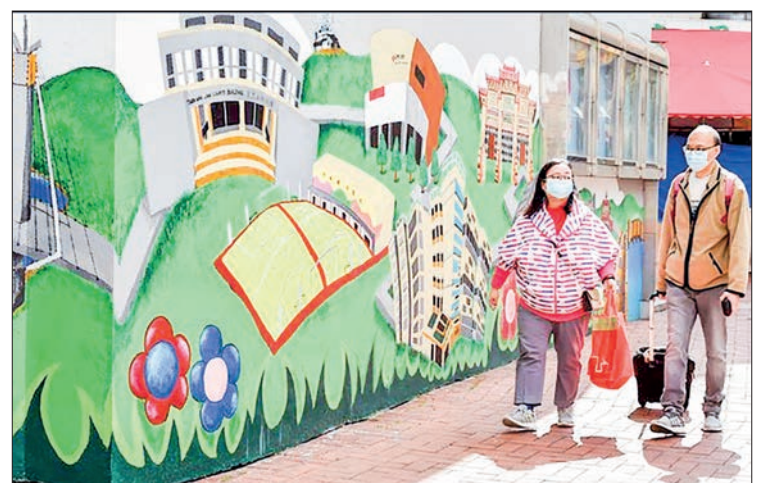
People wearing face masks walk in Tsuen Wan, south China’s Hong Kong, 28 February 2022.

the tough working conditions the medics face in Hong Kong – travelling in a closed-loop bubble and toiling in makeshift hospitals far from their families. Lam’s administration has been widely panned over its unclear public messaging and handling of Hong Kong’s fifth Covid-19 wave, which has seen nearly a million cases recorded and about 5,000 deaths in less than three months.—AFP ■