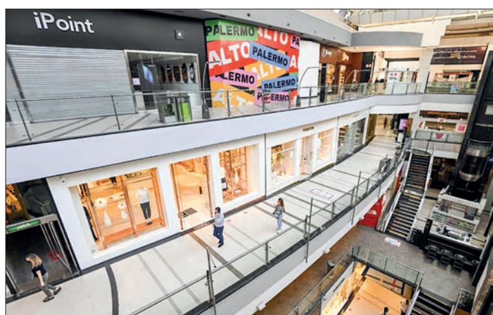
Under the new deal, Argentina has committed to progressively reducing its fiscal deficit from three percent in 2021 to just 0.9 percent in 2024. A shopping center in Buenos Aires.

Last week, the agreement won the approval of the Chamber of Deputies with a broad consensus between the centre-left ruling coalition and the centre-right opposition, a rarity in Argentina.—AFP ■