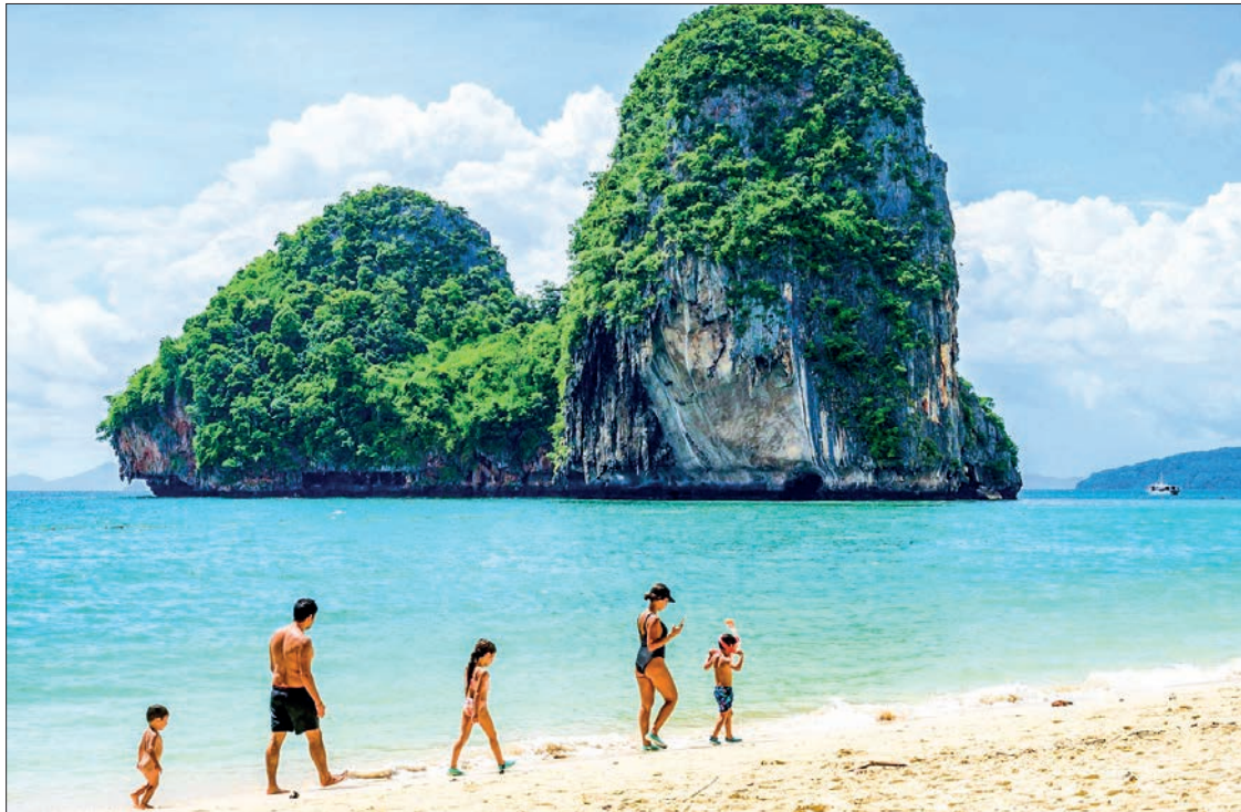
From 1 April, the requirement to take a negative test within 72 hours of travel will be scrapped, and instead visitors will be tested on arrival in Thailand.

DESPITE record-high daily COVID-19 cases, Thailand on Friday announced further easing of social distancing rules nationwide, allowing more businesses to resume operations.