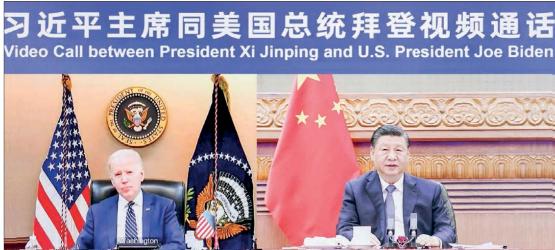
Biden and Xi began speaking at 13:00 GMT on Friday, the White House said.

countries should not come to the point of meeting on the battlefield. Conflict and confrontation are not in anyone's interest, and peace and security are what the international community should treasure the most, he added.