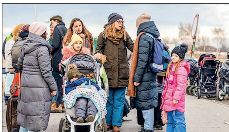
People from Ukraine arrive at Medyka, Poland, 26 February 2022.

POLAND'S border guards said Friday that more than two million refugees had crossed into the EU member from neighbouring Ukraine since the 24 February Russian invasion.