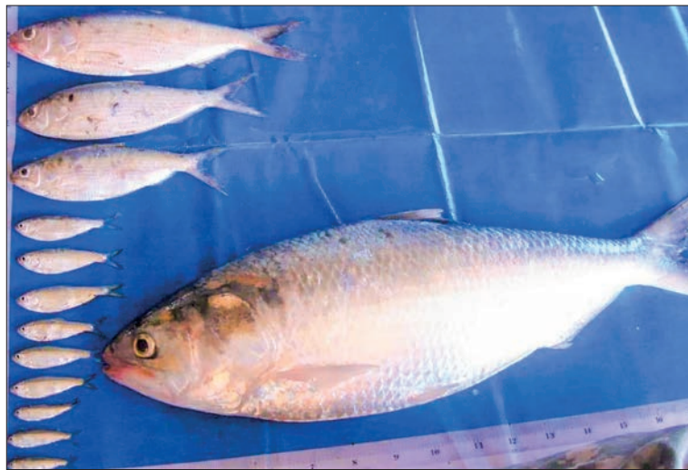
Myanmar is the third-largest producer of Hilsa with only three per cent.

Climate change affects all regions across the world. Lack of wastewater treatment in the factories, livestock businesses, mining activities and agribusinesses, improper waste disposal, sand dredging, having waterways blocking Hilsa migrating jour-