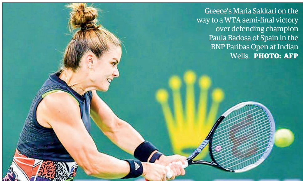
Greece's Maria Sakkari on the way to a WTA semi-final victory over defending champion Paula Badosa of Spain in the BNP Paribas Open at Indian Wells.

MARIA Sakkari ended Paula Badosa's bid for a repeat title at Indian Wells on Friday, beating the defending champion to set up a final clash with former French Open winner Iga Swiatek.