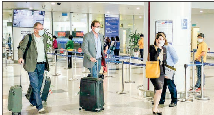
Travellers are seen at Noi Bai International Airport in Hanoi, Vietnam, on 15 March 2022. Vietnam on Tuesday fully reopened its borders for international tourists, its tourism authorities said.

Vietnam’s overarching goal in the period is to ensure effective disease control, protect the life and health of the people, minimize the number of serious illnesses and deaths caused by disease, and enable economic recovery and development, the document said. Thanks to high vaccination coverage, the death