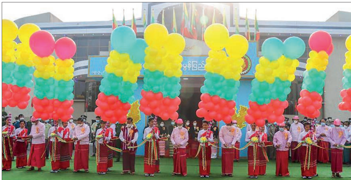
The SAC members and dignitaries cut the ceremonial ribbon to launch the display booths in marking the 48 th Mon State Day.

Aung Moe read out the message sent by SAC Chairman Prime Minister Senior General Min Aung Hlaing to the ceremony to mark the 48 th Anniversary Mon State Day.