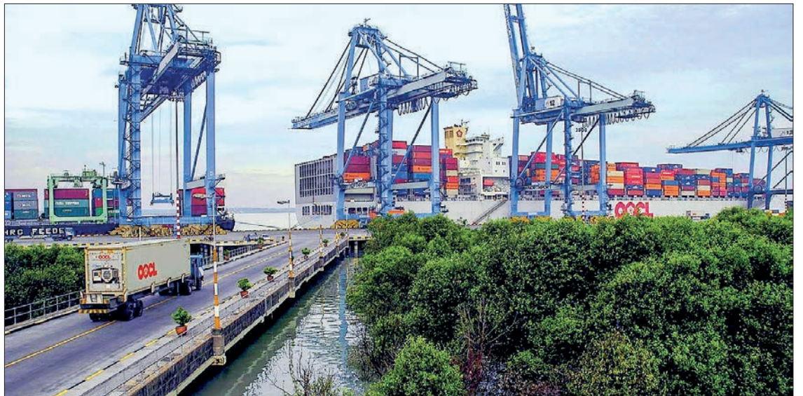
Malaysia is expected to see a 200-million-US dollar increase in export gains, making the RCEP a vital tool in recovering from the economic disruptions caused by the COVID-19 pandemic. Port Klang (Malay: Pelabuhan Klang) is a town and the main gateway by sea into Malaysia.

THE Regional Comprehensive Economic Partnership (RCEP), the world's largest trade deal so far, came into effect in Malaysia from Friday, the country's trade ministry said in a statement.