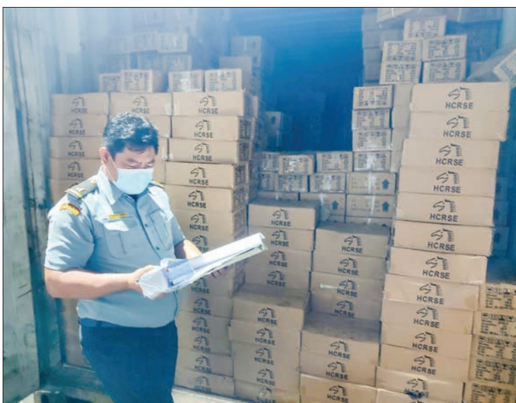
Seized illegal commodities in Yangon Region.

Therefore, a total of 14 arrests (estimated value of K96,835,922) were made on 12, 13, 15, 18 and 19 March, according to the committee. —MNA