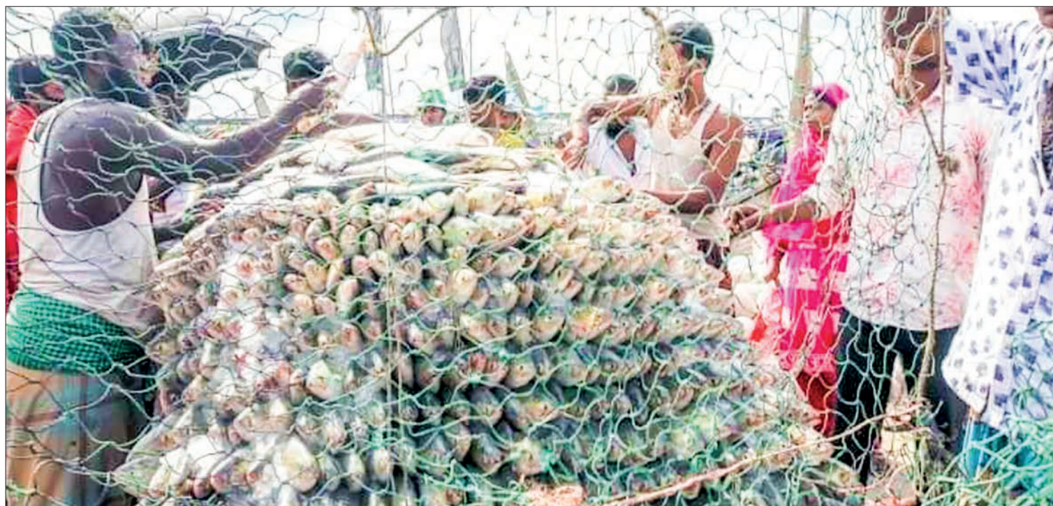
The Hilsa shad is primarily harvested in Rakhine and Mon states and Dawei and Myeik districts in Taninthayi Region, Bago Region and Yangon Region. The best fishing spots are Ayeyawady Region and Mon State.

Hilsa shad is anadromous fish species, and it lives in the