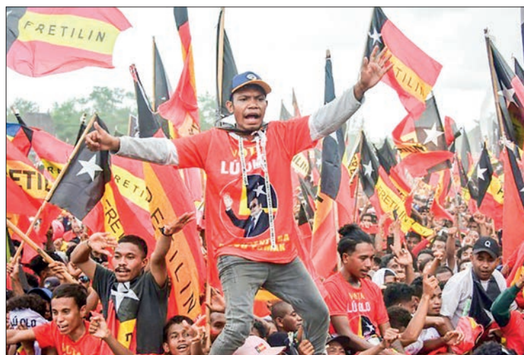
Supporters from the Fretilin party attend a campaign rally in support of East Timor President Francisco Guterres.

EAST Timor's citizens were at the polls on Saturday to elect a new president, hoping the most competitive election in the history of Southeast Asia's youngest country will end a protracted political impasse.