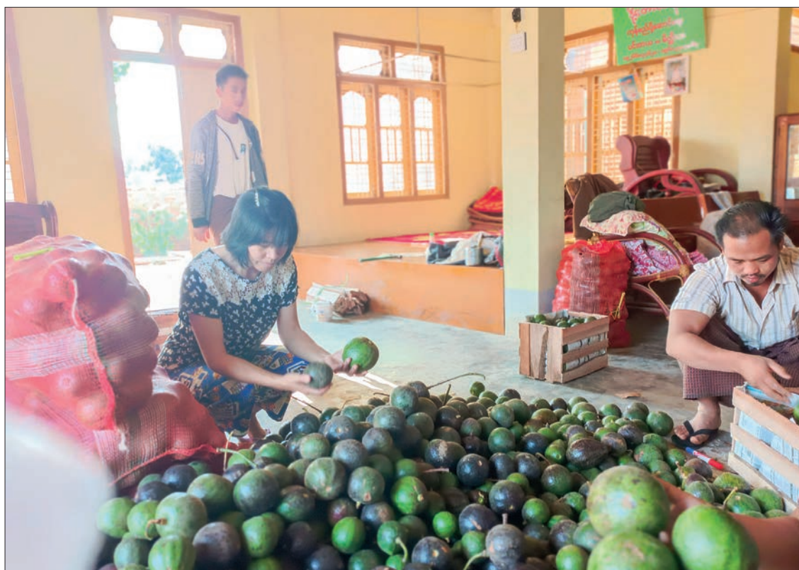
This is the main season of avocado production. Farmers are selling them by bringing it to the market. Pindaya township is located at 3,880 feet above sea level and the region is growing local crops using agricultural techniques to attain good varieties of local fruits, vegetables and flowers.

THE avocados were grown near the villages in Pindaya township, Danu Self-Administered Zone, Shan State (South). Now, the growers are happy to get good price for avocado this year because it can create more job opportunities and earn the extra family income.