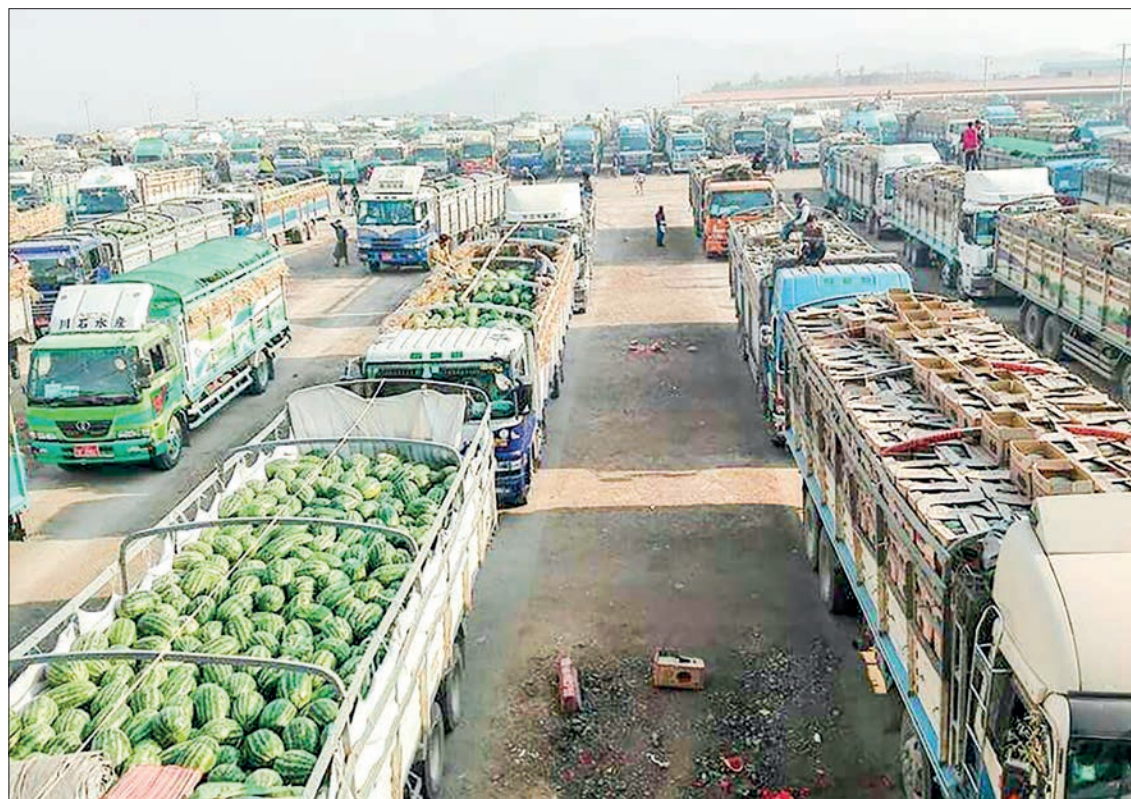
Exports to China through Muse are made up largely of agricultural produce like rice, beans and fruits, while Myanmar imports medicines, electronics and construction materials via the overland route.

Exports to China through Muse are made up largely of agricultural produce like rice, beans and fruits, while Myanmar imports medicines, electronics and construction materials via the overland route. —ACM