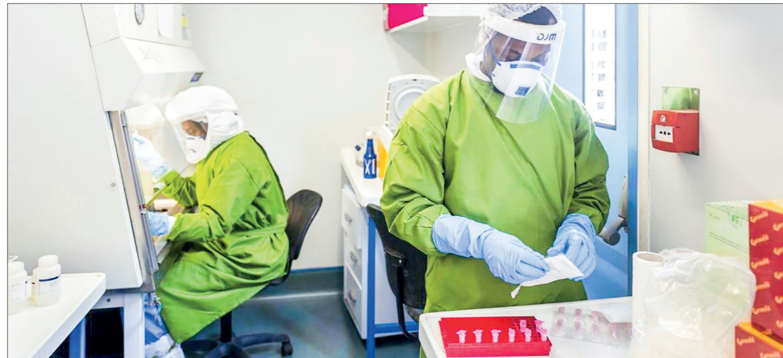
The World Health Organization is helping countries boost testing capacity for SARS-CoV-2, the virus that causes COVID-19.

"We still have Omicron which is transmitting at a very intense level around the world. We have sub-lineages of Omicron BA.1 and