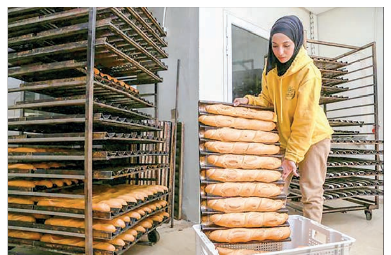
The war in Ukraine will continue to push up food prices as the supply from the "Breadbasket of Europe" is cut in the short term and, possibly, the long term depending on how the conflict plays out. A staff member fetches freshly-baked bread at a bakery in the capital Tunis.

For maize, the increase would be 8.2 percent in the moderate case and 19.5 percent in the severe scenario. For other coarse grains, prices would rise by 7 to 19.9 percent, and for oilseeds by