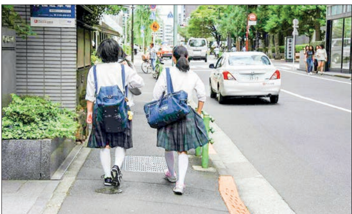
Japanese schoolgirls walk on a street in Tokyo on 1 September 2019.

Later this month, he will enter court-mediated arbitration with the school and city, hoping authorities will revise the rules. Change is already under way in Tokyo, which recently announced that strict rules on issues such as hair colour will be scrapped at public schools in the capital from April.—AFP ■