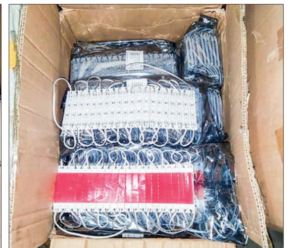
Confiscated illegal goods at the warehouse of Yangon International Airport.