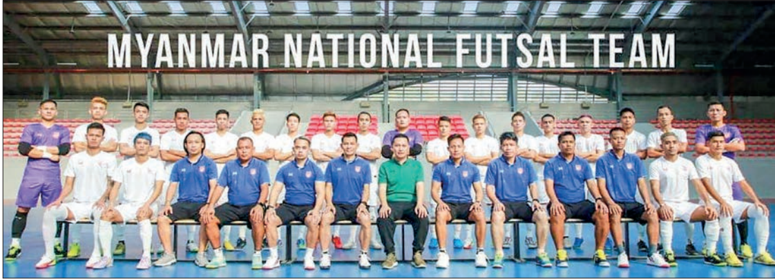
The Myanmar Futsal Team players pose for a group photo with team authorities and coaches.

THE ASEAN Football Federation has recently announced fixtures for the 2022 ASEAN Futsal Championship to be played by Myanmar Futsal Team.