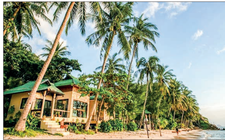
Thailand's tourism industry accounts for about a fifth of the country's economy.

Thailand is currently recording around 25,000 new cases of Covid a day as the Omicron variant spreads around the country, but officials hope this will tail off in time for them to move to a "post-pandemic" phase from July.