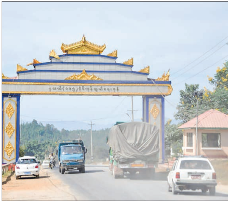
The Sino-Myanmar border trade zone.

Major export items via Mang Wein crossing various beans and pulses, rice and