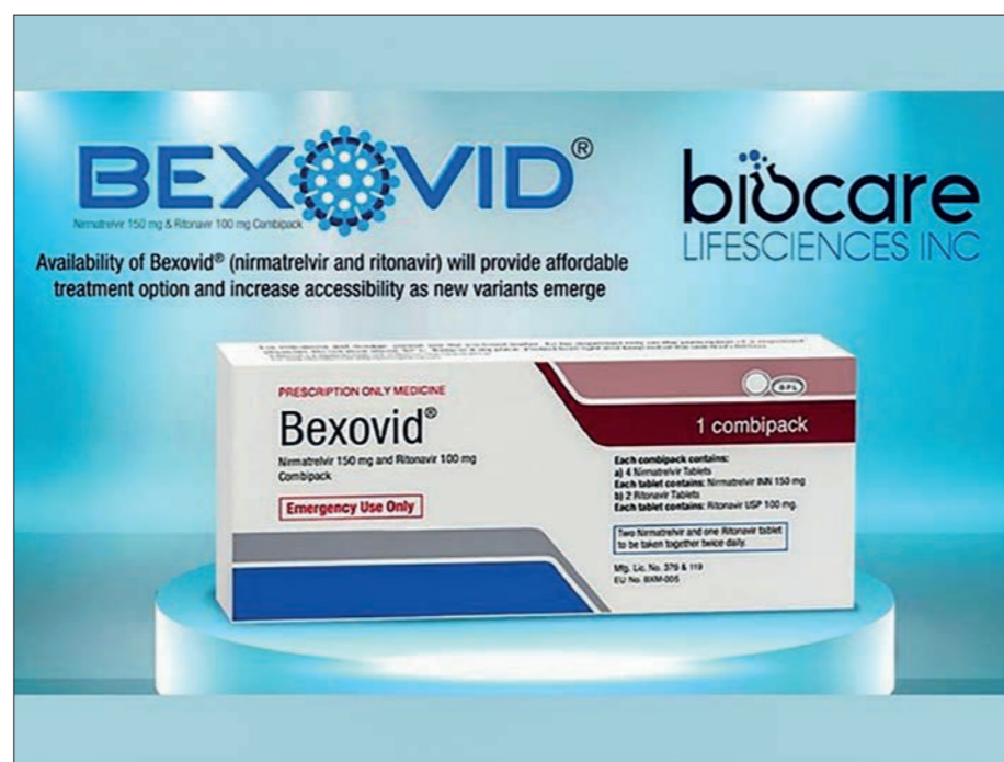
Philippines FDA approves world's first generic version of Pfizer's anti-Covid pill. The Manila city government on 10 March 2022 received its order of Bexovid drug for the treatment of mild to moderate coronavirus disease 2019 (Covid-19) for individuals 12 years old and above.

The sub-licences allow manufacturers to produce the raw ingredients for nirmatrelvir, and/or the finished drug itself co-packaged with the HIV medicine