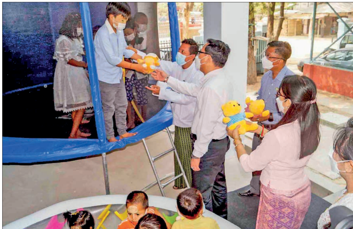
The MoI Union Minister comforts the children at the Natmawk Community Centre.

centre was constructed using more than K414 million of State budget and the Magway Region government donated materials worth K50 million.