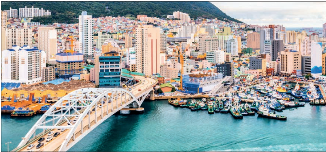
Busan Harbour, the largest port in South Korea.

SOUTH Korea's economy was faced with uncertainties both at home and abroad amid the spread of the COVID-19 Omicron variant and geopolitical risks in Europe, a government report said Friday.