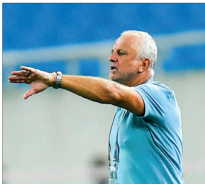
Australia coach Graham Arnold has tested positive for Covid-19.

AUSTRALIA suffered a major setback Friday ahead of their must-win World Cup qualifier against Japan next week with coach Graham Arnold testing positive for Covid-19.