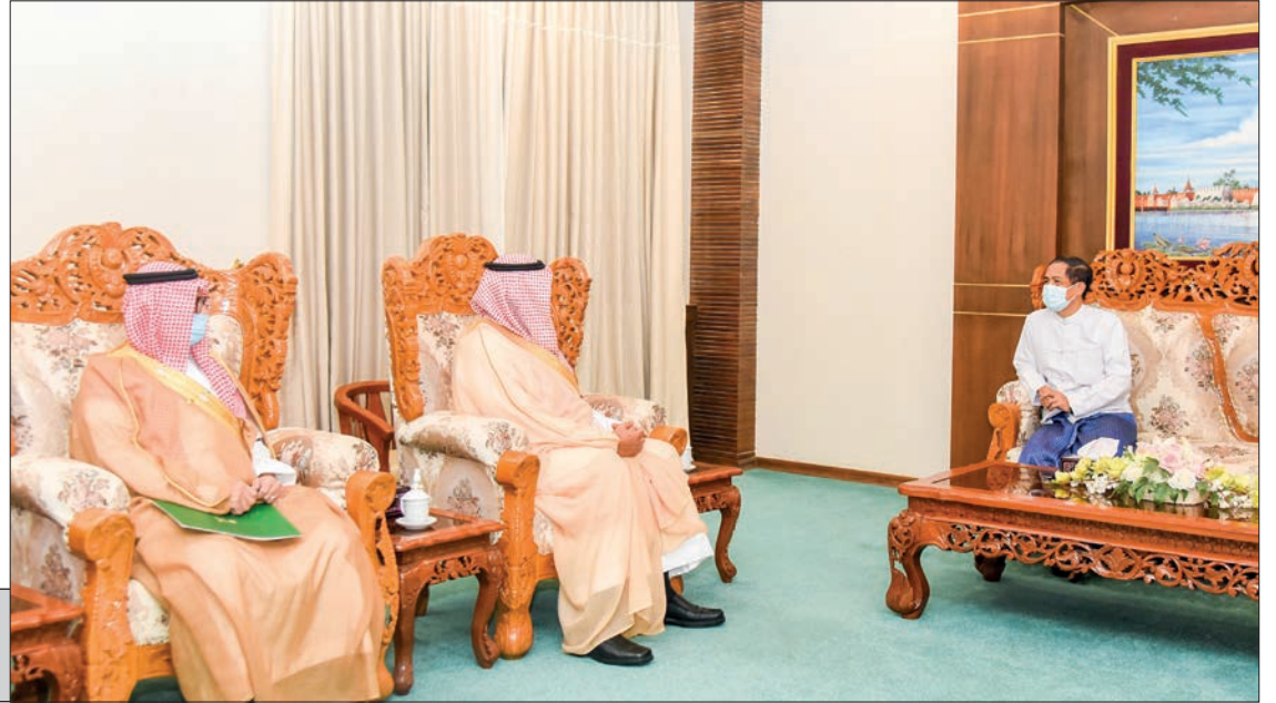
The Union Minister for International Cooperation receives the Saudi Arabian Ambassador to Myanmar.

They cordially exchanged views on the importance of religious harmony, expanding bilateral cooperation, particularly in trade, investment and energy sectors.—MNA