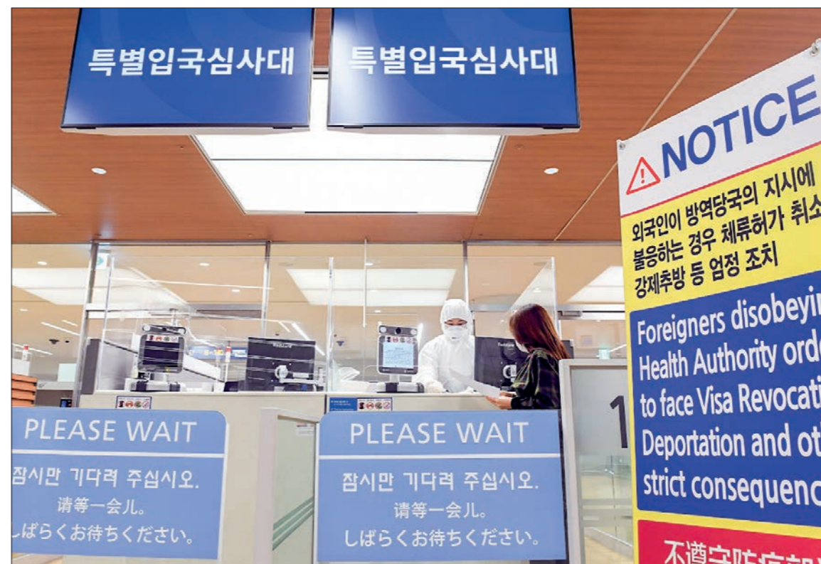
WHO said cases are especially on the rise in parts of Asia. A staff member checks information of a foreigner entering South Korea at Incheon International Airport in Incheon, South Korea, 8 April 2020.