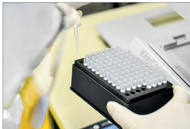
A staff member works at the air-inflated testing lab for COVID-19 nucleic acid testing in Beichen District of north China's Tianjin, Jan. 13, 2022.

VV116 was first approved for clinical trials in Uzbekistan and allowed to be used in the treatment of moderate to severe COVID-19 patients in the country in late 2021.—Xinhua ■