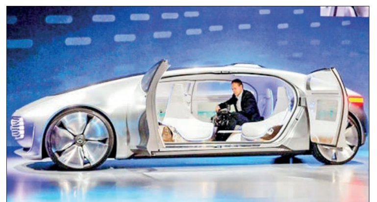
Total EU luxury sales to Russia were worth €3.5 billion per year. The Mercedes-Benz F 015 Luxury car.

Schumer said he expected the move to have "broad bipartisan support" in the Senate, vowing to push it through quickly.— AFP ■