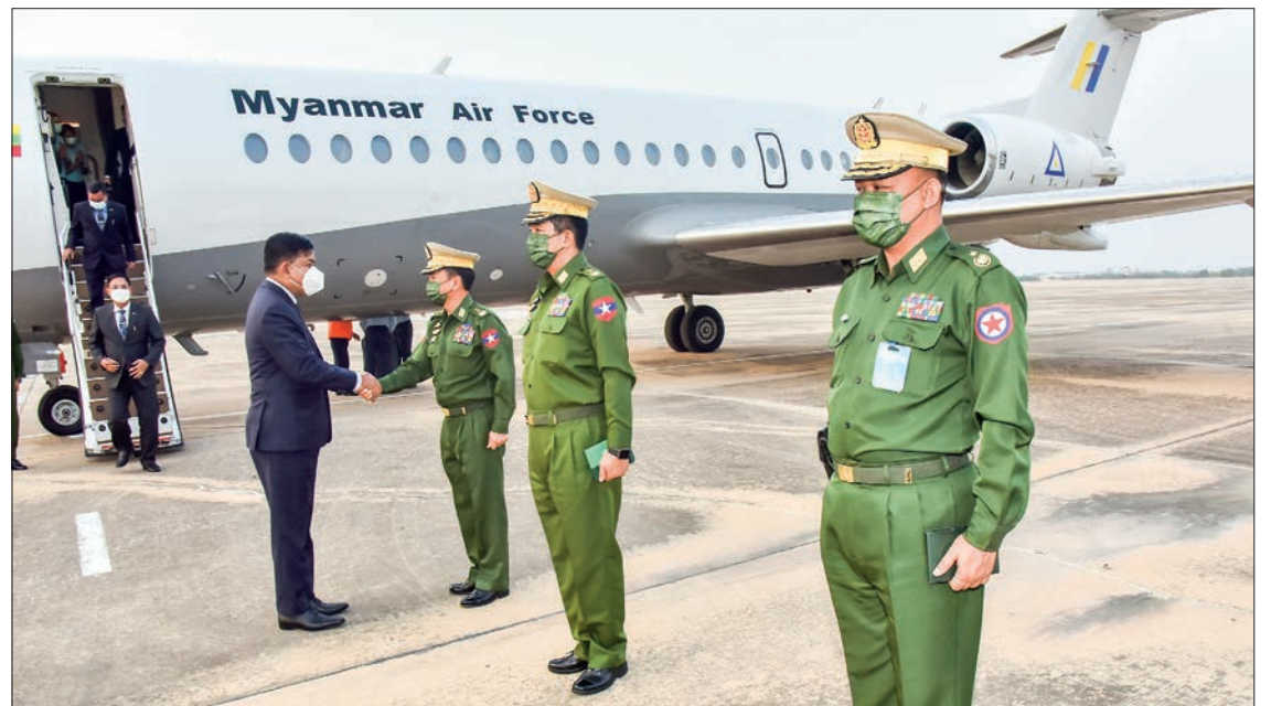
The Myanmar Tatmadaw delegation is welcomed back at Nay Pyi Taw Tatmadaw Airport yesterday.

The Myanmar Tatmadaw delegation arrived back at Tatmadaw Airport in Nay Pyi Taw at 6 pm yesterday. Lieutenant-General Than Tun Oo from the Office of the Commander-in-Chief (Army), Adjutant-General Lieutenant-General Myo Zaw Thein, the Commander and officials of Nay Pyi Taw Command welcomed back the delegation at the airport. — MNA