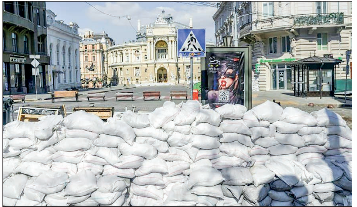
Odessa, a key port of about 1 million people, of whom around 100,000 have left since the invasion began, is both a strategic and symbolic target for the Russians.

IN front of a barricade mounted outside Odessa’s magnificent opera house, a soldier shares a long, emotional hug with his wife and daughter.