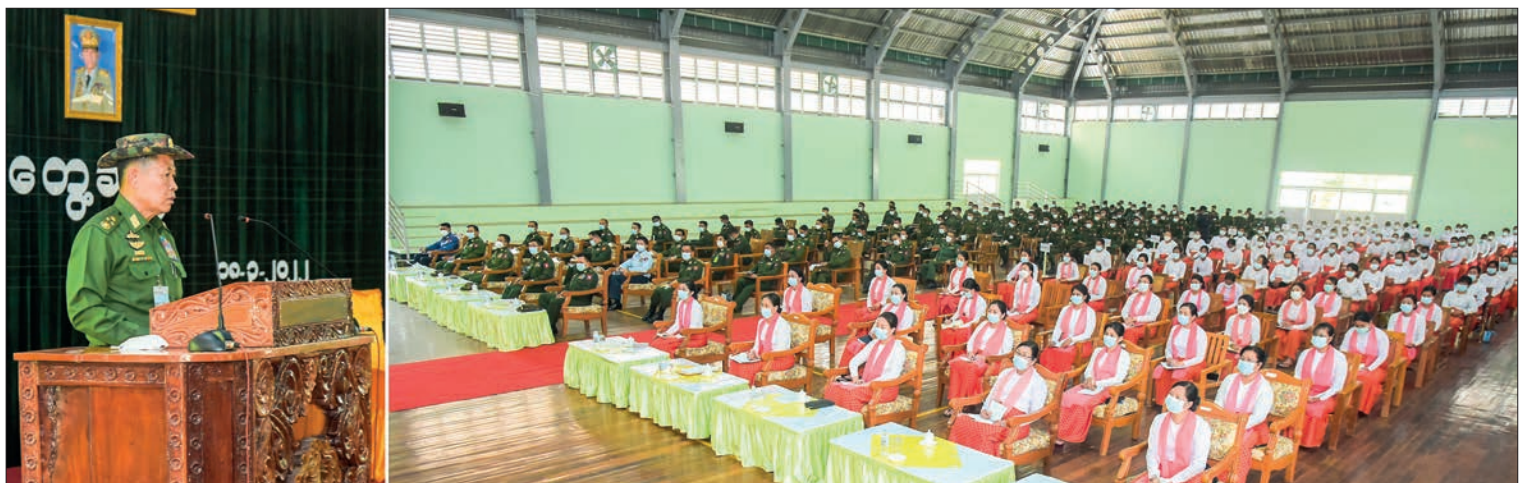
State Administration Council Vice-Chair Deputy Commander-in-Chief of Defence Services Vice-Senior General Soe Win meets the officers, other ranks and family members of the Kalaw Station yesterday.

ALTHOUGH terrorists commit instigations, the Tatmadaw is standing with strong unity of military units, said Vice-Chairman of the State Administration Council Deputy Commander-in-Chief of Defence Services Commander-in-Chief (Army) Vice-Senior General Soe Win at the meeting with officers, other ranks and families from Kalaw Station at the Station Hall of Kalaw, Shan State (South), yesterday afternoon.