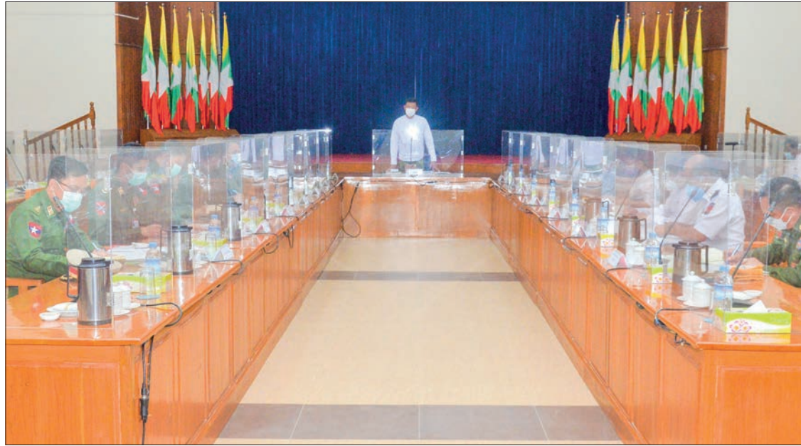
The meeting 1/2022 of the Committee on the Prevention of Recruitment of Child Soldiers in progress.

After the end of the second six-month term on 27 December 2014, the Plan of Action was not extended but carried out with Indicator 21 and then it was reduced to Indicator 11 according to the meeting of CTFMR and the government conducted on 26 July 2018. According to the Plan of Action, the Tatmadaw