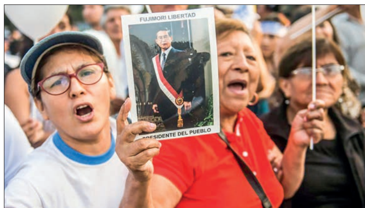
Demonstrators hold a march in favour of the pardon of former Peruvian President Alberto Fujimori in Lima, on 12 January 2018.

PERU’S constitutional court on Thursday ordered the release of disgraced former president Alberto Fujimori, who is serving a 25-year sentence for crimes against humanity, a judicial source said. The court reinstated a “humanitarian pardon” given to the 83-year-old in December 2017