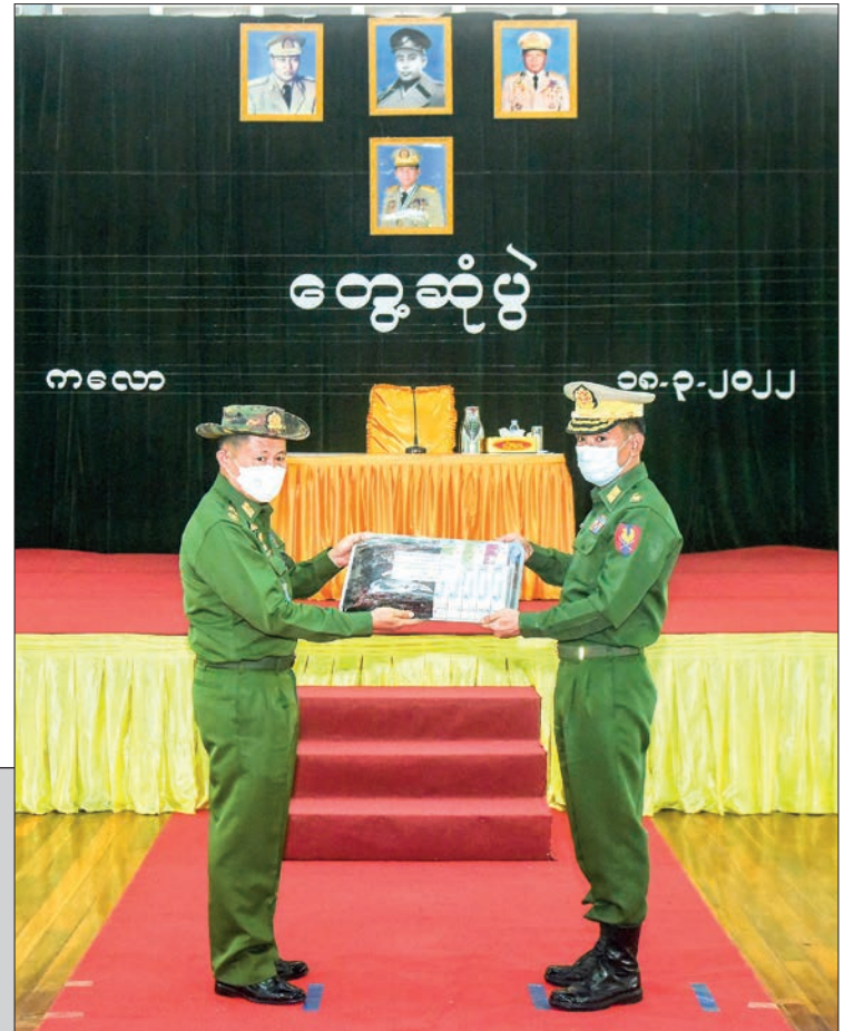
The Vice-Senior General presents foodstuffs and cash assistance for the Kalaw Station.

The Vice-Senior General and party cordially greeted Tatmadaw members and families.