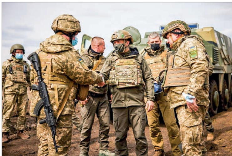
Ukrainian President Volodymyr Zelensky inspects the positions of the Armed Forces of Ukraine at the frontline of defense in Donbass, eastern Ukraine, 8 April 2021.