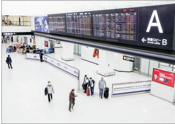
An arrival lobby at Narita International Airport has far fewer people than usual on 9 March 2020.

JAPAN is considering raising the daily cap on overseas arrivals to 10,000 from the current 7,000 starting in April, further easing its COVID-19 border controls, government sources said