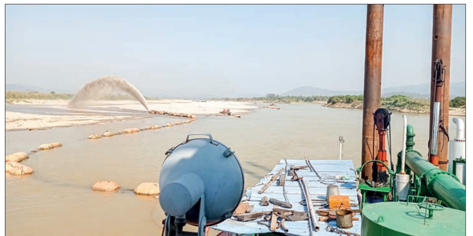
The 97-per-cent completion of the dredging works is seen in Bhamo Township.

THE Bhamo District Construction Quality Control Committee inspected the 97-per-cent completion of the dredging work to improve the port waterway in Bhamo Township, Kachin State, on 10 March.