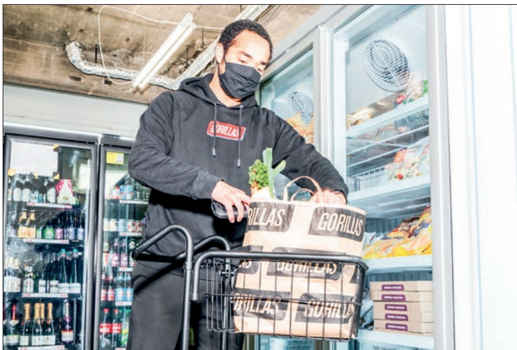
Gorillas, a German on-demand grocery delivery company, delivering groceries within 10 minutes of ordering by using dark stores.

RUSSIA'S invasion of Ukraine will have a heavy impact on the