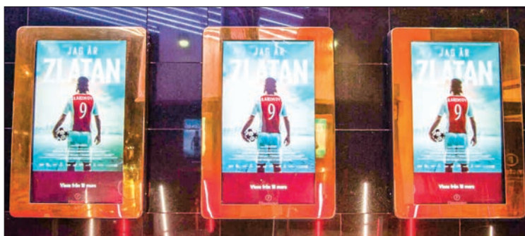
Film posters are pictured prior to the gala premiere of the film 'I Am Zlatan'.