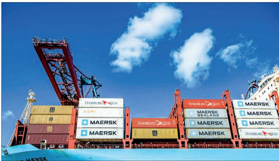
Germany's largest port, Hamburg, has warned that global supply chain issues are here to stay.

THE majority of German companies have reported disruptions to supply chains and logistics as a