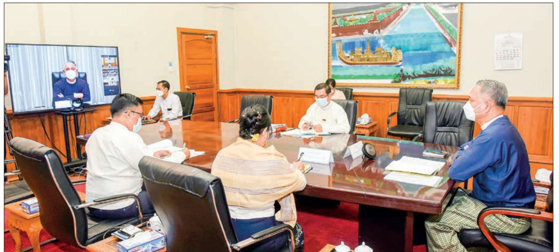
The meeting 2/2022 of the Working Committee to Address the Impact of COVID-19 on the National Economy in progress.

During the meeting, the discussion was held on the provision and repayment of loans under COVID-19 Fund, collection condition of loan interest, ongoing process for provision of loans for the Film, Music, Theatrical, Press and Media and the works done by the working committee. The meeting also discussed relief measures carried out by concerned ministries, upcoming plan of actions, and issues presented to the committee. —MNA