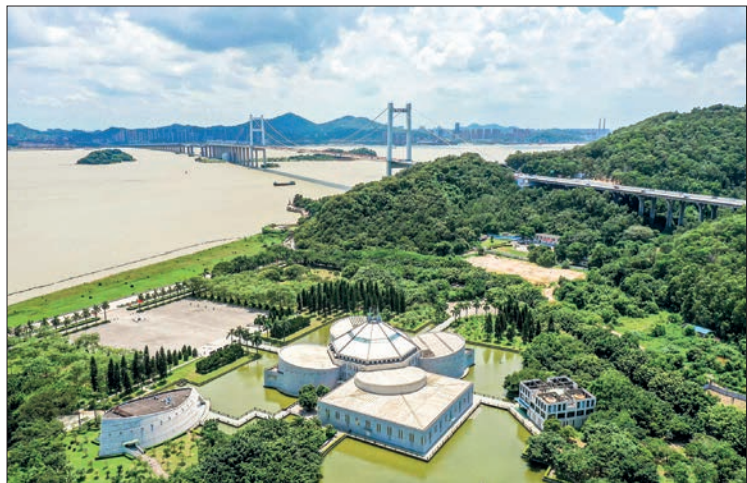
On Tuesday, the same measure was imposed in nearby Dongguan, an industrial city of 10 million. Aerial photo taken on 23 June 2020 shows the Sea Battle Museum in Humen Town, Dongguan City, south China's Guangdong Province.

NEW COVID-19 cases in China topped 5,000, the highest in two years, as the world's most populous country wrestles with rising infections, especially in its northeast, health authorities said Tuesday.