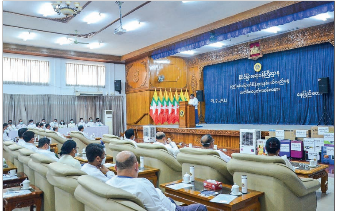
Diamond Jubilee event of the Ministry of Foreign Affairs in progress.

Then, the staff officers and low-rank employees who dutifully served the duties for the country and the ministry, the staff who successfully completed the 2020-2021 training of Central Institutes of Civil Service (CICS) (Lower and Upper Myanmar), best writer for Thar Kaung Taman Magazine for 2021, winners of debating contest and impromptu talks were awarded and other funfairs were organized following the COVID-19 health rules.