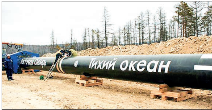
Workers weld a juncture for a Russian oil pipeline in Siberia in this file photo.

“While it is still too early to know how events will unfold, the crisis may result in lasting changes to energy markets,” said the Paris-based agency, which advises developed countries.