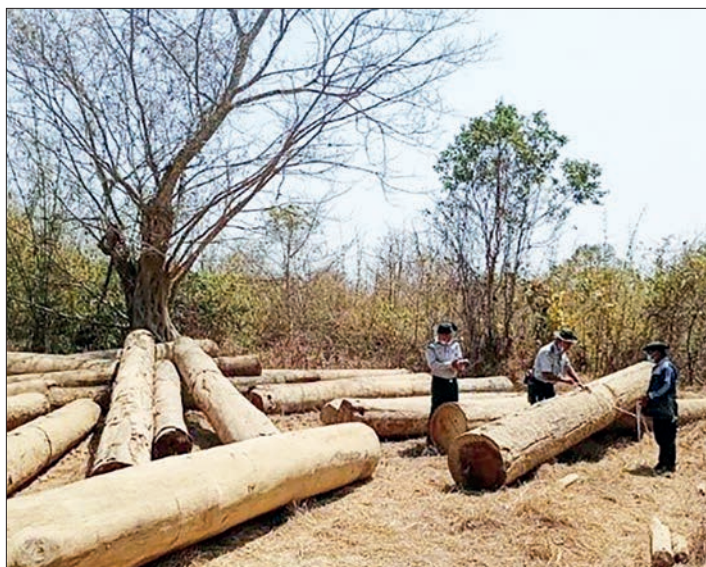
Confiscated teak and hardwood logs.

According to the data collected between 7 and 13 March, the department seized a total of 287.5538 tonnes of illegal timbers — 38.5142 tonnes of teak, 51.0308 tonnes of hardwood and 198.0088 tonnes of others in regions/states and Nay Pyi Taw and arrested 31 suspects with 24 vehicles, the department stated. — MNA