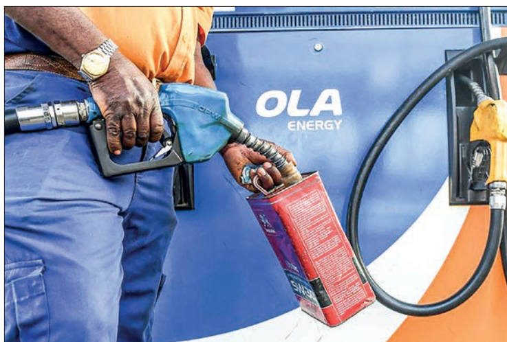
Pain at the pump: Many drivers have been stunned by the leap in fuel prices.

The impact of the war and the West's sanctions against the Kremlin are already starting to