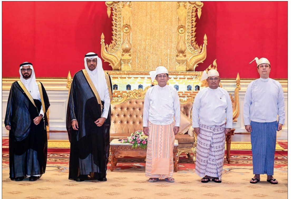
The Senior General, dignitaries and the Ambassador pose for the documentary photo.