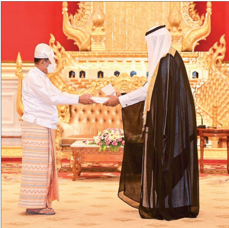
The Senior General accepts the Letters of Credence of the Saudi Arabian Ambassador to Myanmar.