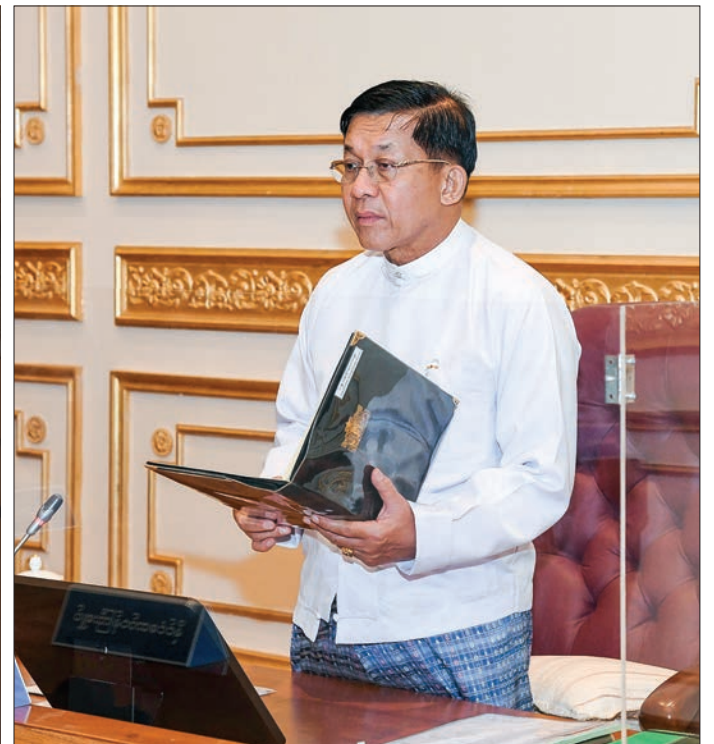
State Administration Council Chairman Prime Minister Senior General Min Aung Hlaing presides over the meeting 1/2022 of the Financial Commission in Nay Pyi Taw on 17 March 2022.

T HE meeting (1/2022) of the Financial Commission was held yesterday afternoon at the Office of the Chairman of the State Administration Council in Nay Pyi Taw. The meeting was addressed by Chairman of the State Administration Council Prime Minister Senior General Min Aung Hlaing in his capacity as the Chairman of the Financial Commission.