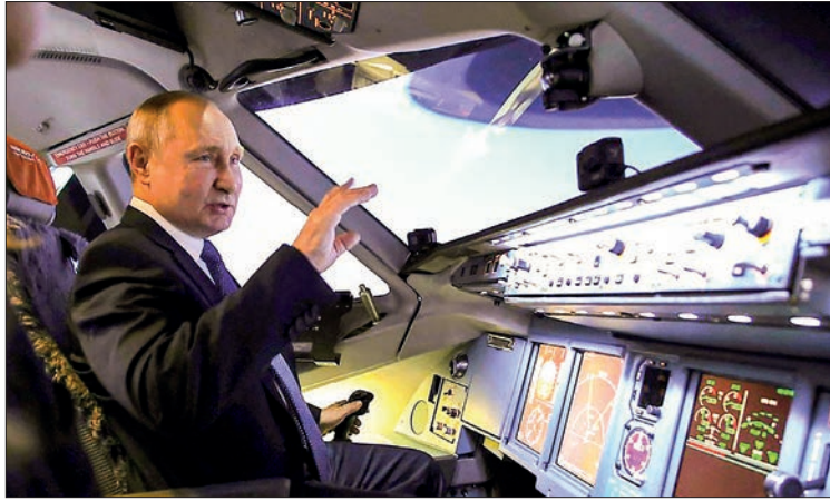
Russian President Vladimir Putin is seen during a visit to Aeroflot aviation training centre on 5 March 2022.

RUSSIAN investigators on Wednesday launched the first criminal cases under a new law against spreading “false information” about Russia’s military operation in Ukraine.