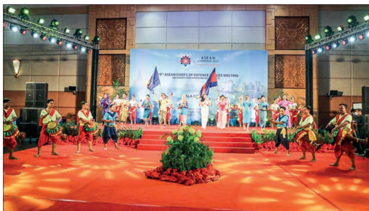
The songs from ASEAN nations are played and traditional dances performed at the dinner.

CHIEF of the General Staff (Army, Navy and Air) General Maung Maung Aye, who will attend the 19 th ASEAN Chiefs