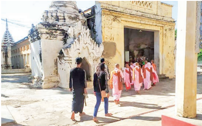
Devotees visit the temples in Bagan Cultural Zone.

The pilgrims must strictly obey the health guidelines issued by the Ministry of Health.