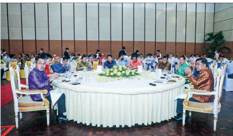
The gala dinner in progress.

of Defence Forces Meeting (ACDFM-19) in Cambodia, attended the gala dinner hosted by Commander-in-Chief of