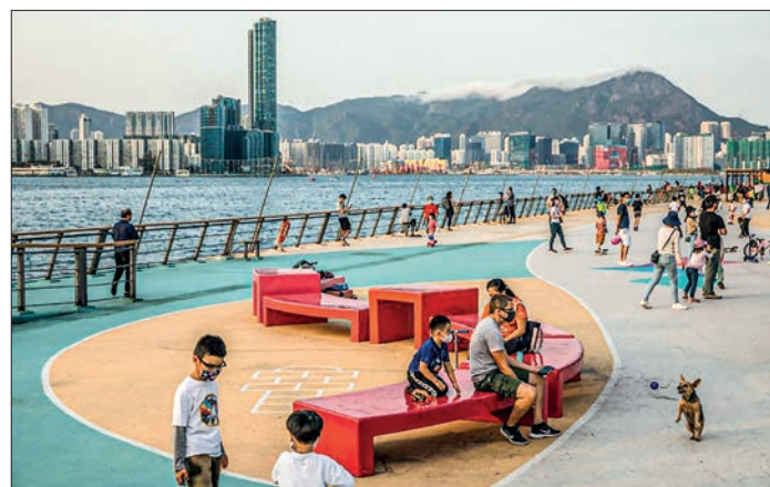
People visit a promenade next to Victoria Harbour in Hong Kong on 15 March 2022.

"How can they be so care-free and go to the beach while Shenzhen is under lockdown? So selfish," one user wrote on Weibo.—AFP ■