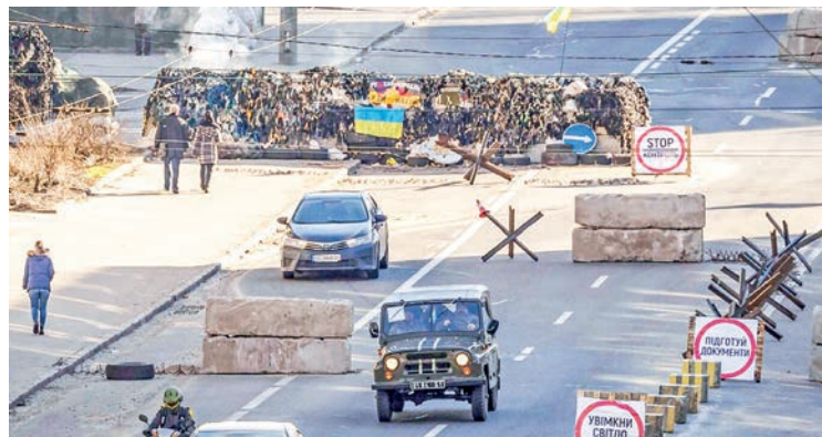
15 March: A car rides away from a Ukrainian military check point in the centre of Kyiv on the 20 th day of the Russian invasion.

He explained that Moscow would only be interested in talks with Ukraine if these would lead to concrete results and solve existing problems.