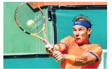
Spain's Rafael Nadal battles past American Reilly Opelka in the fourth round of the BNP Paribas Open at Indian Wells.

break point of a tense first set. A patient Nadal worked the rallies in the tiebreaker and after he gained a 4-3 lead Opelka produced three straight errors to surrender the set. Impervious on his own serve in the opening set, Nadal gave Opelka a break chance with a double fault in the fifth game of the second and the American pounced on it.