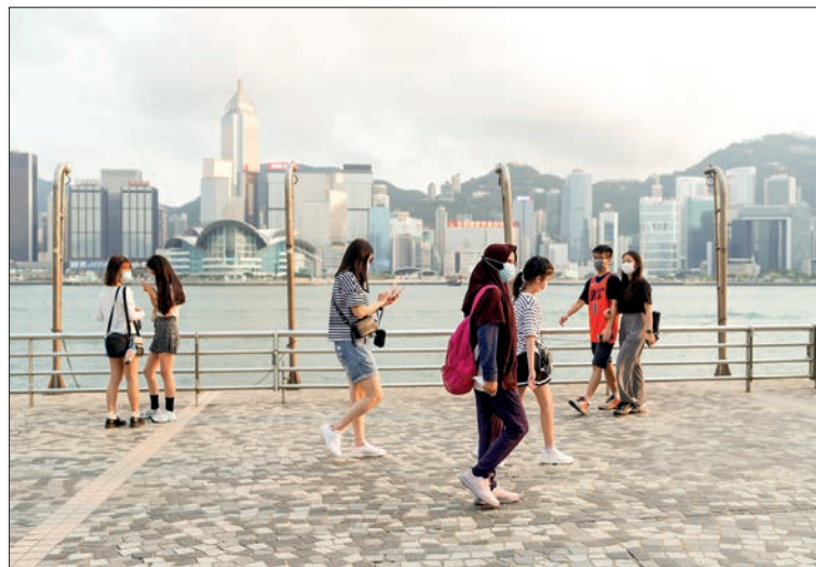
Citizens wearing masks walk on a street in Hong Kong, south China, 2 April 2021.

ASIAN and European markets rallied further Thursday with another blistering surge in tech firms helping Hong Kong ex-