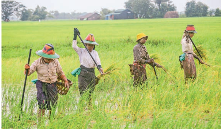
An awareness campaign for Shwebo Pawsan (high-grade rice variety) to get a Geographical Indication (GI) designation was held on 15 March in Leikchin village in Shwebo district.

Under the support of GRET Myanmar, the SPFMTA is exert-