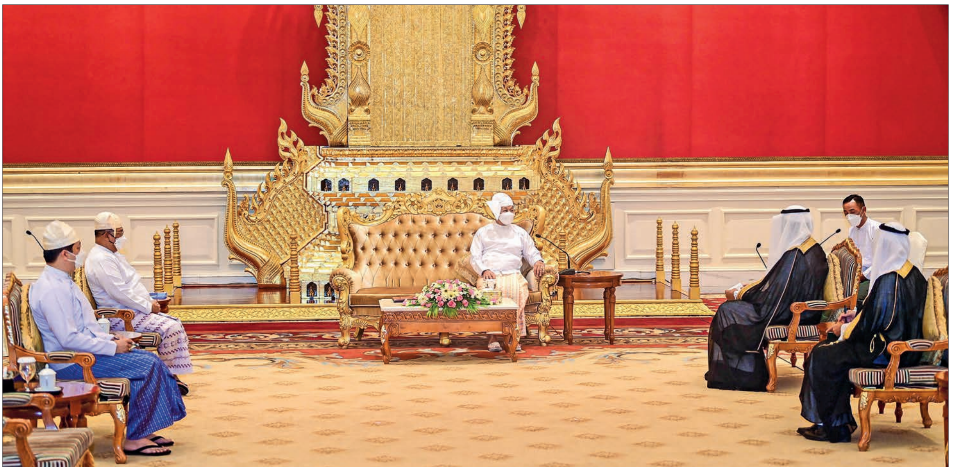
State Administration Council Chairman Prime Minister Senior General Min Aung Hlaing receives the Ambassador of the Kingdom of Saudi Arabia to the Republic of the Union of Myanmar in Nay Pyi Taw on 17 March 2022.