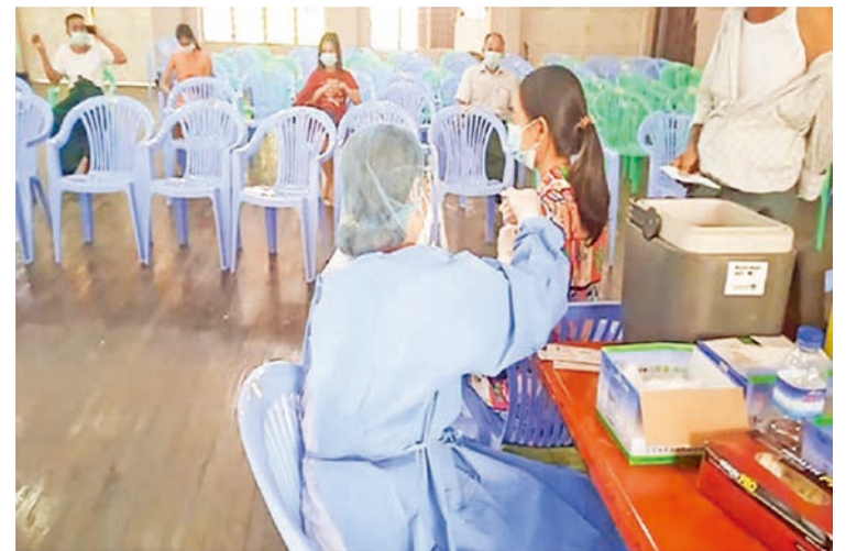
Locals in Mon State get vaccinated against COVID-19.

It is reported that officials from the respective Regional Military Headquarters visited the site and coordinated the necessary work. — MNA