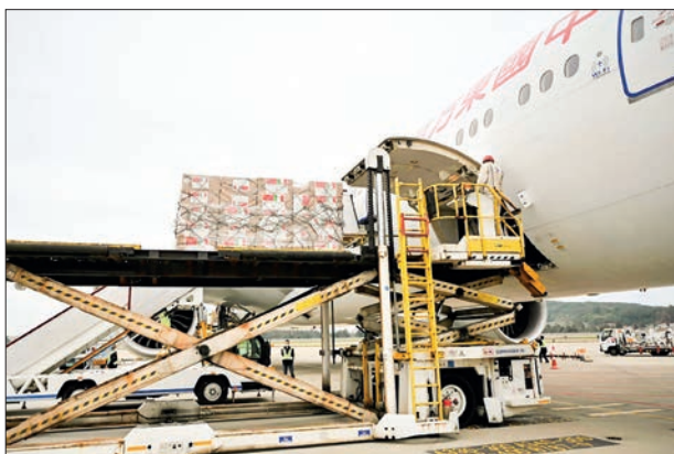
China's air-cargo market is a highlight in the global market.

China's air-cargo market is a highlight in the global market, according to Guo, and like other markets, it is powered by demands from the e-commerce and logistics sectors. It also shows unique demands and market ecology in line with the country's social-economic conditions and geographical environment, he said.