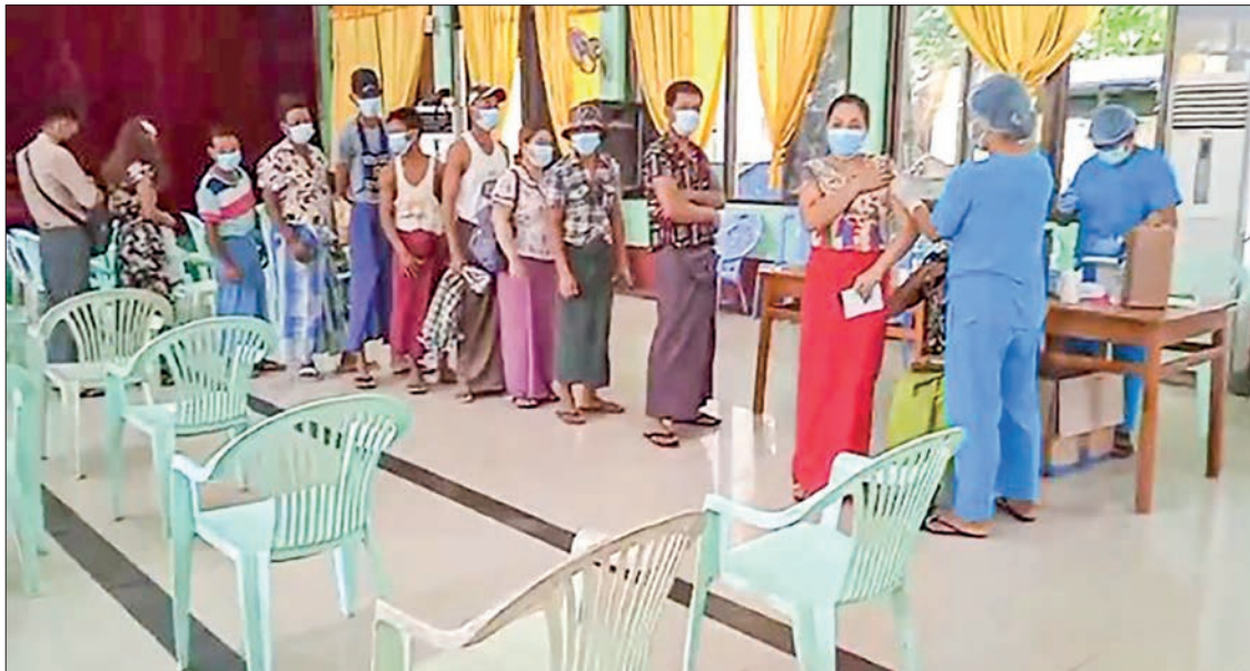
Locals get vaccinated against COVID-19 in Bago Township, Bago Region.

DOCTORS and nurses from people's hospitals, Tatmadaw medical teams, healthcare workers and volunteers are working hard to give COVID-19 vaccines in different states and regions as the vaccination programme is one of the most important activities in the prevention, control and