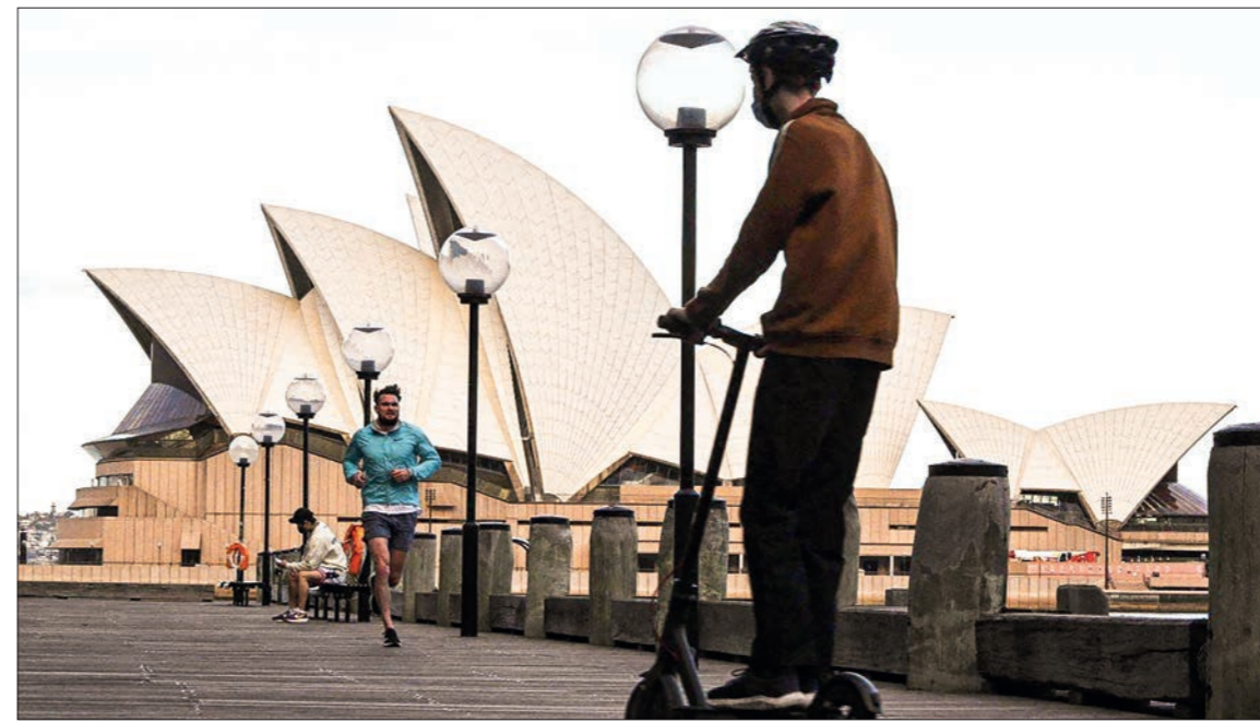
People exercise with the Sydney Opera House in the background, as the city and state of New South Wales report a record number of coronavirus cases.

Late last month the NSW government scrapped its mask