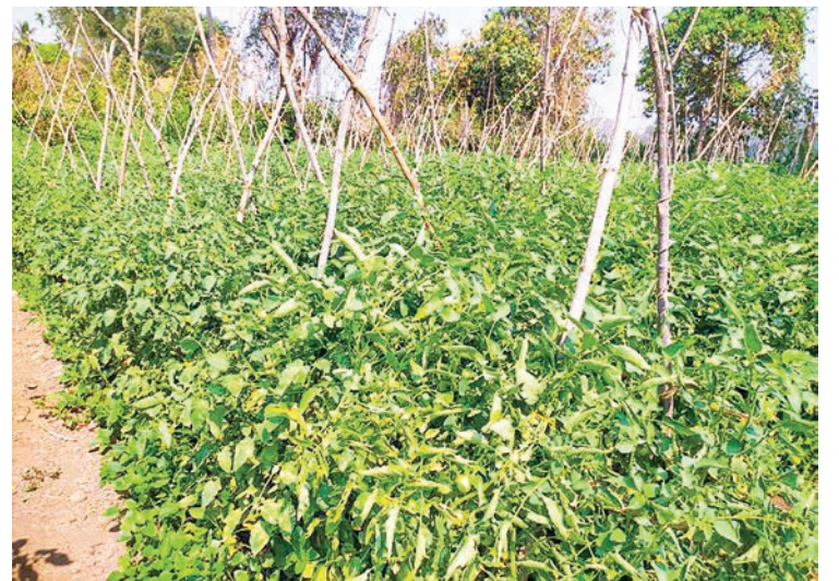
The growers in NyaungU Township uses underground water. The villages in the township supply tomatoes to markets of NyaungU and Pakokku.