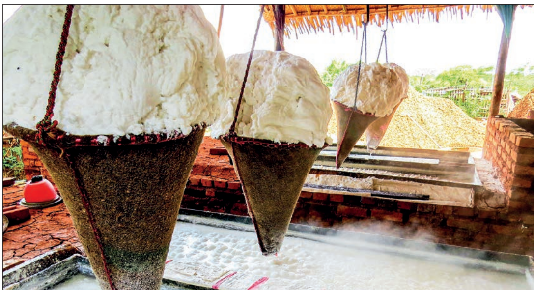
On 17 March, the raw salt price (normal) ranges from K214-K220 per viss (a viss equals 1.6 kilogrammes) while the raw salt (pure) is K250 per viss.

The 2019-2020 statistics showed 14 iodine salt processing plants and one factory each for magnesium chloride (MgCl 2 ) and table salt (NaCl) production, with the production capacity of 60 tonnes of magnesium chloride, 204 tonnes of table salt and 12,132 tonnes of iodized salt. — NN/GNLM