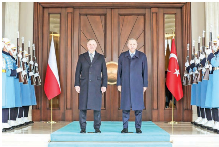
Turkish President Recep Tayyip Erdogan (R) welcomes Polish President Andrzej Duda in Ankara, Turkey, 16 March 2022.

“We continue our attempts to achieve a ceasefire,” Erdogan said, adding that Turkish Foreign