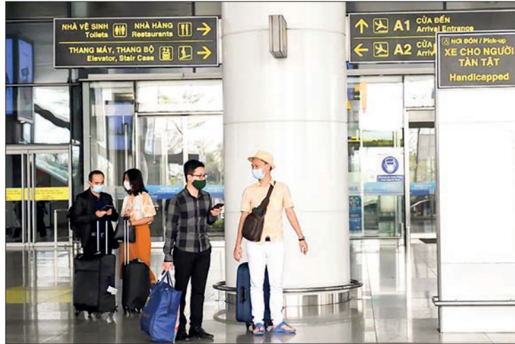
Passengers outside the arrival hall of Noi Bai International Airport in Hanoi, Vietnam, on 15 March 2022.

Virus curbs have slowly been eased in recent months, with visitors trickling back in