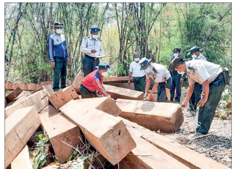
Officials seized illegal timbers.

Therefore, two arrests (estimated value of K6,812,420) were made on 13 March and 17 March, according to Anti-Illegal Trade Steering Committee. — MNA