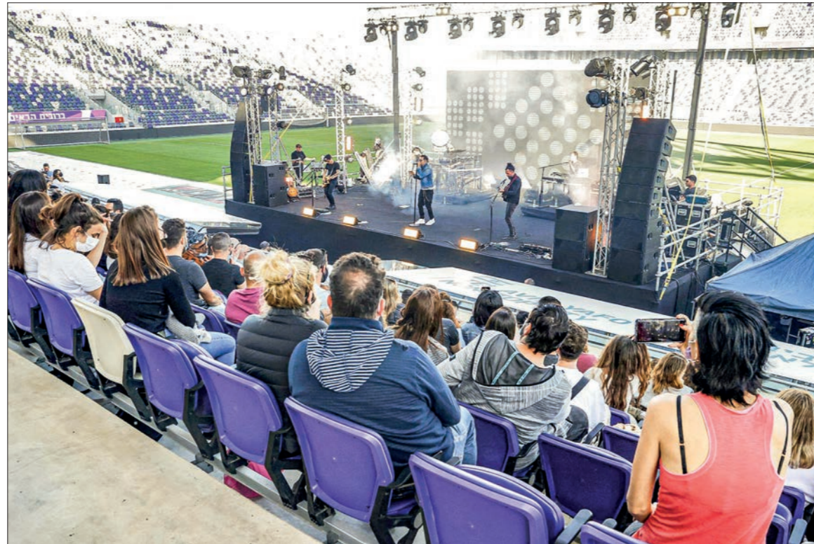
Several hundred people vaccinated against Covid-19 attend a ‘green pass concert’ at Bloomfield Stadium in Tel Aviv on 5 March 2021.

Overall, the fourth shot was found to be safe, and topped up recipients’ neutralizing antibodies — which block the coronavirus from infecting cells — to levels