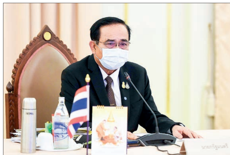
Thai Prime Minister Prayut Chan-ocha takes part in a special Cabinet meeting to discuss measures to stop the spread of the COVID-19 at the Government House in Bangkok on 10 April 2020.

THAILAND’S embattled prime minister will hold talks with party leaders in his ruling coalition Thursday as he seeks to control growing divisions that could lead to early elections later this year.