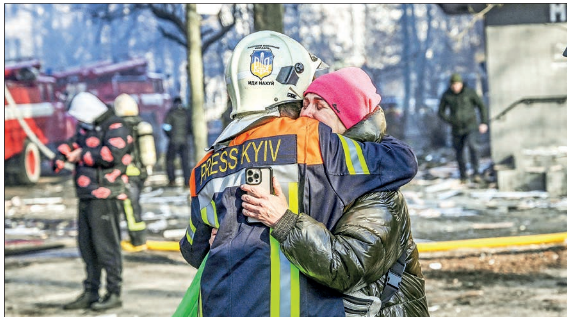
A fireman embraces a woman outside a damaged apartment building in Kyiv on 15 March 2022, after strikes on residential areas killed at least two people, Ukraine emergency services said as Russian troops intensified their attacks on the Ukrainian capital.

STRIKES on residential areas in Kyiv killed at least two people early on Tuesday, emergency services said, as Russian troops intensified their attacks on the Ukrainian capital.