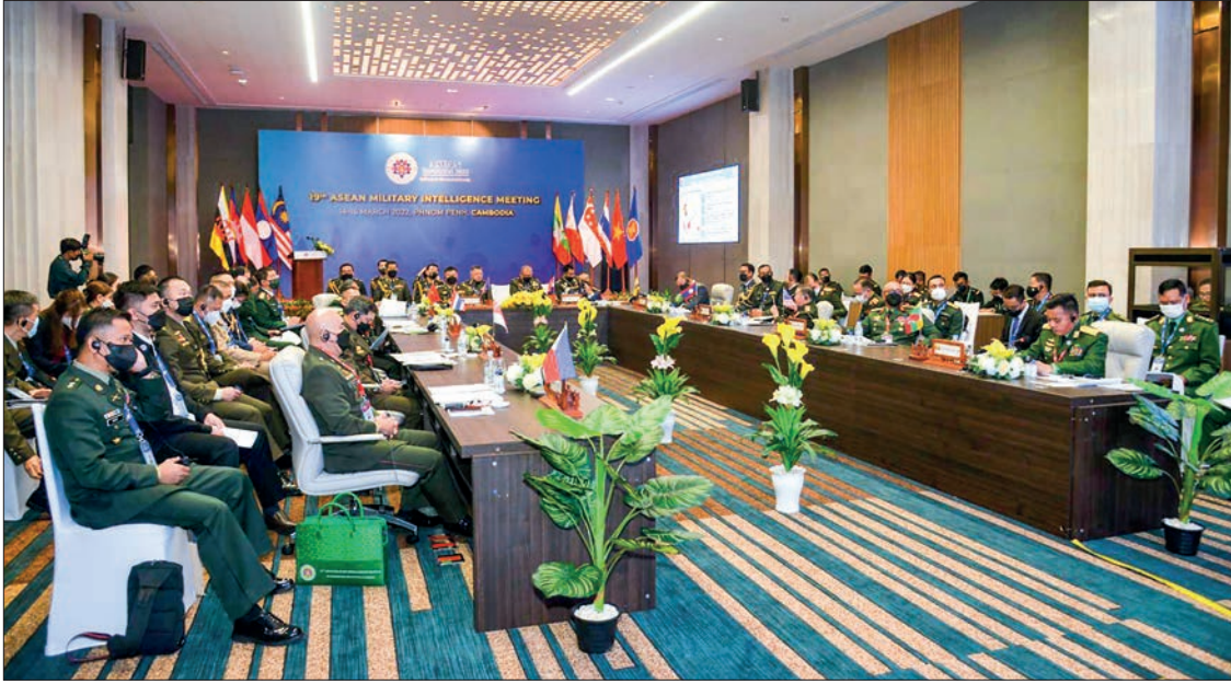
The 19 th ASEAN Military Intelligence Meeting AMIM-19 in progress in Cambodia.

THE Myanmar delegation with Chief of Military Security Affairs of the Myanmar Armed Forces Lt-Gen Ye Win Oo attended the 19 th ASEAN Military Intelligence Meeting – AMIM-19 held in Phnom Penh, Cambodia, yesterday morning.