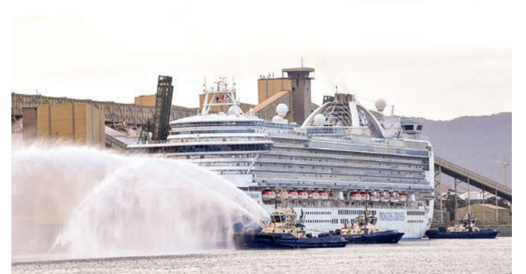
A tug boat gives a water salute as cruise liner Ruby Princess prepares to leave Port Kembla, some 80 kilometres south of Sydney on 23 April 2020. The Ruby Princess berthed after weeks stranded at sea to allow doctors to assess sick crew members and take the most serious cases ashore for medical treatment.

AUSTRALIA said Tuesday it will lift the entry ban on international cruise ships next month, effectively ending all major travel restrictions imposed in response to the coronavirus pandemic after two years.