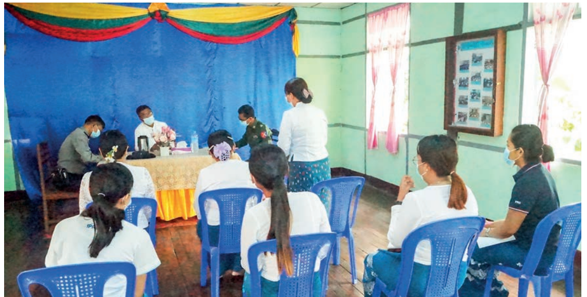
The MoI deputy minister meets the IPRD staff in Lewe Township.

He also said that the set up of IPRD was upgraded and it is more responsible to carry out the office responsibilities of the region, state, district and