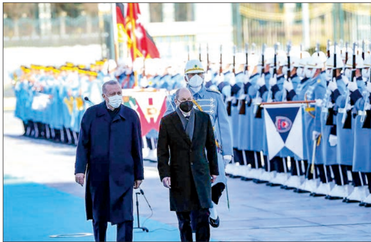
Turkish President Recep Tayyip Erdogan (L) welcomes visiting German Chancellor Olaf Scholz in Ankara, Turkey, 14 March 2022. Recep Tayyip Erdogan on Monday said his country has to maintain close ties with both Kyiv and Moscow.

For his part, Scholz said Turkey and Germany have common concerns regarding the Ukraine