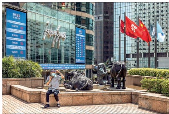
A man adjusts his face shield in front of Exchange Square displaying the Hang Seng Index (top L) in the financial district of Hong Kong on 15 March 2022.

ASIAN markets struggled again Tuesday, with Hong Kong tech firms leading another sharp equity sell-off in the city following the Covid-19 shutdown of tech hub Shenzhen and worries over Russia's military outreach to China.