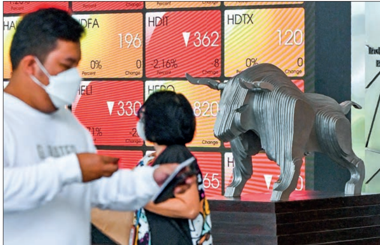
People walk past a big screen showing stocks trading at the Indonesia Stock Exchange in Jakarta on 22 September 2021.

INDONESIA'S largest tech firm said Tuesday it planned to raise up to $1.26 billion through an initial public offering this month, despite tumultuous world market conditions.