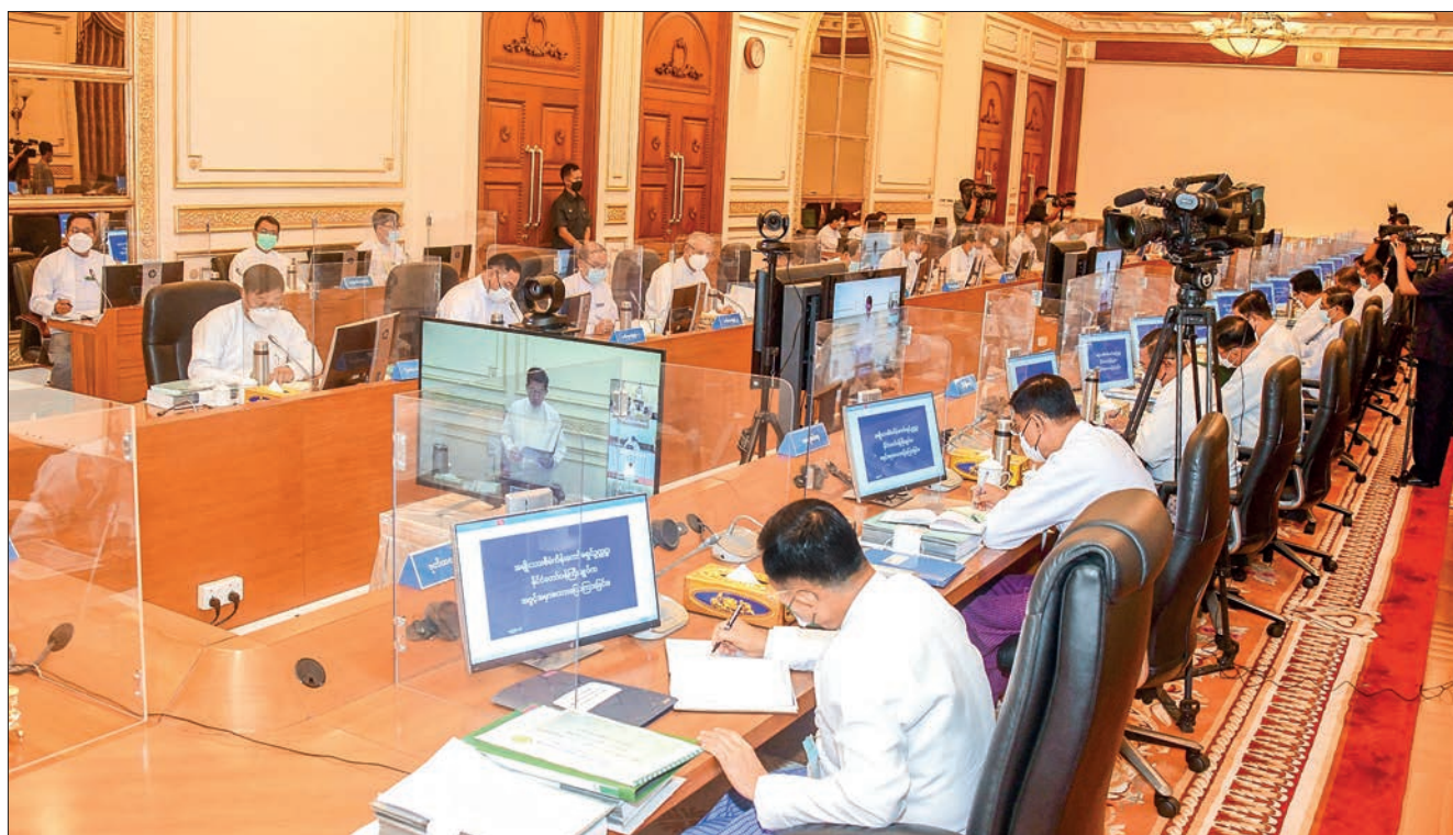
State Administration Council Chairman Prime Minister Senior General Min Aung Hlaing addresses the meeting 1/2022 of the National Planning Commission in Nay Pyi Taw on 15 March 2022.

P REPARATIONS must be made for minimizing risks in implementing the projects after taking lessons on advantages and disadvantages, said Chairman of the National Planning Commission Chairman of the State Administration Council Prime Minister Senior General Min Aung Hlaing at the meeting 1/2022 of the National Planning Commission at the SAC Chairman Office in Nay Pyi Taw