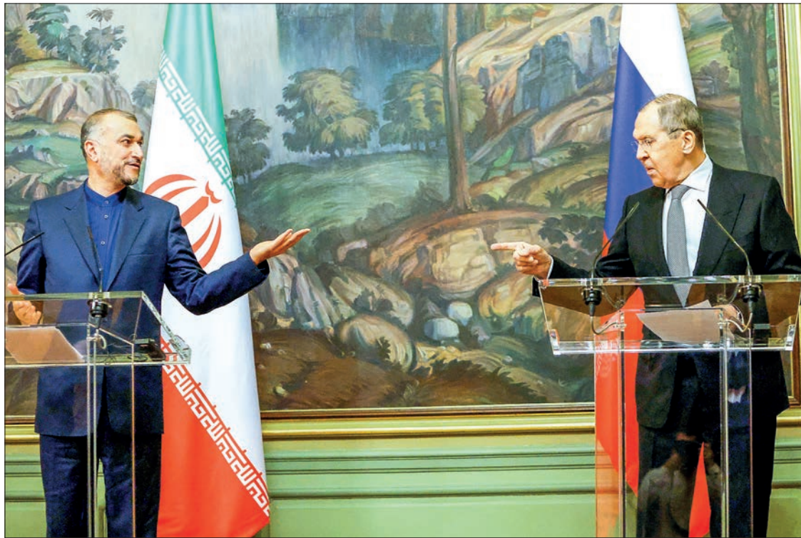
Russian Foreign Minister Sergei Lavrov (R) and Iranian Foreign Minister Hossein Amir-Abdollahian hold a joint press conference following their talks in Moscow on 15 March 2022.

ter Moscow earlier this month demanded guarantees that Western sanctions imposed following its military incursion into Ukraine would not damage its trade with Iran.