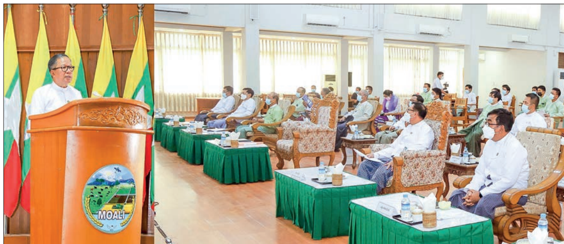
The MoALI Union Minister makes the speech to mark the golden jubilee of the Fisheries Department yesterday.

THE Department of Fisheries commemorated the 50 th anniversary (golden jubilee) at the meeting hall of the Ministry of Agriculture, Livestock and Irrigation on the morning of 15 March 2022.