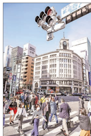
People walk in Tokyo’s Ginza area on a warm day on 14 March 2022, wearing face masks amid the coronavirus pandemic.

However, the government will keep a close eye on the number of infections in such areas as