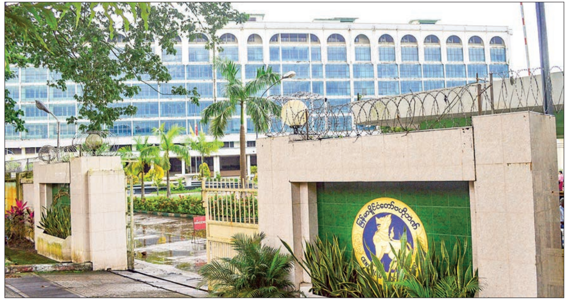
The Office of the Central Bank of Myanmar.

ed oil prices, the retail price of palm oil is shooting up around K7,000 per viss (a viss equals 1.6 kilogrammes) at present.