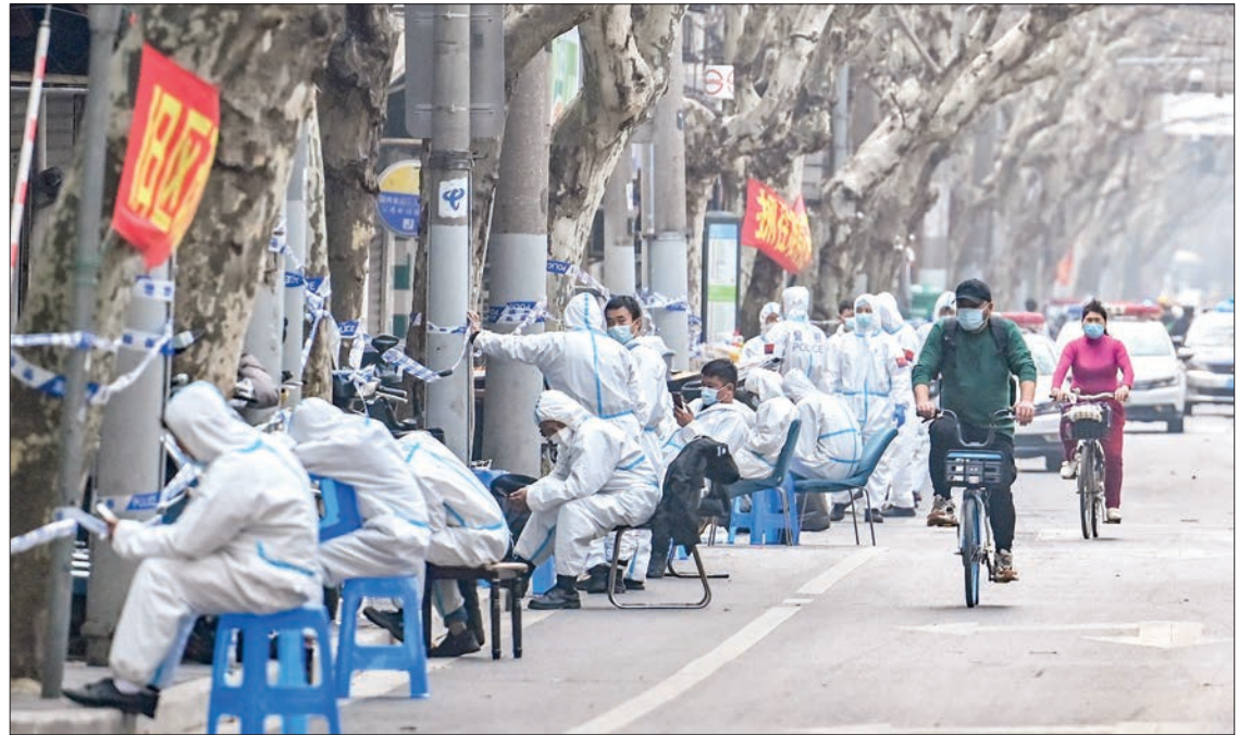
Workers are seen wearing protective clothes next to some lockdown areas after the detection of new cases of covid-19 in Shanghai on 14 March 2022.

NEARLY 30 million people were under lockdown across China on Tuesday, as surging virus cases prompted the return of mass tests and hazmat-suited health officials to city streets on a scale not seen since the start of the pandemic.