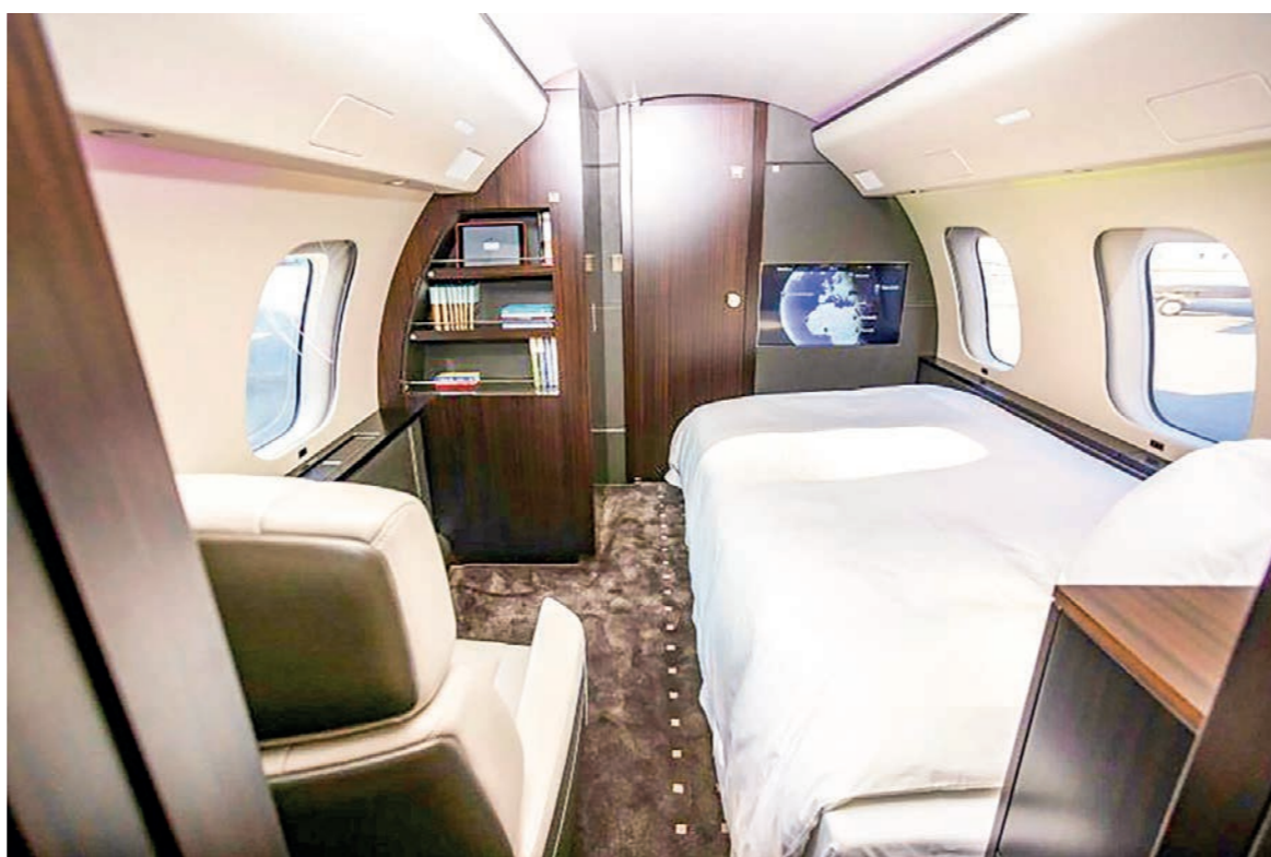
Clients enjoy plush cream-coloured leather chairs and a large double bed.

It found that private air travel nearly doubled its global market share between 2019 and 2021, when it stood at 12 per cent.