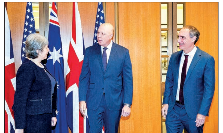
This handout photo taken and released on 22 November 2021 by the Australian Defence Force shows British High Commissioner Victoria Treadell (L), Australia's Minister for Defence Peter Dutton (C) and US Chargé d'Affaires Michael Goldman (R) after signing the Exchange of Naval Nuclear Propulsion Information Agreement during a ceremony at Parliament House in Canberra.

AUSTRALIAN Prime Minister Scott Morrison announced Tuesday his government is readying the country's ports to host nuclear-powered submarines from Britain and the United States.