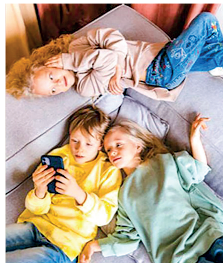
REPRESENTATIVE IMAGE: School children had almost doubled to more than three hours per day, while in Tunisia researchers reported an increase of 111 per cent in total screen time for children aged 5-12.