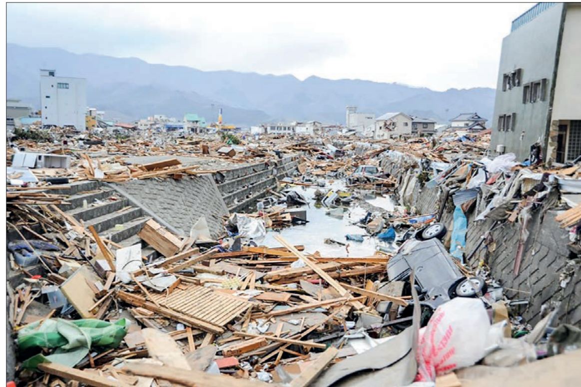
Damage of Tsunami caused by Great East Japan Earthquake in 2011

11TH March is a special day for the people living in Japan. Great East Japan Earthquake struck the coastal areas of Japan's Eastern-North region, killed or missed more than 22,000 people, and gave 300 billion and more USD damage to infrastructures. When the day is coming, people all over Japan might feel pain in their minds.