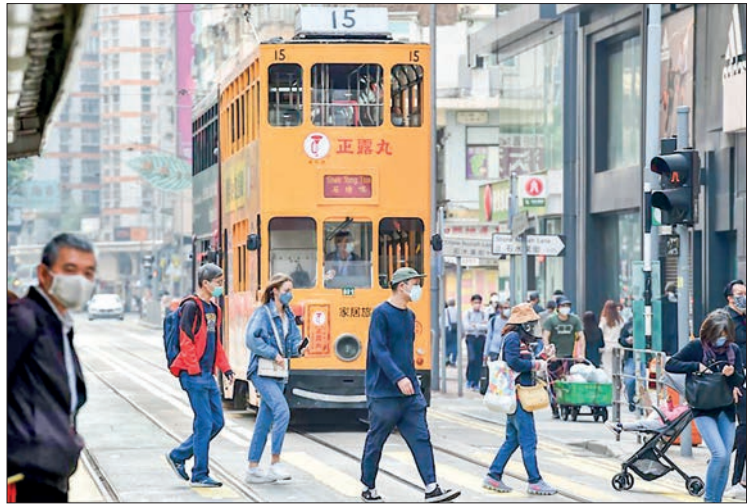
People wearing face masks walk on a street in south China's Hong Kong, 5 March 2022. The Hong Kong Special Administrative Region (HKSAR) reported 37,529 new COVID-19 cases and 150 deaths on Saturday, official data showed.

THE International Monetary Fund (IMF) has reinforced its assessment of Hong Kong's economic and financial positions, recognizing that Hong Kong's financial sector has continued expanding robustly even during the COVID-19 pandemic.