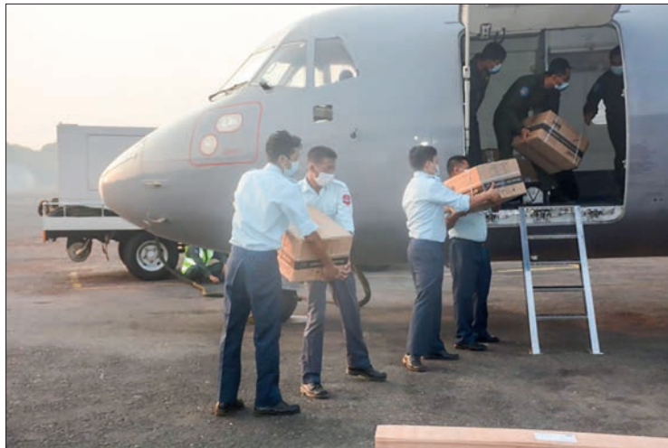
Vaccines are loaded onboard the Tatmadaw aircraft to transport them to states/regions.

A total of 393 Covishield vaccines, 9,122 Covaxin vaccines for Dawei Township, 1,356 Covishield vaccines, 6,034 Covaxin vaccines for Myeik Township, 132 Covishield vaccines, and 141 Covaxin vaccines for Kawthoung