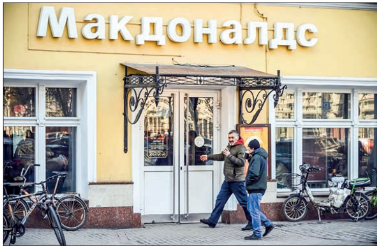
McDonald's has 850 restaurants in Russia. Many Western companies, like McDonald's, have said they will suspend operations in Russia.

Putin on Thursday however downplayed the massive sanc-