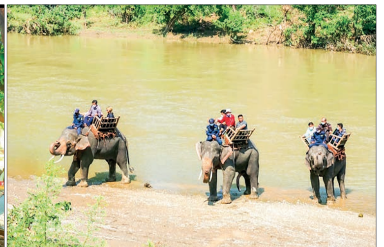
Visitors are seen riding on the elephants.