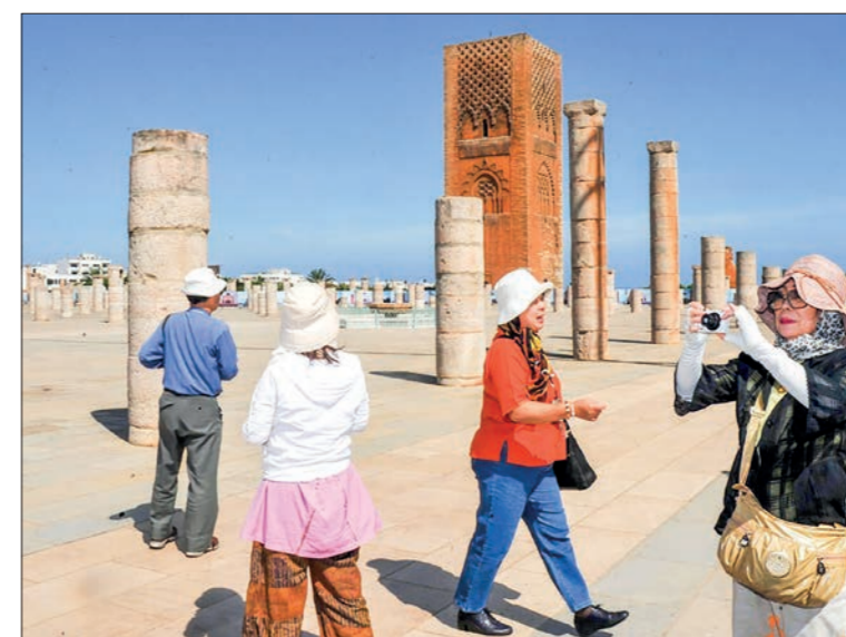
Tourists visit the Mausoleum of Mohamed V in Rabat.

Researchers surveyed 1,021 US residents who rated their travel desire on a five-point scale. Survey respondents with the highest travel desire also had the highest COVID-19 vaccination intentions, the study found.— ANI