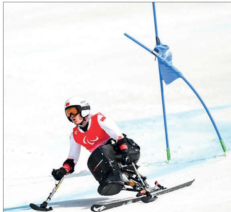
Jesper Pedersen of Norway competes during the alpine skiing men's giant slalom sitting of Beijing 2022 Winter Paralympic Games at National Alpine Skiing Centre in Yanqing District of Beijing, capital of China, 10 March 2022.

JESPER Pedersen of Norway grabbed his third gold medal of the Beijing Paralympic Winter Games in convincing fashion, winning the men's giant slalom sitting on Thursday.