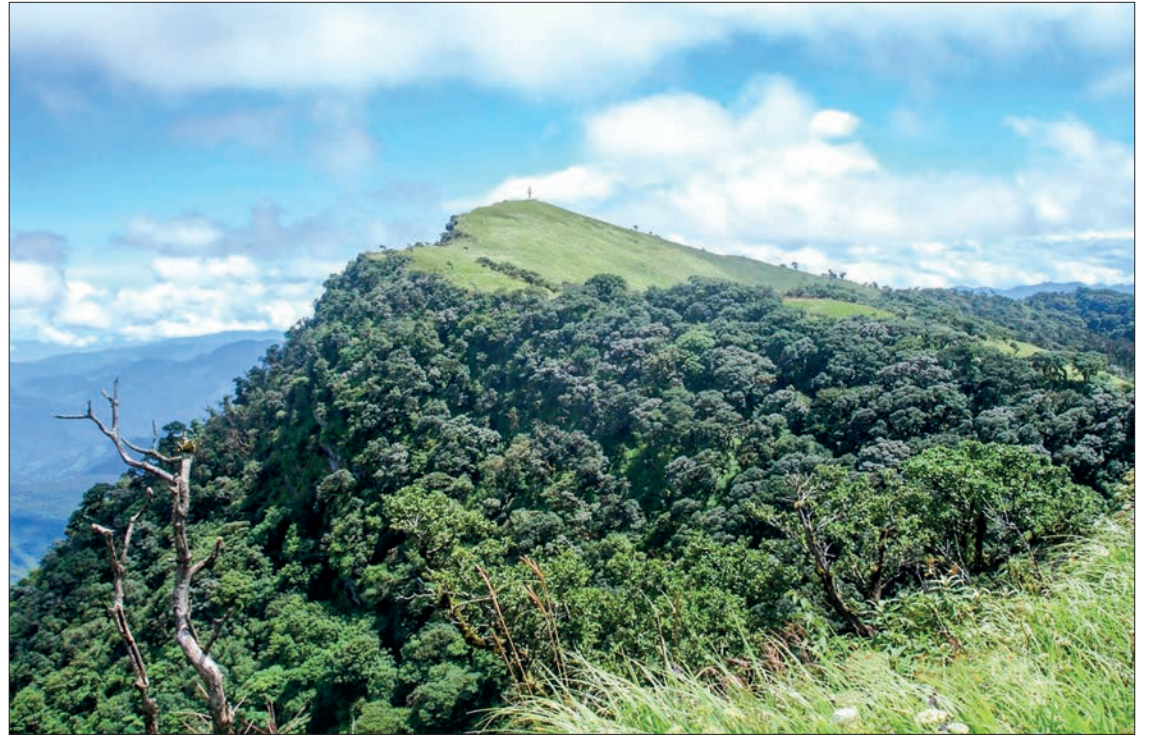
Picture shows an aerial view of the Zinghmuh Mountain.