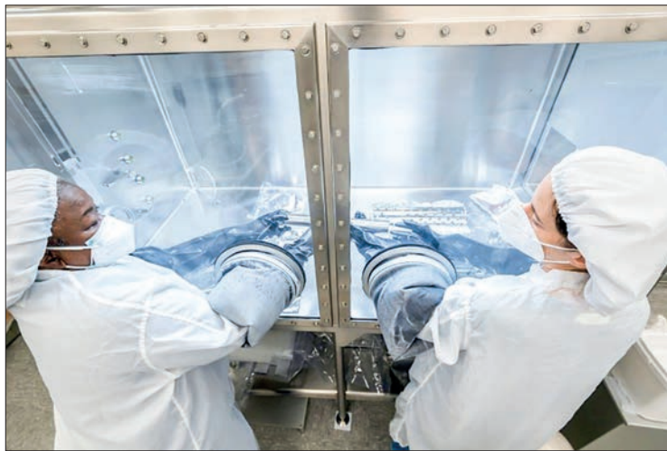
A sample of moon rock collected during the Apollo 17 mission is opened by NASA 50 years on.

Dubbed 73001, the sample in question was collected by astronauts Eugene Cernan and