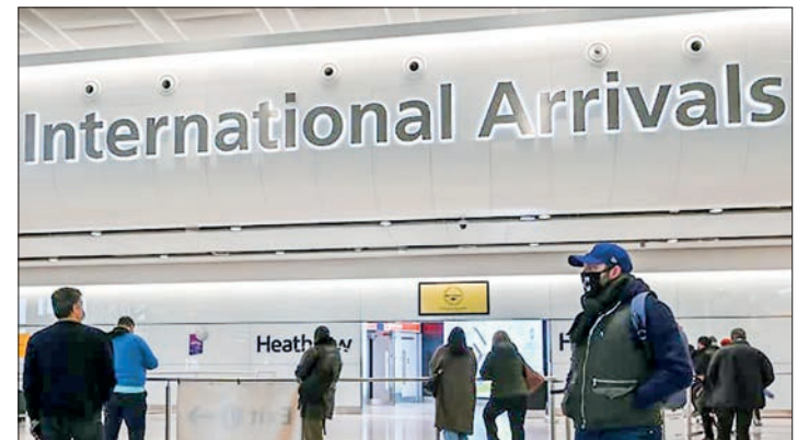
People wait for passengers at one of the International Arrivals halls at London Heathrow Airport in west London on 14 February 2021.

However, Prime Minister Boris Johnson has decided to scrap all pandemic legal curbs in England from Thursday, urging a shift from government intervention to personal responsibility.—AFP ■