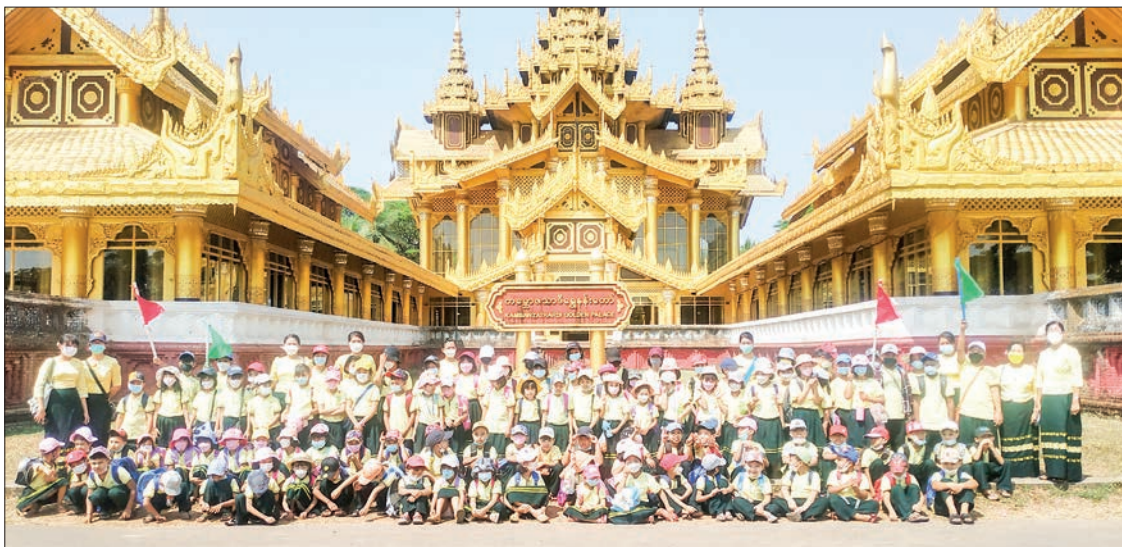
Students pose for the group photo at the front of the Kanbawzathadi Palace.