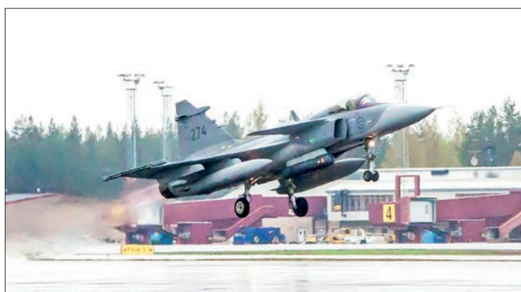
Swedish Prime Minister Magdalena Andersson warned that “the war in Europe is going to affect the Swedish people”.

Zhao said it has been proven by practice that sanctions will not solve problems, on the contrary, they will lead to new problems. They will not only result in two or multiple economic losers but also disturb the process of a political settlement, which is “not constructive at all,” Zhao added.—Xinhua ■