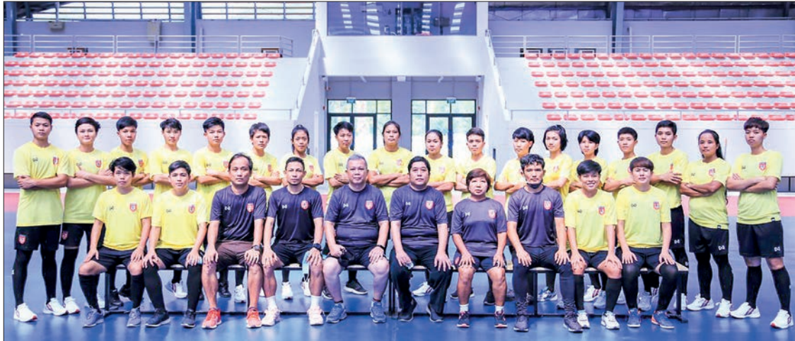
The Myanmar women's Futsal team pose for a group photo with team administrators and coaches.

THE Myanmar women's Futsal team is taking training with 22 players for the 31 st Viet Nam SEA Games to be held in May.