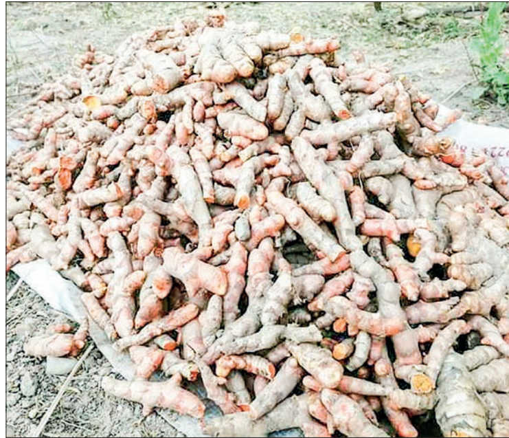
Of the kitchen crops, turmeric and ginger have penetrated the foreign market. The exports of kitchen crops such as turmeric, ginger, tamarind, onion and garlic have been growing.

Myanmar exported over US$11.147 million the worth of 18,614 metric tons of turmeric to its neighbouring countries in the financial year 2019-2020 and $7.7 million valued 13,553.49 MT of turmeric in the FY2020-2021, according to statistics released by Myanmar Customs Department.