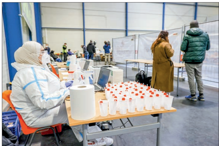
Ukrainian refugees are being tested for the coronavirus at a reception centre in Vienna, Austria, 4 March 2022.

AUSTRIA said Wednesday it is suspending mandatory Covid-19 vaccinations for all adults saying the pandemic no longer poses the same danger; just weeks after the law took effect in an EU first.