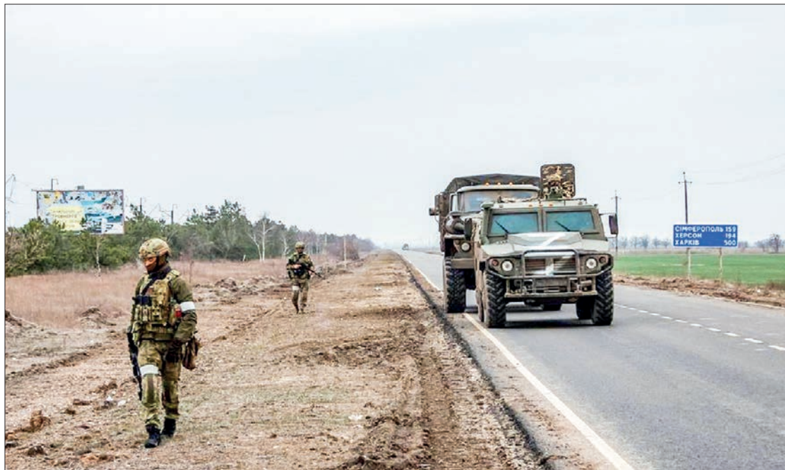
8 MARCH 2022: A Russian humanitarian convoy carries food supplies from Crimea to Ukraine.

RUSSIA will no longer participate in the Council of Europe, the country's foreign ministry said Thursday.