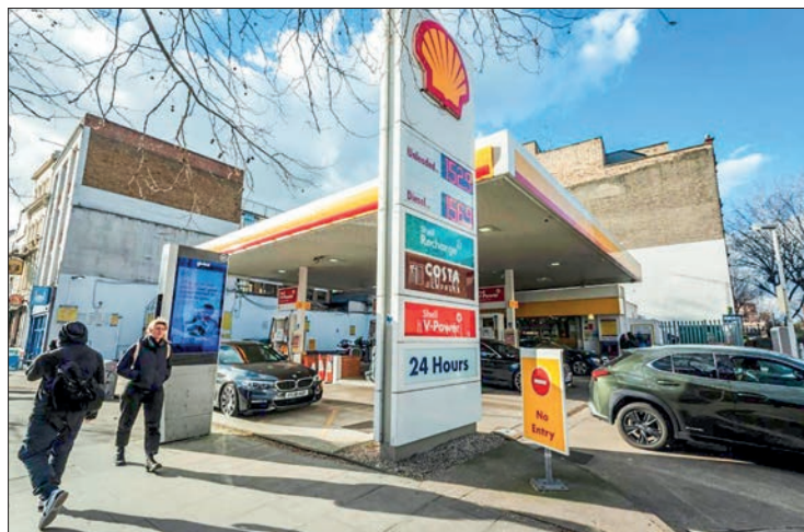
People walk past a petrol station in London, Britain, 25 February 2022. After days of bearish trading amid concern over the escalating Russia-Ukraine tension, a flare-up of the conflict battered major European markets on Thursday, bringing the stocks down to new lows.

A Chinese foreign ministry spokesperson said on Thursday the United States should not undermine China’s legitimate rights and interests in handling with ties with Russia, otherwise China will make firm and resolute responses.