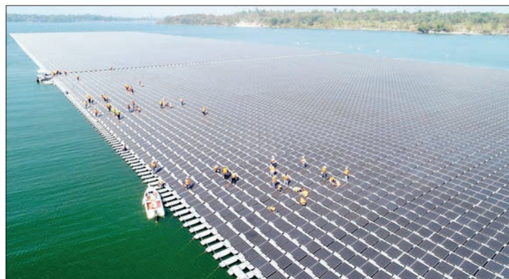
The floating solar farm at Sirindhorn Dam in Ubon Ratchathani.

A vast array of solar panels floats on the shimmering waters of a reservoir in northeast Thailand, symbolizing the kingdom's drive