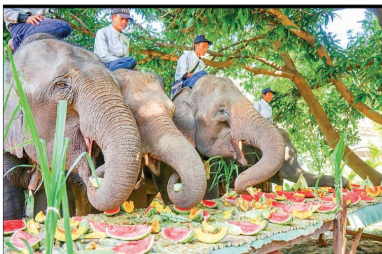
Elephants enjoy their buffet-feed.

Region. U Htet Naing Aung, in-charge of the elephant camp, said that the camp was based on tourism to make it easier for staff to work due to reduced logging activities. — Zeya Htet (Minbu)/GNLM