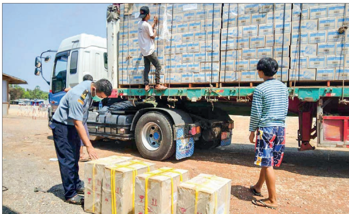
Confiscated illegal goods.

Therefore, three arrests (estimated value of K7,835,650) were made on 11 March, Anti-Illegal Trade Steering Committee stated. — MNA