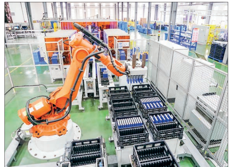
A robot works at a lithium battery factory in Tangshan, north China's Hebei Province, 29 Nov 2020.

"There are a lot of complexities and rising uncertainties" in the global sphere, Li said at the press conference. "It will be very hard for such a big economy to maintain a medium to