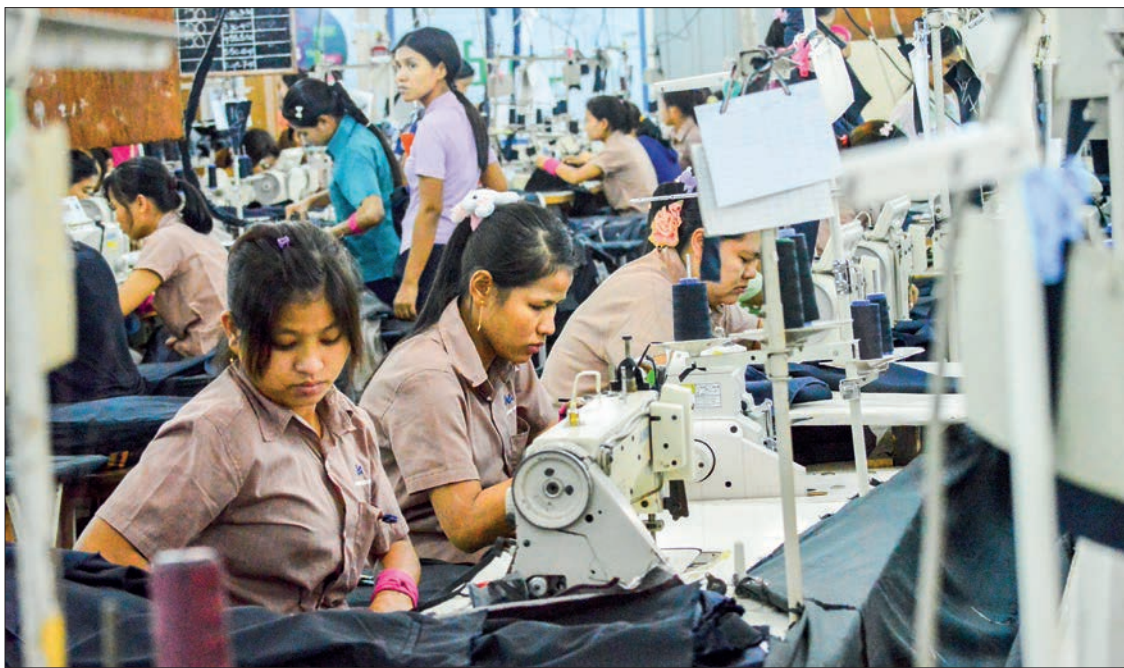
Female workers are seen working at one of the manufacturing workplaces.

THE majority of foreign enterprises eye the manufacturing sector for investments, pumping the estimated capital of US$138.6 million into 25 projects in the past five months of the current mini-budget period (October 2021-March 2022), as per the statistics released by the Directorate of Investment and Company Administration (DICA).