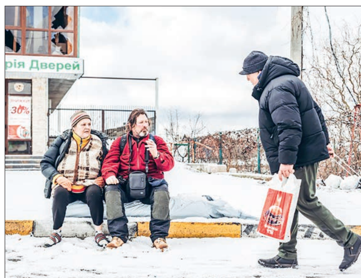
People rest by a road in Irpin, Ukraine, March 8, 2022.

Lavrov singled out the deliveries of portable air defence systems, saying that they could be used to create "risks for