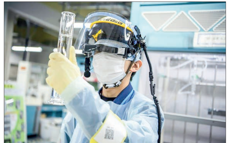
Thousands of workers at the Fukushima Daiichi nuclear plant are involved in the complex and decades-long process of decommissioning the Fukushima nuclear site. PHOTO: AFP

Cranes tower over several units, while workers in coveralls and wearing dosimeters, full-face respirators, and helmets operate machinery nearby.—AFP ■