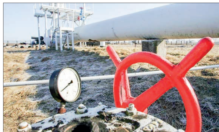
Ireland and the EU as a whole need to take the security of gas supplies more seriously as the Russian invasion of Ukraine highlights vulnerabilities.

THE International Monetary Fund is set to lower its global growth projection next month due to the impact of Russia's invasion of Ukraine, which has triggered massive economic sanctions on Moscow and is sending energy and food prices higher, IMF Managing Director Kristalina Georgieva said Thursday.