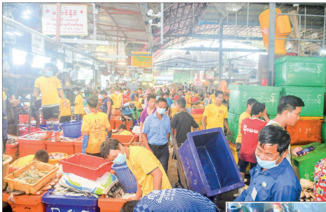
The Shwe Padauk Fish Market is in action. It was established in 2014, with a small number of stalls.

The saltwater fishery products that primarily came from Ayeyawady Region, Rakhine State, Mon State, Taninthayi Region and coastal areas are supplied to the Sanpya and Shwe Padauk fish markets with the use of vehicles and vessels. Moreover, freshwater fish and prawns from Ayeyawady, Bago and Yangon regions are flowing into the markets daily. Over 200,000 visses of freshwater fishery products such as rohu, mrigal fish, hilsa, big head carp, great white sheatfish, giant sea perch, whisker sheatfish, catfish, tilapia, striped catfish, striped snakehead, prawn, shrimp and others, and 14,000 visses of seafood enter the market every day, circulating about 300,000 visses of fishery products per day.