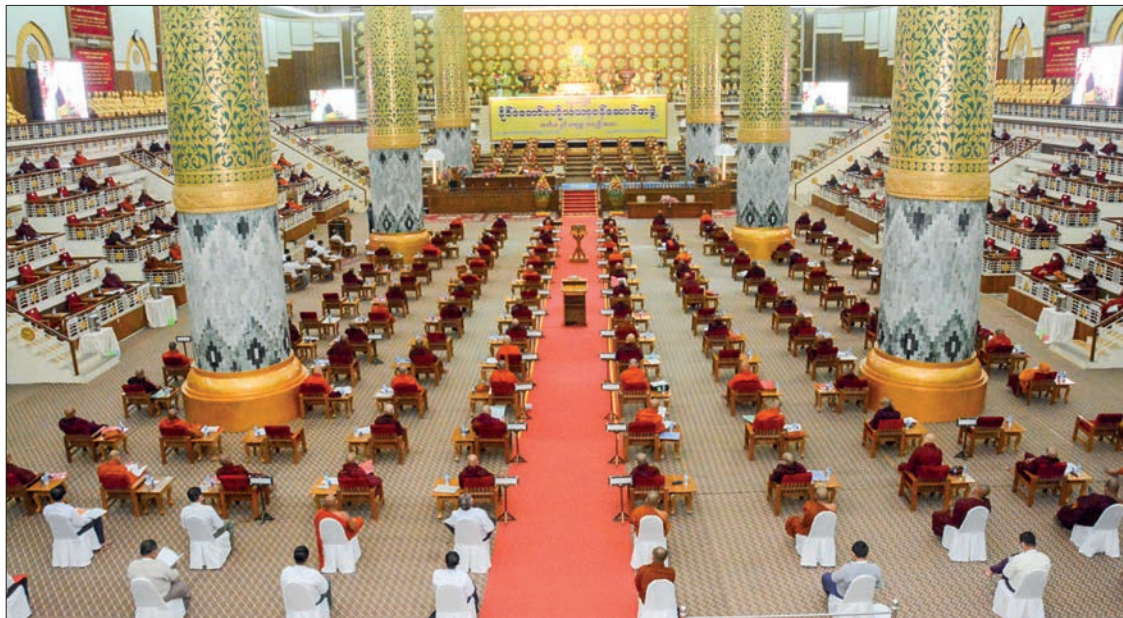
The eighth State Sangha Central Working Committee's third meeting in progress.

Then, the MC Sayadaw reported on the numbers of attendees to the meeting and announced the event was successful as 80 per cent of Sayad-