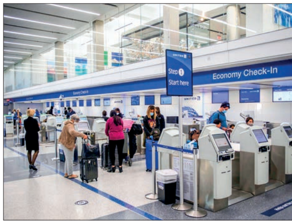
United Airlines airport check-in counters.

"Of course, if another variant emerges or the Covid trends suddenly reverse course, we will reevaluate the appropriate safety protocols at that time." The extension of the transportation mask mandate announced by the Centres for Disease Control and Prevention will affect airplanes, buses, subways and ferries, and the agency noted in a statement they'll use the time to determine where masks should be mandatory going forward. —AFP ■