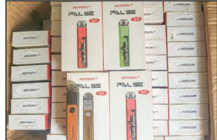
Confiscated illegal goods.

THE Anti-Illegal Trade Steering Committee focuses on strict control of illegal trade by the law.