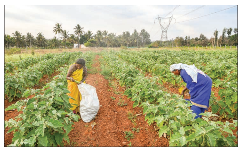
Farmers harvest a crop of brinjal from a field on the outskirts of Bangalore on 2 March 2022.

Exports of wheat recorded a huge surge at 1.7 billion US dollars during April-January 2021-22, growing 387 per cent over the corresponding period in 2020-21, while other cereals registered a growth of