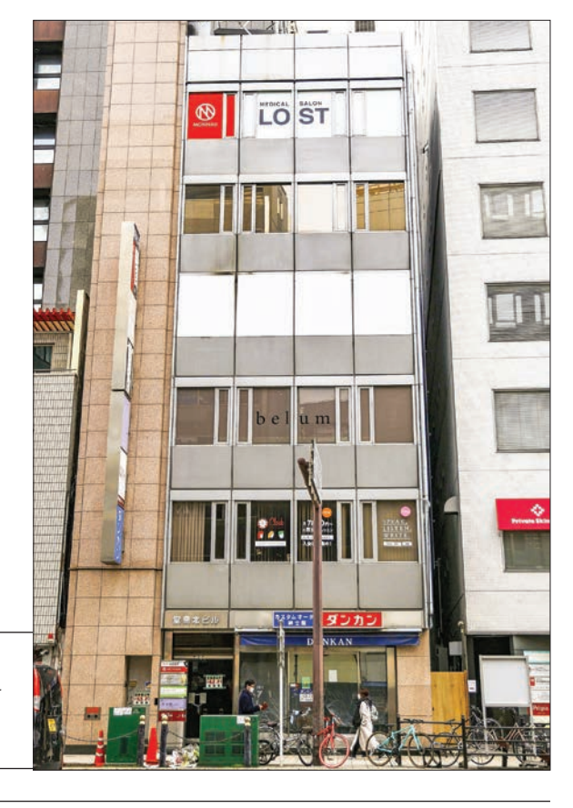
Photo taken on 7 March 2022, shows a building in Osaka that was hit by a deadly fire in December 2021.

Police aims to refer the case to prosecutors later this month. Notes about the comings and goings at the clinic were found on Tanimoto's smartphone dating back to June, suggesting he had been planning the attack beforehand.— Kyodo ■