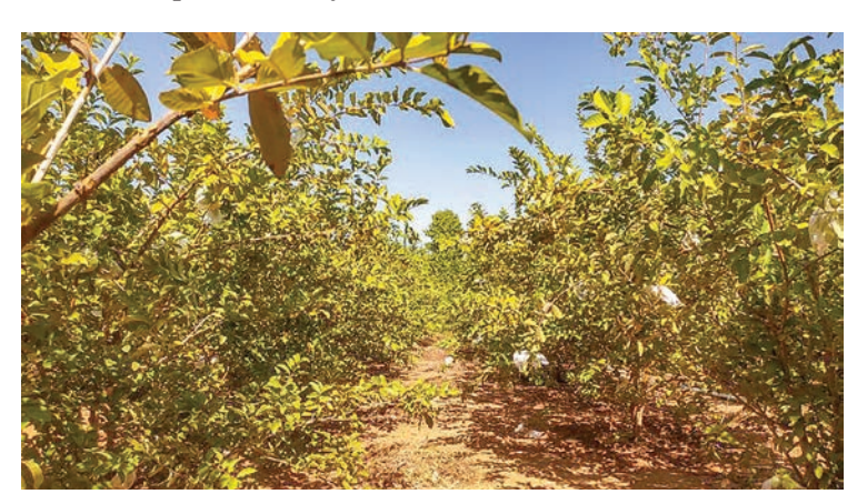
The growers from NyaungU township are growing the guavas using underground water, and the farmland is successfully yielded.

To make the fruits beautiful and prevent the germs from penetrating, each fruit is wrapped in paper and covered with plastic bags. Then, it can start to pick up after two months of covering with plastic bags. Guava cultivation requires fewer labourers and input costs. The growers from NyaungU township are growing the guavas using underground water, and the farmland is successfully yielded. The growers are selling them for K1,200 per viss, said U Paik, a guavas grower.