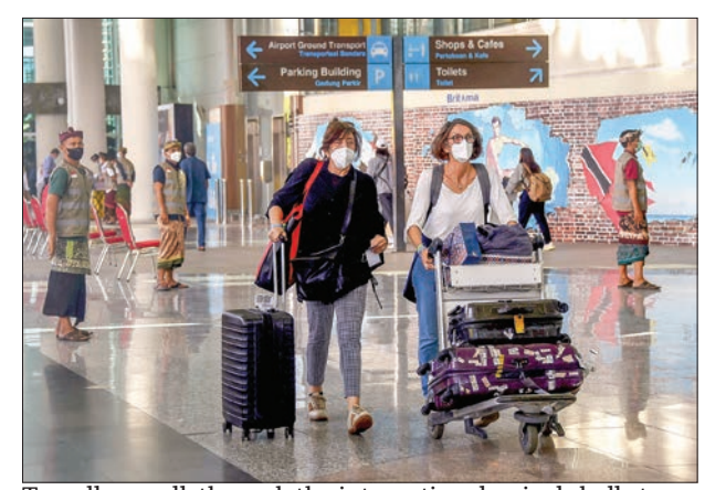
Travellers walk through the international arrivals hall at Ngurah Rai International Airport in Tuban near Denpasar on Indonesia's resort island of Bali on 16 February 2022, after a Singapore Airlines flight arrived following a nearly two-year break due to Covid-19.

as a wave of Omicron infections wanes across the Southeast Asian archipelago and after some international airlines resumed direct flights in recent