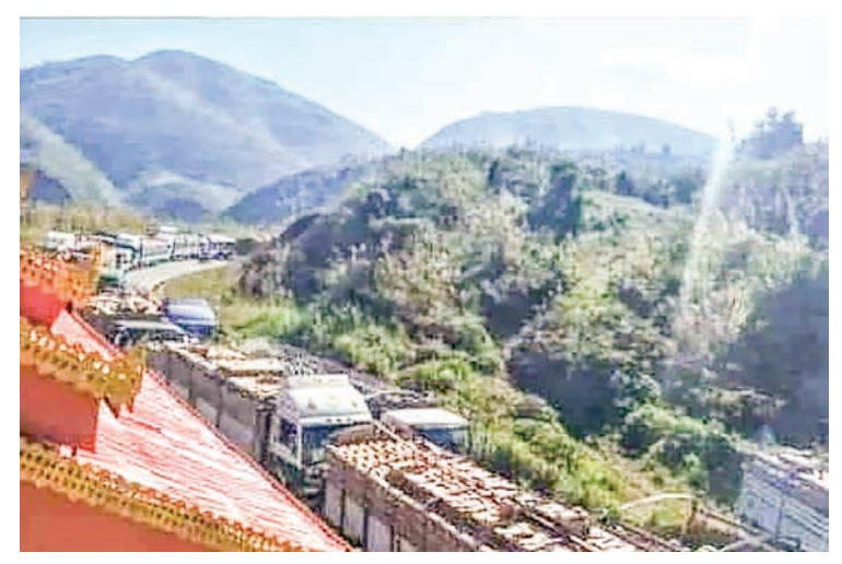
Melon trucks are seen still getting stuck on the China-Myanmar border.

"The cross-border trade via China's Wamding port is pretty complex. Additionally, China's Customs regulations cause the delay. Moreover, the health inspection team seems to wait for guidance. At present, almost all the buyers of watermelon and muskmelons are quarantined for seven days at the hostels in Changhaw yard. If the melon trucks pass the coronavirus test, they can enter the market on 10 March. Over 200 trucks are still