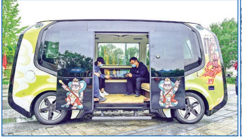
Visitors sit in a 5G-driven autonomous vehicle at the tourist service area of the Longmen Grottoes, a world cultural heritage site in Luoyang, central China's Henan province, 4 Oct 2021.

Besides, many scenic spots and museums have developed online digital experience products to present tourism resources with the help of digital technologies. They have also cultivated new business forms such as virtual tour, online performance, live streaming show, and online exhibition, creating new scenarios of immersive travel experience.