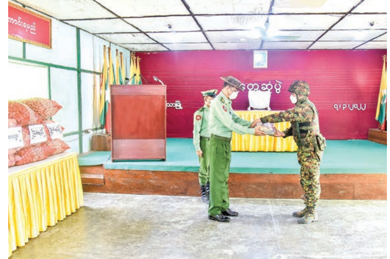
The MoD Union Minister provides food assistance for families of Katha