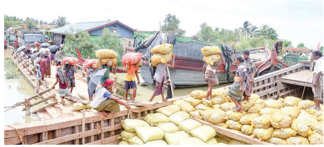
Between 1 October and 25 February of this mini-budget period, the Myanmar-Bangladesh trade through border checkpoints has touched $18.002 million, with exports worth $17.92 million and imports amounting to $0.080 million.

TRADE between Myanmar and Bangladesh as of 25 February since October this mini-budget year has exceeded US$ 18 million, down $2.49 million from the same period last year, according to the monthly data issued by the Ministry of Commerce.