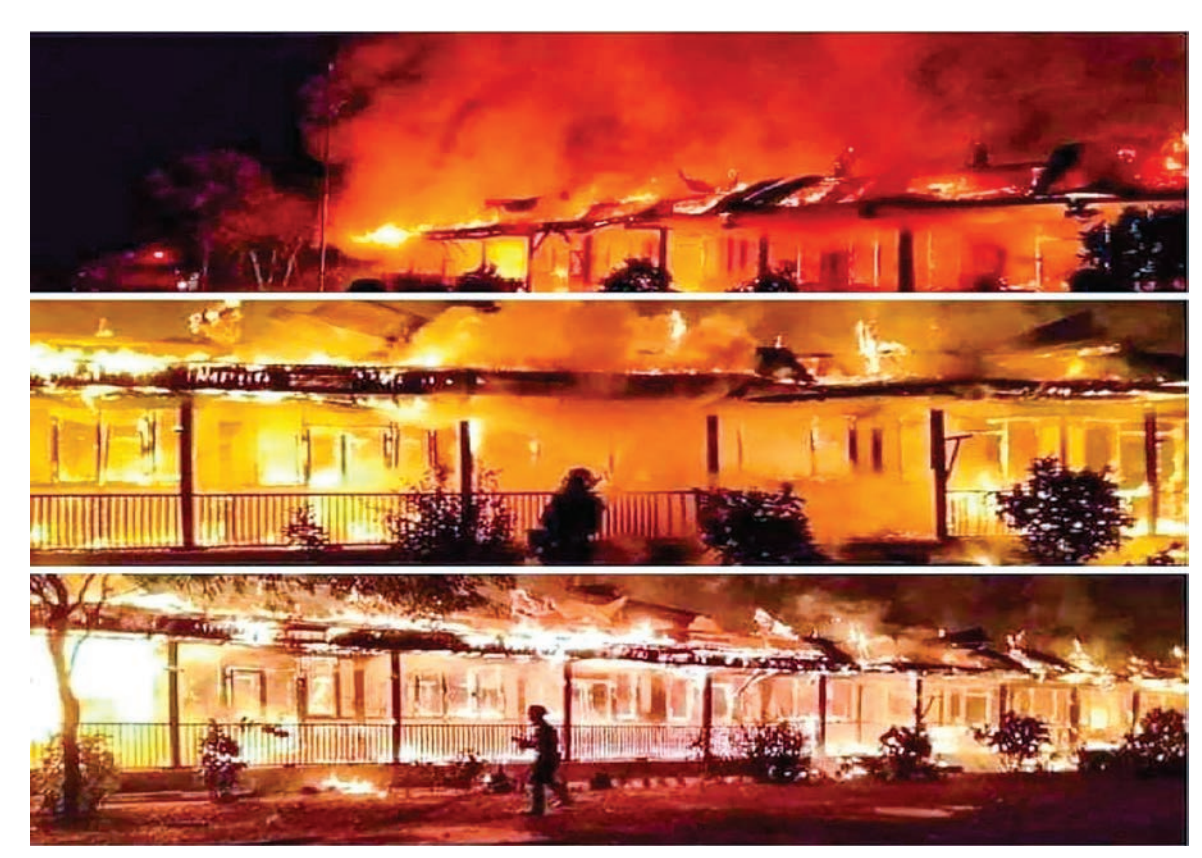
Kamyawkin Basic Education High School in Dawei township on fire in the arson attack of PDF terrorists.

'D now like to present a sorrowful news report spreading on social media that inspired me to write this article after I stopped writing a while. I reckon most Facebook users might have already known the report.