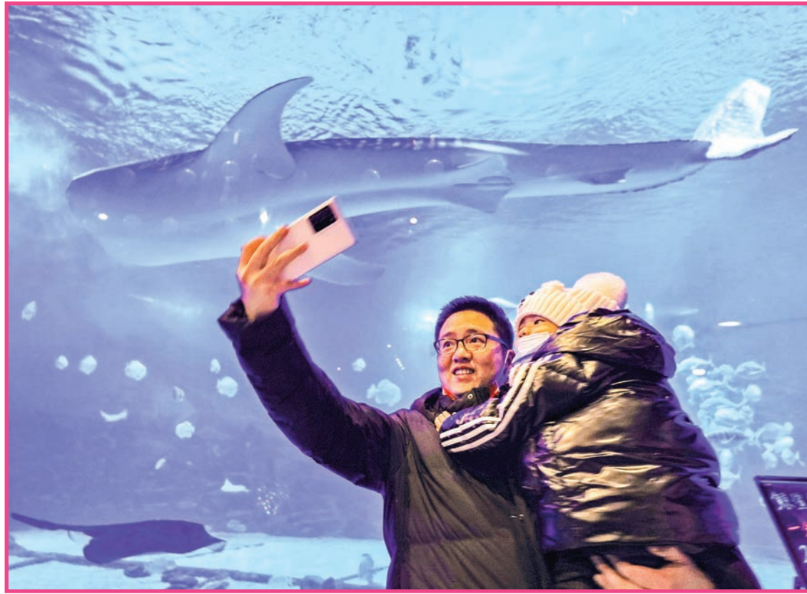
Tourists take selfies at the Haichang whale shark ocean park in Yantai city, east China's Shandong province, 4 Feb 2022.

So far, Anhui has built over 50,000 5G base stations, and covered 16 prefecture-level cities and Mount Huangshan, Mount Jiuhua, and other major scenic