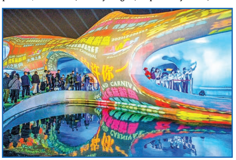
Photo taken on 10 Dec 2021 shows a light show held during the Hainan Island Carnival.