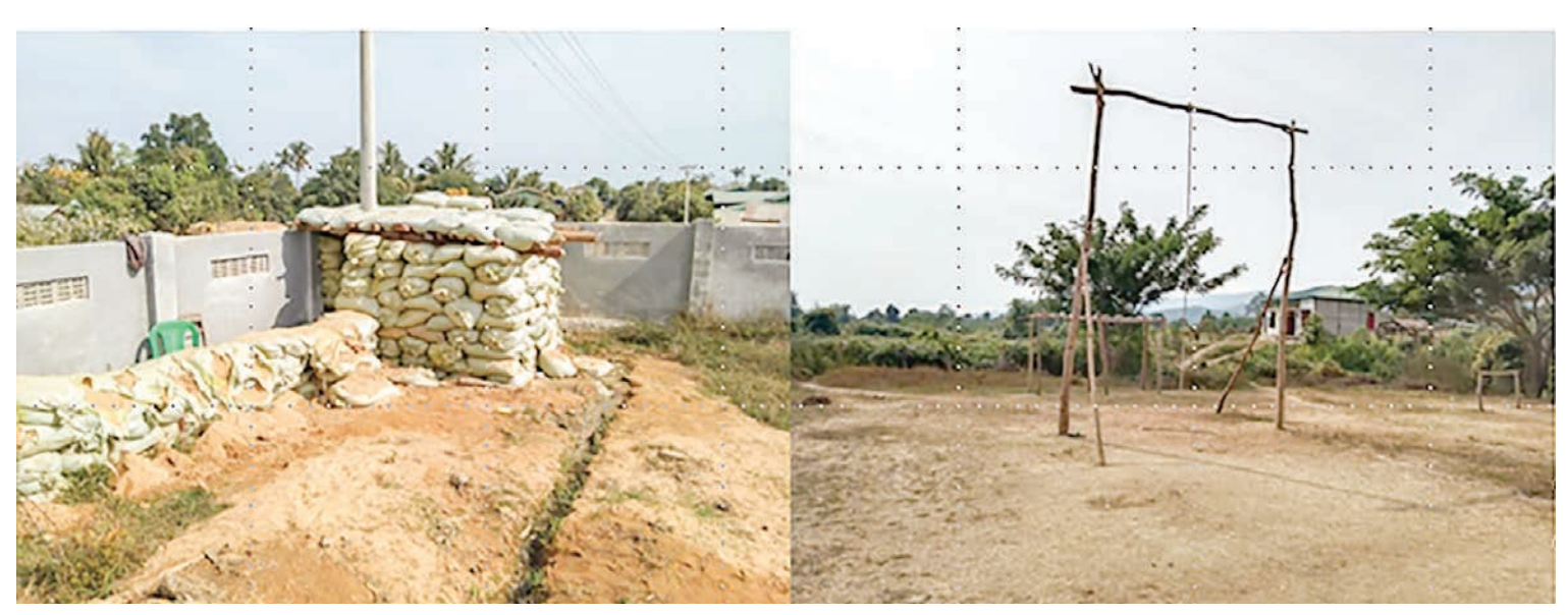
PDF terrorists use the Marathein school in Htigyaing township as their fortified base and training ground.

NUG/PDF terrorists and some EAOs that do not follow