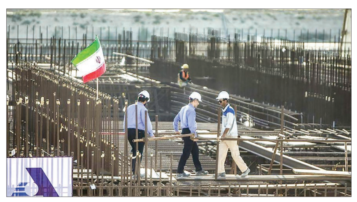
People work at the construction site of the second phase of Iran's Bushehr Nuclear Power Plant in Bushehr, southern Iran, on 10 November 2019.

SECRETARY of Iran's Supreme National Security Council Ali Shamkhani on Monday