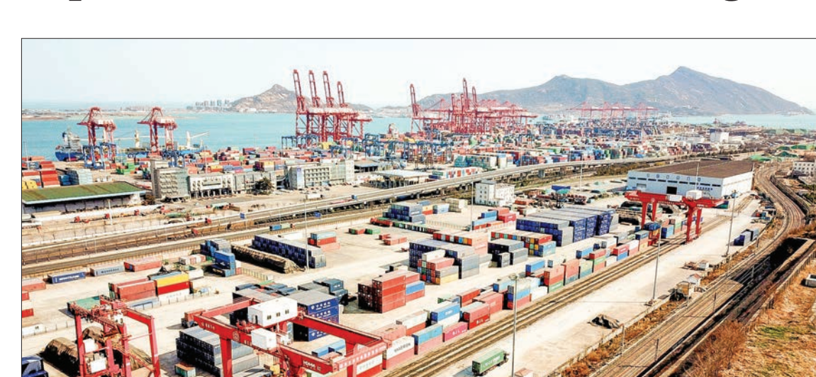
This aerial photo taken on 7 March 2022 shows containers stacked at a port in Lianyungang, in China's eastern Jiangsu province.

Trade data for January and February is usually combined