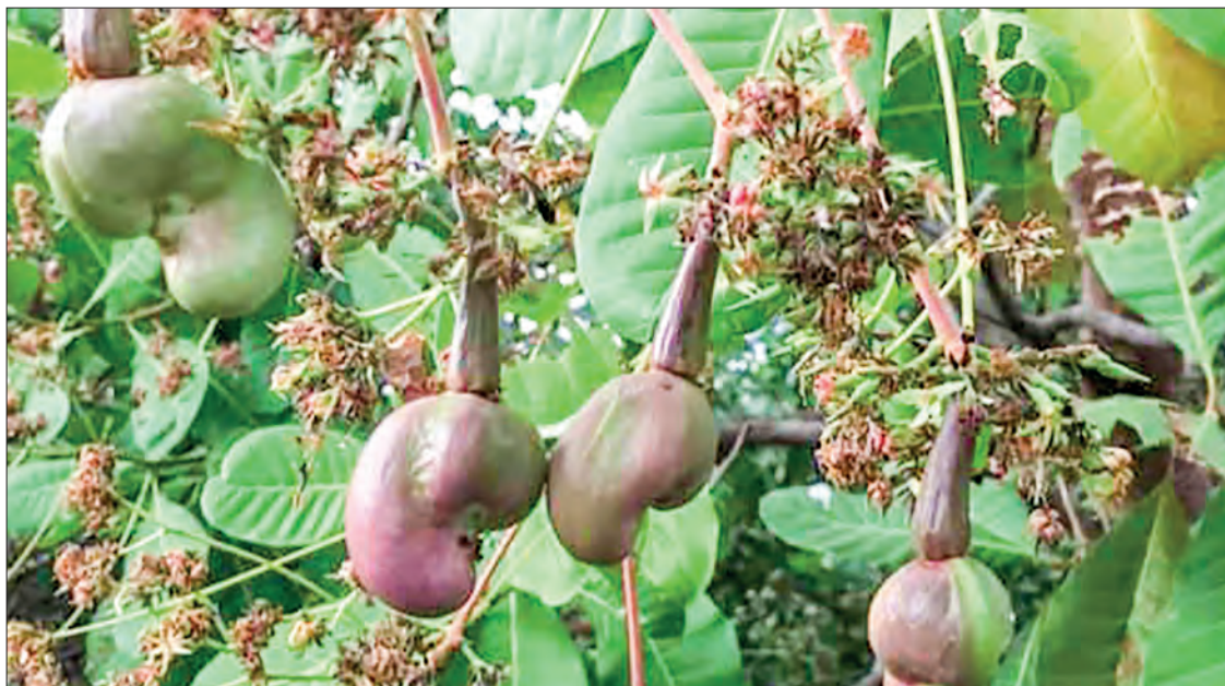
Last year, the cashew nut price was ranged between K50,000 and K60,000 per basket. But this year, the cashew is sold for only K18,000-K20,000 per basket due to the COVID-19 outbreak.

The cashew nut is grown mostly in Hsinhsin, Naga Laehsae, Seema and Shawtaw villages around Popa Mountain area, Kyaukpadaung township, Nyaung U district. Last year, the cashew nut price was ranged between K50,000 and K60,000 per basket. But this year, the cashew is sold for only K18,000-K20,000 per basket due to the COVID-19 outbreak, the