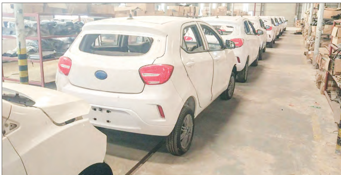
The KSDV 1-NE2 model electric car can drive up to 800 kilometres on a single charge. It can reach speeds of up to 80 kilometres per hour and can have seats of five people.

Besides, these hybrid electronic vehicles – KSDV1-NE2 – are issued with a Yangon licence number YGN-5 (S--). So, the customers can change their name easily, according to the Khaing Khaing Sangda Motorcar Factory from Myanmar. — Pwint Thitsa/GNLM