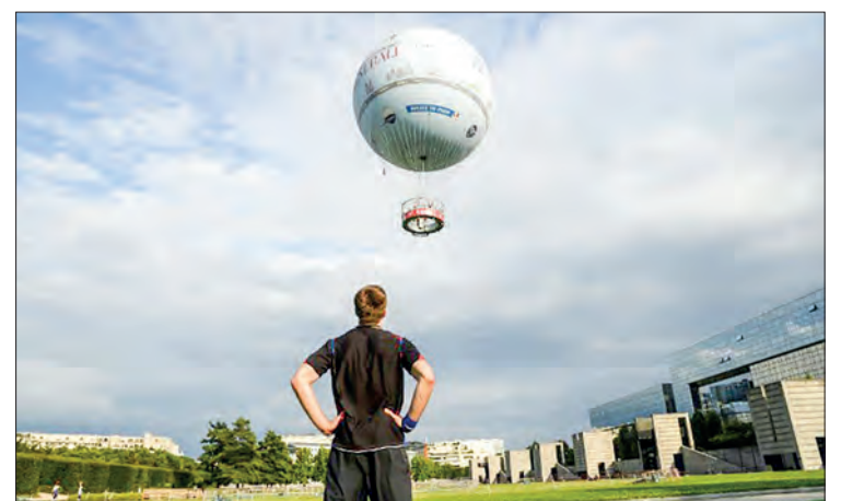
In Paris’s André-Citroën Park, a balloon is used to measure air pollution.