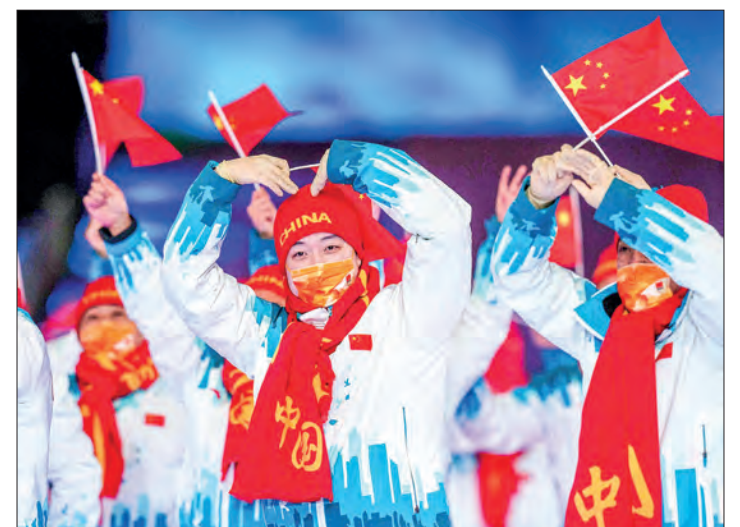
Chinese Paralympians wave their national flag as they enter Beijing's "Bird's Nest" stadium on Friday. PHOTO: JOE TOTH OIS/IOC/AFP

Athletes paraded through Beijing's national stadium as the Winter Paralympics opened Friday after a storm of controversy that surrounded the banning of Russian and Belarusian athletes due to Moscow's invasion of Ukraine. High tension in the athletes' village, threats of competition boycotts and organisers' eleventh-hour reversal of a previous decision to let Russian athletes and those from ally Belarus compete as neutrals, marred the lead-up to the Games. — Xinhua/AFP ■