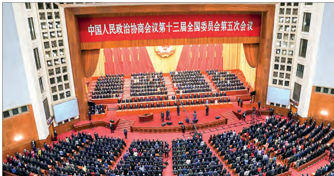
The Chinese People’s Political Consultative Conference convenes its annual meeting in Beijing on 4 March 2022.

Zhang’s remarks came as many Chinese citizens are believed to be frustrated by all-en-