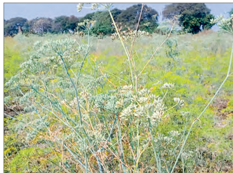
The prices of fennel seeds stood at K2,600 per viss. (a viss equals 1.6 kilogrammes), while the black fennel seeds soared to K7,500 per viss. The price of black fennel seeds edged up to a record high last year.

The fennel seeds are cultivated as winter crops in Mandalay and Sagaing regions, with a view to export targeting. — Aung Soe Phay, KK/GNL