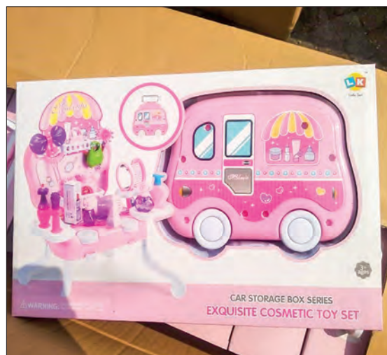
Seized toy at Asia World port.

As a result, a total of 18 arrests was made on 4 and 5 March and the estimated value is K139,115,350, according to the Anti-Illegal Trade Steering Committee. — MNA