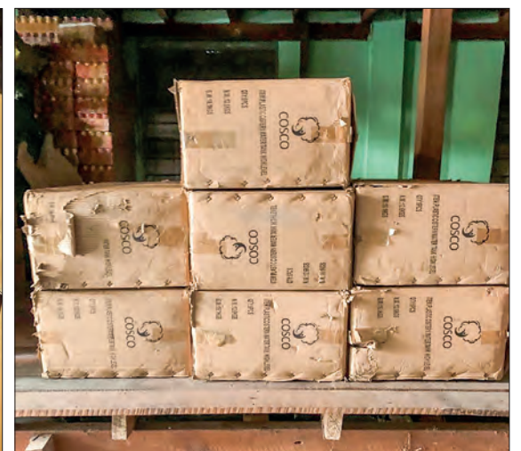
Seized items in Mandalay Region.