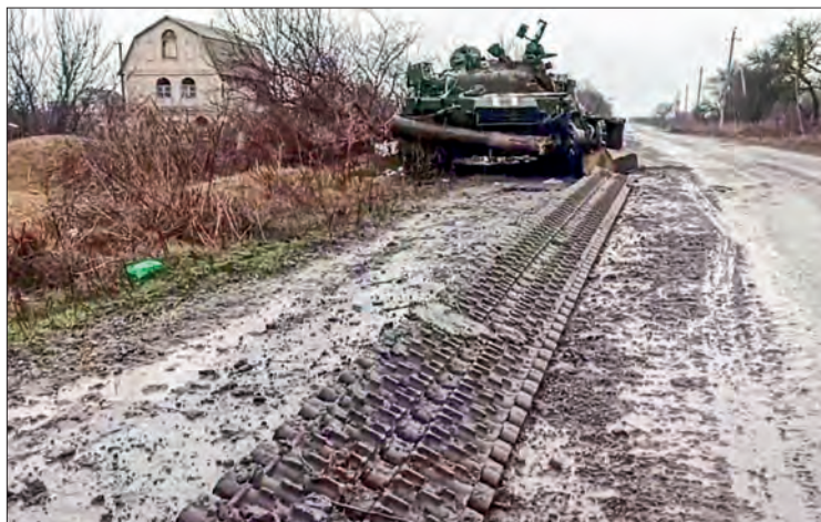
This screen grab obtained from a handout video released by the Russian Defence Ministry on 4 March 2022, shows a destroyed Ukrainian army tank in the settlement of Gnutovo outside Mariupol.

Since President Vladimir Putin’s army invaded on 24 February, Russia has pummelled Ukrainian cities, killed hundreds of civilians and assaulted Europe’s largest atomic power plant.