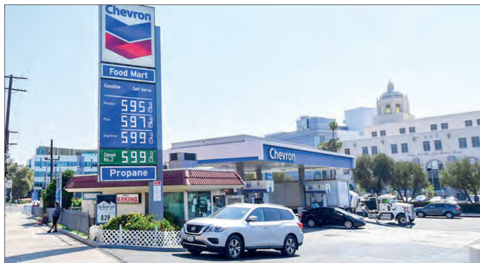
Average petrol prices in California are just above $5 per gallon ($1.34 per litre), but some gas stations have much higher prices.

While all countries have access to the same gasoline, subsidies or taxes imposed locally mean the ultimate cost to consumers varies wildly. — AFP ■