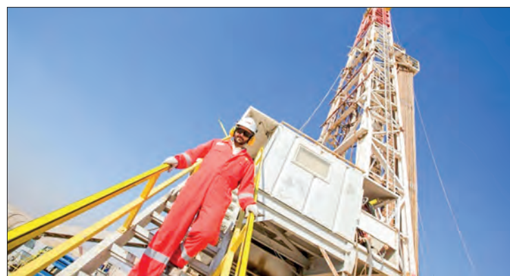
On 24 February 2022 Russia launched a military invasion on Ukraine. Already inflated oil prices have since skyrocketed to over $110 per barrel.

Brent crude for May delivery increased 7.65 dollars, or 6.9 per cent, to close at 118.11 dollars a barrel on the London ICE Futures Exchange, the highest settlement since February 2013.