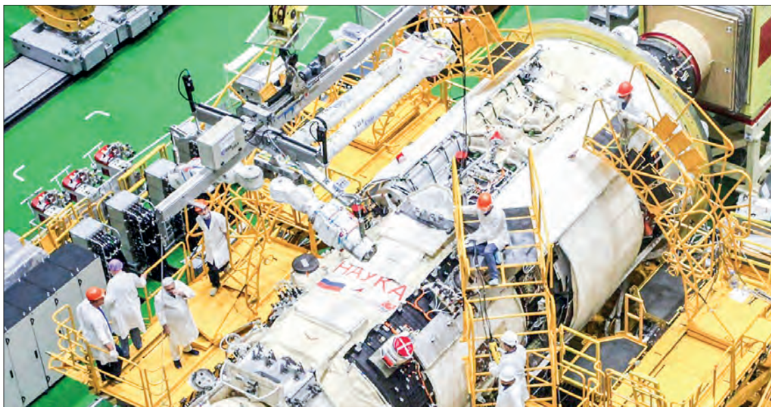
A handout photograph released by the Russian Space Agency Roscosmos 21 July 2021, shows workers preparing the module “Nauka” (Science) at the Baikonur cosmodrome in Kazakhstan.

RUSSIA'S invasion of Ukraine has had repercussions not just