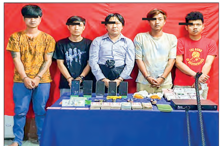
Five arrestees are seen along with seized cash and materials.

The five suspects went to the vicinity area of the bank as Myanmar Net staff and Kaung Chit Soe entered the bank