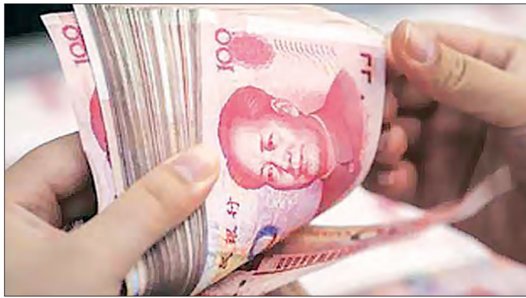
REPRESENTATIVE IMAGE: The AIIB bank has suspended its project with Russia related to the rail sector worth $300 million while freezing its two activities with Belarus, it added.

THE China-led Asian Infrastructure Investment Bank has decided to freeze projects with Russia and Belarus as Western countries expand sanctions against the two nations in the wake of Moscow's aggression against Ukraine.