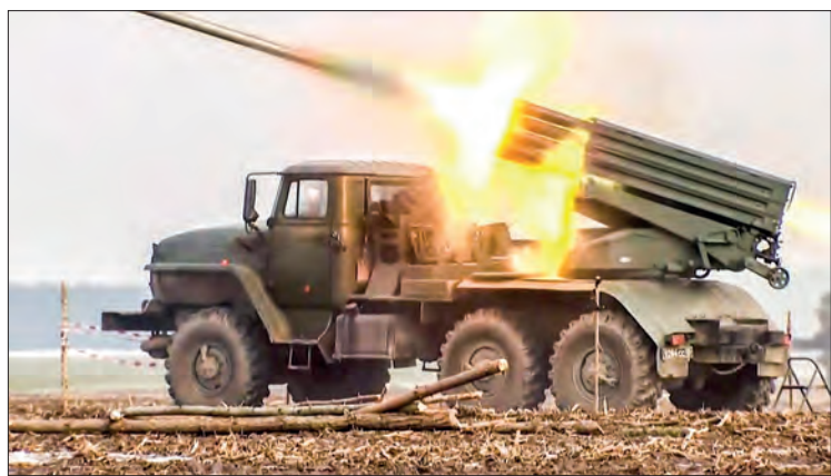
Given Russian troops’ superior weapons, air power and devastating use of artillery, Western defence analysts expect them to continue grinding forward.

The operation is coordinated by a mix of soldiers and civilians, mainly from NATO member countries, who have come to support Ukraine in its battle against a Russian invading force that is bigger and better equipped. — AFP ■