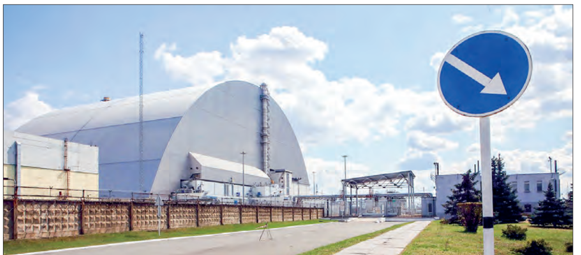
The New Safe Confinement seals off the Object Shelter, also known as the Sarcophagus, a temporary structure built in 1986 over the debris of the 4 th reactor of the Chernobyl Nuclear Power Plant, Kyiv Region, northern Ukraine.

A Chinese envoy on Friday called on parties to the Ukraine conflict to act with caution and work together, with the assistance of the International Atomic Energy Agency (IAEA), to ensure the safety of relevant nuclear facilities inside Ukraine.