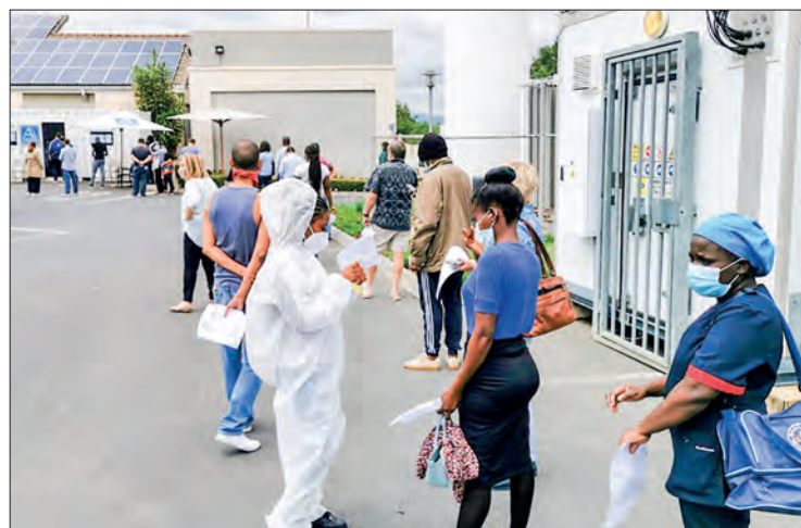
People wait to take the COVID-19 test in Johannesburg, South Africa, 1 February 2021.

The ARFSD-8, organized by the United Nations Economic Commission of Africa (ECA) and the government of Rwanda in collaboration with the African Union (AU) Commission, the African Development Bank (AfDB) and other entities of the UN system, envisaged reviewing and catalyze actions to achieve the Sustainable Development