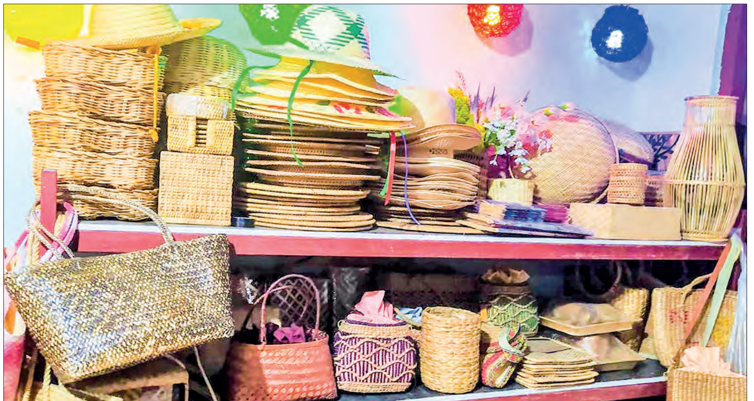
Myanmar boasts of various handicraft industries and can earn foreign income with the exports of bamboo products, commodities and value-added foodstuffs.

“We grow bamboos in 2,500 acres of land in Yedashe Township of Toungoo District to produce commodities, foodstuffs and decoration materials