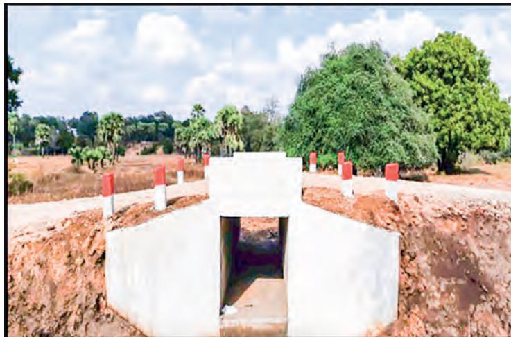
One of the rural roads in Gwegyi village in Pyawbwe Township.

"In October, tenders were called for the construction of 14 rural production roads. In December, ground construction work began. Road construction was carried out in 14 villages. Currently, all the construction work is completed. There are 18,902 acres that can be benefited. With the aim of helping to bring agricultural products to the market and to get them to cities and towns in real-time. In some areas, the process of delivery to homes and warehouses