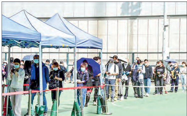
Citizens queue for COVID-19 testing at a mobile testing station in Hong Kong, south China, 11 February 2022. Hong Kong registered 1,325 new cases of COVID-19 over the past 24 hours, according to data from the Centre for Health Protection on Friday.

ONE of Hong Kong’s top coronavirus experts on Thursday joined a growing chorus of criti-