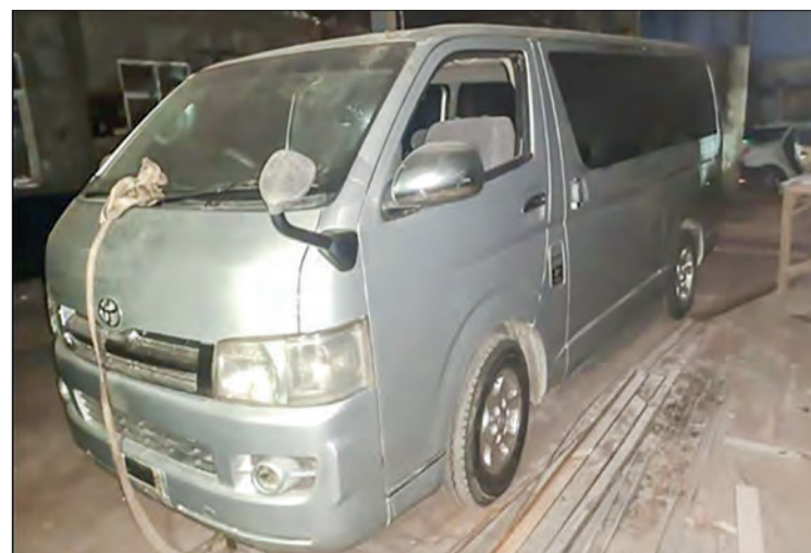
Confiscated Toyota Hiace in Thingangyun Township on 4 March 2022.

The suspects committed the robbery by taking the chance of threats conducted by CRPH, NUG and PDF terrorist groups. Therefore, the public should report the activities of terrorist groups and unscrupulous persons secretly to the security forces. The informers will be awarded. The AGD Bank robbers will face actions under the law. — MNA