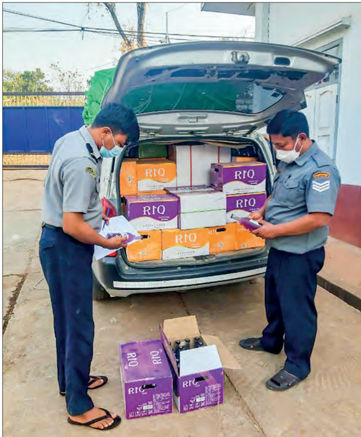
Officials confiscated goods in Shan State.

BY the Anti-Illegal Trade Steering Committee, effective action is being taken to prevent illegal trade under the law.