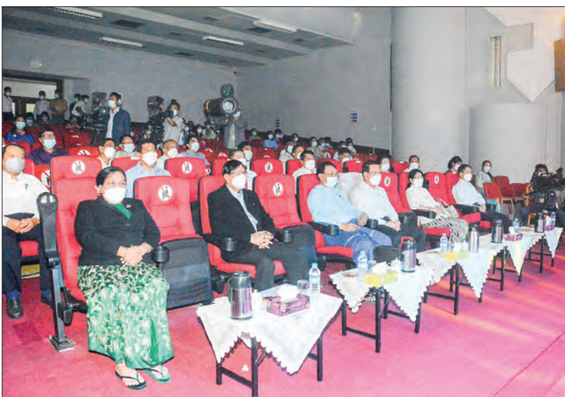
The MoI Union Minister views the Friday Night Live Show programme at the MRTV Studio A.

Before the entertaining processes, the Union minister and party cordially greeted the artistes. Then, the Union minister, the region chief minister and the chairman of the Myanmar Press Council gave the flower basket and cash-prizes to MRTV Orchestra. –MNA