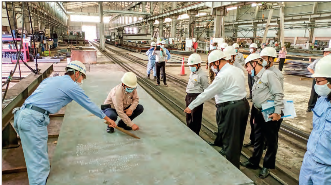
The MoC Union Minister and party pay an inspection tour around the J & M Steel Solutions Co., Ltd yesterday.

The J&M Steel Solutions plant in Yangon, a joint venture between the Ministry of Construction and Japan's JFE Engineering Corporation, manufactures bridge piers and accessories locally as well as bridge piers ordered from