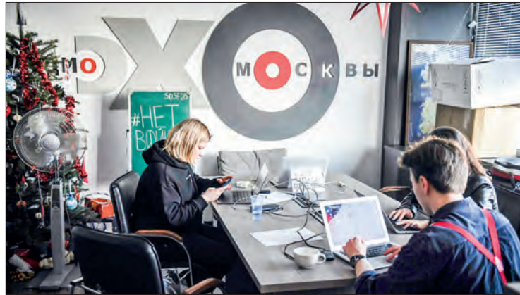
Ekho Mosvky, a liberal-leaning radio station, said it was shutting down after being taken off air over Ukraine war coverage.

RUSSIAN President Vladimir Putin on Friday signed into law a bill introducing jail terms of up to 15 years for fake news about the Russian army, as Moscow pushes forward with its invasion