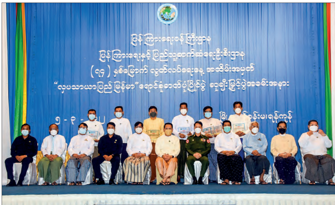
MoI Union Minister U Maung Maung Ohn, Yangon Region Chief Minister U Soe Thein and officials take the documentary photo with awardees at the event yesterday.

First, the Union minister said there were 140 photographers from different regions and states who participated in the photo contest with 338 photos. There will be eight prizes – first, second and third and the other five special awards.