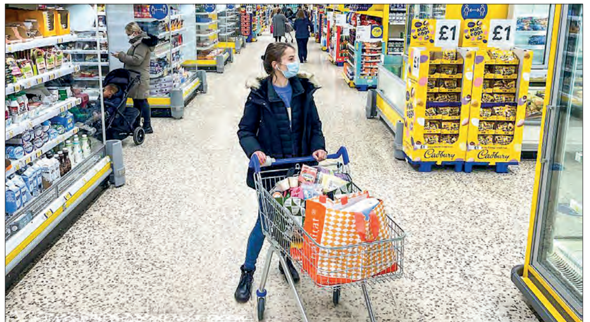
Experts say the Russia's war against Ukraine could send food prices rising and increase global hunger.

Four of five sub categories in the index rose, with the index for grains and cereals — the largest component in the index