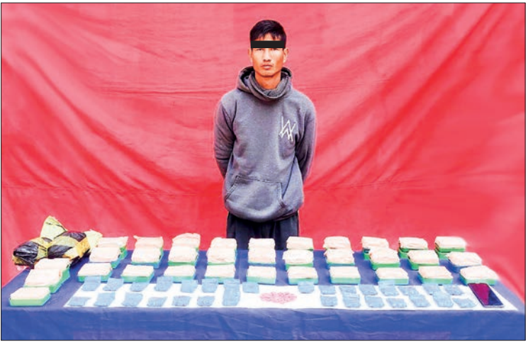
An arrestee is seen along with seized drugs.

It is reported that action is being taken against the arrested suspects under the Narcotic Drugs and Psychotropic Substances Law, according to MPF. — MNA