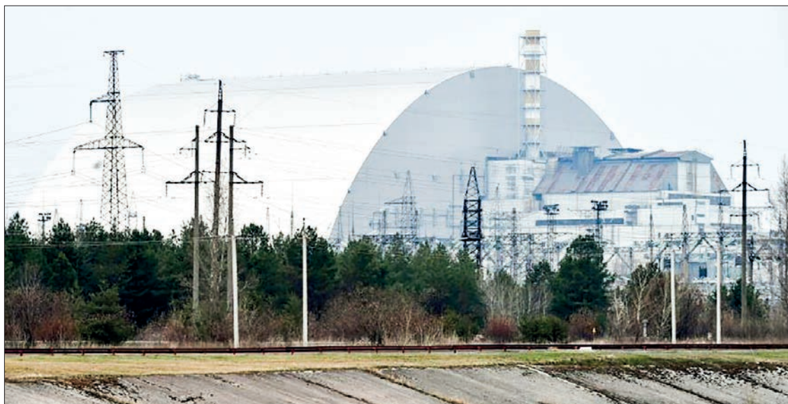
The Chernobyl nuclear power plant, seen here in April 2021, is one of the most radioactive places on earth.

UKRAINIAN authorities warned Friday that radiation levels had increased in the Chernobyl exclusion zone since it was seized by invading Russian troops, however the UN's nuclear watchdog said it currently “posed no danger”.