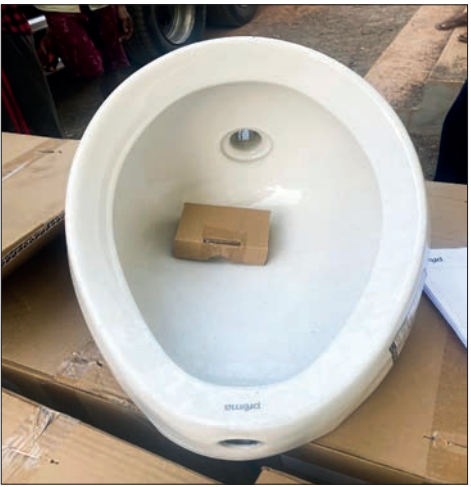
From Kayin State.