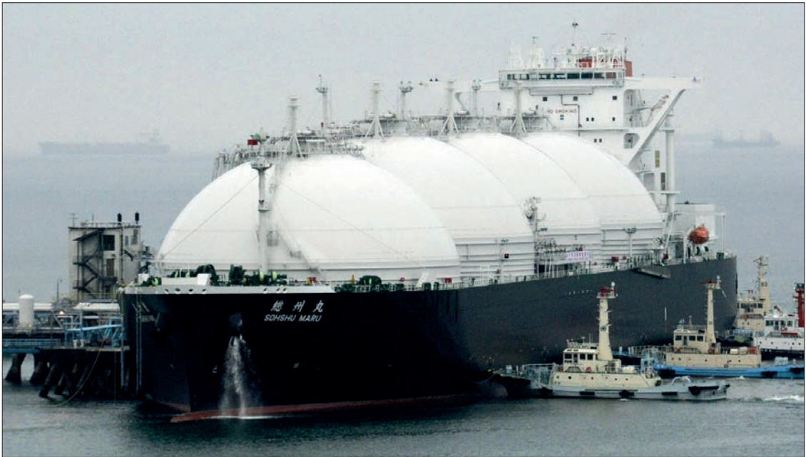
A ship containing tanks of LNG (liquefied natural gas) arrives in Mie Prefecture in January 2020.

Japan, a major LNG importer, announced earlier this month it will provide part of its imports to Europe for March, with the amount expected to total around several hundred thousand tonnes. The Japanese government will ask domestic firms to consider additionally diverting their LNG imports to Europe from April after securing stable supplies, the sources said. Russia accounts for around 40 per cent of European imports of LNG, putting the continent in a highly vulnerable position.