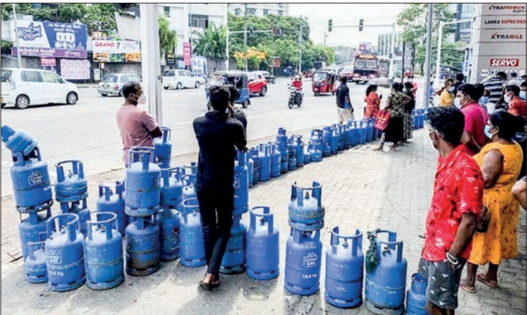
The island is in the grip of an economic crisis after the tourism sector, a key foreign-exchange earner, collapsed in the wake of the Covid-19 pandemic.

ONE of Sri Lanka's biggest fuel suppliers put up its prices by as much as 12 per cent on Saturday, as the cash-strapped island's energy crisis worsened. Lanka IOC, a fuel retailer which accounts for a third of the market, said it was increasing prices for diesel – commonly used by public transport – by 12 per cent, and petrol up 11 per cent. The increases came after a seven per cent price rise three weeks ago and will add to the upward pressure on inflation,