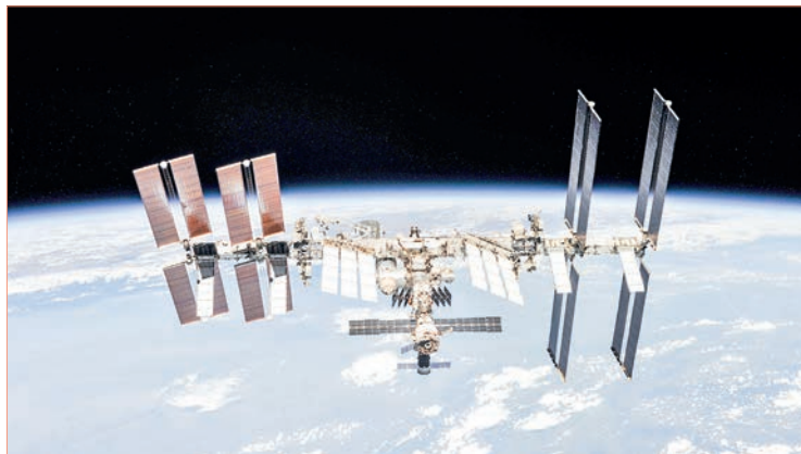
The International Space Station, a symbol of US-Russian cooperation, has been continuously inhabited for more than 21 years.