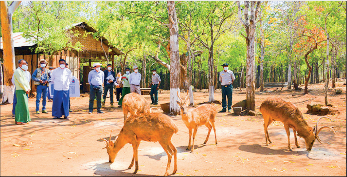
The MNREC deputy minister and party inspect the proposed Geosites for Mount Popa National Geopark yesterday.

CHAIRMAN of Geopark Working Committee Deputy Minister U Min Min Oo of the Ministry of Natural Resources and Environmental Conservation inspected the proposed Geosites for Mount Popa National Geopark in Kyaukpadaung Township of Mandalay Region yesterday.