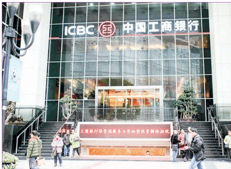
Pedestrians walk past a branch of ICBC (Industrial and Commercial Bank of China) in Chongqing municipality, 14 December 2013.

Ukraine, at least two of China's largest state-owned banks, ICBC and Bank of China, are restricting funding for the purchase of Russian commodities, Bloomberg said.