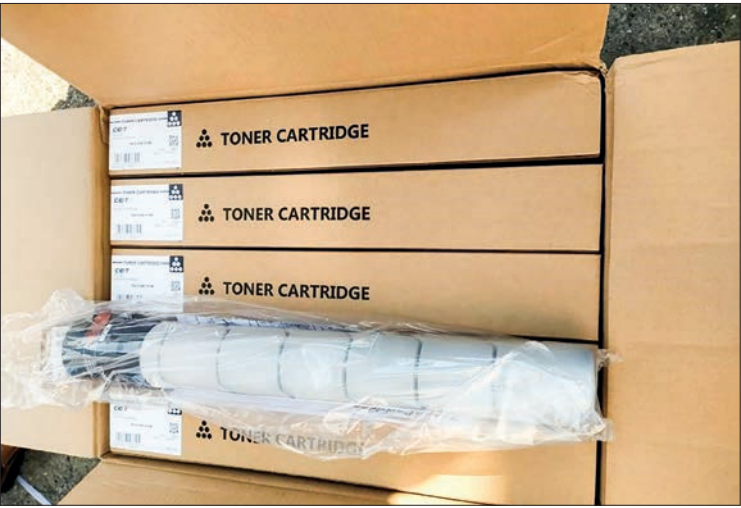
Confiscated commodities at Myanmar Industrial Port Container Inspection Station.

SUPERVISED by the Anti-Illegal Trade Steering Committee, effective action is being taken to prevent illegal trade under the law.