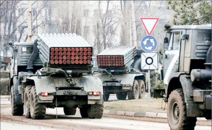
Russia has launched a barrage of air and missile strikes on Ukraine early Thursday and Ukrainian officials said that Russian troops have rolled into the country from the north, east and south.

THE Russian army has targeted Ukraine’s military infrastructure with cruise missiles from the air and sea, the defence ministry said on Saturday, as Moscow pressed on with the