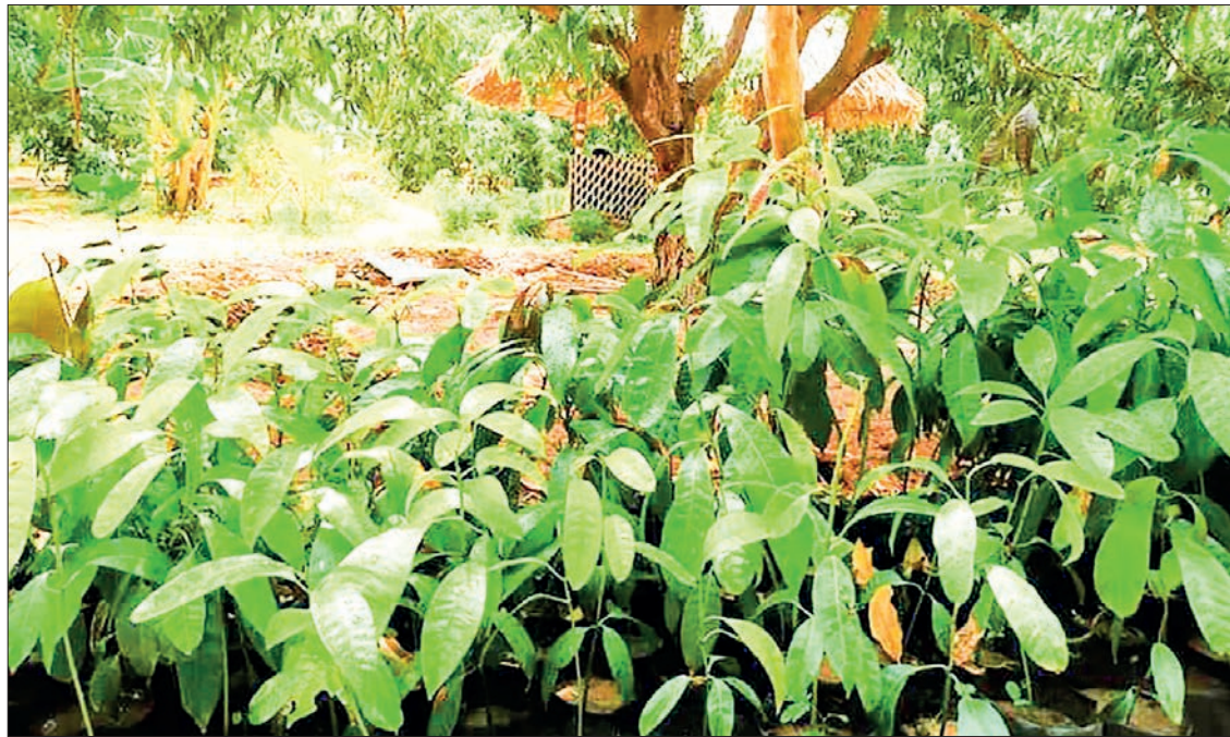
The mangoes are early yielding in lower Myanmar because it is close to the equator. Then, Mangoes yield in Yangon and Mandalay.