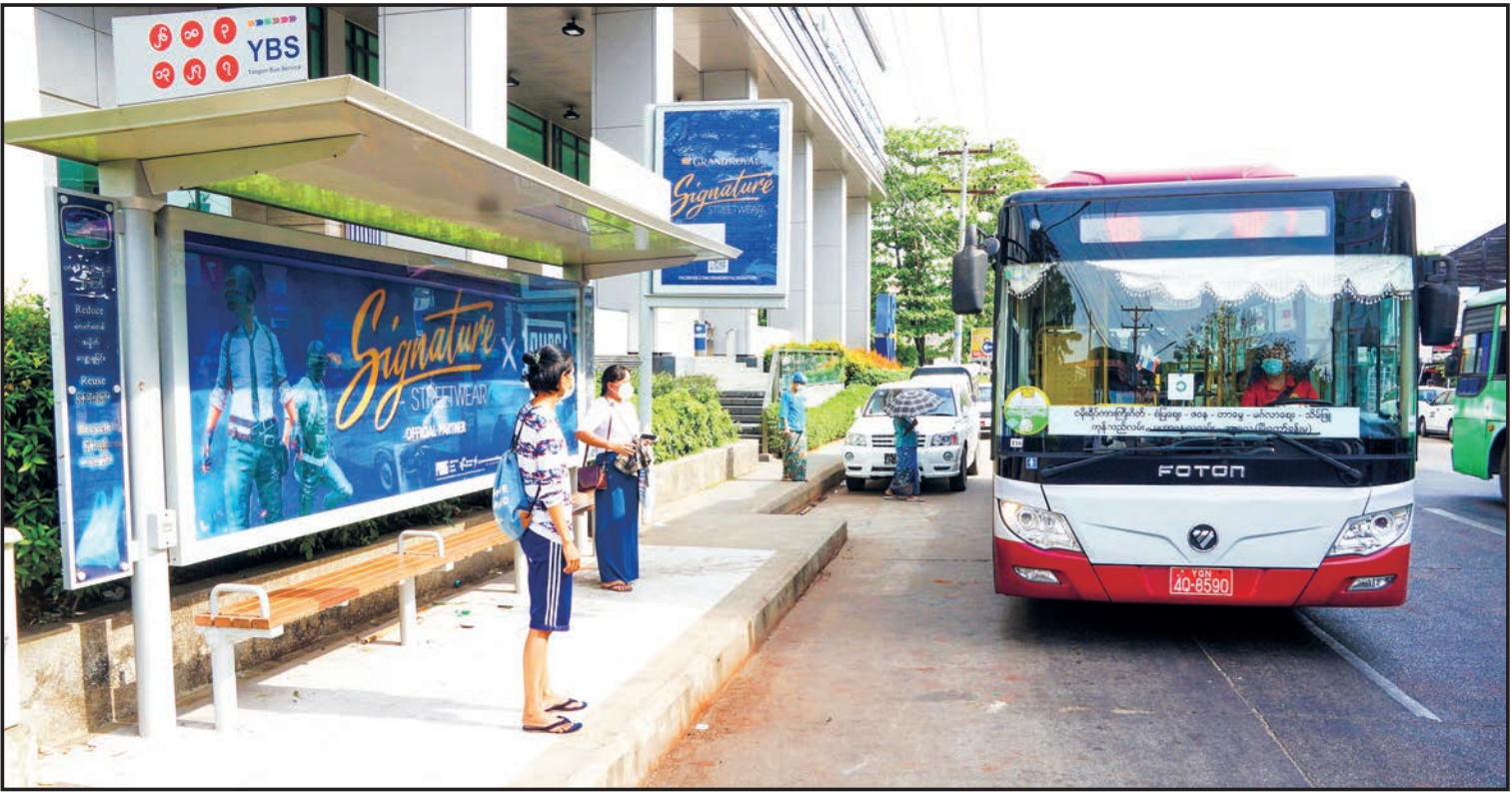
One of the YBS buses is seen commuting in Yangon.

“Currently, we don’t have any plan to increase the YBS bus fares and we do not permit it officially. Some buses adopted a distance-based payment system in the past. Currently, we arrange to launch the payment-on-distance system using a YPS card. It does not mean to increase the bus fares. We took actions against the buses that collected K500 or K1,000