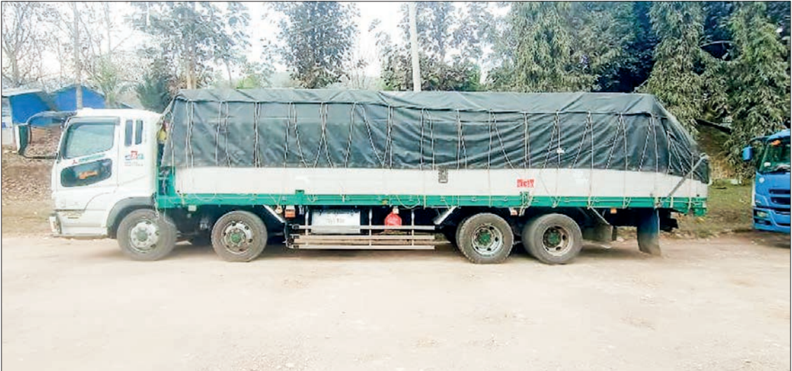
A lorry is seen ready to transport the imported anti-Covid items to states/ regions.

THE Ministry of Commerce is facilitating the importation of essential medical supplies plus anti-COVID devices that are critical to the COVID-19 prevention, control and treatment activities, including liquid oxygen and oxygen cylinders, through trading posts, international airports and seaports. Two tonnes of masks were imported by one company via the Chinshwehaw trading zone yesterday. From 1 to 26 February, four oxygen plants were imported through international seaports in Yangon and a total of 549 tonnes of masks were imported by 83 vehicles of 34 companies. Officials from relevant departments are cooperating to facilitate and expedite the standard operating procedures for the import process. It is reported that the Ministry of Commerce is coordinating with relevant departments and treatment of COVID-19 as well as contact persons for inquiries can be reached through the Ministry's Website — www.commerce.gov.mm . — MNA