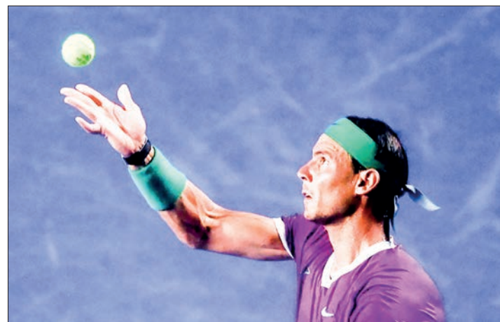
Spain's Rafael Nadal on the way to a semi-final victory over Russian Daniil Medvedev in the semi-finals of the ATP Mexico Open at Acapulco.

RAFAEL Nadal beat Daniil Medvedev 6-3, 6-3 on Friday to reach the final of the ATP Mexico Open and insure the Russian will not celebrate his rise to number one with the Acapulco trophy. Medvedev was unable to avenge his loss to Nadal in the Australian Open final, where the Spaniard rallied from two sets down to triumph in five and claim a record-setting 21st Grand Slam singles title.