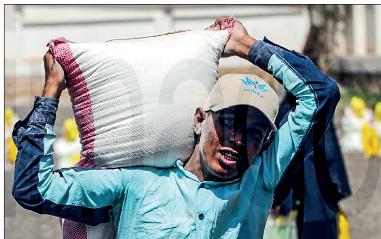
A Yemeni state employee carries a bag of wheat in Sanaa, Yemen, on 25 May 2018.

RUSSIA'S invasion of Ukraine could mean less bread on the table in Egypt, Lebanon, Yemen and elsewhere in the Arab world where millions already struggle to survive.