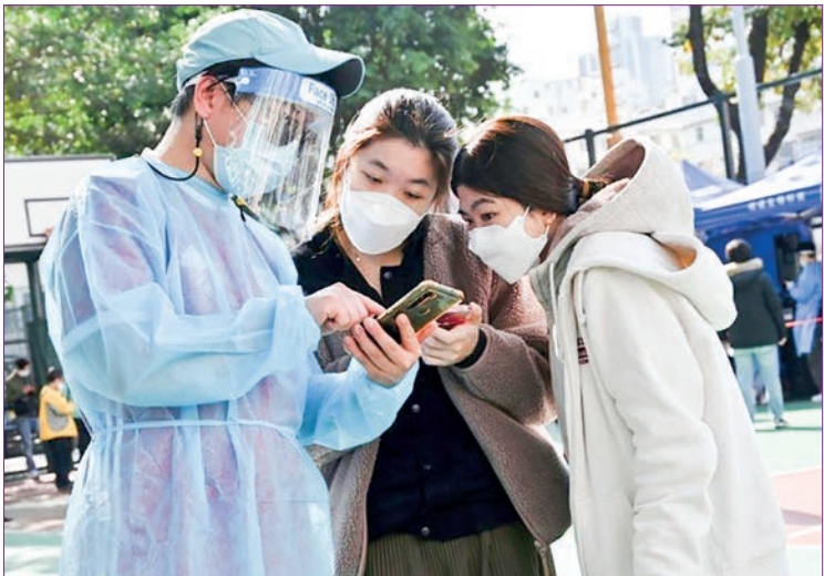
Hong Kong is in the midst of its worst coronavirus wave since the beginning of the pandemic.

eight isolation and treatment facilities to help fight a worsening COVID-19 outbreak. The temporary facilities, to be built by China State Construction International Holdings Ltd and with a combined capacity of 50,000 beds, will be spread across Hong Kong, including on private land lent for free by developers. The time-frame for completion of the new facilities was not clear. The move follows promises of "staunch support" from mainland Chinese authorities, with Hong Kong leader Carrie Lam doubling down on the official goal of bringing infections to zero.— AFP ■