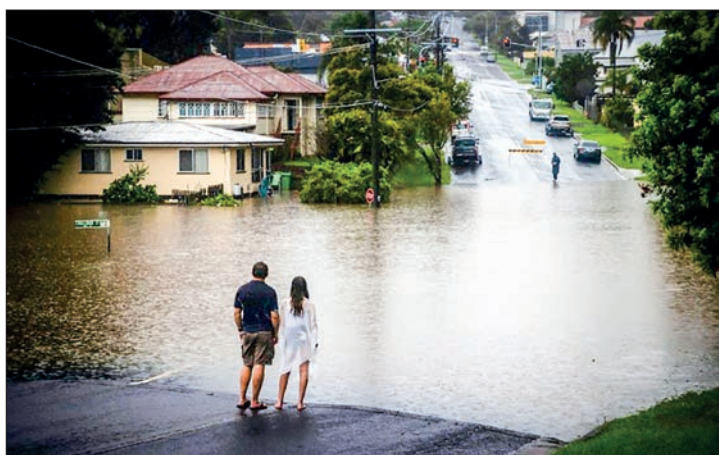
Four people have been killed in floods in eastern Australia as the state of Queensland sees some of the heaviest rains in decades.

The waters snatched the car of a team of four emergency services workers who were heading to rescue a family from their flooded home, said state police disaster coordinator Steve Gollschewski. “The vehicle in which they were travelling was swept off the road into floodwaters. Three of our members were rescued. One of those members is deceased,” Gollschewski told a news conference.—AFP ■