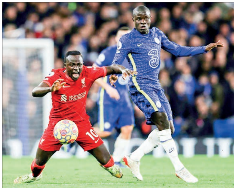
Liverpool and Chelsea will clash in Sunday's League Cup final.

JURGEN Klopp wants Liverpool to take a step towards immortality when they target the first trophy in their historic quadruple bid in Sunday's League Cup final against Chelsea.