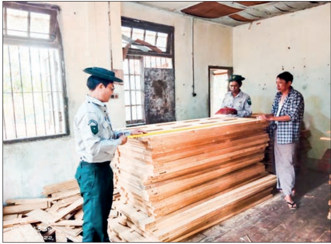
Seized teak furniture in Yangon Region.

Therefore, a total of six arrests (approximately K86,261,320) were made three consecutive days, according to the Anti-Illegal Trade Steering Committee. —MNA