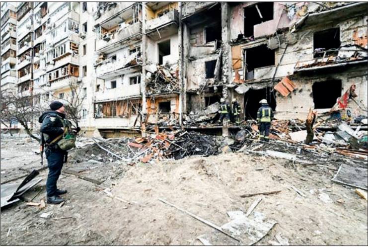
Firefighters in front of a damaged residential building on Koshytsa Street, a Kyiv suburb, where a military shell reportedly hit, 25 February 2022.

RUSSIA and Ukraine are plunging deeper into the mire of military conflict, sending shock waves across the world.