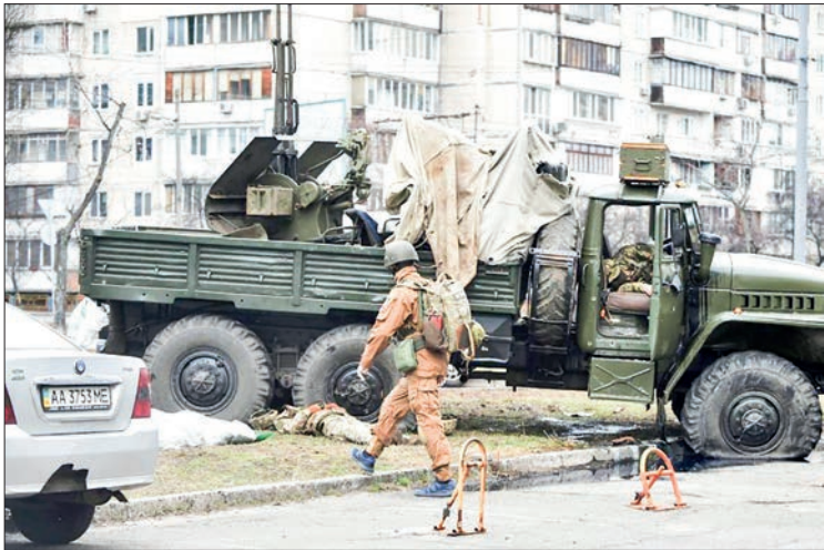
A Ukrainian military medic approaches the bodies of Russian servicemen wearing a Ukrainian service uniform and lying beside and inside a vehicle after being shot during a skirmish in Kyiv.

“Let me make one thing clear,” US Ambassador to the UN Linda Thomas-Greenfield said after the vote. “Russia, you can veto this resolution, but you cannot veto our voices, you cannot veto the truth, you cannot veto our principles, you cannot veto