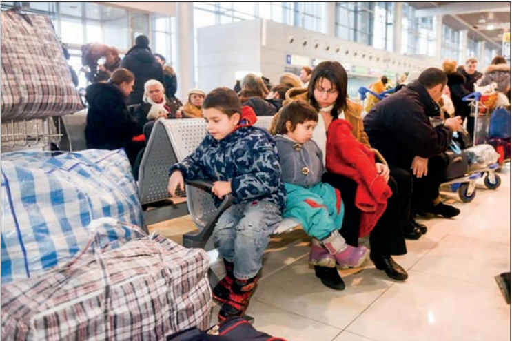
Refugees from eastern of Ukraine wait for their departure.