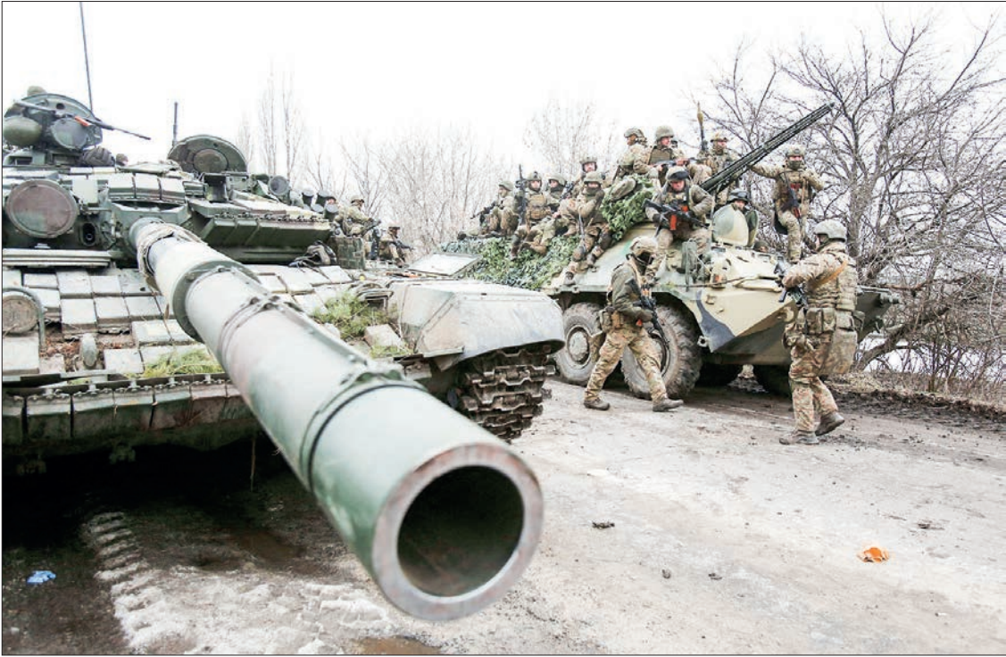
Russian forces approached Kyiv on the second day of the attack.