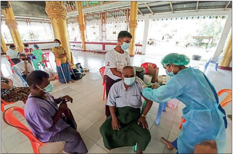
Residents receive vaccination in Ponnagyun Township.

It is reported that officials from the respective Regional Military Headquarters visited the site and coordinated the necessary work.