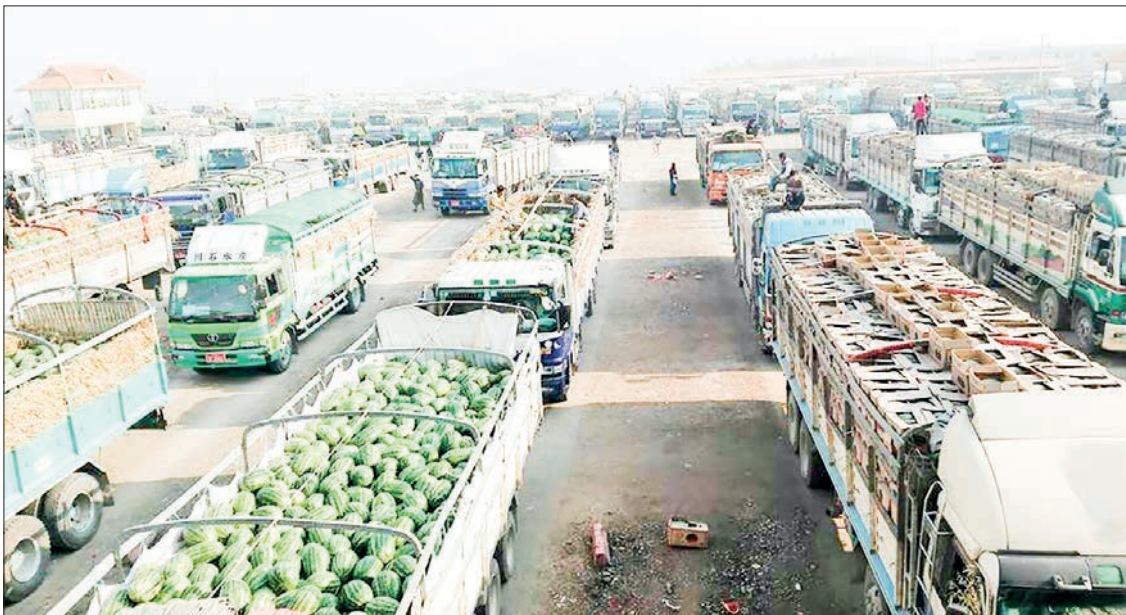
Myanmar mainly exports agricultural products, animal products, marine products, minerals, forest products, manufacturing goods and others while capital goods, intermediate goods and consumer goods are imported to the country.

Myanmar mainly exports agricultural products, animal products, marine products, minerals, forest products, manufacturing goods and others while capital goods, intermediate goods and consumer goods are imported to the country. —ZYA/GNLM