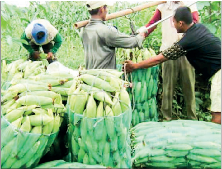
Both the domestic and the foreign demand hike up the corn prices for now. PHOTO: MIN HTET AUNG

of corn trade with China, corn market remains strong on account of the leading buyer Thailand”, Soe Win Myint explained. Thailand has granted tax exemption on corn imports between February and August. However, Thailand imposed a maximum tax rate of 73 per cent on corn import to protect the rights of their growers if the corn is imported during the corn season of Thailand. Both the domestic and the foreign demand hike up the corn prices for now. The local feed processing factory also makes competitive buying with the exporters engaged in the Myawady border post. As corn has market prospects, it is suggested to increase corn acreage, he elaborated. — Min Htet Aung (Man Sub-printing House)/GNLM