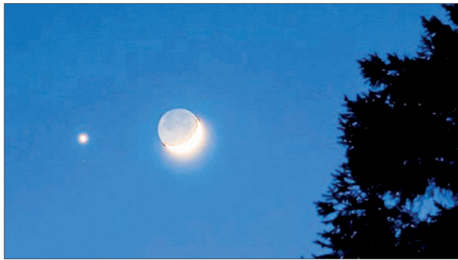
A Waxing Crescent Moon lit up by earthshine

explained why we can see light between the two points of the crescent moon, the phenomenon we now call earthshine (Sunlight reflected from the earth that illuminates the dark part of the moon and reflected again to earth.) It is also called earthlight , and also sometimes called ashen glow , the old Moon in the new Moon's arms, or the Da Vinci glow, after Leonardo da Vinci explained the phenomenon for the first time in recorded history.