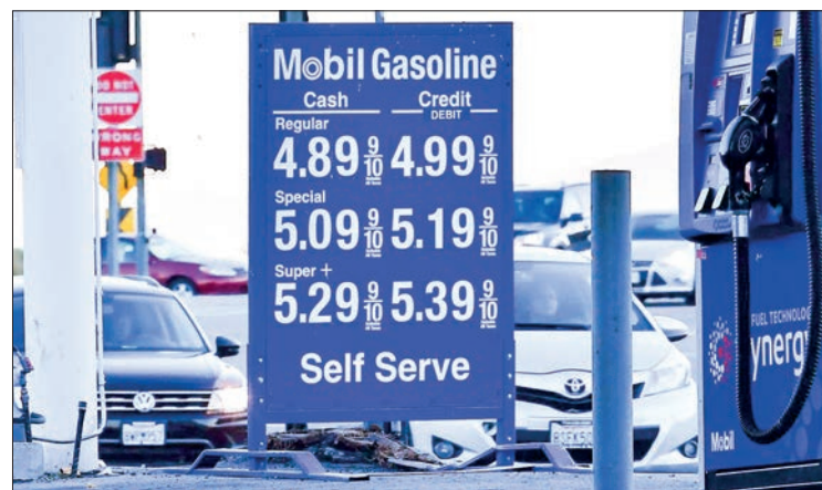
A Los Angeles gas station's price display on Wednesday, a day before the global benchmark Brent crude futures hit $100 a barrel.

The S&P 500 climbed 1.50 per cent, after falling as far as 2.6 per cent earlier in the session. The Nasdaq Composite Index increased 3.34 per cent, after shedding nearly 3.5 per cent at the session low. Despite the stunning