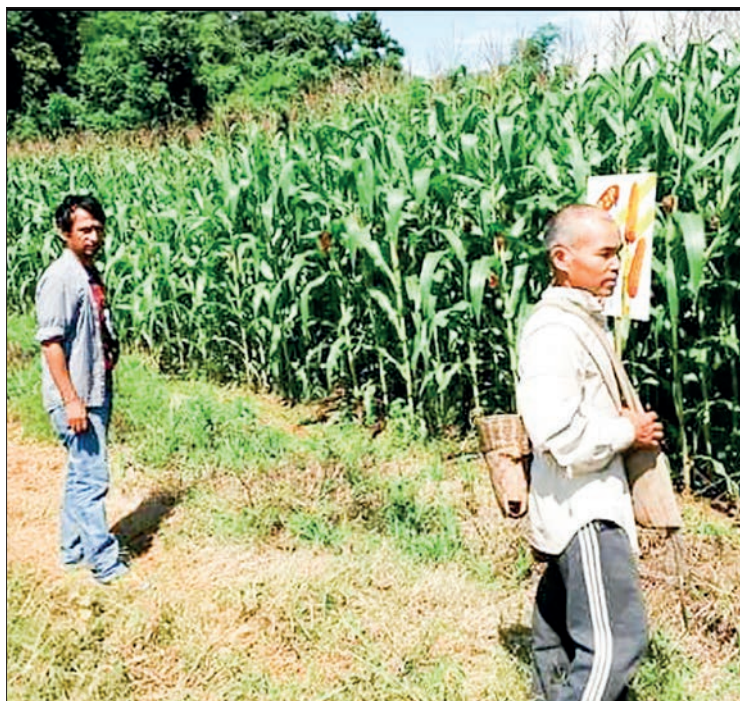
Farm workers are seen working for one of the corn plantations.

Myanmar is allowed for corn export to Thailand between 1 February and 31 August with Form-D, under zero tariff. That is the reason, the corn is being exported to Thailand through the Myawady bor-