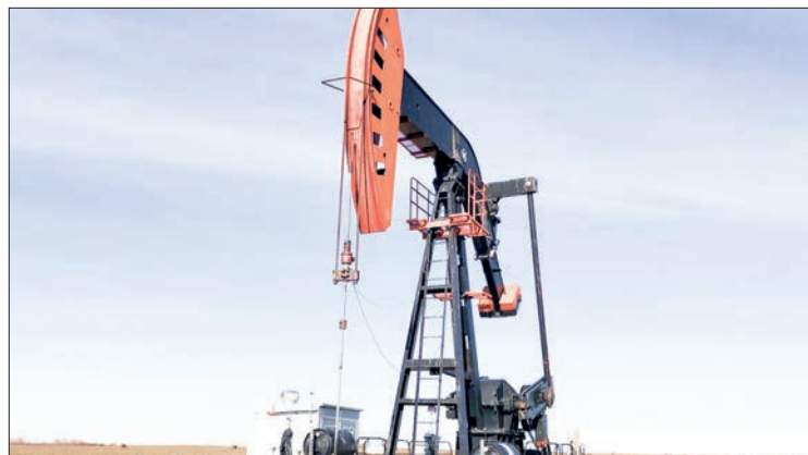
Global oil prices rose to above $100 a barrel on Thursday after Russia launched an invasion of Ukraine.

RUSSIA'S invasion of Ukraine sent oil prices above $100 a barrel and pummeled European equities on Thursday, while Wall