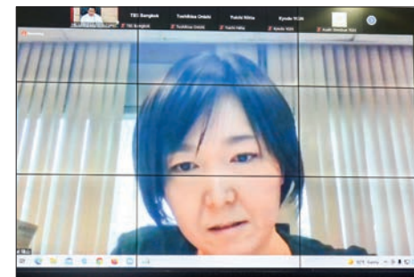
The correspondent from Asahi Shimbun.

Those wishing to re-enter Myanmar from another country strictly demand recognition for them as Rohingyas but Bengalis. The Ministry of Immigration and Population identifies ethnics as naturalized citizens and non-ethnics as the legalized citizens under the 1982 Myanmar Citizenship Law. NV card is issued to those who applied for citizenship without holding any IDs. The NV cardholders have the right to apply for the decisions to legalized citizens,