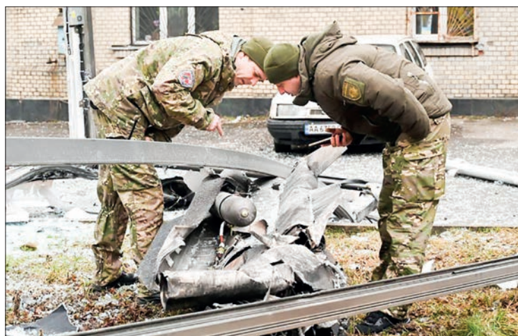
Police and security personnel inspect the remains of a shell landed in a street in Kyiv on 24 February 2022.

Putin and his French counterpart Emmanuel Macron also discussed the situation in Ukraine during a phone conversation.—Xinhua ■