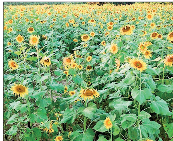
Kyaukse township targeted to cultivate a total of 11,607 acres of winter crops, including 297 acres of peanut, 5,135 acres of sesame and 6,175 acres of sunflower.

Staff from the Township Agriculture Department are providing technical support to improve the winter crops yield.