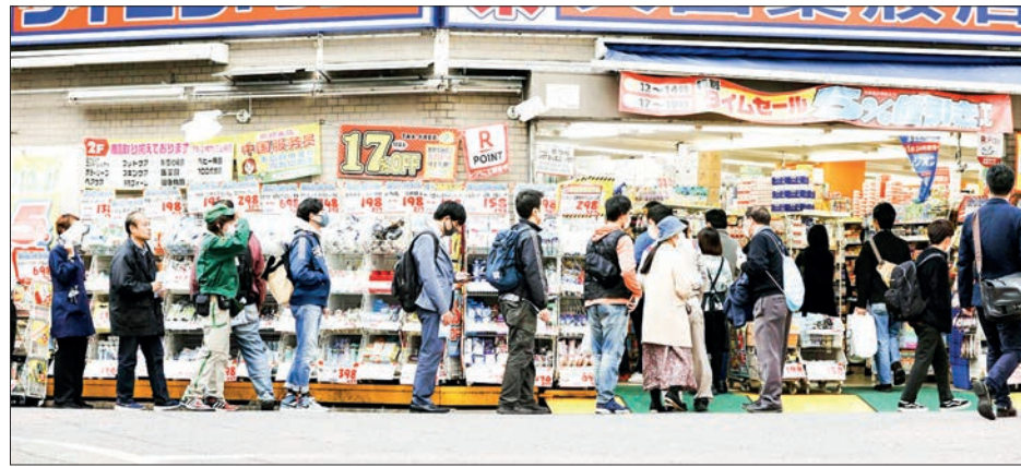
People wait in line in front of a drugstore in Tokyo to buy masks on 6 April 2021.

JAPANESE pharmaceutical firm Shionogi & Co. said Friday it has applied for approval of its oral COVID-19 drug, after mid-phase clinical trials showed efficacy in reducing the coronavirus in the body.