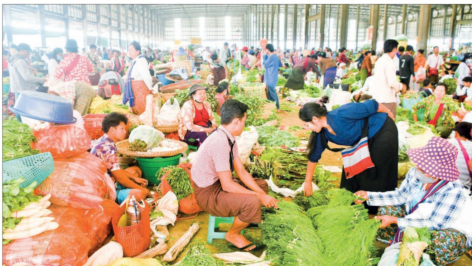
The market located near the Danyingon railway station offers the sale of about 7,000 tonnes of green groceries and about 3,000 tonnes of various commodities daily.

The products produced across the nation enter the market via road and sea routes daily while the products from