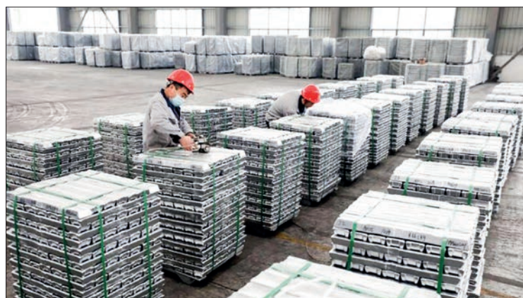
Aluminium rallied to a record in London, exceeding its 2008 peak, as the deepening Ukraine crisis added to supply risks in a market already seeing critical shortages of the most widely-used base metal.

The base metal was already trading at elevated levels owing to stretched global supplies of the base metal, particularly from China.—AFP ■