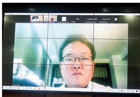
The correspondent from Nikkei Asian News.

Currently, the state of emergency will be politically extended for six more months