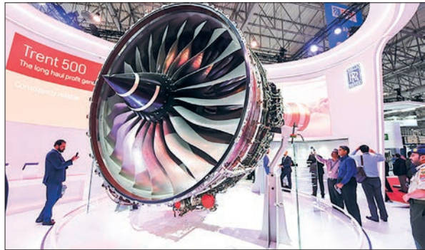
A Rolls-Royce Trent 500 engine on display at the Dubai Airshow in 2019. The company relies on aerospace for just over half of its annual revenues.

“Even though markets were already in a bad mood because of... Ukraine, shares in Rolls-Royce fell by even greater magnitude as investors reacted really badly to the resignation of CEO Warren East,” noted Russ Mould, investment director at AJ Bell.—AFP ■