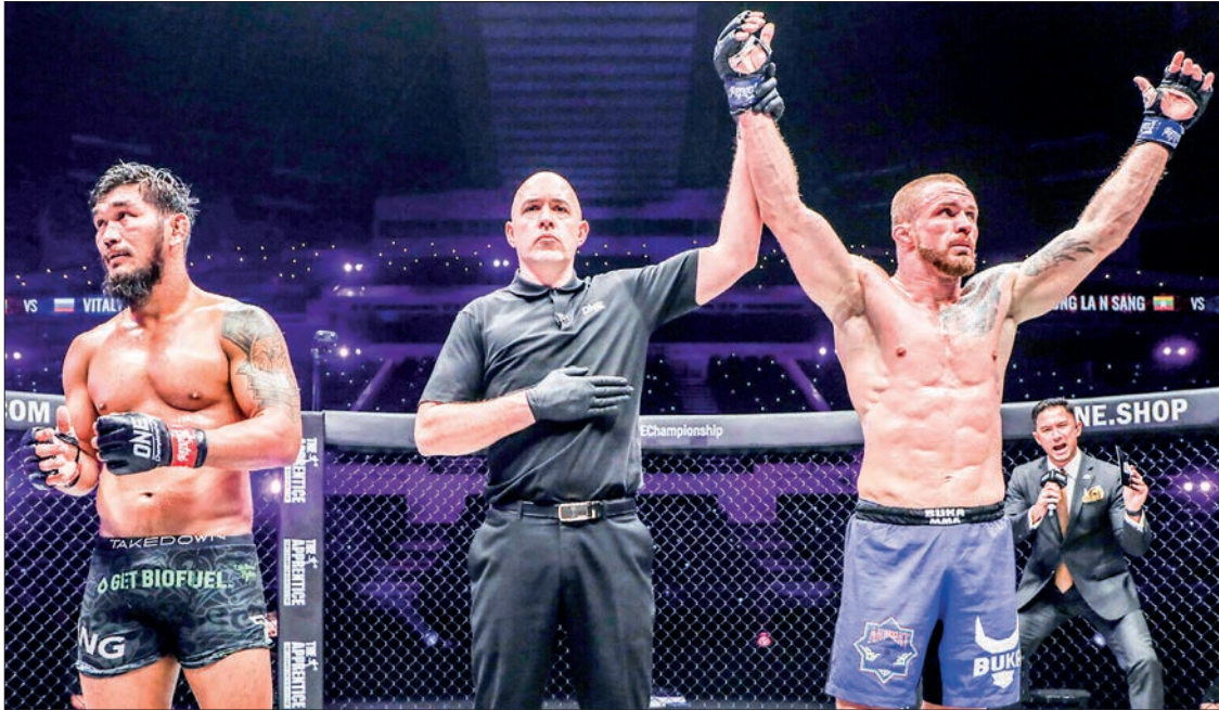
The referee (middle) nominates Vitaly Bigdash (Right) as a winner of the ONE Championship: Full Circle catchweight trilogy bout via unanimous decision at Singapore Indoor Stadium on 25 February 2022.

VITALY Bigdash defeated Aung La Na Sang via unanimous decision in their catchweight trilogy bout of ONE Championship: Full Circle event at Singapore Indoor Stadium yesterday night.