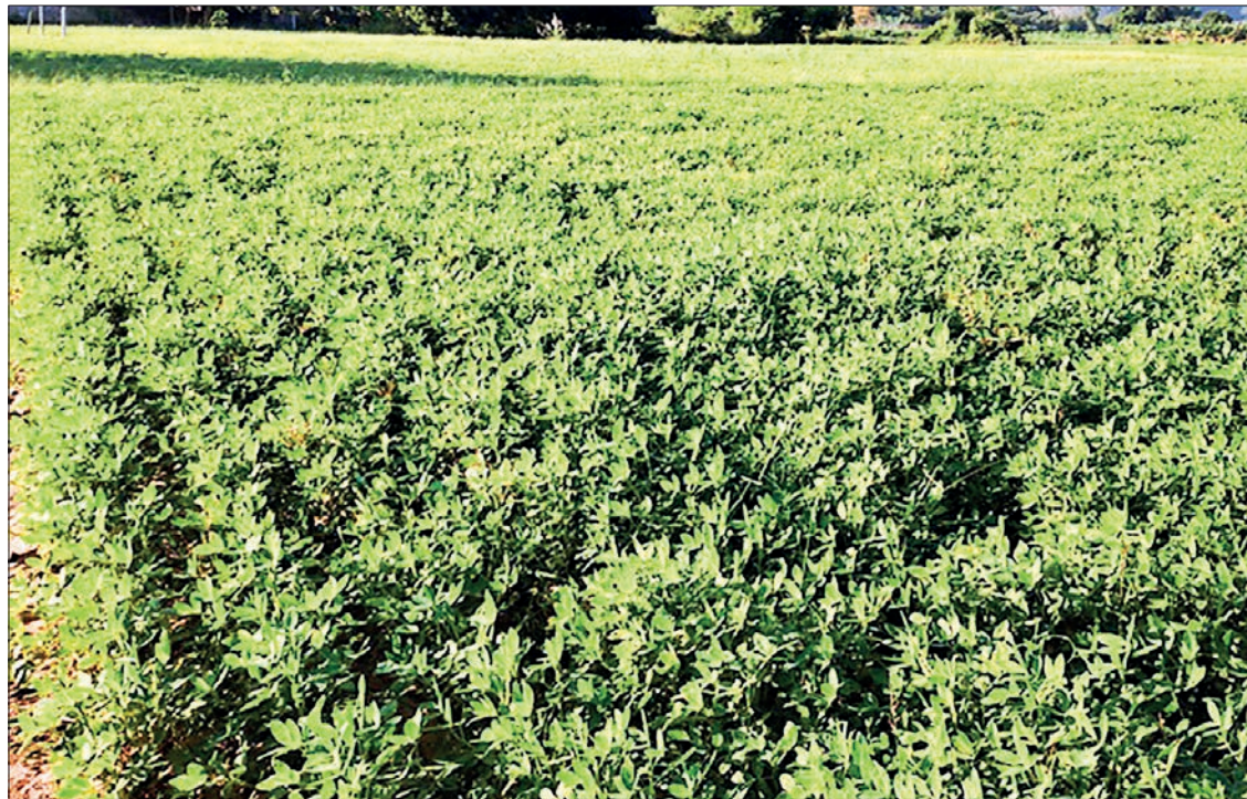
The agro exports topped $2.14 billion in the corresponding period of the 2020-2021FY.

THE value of agricultural exports shrank to US$1.56 billion as of 11 February in the current mini-budget period (Oct 2021-March 2022), indicating a significant drop of $576.9 million as against the year-ago period, as per the statistic of the Ministry of Commerce.