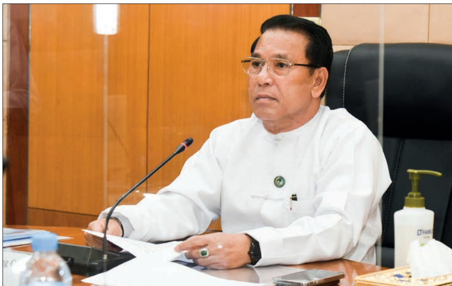
MoI Union Minister U Maung Maung Ohn.

Priority is given to perform vaccination to EAOs. If so, it can be seen that the Tatmadaw is striving for ensuring per-