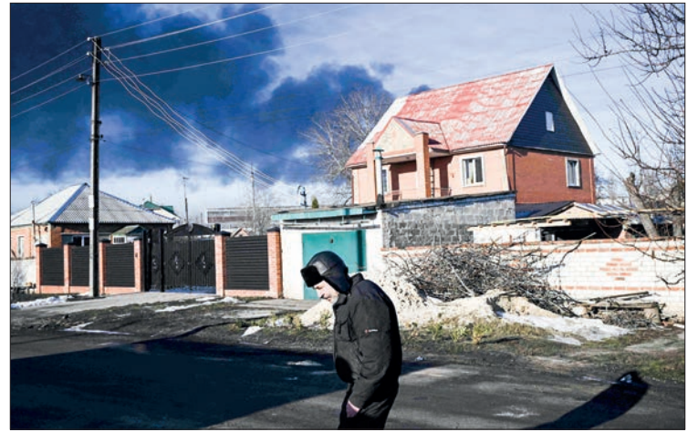
Some of the fiercest fighting was in east Ukraine, near the frontline with Moscow-backed rebel forces.

Zelensky said that 137 Ukrainians, both military personnel and civilians, had been killed since the start of the attack early Thursday.