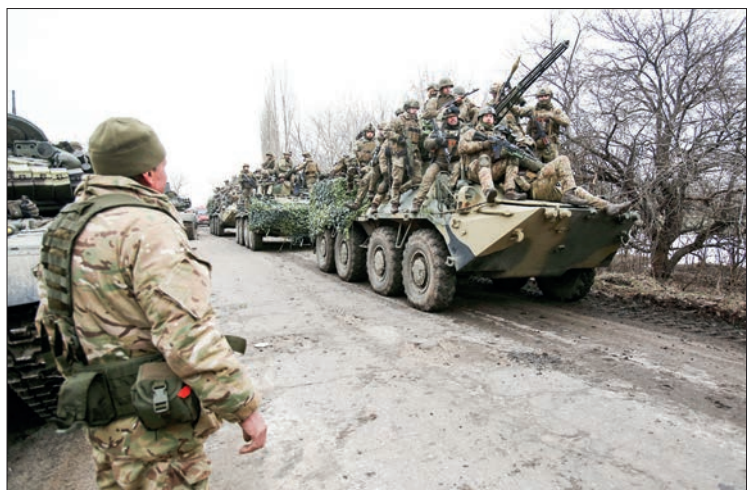
Ukrainian servicemen prepare to repel an attack in Ukraine's Lugansk region.

INVADING Russian forces pressed deep into Ukraine as deadly battles reached the outskirts of Kyiv, with explosions heard in the capital early Friday that the besieged government described as "horrific rocket strikes".