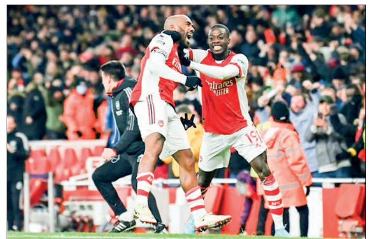
Arsenal’s Alexandre Lacazette (L) celebrates with Nicolas Pepe.