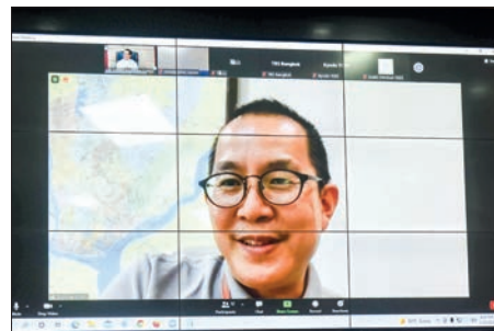
The correspondent of Kyodo News.

The reporter of Kyodo News of Japan raised the question of how to deal with the allegation from The Gambia for ICJ hearings. The Union Minister said Gambia accused Myanmar of violating the Convention on the Prevention and Punishment of Crime of Genocide at the ICJ on 11 November 2019. Regarding the argument of Gambia, the Court lacks jurisdiction and Gambia does not have the right to launch the case at the Court. Myanmar submitted the first preliminary objection to the International Court of Justice on 20 January 2021. The hearings related to the objection of Myanmar are being held at the court from 21 to 28 February 2022 at the Peace Palace of The Hague, the Neth-