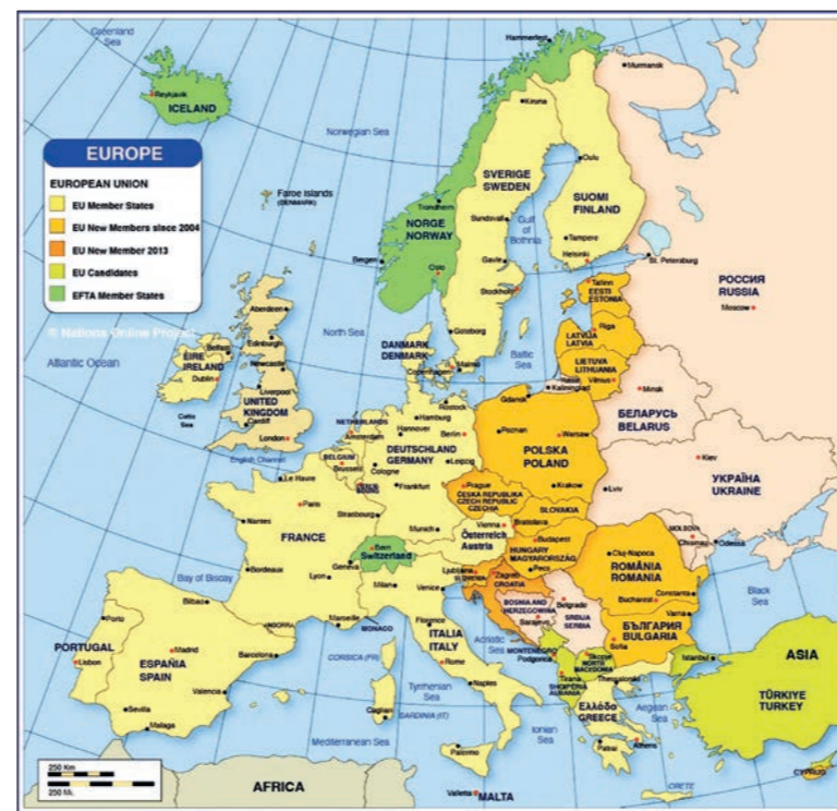
Political Map of Europe showing the European countries.

In Southern Europe, the winters are raining and the summers are hot and dry. The badgers, owls, and a variety of fish are found in this region. Albania Andorra is a landlocked country found within France and Spain. France is the most popular travel destination in Europe and Eiffel Tower is in Paris, the capital of France. Then Greece is home to the Acropolis. Italy is another popular tourist attraction where the famous Leaning Tower of Pisa and the Colosseum in Rome can be found. Spain is a popular place for tourists where