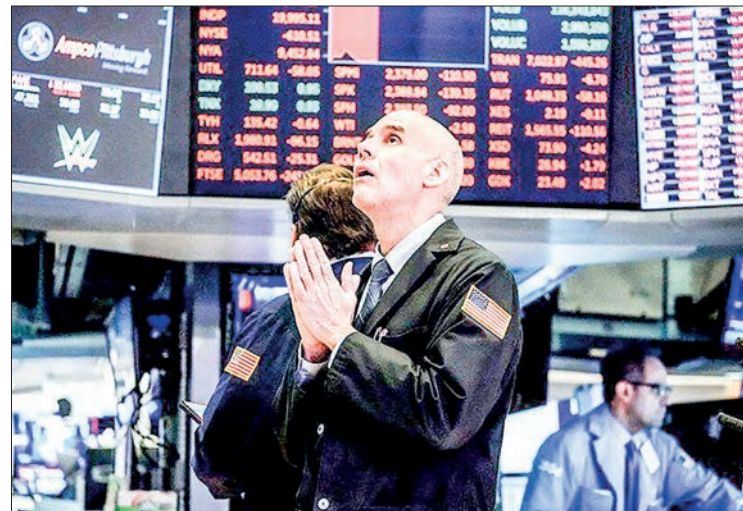
The current crisis in Ukraine, in addition to threatening gas supplies to Europe and regional security, is wreaking havoc on the global economy. Dow Jones opens in New York.

The snowballing conflict already has sent oil prices soaring