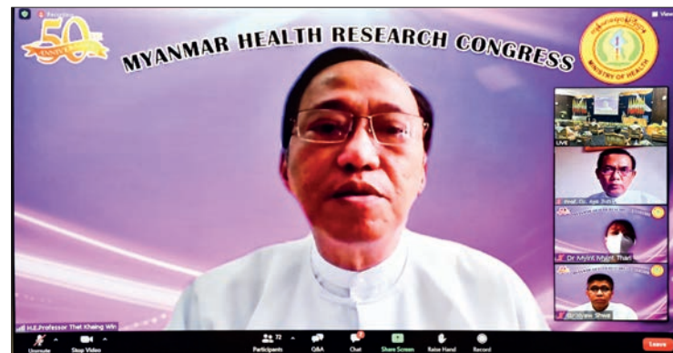
Union Minister Dr Thet Khaing Win.