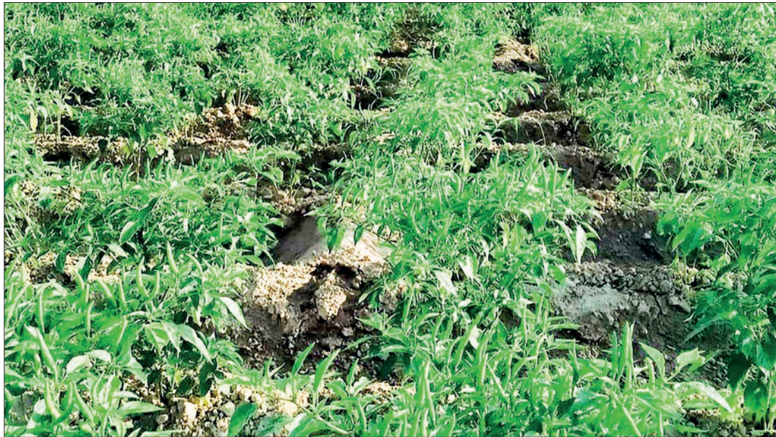
The chilli growers from NyaungU township are running their farming businesses using underground water and hope to fetch better prices. This year, the chilli plantation is being grown successfully and yielded abundantly.

“The chilli growers from NyaungU township grow two