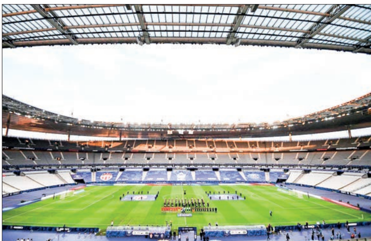
The Stade de France has hosted the Champions League final twice before, most recently in 2006.

“Together with the French government, UEFA will fully support multi-stakeholder efforts to ensure the provision of rescue for football players and their families in Ukraine who face dire human suffering, destruction and displacement.” The final was supposed to be played at the Gazprom Arena in Saint Petersburg, which already hosted several matches at last year’s European Championship and at the 2018 World Cup held in Russia. UEFA made no reference to its relationship with Gazprom, the Russian state energy giant that is a key sponsor of European football’s governing body.— AFP ■