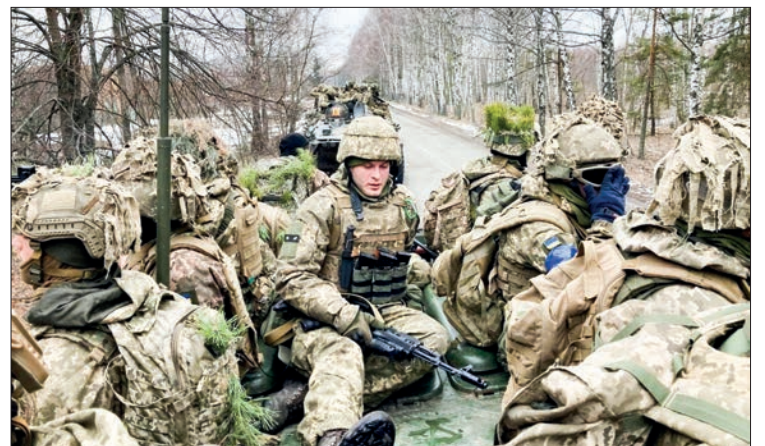
Service members of the Ukrainian Air Assault Forces take part in tactical drills at a training ground in an unknown location in Ukraine, in this handout picture released 18 February 2022.

Ukraine’s border guards said Thursday their country was coming under artillery attack along its northern border with Russia and Belarus. Minsk said Putin called Lukashenko in the early hours of Thursday — “at around 5:00 am (0200 GMT) —