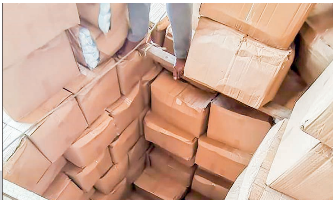
Packages of anti-Covid medical supplies are seen to transport them to where necessary.

It is reported that the Ministry of Commerce is coordinating with relevant departments and treatment of COVID-19 as well as contact persons for inquiries can be reached through the Ministry's Website —www.commerce.gov.mm. — MNA