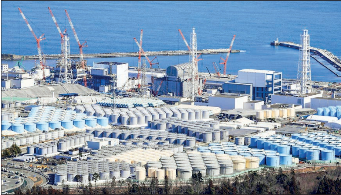
The picture shows the Fukushima Nuclear Power Plant. More than a million tonnes of liquid has accumulated in tanks at the crippled Fukushima plant.

THE International Atomic Energy Agency said Friday it made “significant progress” on its first mission to review the planned