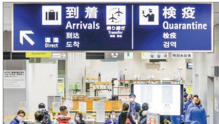
Japan will ease COVID-19 border controls starting from March by raising the daily entry cap and reducing the quarantine period from seven days to three for both Japanese and foreign nationals.

Upon arrival in Japan, travellers will be asked to quarantine for three days and the period will end after they test negative for COVID-19.