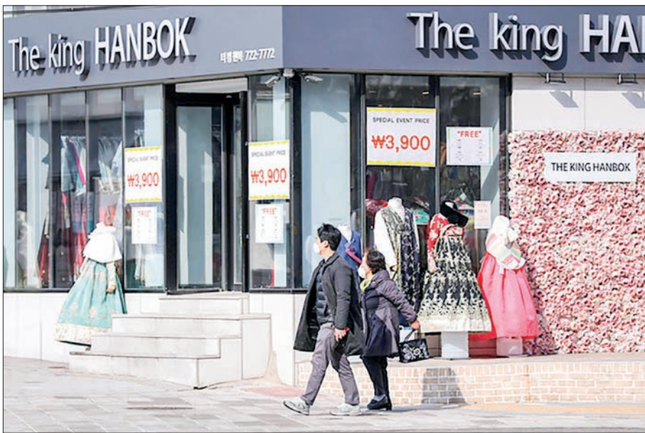
Revenue among department stores and discount outlets gained in double figures last month. People walk past a clothes shop in Seoul, South Korea, 26 February 2020.

In the latest tally, the country reported a record daily high of 109,831 COVID-19 cases for the past 24 hours, raising the total number of infections to