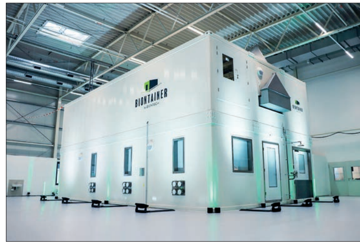
BioNTech is looking to have its first BioNTainer in Africa during the second half of 2022.

GERMANY'S BioNTech, which together with Pfizer developed the first mRNA vaccine against the coronavirus, said Wednesday it plans to ship mobile vaccine production units to Africa.