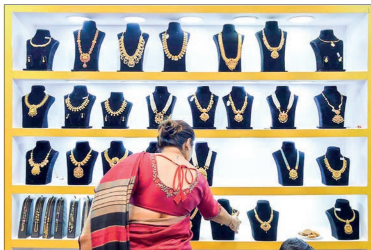
A senior Indian official said Friday that the gems and jewellery sector is expected to achieve an export target of 40 billion US dollars this year.

A senior Indian official said Friday that the gems and jewellery sector is expected to achieve an export target of 40 billion US dollars this year.