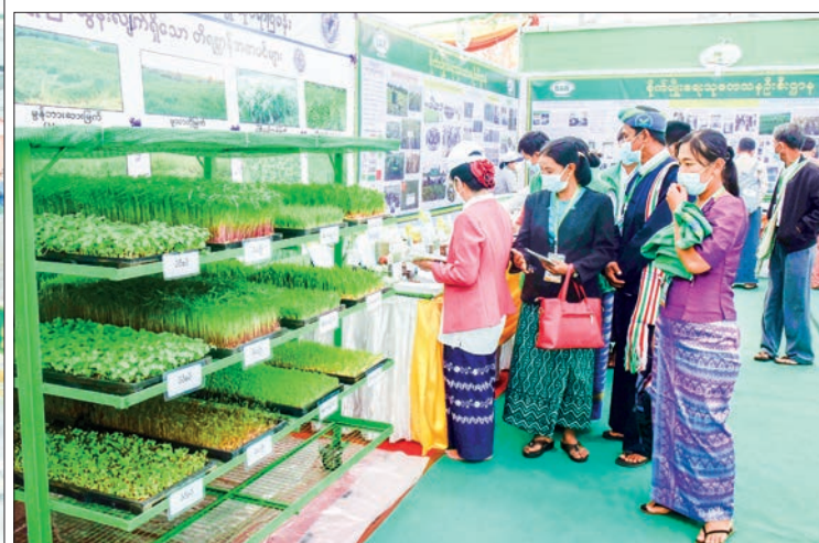
People throng at the Seed Fair 2022 on the second day.