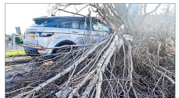
A car damaged by a fallen tree is pictured in Southwick, southern England, on 18 February, 2022.

They say a global database of the booms, whistles and chatter of the sea will help to monitor diversity in aquatic life – and help put a name to mystery sounds like the one Di Iorio and her colleagues investigated.—AFP ■