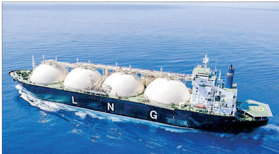
Global supply was tight because of high Asian demand for LNG and lower-than-normal Russia gas pipeline flows.

LEADING gas producers meet in Qatar from Sunday to discuss how to answer frantic world demand, but Russian President Vladimir Putin is expected to stay away as Ukraine tensions