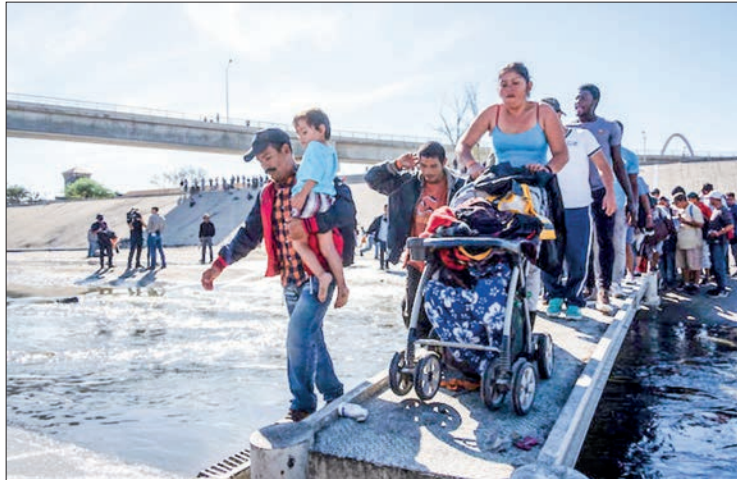
Migrants make their way across the almost-dry riverbed of the Tijuana River on their way to the El Chaparral port of entry to the US in Tijuana, Mexico, on 25 November 2018.

Those efforts have faced setbacks in the US court sys-