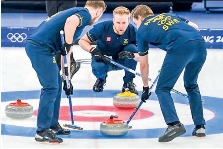
Sweden beat Team GB in the final of the men's curling.

BRITAIN were denied their first gold medal of the Beijing Winter Olympics when their men's curling team were pipped 5-4 by Sweden in the final on Saturday.