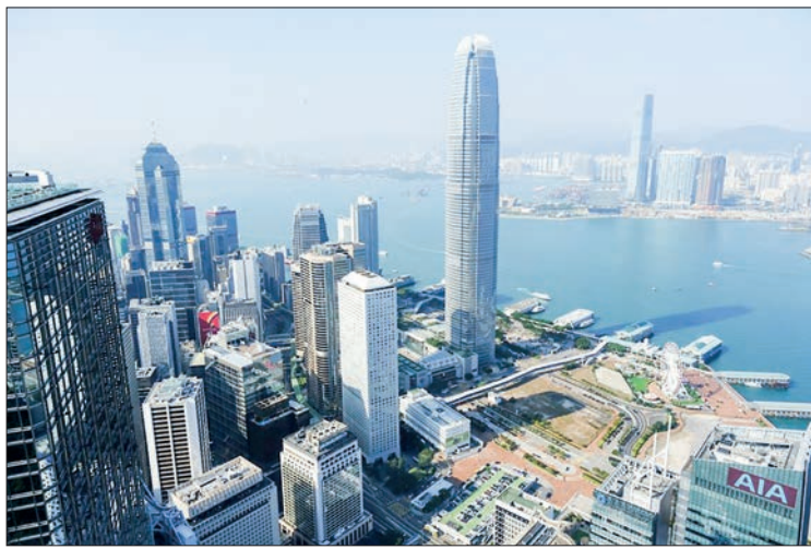
Photo taken on 24 November 2021 shows a view of Hong Kong, south China.

HONG KONG said on Friday it would postpone picking the city's new leader and was preparing to test the entire population for COVID-19 as it struggles to tackle a wave of infections.