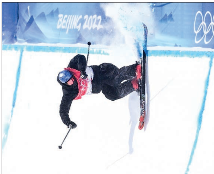
New Zealand's Nico Porteous won gold in Beijing.

"It made me put my head down and do everything I could for this moment."