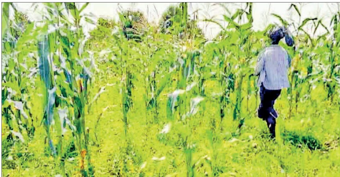
Pwintphyu township is one of the most irrigation water areas out of 25 townships of the Magway region. The local people are mainly engaging the agriculture business using the Maezali dam.

PWINPHYU township agriculture department has grown about 66,664 acres of edible oil crops and kitchen crops in 2021-22 financial year during the winter planting season, according to the official statistics of the Pwintphyu Township Agriculture Department.