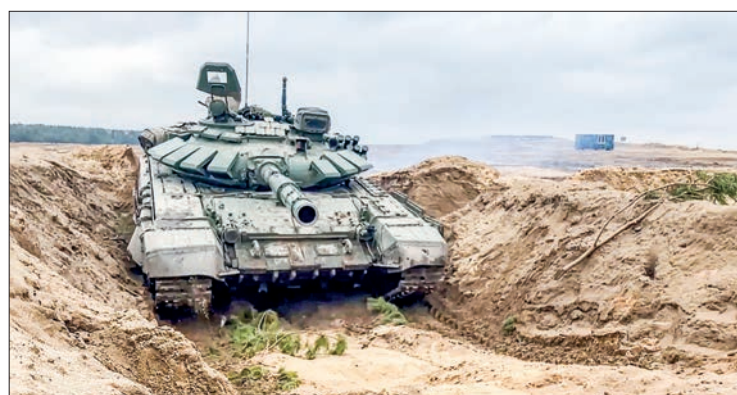
File photo shows a tank during joint exercises of the armed forces of Russia and Belarus as part of an inspection of the Union State's Response Force, at a firing range near Brest.

US President Joe Biden said that the invasion would come in the next week or days and that his Russian counterpart President Vladimir Putin had "made the decision" to invade. But Biden left the door open for a diplomatic resolution. — AFP ■