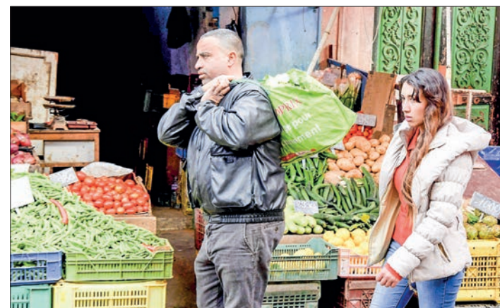
Tunisians shop at Halfaouine market near central Tunis on 15 February 2022. The Tunisian economy is plagued by recession, inflation and high unemployment.

Such a deal would likely mean cuts to subsidies and public sector wages, which many fear would spell more suffering for the most vulnerable. That could fuel the same kind of grievances that sparked a revolution a decade ago and brought down autocrat Zine El Abidine Ben Ali after 23 years in power.—AFP ■