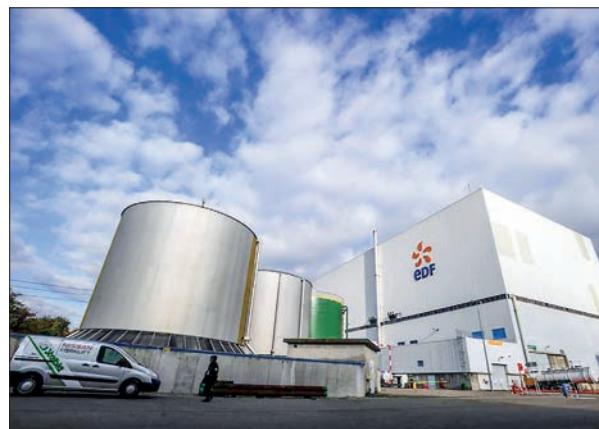
EDF's Fessenheim nuclear power plant in eastern France.

announced plans to build as many as 14 new next-generation EPR2 reactors to reduce the country's reliance on fossil fuels, which EDF has said could cost some 50 billion euros.—AFP ■