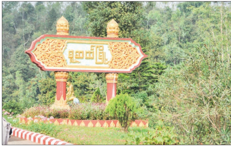
The Muse border post witnessed $4.057 billion worth of the Sino-Myanmar border trade last financial year 2020-2021, including exports worth $2.9 billion and imports worth $1.15 billion.

At present, the traders are anticipated for the resumption of the Kyalgaung post which performed the largest trade volume