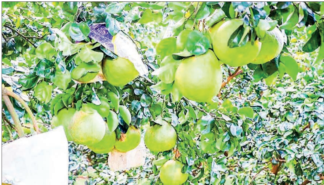
There are approximately 15,000 acres of pomelo acreage across the states and regions.

The pomelos both in organic and conventional farm-