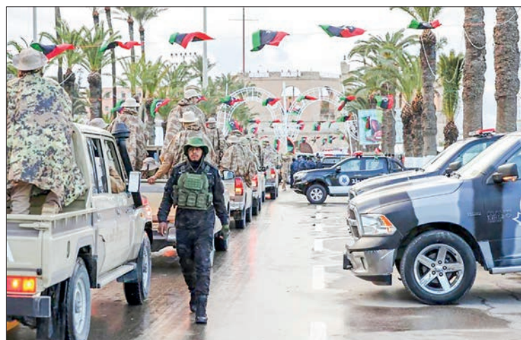
Libya's security forces parade at the Martyrs' Square in the capital Tripoli.

A court official said the judges in a unanimous decision exonerated the suspects and released them without calling defence witnesses. The attacks, blamed on a homegrown Islamic extremist group, targeted three churches and three hotels in the capital and killed 279 people, including 45 foreigners, leaving more than 500 wounded.—AFP ■