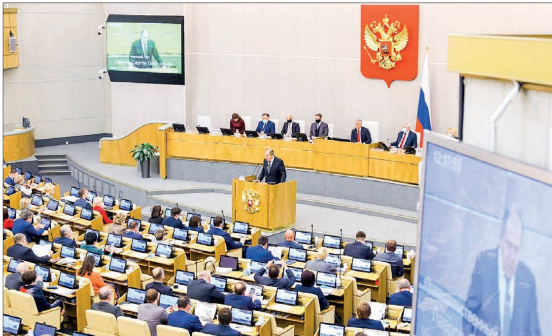
Russia's parliament wants President Vladimir Putin to recognize the independence of self-proclaimed 'republics' in Ukraine's industrial east.

Kyiv has been battling pro-Russia separatists in its eastern regions since 2014 in a conflict that has claimed around 14,000 lives.