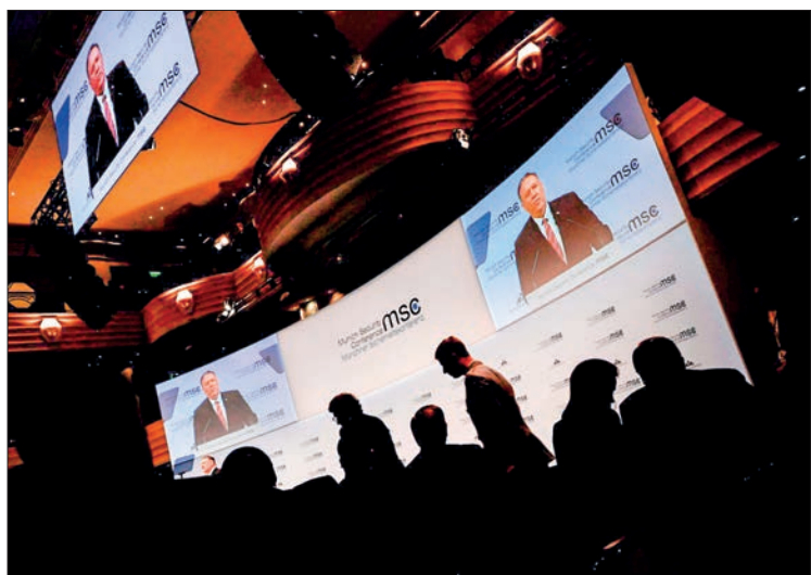
Western leaders discuss Ukraine.

THE 58th edition of the Munich Security Conference (MSC) opened here on Friday afternoon with a theme focusing on "unlearning helplessness" against the backdrop of tensions in the Ukraine crisis, reported Xinhua.