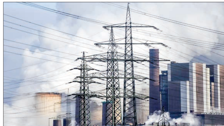
Electricity pylons are seen in front of the cooling towers of the coal-fired power station of German energy giant RWE in Weisweiler, western Germany, on 26 January 2021.

Meanwhile, emissions trading, as proposed by the European Commission for the buildings and transport sectors, should be supported to ensure that its scope is