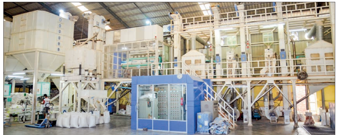
From 1 October to 31 January in this financial year, the country exported over 1 million tonnes of rice and low-quality rice. Of which, China is becoming a large net importer of Myanmar rice, according to the Myanmar Rice Federation.

From 1 October to 31 January in this financial year, the country exported over 1 million tonnes of rice and low-quality rice. Of which, China is becoming a large net importer of Myanmar rice, according to the Myanmar Rice Federation.