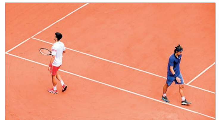
Djokovic (left) was two sets down to Musetti at last year's French Open.

Djokovic went on to seal the title at Roland Garros for his 19th Grand Slam, with his 20th secured at Wimbledon the following month. The 34-year-old has kept a low profile since his deportation from Australia last month over his refusal to get jabbed.—AFP ■