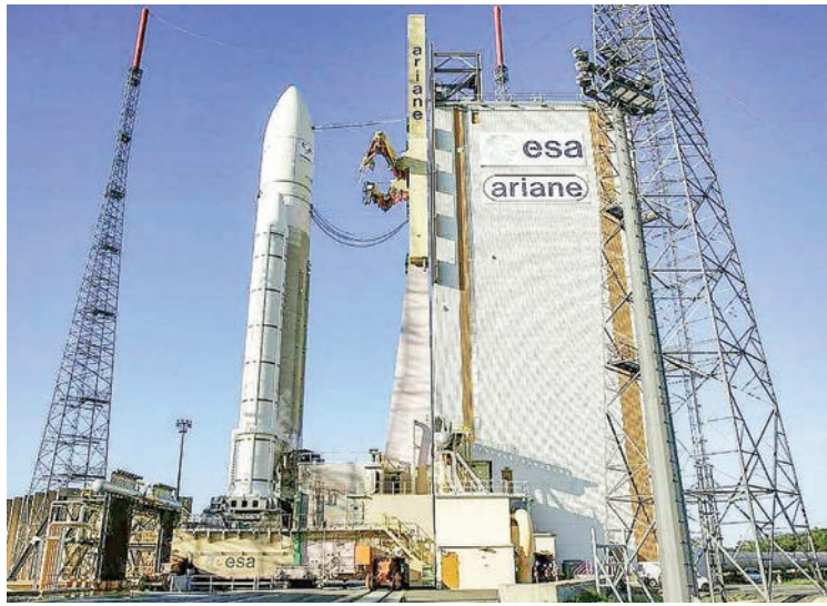
The European Ariane 5 rocket stands on the launch pad at the Guiana Space Center in Kourou, French Guiana, 11 August 2005.

A Russian scientist accused of spying for Moscow while working at a German university goes on trial Thursday, another source of friction in already frayed ties between the two countries.