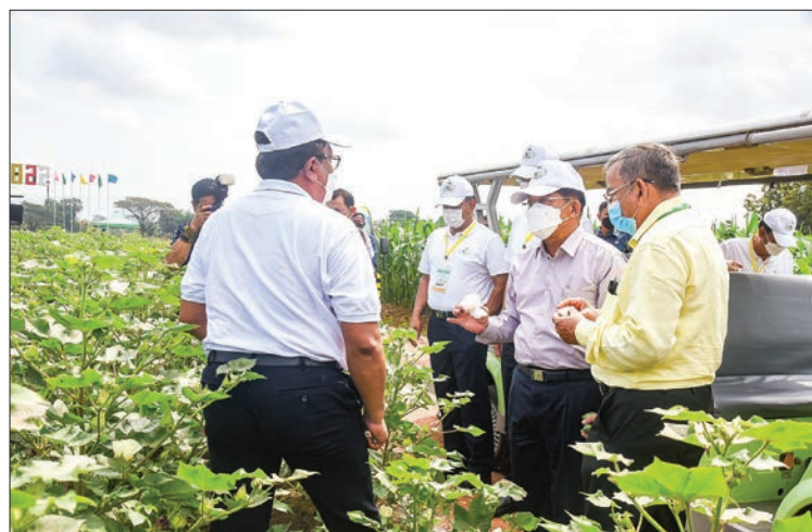
The Senior General pays an observation tour around the farms of the Institute of Agriculture in Pyinmana of Nay Pyi Taw Council Area on 18 February 2022.

and pulses and beans on 4,552 acres of seed production farms and 8,048 acres of paddy to produce quality seeds. The Senior General urged all to increase investments from the government and the private sector in these sectors in coming years.