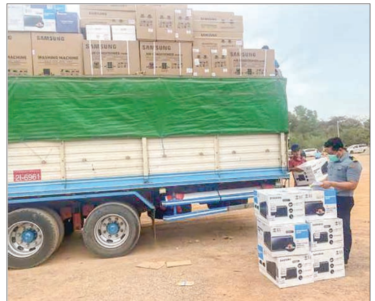
Confiscated consumer goods.

Thus, a total of 11 arrests (estimated value of K40,672,060) were made on 16, 17 and 18 February and actions were taken under the Forest Law, Customs Law and Export and Import Law, the committee stated. — MNA