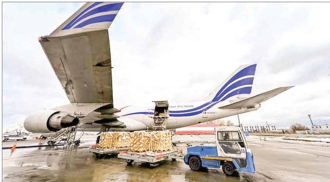
Transport planes crammed with huge heavy crates. Inside the crates are weapons and ammunition that the US and UK are sending to Ukraine.

The two leaders agreed to continue dialogue over the Ukraine crisis and toward reaching a postwar peace treaty between Japan and Russia, Kishida said. Japan and Russia remain at loggerheads over the ownership of a group of islets off Hokkaido.—Kyodo ■