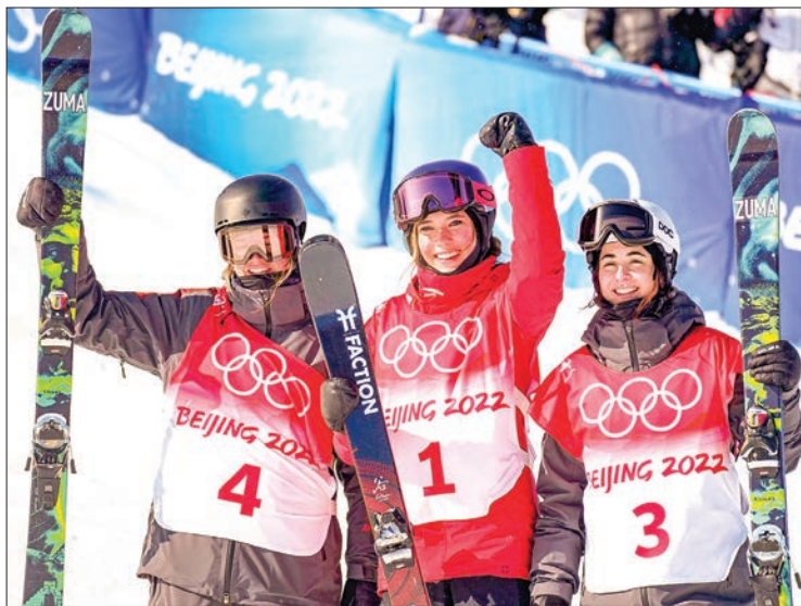
Chinese athlete Gu Ailing (C), Canadian athletes Cassie Sharpe (L) and Rachael Karker celebrate after the freestyle skiing women's freeski halfpipe final of Beijing 2022 Winter Olympics at Genting Snow Park in Zhangjiakou, north China's Hebei Province, 18 February 2022.

nadian skier Cassie Sharpe took the silver with her stable performances. Her best score was 90.75 in her third run and the worst was 89.00 in her first run.