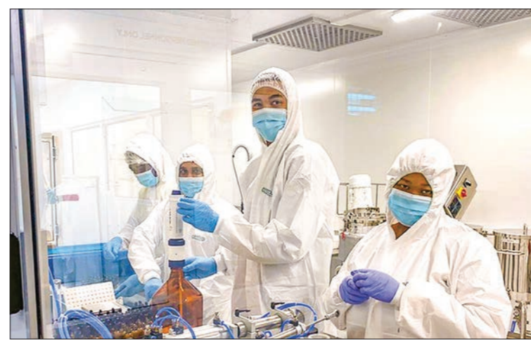
Researchers at WHO technology-transfer hub complete first step in a project aimed at building capacity for vaccine manufacturing in low- and middle-income countries. Researchers at Afrigen Biologics and Vaccines in Cape Town are attempting to replicate Moderna's vaccine.