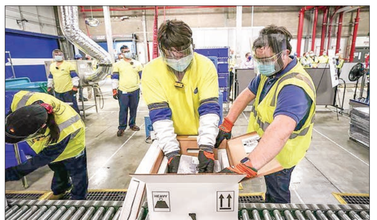
The shipments of the vaccine rolled out of a factory in Michigan.

"Our vaccination rates, as well as booster use, in people aged 60- or 65-plus are woefully low and expose a tremendous amount of vulnerability to severe disease, hospitalizations, and deaths," Eric Topol, director of the Scripps Research Translational Institute, told reporters.—Xinhua ■