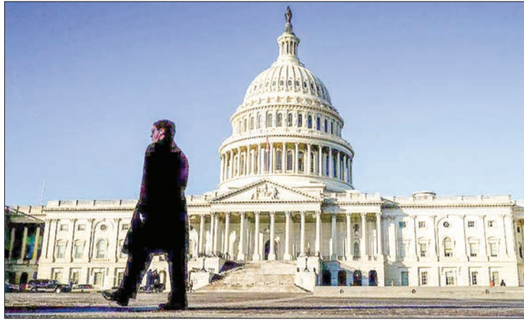
The United States Congress.

THE US Senate passed a stop-gap funding bill Thursday, after threats by some Republicans earlier in the week risked a damaging government shutdown.