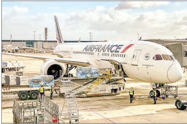
In this 19 November 2020 photo, an Air France Boeing 787-9 Dreamliner prepares to depart from Charles De Gaulle International Airport (CDG).

Omicron also led to a spate of flight cancellations through January after a better than expected 4th quarter showing which brought operating profits of 178 million euros for that period — better than the corresponding period of 2019 before the health crisis hit.—AFP ■