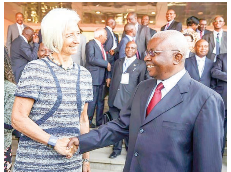
Before the storm: The then head of the IMF, Christine Lagarde, is greeted by Guebuza in Maputo in May 2014.

The 79-year-old former leader, who will be the most