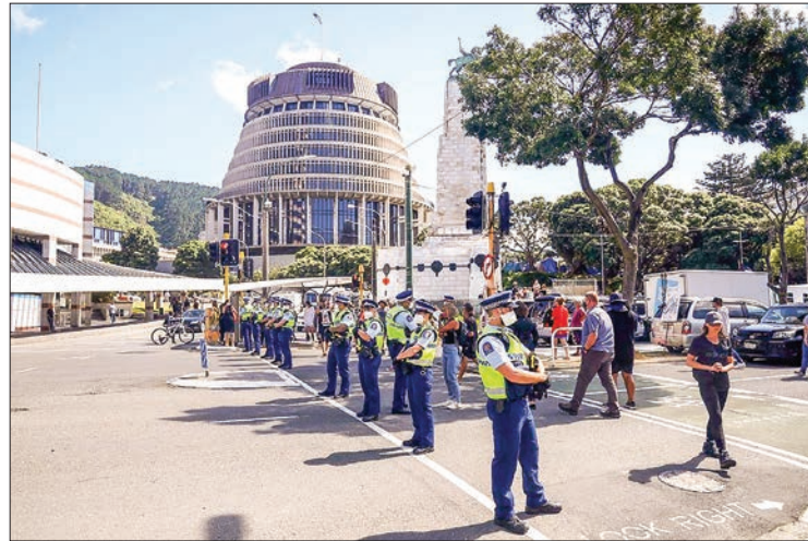
Police take over an intersection leading to Parliament on the ninth day of demonstrations against Covid-19 restrictions in Wellington on 16 February 2022, inspired by a similar demonstration in Canada. PHOTO:

shelters, and organized portable toilets, food distribution points and childcare facilities.