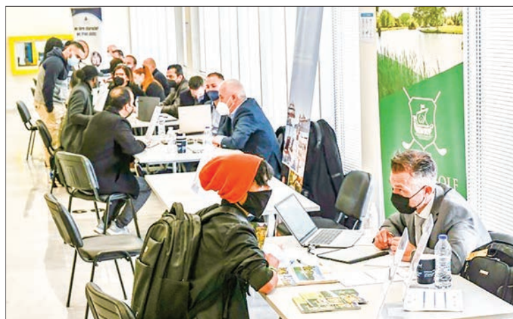
In Greece, obtaining asylum means having to confront a whole new set of challenges PHOTO: AFP

Starting in 2019, the conservative government began phasing out accommodation and financial assistance for people with asylum status, arguing that such benefits only encouraged further migration.—AFP ■