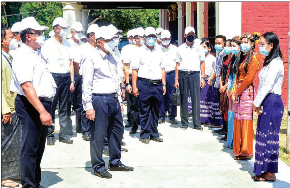
The Senior General warmly greets faculty members and students of the Institute.

socio-economic life of the State with high production using quality seeds in the agricultural sector. The fair displays paddy, pulses and beans, edible crops, vegetables, fruits, seeds, saplings and farms. Local people can view the fair through www.myanmarseedportal.gov.mm . The fair will last for five days.