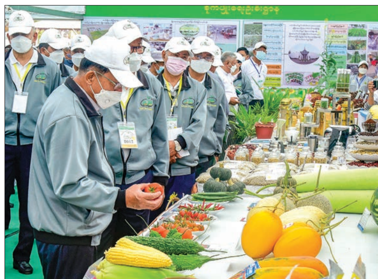
The Senior General observes farm products.