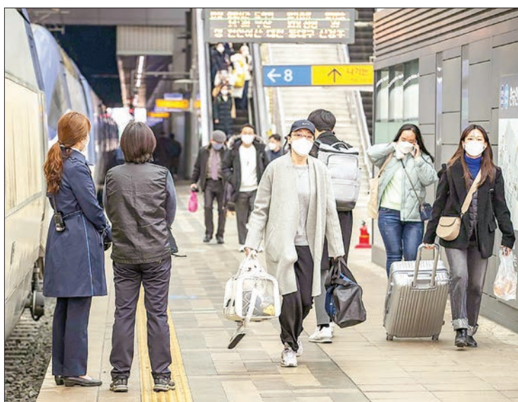
People wearing face masks prepare to board their train at Seoul Station in Seoul, South Korea, 10 February 2021.

THE crisis in Ukraine is a serious threat to the global economy's post-pandemic recovery, Indonesia's leader on Thursday warned a meeting of finance chiefs from the G20 nations.