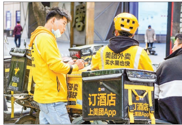
Food delivery giant Meituan has hundreds of millions of customers in China.

SHARES of Chinese food delivery giant Meituan slumped Friday as Beijing released new guidelines instructing internet platforms to lower fees for struggling eateries.