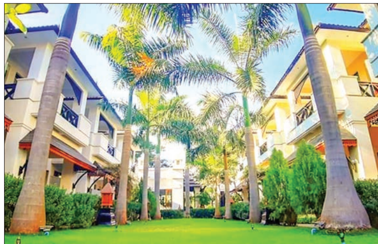
Authorities have issued hotel licences to 59 hotels, motels and lodges and 45 of them are currently operating in the Sagaing region.

So far, some hotels and motels are completed about 90 per cent while some are done 50 and 80 per cent. — Lu Lay/GNLM