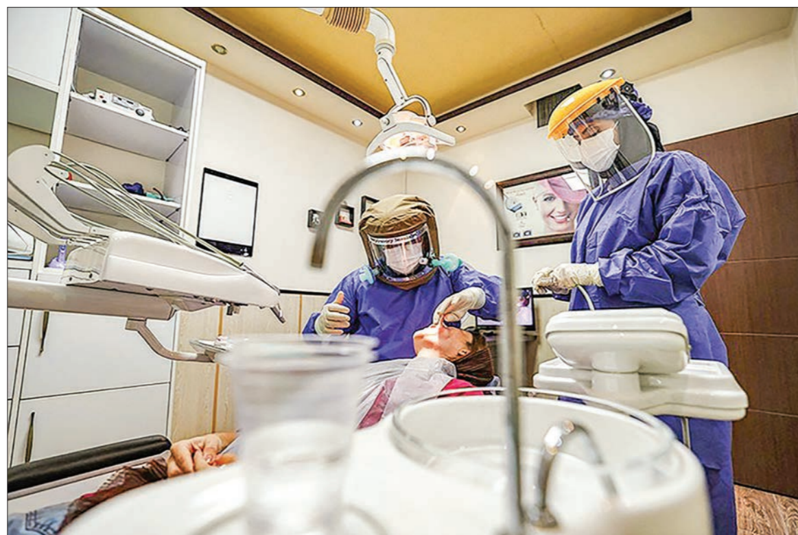
Research conducted since the start of the pandemic is starting to suggest that the mouth could be a key player in COVID-19 infection. A dentist and an assistant in Iran work in full personal protective equipment to treat a patient during the COVID-19 pandemic.

The publications were selected out of an original pool of 712 publications screened by Monell's research team, an unprecedented