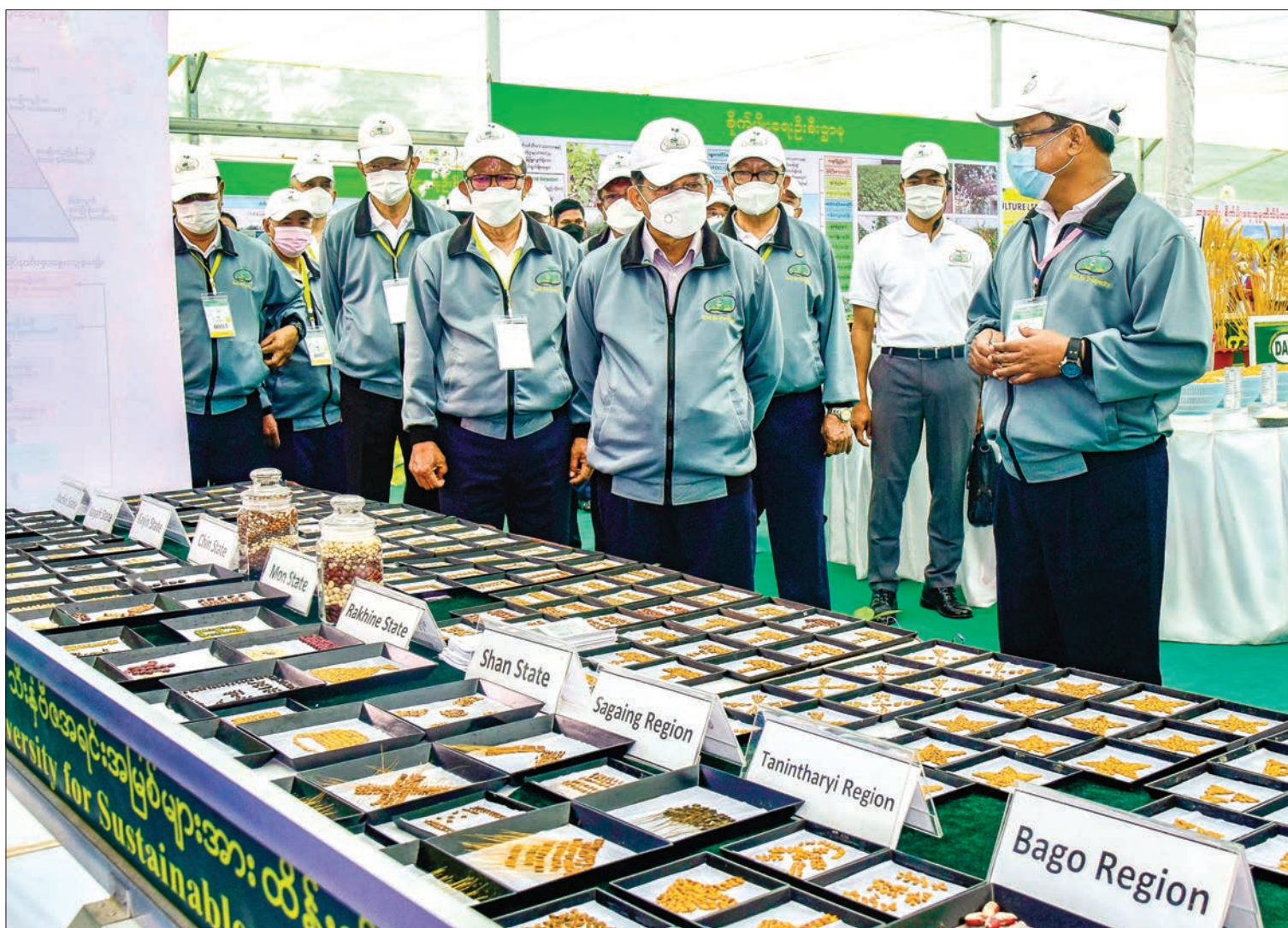
State Administration Council Chairman Prime Minister Senior General Min Aung Hlaing views around the display at the Seed Fair in Pynmana of Nay Pyi Taw Council Area on 18 February 2022.