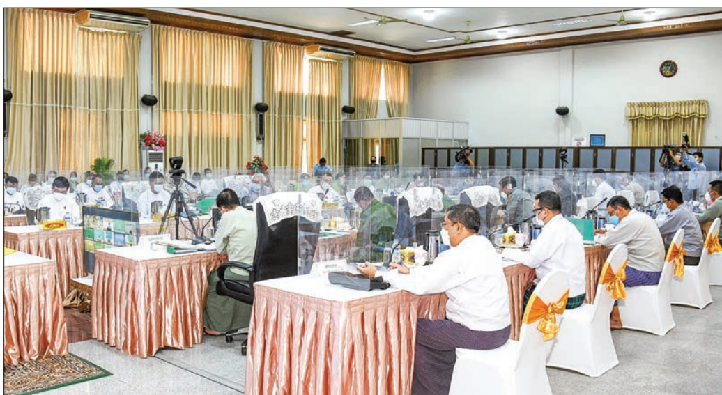
State Administration Council Vice-Chairman Deputy Prime Minister Vice-Senior General Soe Win chairs the Illegal Trade Eradication Steering Committee meeting 1/2022 in Nay Pyi Taw on 18 February 2022.

for national security and health. In addition to the storage at airports, ports and border trade points, main storage and distribution in the cities where the markets are located must be identified and inspected to take effective action against illegal trades under the law, the Vice-Senior General said.