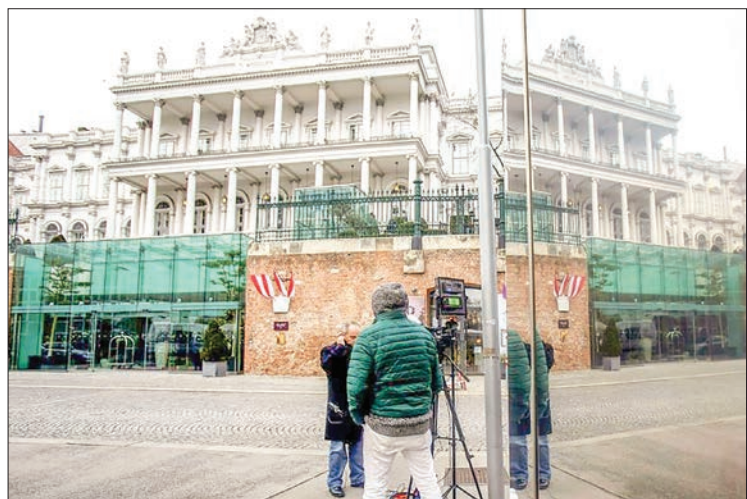
Negotiations to save the Iran nuclear deal are taking place in Vienna's Hotel Palais Coburg, pictured in December 2021.

THE United States said Thursday that “substantial progress” during negotiations in Vienna to save the Iran nuclear deal had been made, deeming an agreement possible within days if Iran “shows seriousness” on the matter.