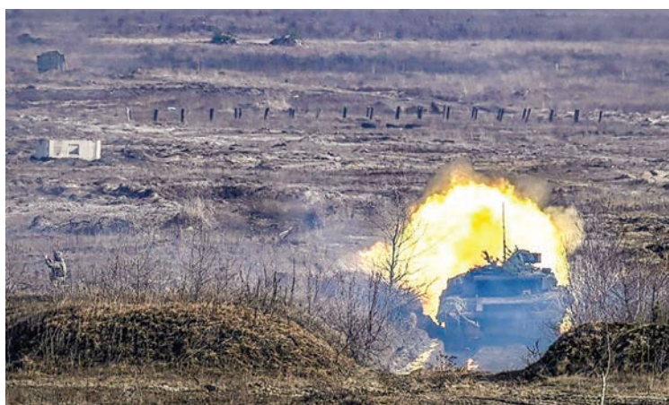
The Ukrainian army has carried out military drills amid fears of a Russian invasion.

RUSSIA on Thursday announced more troop pullbacks from the Ukrainian border as Washington insisted that Moscow is still building up forces for a potential invasion of its pro-Western neighbour.