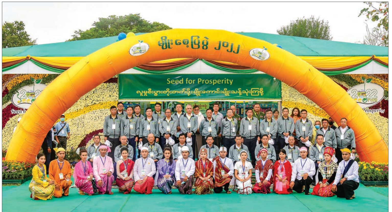
The Senior General and attendees pose for the documentary photo at the Seed Fair 2022 in Pyinmana on 18 February 2022.

Within one year period when the State Administration Council took the State responsibilities, Magway, Mandalay and Sagaing regions and Nay Pyi Taw cultivated edible oil crops