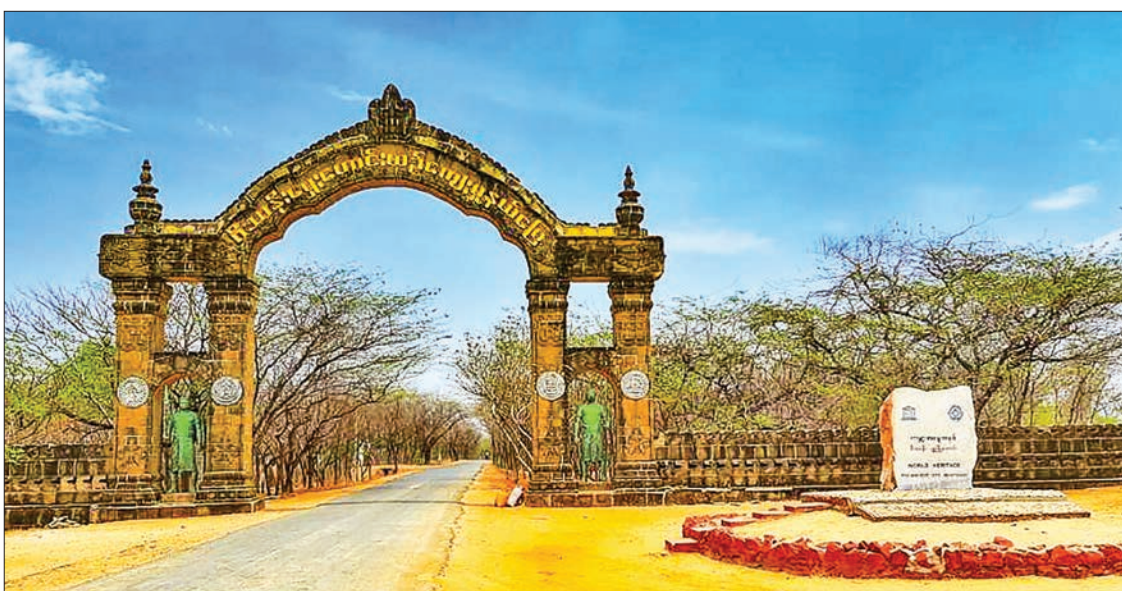
Beikthano -- one of UNESCO's List of World Heritage Sites in Southeast Asia.

THOSE enthusiasts who want to explore the history and heritage