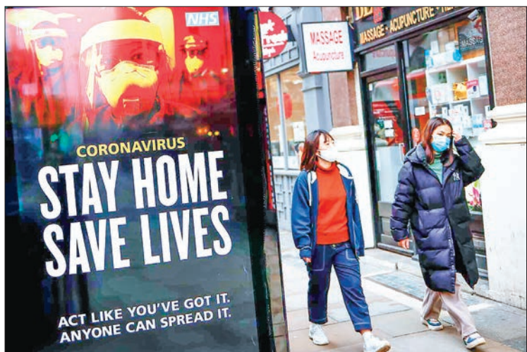
Across London, everyone is working hard to stop the spread of coronavirus.

ALL children aged five to 11 in England will be offered a COVID-19 vaccine, the UK government said Wednesday, following similar announcements in the rest of the UK.