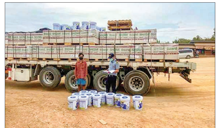
Seized consumer goods.

Next, a combined inspection team of Kayin State conducted a search operation at the Tadakyoe Joint Checkpoint in Kawkareik