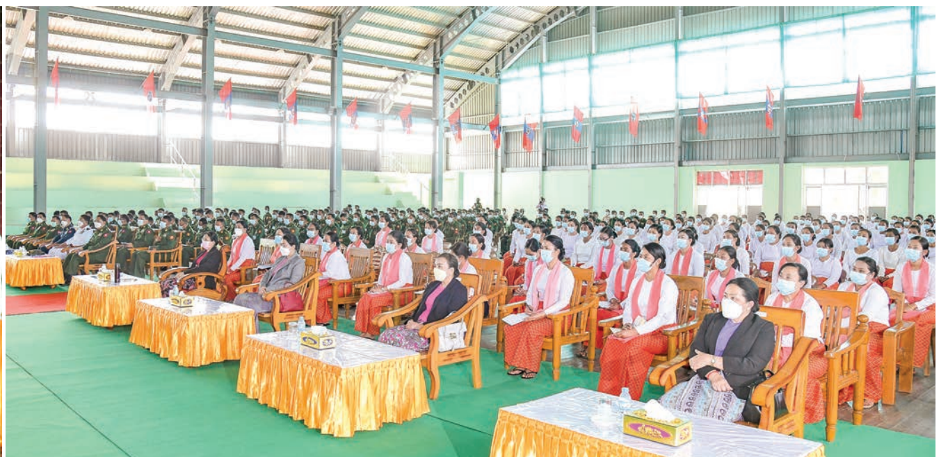
State Administration Council Chairman Commander-in-Chief of Defence Services Senior General Min Aung Hlaing meets the officers, other ranks and family members of the Kholan Station in southern Shan State on 17 February 2022.

FROM PAGE-1 occurrences in the 2020 election, and they are committing instigation between the Tatmadaw and the people. Since its establishment, the Tatmadaw has been protecting the State with prestige and so, the Tatmadaw does not accept these misunderstandings.