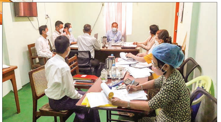
At the office of the People's Party.