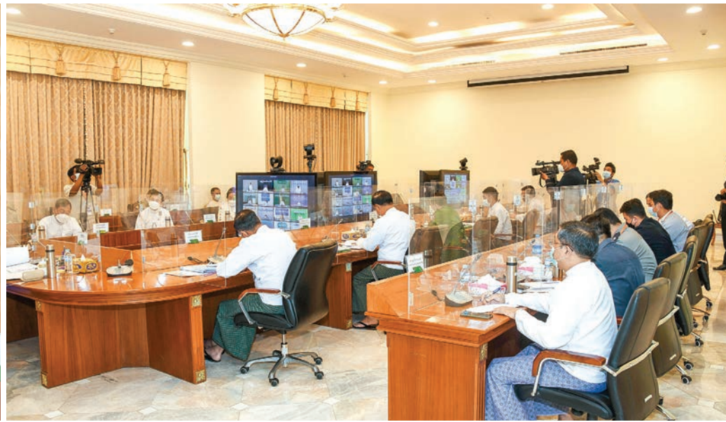
Vice-Chairman of the State Administration Council Deputy Prime Minister Vice-Senior General Soe Win addresses the coordination meeting of the COVID-19 Control and Emergency Response Committee yesterday in Nay Pyi Taw.

VICE-CHAIRMAN of the State Administration Council Deputy Prime Minister Vice-Senior General Soe Win, in his capacity as the Chairman of the COVID-19 Control and Emergency Response Committee, addressed the coordination meeting of the committee held yesterday afternoon at the office of the Chairman of the State Administration Council.