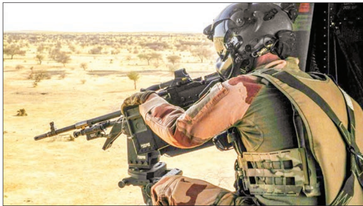
Of the 53 soldiers killed serving in France's Barkhane mission in West Africa, 48 of them died in Mali. A French soldier from the Barkhane mission in Africa's Sahel region, points a machine gun from a NH90 helicopter between Gao and Menaka, Mali, on 21 March 2019.

Macron is to travel to Brussels Thursday for a two-day EU-Africa summit. But the French presidency announced he would hold an 0800 GMT press conference at the Elysee on the “engagement of France in the Sahel”, where he is likely to make the formal announcement.