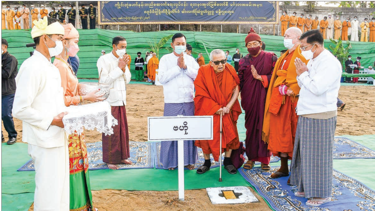
State Administration Council Chairman Prime Minister Senior General Min Aung Hlaing attends the ceremony to lay cornerstones for building the Kengtung Manor replica near Naungton Lake in Kengtung Township on 17 February 2022.

C HAIRMAN of the State Administration Council Prime Minister Senior General Min Aung Hlaing attended the ceremony to lay cornerstones for building Kengtung Manor replica near Naungton Lake in Kengtung yesterday.