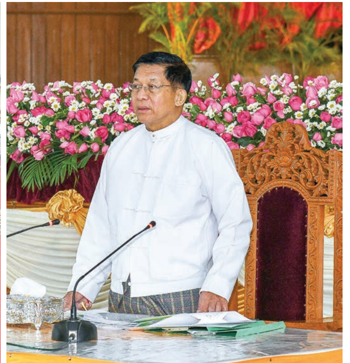
State Administration Council Chairman Prime Minister Senior General Min Aung Hlaing meets the departmental personnel and town elders in Kengtung Township on 17 February 2022.

KHOLAN, Namsang, Hopong, Aungban and Heho are plain regions with chances for operating agriculture and livestock farms, said Chairman of the State Administration Council Prime Minister Senior General Min Aung Hlaing in meeting with departmental officials from Kengtung and Mongpyin townships of Shan State (East), Namsang Township and Kholan of Loilem District in Shan State (South), town elders in respective townships separately yesterday.