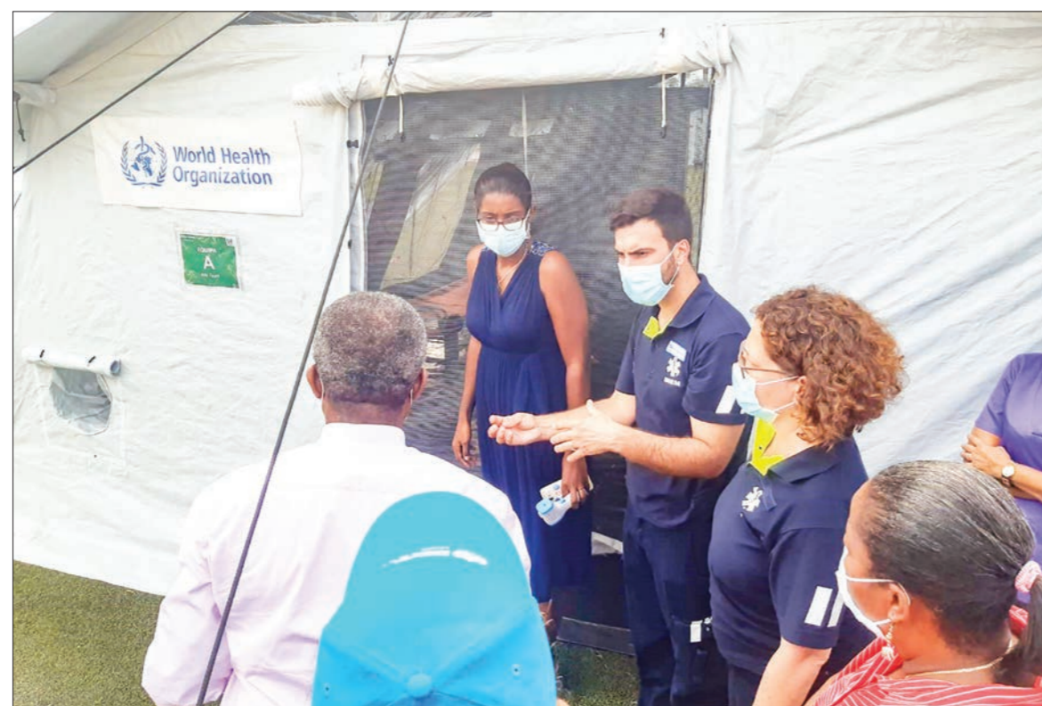
A team of WHO technical and health experts setting up a COVID-19 treatment centre in a football field in São Tomé and Príncipe, which was subsequently run by an Emergency Medical Team.