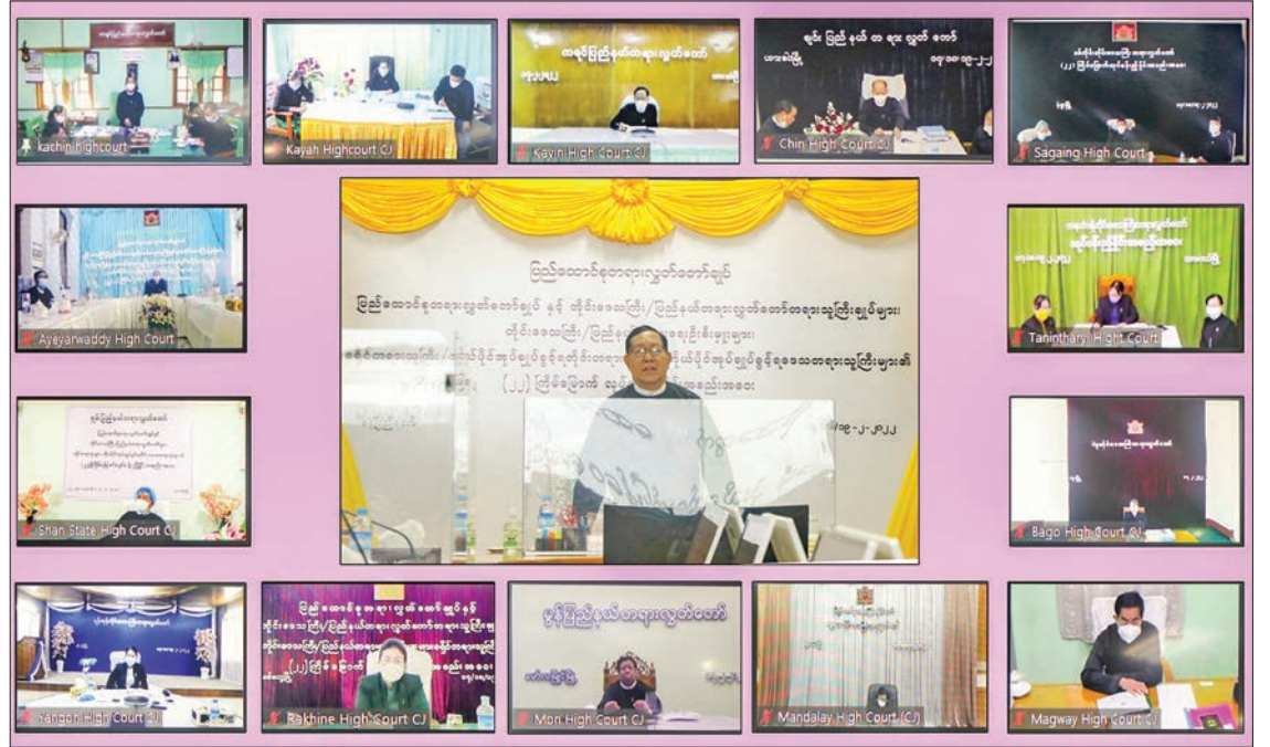
The Chief Justice of the Union Supreme Court gives the opening remark.

The Self-Administered Division, Self-Administered Zones and District Courts had 12,921 criminal cases and finished 13,545 cases (including 624 cases of last year) and also received 7,243 civil lawsuits and completed 6,350 cases.