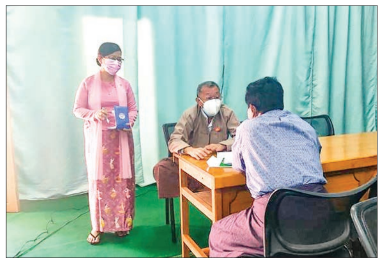
At the office of the Karen People's Party.

departmental representatives from the Internal Revenue Department and the Bureau of Special Investigation led by members of the Union Election Commission U Myint Oo and Daw Nu Mra Zan investigated the Yangon-based Karen People's Party, National Democratic Force, New National Democracy Party and the People's Party from 7 to 11 February 2022. — MNA