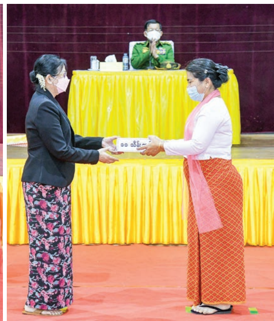
The wife of the Senior General presents cash assistance for the Maternal and Child Welfare Associations of the Kholan Station (left photo) and of the Mongpyin Station (right photo).

loving the nation, they have to take pride in these spirits for dutifully serving the assigned tasks. As the Tatmadaw is a family, all Tatmadaw members and families are to live together in unison. The Senior General then explained voting frauds in the 2020 multiparty democracy general election, social, economic and peace process of the democratic governments in their terms, and legally solving the terrorist acts based on political events.