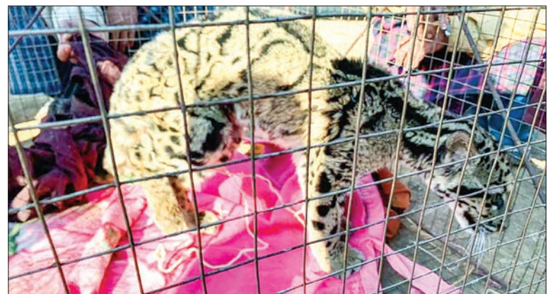
The tiger is kept and fed at the Thalika Farm of the Uruvela Tawya Monastery.