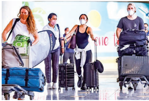
Bali has reopened to foreign tourists and welcomed its first international flight in two years on February 16.