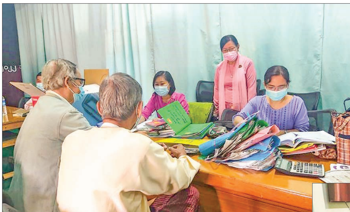
At the office of the National Democratic Force

THE Union Election Commission (UEC) is supervising the registration of political parties under Section 10 (1) of the Union Election Commission Law.