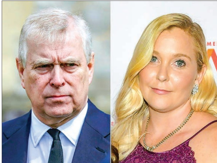
Virginia Giuffre’s lawyer said she and Prince Andrew had ‘reached an out-of-court settlement’, without revealing the financial terms.

DISGRACED British royal Prince Andrew faced a call Wednesday to “live out his retirement in ignominy” after reportedly settling a sexual assault lawsuit for a whopping £12 million ($16.3 million, 14.3 million euros).