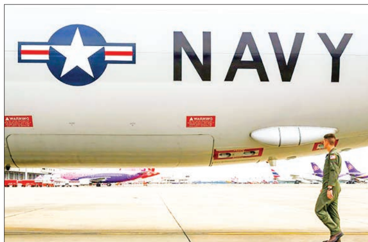
The Pentagon said Russian planes intercepted three US Navy P-8A aircraft over the Mediterranean in an ‘unprofessional’ manner.

“The US will continue to operate safely, professionally and