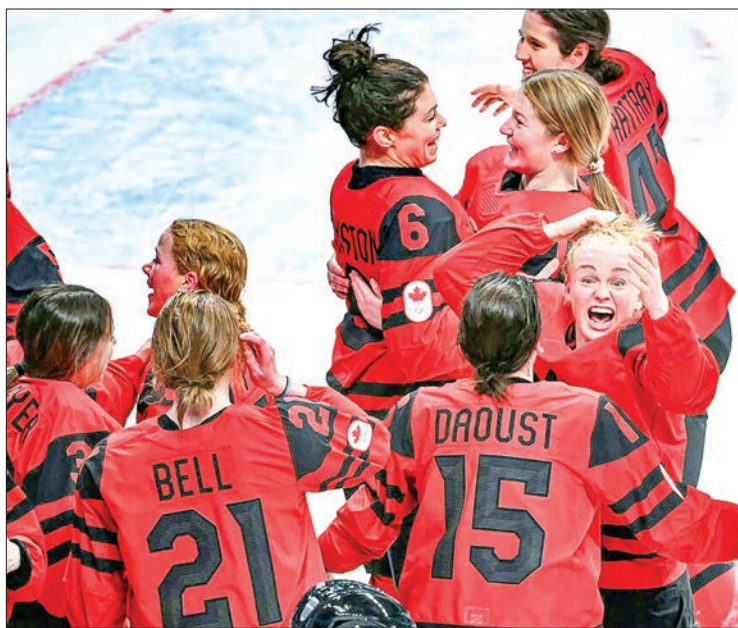
Canada beat old rivals the US for gold.

No other country has won women’s ice hockey gold in the seven Olympic Games since the event debuted in Nagano in 1998. Canada have won five of those and the US two.