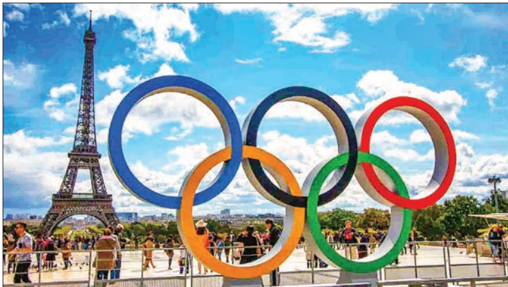
The Olympic Rings are placed in front of the Eiffel Tower in celebration of Paris winning to host the 2024 summer Olympic Games, 14 September 2017.

PARIS is determined to hold the 2024 Olympic Games in some ways never tried before, Tony Estanguet, head of the Paris 2024 organizing committee, told Xinhua in an interview.