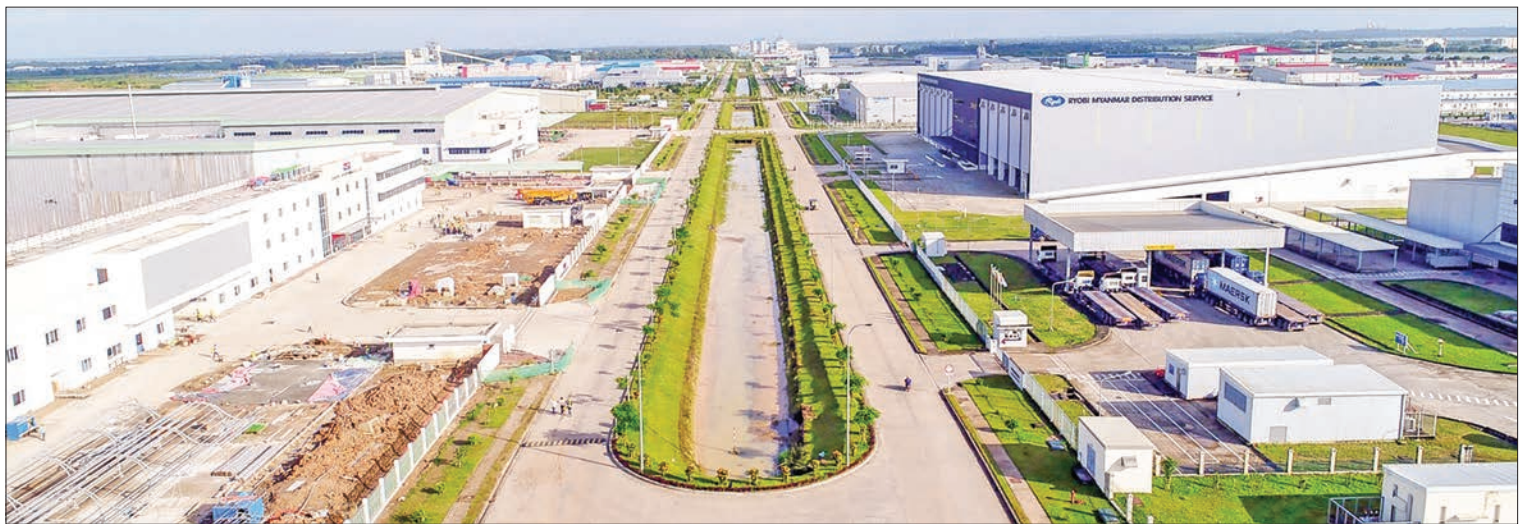
The businesses are primarily operating in Thilawa Zone A, and the development activities in Zone B is underway.

Myanmar is currently implementing three Special Economic Zones — Thilawa, Kyaukpju, and Dawei. Out of the three, Thilawa is leading with better infrastructure and successful businesses. More than 60 per cent of businesses in Thilawa is domestic-oriented manufacturing enterprises, while 40 per cent are