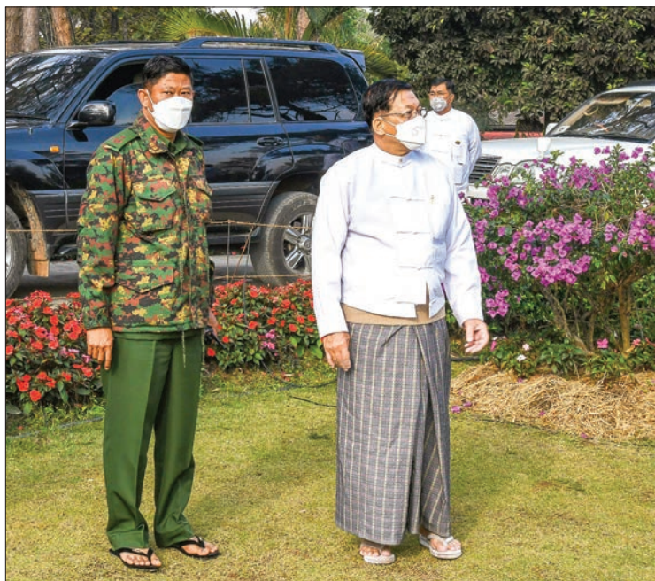
The Senior General views around the Thittabin Taung garden where the resin tree (right picture) was planted in the reins of King Alaungphaya in 1753.

The construction of the Kengtung Manor replica begun following the wishes of the relatives of Kengtung Saopha Sao Kawng Kiao Intaleng and locals. Moreover, the Mongpun Manor of