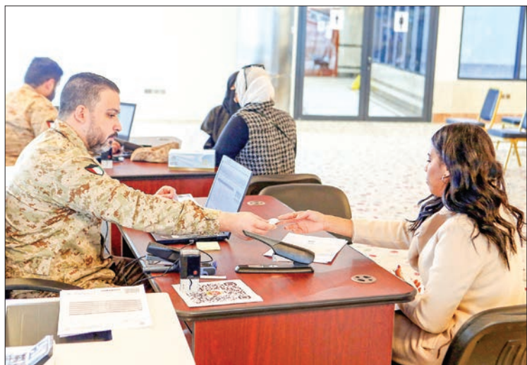
Kuwait's military decided women need the permission of a male guardian to enlist and are banned from carrying weapons.

KUWAITI women are angry after the military, having allowed