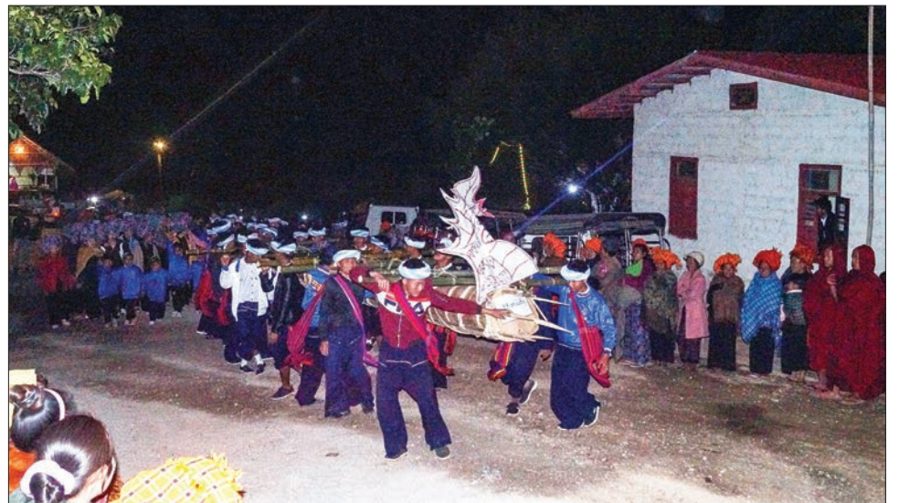
The Pa-O traditional lighting ceremony was held on the full moon of Tabodwe in the Pa-O Self-Administered Zone in southern Shan State.

THE Pa-O traditional lighting ceremony was held on the full moon of Tabodwe in the Pa-O Self-Administered Zone in southern Shan State.