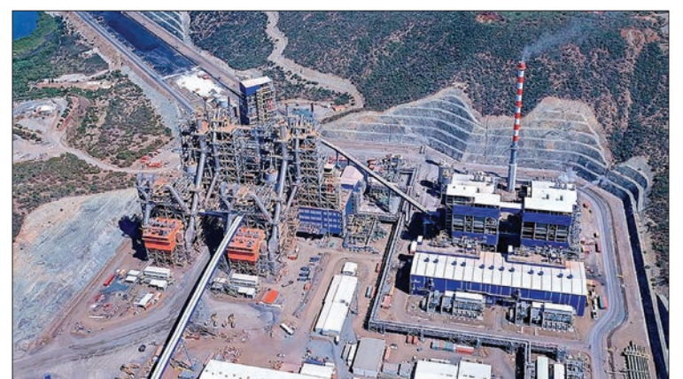
An aerial view taken on 22 September 2015 in Voh, in North Province, New Caledonia shows the Koniambo Nickel SAS (KNS) metallurgical plant belonging to Glencore and Societe miniere du Sud Pacifique.

Northern Territory Heritage Minister Chansey Paech on Tuesday rejected Glencore’s application to overturn a decision by