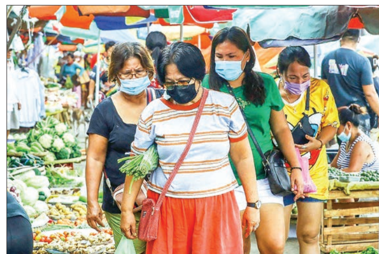
People at a market in Quezon city, Manila.

THE Philippines is now at “low risk” from the coronavirus pandemic as more people get vaccinated and hospital admissions drop, President Rodrigo Duterte’s spokesman said Tuesday. The country last week reopened to foreign tourists for the first time in two years, though some health restrictions remain as campaigning for the 9 May