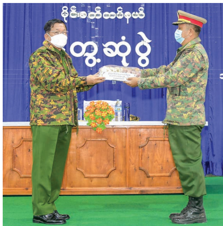
The Senior General presents foodstuffs for Tatmadaw members and families of the Mongyawng Station (Left photo) and for Tatmadaw members and families of the Mongkhat Station (Right photo).