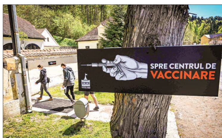
A vaccination centre at the vaccination marathon at Bran Castle, Romania. PHOTO: DANIEL MIHAILESCU /AFP

The virus has infected more than 3.6 million people and killed more than 55,000, according to government data.—AFP ■