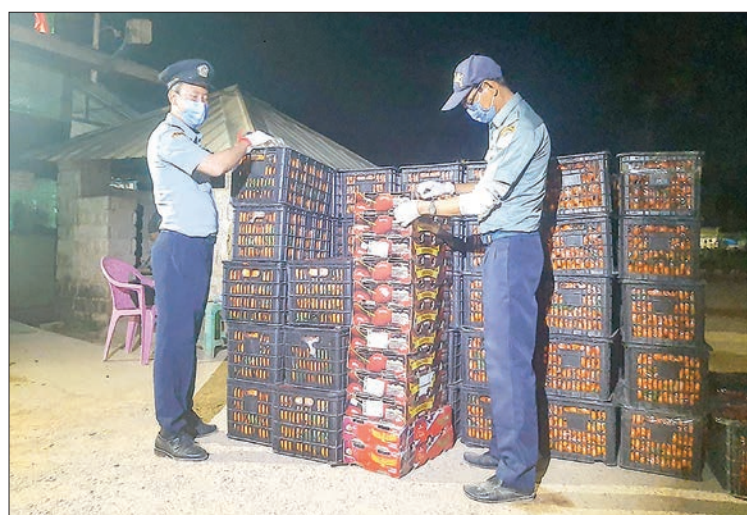
Seized illegal consumer goods.

SUPERVISED by the Anti-Illegal Trade Steering Committee, effective action is being taken to prevent illegal trade under the law.