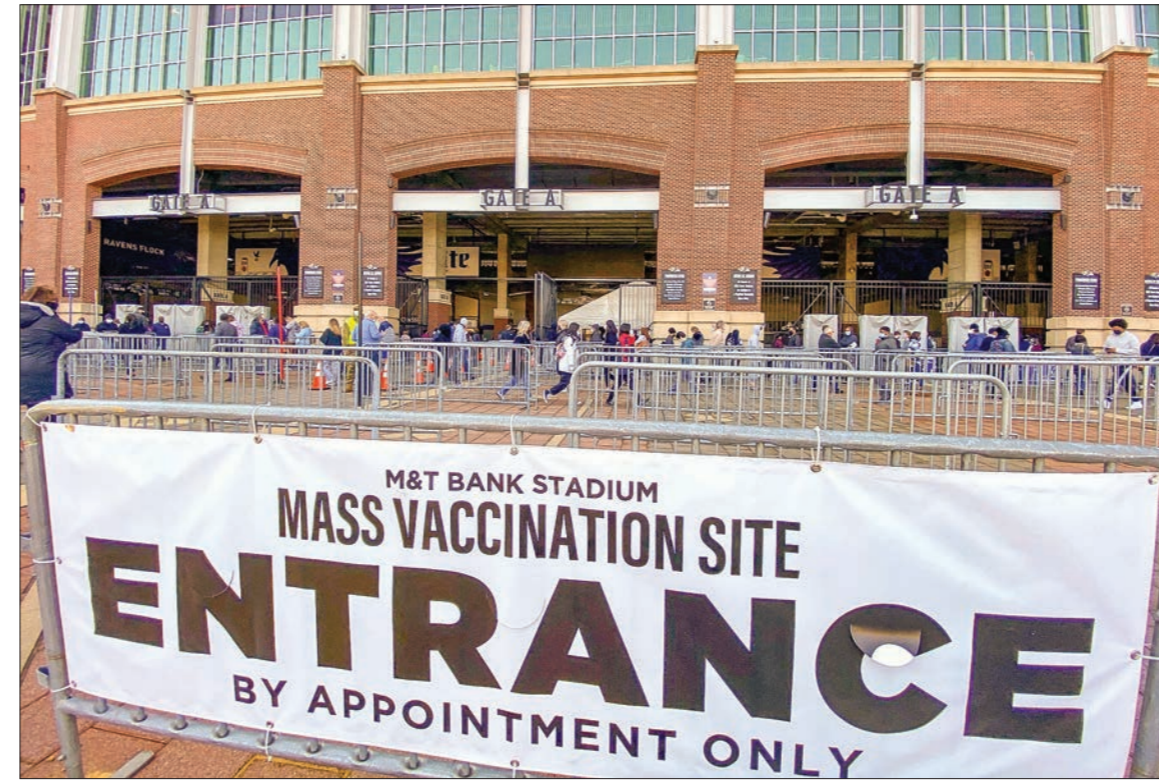
A mass COVID-19 vaccination site at M&T Bank Stadium in Baltimore on 20 March 2021.

against infection declined from 85 per cent during the first month to 49 per cent up