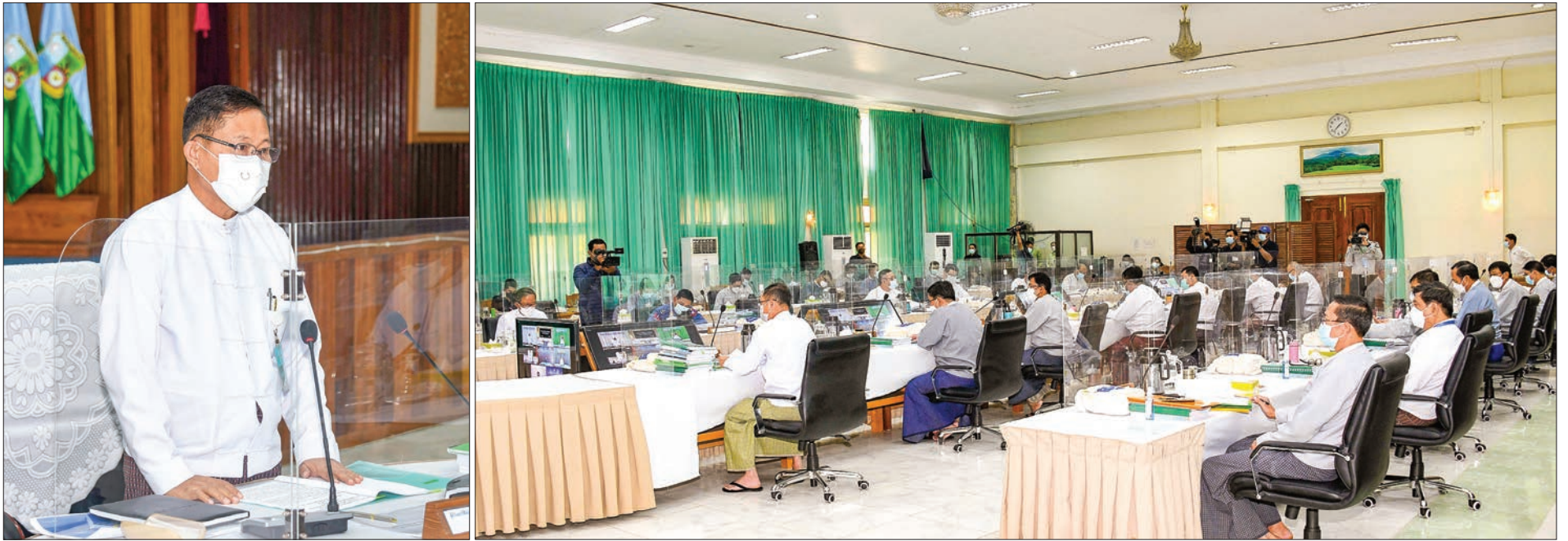
State Administration Council Vice-Chairman Deputy Prime Minister Vice-Senior General Soe Win presides over the second meeting of the National-Level Central Committee on Administration and Management of Natural Resources in Coastal Areas on 16 February 2022 in Nay Pyi Taw.

STATE Administration Council Vice-Chairman Deputy Prime Minister Vice-Senior General Soe Win delivered a remark at the second meeting of the National-Level Central Committee on Administration and Management of Natural Resources in Coastal Areas, held in the afternoon of 16 February at Ingyin Hall of the Forest Department under the Ministry of Natural Resources and Environmental Conservation in Nay Pyi Taw.