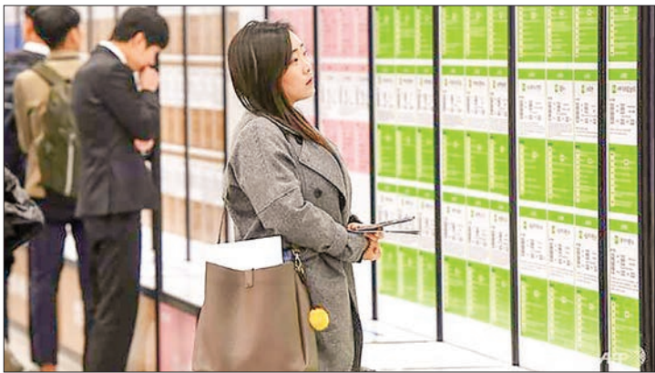
The number of those employed totalled 26,953,000 in January, up 1,135,000 from a year earlier, according to Statistics Korea.

The number of unemployed fell 427,000 from a year earlier to 1,143,000 in January, and the unemployment rate retreated 1.6 percentage points to 4.1 per cent.—Xinhua ■