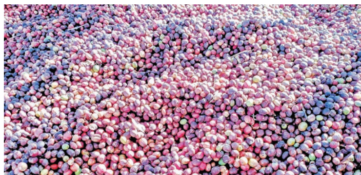
Thandaunggyi Township is a hill region and residents are engaged in the agribusinesses. The region is renowned for its organic coffee (Arabica and Robusta coffee).

Myanmar’s coffee has already earned a good reputation. It has penetrated markets in Asia such as Hong Kong and Singapore, some European