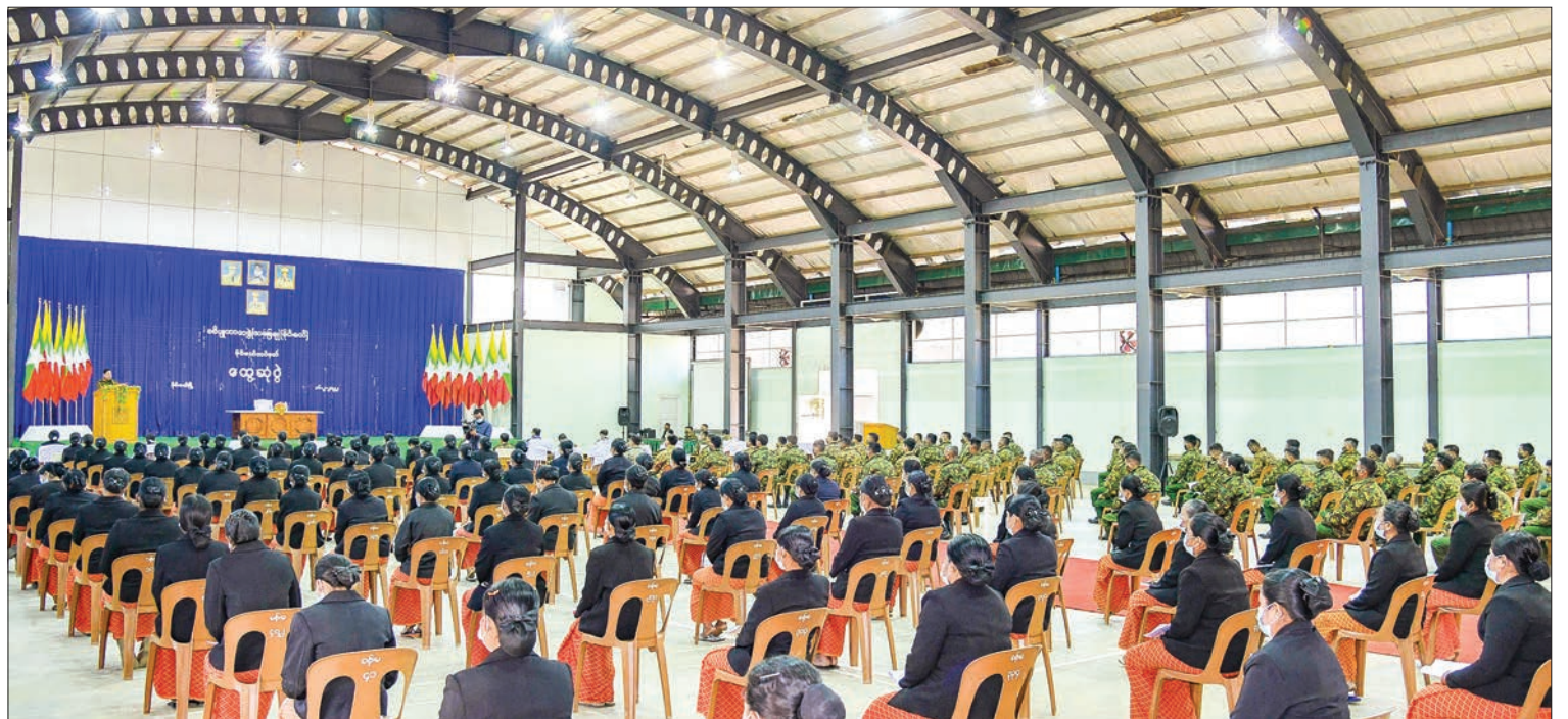
State Administration Council Chairman Commander-in-Chief of Defence Services Senior General Min Aung Hlaing meets Tatmadaw members and families of the Mongkhat Station in the Triangle Region Command on 16 February 2022.

Only when the country restores peace and stability will the free and fair election be held. It is