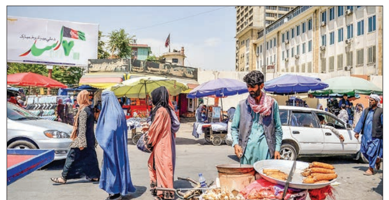
Afghan women shop at a market area in Kabul on 23 August 2021, following the Taliban's military takeover of the country.