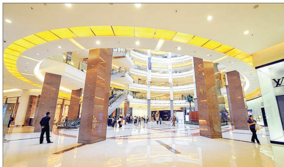
In this picture taken on 20 November, 2009, people walk around a shopping mall in Jakarta.

To date, the country has recorded over 4.9 million COVID-19 cases with more than 145,000 deaths.—Xinhua ■