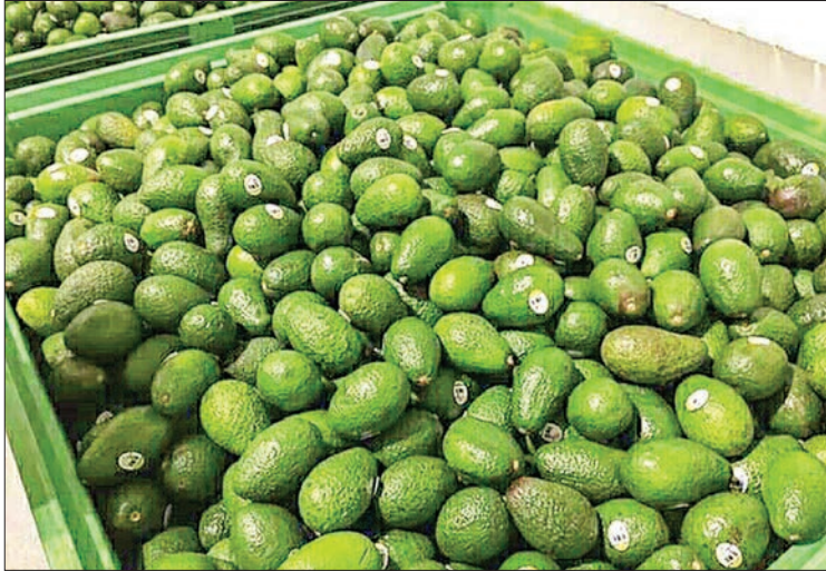
The accuracy of statistics plays a pivotal role in the development of the avocado industry. Thus, growers and entrepreneurs in PyinOoLwin Township are required to cooperate in this survey.