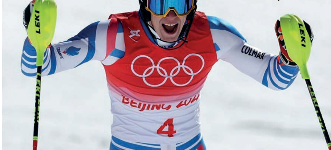
Clement Noel won France's first alpine skiing gold of the Beijing Olympics. PHOTO: AFP

Of the six World Cup races held this season, there have been five different winners, including Noel, while 14 different racers have made the podium.—AFP ■