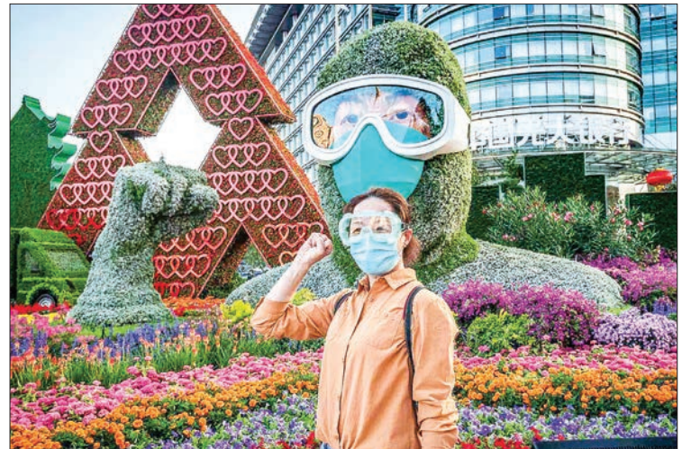
A woman poses in front of a flower display dedicated to frontline healthcare workers during the Covid-19 pandemic, Beijing, 29 September 2021.

Based on mutual respect and cooperation, ties between the UAE and China have “entered a new and special era,” said an article published by Abu Dhabi-based English daily The National, citing the UAE ambassador to China Ali Obaid Al Dhaheri.—Xinhua ■