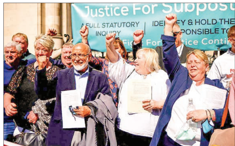
Former subpostmasters celebrate outside the Royal Courts of Justice in London.

In 2019, the High Court ruled that Horizon was affected by bugs and defects, and courts have gone on to quash 72 convictions. Meanwhile, the government vowed in December to pay the final settlements to those Post Office workers wrongly convicted of defrauding their branches. The inquiry, which is being chaired