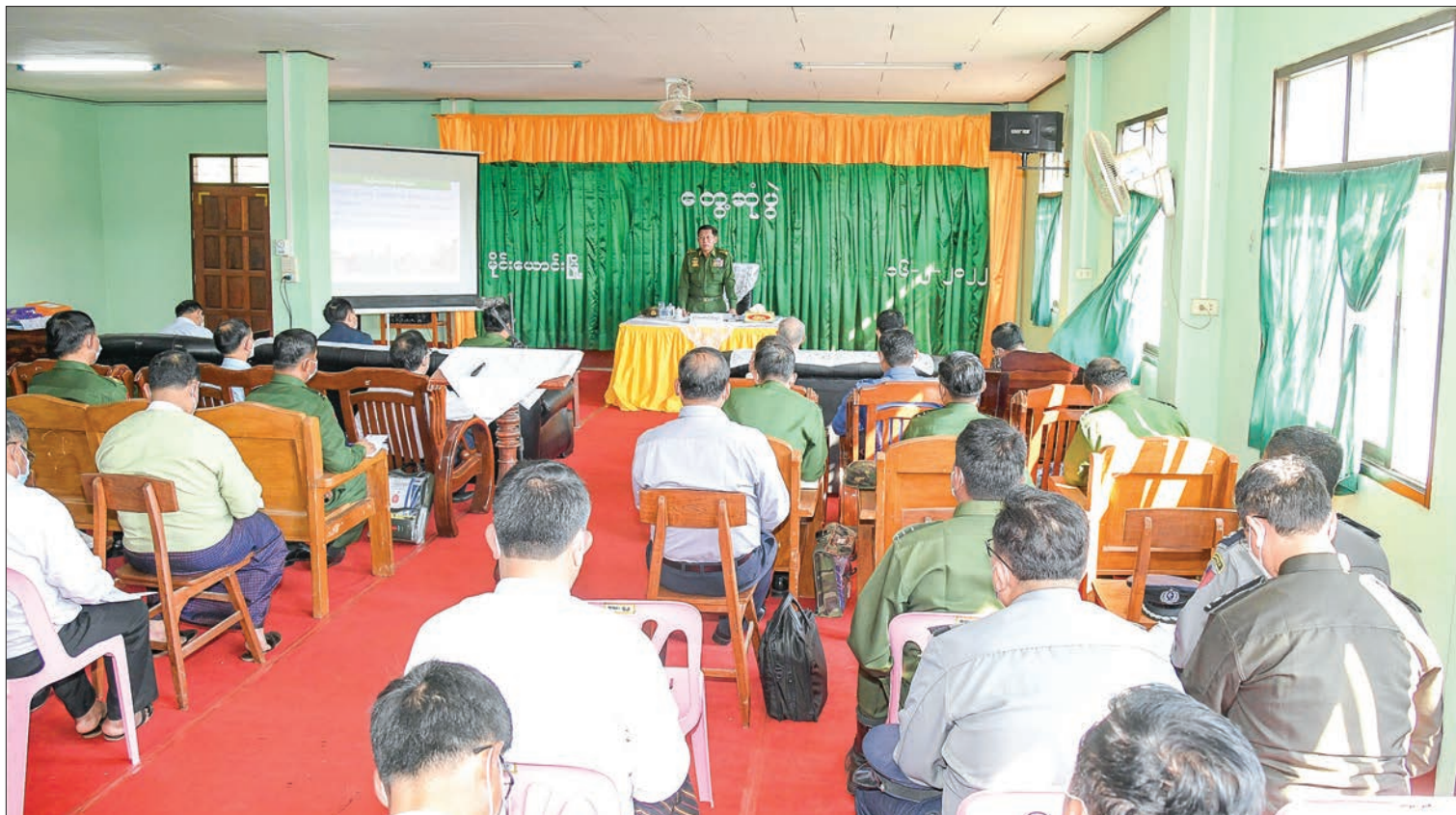
State Administration Council Chairman Prime Minister Senior General Min Aung Hlaing meets the departmental personnel and town elders in Mongyawng Township in Shan State (East) yesterday.

In his speech, the Senior General said that if water from Namloi Creek can be purified in modern technologies, it will supply drinking water to the people. Research can be conducted