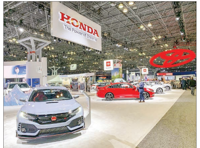
Workers at Honda Motor Co. and Mitsubishi Motors Corp. demanded a monthly base wage hike of 3,000 yen ($26) and 1,000 yen, respectively.

In a departure from demanding a pay hike based on the average wage of all union members, Toyota's union — seen as the industry trendsetter — has proposed wage increases in accordance with the line of work and positions of employees.