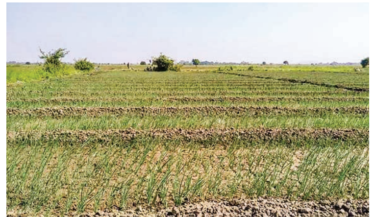
the projected acres, according to the Director of Chin State Agriculture Department.

about 107 acres of onion and 200 acres of garlic in Haka district, 495 acres of onion and 516 acres of garlic in Falam district and 91 acres of onion and 120 acres of garlic in Matupi district. In the 2021-2022FY, Chin State aims to grow about 5,025 acres of chilli crop. So far, about 4,379 acres of chilli have been cultivated, which is covered over 87 per cent of