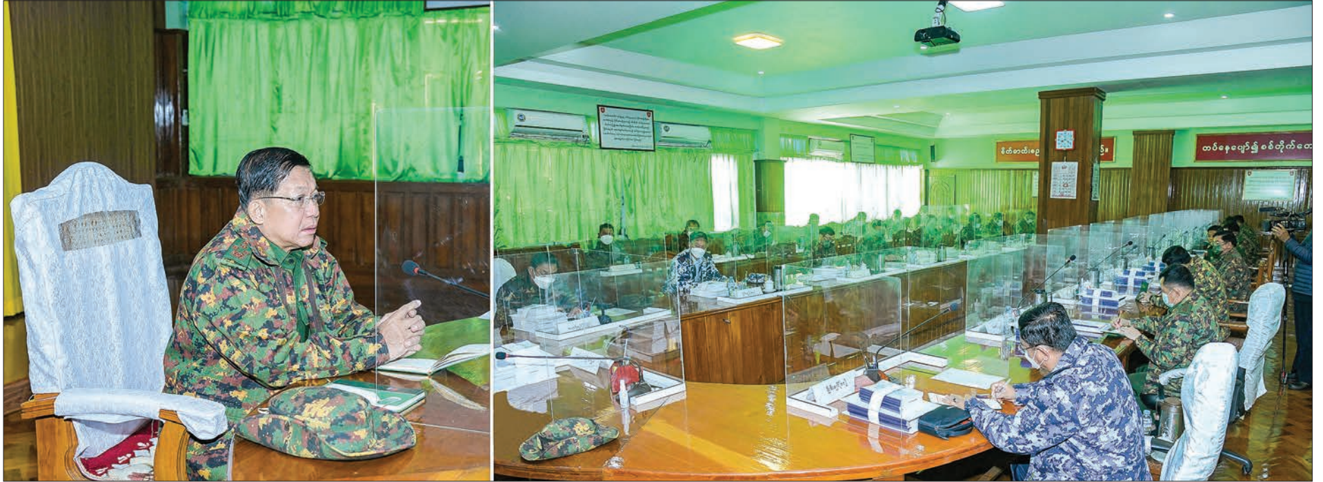
State Administration Council Chairman Commander-in-Chief of Defence Services Senior General Min Aung Hlaing meets the high ranking officers of the General Staff, Adjutant-General and Quartermaster-General Corps of the Triangle Region Command yesterday.