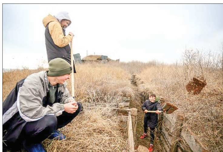
Ukrainian teenagers from broken homes have decided to respond by digging trenches for their troops.

“When our father, the pastor, said there might be shelling, that Putin might attack, I started having nightmares, because that's what I would think about before bed,” he said. “We dug trenches to help Ukrainian soldiers. Now, we are reinforcing them. This