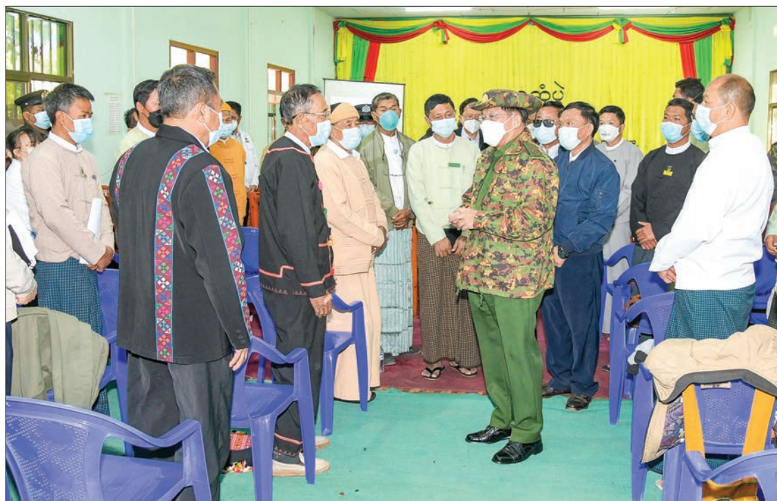
State Administration Council Chairman Prime Minister Senior General Min Aung Hlaing cordially greets the departmental personnel and town elders in Mongkhat Township in Shan State (East) yesterday.

After the meeting, the Senior General cordially greeted departmental officials, town elders, Shan, Lahu and Akha ethnic cultural troupes.