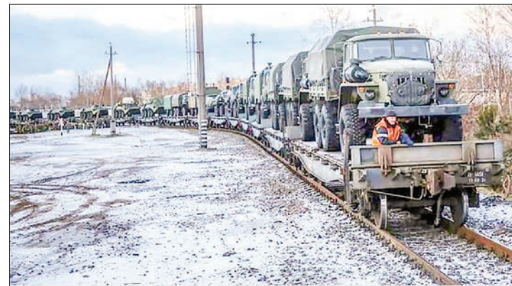
The statement said tanks, infantry vehicles and artillery were leaving Crimea by rail.

RUSSIA on Wednesday said military drills in Moscow-annexed Crimea had ended and that soldiers were returning to their garrisons, a day after it announced a first troop pull-back from Ukraine's borders.