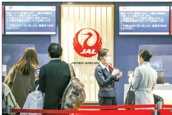
A Japan Airlines Co. staff member attends to passengers at a check-in counter at Haneda airport in Tokyo on Feb. 16, 2022.

A glitch in Japan Airlines Co.'s check-in system caused delays in departures Wednesday at Tokyo and other domestic airports in Japan, the company said.