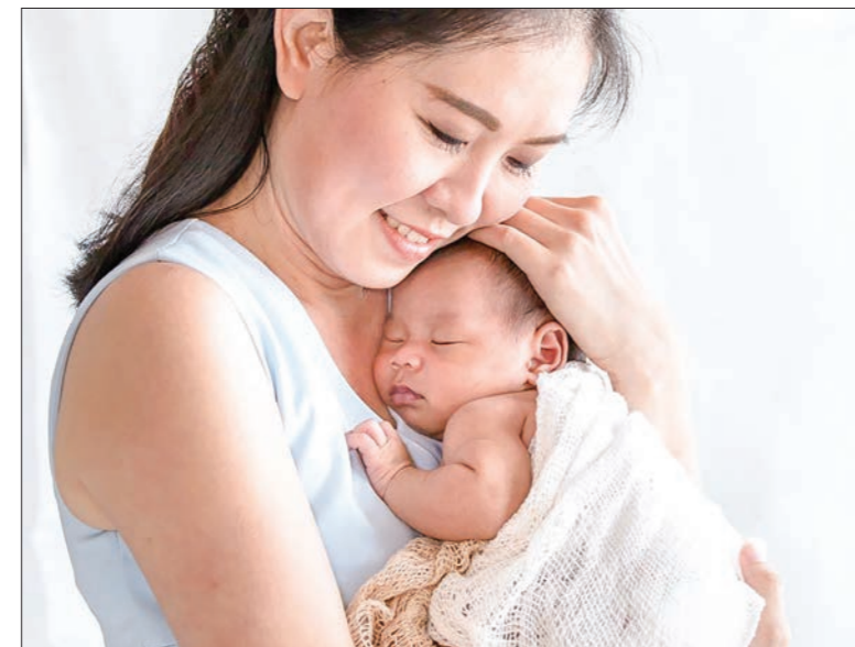
Babies born to mothers fully vaccinated against the coronavirus during pregnancy were around 60 per cent less likely to be hospitalized with severe Covid, a new study by the US Centres for Disease Control and Prevention said.

The authors studied the odds of Covid-19 vaccination among mothers whose babies were hospitalized with the disease (176 infants) compared to the odds of vaccination among mothers whose babies were hospitalized for non-Covid reasons (203 infants), who were a control group.