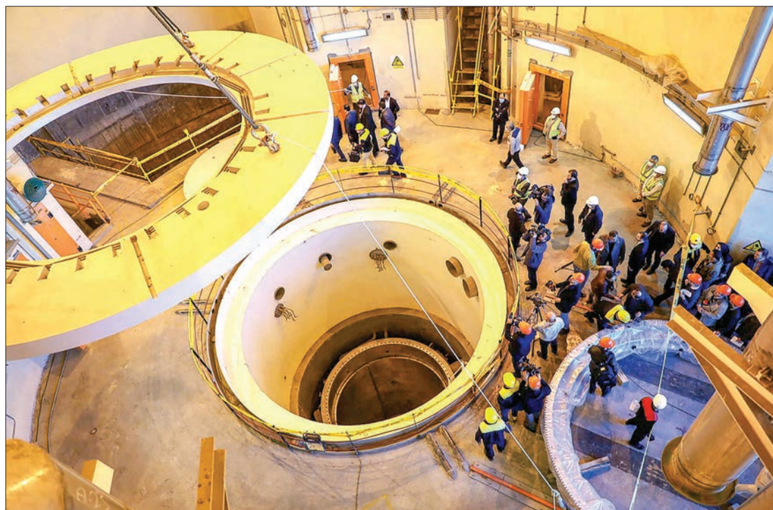
Technicians work at the Arak heavy water reactor's secondary circuit, as officials and media visit the site, near Arak, Iran, 23 December 2019.

IRAN on Monday said an agreement to restore the 2015 nuclear deal was “at hand”, but insisted