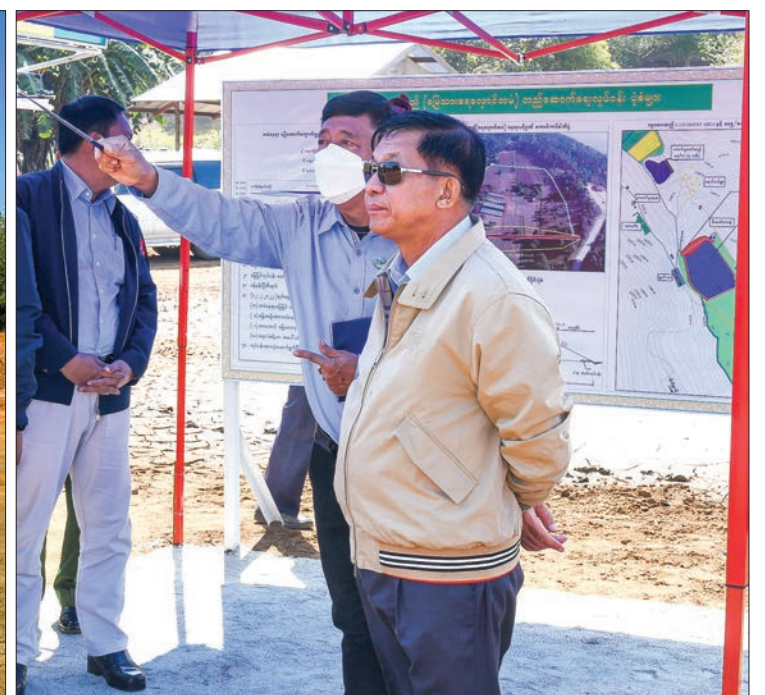
The Senior General inspects the project site for the construction of a skytrain track linking between the Buddha Park and the Loimwe hill station.