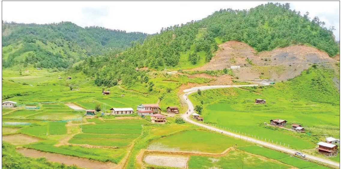
About 78,038 acres of paddy are targeted to grow in districts of Chin State in 2021-22 cultivation season. So far, about 59,832 acres have been cultivated, which is covered over 76 per cent of the projected acres.

About 78,038 acres of paddy are targeted to grow in districts of Chin State in 2021-22 cultivation season. So far, about 59,832 acres have been cultivated, which is covered over 76 per cent of the projected acres.