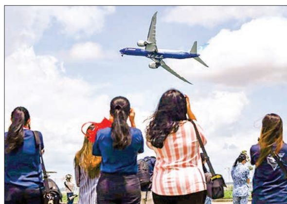
People watch as a Boeing 777-9 aircraft flies past during the Singapore Airshow.

"While Glencore cannot forecast with certainty the cost, extent, timing or terms of the outcomes of the investigations, the Company presently expects to resolve the US, UK and Brazilian investigations in 2022," it added.—AFP ■