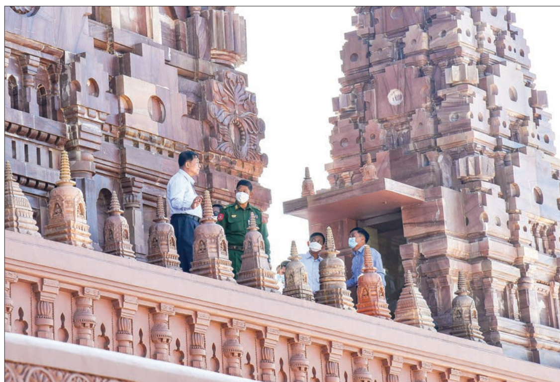
The Senior General observes the Buddhological images carved on the marble rocks.

link the Buddha Park and the Loimwe hill station and attended to the needs of officials.