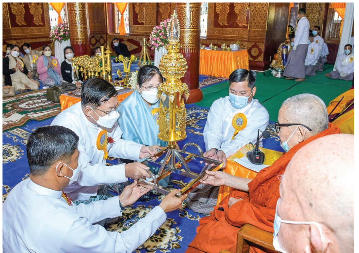
The Senior General and wife offer the Yadana diamond orb to the Kengyin Monastery Sayadaw.

As a gesture of honouring the centennial birthday of the Image, the Senior General who is the leader of the well-wishers, wife and family members, well-wishers and local people successfully hoisted the Yadana Diamond Orb and the golden umbrella and held the consecration ceremony yesterday.