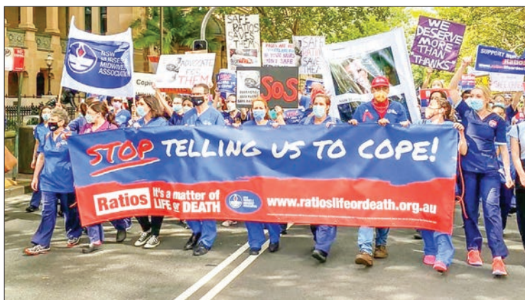
Nurses in Australia protesting against staff shortages and COVID-19 pandemic-related stresses and strains on 15 Feb 2022.

For two years, Australia's medical staff have worked under