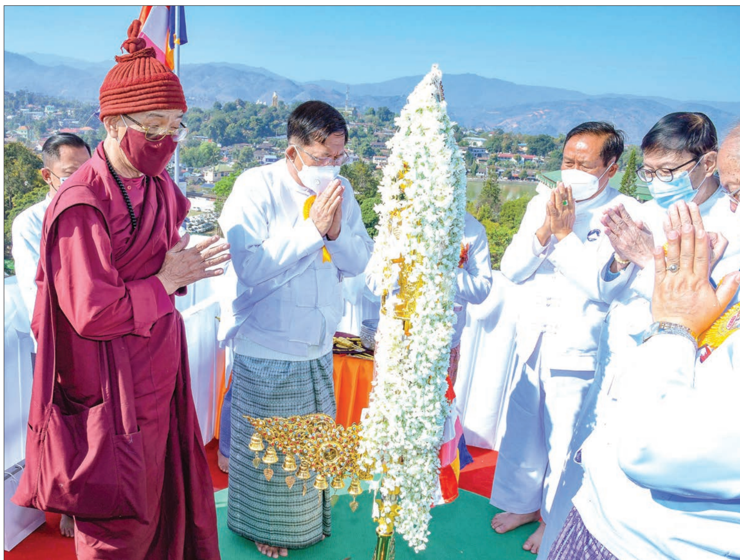
State Administration Council Chairman Prime Minister Senior General Min Aung Hlaing attends the event to hoist the Yadana diamond orb and golden umbrella atop the Maha Muni Buddha Image in Kengtung in southern Shan State on 15 February 2022.