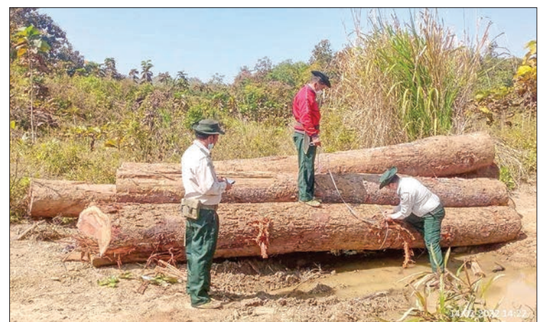
Confiscated teak logs.

In addition, a combined team of the Bago Region Forest Department reportedly seized 3.1122 tonnes of illegal timbers