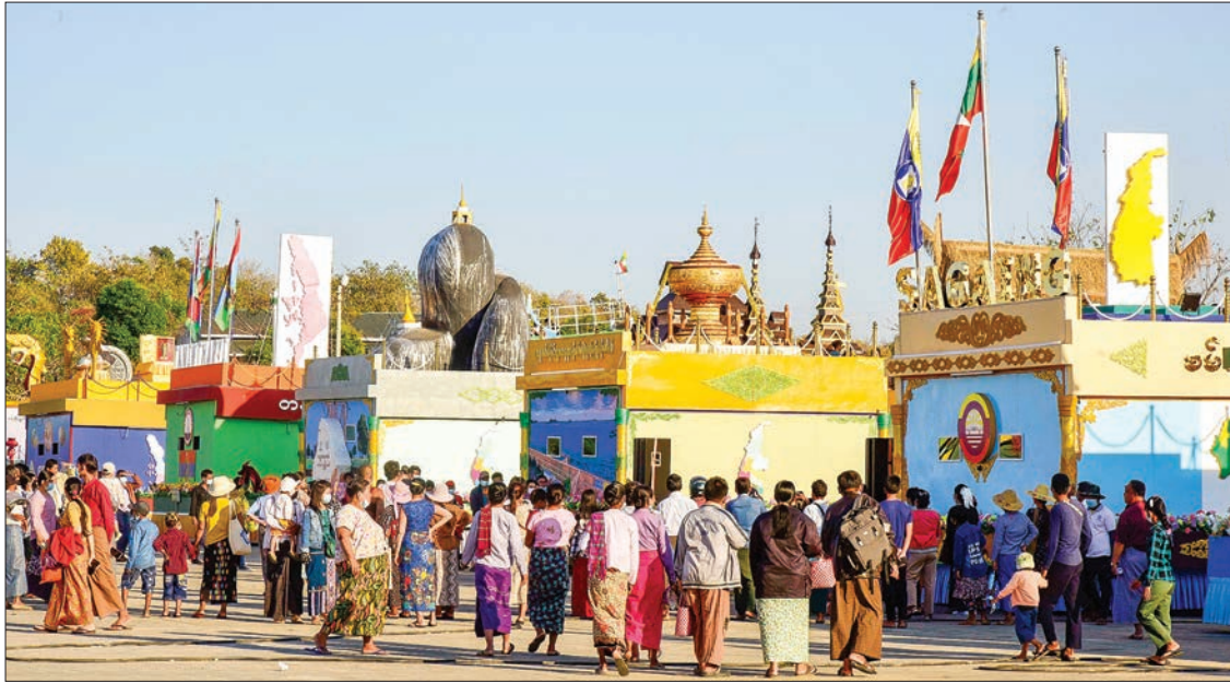
Visitors throng at the honorary floats show on its final day.

A large flock of people visited the Tabaung ground in front of Uppatasanti Pagoda where the honorary floats, which joined the Diamond Jubilee Union Day Ceremony from Nay Pyi Taw, the regions and states, were parked yesterday.