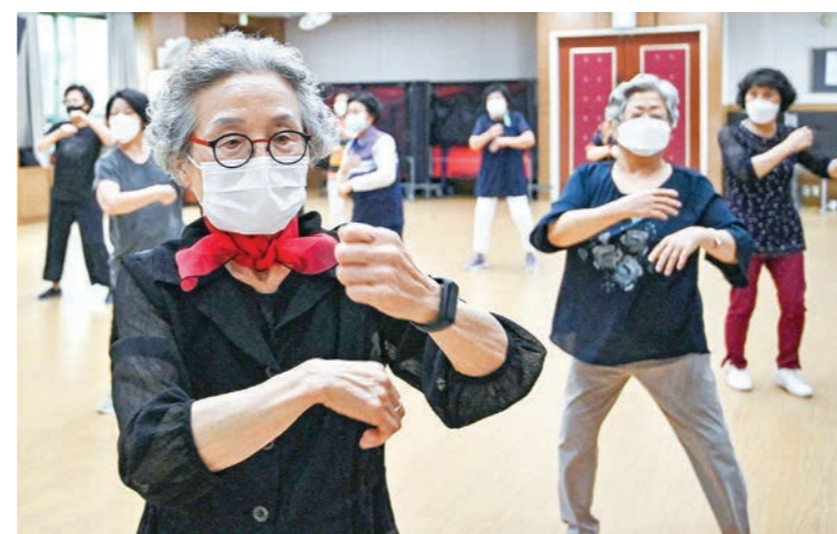
Elderly women wearing face masks attend a dance class re-opened for the first time since the Covid-19 coronavirus pandemic at Seodaemun Senior Welfare Centre in Seoul on 1 July, as South Korea seeks to ease coronavirus restrictions.

14,685 women in total: 227 (2 per cent) had been previously diagnosed with breast cancer and were on oestrogen blocker drugs (adjuvant therapy) to curb the risk of cancer recurrence (group 1), and 2535 (17 per cent) were taking hormone replacement therapy (HRT) to boost their oestrogen levels in a bid to relieve menopausal symptoms (group 2).