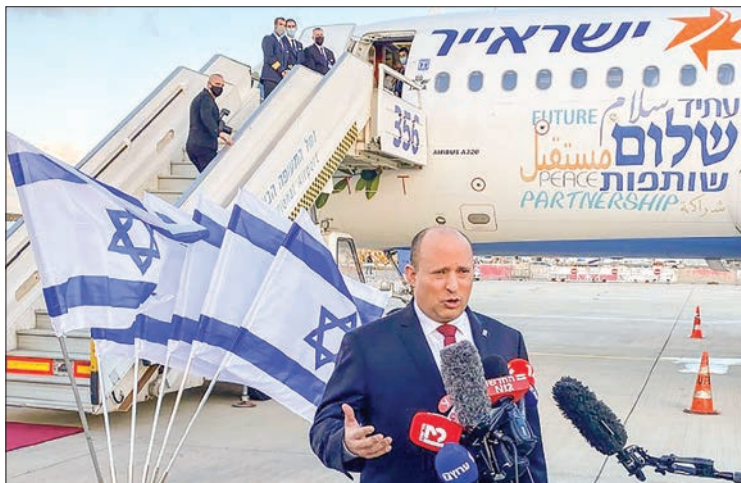
Bennett is the first Israeli head of state to visit Bahrain.

Bennett's visit is the latest such initiative following the US-brokered 2020 Abraham Ac-cords, which ran counter to the longstanding Arab consensus that ruled out ties with Israel in the absence of a solution to the