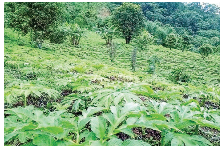
In this 2021-22FY, about 12,158 acres of konjac have been cultivated — 3,864 acres in Haka, 2,378 acres in Falam and 5,916 acres in Matupi districts.

Although konjac is a natural plant in Chin State, the three-year plan is set up from the 2020-21FY to 2022-23FY to increase the annual income for local farmers and to bring permanent farming from shifting cultivation because of the scarcity of konjac species by increasing the number of excavations. — Lu Lay/GNLM