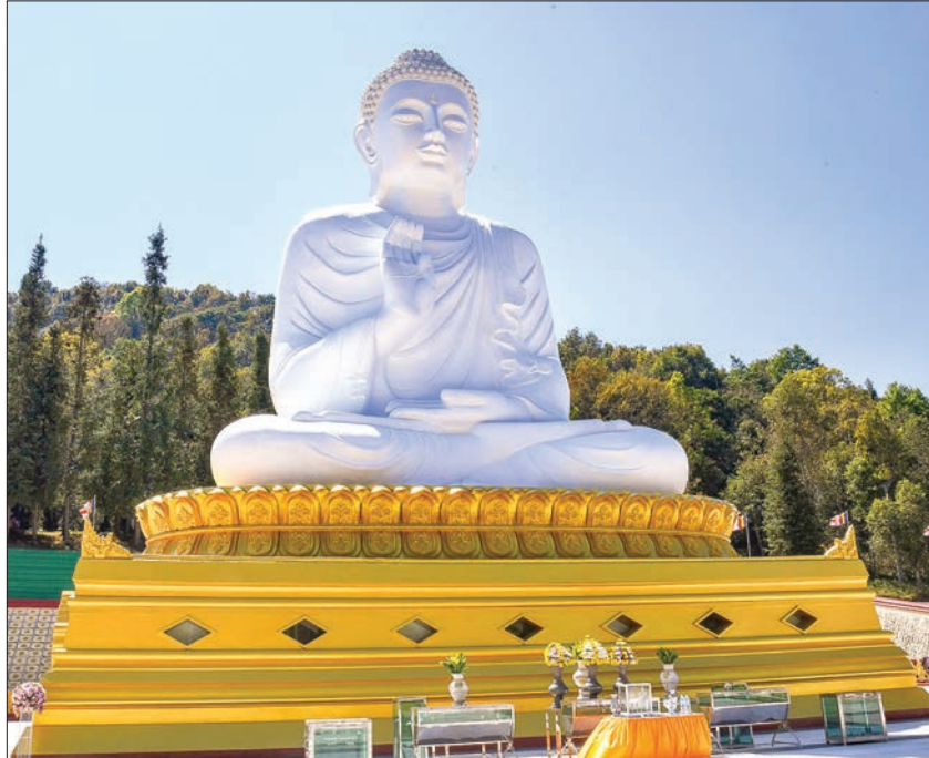
State Administration Council Chairman Prime Minister Senior General Min Aung Hlaing and party pay homage to the Abhayarajamuni Buddha Image in the precinct of Buddha Park near Pankwe Village 15 miles southeast of Kengtung yesterday.

The Senior General inspected the project site for the construction of a skytrain route to