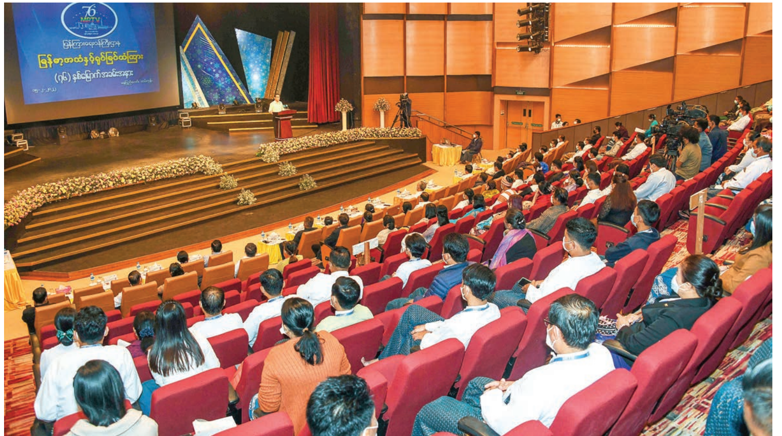
The 76 th Anniversary of MRTV is celebrated in Nay Pyi Taw on 15 February 2022.

The ministry is working hard to become one that the country relies on in addition to the main duties such as to inform, educate and entertain and also provide modern and active programmes. It also cooperates with various artistes and