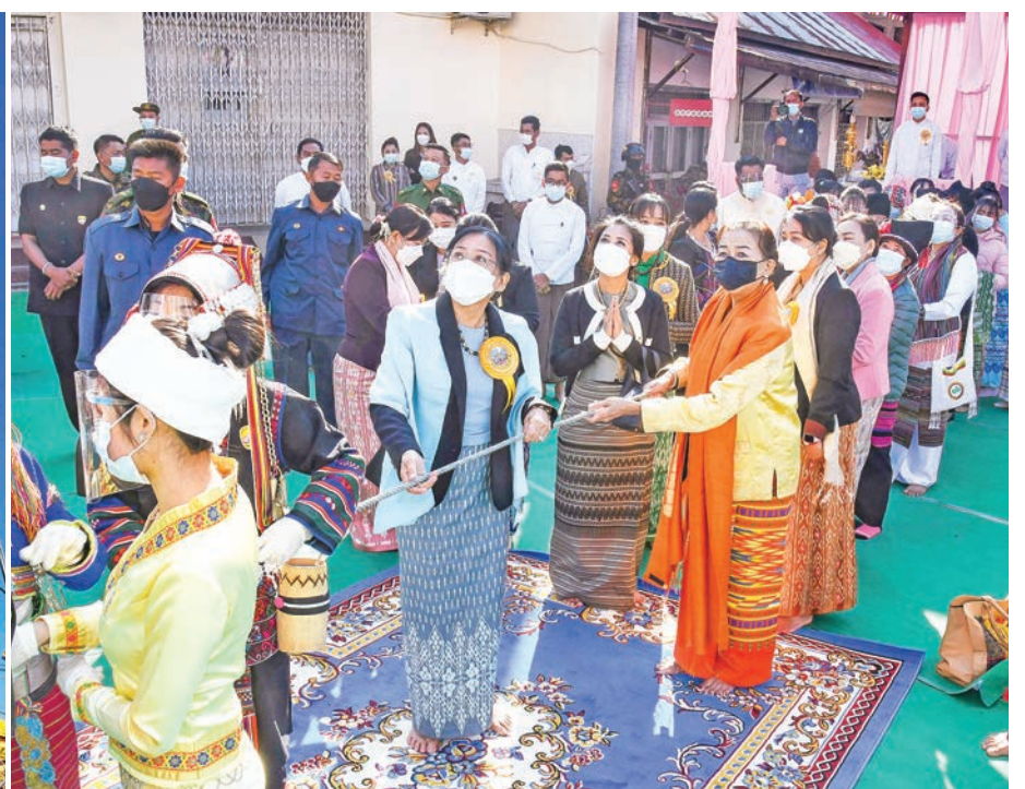
The Yadana diamond orb and pennant shaped vane are being conveyed atop the Maha Muni Buddha Image.