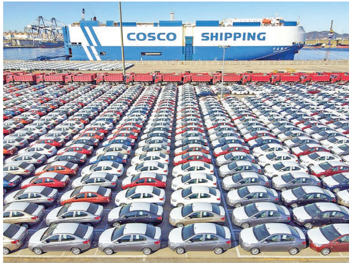
Aerial photo taken on 7 December 2021 shows vehicles before being loaded onto a freight ship at Yantai Port, east China's Shandong Province.

If China were to follow the model of "coexistence with the virus," it would be reporting "hundreds of thousands" of daily new cases "even in a highly underestimated outbreak scenario and under the most optimistic assumptions," according to a study of the Chinese Centre for Disease Control and Prevention. In the face of the unprecedented health crisis,