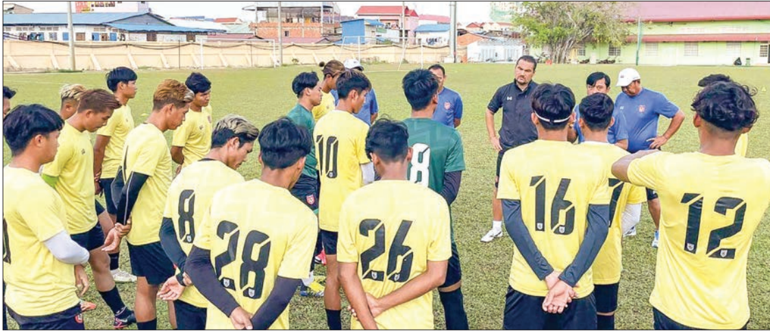
The Myanmar U-23 squad seen at their training session before conducting the COVID-19 test.