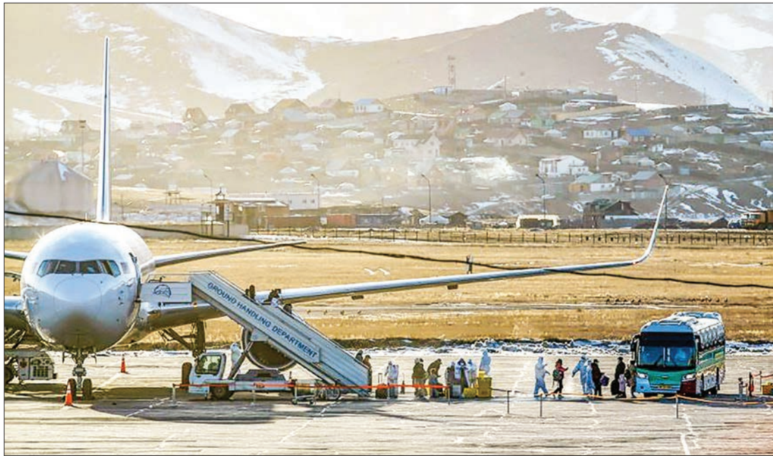
Mongolia has implemented some of the world's toughest anti-Covid measures since the start of the pandemic.

The move means the country of three million "fully opens its borders to international travel", Prime Minister Luvsan-namsrai Oyun-Erdene said, according to Montsame.