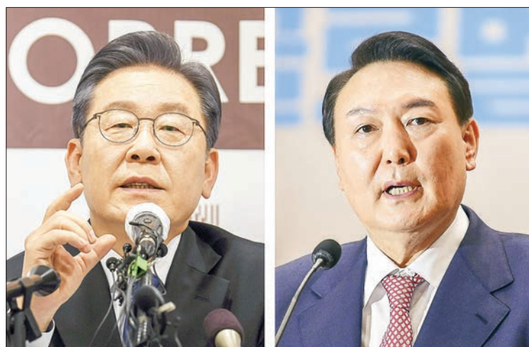
Combined photo shows Lee Jae Myung (L) and Yoon Suk Yeol.

With bilateral ties sinking to the lowest level in decades under South Korean President Moon Jae In, ruling party nominee Lee Jae Myung and main opposition candidate Yoon Suk Yeol -- the two front-runners for the 9 March election — share the need to im-prove relations with Japan.