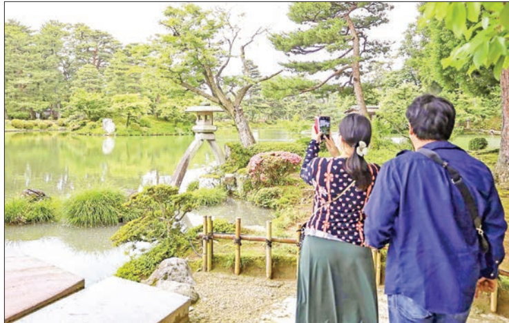
A visitor takes a photo at Kenrokuen, one of Japan’s top three landscape gardens, in Kanazawa, Ishikawa Prefecture, on : 20 June 2020, PHOTO: KYODO /FILE

The annualized figure was worse than the average projection of a 5.5 per cent expansion in a poll of private-sector economists conducted by Kyodo News.