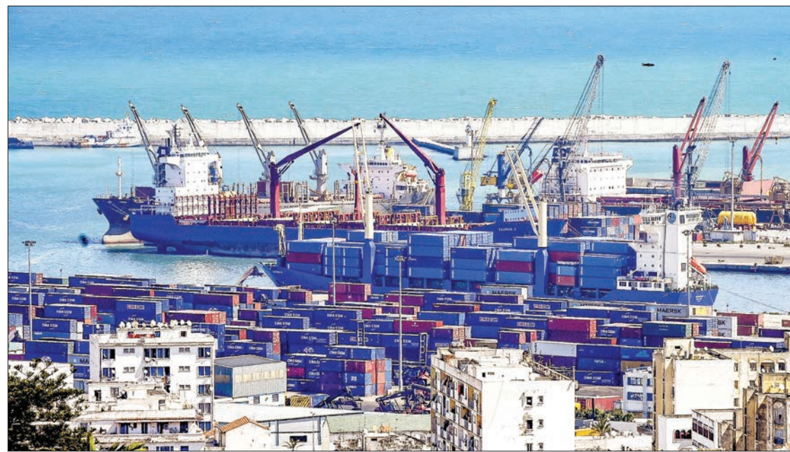
Algeria’s main commercial harbour for importing and exporting goods in Algiers.

TRADE ministers from the Foreign Affairs Council of the European Union (EU) have discussed the EU’s trade policy priorities, and partnerships with the African Union and the United States.