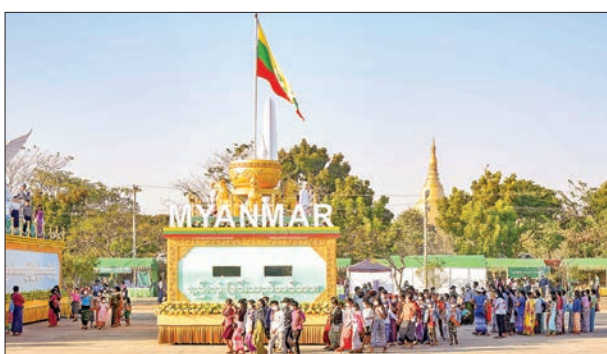
The event is packed with a large number of people.