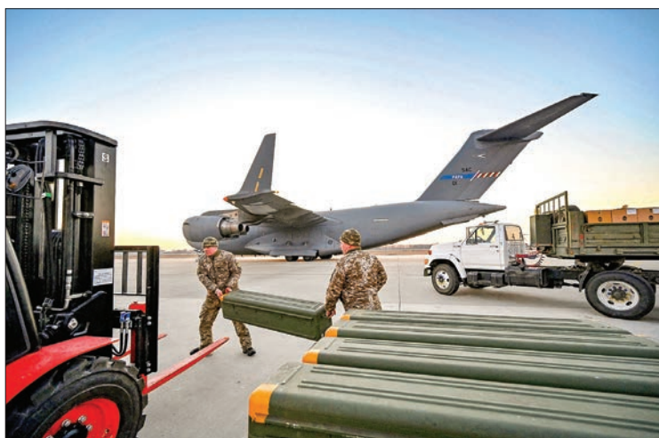
Two Ukrainian soldiers carry a defence missile on the Boryspil military base in Kiev, this Sunday, 13 February.

As speculation mounted that Russian troops massed on the Ukraine border could launch an attack this week, German Chan-celler Olaf Scholz was due in Mos-cow on Tuesday for talks with the Russian president—the latest in