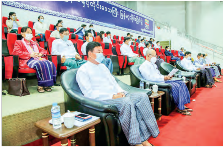
Dignitaries attend the opening ceremony of the Inter-Region/State traditional martial arts (Myanmar Thaing) contest 2022 in Nay Pyi Taw yesterday.

First, Union Minister U Min Thein Zan highlighted the intentions of holding the martial arts competition such as the emergence of young, strong and fit athletes to lift