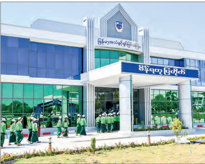
Students pay the study tour around the MRTV in Tatkon

THE students, who will participate in the Diamond Jubilee Union Day Ceremony by performing the characters representation of states/regions and playing the band, and their teachers visited MRTV in Tatkon of Nay Pyi Taw and enjoyed the entertainment programmes yesterday.