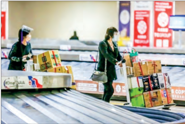
Passengers wearing protective masks are seen inside the Terminal 1 of the Ninoy Aquino International Airport in Manila, the Philippines on 17 March 2021.

THE Philippines on Thursday reopened its borders to foreign tourists, lifting a two-year ban implemented to keep local COVID-19 cases under control.