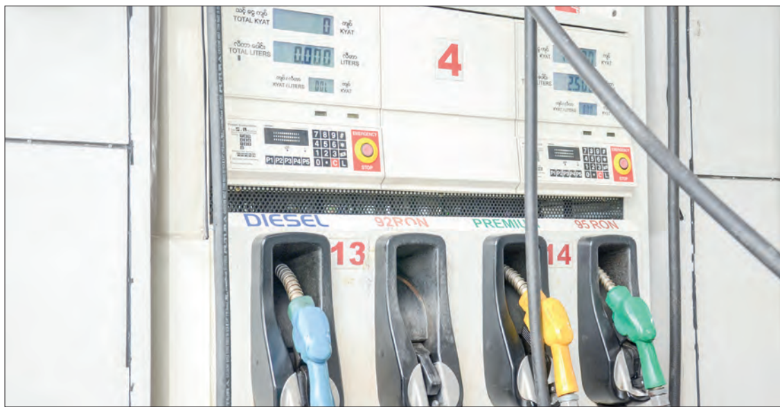
The fuel oil price in other states and regions are ranging between over K1,800 and K1,950 per litre depending on the transport charges.

THE fuel oil price in the Yangon market is inching upward up to over K1,700 per litre, according to the fuel oil stations.