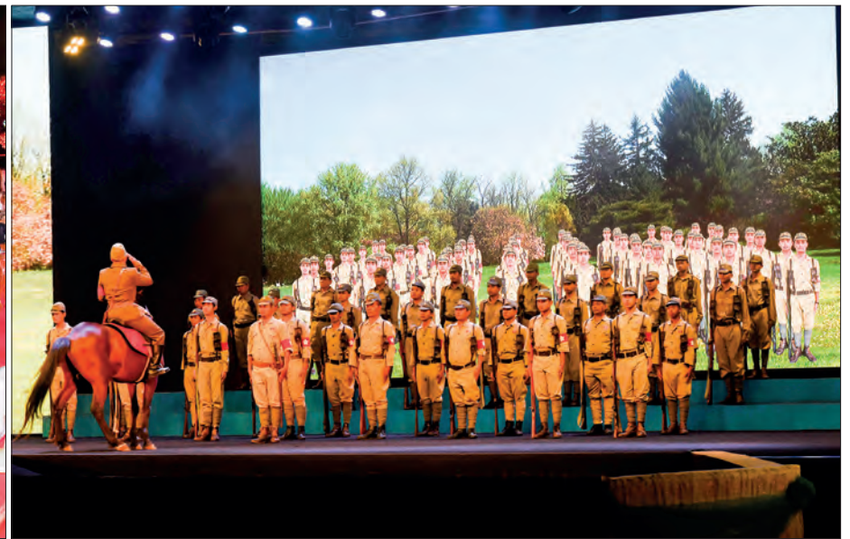
The Vice-Senior General and party view the full dressed rehearsal of ethnic nationals for Diamond Jubilee Union Day 2022.