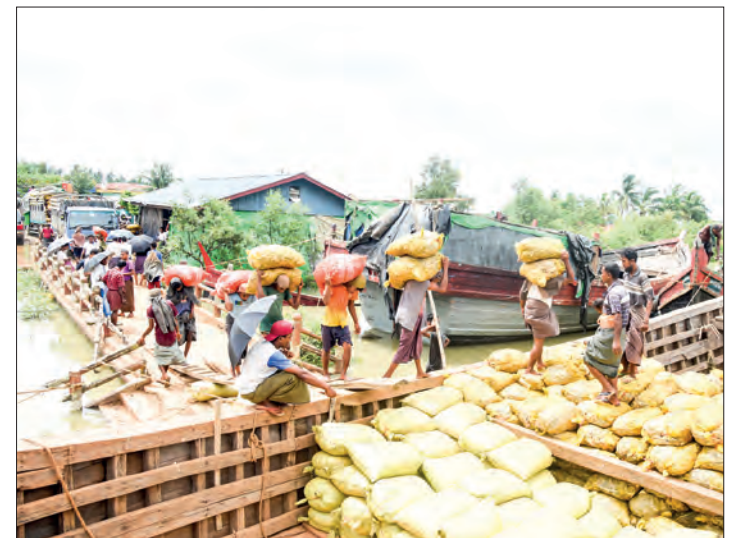
Cargos are loaded on the Myanmar-Bangladesh border.

The products traded between the two countries include bamboo, ginger, peanuts, saltwater prawns and fish, dried plums, garlic, rice, mung beans, blankets, candy, plum jams, footwear, frozen foods, chemicals, leather, jute products, tobacco, plastics, wood, knitwear, and beverages. — ACM/GNLM