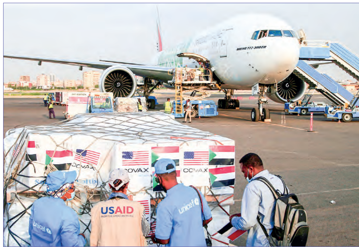
Aid workers check a shipment of vaccines against the coronavirus sent to Sudan by the Covax vaccine-sharing initiative, shortly after an Emirates plane landed at the airport in the capital Khartoum, on 6 October 2021.

The scheme therefore wants $16 billion up front from wealthy nations "to close the immediate financing gap", with the rest to