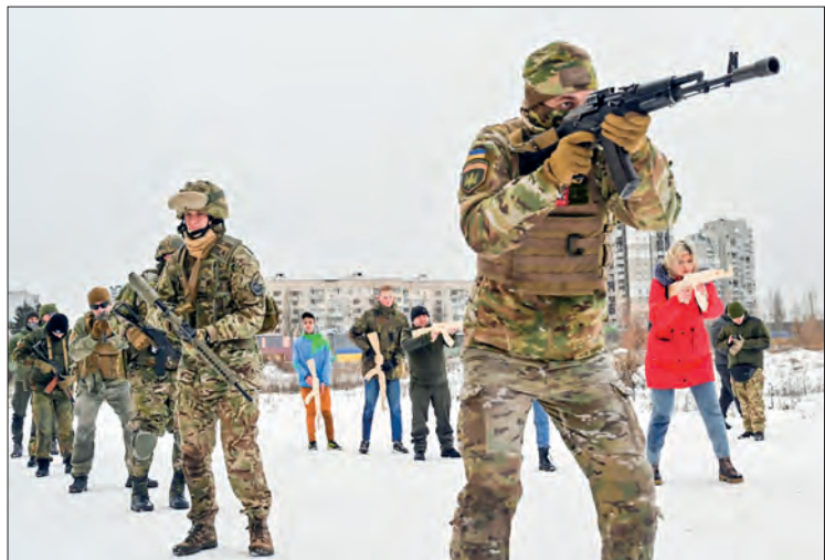
A Ukrainian military instructor teaches civilians holding wooden replicas of rifles, as they take part in a 6 February 2022, training session in Kyiv amid fears of a possible Russian invasion.

HOPES are rising that efforts to stop Russia from invading Ukraine may be starting to pay off, as the diplomatic push picks up Thursday with German Chancellor Olaf Scholz to meet Baltic leaders in Berlin and UK Prime Minister Boris Johnson heading to NATO and Poland.