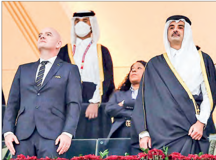
FIFA President Gianni Infantino (L) says this year's World Cup finals in Qatar will become a benchmark for holding future mass events during a health crisis.

sure this not only the best World Cup ever but also the healthiest World Cup ever," Infantino said in a recorded statement for the event.