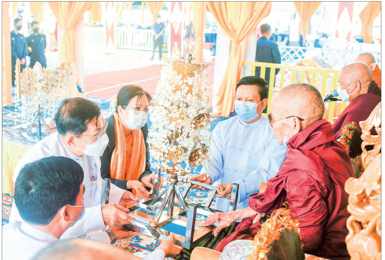
The Senior General, wife and family members offer the Yadana diamond orb, pennant-shaped vane, golden umbrella and offerings to the Salin Sayadaw yesterday.

The Senior General, wife and family members offered Yadana diamond orb, pennant shaped vane, golden umbrella and offerings to Salin Sayadaw. Members of the Council, the joint secretary and Union ministers donated alms to members of the Sangha. They all listened to a sermon