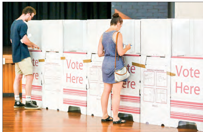
Voters are seen keeping a distance at Brisbane City Hall in Brisbane, Australia on 28 March 2020.

The scheme may have seen allies placed into the offices of successful candidates, who could have both influenced the politician and filtered sensitive information back to the foreign government, if ASIO had not foiled the plot.—AFP ■