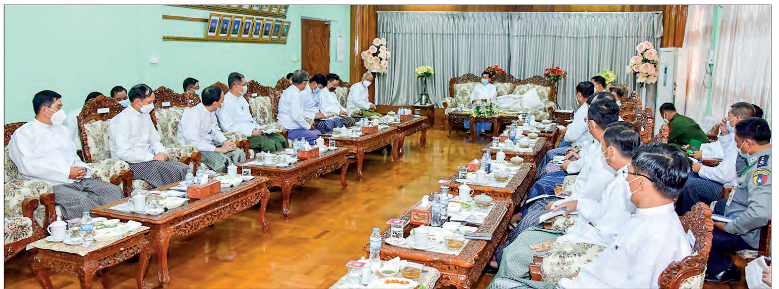
State Administration Council Chairman Prime Minister Senior General Min Aung Hlaing hold talks with the regional government officials and departmental personnel in Magway yesterday.

Upon explanation, the Senior General said it is necessary to systematically plant fish in rivers, and cattle and goat breeding will be more beneficial if they are reared in captivity as it will provide not only livestock but also natural fertilizers required for agriculture. The Senior General also suggested that not only broilers but also layers should