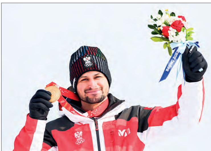
Austria's Johannes Strolz won the Olympic alpine combined gold medal to emulate his father.

AUSTRIA'S Johannes Strolz bounced back from being dropped from his team — even working as a traffic policeman for a time — to emulate his father in winning Olympic alpine combined gold on Thursday in Beijing.