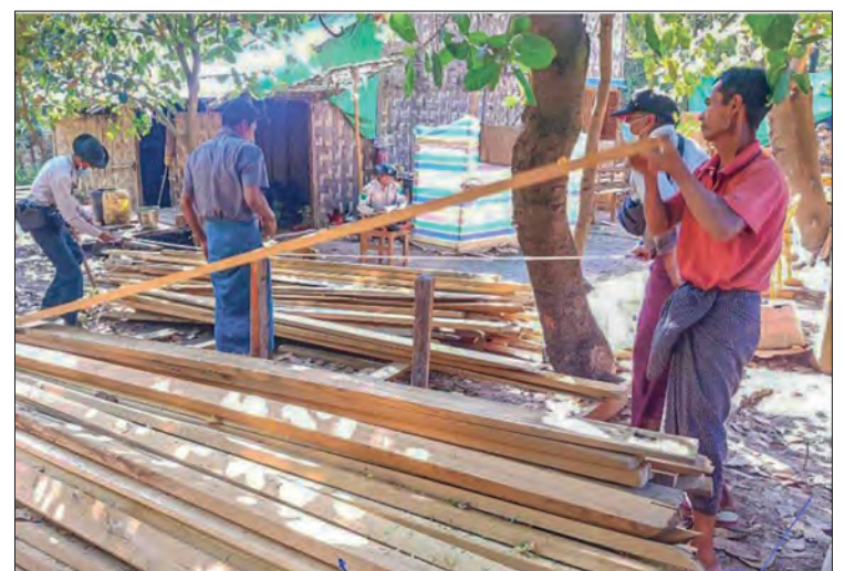
Confiscated sawn timbers.

Therefore, a total of 16 arrests were made on 7, 9 and 10 February and the estimated value is K183,707,388, according to the Anti-Illegal Trade Steering Committee. — MNA