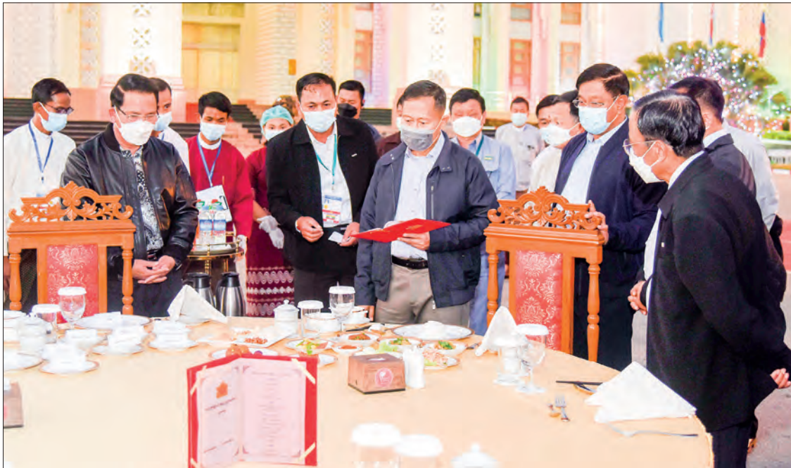
The Vice-Senior General inspects the dinner table setting for the Diamond Jubilee Union Day 2022.

VICE-CHAIRMAN of the State Administration Council Deputy Prime Minister Vice-Senior General Soe Win inspected the table setting for dinner and full dressed rehearsal of ethnic people for the ceremony to mark the Diamond Jubilee Union Day 2022 in Nay Pyi Taw yesterday.