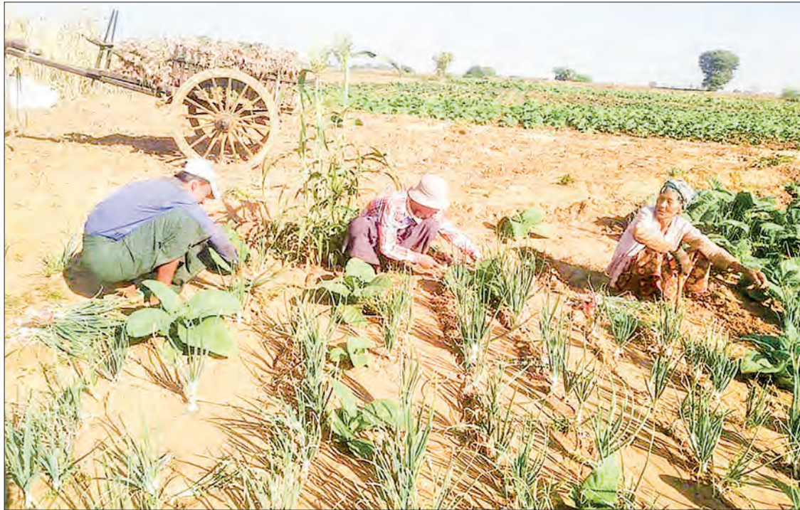
Farm workers are seen picking the onions.

Last year, onions were priced up to K750-1,000 per viss. The onion market remains