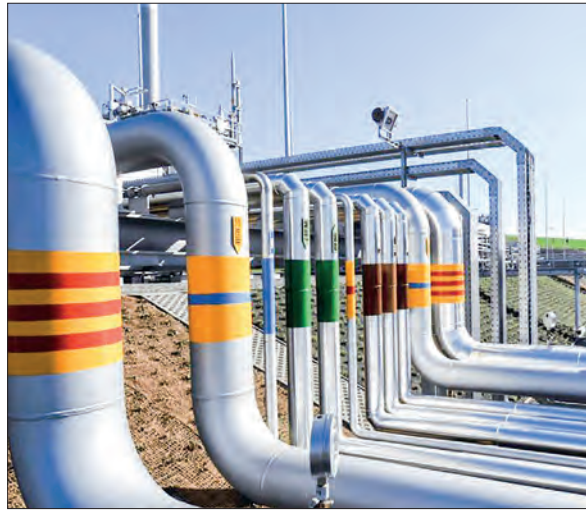
Germany's gas stocks have fallen to a "worrying" level as fears over a possible invasion of Ukraine by Russia put further pressure on energy supplies.