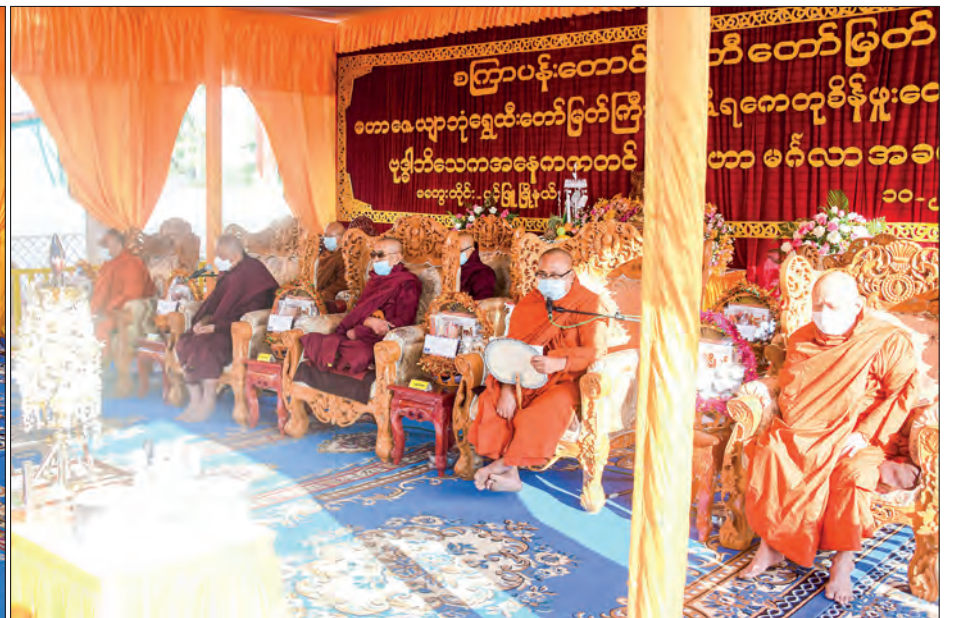
State Administration Council Chairman Prime Minister Senior General Min Aung Hlaing, wife and congregation take the Nine Precepts from the members of the Sangha at the event yesterday.