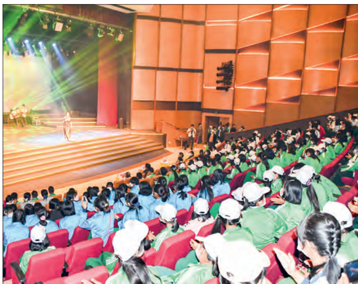
Students watch the entertainment programmes.

The study group including 1,240 students and teachers from 13 high and middle schools of Pyinmana and Nay Pyi Taw paid a study tour to MRTV in two groups keeping in line with the COVID-19 health rules. — MNA