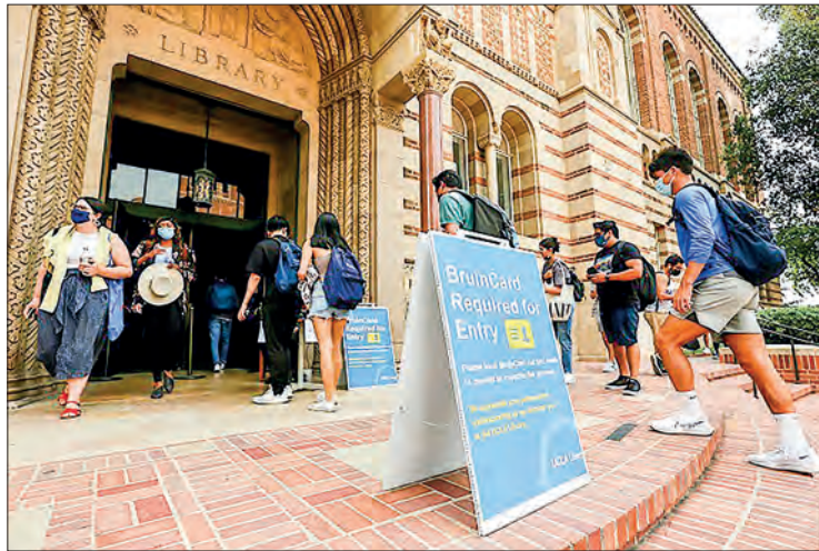
Students are seen at the entrance of the Library on campus of the University of California, Los Angeles (UCLA), in Los Angeles, the United States, 23 September 2021

of acknowledging complaints against Heaps dating back to the 1990s but taking no action even