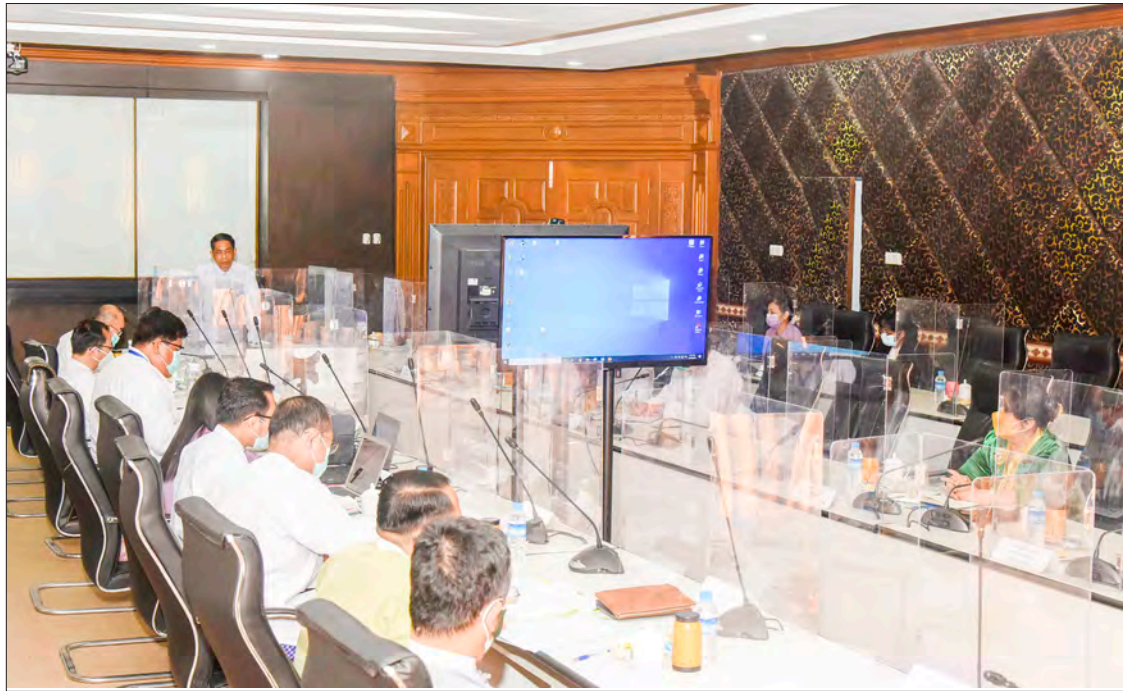
At the meeting, Union Minister U Ko Ko Hlaing said the first phase of the ASEAN Humanitarian Assistance provided through the AHA centre will be completed soon, and

The meeting was attended by Chairman of the Task Force Union Minister for International Cooperation U Ko Ko Hlaing, Member of the Task Force Deputy Minister for Social Welfare, Relief and Resettlement U Aung Tun Khaing, secretaries and members of the Task Force.