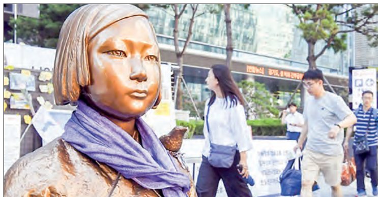
Moon called Japan “the closest of neighbouring countries,” adding that his government has tried to achieve stable relations with Japan by approaching history issues and future-oriented cooperation separately, symbolizing ‘comfort women’ in front of the Japanese Embassy in Seoul.

“I expect the next administration to work hard to develop Korea-Japan relations. It is necessary to strengthen dialogue