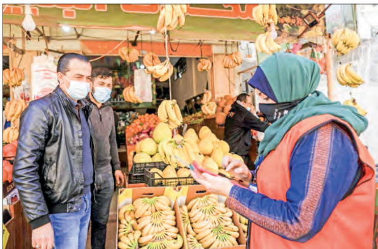
Palestinians at a market in Gaza city.

It said that bandwidth was limited to 2G in Gaza and to 3G in the West Bank, at a time when Israel is moving towards 5G.—AFP ■