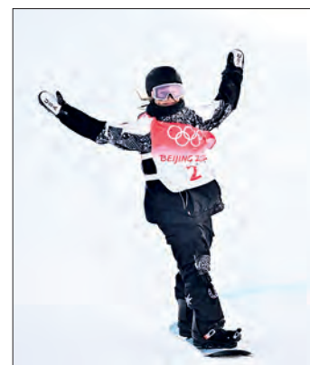
USA's Chloe Kim celebrates as she wins snowboard women's halfpipe.

The American sensation overcame a "mental battle" to successfully defend her Olympic title, virtually guaranteeing herself the gold with a scorching-hot start.