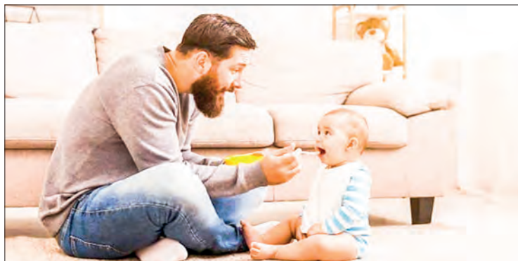
Data released from a government survey on Tuesday has shown that more and more Australian employers are offering paid parental leave to both parents, indicating a gradual shift away from traditional parenting roles.

dridge said the move would have far-reaching benefits for families