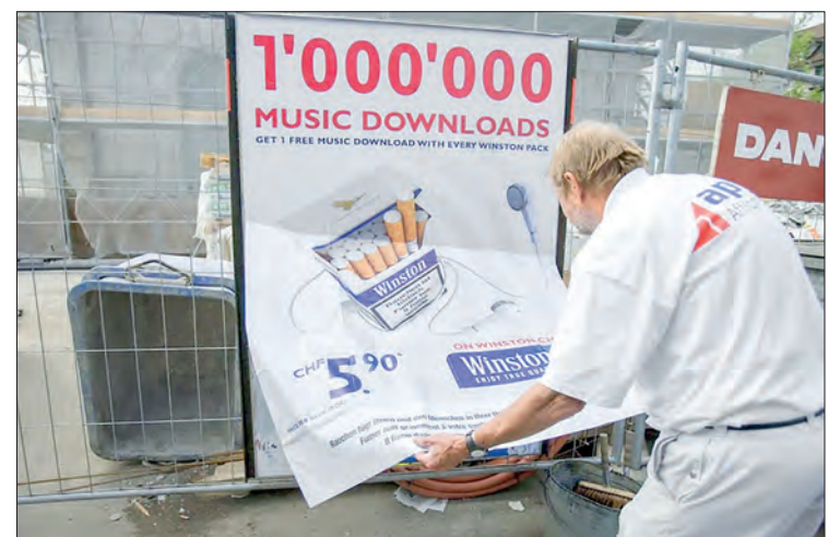
Poster advertising of tobacco products and e-cigarettes that can be seen from public places—for example, here in Zurich—will be banned.

Recent polls indicate a significant majority of voters favour the initiative, which in practice