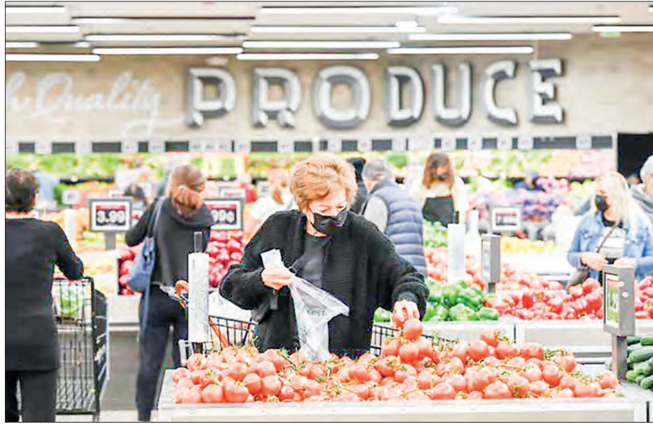
While the price increases were particularly severe for used cars and energy, particularly gasoline, they also hit items like food and rent.

AN upcoming government consumer price report will likely show another lofty spike in US inflation in the first month of the year, the White House warned on Wednesday.