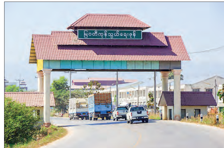
Myawady trade zone.

Myanmar primarily exports corn, natural gas, fishery products, coal, tin concentrate (SN 71.58 per cent), coconut (fresh and dry), beans, and bamboo shoots to Thailand. It imports capital goods such as machinery, raw industrial goods such as cement and fertilizers, consumer goods such as cosmetics and food products from the neighbouring country. — KK/GNLM