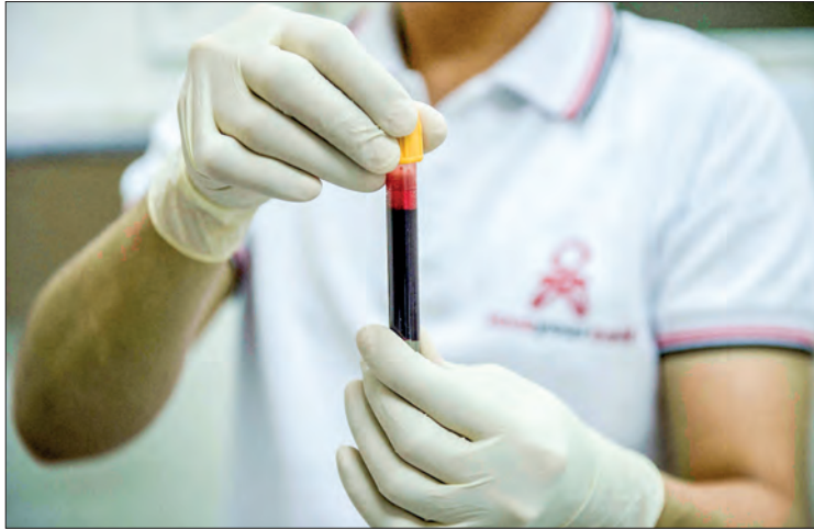
A hospital worker holds up a blood sample that will be screened for the HIV virus which causes AIDS.

OXFORD researchers have found in the Netherlands a highly virulent strain of HIV, the disease which infects white blood cells, like the one seen in the National Institute of Health handout—National Institutes of Health.