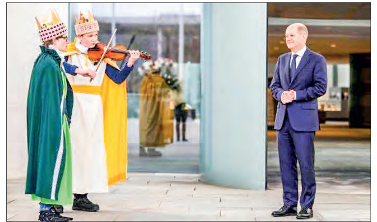
German Chancellor Olaf Scholz during the Epiphany celebration in front of the Chancellery in Berlin on 5 January 2022.

Scholz himself, feted for winning the September 26 election with a campaign that played on his calm demeanour and meticulous approach, is also seeing his popularity wane.