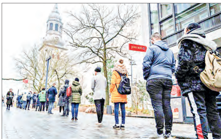
People queue at a coronavirus test centre in Aalborg, Denmark.

that it has not been "as rapid as the case incidence rate, and overall, admissions to intensive care have not increased significantly." "It is possible to respond to new variants that will inevitably emerge — without re-installing the kind of disruptive measures we needed before," said the WHO official.—AFP ■