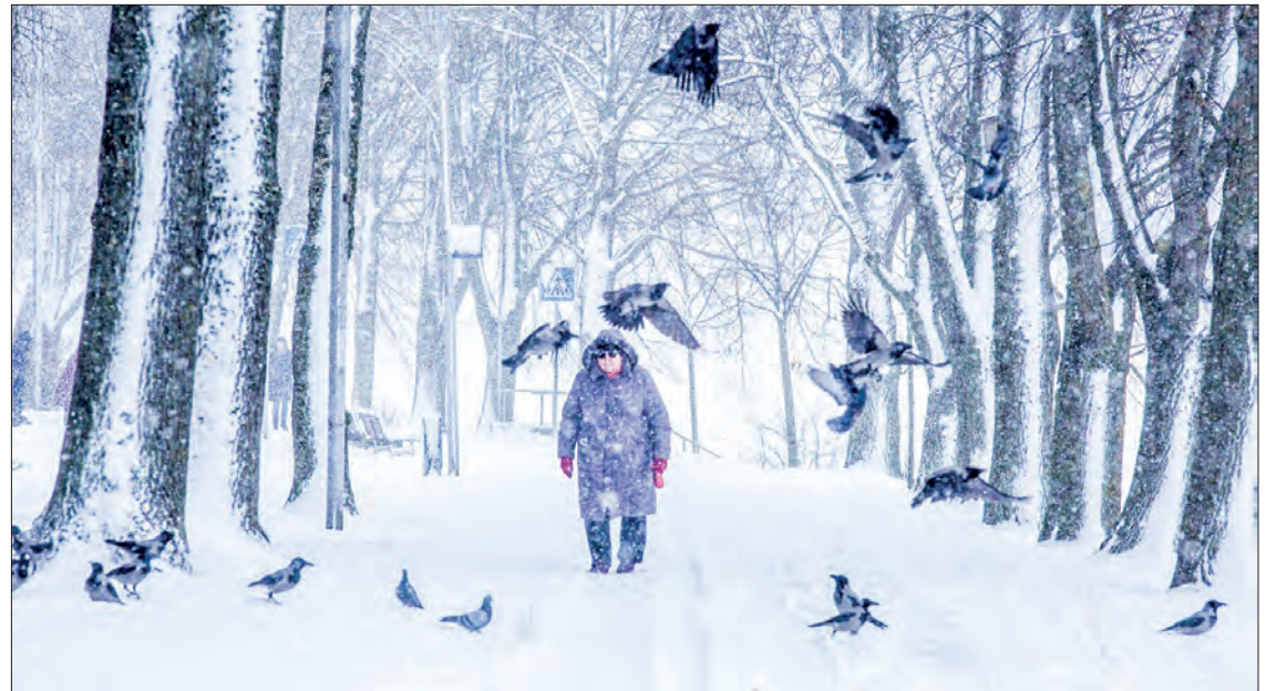
Dozens died amid devastating floods triggered by heavy rainfall across parts of western Germany and Belgium, as the search continued for hundreds of people still unaccounted for. Cars piled up by the floods at a roundabout in Verviers, Belgium, 15 July 2021.

EXTREME weather events such as heatwaves and floods have cost Europe almost 510 billion euros and around 142,000 lives over the past 40 years, according to a new report published Thursday (3 February).