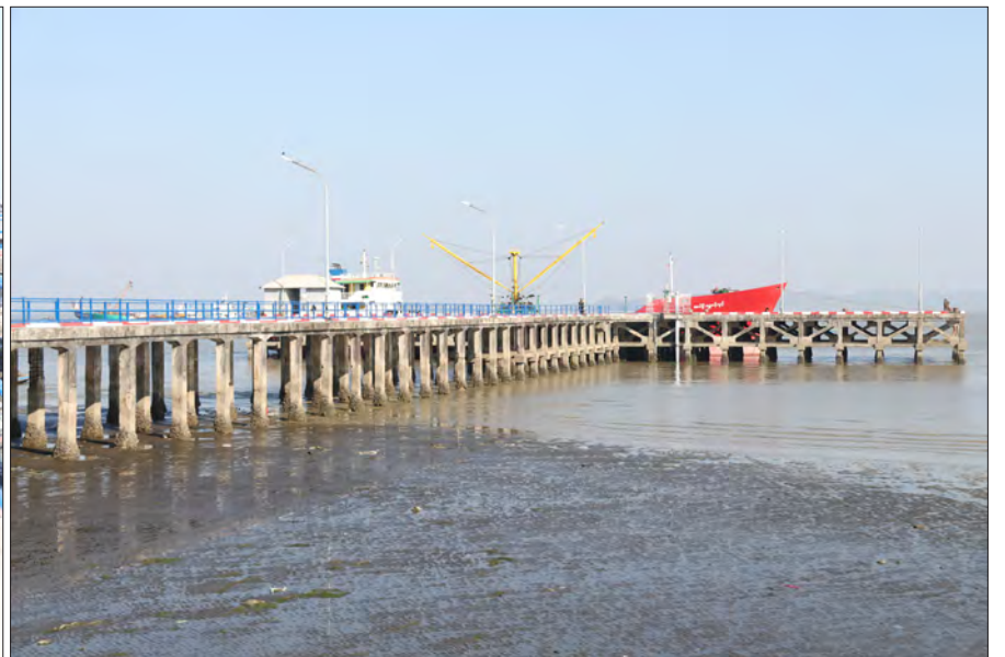
MoTC Union Minister Admiral Tin Aung San and the SAC members pay inspection tours around Sittway Township on 4 February 2022.

garding the cooperation work among departments, COVID-19 preventive measures, saving the consumption of fuel and electric-ity and clean and tidy processes. He then inspected the Phaungtawgyi Jetty of the Myanma Port Authority.