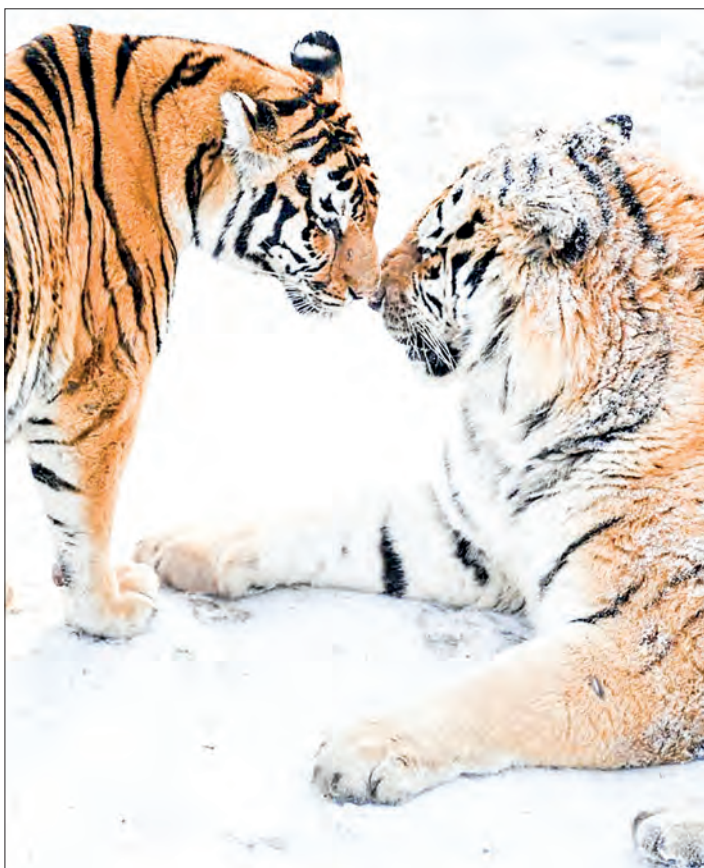
Siberian tigers frolic at the Siberian Tiger Park in Changchun City, capital of northeast China’s Jilin Province, 13 January 2022.