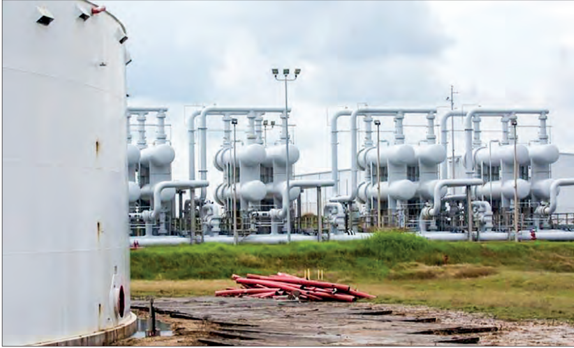
Japan is weighing an option to divert part of its natural gas reserves to Europe in case Russia restricts gas supplies to the region in response to projected sanctions following a Russian invasion of Ukraine.

JAPAN is weighing an option to divert part of its natural gas reserves to Europe in case Russia restricts gas supplies to the region in response to projected sanctions following a Russian invasion of Ukraine, government sources said Thursday.