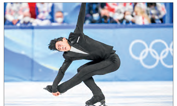
Nathan Chen gave the US an early lead in the team figure skating competition at the 2022 Winter Olympics with a cool, clean short programme.

THE United States took the lead and host China saw its chance of qualifying for the free skate, as the figure skating team event got underway here in the Capital Indoor Stadium on Friday at the Beijing 2022 Olympic Winter Games. Three-time world champion Nathan Chen and veteran ice dancing couple Madison Hubbell/Zachary Donohue both finished on top in their respective short programmes. Their fellow Americans Alexa Knierim/Brandon Frazier finished third in the pairs to secure the US a leading position with the score of 28 points. Olympic athletes from Russia were ranked second with 26 points, with reigning pairs world champions Anastasia Mishina/Aleksandr Galliamov and ice dancers Victoria Sinitsina/Nikita Katsalapov both on the second and Mark Kondratyuk third in the men's singles. Thanks to medal hopeful Sui Wenjing/Han Cong's top-class performance, China edged onto the third place with 21 points, beating Japan into fourth by one point, though Olympic silver medalist Shoma Uno landed a nearly perfect short programme to finish second.—Xinhua ■