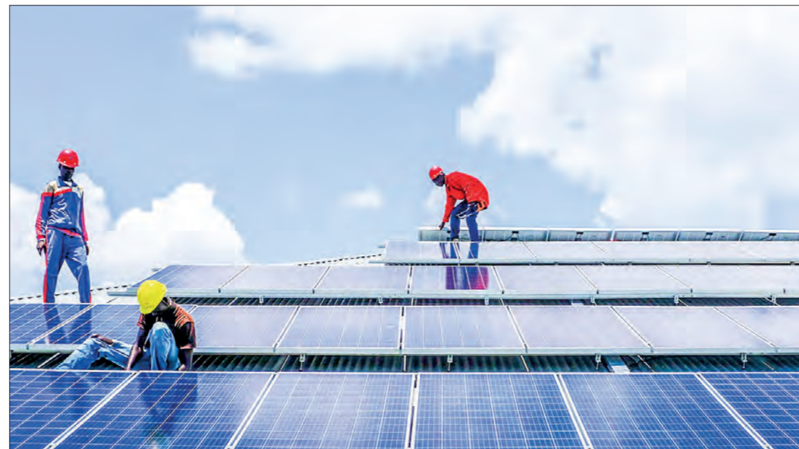
The Sustainable Development Goals (SDGs), also known as the Global Goals, were adopted by the United Nations in 2015 as a universal call to action to end poverty, protect the planet, and ensure that by 2030 all people enjoy peace and prosperity.

be strengthened and global financial systems rejigged to ensure that all countries have the fiscal space needed to invest in their people.