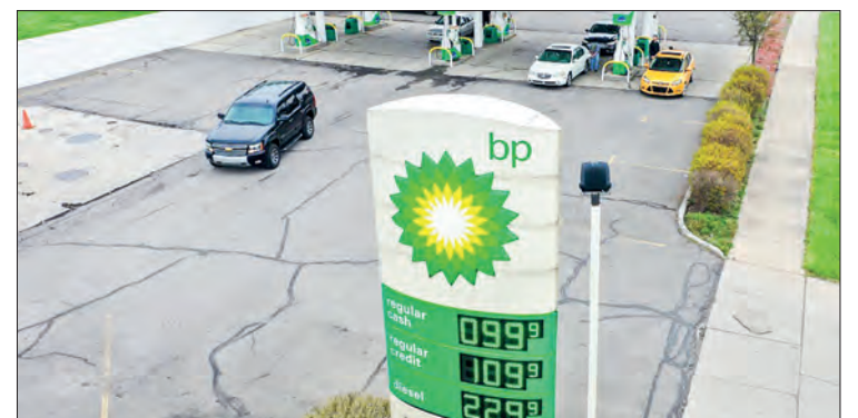
A BP gas station.

30-year high in December and more costly household bills are further stoking fears about a cost-of-living squeeze, with government tax rises looming.