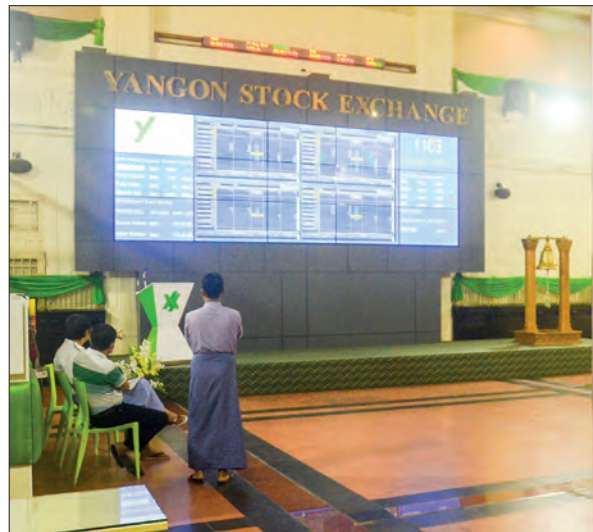
Myanmar stock market index at the Yangon Bourse.

A total of 61,435 shares by seven listed companies were traded on the Yangon Stock Exchange (YSX) in January 2022, with an estimated value of K282 million, according to the monthly report of the YSX.