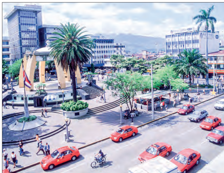
Costa Rica is a rugged, rainforested Central American country with coastlines on the Caribbean and Pacific. Though its capital, San Jose, is home to cultural institutions.

It saw a political shift in 2014, when the two rightwing parties that had shared power since the 1960s — the PLN and PUSC — suffered an historic defeat as centrist Luis Guillermo Solis was elected president.—AFP ■