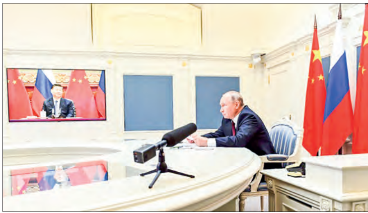
Russian President Vladimir Putin holds a meeting via video conference with Chinese President Xi Jinping at the Kremlin in Moscow on June 28 2021.

Xi and Putin will meet in the Chinese capital before their nations release a joint statement