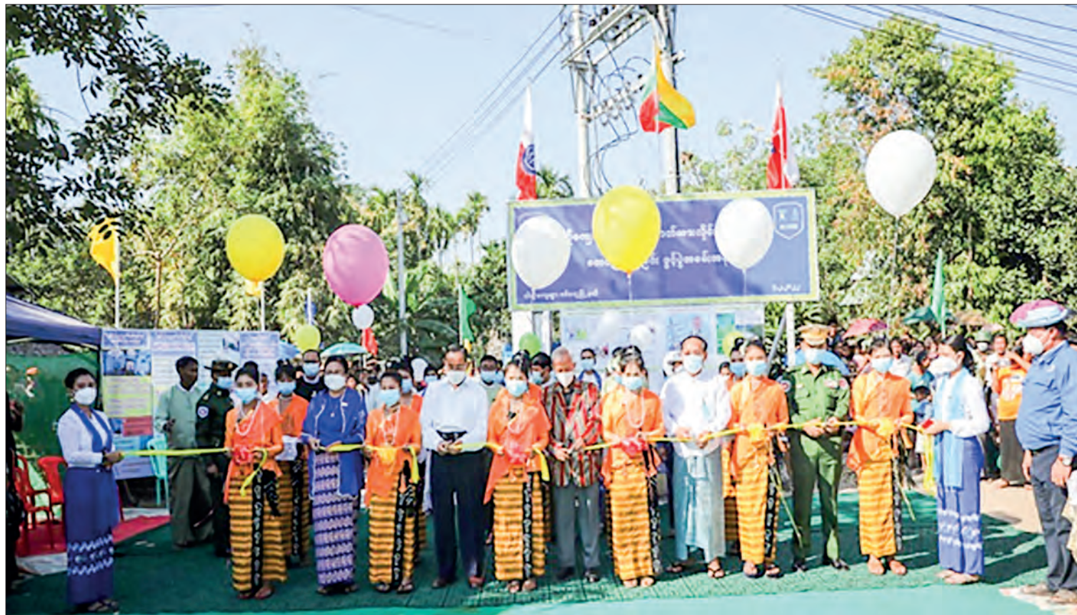
Dignitaries cut the ceremonial ribbon to initiate power distribution from the National Grid in Wabo Village of Sittway Township, Rakhine State.

khine State, 2,246 villages, about 60 per cent of the village, have access to electricity through