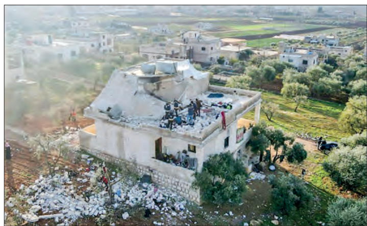
A Syrian civil defence team surveys the damage to a two-storey house on the outskirts of the rebel-held town of Atme that appears to have been one of the main targets of the US raid.

US special forces hunted down high-ranking jihadists in a rare airborne raid in northwestern Syria on Thursday, killing 13 people in an operation the Pentagon described as "successful".