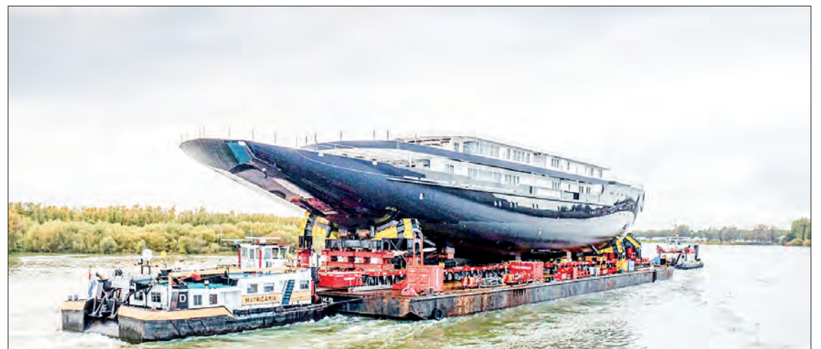
Bezos's gigantic, 430-million-euro ($485 million) three-masted yacht — built in Alblasserdam near Rotterdam — is too big to pass under the bridge, which dates from 1878 and was rebuilt after being bombed by the Nazis in 1940 during World War II.

His remarks in Colombia, where he is on a visit, were confirmed by his spokesperson to Dutch news agency ANP.—AFP ■