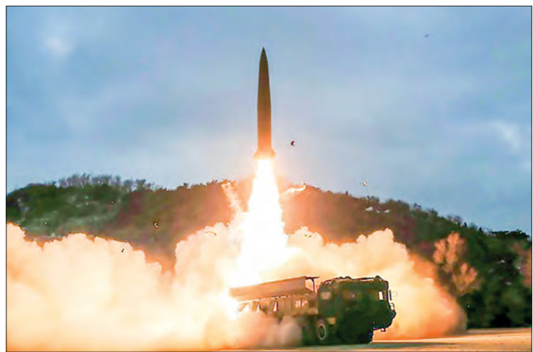
A barrage of January missile tests by North Korea forced Beijing to block a US push for new sanctions on Pyongyang.

NORTH Korea sent "warm congratulations" Friday to ally Chi-