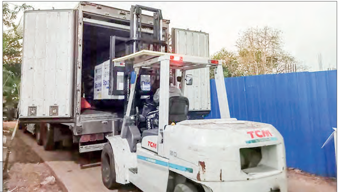
Covid-19 vaccines are loaded onto the Cold Chain Delivery Logistics vehicle.

Authorities from each township have received all the vaccines and the vaccines will be distributed to the public as soon as possible as per the target population groups, officials added. — MNA