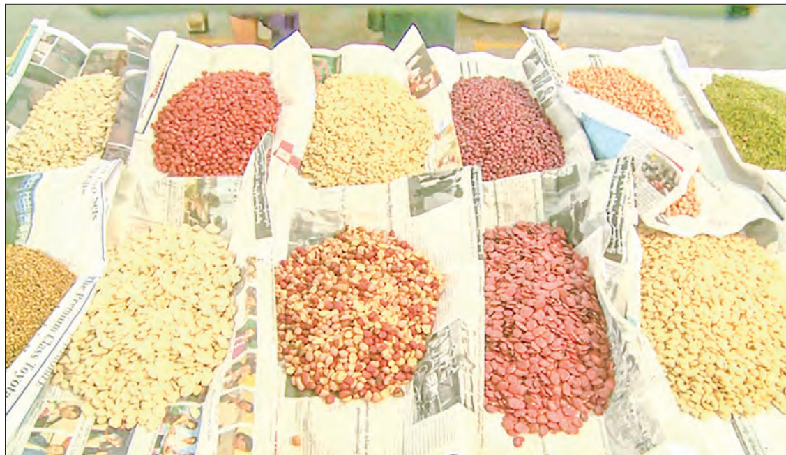
The bean has started flowing into the market since January. It fetched only K60,000 per three-basket bag in the corresponding period last year. At present, the foreign demand drives up the price to double (K120,000 per bag).

The rice beans are primarily cultivated in the alluvial soil of Ayeyawady River, Dokhtawady River and Chindwin River valley. — Min Htet Aung (Mandalay Sub-Printing House)/GNLM