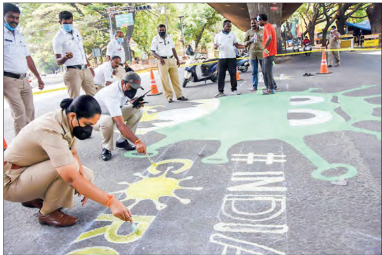
Indian police participate in awareness campaign by drawing large graffiti of coronavirus at all traffic junctions urging people to cooperate with the Indian government-imposed nationwide lockdown as a preventive measure against the COVID-19 coronavirus in Bangalore, India, 3 April 2020.

INDIA'S official death toll from Covid-19 crossed 500,000 on Friday, even as many experts flag