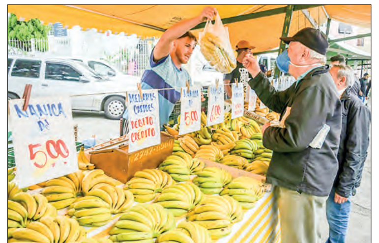
Brazil has hiked its benchmark interest rate to 10.75 per cent, bringing it into double digits for the first time in nearly five years to fight rampant inflation.

The last time the Selic rate was in the double digits was in May 2017. Brazil’s inflation rate came in at 10.06 per cent for 2021, crashing through policymakers’ target range — currently 3.5 per cent, plus or minus 1.5 percentage points.—AFP ■