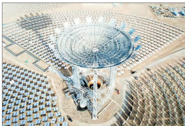
Aerial photo taken on 8 December 2021 shows a molten-salt solar thermal power plant in Yumen City, northwest China's Gansu Province.

Last year, the electricity generated by new energy