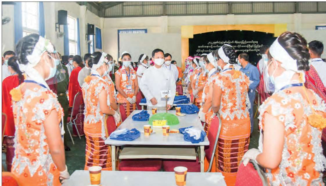
Ethnic cultural delegates are cordially welcomed at Nay Pyi Taw on 4 February.