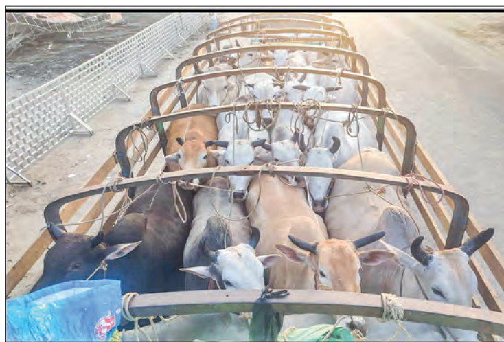
Seized cattle, tyres and consumer goods.

Similarly, Bago Region Forest Department seized 1.2040 tonnes of illegal teak worth of K180,600 in the forest reserve of