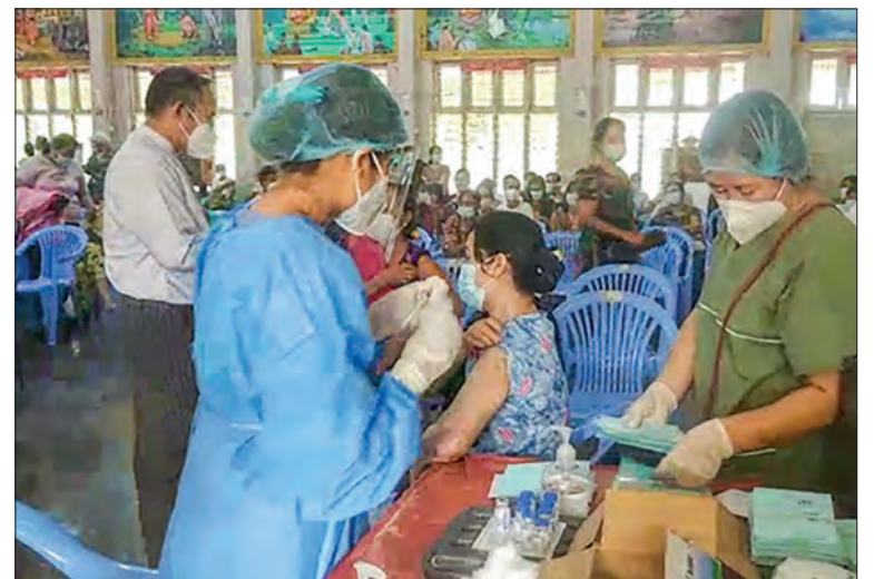
Locals get inoculated against Covid-19 in Mon State.

It is reported that officials from the respective Military Commands visited the sites and coordinated the necessary work.—MNA