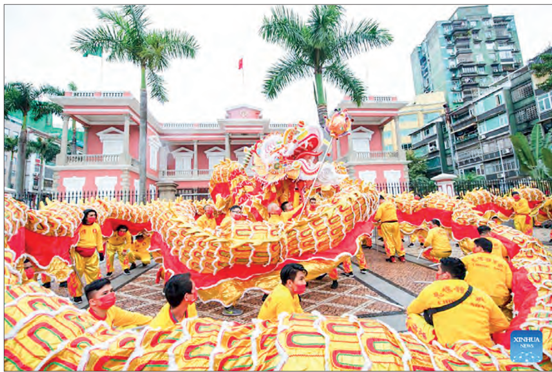
People perform dragon dance to celebrate the Chinese Lunar New Year in Macao, south China, 1 February 2022.

Local authorities should not take a simplistic approach to COVID-19 containment by applying a one-size-fits-all policy, nor should they add excessive restrictions, according to the NHC. This year's Spring Festival travel rush began on 17 January and will last until 25 February. To avoid the spread of COVID-19, free testing locations have been set up in hospitals and railway stations across the country to facilitate nucleic acid testing for travellers. The Third Hospital of Changsha in central China's Hunan Province began providing a 24-hour nucleic acid testing service on 19 January.—Xinhua ■