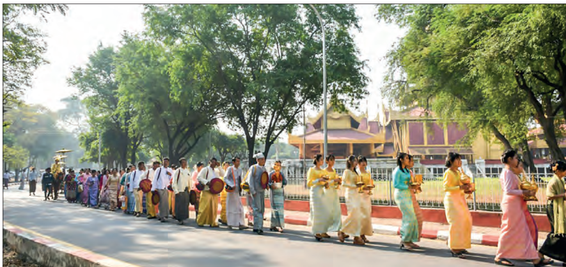
Myanmar traditional ordination and novitiation ceremony proceeding at Mya Nan San Kyaw Golden Palace.

cannon museum displaying various ancient cannons, King Mindon tomb and scale model, including Mya Nan San Kyaw Golden Palace. — MNA