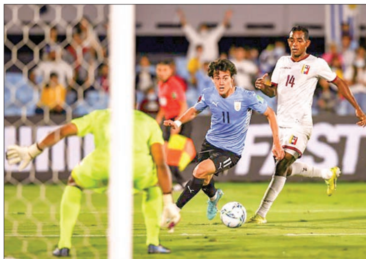
Uruguay's Facundo Pellistri (centre) played a starring role in only his second international match in the win over Venezuela.

Cavani, who had a second half goal ruled out for offside, all but sealed the victory in first half stoppage time with an opportunistic overhead kick from six yards out as Uruguay's players were lining up to finish off their weary opponents.—AFP ■