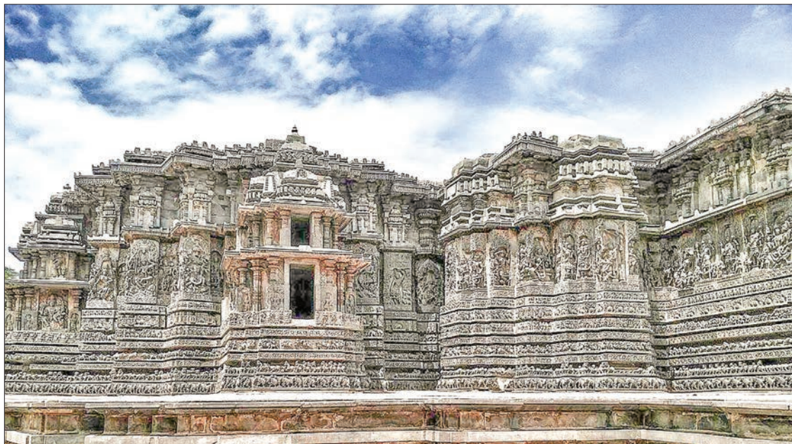
Hoysala Temples in Karnataka as India's nomination for World Heritage List for 2022-2023.

THE Hoysala Temples of Belur, Halebid and Somnathapura in Karnataka have been finalized as India's nomination for consideration as World Heritage for the year 2022-2023, said the