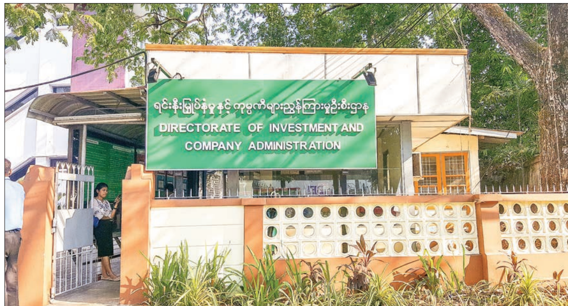
Under Section 266 (A) of the Myanmar Companies Law 2017, public companies must submit annual returns and financial statements (G-5) simultaneously.

In addition, all registered companies need to file annual returns (AR) on the MyCO registry system within two months of incorporation, and at least once every year (not later than one