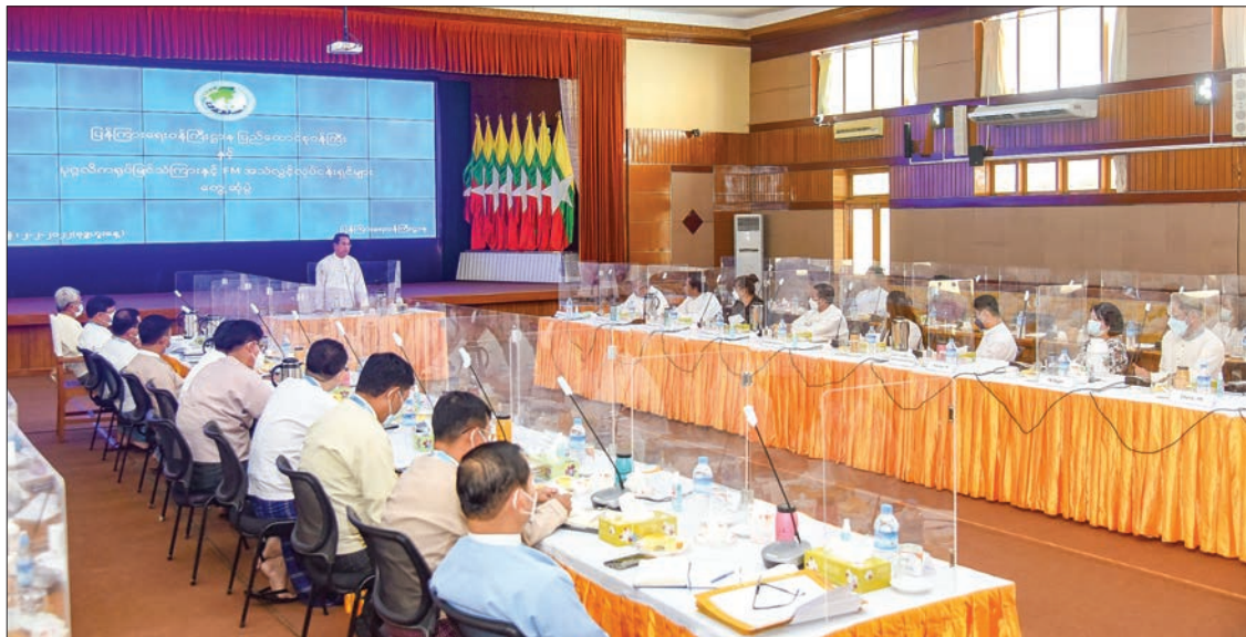
The meeting between the MoI Union minister and private broadcasting entrepreneurs in progress.

UNION Minister for Information U Maung Maung Ohn met private television and FM broadcasters yesterday afternoon in Nay Pyi Taw. The meeting was also attended by