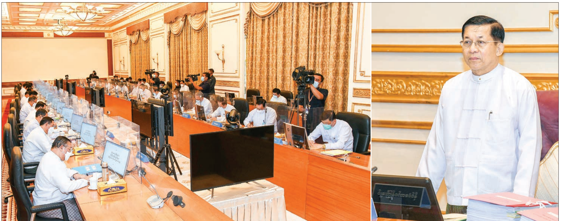
State Administration Council Chairman Prime Minister Senior General Min Aung Hlaing addresses the meeting 1/2022 of the Union Government of the Republic of the Union of Myanmar in Nay Pyi Taw on 2 February 2022.

M INISTRIES need to strive to efficiently utilize water sources in agriculture and livestock tasks, said Chairman of the State Administration Council Prime Minister Senior General Min Aung Hlaing at the meeting 1/2022 of the Union Government of the Republic of the Union of Myanmar at the office of SAC Chairman in Nay Pyi Taw yesterday morning.