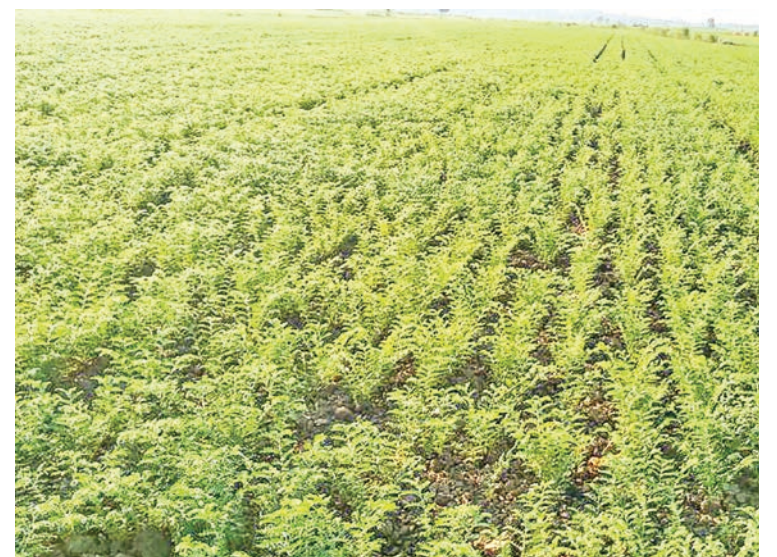
There are over 30,000 acres of winter chickpea plantation in ChaungU Township.

"The department is providing the high-quality seeds to farmers for accessing high-quality chickpea. The growers are also allowed to use only Boron and Borax to help germ-free and yield good quality crops. Likewise, the department staff are sharing the method that how to make natural antibiotics," she clarified. — Lu Lay/GNLM