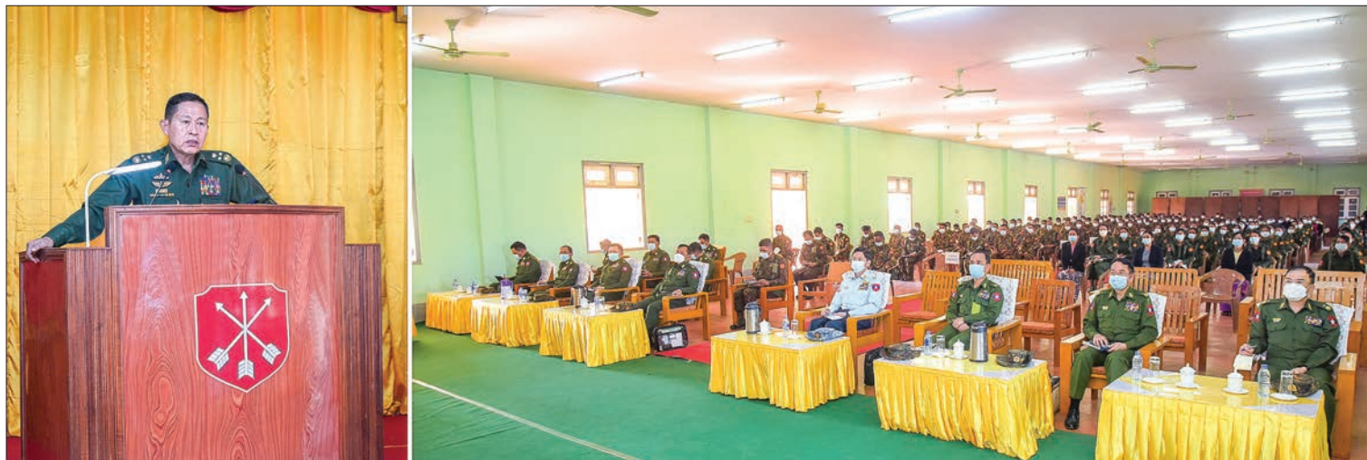
Vice-Chairman of the State Administration Council Deputy Commander-in-Chief of Defence Services Vice-Senior General Soe Win addresses the meeting with Tatmadaw members and families of Pruhsa Station yesterday.

AS the Tatmadaw formed with all ethnic nationals is a strong organization, it needs to carry on its tasks through unity, said Vice-Chairman of the State Administration Council Deputy Commander-in-Chief of Defence Services Commander-in-Chief (Army) Vice-Senior General Soe Win in meeting with Tatmadaw members and families of Pasawng, Bawlakhe and Pruhsa