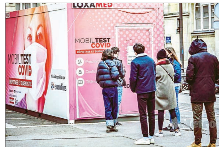
Patients wait to be tested for the novel coronavirus Covid-19 in Paris on 23 December 2021.

Motto of 75 th Anniversary Union Day 2022