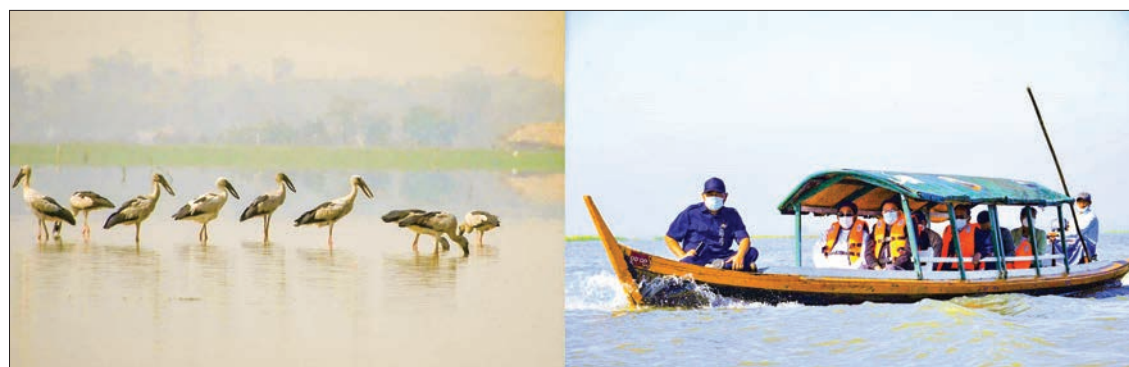
Additionally, to protect migratory birds from hunting, awareness of migratory birds will be implemented as well. Those who tip-off regarding bird hunts will be awarded.

gered species such as sarus crane, the greater spotted eagle, Myanmar Eyed Turtle are found in Moeyungyi Wetlands, along with over 20,000 water birds. This wetland constitutes a part of the northern paintail habitat.