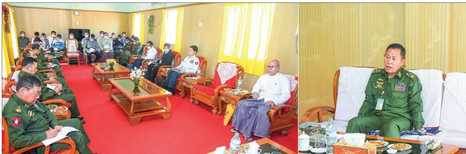
State Administration Council Vice-Chair Deputy Commander-in-Chief of Defence Services Vice-Senior General Soe Win meets departmental officials and town elders of Bawlakhe Township in Kayah State on 2 February 2022.

During the meeting, the Vice-Senior General said the SAC overcame many challenges during the one-year term of the State of Emergency. Some government employees joined CDM without thinking of the country and the government tried hard with good employees who do not want terrorist attacks. Despite various internal and external pressures, it has passed successfully with public participation. The great challenge is COVID-19 prevention, control and treatment measures. Some countries and INGOs once said that Myanmar would have to give up on the pandemic. The