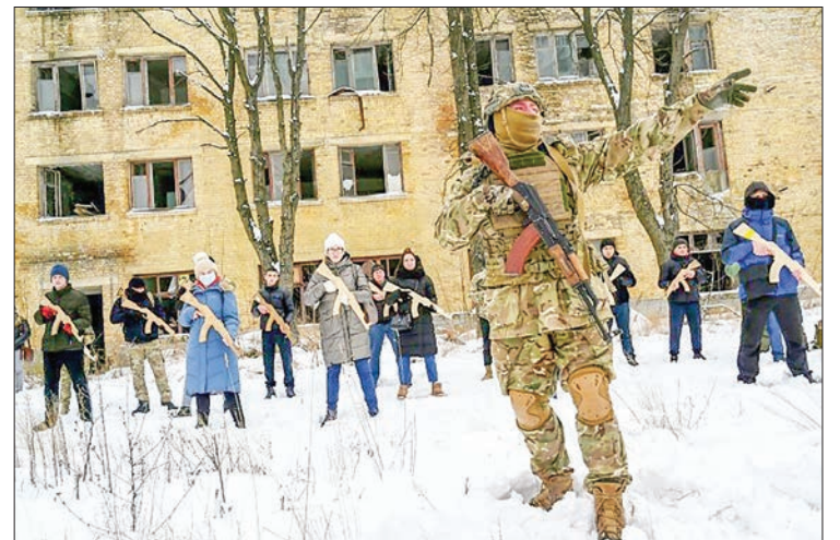
A military instructor teaches civilians holding wooden replicas of Kalashnikov rifles in the Ukrainian capital Kyiv.

Russian Foreign Minister Sergei Lavrov and US Secretary of State Antony Blinken will hold fresh telephone talks on Ukraine Tuesday. Tensions between the two countries have skyrocketed in recent weeks as the US accuses Moscow of planning an imminent invasion of Ukraine. The White House said Monday that it is ready to impose sanctions on President Vladimir Putin's "inner circle" if an attack on Ukraine