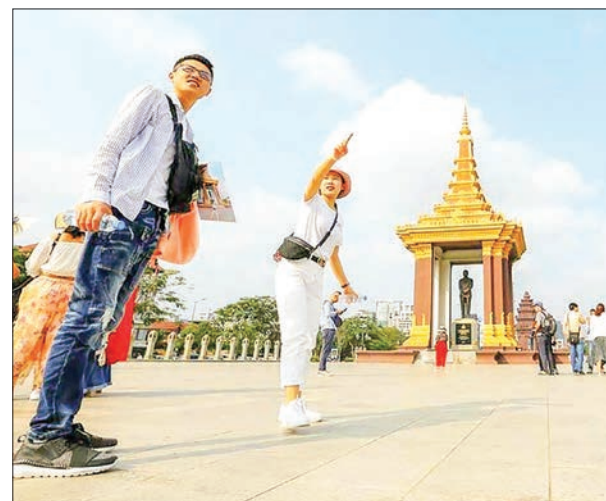
Tourism is one of the four pillars supporting the kingdom's economy.

"With our quarantine-free policy, we're confident that tourists will