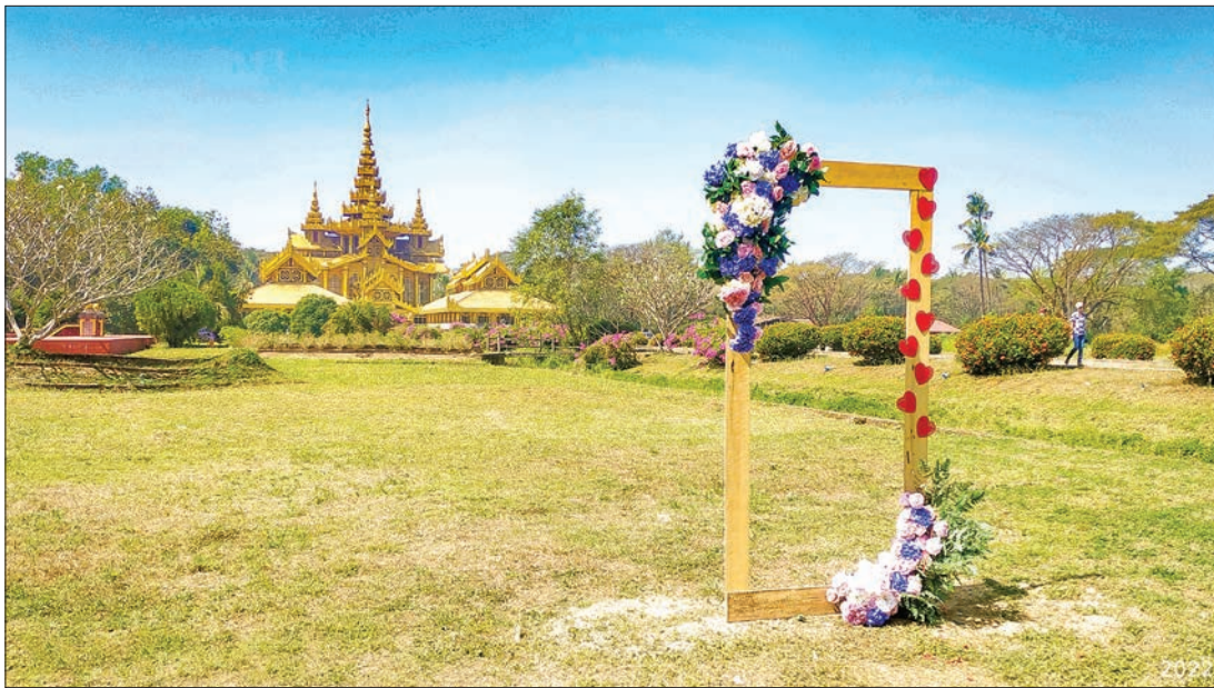
The Kanbawzathadi Golden Palace is pictured at the background.

ARRANGEMENTS are made for visitors to take souvenir photos at every occasion such as Christmas, in the background of Mingala Pond in Kanbawzathadi Golden Palace in Bago.