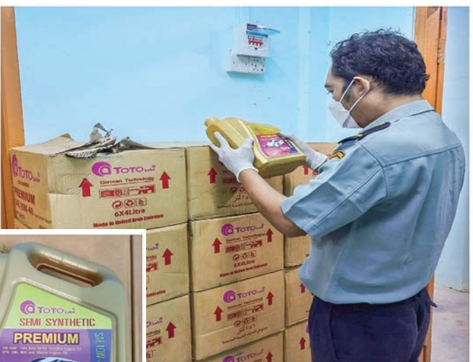
Confiscated teak and goods in Bago Region.