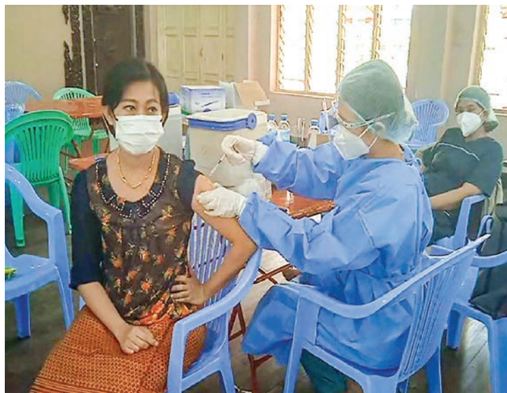
One of locals gets vaccinated against Covid-19 in Mon State.

It is reported that officials from the respective Military Commands visited the site and coordinated the necessary work.