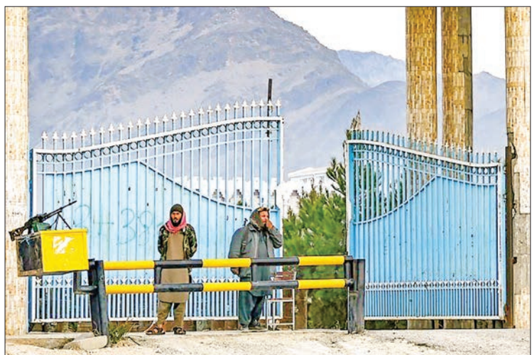
Taliban fighters stand guard at the main gate of Laghman University after classes resumed for the first time since the hardline Islamist group returned to power.

SOME public universities opened in Afghanistan Wednesday for the first time since the Taliban seized power in August, with a trickle of women attending classes that officials said would be segregated by sex.