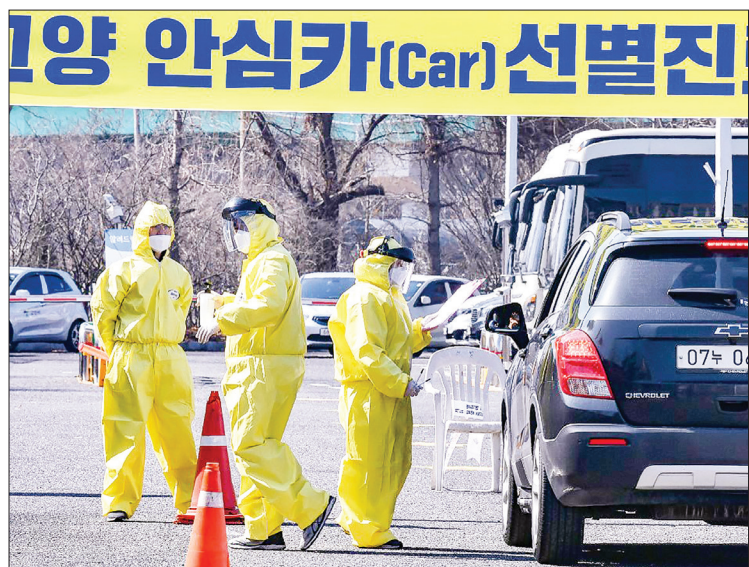
Medical members guide a driver with suspected symptoms of the COVID-19 coronavirus, at a "drive-through" virus test facility in Goyang, north of Seoul, on 29 February 2020.

SOUTH Korea's daily number of COVID-19 cases hit a new record high, surpassing 18,000 amid spread of the Omicron variant of the virus, the health authorities said Tuesday.