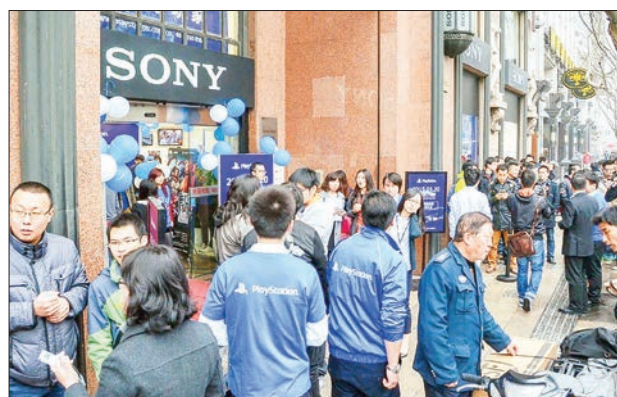
People wait for the launch of Sony's PlayStation 4 console in front of a Sony store in Shanghai on 20 March 2015.

generating gross revenue of 4.92 billion US dollars, according to the Ministry of Tourism. The country is famous for its three world heritage sites, namely the Angkor Archaeological Park, the Preah Vihear Temple and the Sambor Prei Kuk Archaeological Site.—Xinhua ■