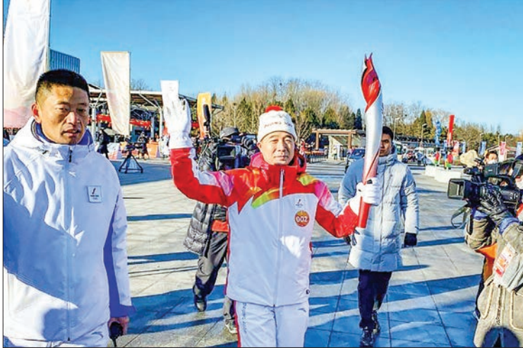
Chinese astronaut Jing Haipeng holds the Olympic torch.

THE torch relay for the 2022 Olympic Winter Games started here on Wednesday, just two days before the Games officially opens.