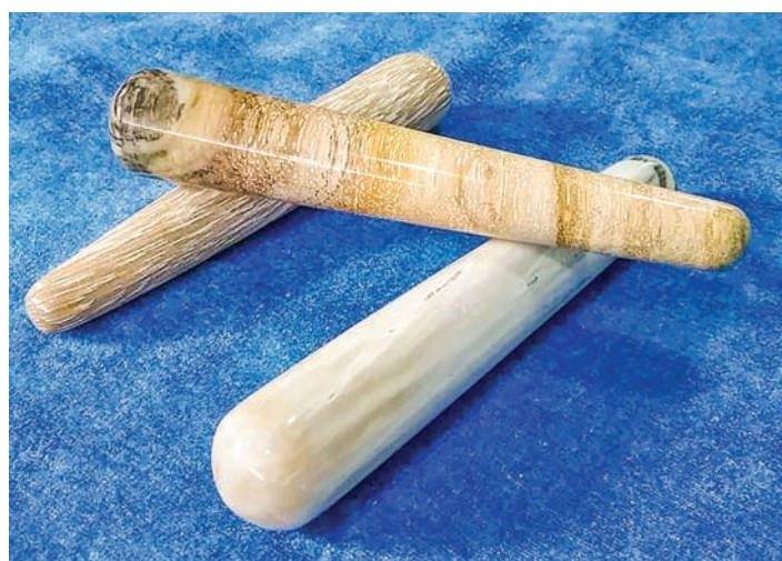
Massaging sticks made out of petrified wood.

THE transactions of the charms, decoration materials and utensils made of petrified wood (Ingyin Kyauk) operate normally online in Sagaing Re-