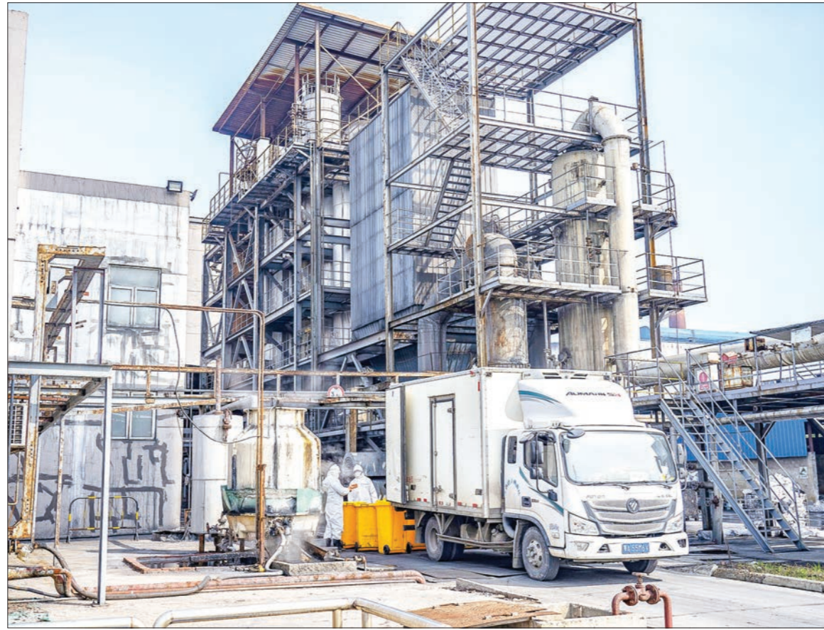
On 4 March 2020, workers handle medical waste at Wuhan Beihu Yunfeng Environmental Protection Technology Co. Ltd., which was converted from handling industrial hazardous waste to medical waste after the coronavirus outbreak in Wuhan in Hubei Province.

The analysis points out that over 140 million test kits, with a