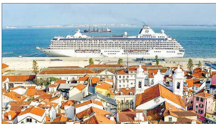
A new port for cruise ships in Lisbon is bringing record numbers of tourists to Portugal's capital. Port of Lisbon is a popular cruise destination and turnaround port for a cruise ship in 2018.

TOURIST accommodation recorded 14.5 million guests and 37.5 million overnight stays in 2021, corresponding to increases of 39.4% and 45.2%, according to preliminary data from Statistics Portugal (INE), released on Monday.