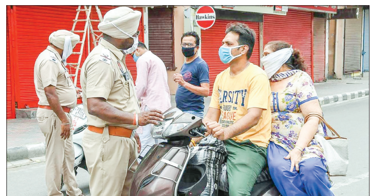
India's COVID-19 tally rose to 41,469,499 on Tuesday, as 167,059 new cases were registered during the past 24 hours across the country, showed the federal health ministry's latest data.

There are still 1,743,059 active COVID-19 cases in the country, despite a fall of 88,209 active cases during the past 24 hours. This was the eighth consecutive day when the number of active cases declined in the country.—Xinhua ■