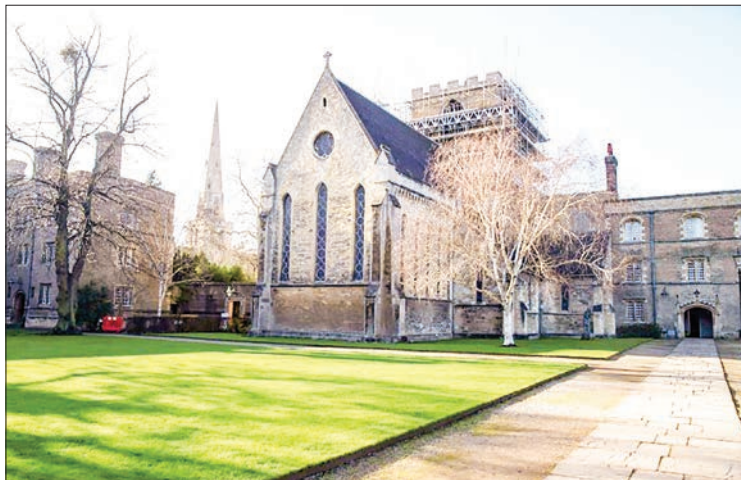
Jesus College in 2021 handed back a Benin Bronze sculpture of a cockerel to a Nigerian delegation.

Rustat, a courtier to King Charles II, was also an investor