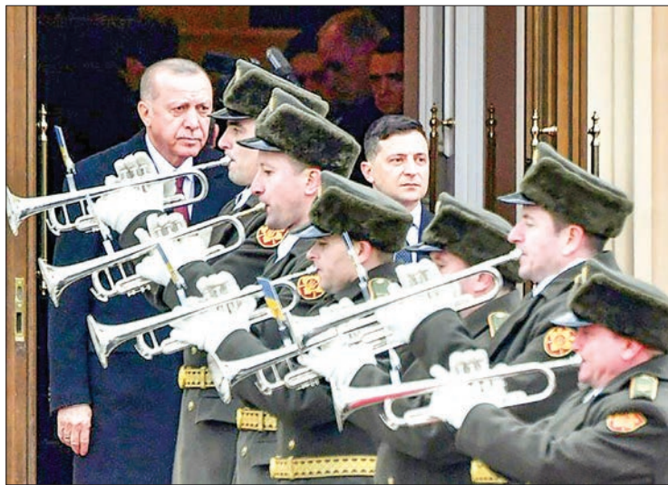
Turkish President Recep Tayyip Erdogan has pledged support for his Ukrainian counterpart Volodymyr Zelensky in the face of simmering tensions with Moscow.

But analysts think success in averting a Russian invasion could highlight Turkey's importance to the Western defence alliance and warm Erdogan's chilly relations with US President Joe Biden. "This is an opportunity for