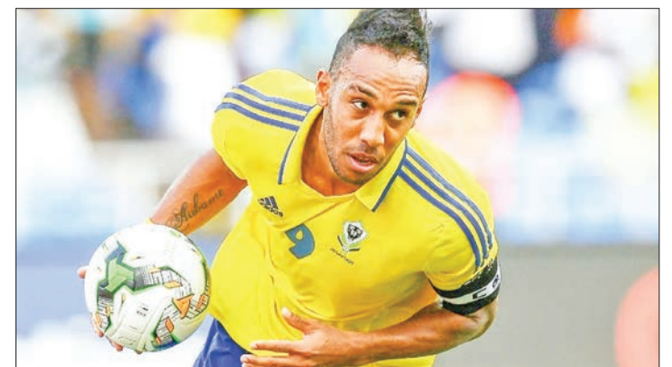
Pierre-Emerick Aubameyang has left Arsenal.

PIERRE-EMERICK Aubameyang has left Arsenal, the club announced on Tuesday, clearing the way for the striker to sign for Barcelona as a free agent. The 32-year-old former Gunners captain was visible in pictures from Barcelona training posted on social media on Tuesday.