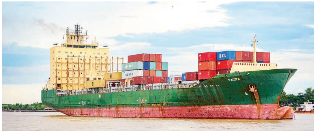
Myanmar exports agricultural products, animal products, minerals, forest products, and finished industrial goods, while it imports capital goods, raw industrial materials, and consumer goods.

MYANMAR'S lower import as of 21 January in the current six-month mini-budget period (Oct 2021-Mar 2022) resulted in a positive trade balance of US$299 million, according to data provided by the Ministry of Commerce.