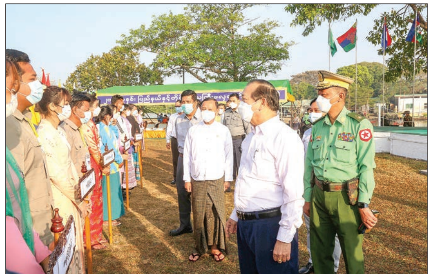
The Myanmar Rowing and Canoeing Federation holds traditional boat race 2022.

A total of 355 athletes from Nay Pyi Taw, Yangon, Mandalay, Sagaing, Bago, Taninthayi, Ayeyawady regions and Kachin, Kayin, Mon, Rakhine, Shan states will participate in the boat race. They will take place until 1 February in the evening and the award-giving ceremony will be held after the competition. — MNA