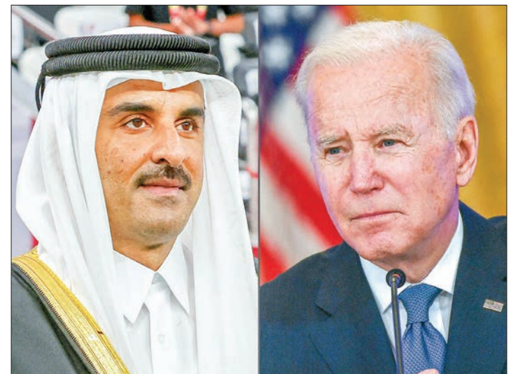
(COMBO) This combination of pictures created on 25 January 2022 shows Qatar’s Emir Sheikh Tamim bin Hamad al-Thani in the Qatari city of Al-Khor on 18 December 2021 and US President Joe Biden in the East room of the White House, in Washington, DC on 24 January 2022.

Qatar is one of the world’s biggest liquid natural gas exporters, along with the United States and Australia, and there are hopes in Washington and Europe that Doha can temporarily redirect exports destined for Asian markets. — AFP ■