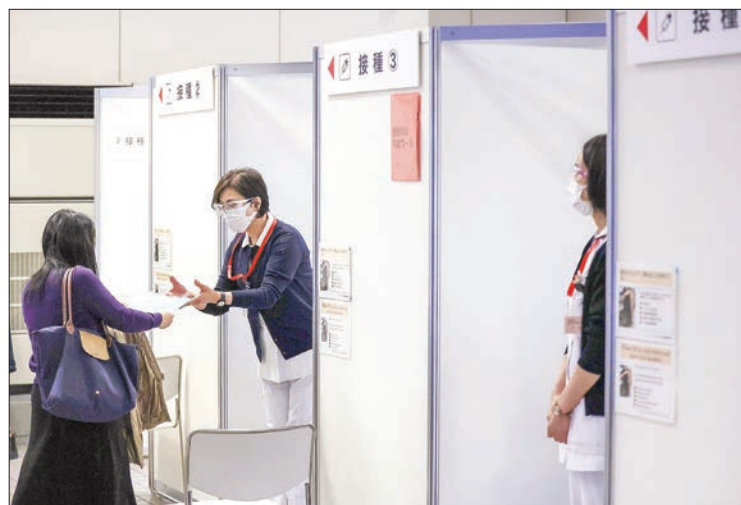
COVID-19 mass vaccinations operated by the Japan Self-Defence Forces begin at a facility in Tokyo's Otemachi business district on 31 January 2022, for people aged 18 or older getting their third shots.

The centre, however, is unlikely to contribute drastically to accelerating the pace of inoculations. Capacity is initially limited to 720 slots per day, much fewer than the 10,000 available at the same venue from May to November last year, with the malfunctioning of an elevator in the aging facility reducing available space to one floor. — Kyodo ■