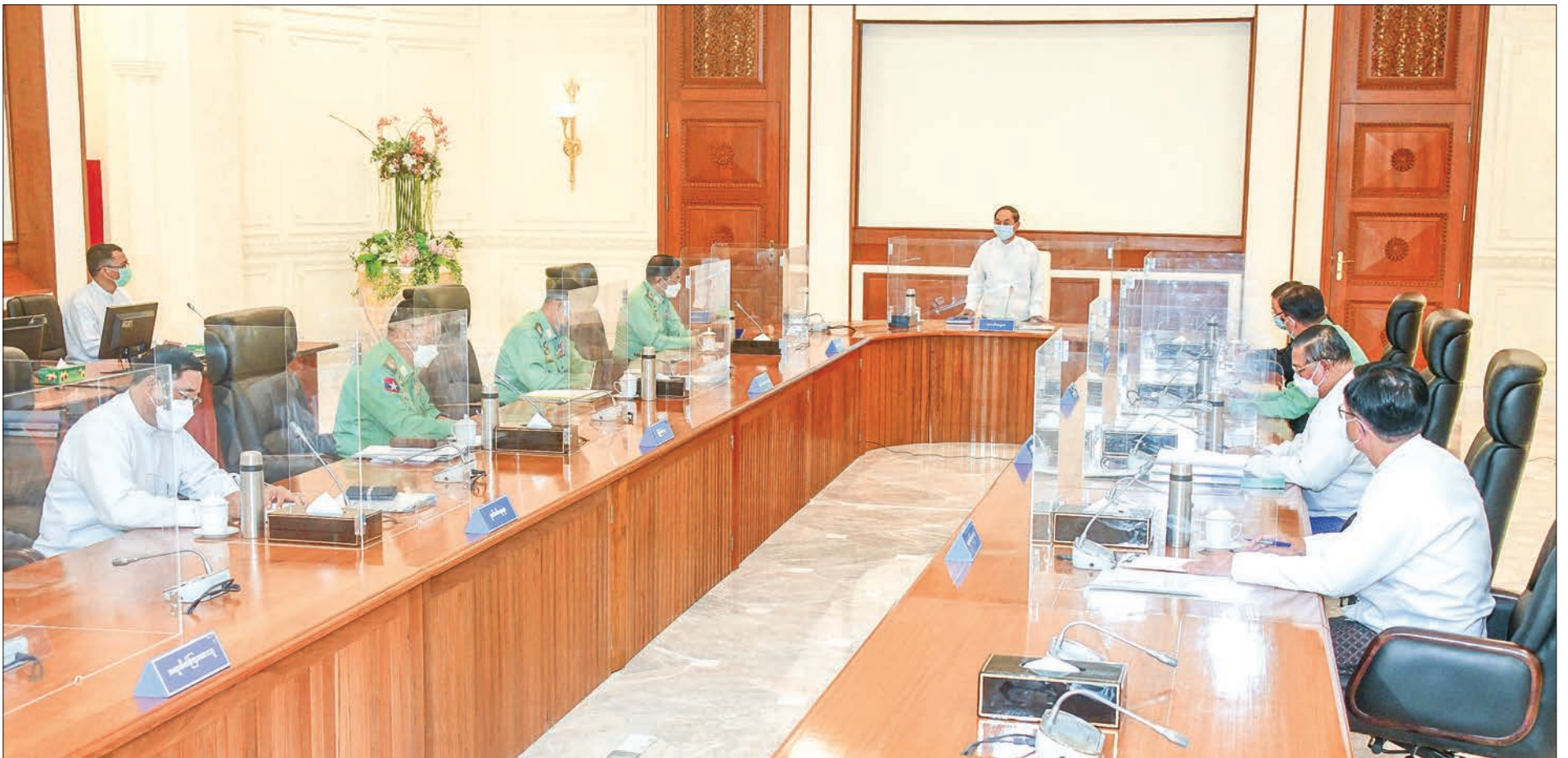
The meeting 1/2022 of the National Defence and Security Council of the Republic of the Union of Myanmar is convened in Nay Pyi Taw on 31 January 2022.

T HE National Defence and Security Council of the Republic of the Union of Myanmar held the meeting