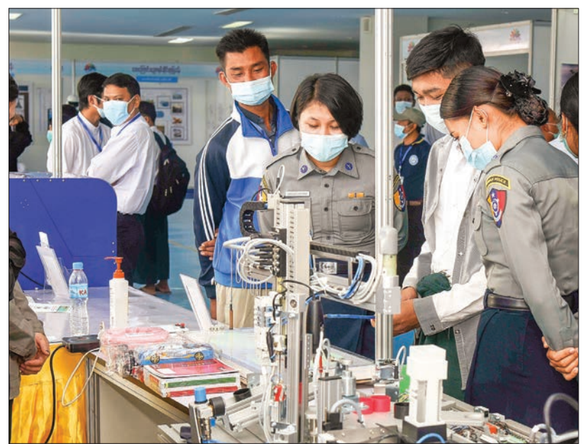
The exhibition booth of the Ministry of Science & Technology.