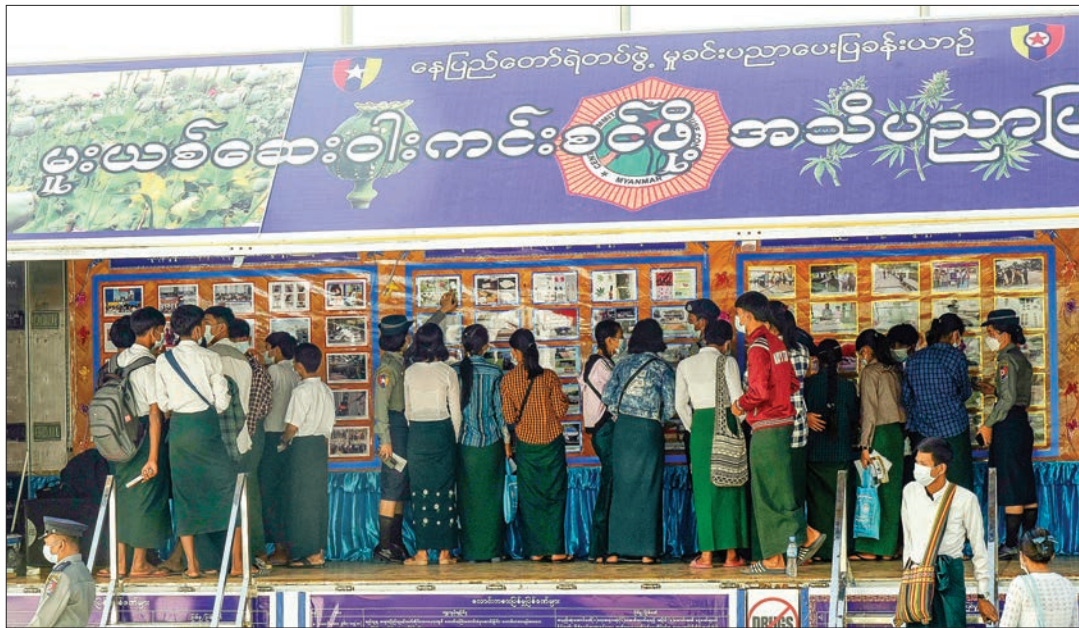
Drugs education booth.