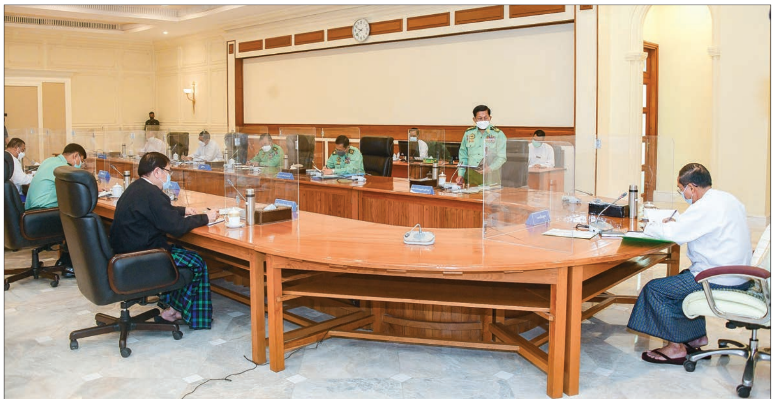
The Commander-in-Chief of Defence Services reports on the extending of the State of Emergency at the National Defence and Security Council meeting 1/2022 yesterday.

With regard to the State responsibilities taken by the Tatmadaw related to the political situation on one-year responsibilities of the State Administration Council, the Senior General said that the Commander-in-Chief of Defence Services expressed the wish to be a free and fair election related to the 2020 election for 24 times at the State level ceremonies, meeting with political parties, diplomats and international representatives and media as well as military families. At the election held on 8 November 2020, 10,482,116