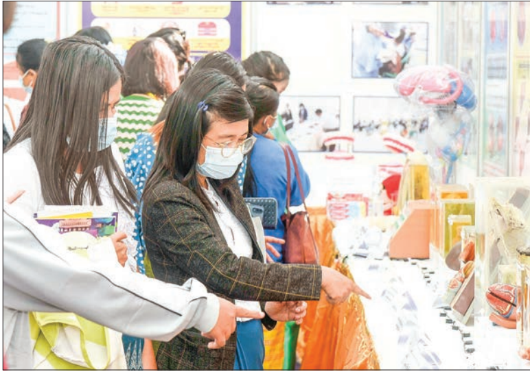
Youths are attentively viewing exhibits.

On the last day of the festival, booths featuring science and technology, aviation technology, marine technology and health awareness, literature, biography of famous writers, historical treaties, arts and galleries, awareness of COVID-19 pandemic and physical sporting activities exhibited by the Ministry of Information, the Ministry of Education, the Ministry of Science and Technology, the Ministry of Sports and Youth Affairs, the Ministry of Health, and the Ministry of Planning and Finance in each sector