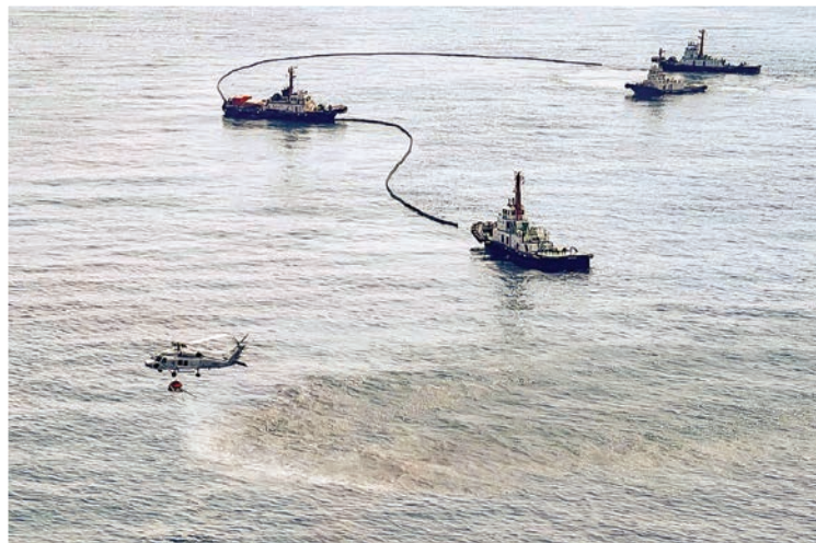
This handout from the Royal Thai Navy taken and released on 27 January 2022 shows the clean-up operation underway for a crude oil spill caused by a leak from an undersea pipeline owned by Star Petroleum Refining Public Company Limited in the Gulf of Thailand, near Rayong.

THE nightly armada of bobbing green lights from squid boats has all but disappeared near