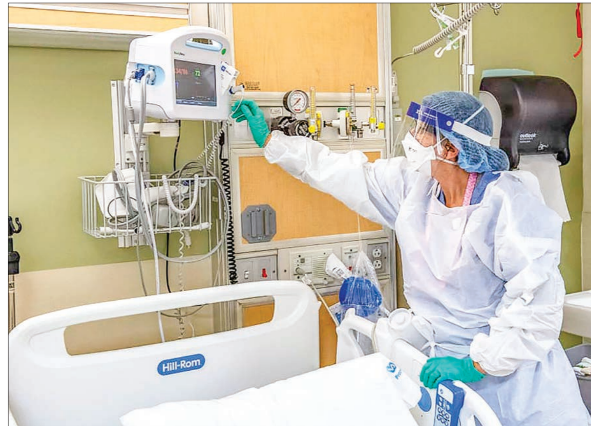
A recent study led by University at Buffalo has said that patients with COVID-19 in the intensive care unit (ICU) prescribed full-dose blood thinners were significantly more likely to experience heavy bleeding than patients prescribed a smaller yet equally effective dose.

Nearly 14 per cent of patients who received full-dose blood thinners experienced a significant bleeding event, compared to only 3 per cent of patients who received a higher-than-standard dosage. All patients who experienced bleeding events were mechanically ventilated. No difference was reported