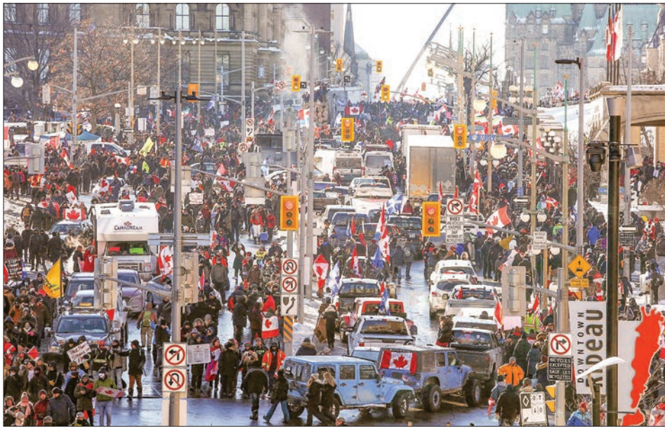
Supporters of the Freedom Convoy protest Covid-19 vaccine mandates and restrictions on 29 January 2022 in Ottawa, Canada. Hundreds of truckers drove their giant rigs into the Canadian capital Ottawa on Saturday as part of a self-titled "Freedom Convoy" to protest vaccine mandates required to cross the US border.

HERE are the latest developments in the coronavirus crisis: