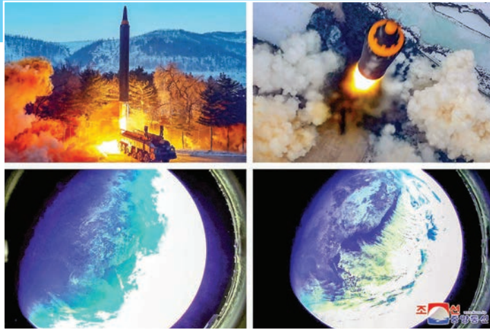
North Korea test-fires a Hwasong-12 "intermediate- and long-range ballistic missile" on 30 January 2022. Bottom section shows images of the earth taken from a camera installed on the warhead.

A senior Biden administration official said Washington shared the concern.