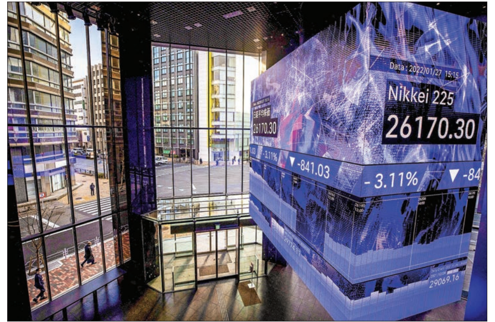
An electronic quotation board displays closing numbers of the Nikkei 225 index of the Tokyo Stock Exchange in Tokyo on 27 January 2022.

The recent selloff “marks a long overdue