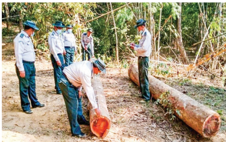
Seized teak logs.

UNDER the guidance of the Illegal Trade Eradication Steering Committee, the Customs officials inspected the cargo on vehicles at Mayanchaung checkpoint in Mon State on 31 January and seized two trucks loaded with illegal consumer goods and household electrical appliances worth K6.83 million. They are taking action under the Customs Law.