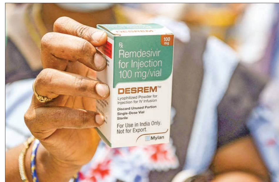
Remdesivir was originally developed for infectious viral diseases and is not yet licensed or approved anywhere to treat Covid-19.

T HE combination of remdesivir plus a highly concentrated solution of antibodies that neutralize SARS-CoV-2 is not more effective than remdesivir alone for treating adults hospitalised with COVID-19, according to recent research.