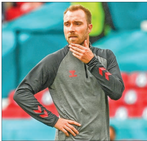
(FILES) In this file photograph taken on 12 June 2021, Denmark's midfielder Christian Eriksen warms up before the UEFA EURO 2020 Group B football match between Denmark and Finland at the Parken Stadium in Copenhagen.