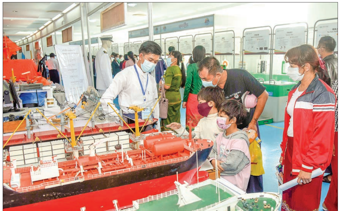
The exhibition booth of the Ministry of Transport and Communications.

In the afternoon, Union Minister U Maung Maung Ohn and