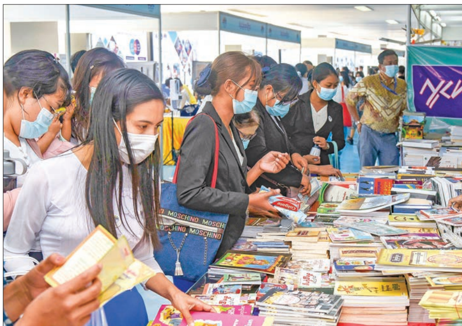
Youths throng at the Youth and Literature Festival.