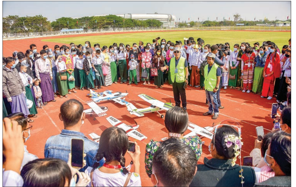
Miniature aircraft flying demonstration.