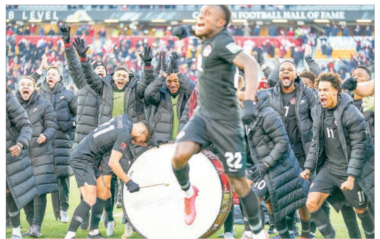
Canada's Mens National Soccer team celebrates their win over the United States in their World Cup qualifying match in Hamilton, Ontario, on 30 January, 2022.

Goalscorer Larin admitted a World Cup berth was within reach. — AFP ■