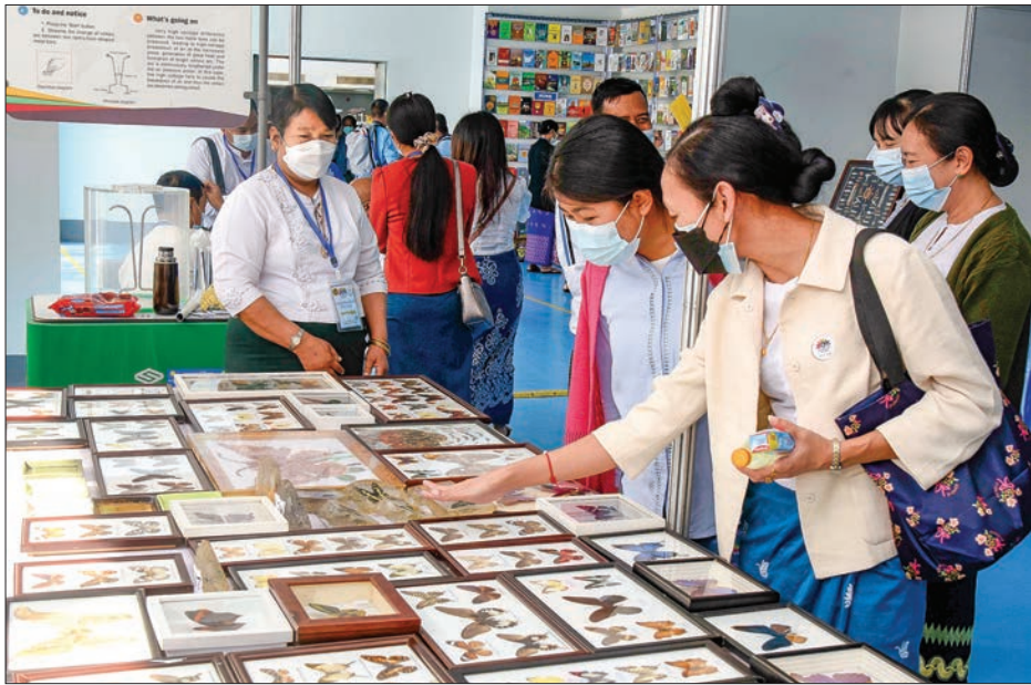
The exhibition booth of the Ministry of Education.