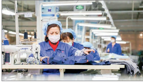
Factory activity in China edged down in January, according to official figures.

The Purchasing Managers' Index — a key gauge of manufacturing activity — in the world's