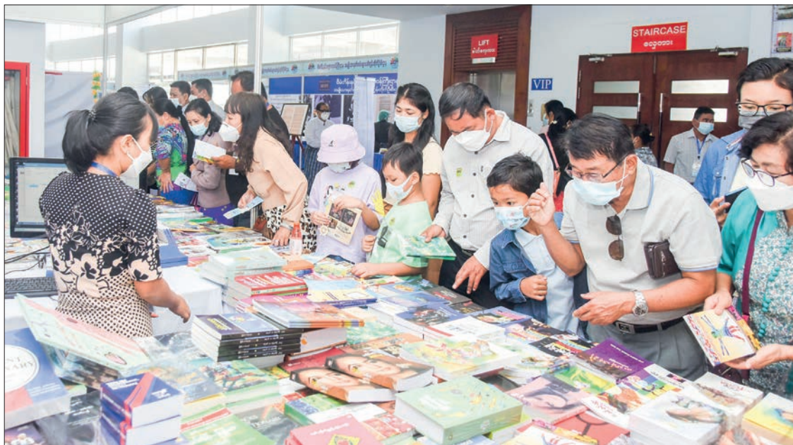
Bookworm students are choosing books at the book stall.

The festival also organized competitions such as painting competition and home building competition, it was a pleasure to see that both teachers and students and the interested