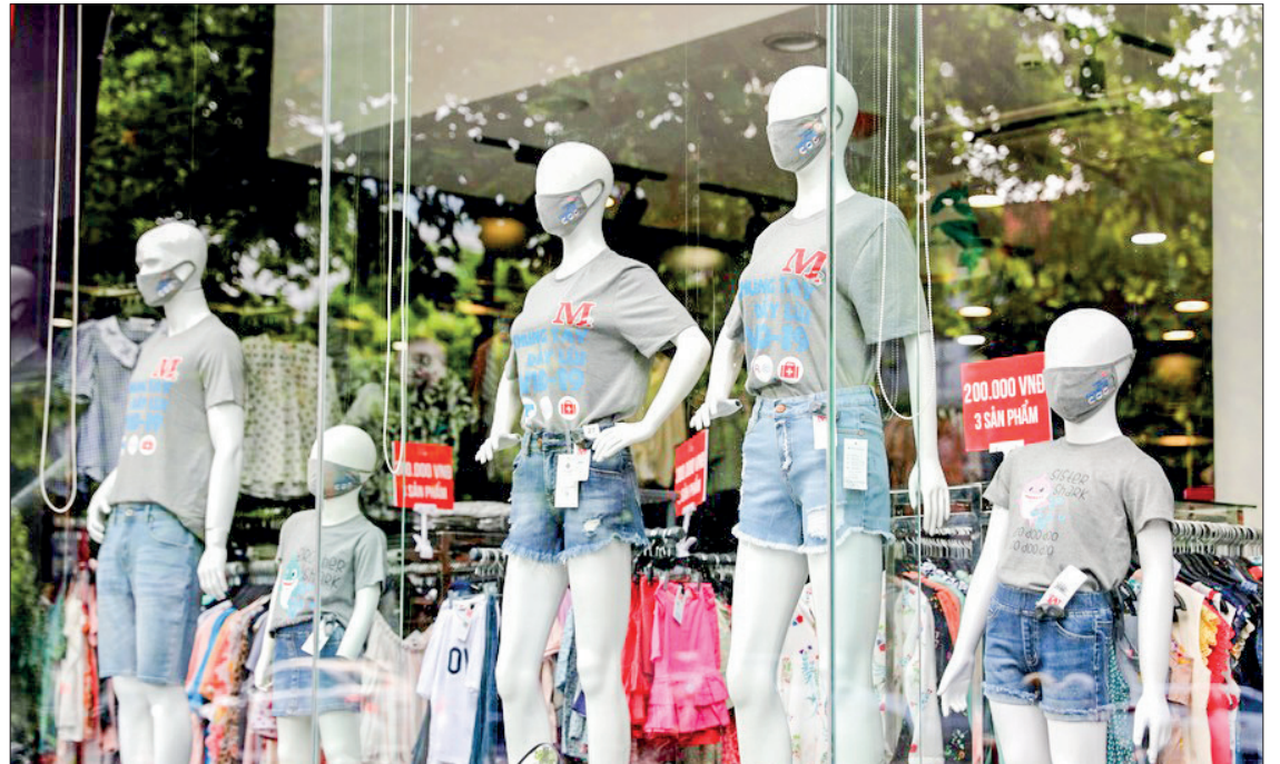
Photo taken on 8 August 2020 shows mannequins wearing face masks in Vietnam's capital city Hanoi. Vietnam reported six new cases of COVID-19 infection on Monday, bringing its total confirmed cases to 847, along with two more deaths from the disease, according to the Ministry of Health.

Vietnam has gone through four coronavirus waves of increasing scale, complication, and infectivity. As of Saturday, the country has registered over 2.2 million locally transmitted COVID-19 cases since the start of the current wave in late April last year, said the ministry. — Xinhua ■