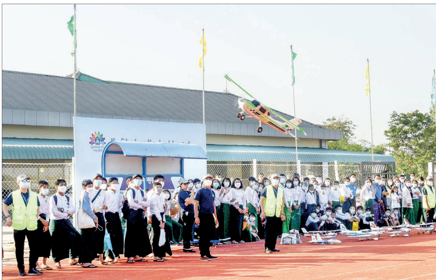
Students are interestingly enjoying the controlling of small airplane at Youth and Literature Festival in Nay Pyi Taw on 30 January.

T HE second-day of the Youth and Literature Festival in commemoration of the Diamond Jubilee Union Day continued yesterday at the Wunna Theikdi Stadium