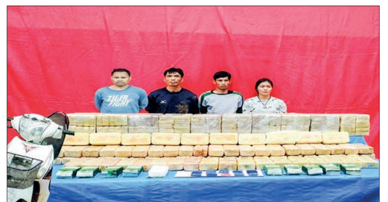
Four suspects were arrested together with stimulant tablets and 10 kilos of Ketamine in Tachilek Township on 19 January.

The investigation led to the house of Yein and Ma Nang Ein in Namluk (Shan) village where 1.6 million stimulant tablets were confiscated, and the police also