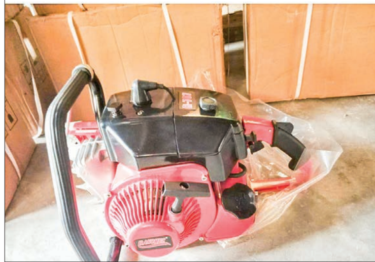
Seized illegally imported chainsaw.

Customs Department of Kayin State conducted a surprise patrol near the Myawady Trade Zone.