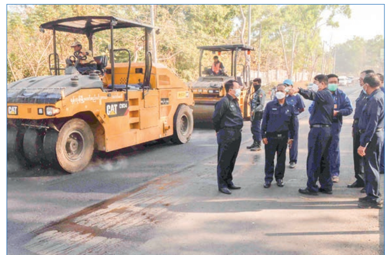
Mayor U Bo Htay views progress of placing asphalt concrete on road section near Pinyinmabin Katkyaw sutaungpyae Pagoda in Mingaladon Township on 30 January.

The Mayor and party then looked into greening tasks on Tezadipa Island on the lake circular road in Mingala Taungyunt Township, bicycle parking near the entrance to Tezadipa Island Park, clearing the bridge, the daily cleaning of the dirt on the bridge and the demolition of the old wooden bridge. The bridge was planned to be rebuilt within the set time.—MNA