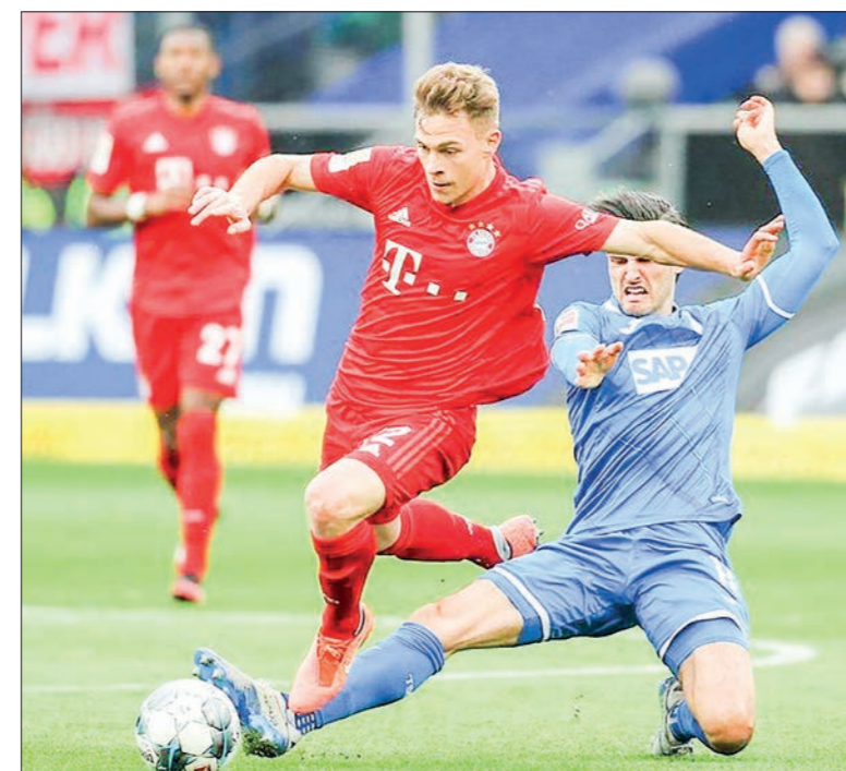
In this 29 February 2020 photo, Hoffenheim's Swiss midfielder Steven Zuber (right) and Bayern Munich's German midfielder Joshua Kimmich vie for the ball during the German first division Bundesliga football match Hoffenheim v Bayern Munich in Sinsheim.

THE long-term effects of COVID-19 among the recovered, sometimes referred to as "long COVID-19," also manifest themselves among footballers.