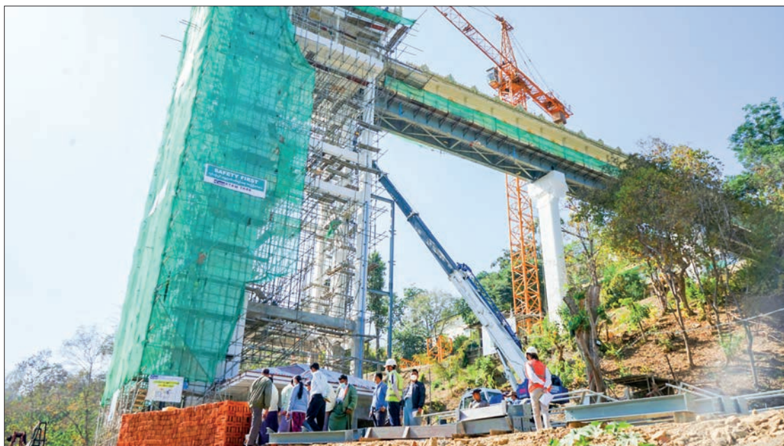
A lift tower is under construction at Mann Shwesettaw Pagoda in Minbu Township with the use of heavy machinery.