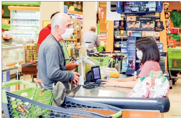
Supermarket cashiers and clients wear protective face masks as new measures are enforced to fight against the coronavirus in Ankara on 6 August 2020.

TURKISH President Recep Tayyip Erdogan has sacked the head of the state statistics agen-