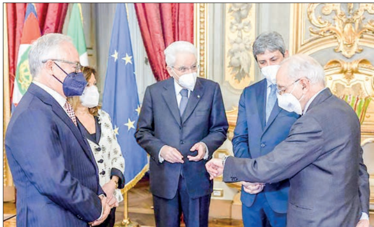
Italian President Sergio Mattarella (centre) talking with President of the Italian Senate, Maria Elisabetta Alberti Casellati (second left).

ITALY'S warring parties were set Saturday to beg outgoing President Sergio Mattarella to stay for another term, fearing political chaos due to a possible