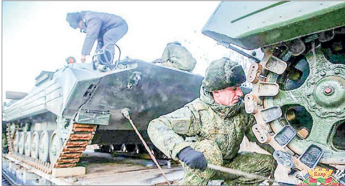
Belarus's defence ministry released photos showing Russian troops and tanks arriving for drills.

nored" other key concerns outlined by Russia and had failed to explain how security in Europe