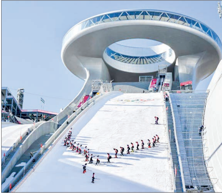
Staff members work on the track at the National Ski Jumping Center in Chongli District of Zhangjiakou City in north China's Hebei Province, on 28 January 2022.