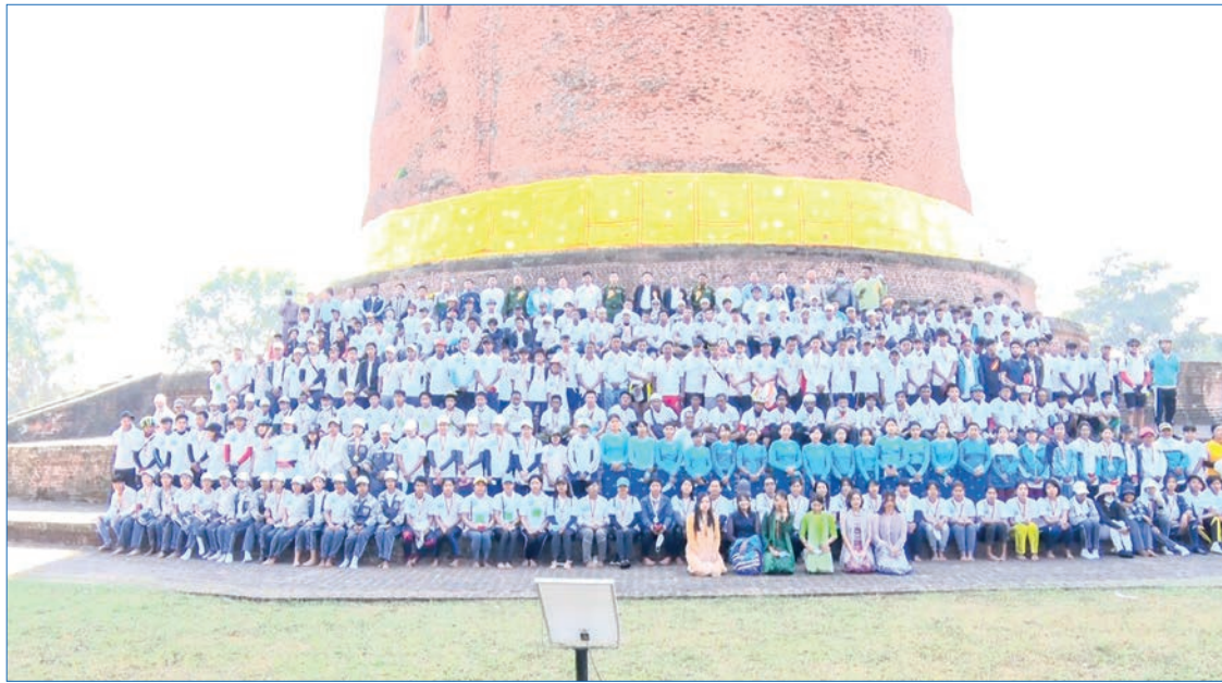
Union Minister Dr Htay Aung poses for documentary photo together with departmental officials, hoteliers and youths and cyclists in Sri Kestra ancient city in Pyay on 29 January.

The tourism industry starts to revive in the current high season. The mass cycling event promoting tourism with sporting activity in Sri Kestra, one of the Pyu ancient cities was held on 30 January, by looking forward to the tourism development and physical fitness of the people. This event is aimed to draw the attentions of the travellers. All