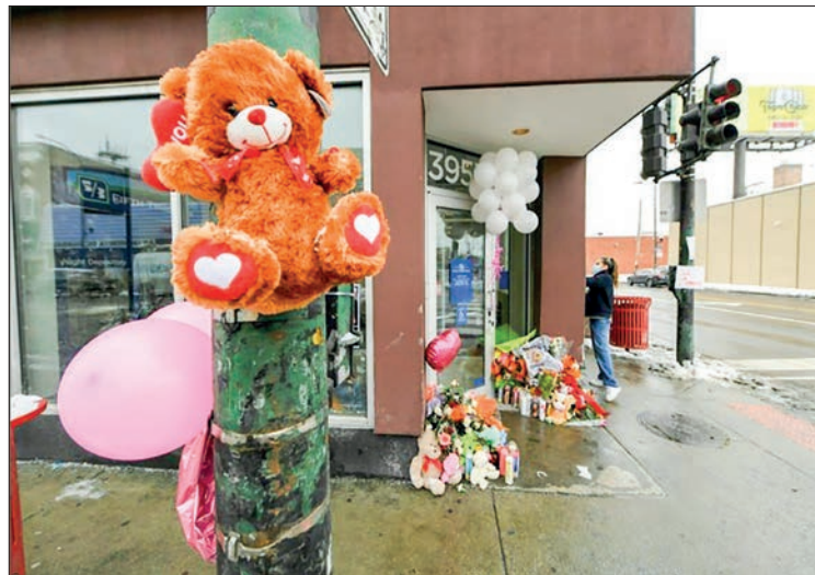
A stuffed teddy bear hangs from a light pole at a memorial for 8-year-old Melissa Ortega, who was struck in Chicago by stray bullets.

Pyongyang carried out two weapons tests last week, and has conducted at least four additional tests this month — including of what it called hypersonic missiles on 5 and 11 January. — AFP ■