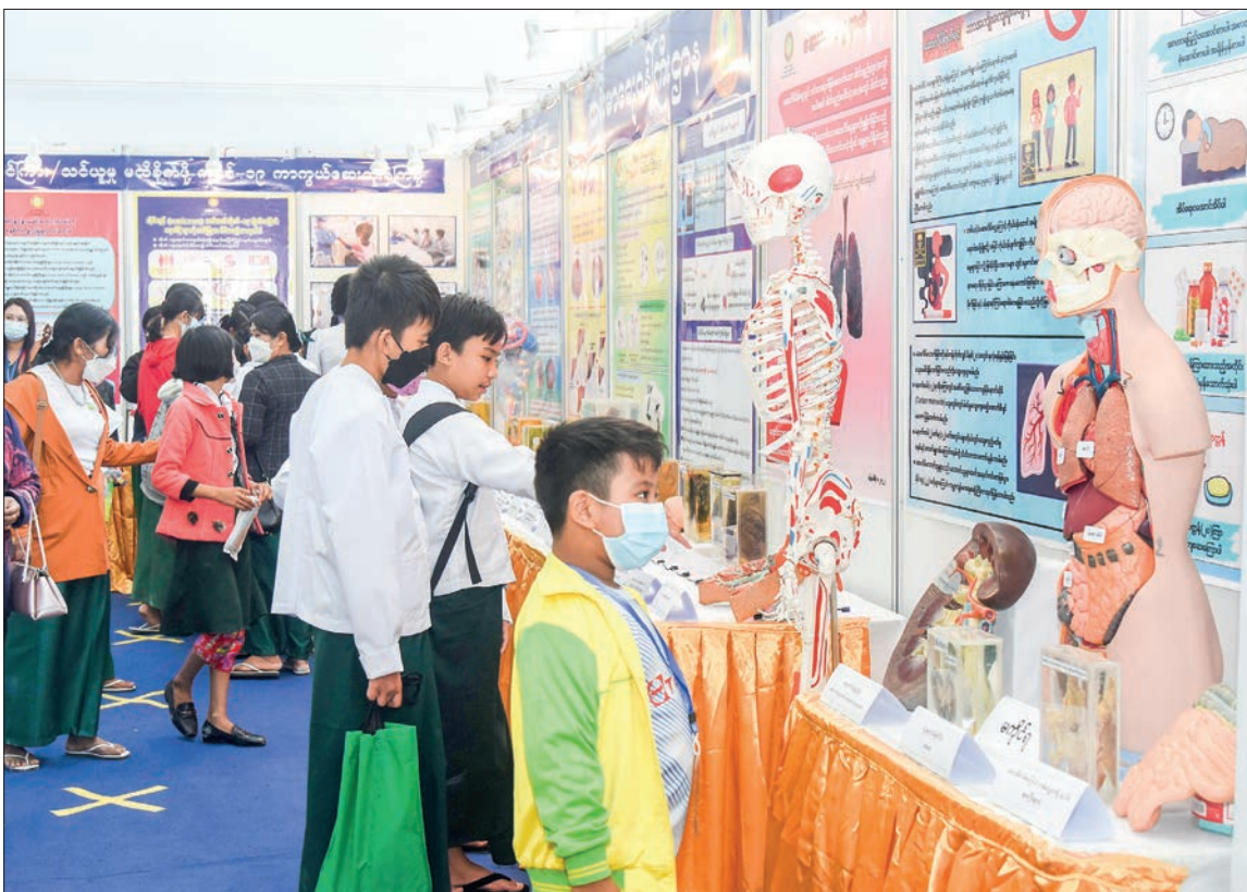
Students are viewing round the booths at Youth and Literature Festival.

The Youth and Literature Festival is being held from 9:30 am to 5:00 pm with good intentions to develop the intellect and ideas of young people, to develop good habits of participating in group activities while celebrating the festival happily, to encourage young people to be creative and to study literature, to build a society of the future with their good ideas.—Myo Sat Thit/GNLM