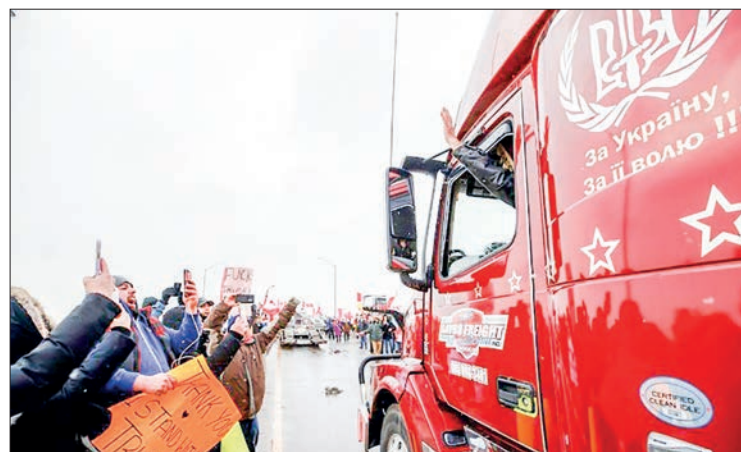
Canadian truck drivers protesting over a Covid-19 vaccine mandate in Toronto on 27 January 2022.

and the United States have imposed a Covid-19 vaccine mandate for truck drivers crossing the border between the two countries, the longest in the world at nearly 5,500 miles (9,000 kilometers).