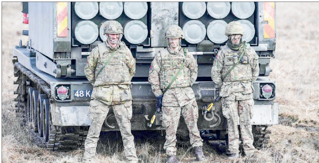
British artillery soldiers are pictured after a shooting session during the Dynamic Front 18 exercise in Grafenwoehr, Germany, in March 2018.

"I have ordered our Armed Forces to prepare to deploy across Europe next week, ensuring we are able to support