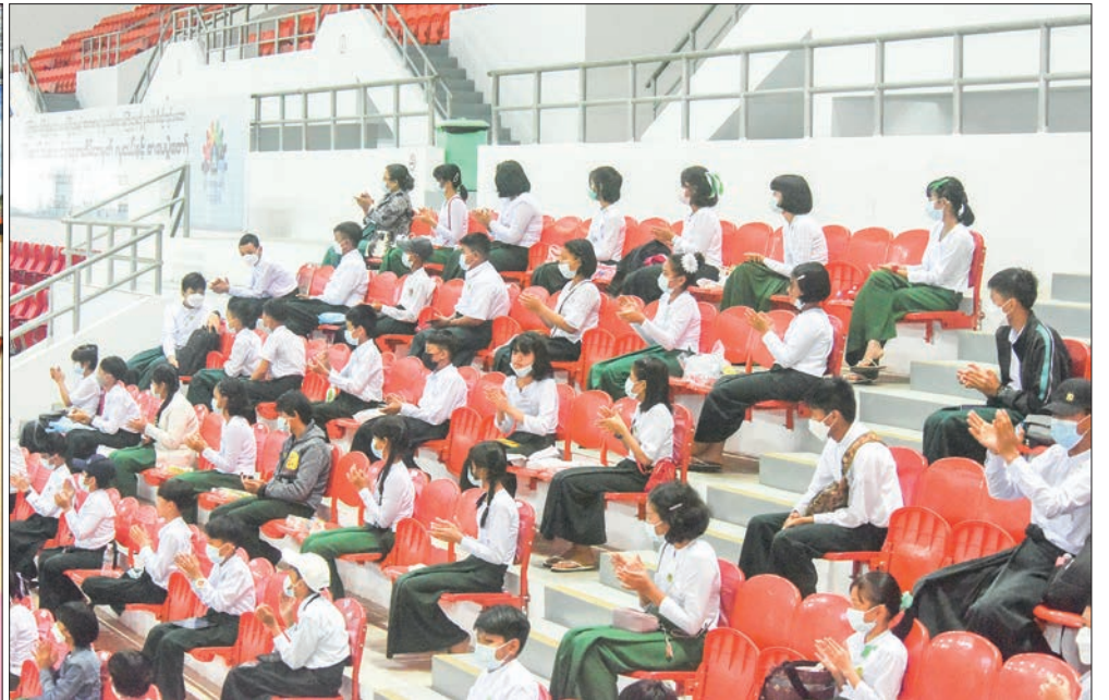
Students and young people are watching Sepak Takraw skill demonstration of selected athletes at Stadium (B) of Wunna Theikdi Gymnasium in Nay Pyi Taw on 30 January.