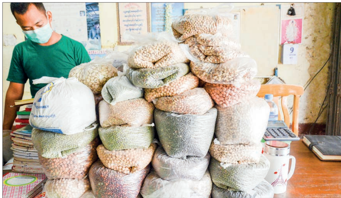
Sample of pulses and beans in bags are stockpiled in brokerage.

28,523 tonnes were sent to the neighbouring countries through land border.—KK/GNLM