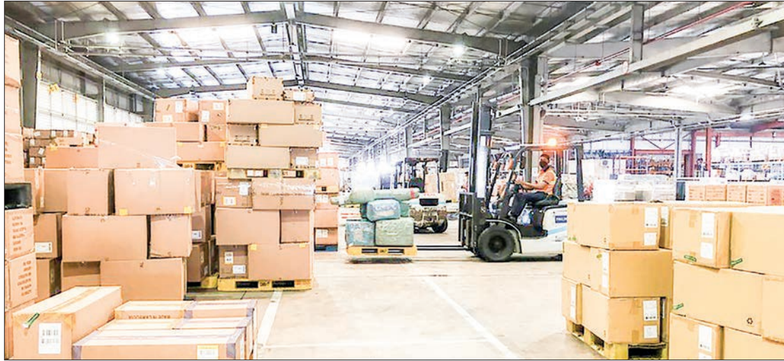
Photo taken on 31 December 2021, shows cargo boxes at the Phnom Penh International Airport's warehouse in Phnom Penh, Cambodia.

"Cambodia's economy is projected to grow by around 3 per cent in 2021 and will continue to grow by more than 5 per cent in 2022, mainly thanks to the full re-opening of the country, and the return of the socioeconomic