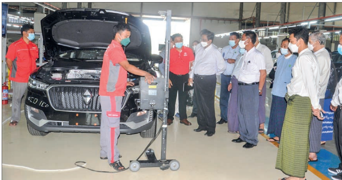
Union Minister for Industry Dr Charlie Than views assembling process of automobiles of Go Excellent (Myanmar) Co., Ltd at Shwelinpan Industrial Zone in Hlinethaya Township.

At the packaging paper mill in Insein Township on 29 January, the Union Minister inspected the process of Star Sanda Company and production process of garment products. Afterwards, he arrived at the Textile and Garment Technology Development Department which will conduct international textile testing, inspection and quality certification issuance under the Joint Venture of the Ministry of Industry and Korea Apparel Testing and Research Institute (KATRI) for the development of the Myanmar textile and garment industrial development. At the department, he inspected the construction of the laboratory building and the availability of testing equipment for the textile, and instructed