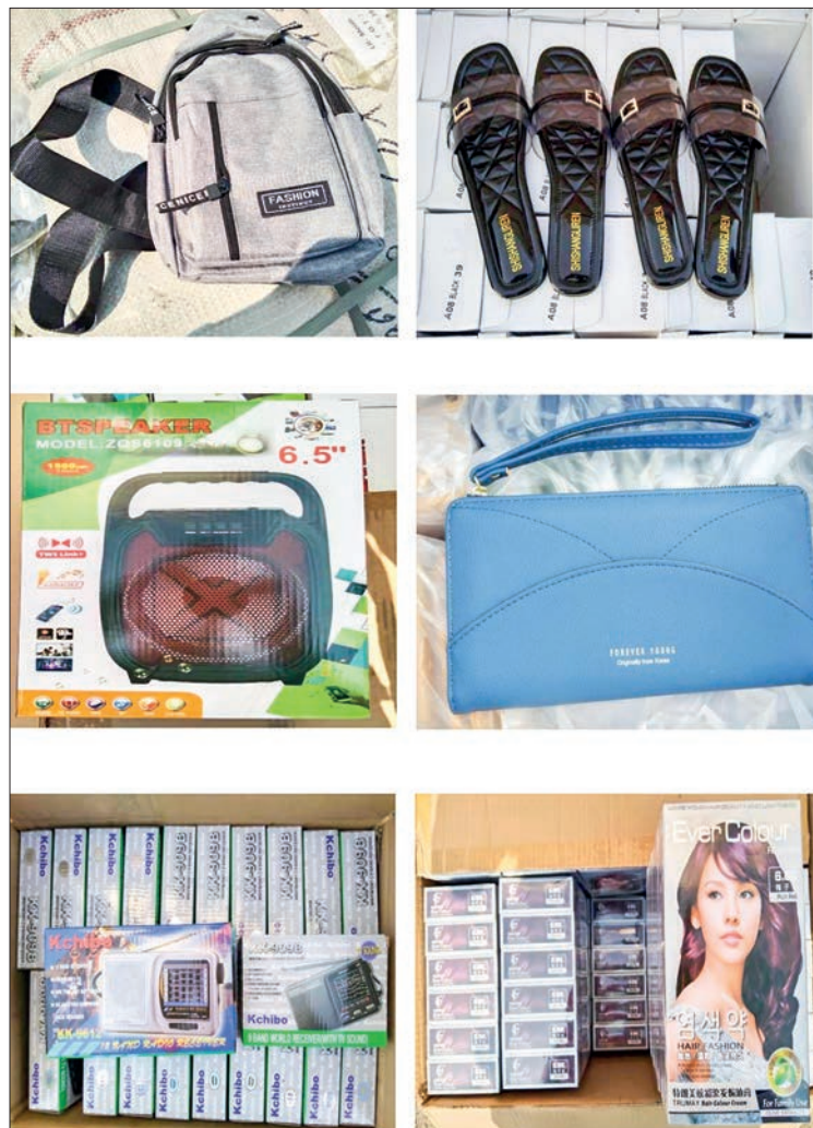
Photo shows illegal consumer goods seized by officials at checkpoint on 29 and 30 January 2022.