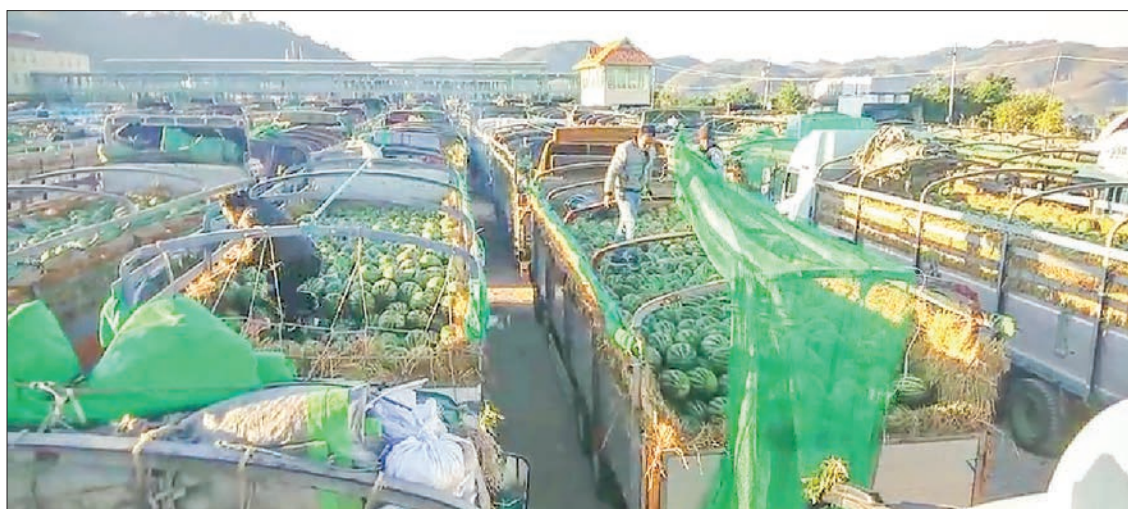
Trucks carrying watermelon and other fruits are leading to border gate.

THE value of agricultural exports sank to US$1.25 billion as of 21 January in the current mini-budget period (Oct 2021-March 2022), indicating a significant drop of $375.5 million as against the year ago period, as per the statistic of the Ministry of Commerce.