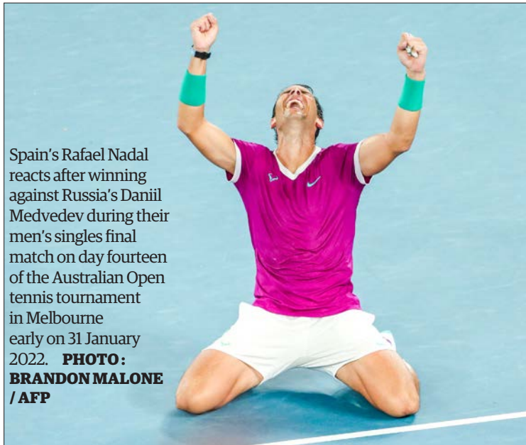
Spain's Rafael Nadal reacts after winning against Russia's Daniil Medvedev during their men's singles final match on day fourteen of the Australian Open tennis tournament in Melbourne early on 31 January 2022.