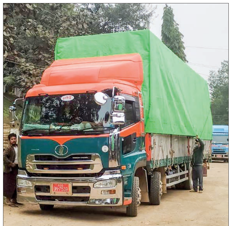
Cargo truck is carrying protective equipment for COVID-19 at Chinshwehaw trade zone on 30 January.

It is reported that anti-COVID-19 medical supplies and equipment are being given priority in accordance with the Standard Operating Procedures (SOP) coordinated with the relevant departments, and notice related to the import of medicines and related products have also been made available on the Ministry's website, commerce.gov.mm.—MNA