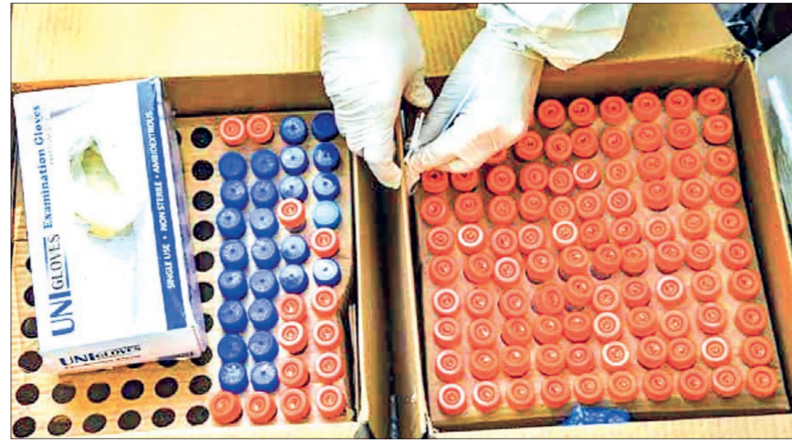
Representational Image: A new study has detected that SARS-CoV-2, the virus that causes COVID-19, can infect a person for more than 200 days in an atypical case.

This is not the first evidence that the virus can remain active for longer than expected even in patients with mild symptoms. In early 2021, researchers at the University of Sao Paulo's Institute of Tropical Medicine (IMT-USP) of these patients at the time the material was collected.