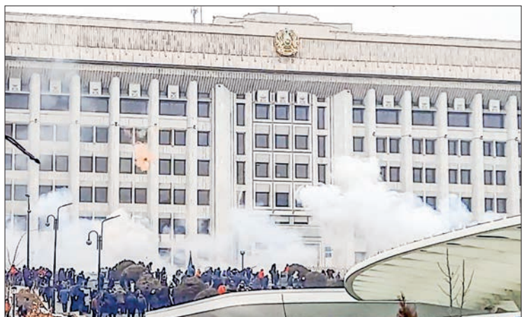
This image grab shows protesters near an administrative building during a rally over a hike in energy prices, in Almaty, Kazakhstan, on 5 January.

KAZAKHSTAN President Kassym-Jomart Tokayev Saturday rejected calls for an international probe into a bloody crisis in the