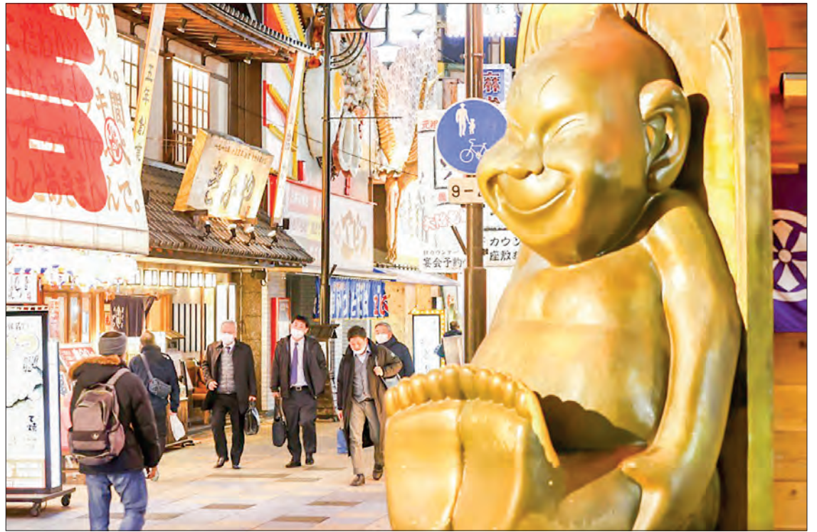
People wearing face masks walk in Osaka's Shinsekai area on 21 January 2022, amid the coronavirus pandemic.

The Washington-based institution holds regular consultations with member countries, usually annually. The pandemic, however, has disrupted the schedule, making the latest report on Japan the first since February 2020.