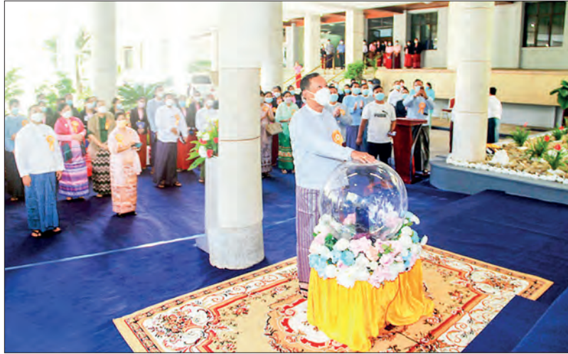
The launching ceremony of the CBM Learning and Training Centre is underway.

Then, the attendees to the event viewed round the Learning and Training Centre.