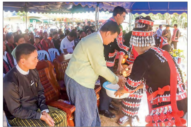
The Lahu Handwashing Ceremony.

spite the divided ethnic groups, all tribes have the same festivals. The New Year is celebrated at the beginning of the New Year in early January, and the Lahu people celebrate the New Year when the cherry blossoms and peach flowers are found, as instructed by the forefathers. The 2022 Lahu New Year Festival was held in Panku village, Lower