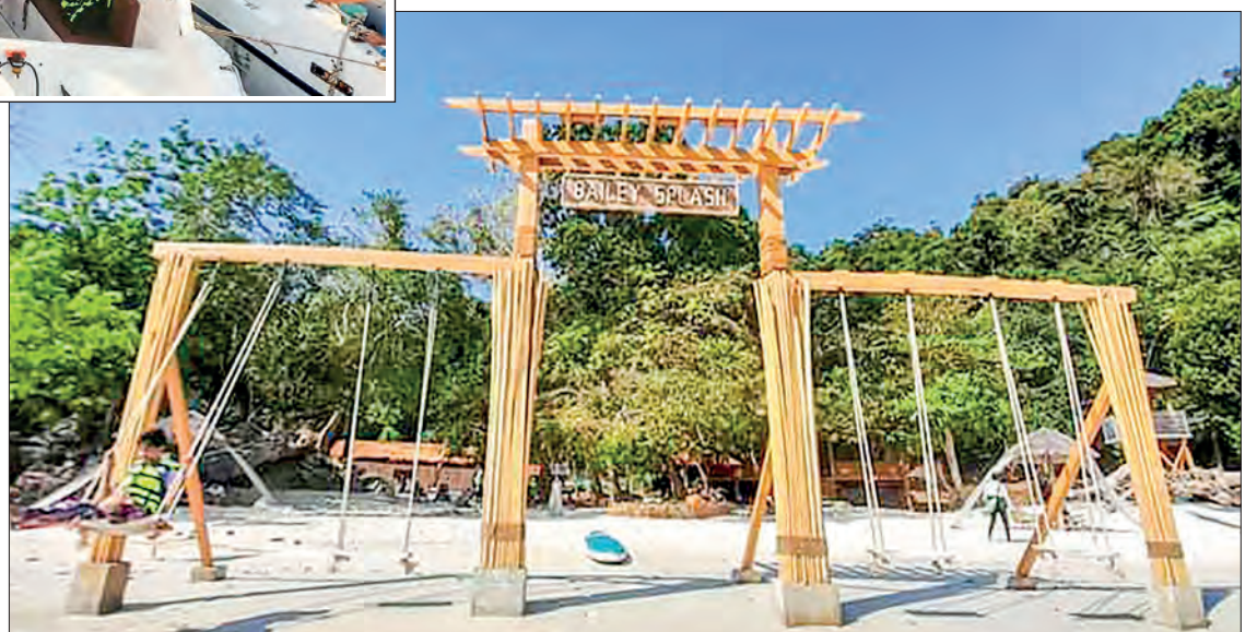
There are islands tours during weekends and holidays.

The resumption of flights and express bus services to Dawei and Myeik cities are required to attract more visitors," said U Moe Zaw from the Moe Travel & Tour. — Myint Oo (Myeik)/GNLM