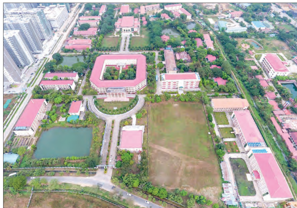
Nationalities Youth Resource Development Degree College (Yangon)

Reference The handbook of the Department of Education and Training