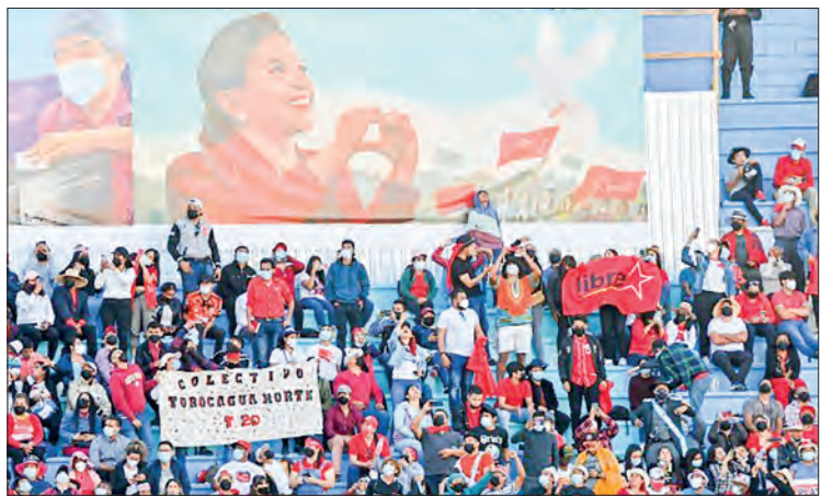
Honduran President Xiomara Castro's supporters wait for her inauguration ceremony to begin in Tegucigalpa on 27 January 2022.

LEFTIST Xiomara Castro was sworn in Thursday as the first woman president of Honduras,