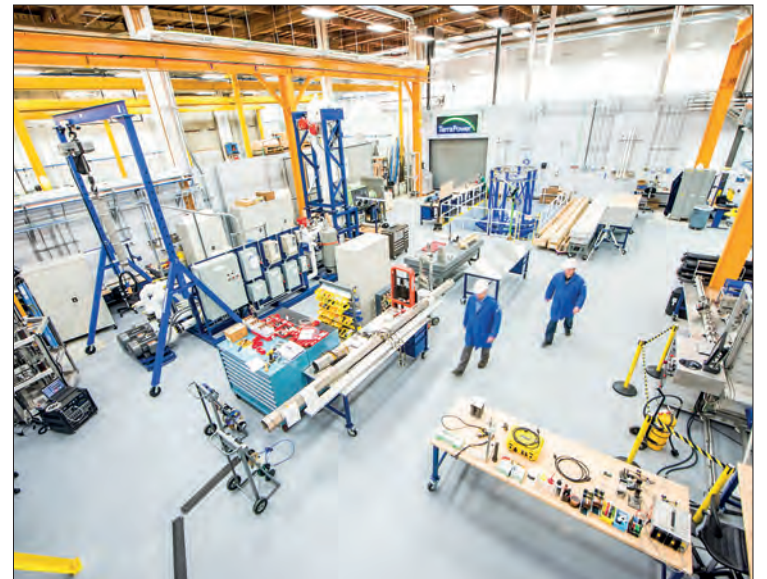
A panoramic view of TerraPower's laboratory shows a full-scale fuel assembly test stand at the centre of the frame.

"MHI will also bring back expertise and knowledge obtained through this partnership to contribute to the advancement of nuclear innovation in Japan," the company added, calling nuclear power "an essential part of the energy mix