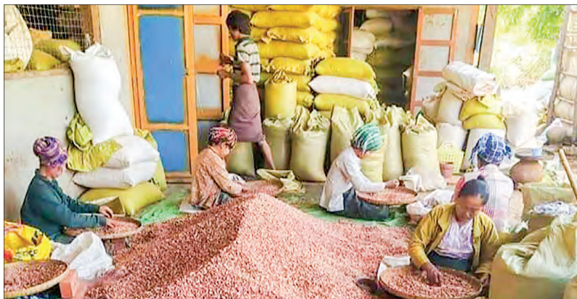
Approximately 2,000 bags of green gram and 7,000 bags of pigeon pea are daily supplied to the Monywa market. Green gram from Pale, Yaw, Kalay and Budalin areas are entering the market.

Those pigeon pea is again delivered to the Yangon market, while Mandalay traders