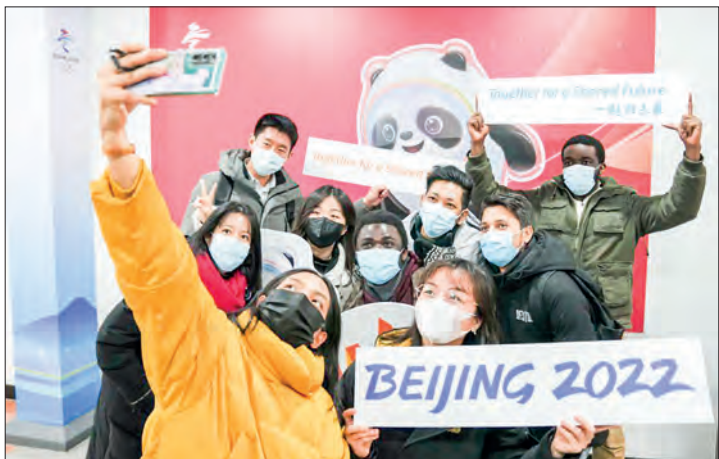
Foreign volunteers pose for a group photo at Wukesong Sports Centre in Beijing, capital of China, 30 December 2021. The first batch of volunteers entered Wukesong Sports Centre to participate in a training programme ahead of Beijing 2022 Winter Olympic Games.

Rights campaigners have accused the International Olympic Committee of turning a blind eye to what they say is a litany of abuses in China, including in Tibet and its ongoing clamp-down on free expression in Hong Kong.—AFP ■