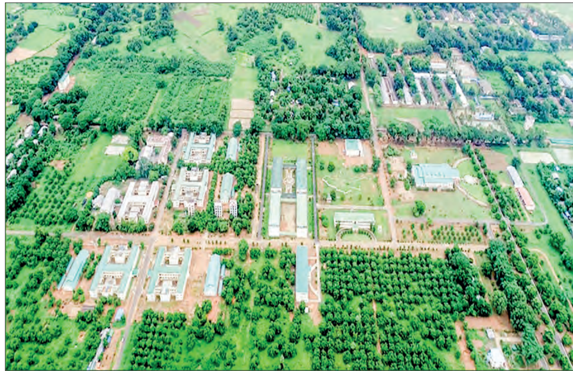
University for the Development of National Races, Sagaing (UDNR)

The Ministry has established two main departments: the Department of Progress of Border Areas and National Races and the Department of Education and Training. To perform one of the eight objectives of the ministry, which is to provide basic education, higher education and professional education to the nationalities youth, the Ministry has established 45 Training Schools for Development of Nationalities Youth from Border Areas, the two Nationalities Youth Resource Development Degree Colleges (Yangon and Sagaing) and the University for Development of National Races, Sagaing (UDNR). At the Youth Training Schools, the food, accommodation, and free basic education are fully provided to the orphans, the fatherless ones, the motherless ones and the poor who could not afford to carry on their education. Those students