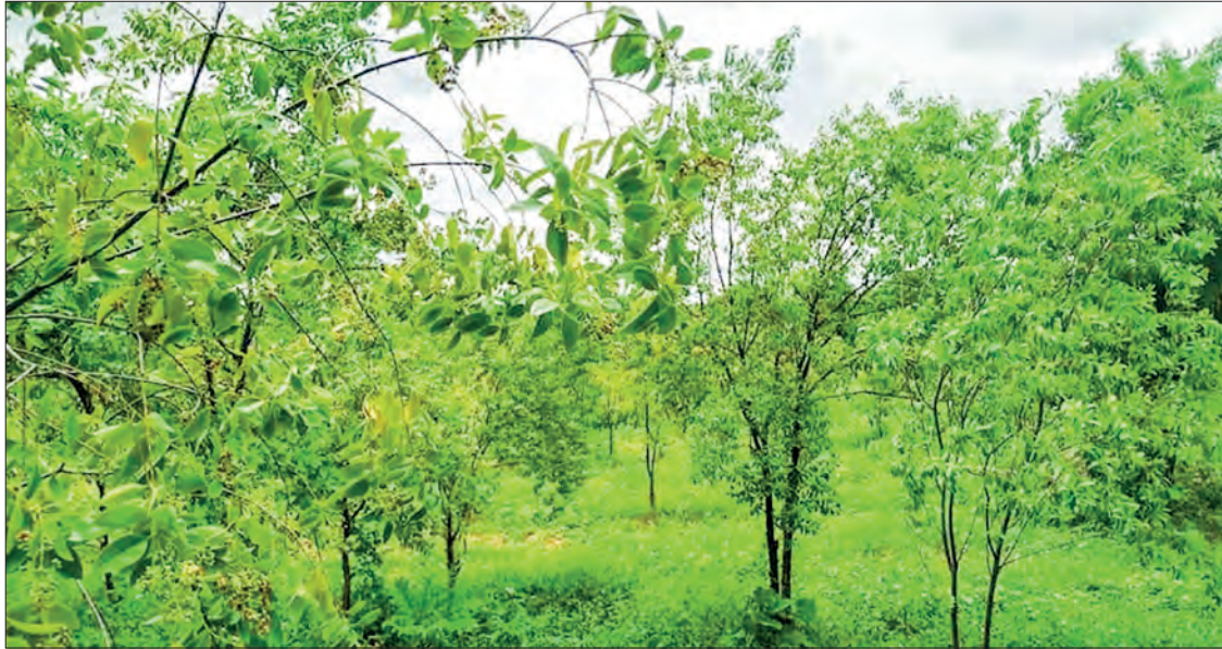
Sandalwood is planted nine feet apart. Ten-year sandalwood plants can be sold. The prices of quality sandalwood reached up to K200,000-K300,000 per viss.