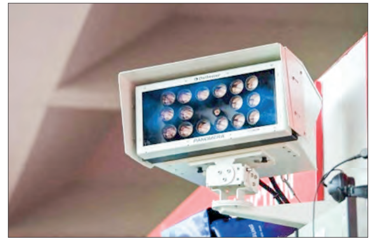
More security cameras at Premier League grounds have not deterred the troublemakers.

BRITAIN'S head of football policing has called for an urgent meeting with Premier League chiefs over rising incidents of crowd disorder.