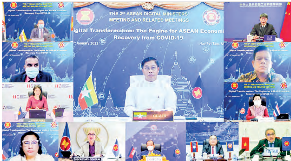
The second-day meeting of the second ADGMIN and related meetings in progress virtually.

At the discussion with China, Digital Ministers from ASEAN countries and the Deputy Secretary-General of ASEAN exchanged views on the latest developments in the digital economy and policy in the ASEAN region, potential areas for ASEAN-China digital economic cooperation in 2022, projects successfully implemented in 2021 and projects to be implemented under the ASEAN-China Digital Work Plan in 2022 and approved