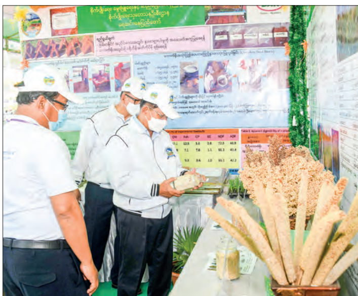
The Senior General looks into the display of exhibitions.

Muse route. Moreover, the cattle are sold out to Bangladesh and Thailand both legally and illegally. The government is striving for extending the agreements for trading and freedom of animal disease in order to export the cattle to regional and international