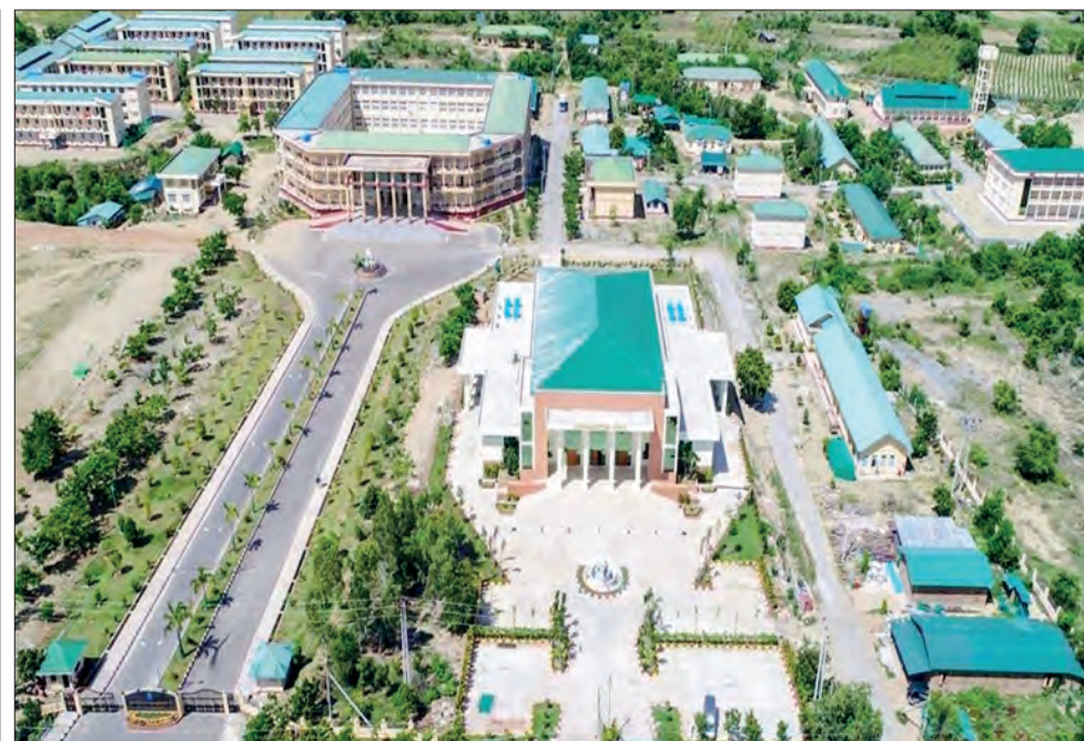
Nationalities Youth Resource Development Degree College (Sagaing)