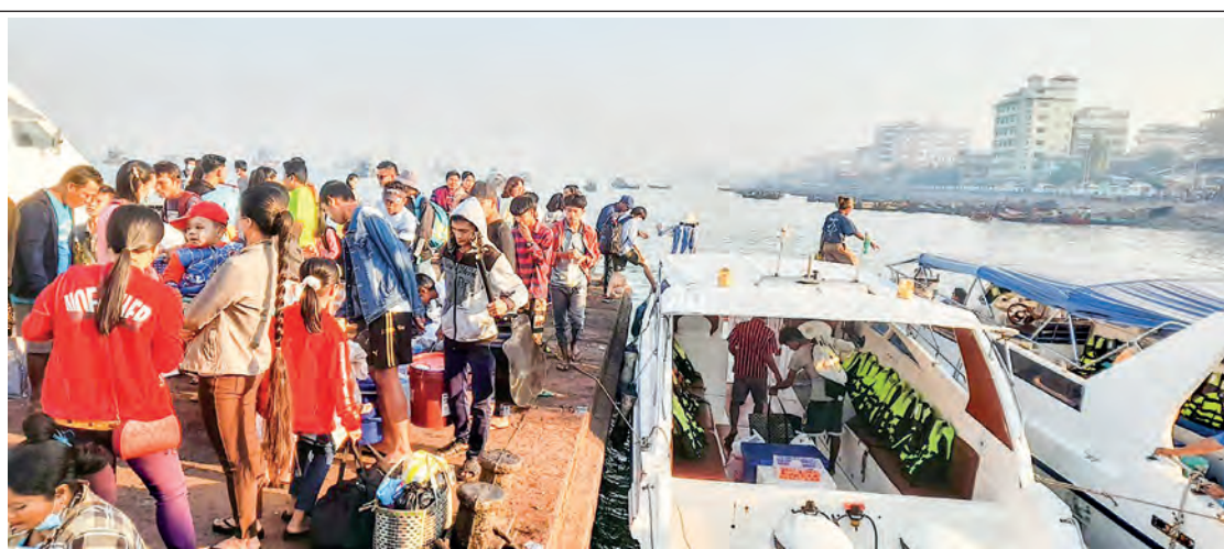
The travellers are mostly from Yangon, Mandalay and Taninthayi regions.

ALL the stakeholders in the tourism industry are endeavouring to revive tourism in Myeik Archipelago, Taninthayi Region and the tour agencies are now offering islands tours every week after an abrupt fall in the past two years amid travel restrictions triggered by the COVID-19 pandemic.