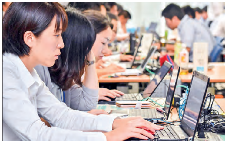
Police officers participate in a cybersecurity workshop in Yokohama on 7 September 2017.

cybercrime investigations using advanced technology as well as cooperation with overseas counterparts.—Kyodo ■