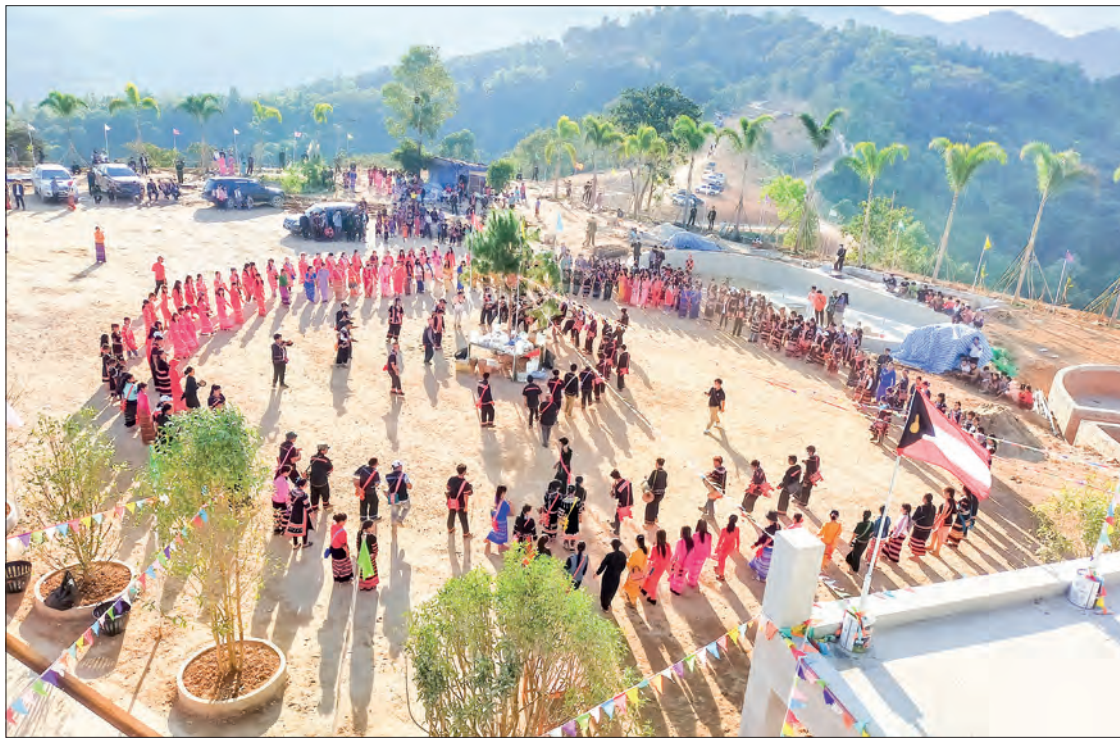
The Lahu New Year Festival in action.

The gourd is the symbol of the Lahu people. There are three main ethnic groups in the