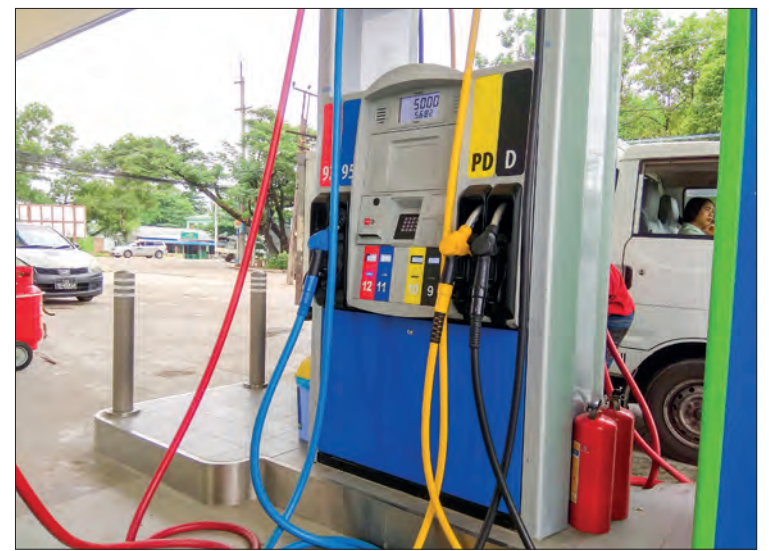
One of the petrol stations in Yangon.

In early February 2021, the exchange rate on the US