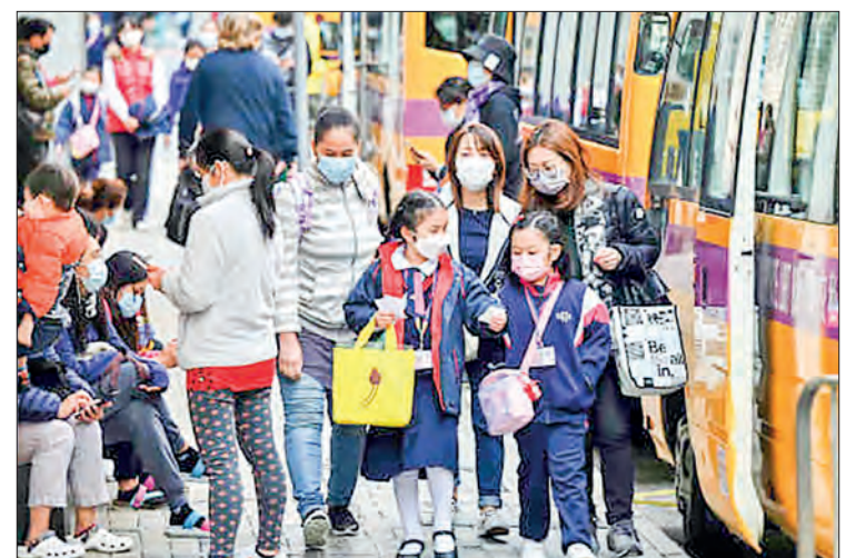
Children are escorted from school in Hong Kong on 11 January 2022, as the city announced the suspension of face-to-face learning at all kindergarten and primary schools until after the Lunar New Year.

"Our schools are a critical source of stability for our children, we know they learn best in the classroom and thrive by being among their peers," the governor said in a statement announcing the program.—AFP ■