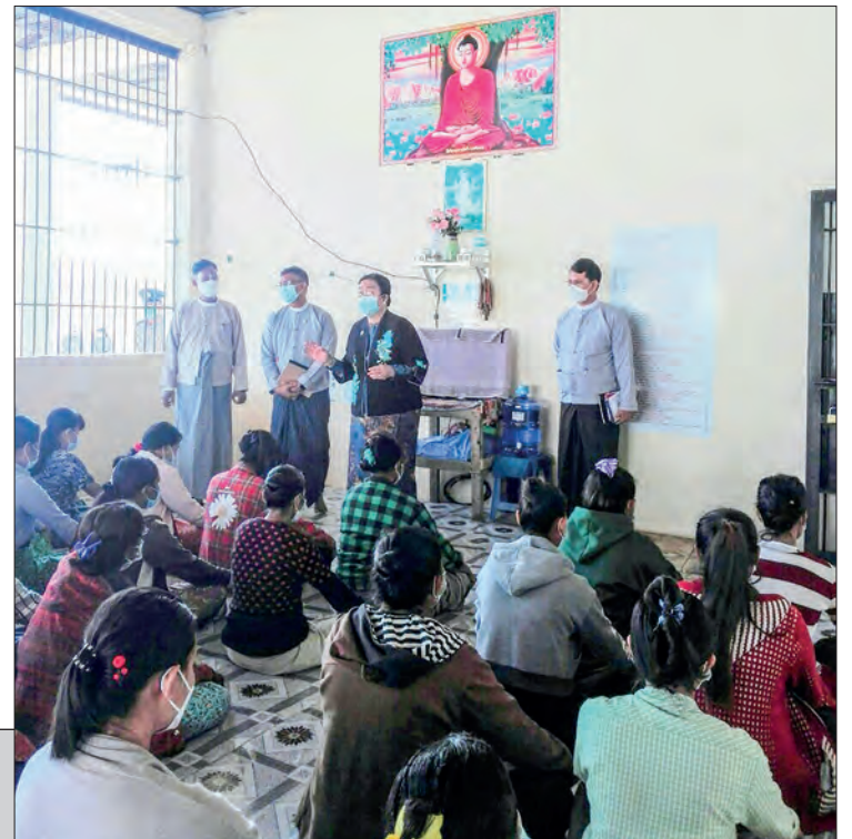
The MNHRC inspection tour in Nay Pyi Taw Prison.

The inspection and recommendations will be sent to relevant authorities for necessary action during the inspection team's visit. — MNA