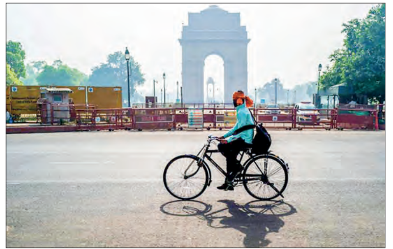
India's Delhi government decided on Thursday to end the weekend curfew and odd-even curbs for markets in the national capital region, local media reported.

The federal health ministry said on Thursday morning that Delhi had recorded 7,498 new COVID-19 cases in the past 24 hours. Meanwhile, Delhi health minister Satyendar Jain said the COVID-19 situation in Delhi is under control and the city is expected to report less than 5,000 cases in the next 24 hours.—Xinhua ■