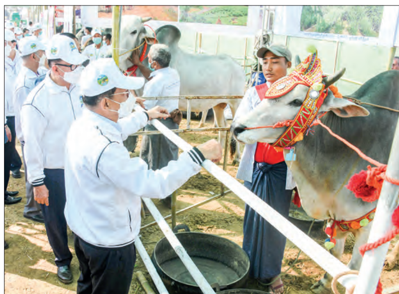
The Senior General views the display of cows in the contest.