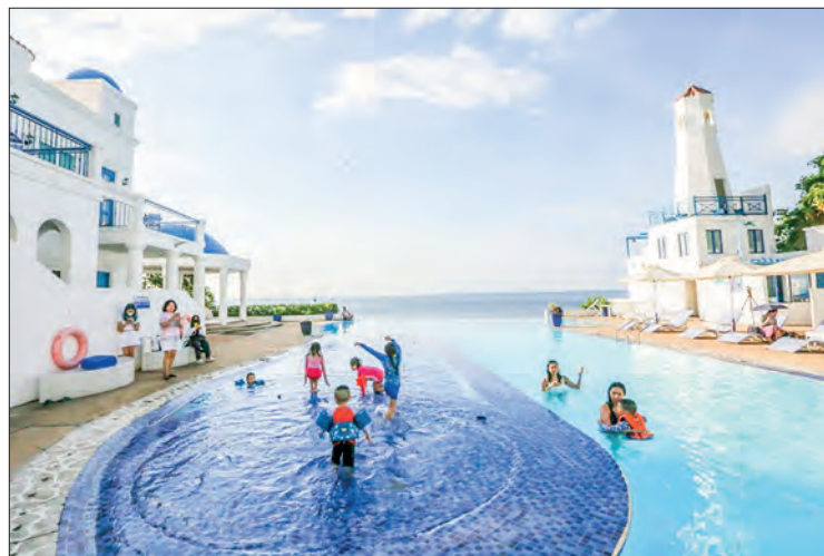
Fully vaccinated tourists from countries on the list will need to test negative for Covid-19 shortly before flying to the Philippines. Tourists are seen at a resort in Batangas Province, the Philippines on 18 November 2021.

THE Philippines will re-open to fully vaccinated tourists from most countries on 10 February and lift quarantine requirements, officials said Friday, nearly two years after closing its borders to contain the coronavirus.