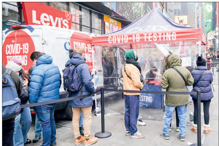
People stand in line for a Covid-19 test at a mobile testing site in Times Square in New York.

US Surgeon-General Vivek Murthy called for swift action to respond to a growing mental health crisis among youth that has worsened due to stressors related to the COVID-19 pandemic.