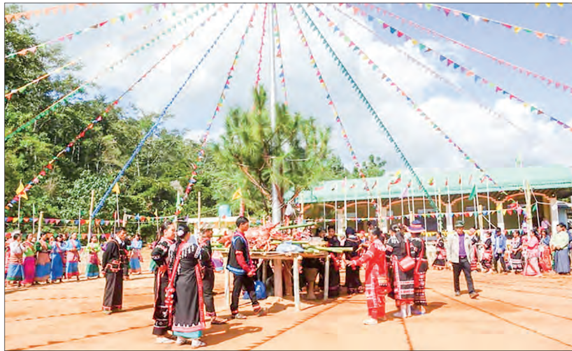
One of the Lahu traditional festivals.

Although handwashing ceremonies are not usually considered a festival, it is always performed at every traditional celebration. The handwashing ceremony is a symbol of cleansing and purification, and the young and old children perform a noble and loving tradition of apol-