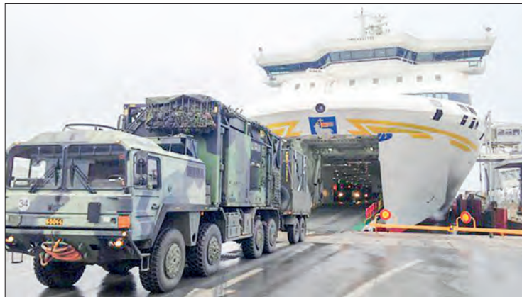
This month Sweden deployed armed patrols to the island of Gotland after three Russian landing ships entered the Baltic Sea. Swedish troops arrive in Gotland, file photo from 2015.

Elina Valtonen, vice-chair of Finland's opposition National