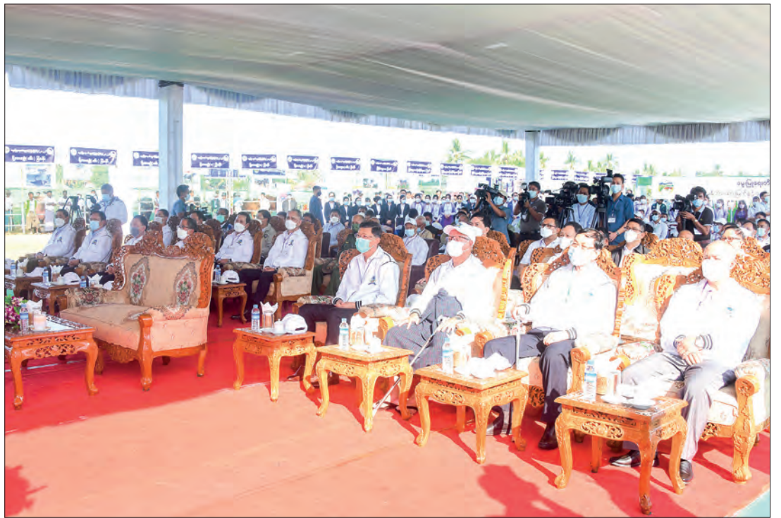
Chairman of the State Administration Council Prime Minister Senior General Min Aung Hlaing attends and addresses the opening event of the Livestock Show and Contest in Pobbathiri Township of Nay Pyi Taw on 28 January 2022.

I F modern manufacturing technologies are applied in breeding pedigree farming cattle, it is sure to become a country with food sufficiency and socio-economic development in line with the policy of the government, said Chairman of the State Administration Council Prime Minister