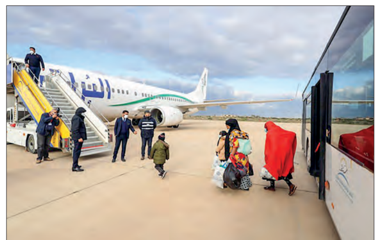
Illegal immigrants are seen boarding an airplane at the Misurata International Airport in Misurata, Libya, 27 January 2022.

The Voluntary Humanitarian Return programme, run by the IOM, arranges the return of illegal immigrants stranded in