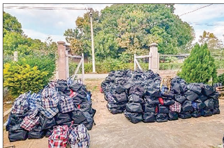
Storage of foodstuffs and personal goods.

kaw at around 3 pm. During the inspection of the building, 120 bags, 1,950 packs of instant noodles, 120 packs of cereal, 760 cans of various kinds of meat, 550 bottles of oil, 100 blankets and consumer goods such as gram, soap bars, detergent powder, were found and confiscated.