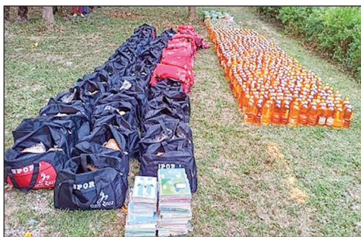
Confiscated goods in Loikaw.