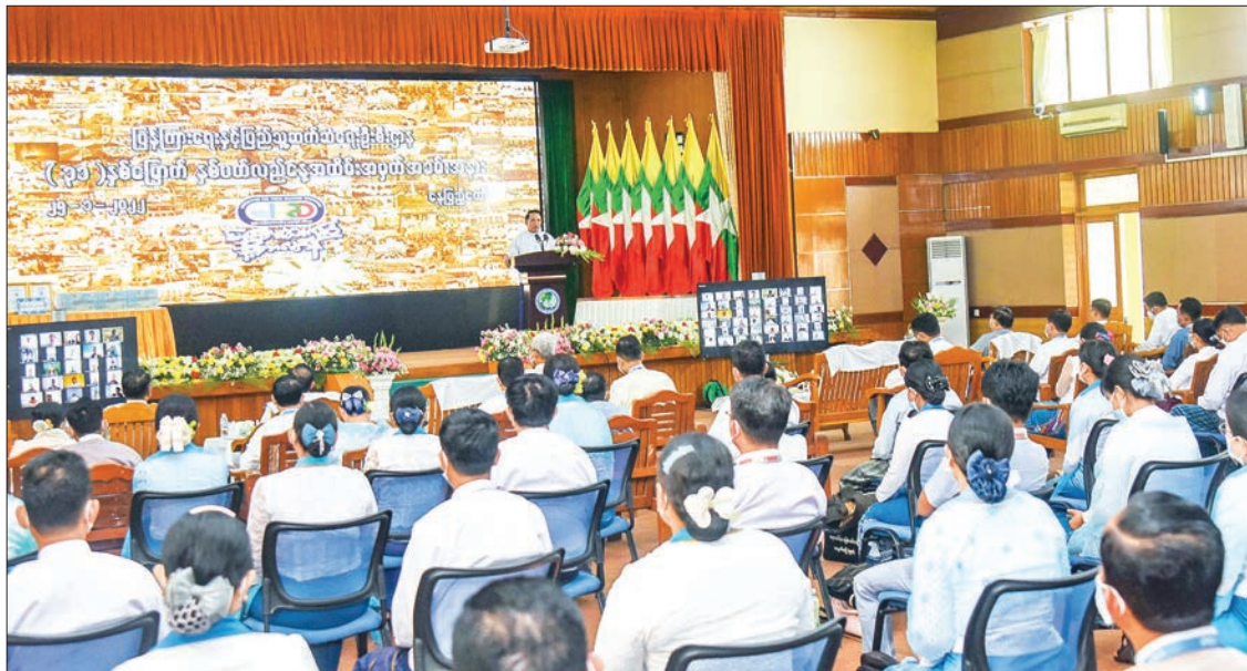
The thirty-first anniversary celebration of the Information and Public Relations Department in progress.

THE Information and Public Relations Department under the Ministry of Information held its 31 st anniversary in Nay Pyi Taw yesterday.