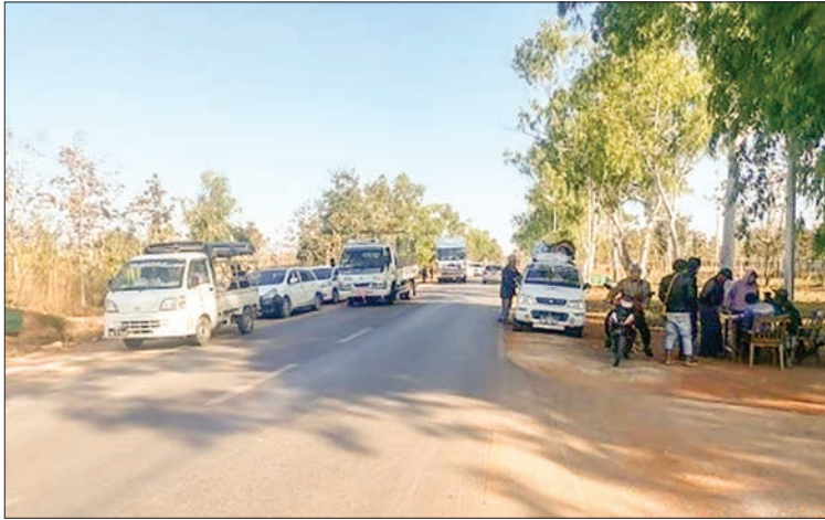
IDPs return to Loikaw.