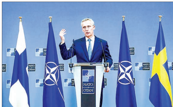
NATO chief Jens Stoltenberg insisted the alliance 'will continue to take all necessary measures to protect' members and was considering deploying fresh battle groups to eastern allies.

Moscow is demanding a guarantee that Ukraine, a former Soviet republic, never be allowed to join NATO, as well as other con-