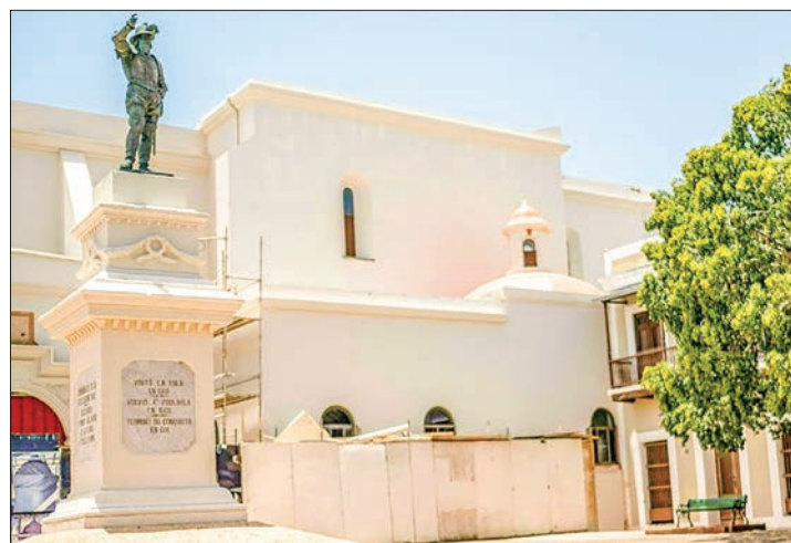
The Juan Ponce de Leon statue in Old San Juan, Puerto Rico is seen prior to its toppling by unknown assailants on 24 January 2022, hours before Spanish King Felipe VI was set to visit the Caribbean island.

Local media reported that a group known as the Boriken Libertarian Forces has claimed responsibility.—AFP ■