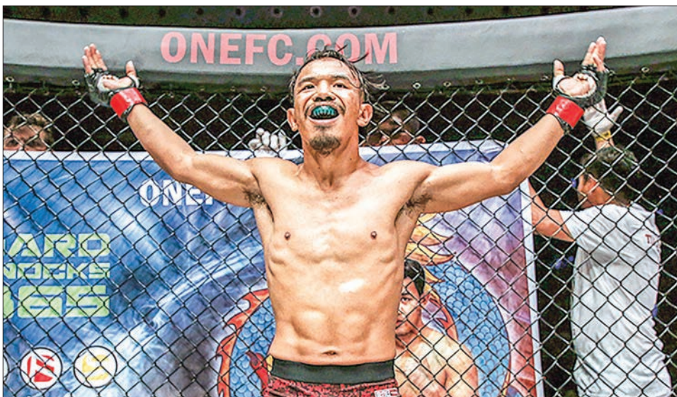
Myanmar MMA fighter Tial Thang.