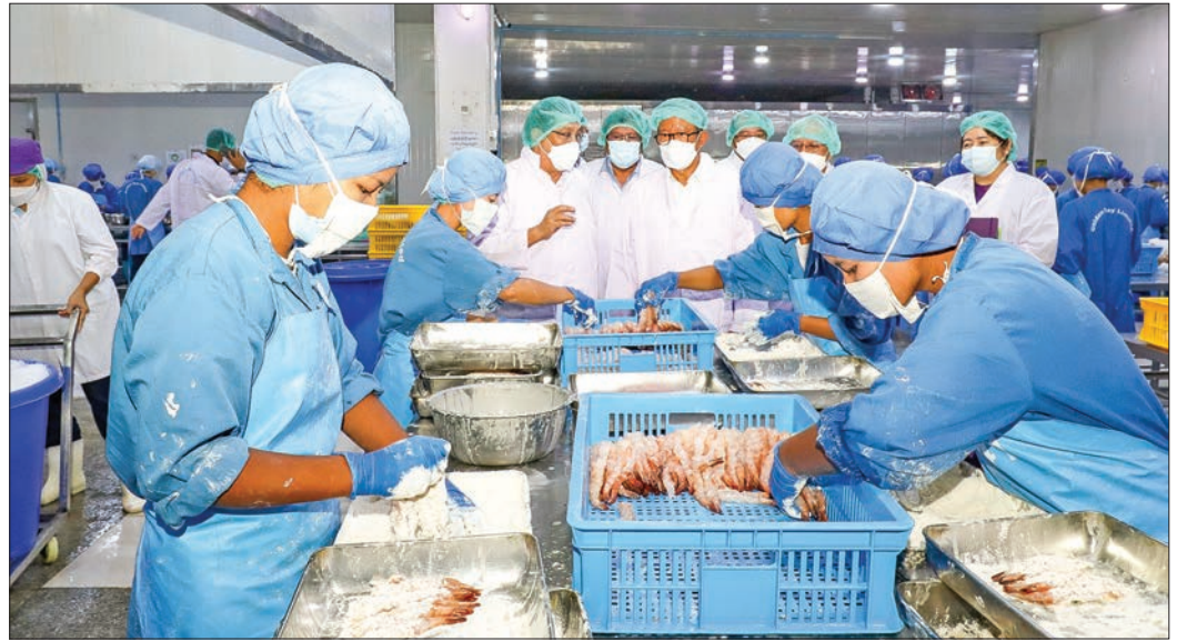
In the evening, the team left for Insein Township, Yangon Region the Union minister inspected the fishery value chains of the General Food Technology Industry Co. Ltd which exports the shrimp and squid to Japan, Europe and Australia.

for Insein Township, Yangon Region the Union minister inspected the fishery value chains of the General Food Technology Industry Co. Ltd which exports the shrimp and squid to Japan, Europe and Australia. — MNA