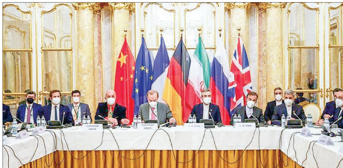
Direct talks between Iran and remaining parties to the 2015 nuclear accord aimed at resuscitating the deal started in Vienna last year.

IRAN for the first time Monday said it was open to direct nuclear negotiations with the United States, which declared itself ready to hold talks "urgently" — in a possible turning point in efforts to salvage the 2015 nuclear accord.