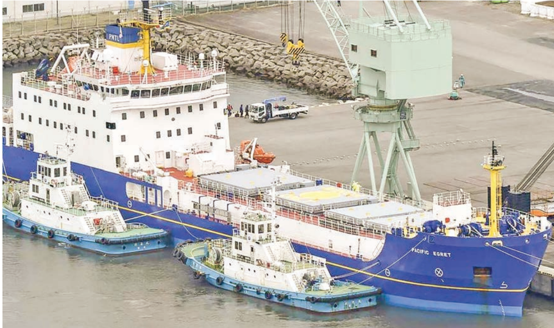
The Pacific Egret, one of the two British-flagged ships arrived in Japan, is anchored at a port in the village of Tokai, northeast of Tokyo, Monday morning, 21 March 2016.

THE Finance Ministry on Tuesday upgraded its overall assessment of Japan's regional economies for the first time in 15 months, saying they are recovering from the fallout of the