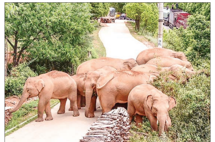
Photo taken by a drone shows the herd wandering in the Jinning District of Kunming, capital of southwest China's Yunnan Province, on 4 June 2021.