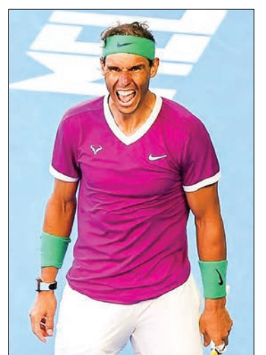
Rafael Nadal celebrates his epic five-set win against Canada's Denis Shapovalov to reach the Australian Open semi-final.

"I was honestly destroyed physically. But my serve worked well, and for me, every game that I was winning with my serve was a victory," said Nadal, who will have two days to recuperate before Friday's semi-finals. "Being in semi-finals means a lot to me and to have a victory against a great player after all the things that I went through, so it's an amazing news. I'm super happy." It will be Nadal's seventh semi-final in