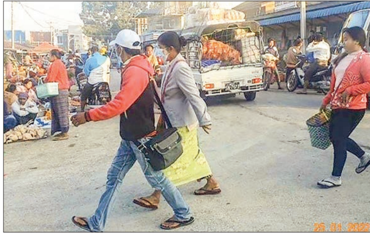
At the Central Market.

markets reopening and trading peacefully.