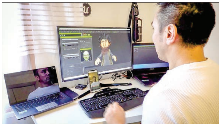
Google is accused of misleading consumers on privacy protections in new lawsuits.

A group of top US justice officials accused Google in lawsuits Monday of tracking and profiting from users' location data, despite leading consumers to think they could protect their privacy on the tech giant's services.