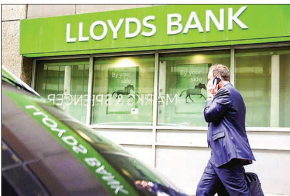
A man uses a mobile phone as he walks past a branch of a Lloyds bank, operated by Lloyds Banking Group, in the City of London.

The 'City' financial sector has also yet to strike a post-Brexit deal with Brussels on equivalence, which would allow London-based firms to fully operate in Europe.—AFP ■