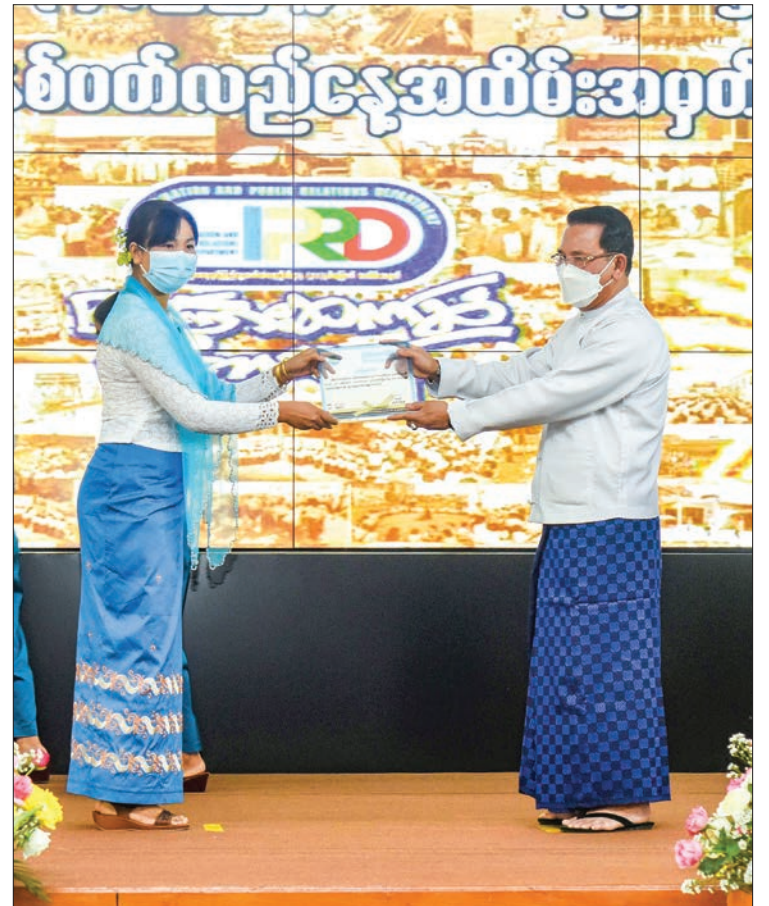
The MoI Union minister presents one of the best performance awards.

The documentary of IPRD work history was then presented and the ceremony was concluded after a staff officer on behalf of the winners expressed thanks for presenting the awards. — MNA