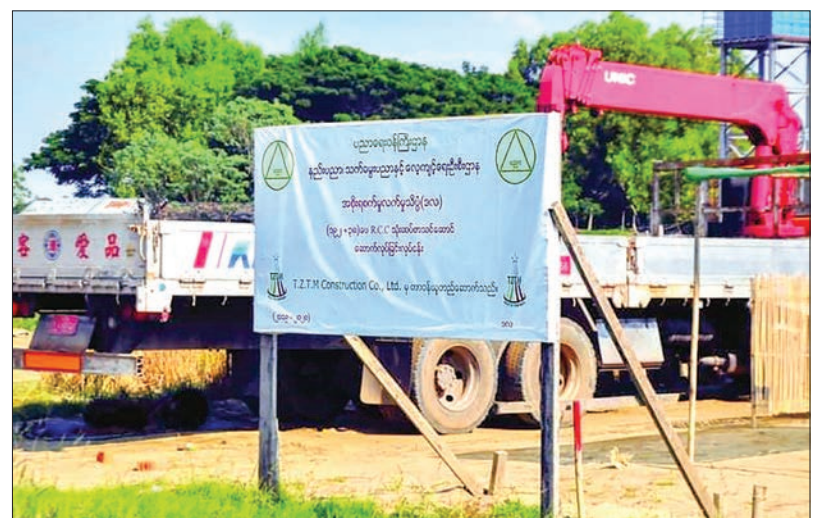
Upon completion of the project, the institute is expected to produce about 300 engineers holding AGTI Diploma certificates yearly.

Upon completion of the project, the institute is expected to produce about 300 engineers holding AGTI Diploma certificates yearly.