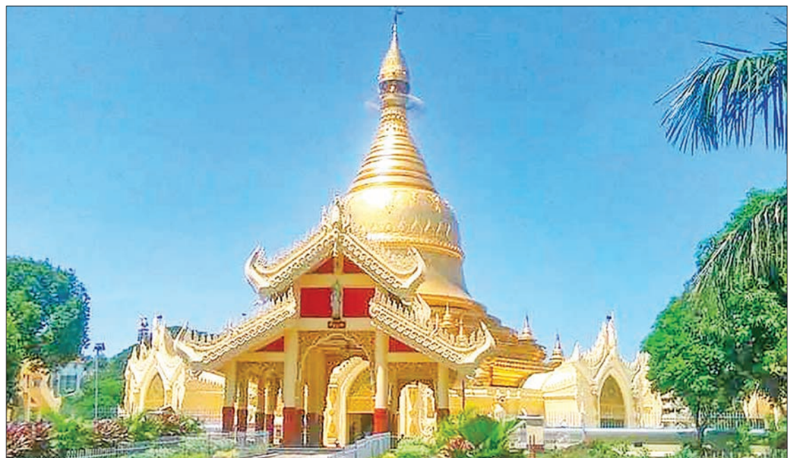
Maha Wizaya Pagoda.

Those devotees who want to make merits by offering the gold foils at Maha Wizaya Pagoda can contact the mobile number (09 424551167) of Pagoda Trustees Board's office.