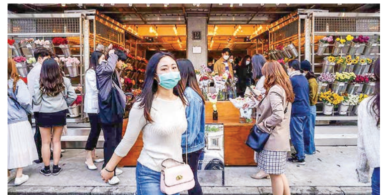
People wearing face masks walk along a street in the Yeonnam district of Seoul.

Bank officials have lifted the benchmark rate three times since August — the latest hike this month took them to 1.25 per cent — and have indicated