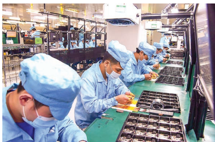
Staff wearing masks work at the factory of OPPO in Dongguan, south China's Guangdong Province, 13 February 2020.

Domestic consumption increased 3.6 per cent, having contracted five per cent the year before.—AFP ■