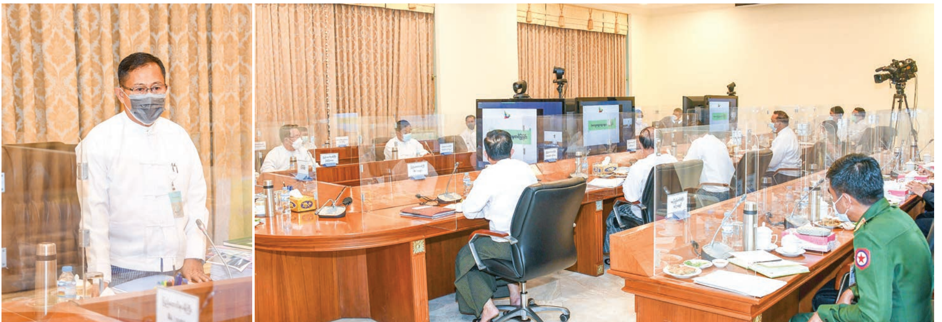
State Administration Council Vice-Chairman Deputy Prime Minister Vice-Senior General Soe Win presides over the 2 nd coordination meeting of the Central Committee on Organizing Diamond Jubilee Union Day 2022 in Nay Pyi Taw on 25 January 2022.

A CTIVE participation of relevant region and state governments and individual participants can be seen to hail the Diamond Jubilee Union Day with regard to using the vehicles, said Chairman of the Central Committee on Organizing the Diamond Jubilee Union Day 2022 Vice-Chairman of the State Administration Council Deputy Prime Minister Vice-Senior General Soe Win at the second coordination meeting of