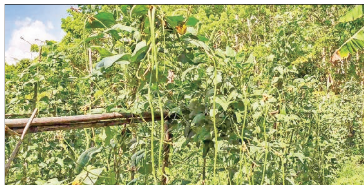
Mudon township mainly grows rubber plantations and agriculture. It is also learnt that people from Mudon township are growing other crops and vegetables to make money to support their families.

The long bean is a necessary crop not only for the housewives but for the Myanmar rice noodle soup (locally called Monhinga) sellers. So, the local growers are happy, making a profit by selling the long beans. — Aung Myo Thu (IPRD)/GNLM