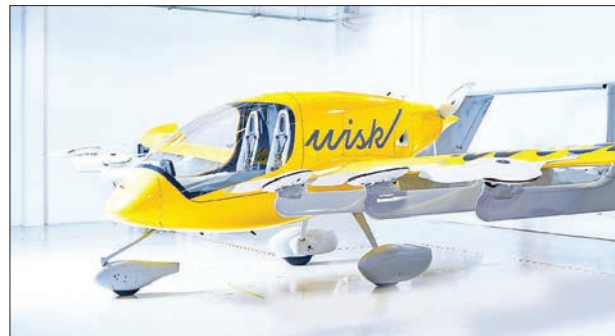
Electric air taxi startup Wisk Aero is co-developing air taxis with Kitty Hawk. The startup raises a new round of funding from Boeing. With the $450 million investment into Wisk Aero, Boeing is possibly going to become "one of the most well-funded [advanced air mobility] companies in the world."

The latter has said it wants to win US certifi-