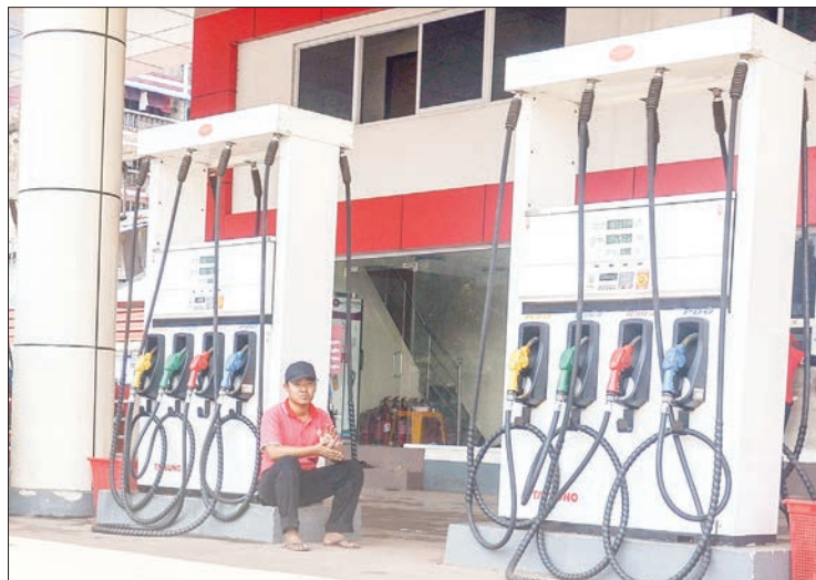
One of the petrol stations in Yangon.

When a dollar was valued at only K1,330 in early February, the fuel oil was estimated at K590 per litre for Octane 92, K610 for Octane 95, K590 for diesel and K605 for premium diesel in early February 2021 in the