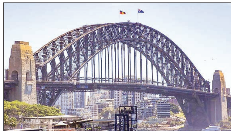
The Australian and Aboriginal flags fly on Sydney Harbour Bridge as part of Australia Day celebrations in Sydney on 26 January 2021.