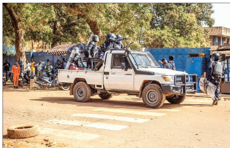
Security forces patrol the streets during a demonstration in Ouagadougou, Burkina Faso, 22 January 2022.

MUTINOUS troops in restive Burkina Faso arrested President Roch Marc Christian Kabore on Monday and detained him in army barracks a day after staging an uprising, security sources told AFP.