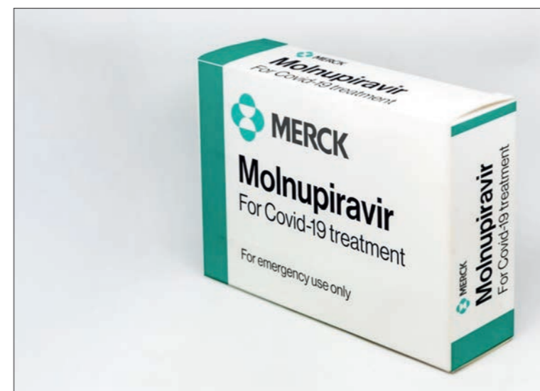
Antivirals like Molnupiravir work by decreasing the ability of a virus to replicate, thereby slowing down the disease. Molnupiravir is an antiviral medication that inhibits the replication of certain RNA viruses. It is used to treat COVID-19 in those infected by SARS-CoV-2.