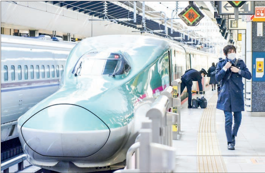
A shinkansen bullet train operated by East Japan Railway Co. is pictured at Tokyo Station on 20 January 2022.

The new programme also comes as JR East expects a second straight annual net loss in the year to March, as teleworking, in-