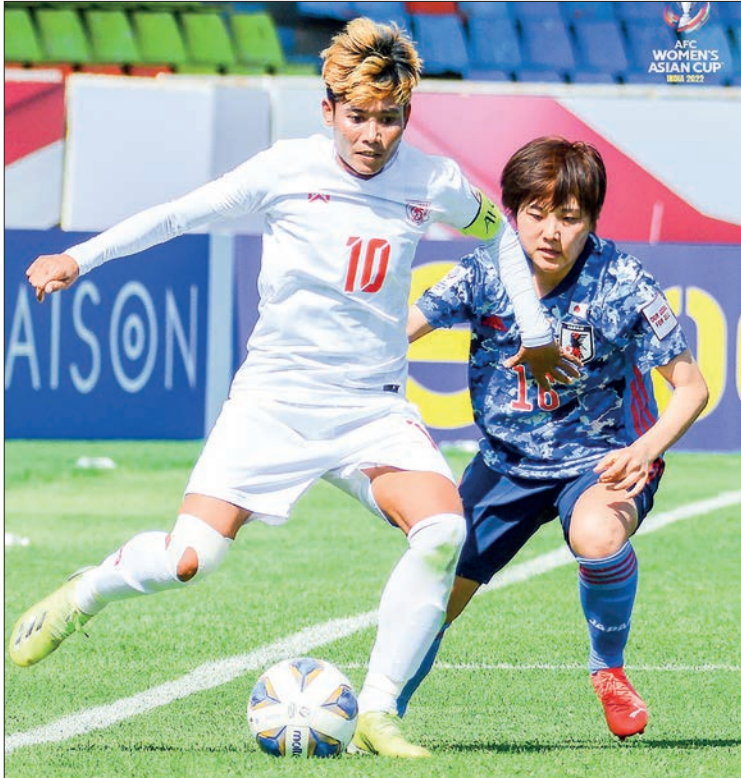
Myanmar's star player Khin Marlar Tun dribbles the ball during the AFC Women's Cup Group C match against Japan at Shri Shivchhatrapati Sports Complex, in Maharashtra, India on 21 January 2022.

MYANMAR team suffered 0-5 loss to defending champions Japan team in the first-day match of the 2022 AFC Women's Cup Group C at Shri Shivchhatrapati Sports Complex, in Maharashtra, India yesterday.