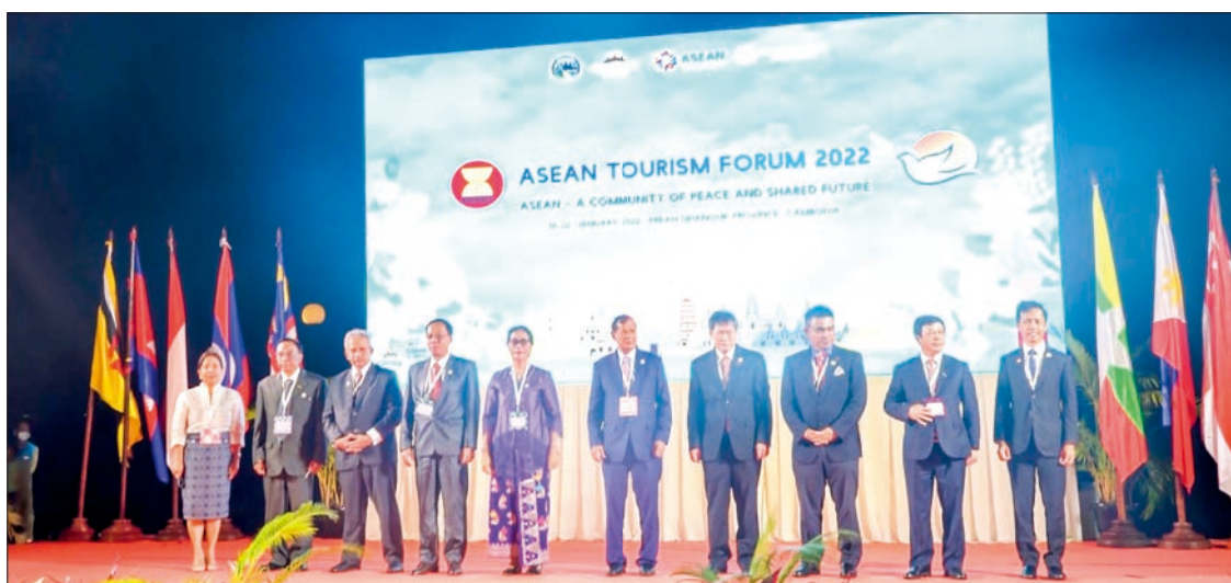
The 40 th ASEAN Tourism Forum 2022, ASEAN Tourism Ministers' Meeting and related meetings are held from 17 to 20 January in Cambodia.

At the meeting with Tourism Minister of Cambodia Dr Thong Khon and officials on 18 January, the Union Minister discussed the renewal of the Action Plan on Tourism Cooperation 2017-2020 between the two countries, including direct flights between Siem Reap and Bagan as per the action plan; human resource development for ecotourism and community-based tourism; matters to recognize internationally the combination of the Enchanting Myanmar Health & Safety Protocol implemented by Myanmar and the ASEAN Guidelines for Hygiene and Safety; joint tourism marketing in the post-COV-