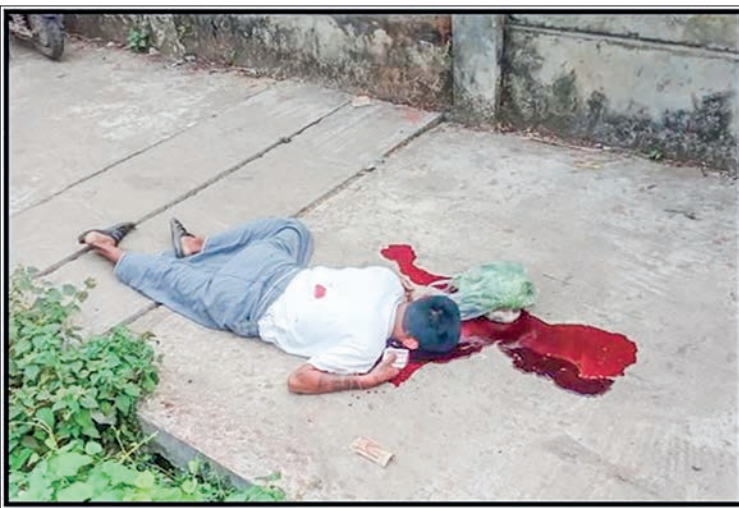
Killing the innocent.

According to the statement of the arrested suspects, Hline PDF terrorists committed the following acts of violence: