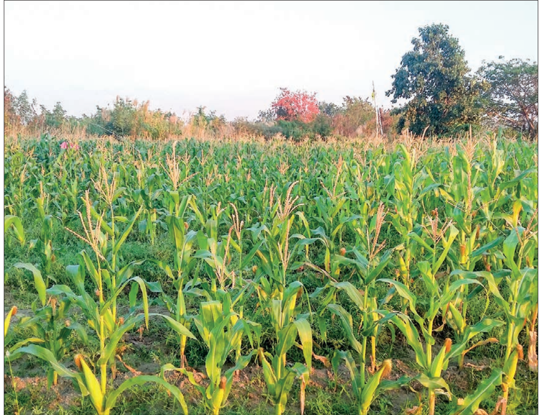
At present, corn is cultivated in Shan, Kachin, Kayah and Kayin states and Mandalay, Sagaing and Magway regions. Myanmar has three corn seasons. The country yearly produces 2.5-3 million tonnes of corn.

THE price of corn seeds has sustained its upward momentum and is now around K800 per viss, according to the domestic market.