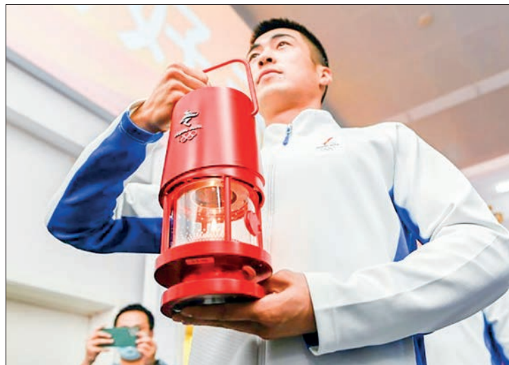
The flame of the Beijing Winter Olympics on tour at a university.

THE already scaled back Beijing Winter Olympics torch relay will be cordoned off from the general public because of Covid measures, organizers said on Friday.