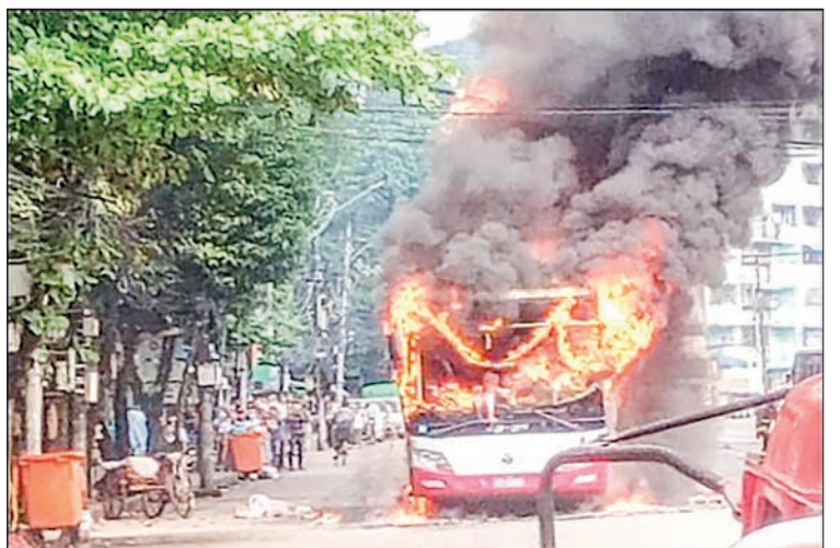
Bomb attack on YBS bus.

Arrested suspect Lin Htet revealed that the Pa Ka Pha ter-