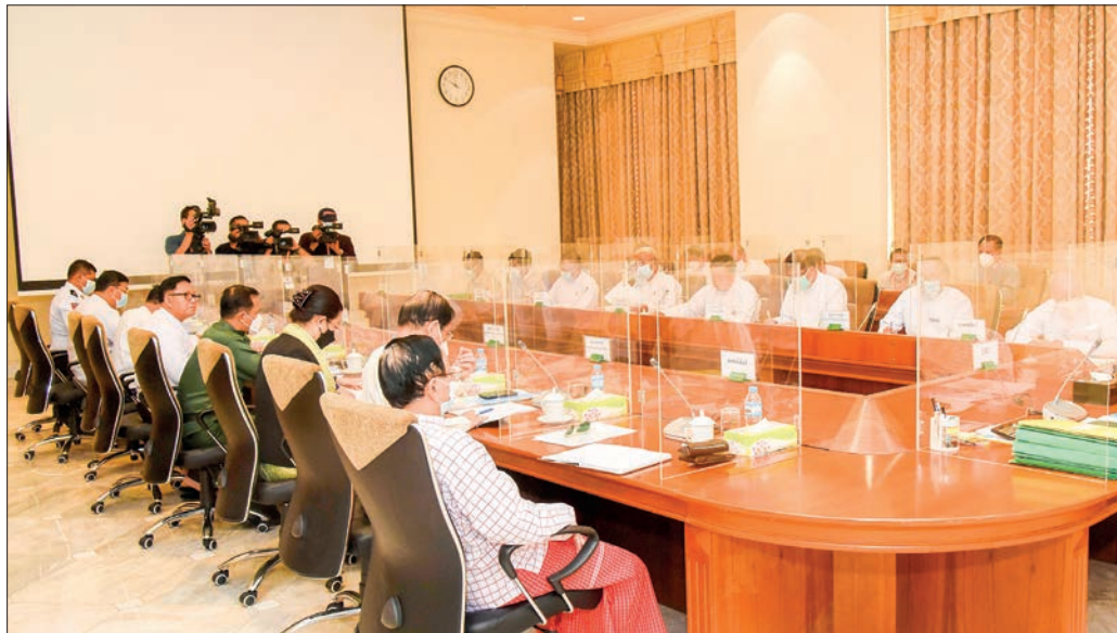
The coordination meeting 1/2022 of the Ethnic Affairs, Public Management and Services Committee in progress.

The attendees to the meeting discussed their respective sectors and the Union minister made approval for the motions proposed by the ministries to submit to the Union Govern-