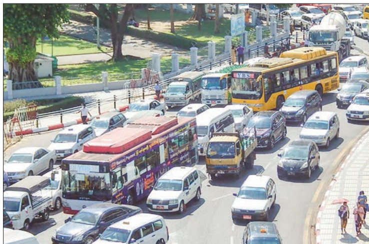
Yangon Region had the highest number of traffic accidents in the year 2021, followed by Bago Region.