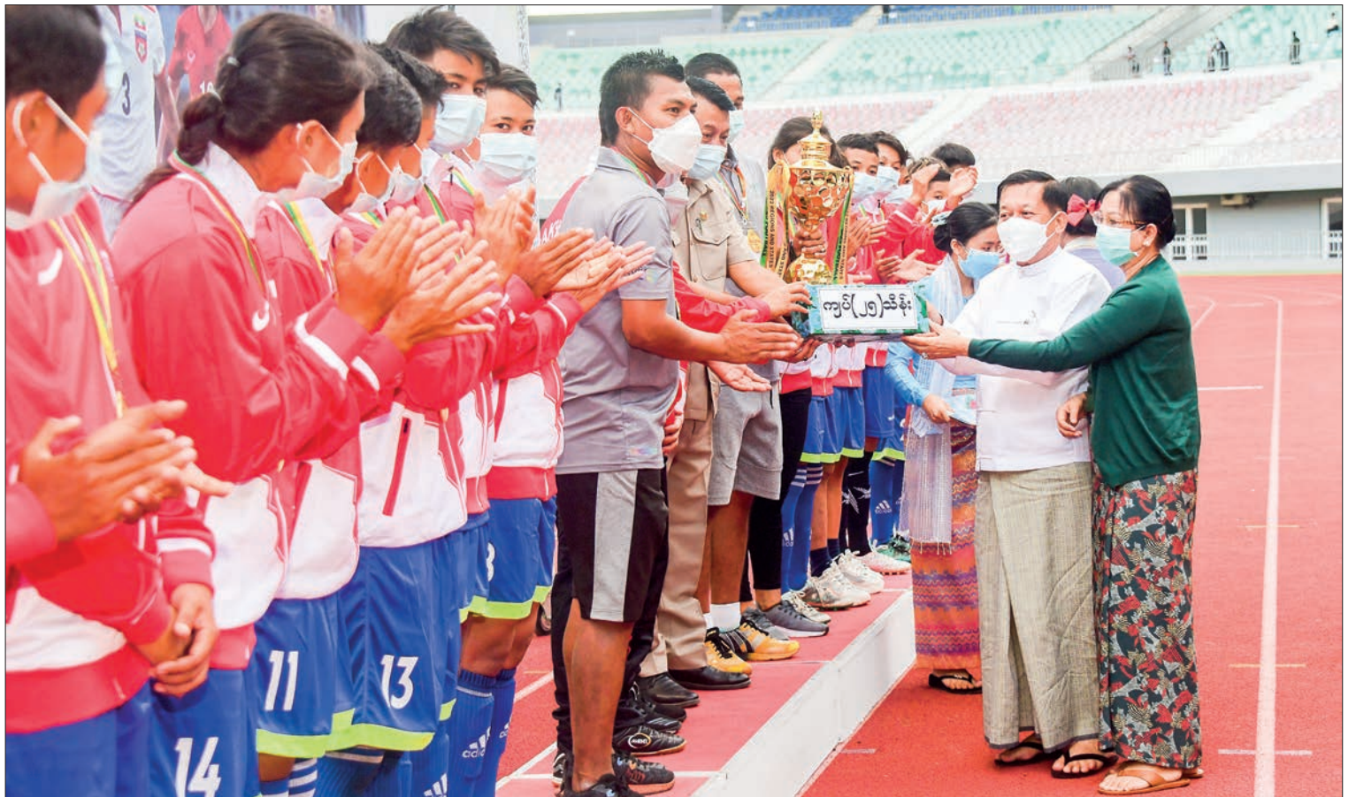
Chairman of the State Administration Council Prime Minister Senior General Min Aung Hlaing and wife Daw Kyu Kyu Hla present the cash award and championship trophy to Champions Rakhine State.

A total of 289 players from 13 football teams participated in the Inter-State/Region U-25