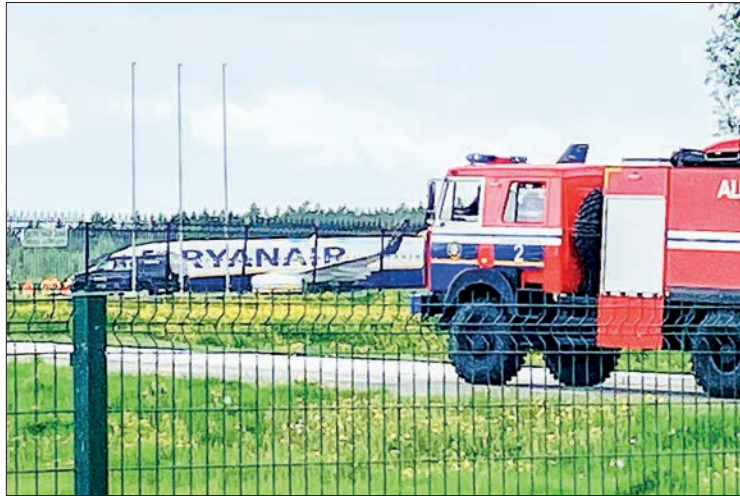
A Ryanair Boeing 737-8AS (flight number FR4978) is parked on the Minsk International Airport's apron in Minsk, Belarus, 23 May 2021.

The charges, filed in federal court in New York, said Ryanair Flight 4978 from Athens to Vilnius