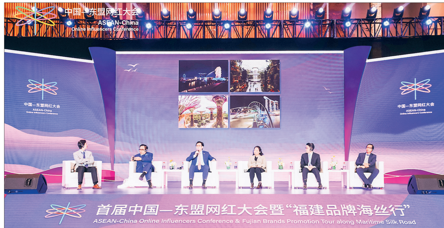
The event focused on economic and trade cooperation and cultural exchanges between China and ASEAN, and held three dialogues on digital economy, influencer economy and cross-border e-commerce.

It also acted as a matchmaker between Chinese and ASEAN enterprises. Fujian Asia-Pacific