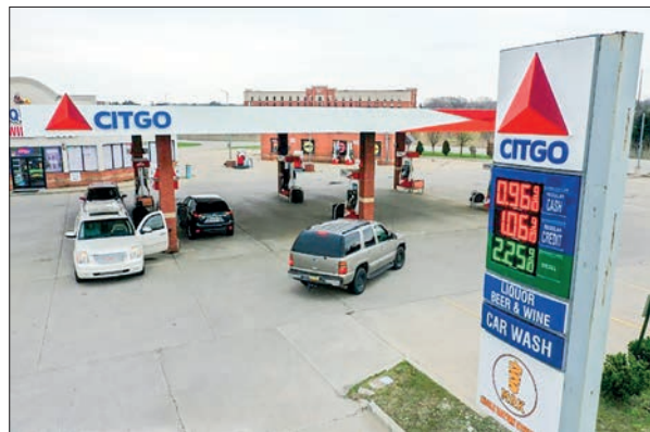
Citgo is the US subsidiary of the troubled Venezuelan state owned oil company PDVSA.

The Houston-based company has been controlled by parties opposed to the government of President Nicolas Maduro since early 2019, when US sanctions against PDVSA took effect.