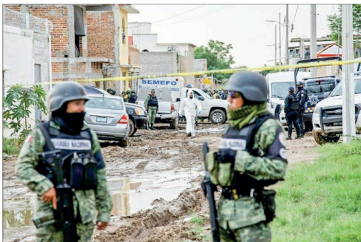
Members of Mexico's National Guard deploy near a crime scene in Irapuato in the central state of Guanajuato.

MEXICO recorded 33,308 murders last year, marking a 3.6 per cent decrease compared with 2020, in a country long plagued by drug cartel violence, official figures showed Thursday.