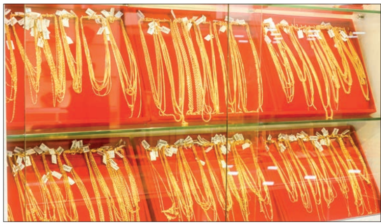
Gold jewellery is seen at one of the Yangon gold jewellery outlets.

In January 2021, the gold price was ranged between the minimum of K1,316,000 per tical (28 January) and the maximum of K1,336,000 per tical (6 January). It reached an all-time high of K1,410,000 per tical on 3 February and hit the minimum of K1,340,000 per tical on 2 February. In March, the rate fluctuated between the highest of K1,391,000 (25 March) and the lowest of K1,302,000 (4 March). The price was registered the highest of K1,455,000 (30 April) and the lowest of K1,389,000 (1 April). The price reached an all-time highest of K1,709,000 (12 May) and the lowest of K1,447,000 in May. The price moved in the maximum of K1,575,500 (11 June) and the minimum of K1,543,000 (19 June). It fluctuated between K1,562,300 (26 July) and K1,587,000 (K1,587,000). The price of gold reached the lowest of K1,572,800 (3 August) and the highest of K1,698,000 (31 August). It was recorded the lowest of K1,703,500 (1 September) and edged up to K2,220,000 (28 September). The price was ranged between K1,768,500 (27 October) and K2,030,000 (1 October). It elevated to K1,810,000 (6 November) and plunged to K1,768,500 (24 November). It was traded between K1,768,500 (6 December) and K1,823,000 (29 December), the gold traders said. — NN/GNLM