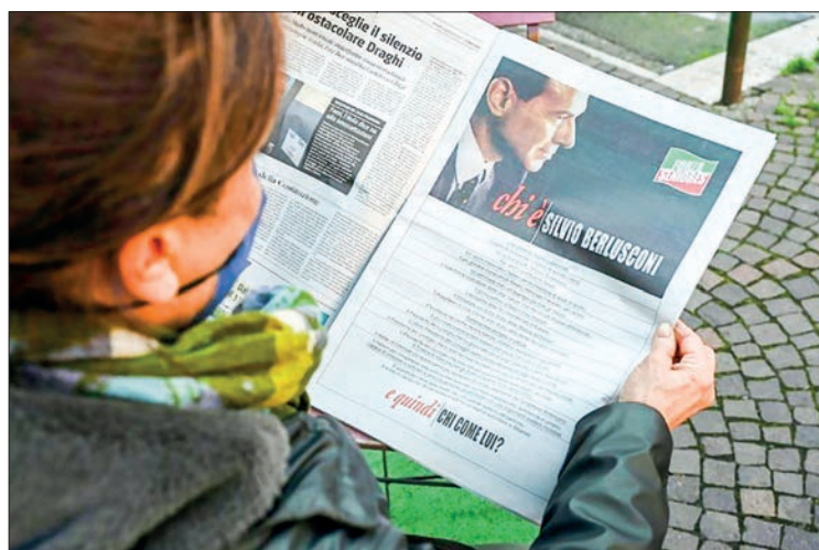
Former Italian prime minister Silvio Berlusconi has taken out advertising space in newspapers to promote his campaign for the presidency.

While a largely ceremonial role, the president wields considerable power in times of political crises, from dissolving