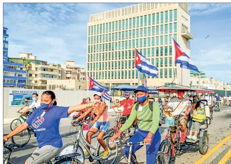
The US embassy in Cuba, where staff in 2016 complained of mysterious, debilitating symptoms that were dubbed "Havana Syndrome".

The reports of unexplained physical ailments spread to US officials in China, Russia, Europe and even Washington, sparking a broader investigation by the government and direct accusations that Russia had an unknown electronic or sound-based weapon.—AFP ■