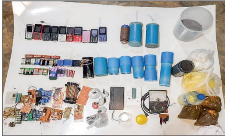
Seized explosives and related items.