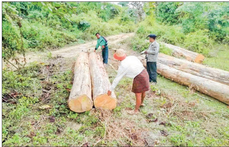
Confiscated illegal teak.

Similarly, under the management of the Anti-Illegal Trade Task Force and led by the Department of Forest, a search of the Dauntchaung village tract