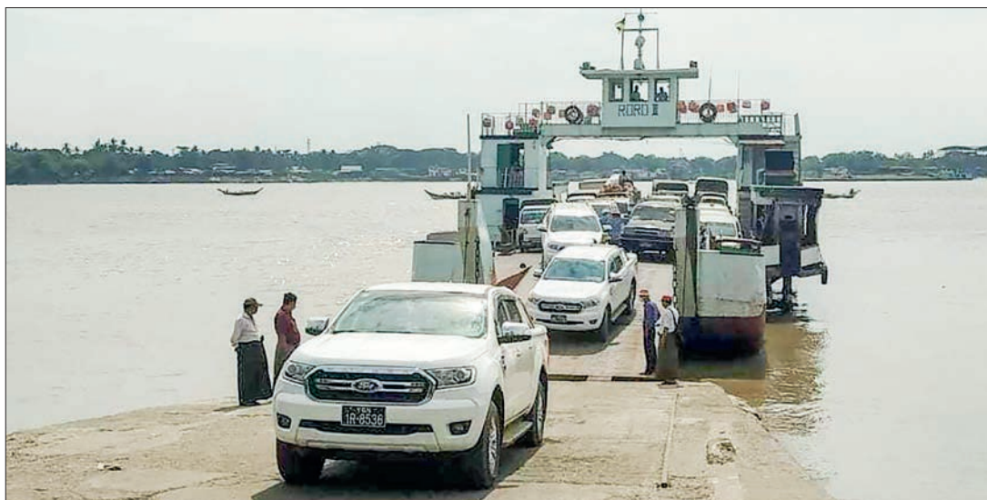
The ferry on the Yangon Wadan-Dala route was plying to and from the ports between 6 am and 6:45 pm.

only gateway to local people in southern Yangon-Dala, Twantay, Kawhmu and Kungyangon townships and some townships in Ayeyawady Region to link with the commercial city hub of Yangon. The service contributes to the health and socio-economic development of the local community.