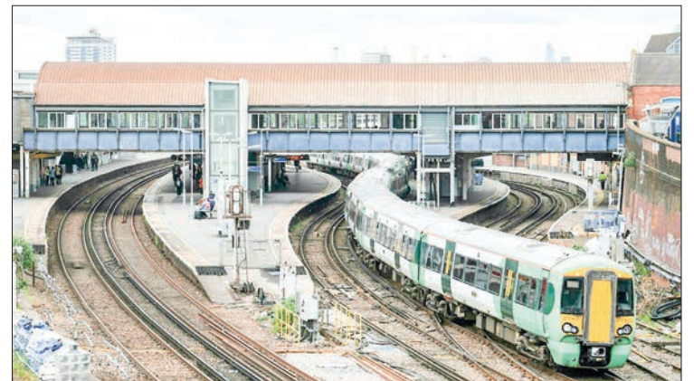
The so-called 'tannoy spam' is expected to be removed in the coming months.

Transport Secretary Grant Shapps said the measures were aimed at improving the railways for those who use them frequently. "I'm calling for a