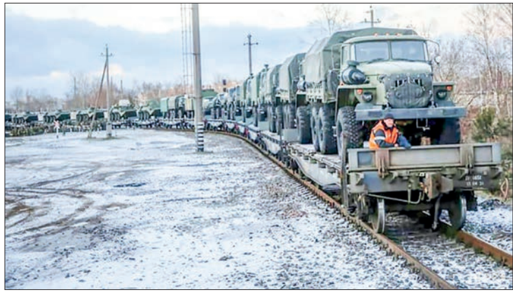
Russian troops arrived in Belarus, near Ukraine, as seen in this handout photograph from Belarus' defence ministry.