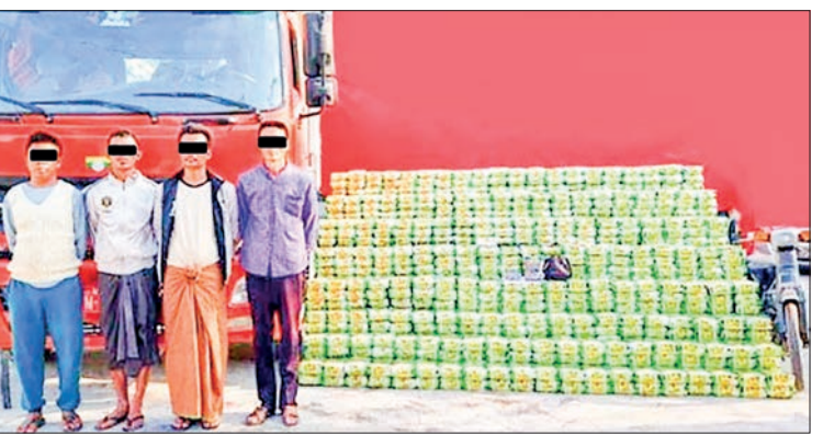
Four suspects are arrested together with Methamphetamine worth K 19.8 billion in Kyaukse Township.

A total of K19.8 billion worth of Ice (Methamphetamine) were seized in Kyaukse Township, Mandalay Region, according to the Myanmar Police Force.