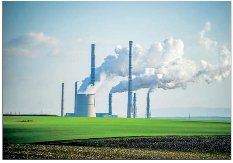
Electricity generation from coal and natural gas hit record levels last year, the IEA says.

This pushed prices to unprecedented levels while emis-