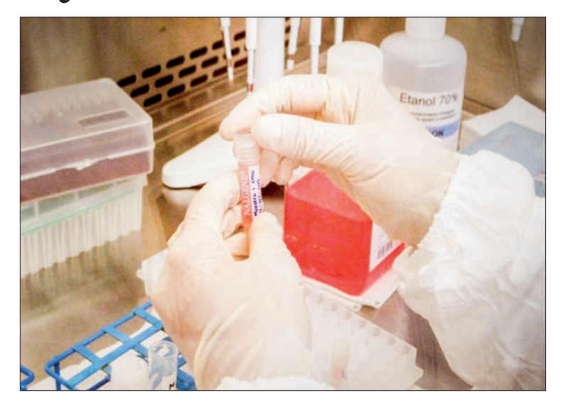
EBV is a herpes virus that can cause infectious mononucleosis — sometimes called kissing disease — and stays in the host for their whole life.

"This is a big step because it suggests that most MS cases