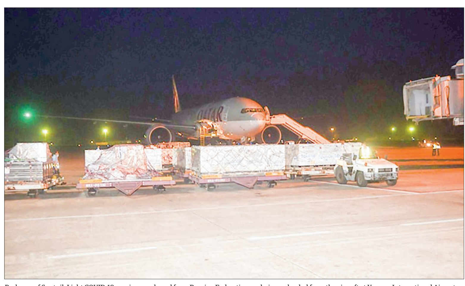
Packages of Sputnik Light COVID-19 vaccine purchased from Russian Federation are being unloaded from the aircraft at Yangon International Airport on 16 January 2022.

Sputnik Light COVID-19 vaccine requires only one dose per person and will greatly contribute to the rapid coverage of the COVID-19 vaccine in Myanmar. The vaccines have been stored at the Central Vaccine Store Depot in Yangon and will be distributed to regions and states.—MNA