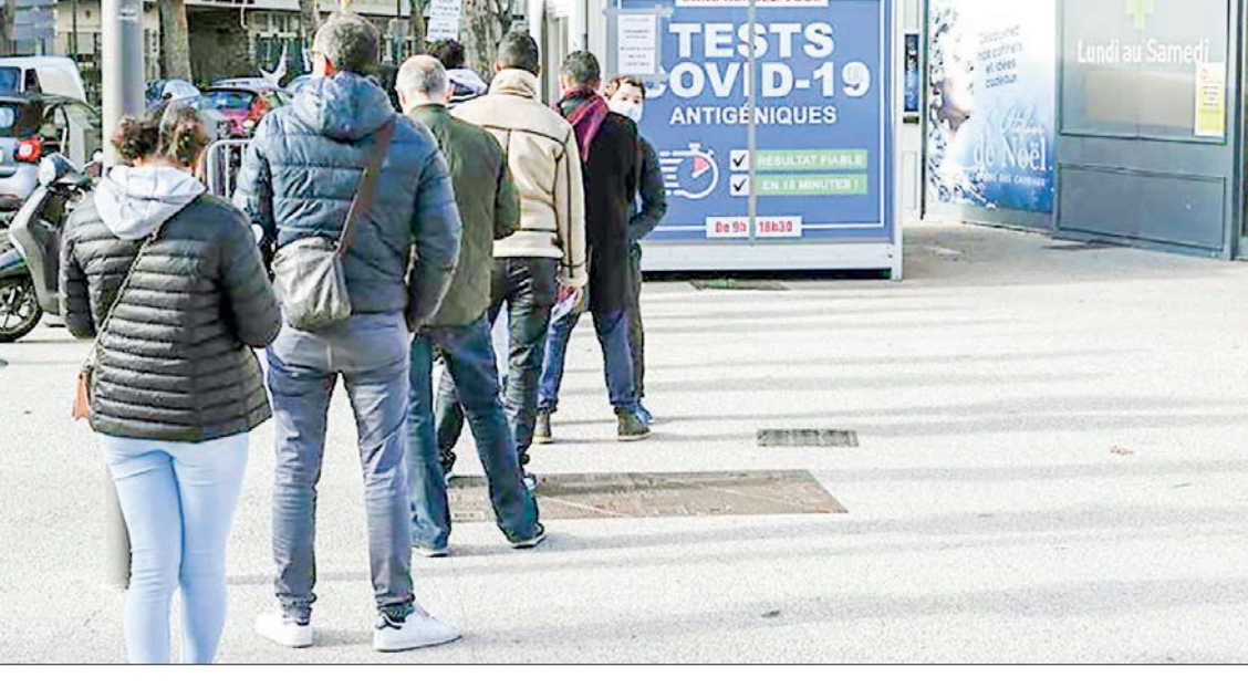
People queue outside a pharmacy for Covid-19 antigenic testing on Monday in Marseille, as France announces plans to bolster its testing capacity amid a surge fuelled by the Omicron variant.

The number of cases soared by 210 percent in Asia, 142 per-