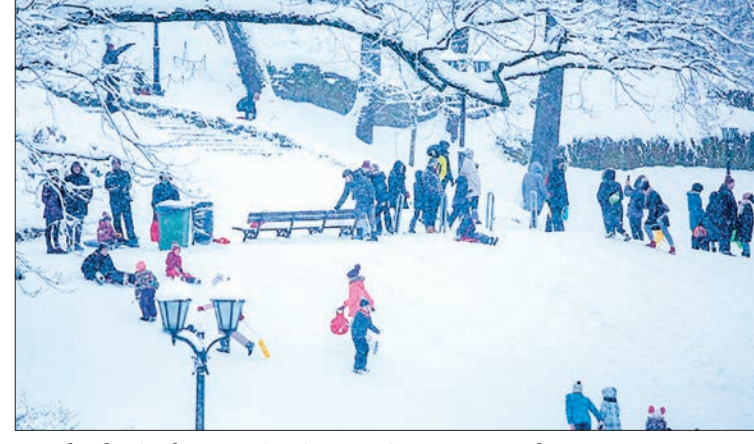
People play in the snow in Riga, Latvia, on 4 December 2021.

RIGA, the capital of Latvia, was battered by gale-force winds