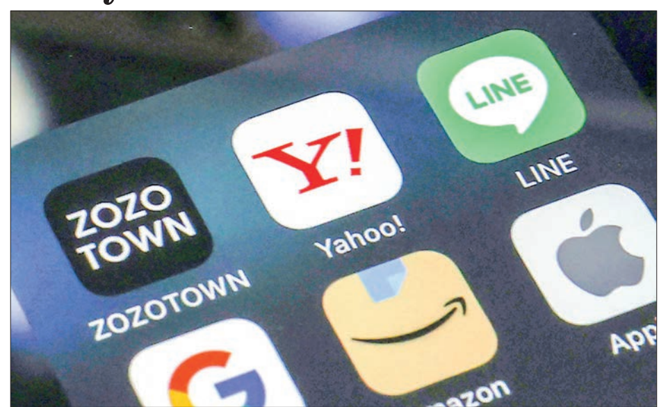
Photo taken in May 2021 shows a screen with an icon of Yahoo Japan Corp's app (top C).

Yahoo Japan introduced the "Office Anywhere" system in 2014 to allow for working outside the office and scrapped a rule on working in the office at least five days a