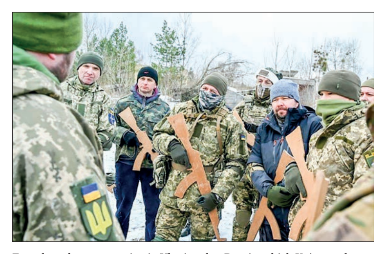
Fears have been mounting in Ukraine that Russia, which Kyiv says has massed around 100,000 troops on its side of the border, is plotting to launch a large-scale attack.

ousting of Ukraine's former pro-Russia president in 2014 by seizing in a lightning military operation the Ukrainian Black