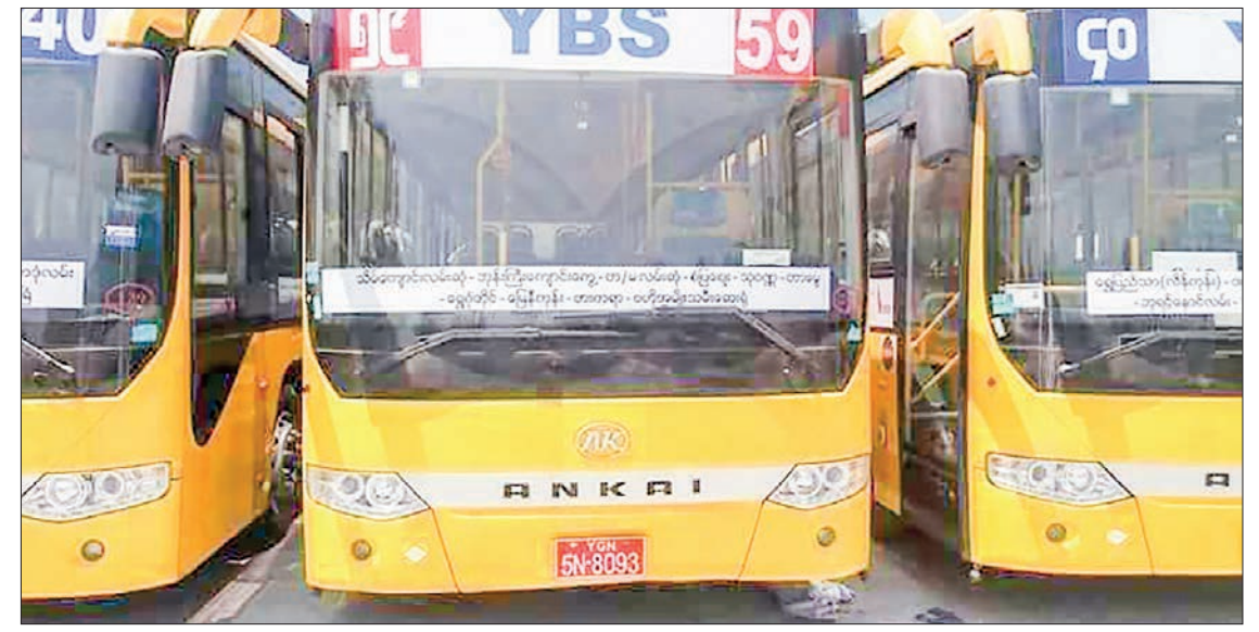
YBS buses are parking at the terminal waiting for their turn to transport passengers in Yangon City.

CARD payment system has been installed on more than 1,900 buses under YBS system and the negotiations are being undertaken