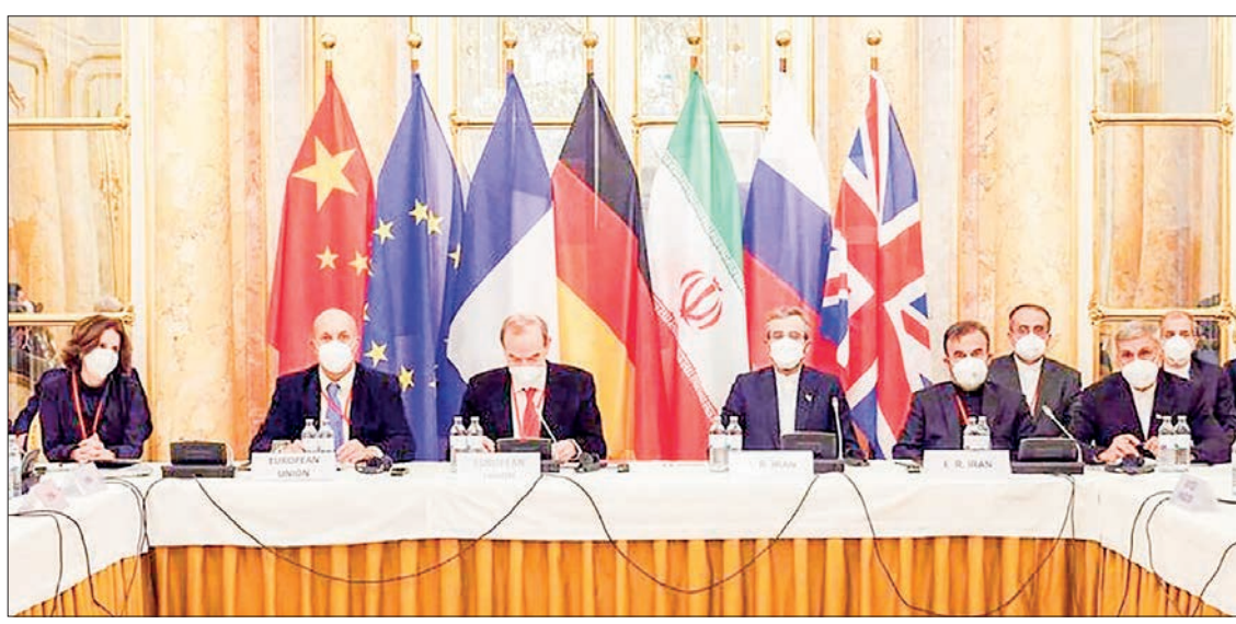
This 3 December 2021 photo shows a meeting of the Joint Commission on the Joint Comprehensive Plan of Action (JCPOA) in Vienna, Austria.

"Before Christmas, I was very pessimistic," he said, adding that "today I believe reaching an accord is possible," even within the coming weeks.