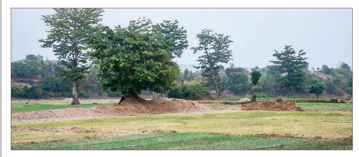
Croplands are placed under onion plantations in winter cultivation season in Kyaukpadaung Township in Mandalay Region. PHOTO: KO HTEIN (KPD)

The onions are primarily grown in Mandalay, Magway and Yangon regions, Nay Pyi Taw and Shan State.— Ko Htein (KPD)/GNLM