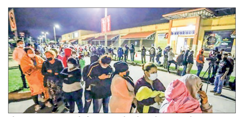
The migrants are mostly from Central and South America, but some have come from as far as Africa — seeking a better life away from gang violence and drug cartels.

HUNDREDS of men, women and children gathered early Saturday morning in the parking lot of San Pedro Sula's main transit hub, on the edge of the northern Honduran city.