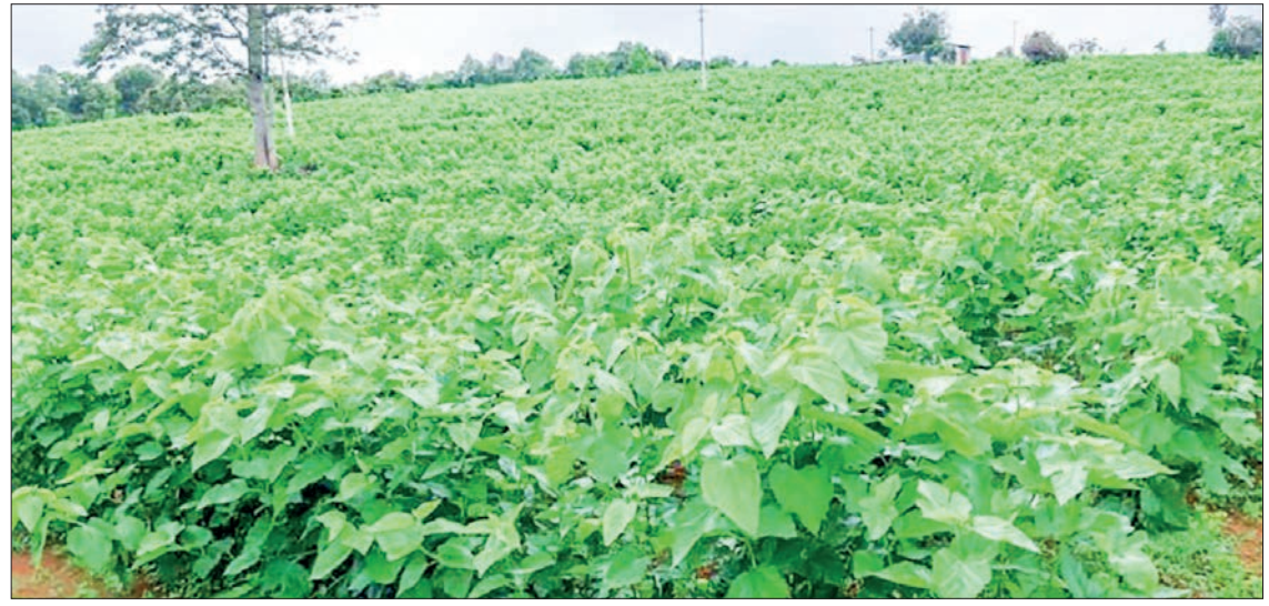
Mulberry plants are thriving in the farm for sericulture industries in PyinOoLwin Township. \begin{tabular}{ll} \bf PHOTO:MIN \\ \bf HTET AUNG \end{tabular}

"The mulberry is perennial and it is mostly cultivated