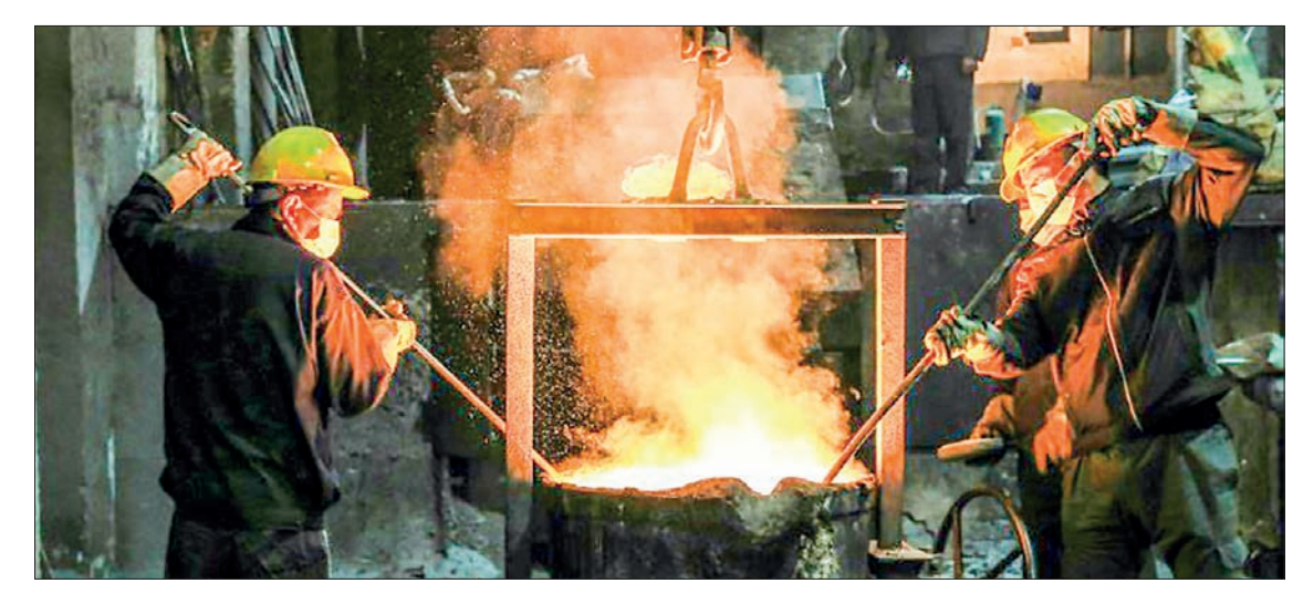
China's strong recovery from the Covid-19 pandemic is threatened by Omicron and a property sector slowdown.

China's exports surged nearly 30 percent last year on solid global demand as countries reopened from pandemic lockdowns, boosting its stuttering economy. But the country's recovery in the second half of 2021 was hobbled by a series of outbreaks - with officials reimposing strict containment measures -- as well as power outages