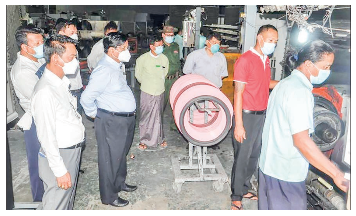
Union Minister for Industry Dr Charlie Than views round production process at No 22 Heavy Industry (Bilin).

The President of the Myanmar Engineer Council discussed the prohibited activities and permitted activities included in the provisions of