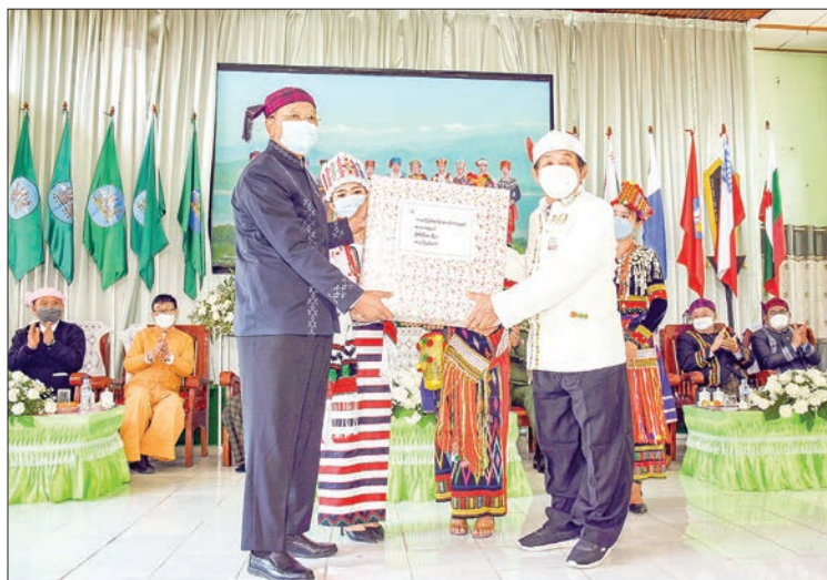
Cash assistance and gifts are presented at the event.

party observed books on ethnic literature and pamphlets, and the law books on ethnic rights displayed in the new office building. Afterwards, they met with members of the Kachin, Shan and Bamar ethnic literature and cultural associations at Manaw House inside the Manaw Ground in Myitkyina and provided cash assistance and souvenirs. Chairman of the Kachin Ethnic Traditional and Cultural Association