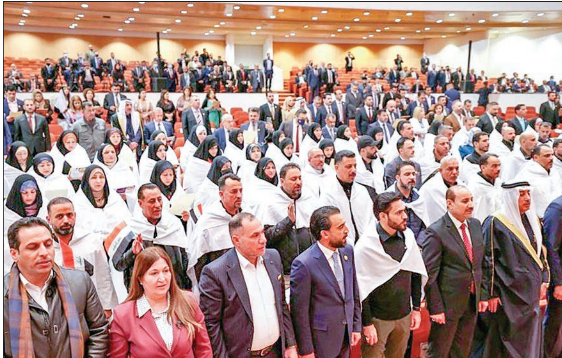
Iraqi lawmakers attend the inaugural session of parliament — analysts warn there are still several hard steps ahead before the formation of a new government.

THREE tense months after legislative elections, Iraq's parliament has finally held its inaugural session — but opening debates swiftly descended into furious arguments between Shiite factions.