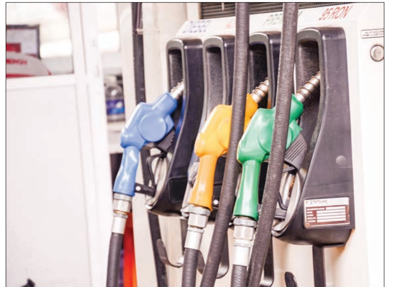
The total volume of fuel oil that are sold at very cheap rates is equivalent to the amount that the oil importers directly purchased the foreign currency from the CBM. The oil has been distributed at the subsidized rate starting from 22 September.

Normally, Myanmar yearly imports six million tonnes of fuel oil from external markets, the Ministry of Commerce indicated. — NN/GNLM