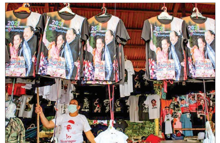
A vendor arranges T-shirts with the image of Nicaragua's President Daniel Ortega and his wife, Vice-President Rosario Murillo, in Managua on 10 January when Ortega starts his fourth term.

In Washington, the US Treasury placed sanctions on six regime officials, including two generals, the defence minister, the head of the Supreme Electoral Council and officials of the telecommunications regulator, who allegedly ran a social media troll farm to help Ortega.—AFP ■