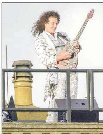
A highlight of the Queen's Golden Jubilee in 2002 saw Queen guitarist Brian May play on the top of Buckingham Palace.

The newly-elected members of parliament met for a swearing-in ceremony and to elect their speaker, but debate soon turned ugly. Videos filmed by MPs showing lawmakers becoming verbally aggressive with each other, highlighting divisions between Shiite groupings. Iraq's post-election period has been marred by high tensions, violence and allegations of vote fraud. One of parliament's first tasks must be to elect the country's president, who will then name a prime minister tasked with forming a new government.—AFP ■