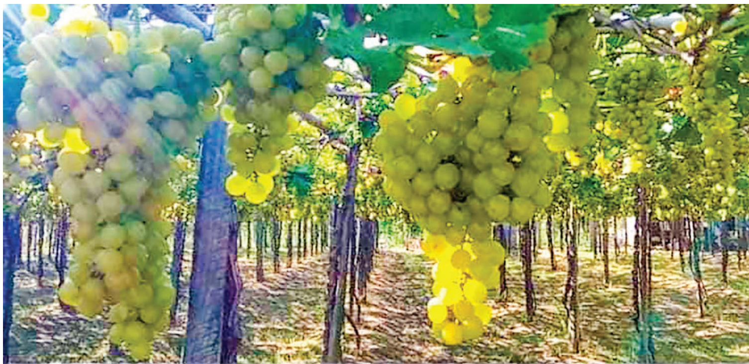
Italian grape variety will flow into markets in February. The current market prices of grapes move in the range of K2,500 to K6,000 depending on the quality and different varieties (Italian grape, RG, Black Queen, No.3 and Chun).

“Last year, it was priced at around K2,500 per viss. This year, the price is expected to