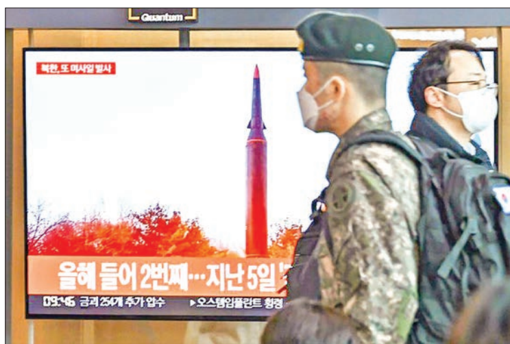
North Korea has launched its second suspected ballistic missile in a week.

in a week came after six countries, including the United States and Japan, urged North Korea Monday to cease “destabilizing actions” ahead of a UN Security Council closed-door meeting. France, Britain, Ireland and Albania joined the call for North Korea to “engage in meaningful dialogue towards our shared goal of complete denuclearization”.—AFP ■