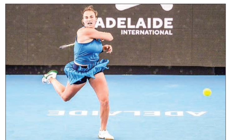
World number two Aryna Sabalenka's form has deserted her ahead of next week's Australian Open.

She took so much pace off her first serves that at one stage they were barely clearing the net. The 23-year-old Belarusian became distressed in the third set and, after being asked by the umpire whether she was all right, broke down in tears during her next service game. — AFP ■