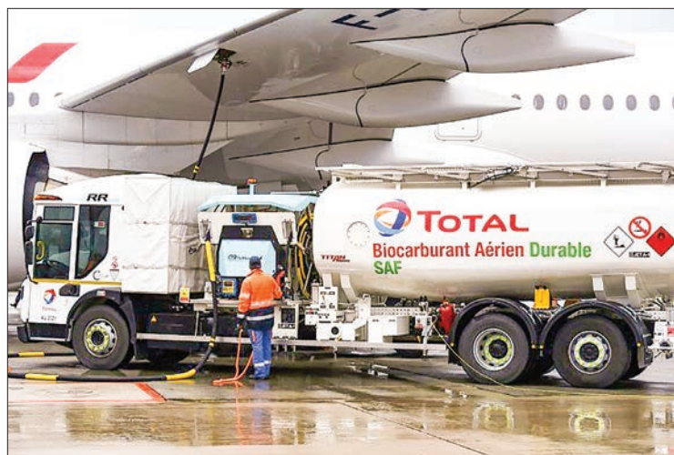
Sustainable fuel allows airlines to reduce carbon emissions by 75 per cent compared with kerosene.

AIR France-KLM said Monday it would add a surcharge of up to 12 euros ($13,50) on its tickets to try to offset the cost of using more expensive sustainable aviation fuel.