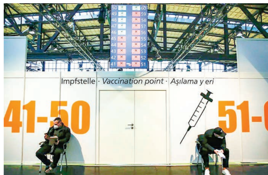
Two men wait for their vaccinations at Treptow Arena's vaccine center in Berlin, on 27 December 2020.

"We are discussing with public health leaders around the world to decide what we think is the best strategy for a potential booster for the fall of 2022," Bancel told the network. "We need to be careful to try to stay ahead of a virus and not behind the virus." — AFP