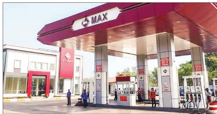
The fuel oil at the fairer price is available at 99 petrol-filling stations in Yangon, Mandalay, and Nay Pyi Taw cities and Mon, Shan and Rakhine states and Sagaing, Bago, Magway and Ayeyawady and Taninthayi regions.

ABOUT 99 petrol-filling stations from regions and states are distributing the diesel with special price starting from 11 January, it is learnt.