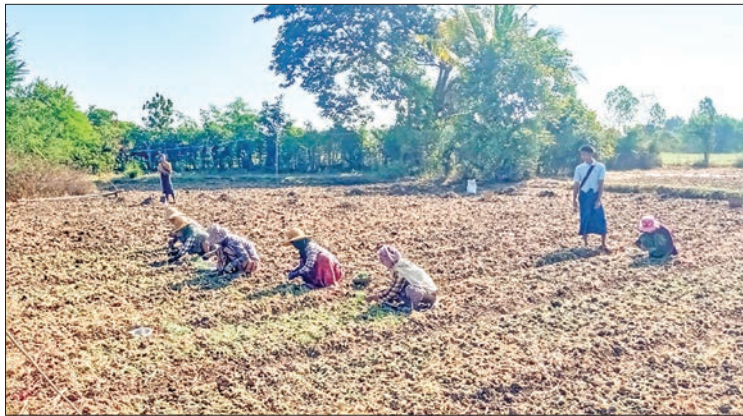
The onions are primarily grown in Mandalay, Magway and Yangon regions, Nay Pyi Taw and Shan State.

THE growers from Kanyay village, Minbu (Sagu) township, Magway region cultivate onion in their farmland and they are expecting a better price in the harvested time.