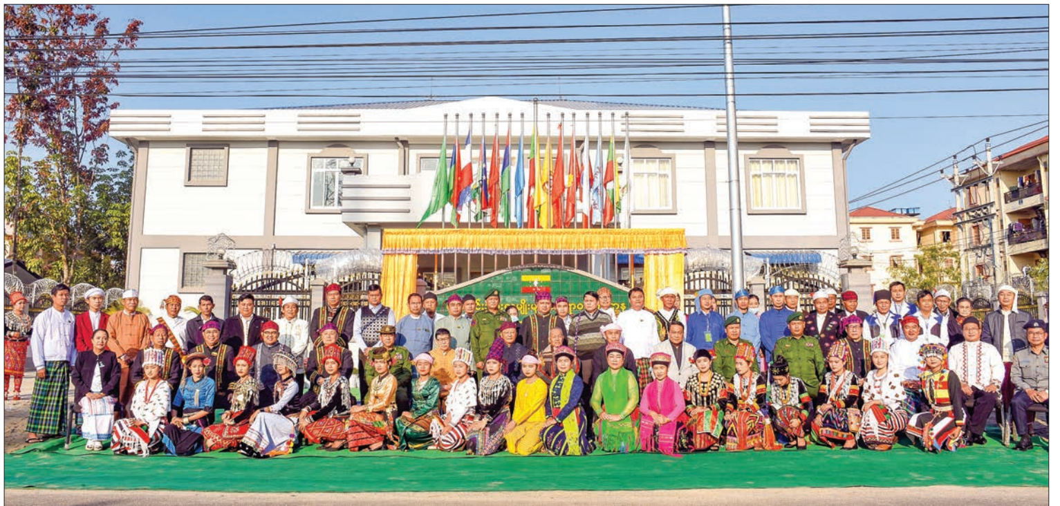
The opening ceremony of the MoEA Kachin State director's office is held in Myitkyina yesterday.

After the opening ceremony, the SAC members and