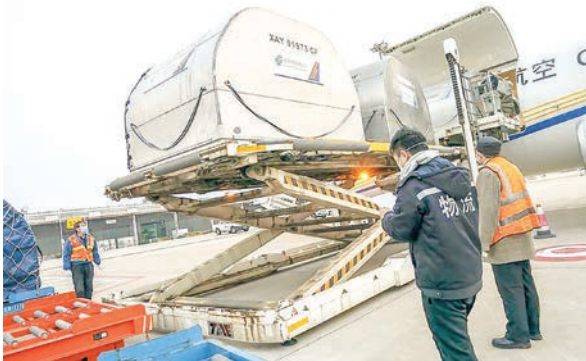
Despite the COVID-19 pandemic, the airport launched five new international freight transport routes, expanding its reach to cities including Yekaterinburg, Brussels, Bangalore, Tokyo, and Dhaka last year. Workers unload materials from a cargo plane at the Chongqing Jiangbei International Airport in southwest China's Chongqing Municipality.

Despite the COVID-19 pandemic, the airport launched five new international freight transport routes, expanding its reach to cities including Yekaterinburg, Brussels, Bangalore, Tokyo, and Dhaka last year.—Xinhua ■