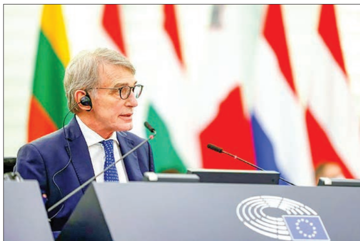
European Parliament President David Sassoli, who died Tuesday, was a former Italian television journalist who turned to politics in 2009.

ble again Monday morning but connections were far from stable. —AFP ■