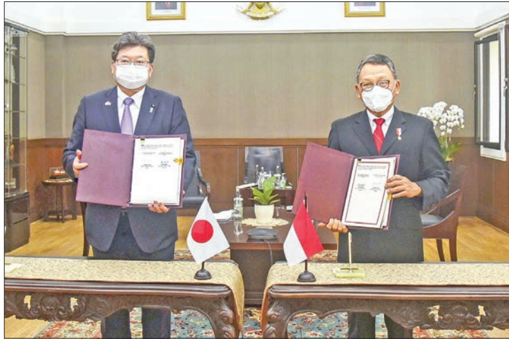
Japan's industry minister Koichi Hagiuda (L) and Indonesian energy minister Arifin Tasrif sign a memorandum on cooperation over power generation on 10 January 2022, in Jakarta.

Hagiuda asked that Indonesia understand the need to resolve the issue, saying Japanese companies have been bewildered by the ban. He also referred to a