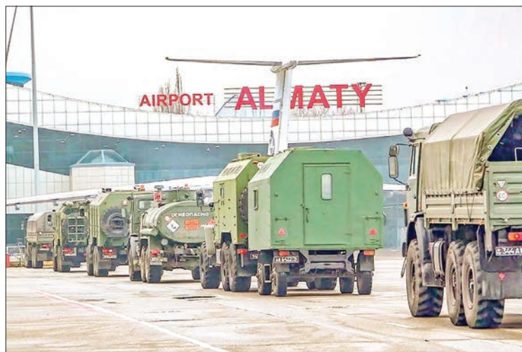
Russian military vehicles cross an airfield in Almaty.

Almaty, the country’s main city and former capital, had