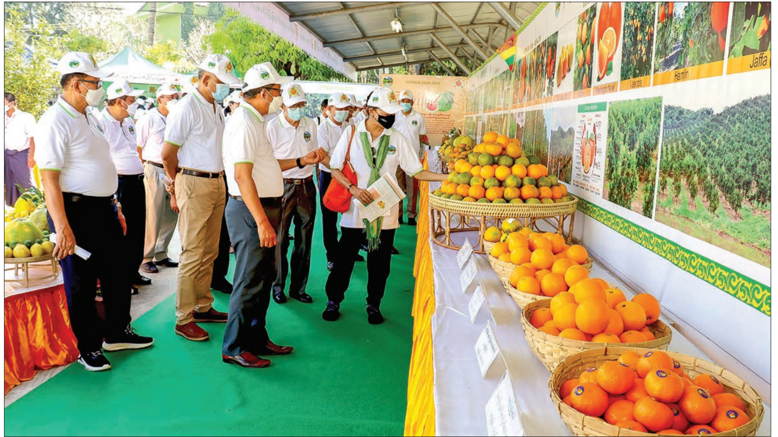
The SAC members, Union ministers, deputy ministers and officials view around the Citrus Fair 2021 on 27 November 2021.

Mr Yohei Sasakawa, Special Envoy of the Japanese Government for National Reconciliation in Myanmar and Chairman of Nippon Foundation of Japan arrived in Sittway of Rakhine State on 15 November. The Special Envoy and his team met with the displaced people living in Aungmye Bawdi Dhamma Yektha Alotawpyae Monastery