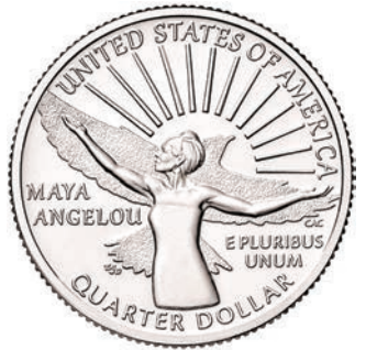
New 25-cent pieces with Maya Angelou have been minted and are going into circulation.

"It is my honour to present our nation's first circulating coins dedicated to celebrating American women and their contributions to American history," said Mint Deputy Director Ventris Gibson.—AFP ■