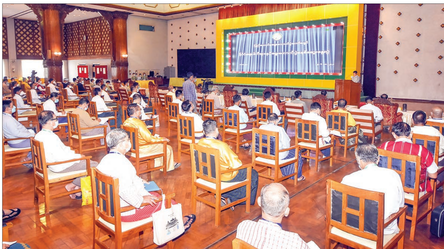
The Union Election Commission meets the representatives of political parties in Yangon on 5 November 2021.