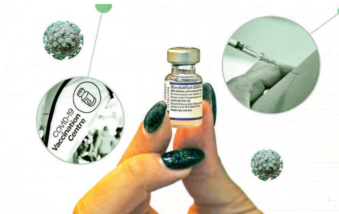
New research has found that a booster dose of a COVID-19 vaccine could produce sufficient antibodies to 'neutralize' the Omicron variant.

The scientists from KU Leuven isolated the Omicron variant of SARS-CoV-2 from a nasal sample of a 32-year-old woman who developed moderate COVID-19