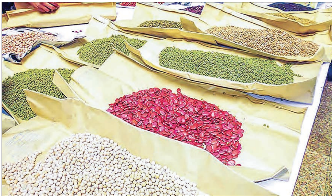
Earlier, the import policy of free imports of three Myanmar pulses was to expire on 31 January 2022. But now, it has been extended to 31 March 2022.

mung bean is about K1,285,000 per tonne, according to the Yangon Region Chambers of Commerce and Industry (Bayintnaung Commodity Exchange).