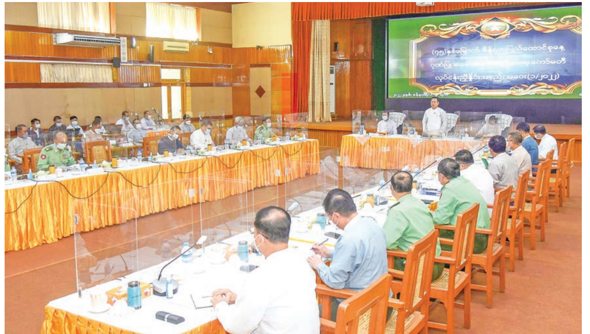
MoI Union Minister U Maung Maung Ohn chairs the coordination meeting 1/2022 of the Diamond Jubilee Anniversary of Union Day Organizing Committee yesterday.

The committee secretary and other officials briefed the organizing of committee and sub-committees on duty assignments. — MNA