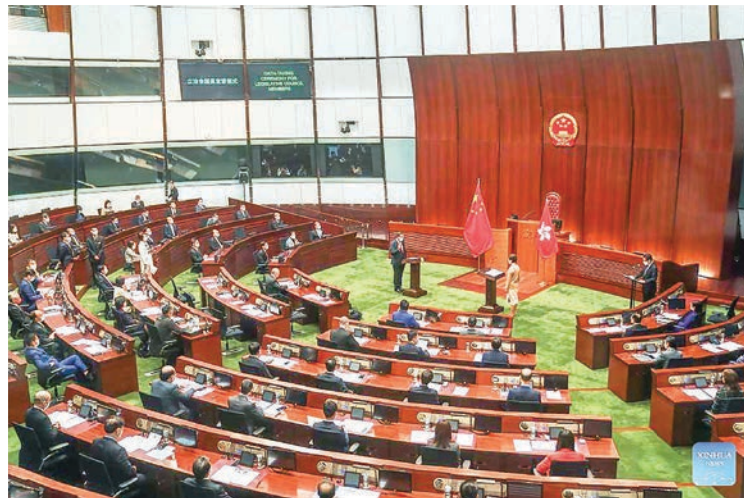
Photo taken on 3 January 2022 shows the oath-taking ceremony for 90 members of the seventh-term Legislative Council (LegCo) of China's Hong Kong Special Administrative Region (HKSAR) in Hong Kong, south China.

The seventh-term LegCo began its four-year term of office on Saturday. The new LegCo is