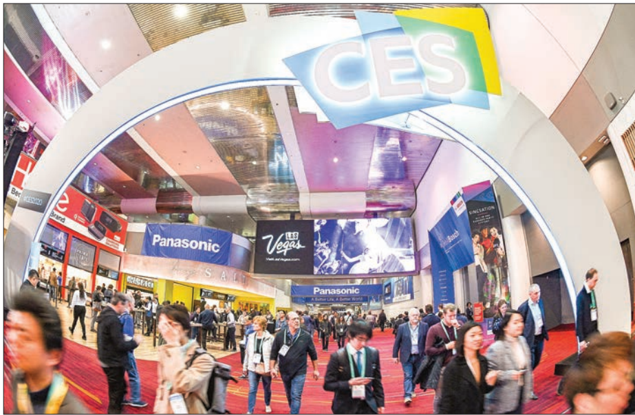
Attendees walk through the Las Vegas Convention Center 10 January 2020 on the final day of the 2020 Consumer Electronics Show (CES) in Las Vegas, Nevada.

THE Consumer Electronics Show (CES), one of the world's largest trade fairs, returns to Las Vegas in person this week under a newly resurgent pandemic that has supercharged the industry but threatens its downsized expo.