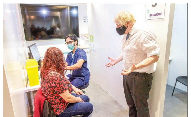
British Prime Minister Boris Johnson (R) visits a Covid-19 vaccination centre at the Rainbow Pharmacy in the Open University Campus, Walton Hall, in Milton Keynes on 29 December 2021.

Johnson urged the public to get a booster vaccination, saying there are slots available for two million people this week. — AFP ■