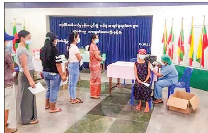
Workers from factories and workplaces in Dagon Myothit (Seikkan) get jabbed against Covid-19.

THE Tatmadaw medics, health officials, nurses and health workers of public hospitals including volunteers conduct vaccination programmes in regions and states for monks, nuns, people aged over 40, inmates, people with disabilities, ethnic armed groups, patients with chronic disease, people at IDP camps and students aged over 12.