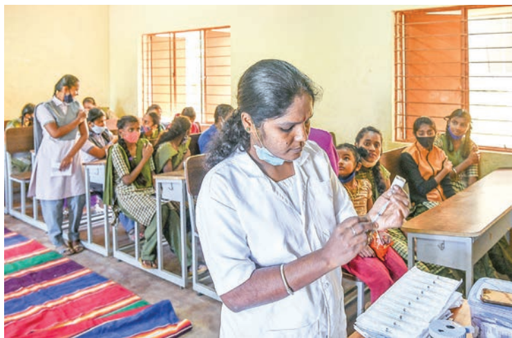
A health worker prepares to administer a dose of the Covaxin vaccine against the Covid-19 coronavirus to students during a vaccination drive for people in the 15-18 age group, at the Nelamangala Government High School and Junior College in Bangalore on 3 January 2022.