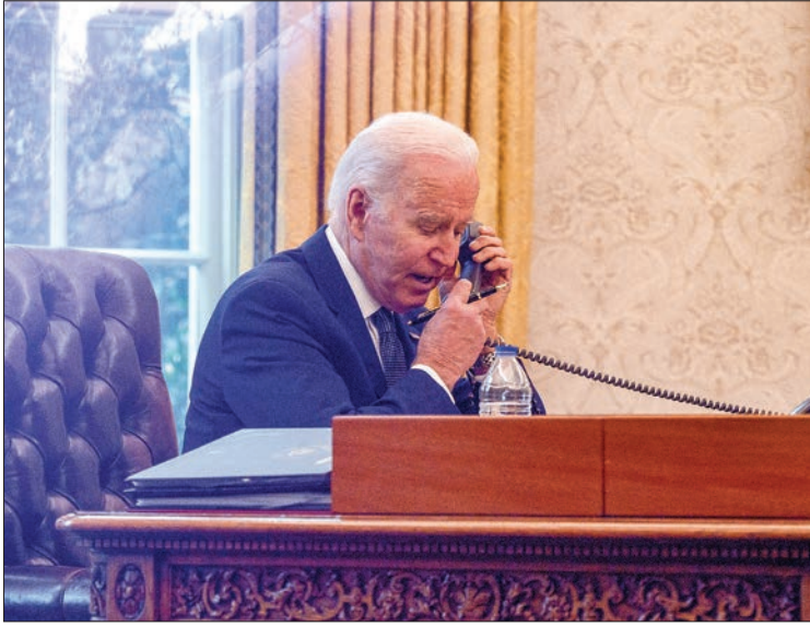
(FILES) In this file photo taken on 9 December 2021, US President Joe Biden speaks on the phone with his Ukrainian counterpart Volodymyr Zelensky, in the Oval Office at the White House in Washington, DC.