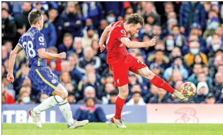
Liverpool’s Portuguese striker Diogo Jota (R) shoots during the English Premier League football match between Chelsea and Liverpool at Stamford Bridge in London on 2 January 2022.

EVEN after a weekend in which Manchester City produced the worst performance of the Premier League’s top four, the champions streaked further clear towards a fourth title in five years.