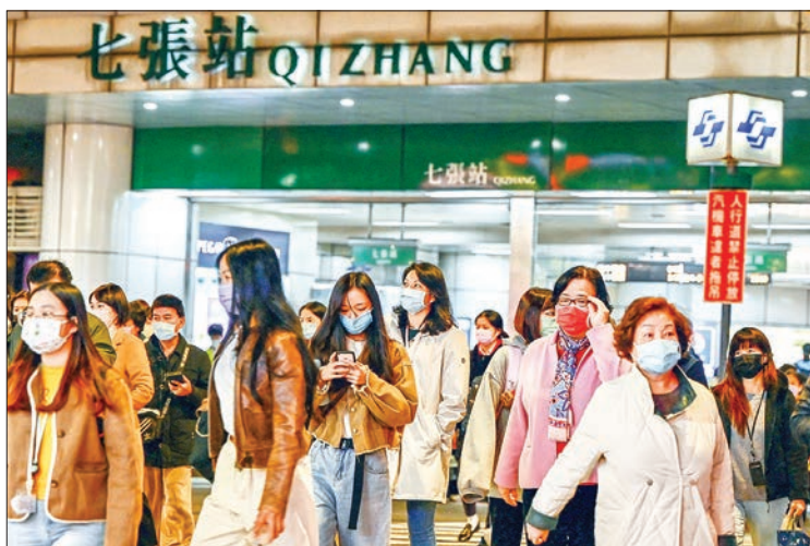
Commuters exit a Mass Rapid Transport (MRT) station in Xindian in New Taipei City on 3 January 2022, after a strong earthquake struck off the coast of eastern Taiwan with shaking felt in the capital Taipei.

A strong earthquake struck off the coast of eastern Taiwan on Monday evening with shaking felt in the capital Taipei, but authorities said there were no immediate reports of widespread damage or injuries.