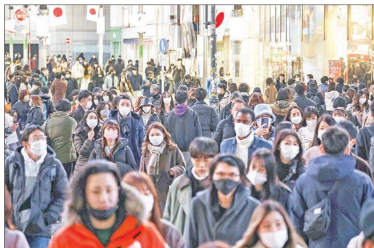
People wearing masks walk in Tokyo's Shibuya on 3 January 2022.

TOKYO confirmed 103 daily coronavirus cases Monday, marking the first time in about three months that the count has surpassed 100, as concerns grow over a gradual rebound in infections in Japan with the spread of