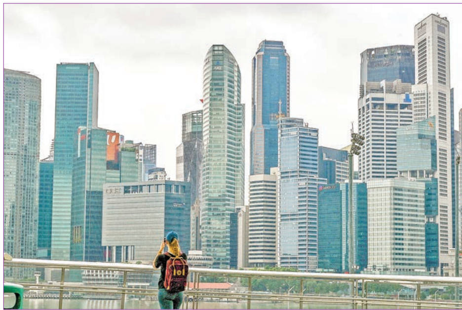
The financial business district is pictured from the Helix Bridge in Singapore on 3 January 2022.