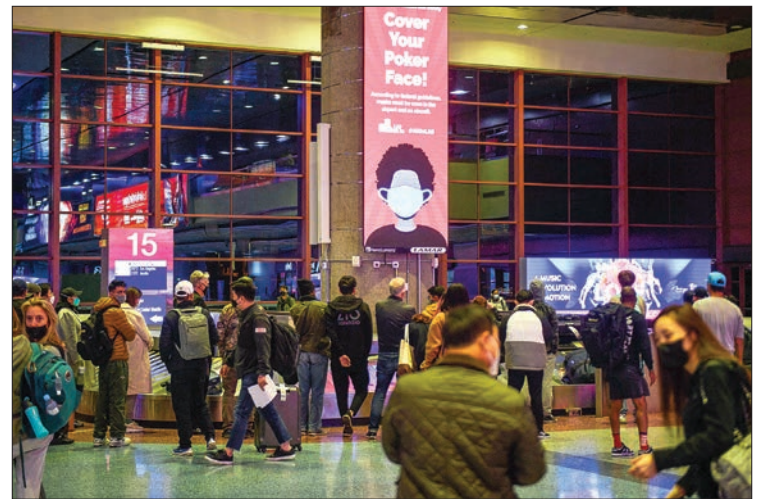
A sign reminds airline passengers to wear face masks as they wait to collect bags from a baggage carousel at the Harry Reid International Airport (LAS) on 2 January 2022 in Las Vegas, California. Americans returning home from holiday travel had to battle another day of airport chaos on 2 January with more than 2,000 flights cancelled due to bad weather or airline staffing woes sparked by a surge in Covid cases.

Airports in Chicago — a major transit hub — were the most affected Saturday, but by Sunday the airports in Atlanta, Denver, Detroit, Houston and Newark were also hard hit. — AFP ■