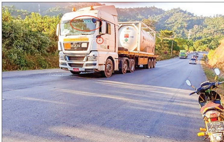
Terrorist attack on the boxer (in picture) transporting liquid oxygen to Yangon via Myawady.

When the government makes efforts regarding the oxygen in the outbreak of COVID-19, the KNLA and PDF terrorist groups committed such attacks without humanitarian grounds and so the security forces will conduct the necessary measures to eliminate the terrorist attacks. — MNA