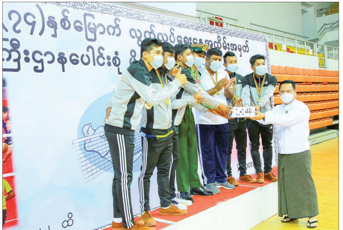
Prizes presentation event to mark 74 th Independence Day in progress.

On 4 January from 7 am, men's/women's 100-metre, 200-metre, 400-metre and 800-metre races, tug of war competitions (men/women), and htoke-see-toe competitions will be held at Wunna Theikdi Sports Complex. — MNA