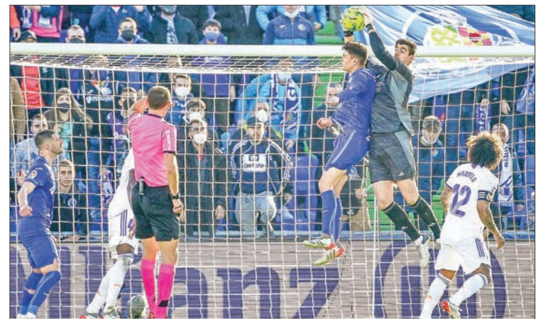
Real Madrid’s Belgian goalkeeper Thibaut Courtois (Top-R) catches the ball during the Spanish league football match between Getafe CF and Real Madrid CF, at the Col Alfonso Perez stadium in Getafe on 2 January 2022.

Xavi Hernandez said on Saturday it was “crazy” the game had to go ahead, with Jordi Alba, Ousmane Dembele and Gavi among those infected while Sergio Busquets was suspended and Pedri, Ansu Fati and Memphis Depay injured. — AFP ■