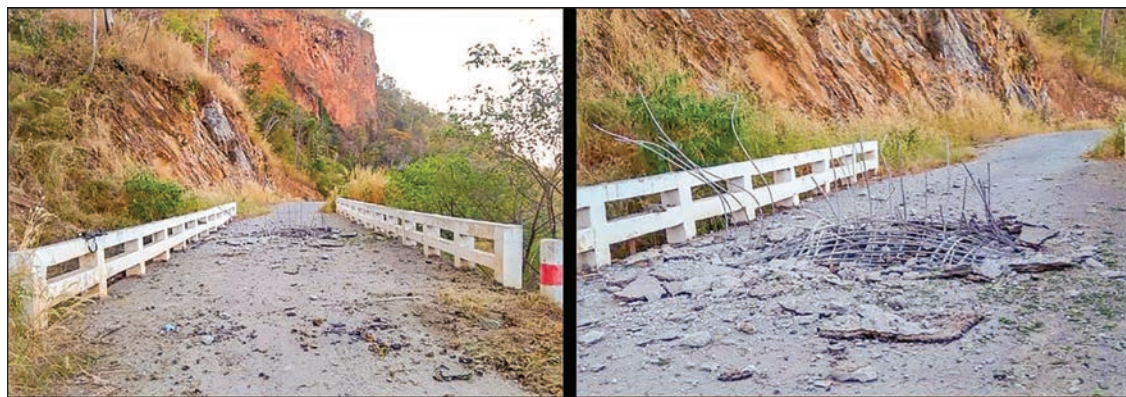
Ravages are seen in the aftermath of the mine attack.

A combined team of KNPP and PDF terrorist groups bombed a reinforced concrete bridge on Shadaw-Loikaw road of Kayah State at about 9:30 am on 2 January.