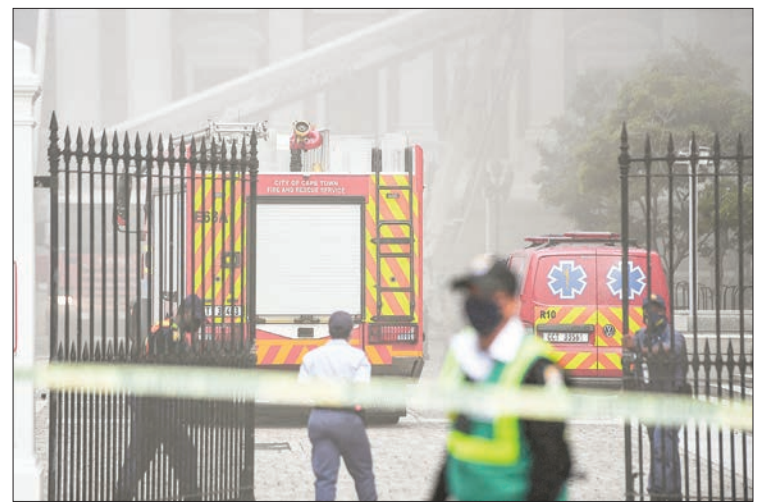
A fire truck is seen at the South African Parliament precinct in Cape Town on 2 January 2022, during a fire incident. A major fire broke out in the South African parliament building in Cape Town on 2 January 2022.

The parliament building houses a collection of rare books and the original copy of the former Afrikaans national anthem "Die Stem van Suid-Afrika" ("The Voice of South Africa"), which was already damaged. — AFP ■